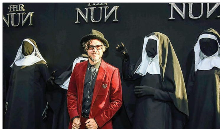
Director Corin Hardy at the recent Hollywood premiere of his movie "The Nun," which topped North American box offices over the weekend.

"Peppermint," from STX Films, stars Jennifer Garner as a mother seeking revenge against the drug cartel she blames for killing her husband and daughter. And in fifth spot was Sony thriller "Searching," starring John Cho as a man desperate to find his missing teenage daughter. It took in $4.5 million. —AFP ■