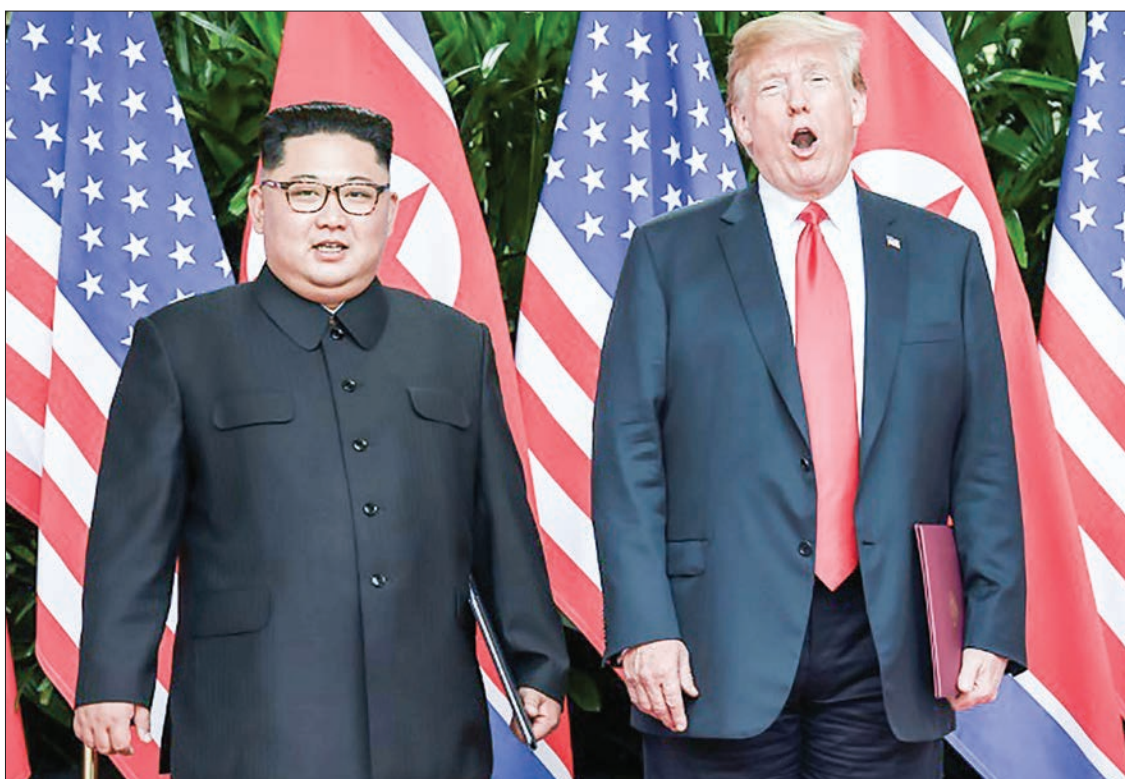
North Korean leader Kim Jong Un and US President Donald Trump.

But the momentum lagged after the summit, and late last month Secretary of State Mike Pompeo abruptly canceled a scheduled trip to North Korea, citing a lack of progress on denuclearization.—AFP ■