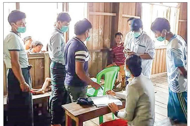
Medical team providing care to patients in Nanyun Town in the Naga Self-administered Zone.

The Ministry of Health and Sports is carrying out laboratory tests to identify the disease and has sent medical teams to the affected areas. —Ko Min (Intaw) ■