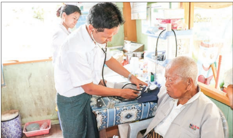
Offering health check-up to the elderly at a Community Health Clinic