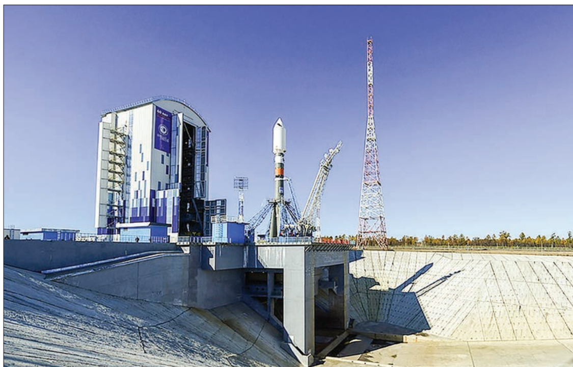
Vostochny spaceport.