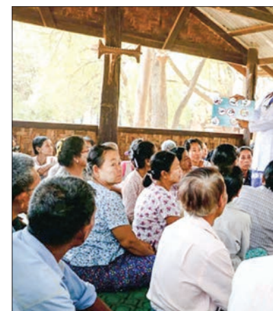
Health literacy promotion at a Community Health Clinic