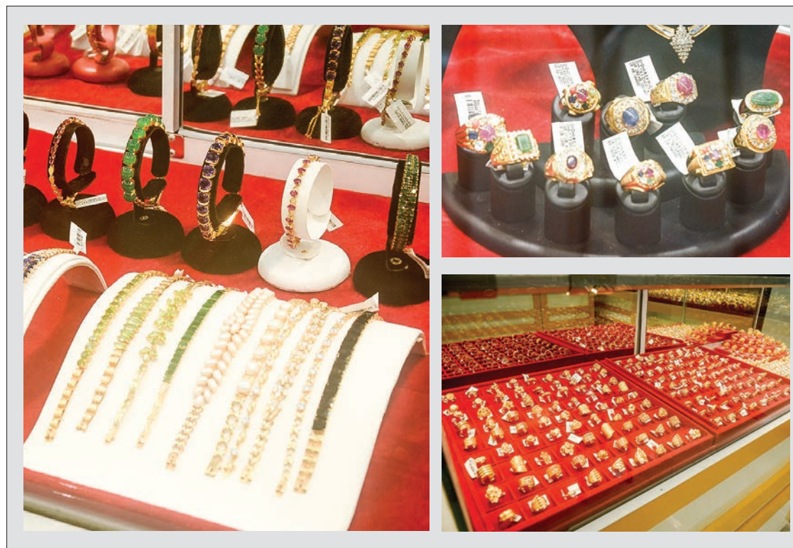
Gold jewellery on display at a shop in Yangon.

"Domestic gold price is increasing, possibly related to dollar appreciating against local currency. Therefore, sellers are