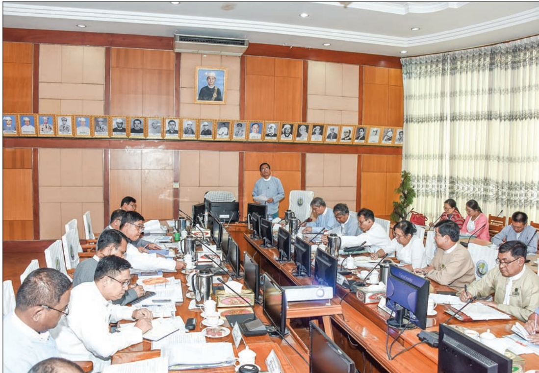
Deputy Minister U Aung Hla Tun addresses the coordination meeting of school textbook tender accepting and assessment committee yesterday.

DEPUTY MINISTER for Information U Aung Hla Tun attended and addressed the coordination meeting of school textbook tender accepting and assessment committee for academic year 2019-2020, held in Ministry of Information meeting hall yesterday afternoon.