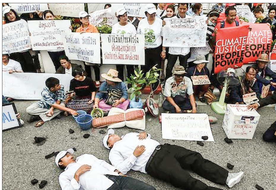
Environmental activists and supporters take part in a demonstration in front of the United Nations building in Bangkok on Sunday.

"Yet, we face devastating climate impacts and some of us could be lost forever to rising seas" without progress on the Paris deal by the end of the year, he added. The Paris deal, struck in 2015,