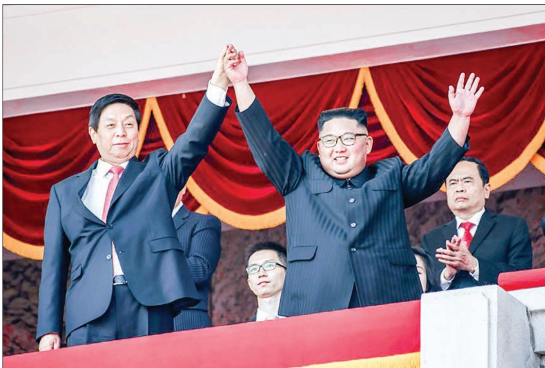
Politburo Standing Committee member Li Zhanshu (L) met North Korea's leader Kim Jong Un (R) during a military parade and mass rally to mark the 70th anniversary of the founding of North Korea.

Trump and Kim reached a vague agreement to work to-