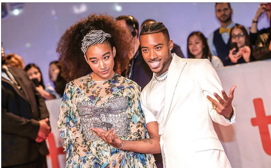
US actors Algee Smith (R) and Amandla Stenberg attend the premiere of "The Hate You Give" at the Toronto International Film Festival in Toronto, Ontario on 7 September, 2018.

In July, two middle-aged women left oil marks on dozens of items at the Byzantine and Christian Museum — home to the country's most extensive collection of religious relics. The incident was revealed by Kathimerini daily, not the museum itself, and then Culture Minister Lydia Koniordou tried to play down the incident. "I wouldn't exactly call it vandalism...it was some ladies spreading oil," said Koniordou, who was later replaced in a cabinet reshuffle. —AFP ■