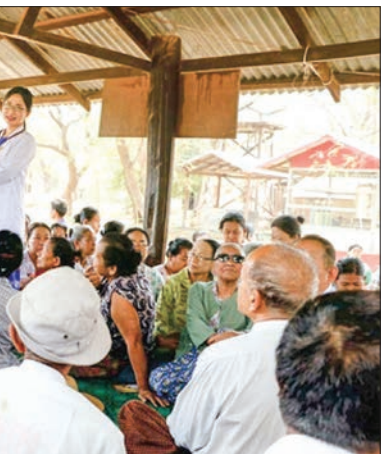
Community Health Clinic

of coordination and support for the implementation of CHC in every state and region, together with the contributions of community-based organizations, civil society organizations, international non-governmental organizations, donor agencies and the private sector. The CHC is expected to support achieving Universal Health Coverage by accessing good quality health services without financial hardship and improving quality of life, which is also in line with the National Health Plan of Myanmar (NHP, 2017-2021).