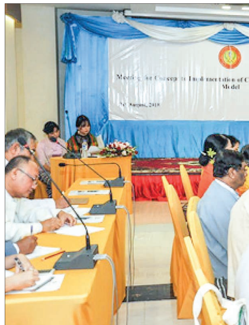
Union Minister Dr. Myint Htwe delivers an opening speech at the meeting "From concept to implementation of CHC Model" at the Mingalar Thiri Hotel, Nay Pyi Taw.

The operational definition of the CHC is the action oriented public health care activity