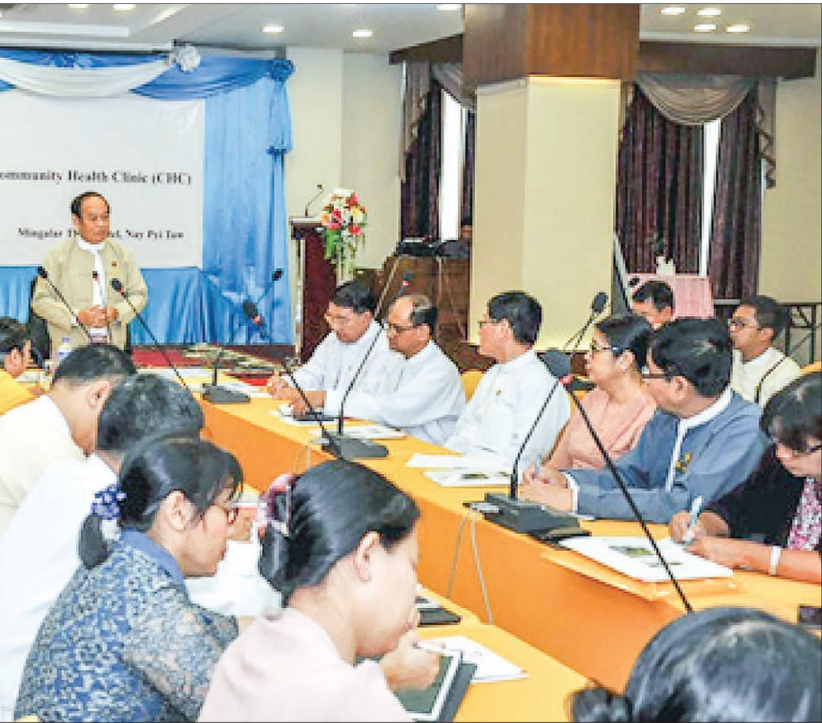
From concept to implementation of Community Health Clinic (CHC) Model" on 31 August at Mingalar Thiri Hotel,