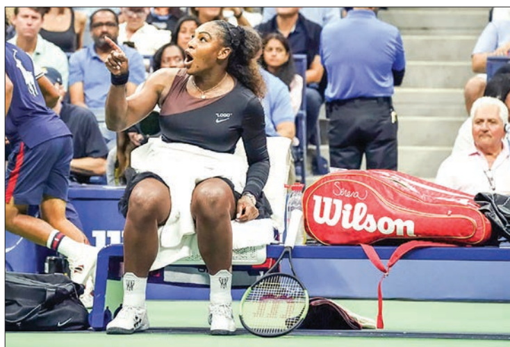
Serena Williams has angry words for chair umpire Carlos Ramos during her US Open final loss to Naomi Osaka on Saturday.

The second violation also cost her a point in the match, sparking her renewed verbal attack on Ramos, a code violation