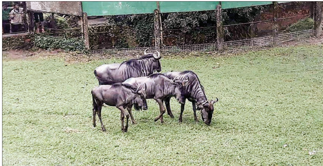
Four wildebeests seen at the Yangon Zoological Gardens.

THREE nyalas and four wildebeests, also called gnus, that arrived from Africa will be displayed at the Yangon Zoological Gardens, according to the Yangon zoo.