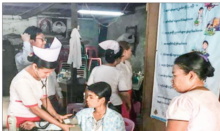
Measuring blood pressure at a Community Health Clinic

supporting community members; 2) to provide screening, proper treatment and appropriate referral of people with NCDs, such as hypertension and diabetes mellitus through provision of essential medicines; 3) to serve the health needs of the vulnerable and under-privileged people, including the aging population. The CHC model is set up with six principles: quality, partnership, equity, effectiveness, efficiency and community involvement. From the aspect of community involvement, the CHC will be supported by community support group (village health com-