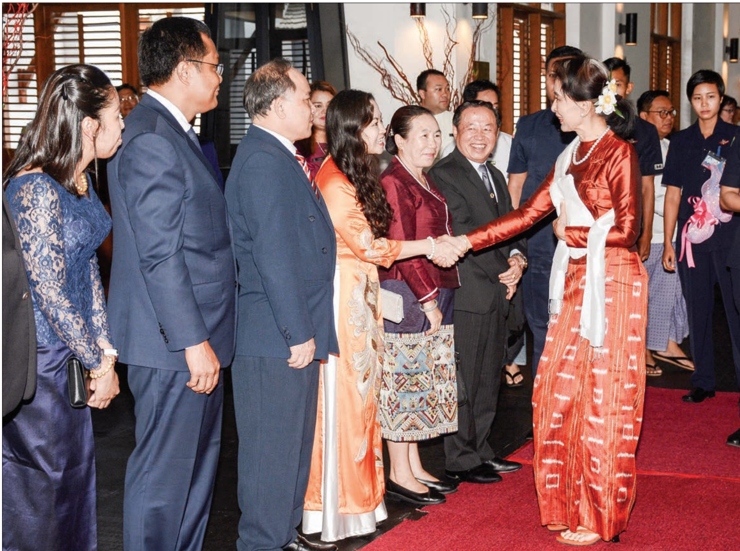
State Counsellor Daw Aung San Suu Kyi greets ASEAN Ambassadors and their spouses at the luncheon to commemorate the 51 st Anniversary of ASEAN Day in Nay Pyi Taw yesterday.