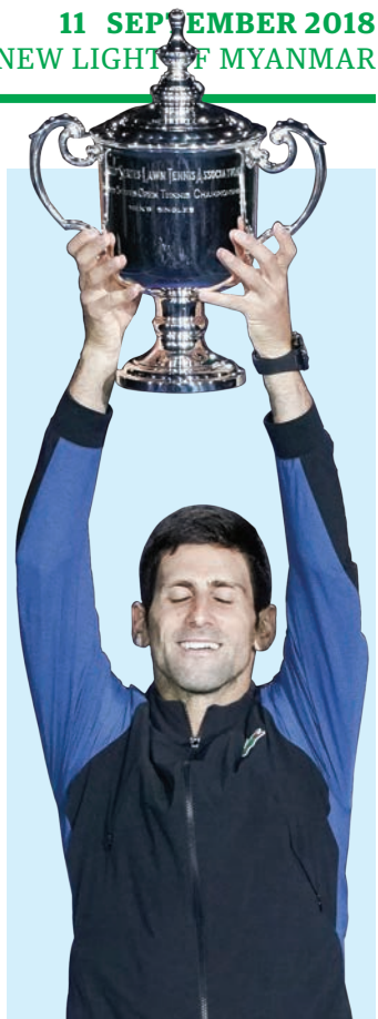
Novak Djokovic of Serbia celebrates his victory over Juan Martin del Potro of Argentina (l) after their 2018 US Open men's singles final match on 9 September, 2018 in New York.

what would be a 6-2, 6-4 victory that made her the first Japanese player to win a Grand Slam title. — AFP ■