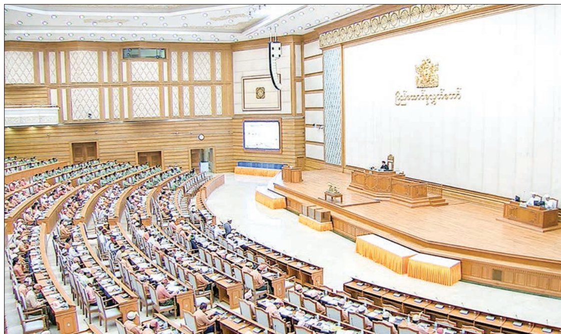
Pyidaungsu Hluttaw being convened in Nay Pyi Taw.