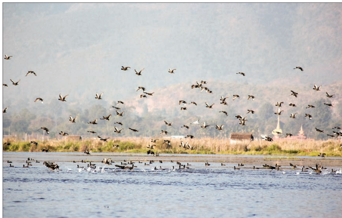
Inle Lake has been designated as Ramsar Site on 7 September.

INLE Lake has been designated as Myanmar's Ramsar Site (Site No. 2356), by Ramsar Convention, and included on the list of Wetlands of International Importance because of their ecological, botanical, zoological and hydrological importance.