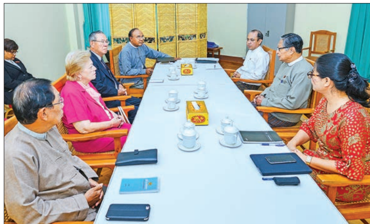
Union Minister U Kyaw Tint Swe discusses with Chairperson of the Independent Commission of Enquiry, Ambassador Rosario Manalo yesterday.

commission members at his office in Nay Pyi Taw yesterday afternoon. During the meeting, they discussed about Rakhine issues.—Myanmar News Agency ■