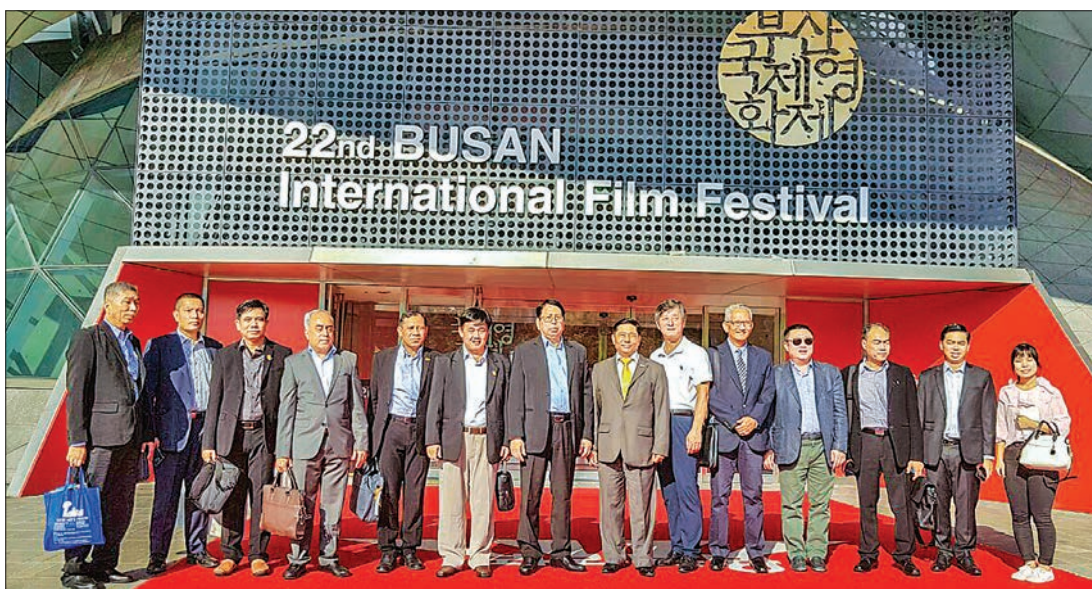
Union Minister Dr Pe Myint and officials pose for a documentary.