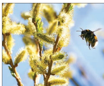
Pesticides have been blamed as a cause of colony collapse disorder in bees.

Even when the position of their feeders was switched, the pollinators made a beeline for