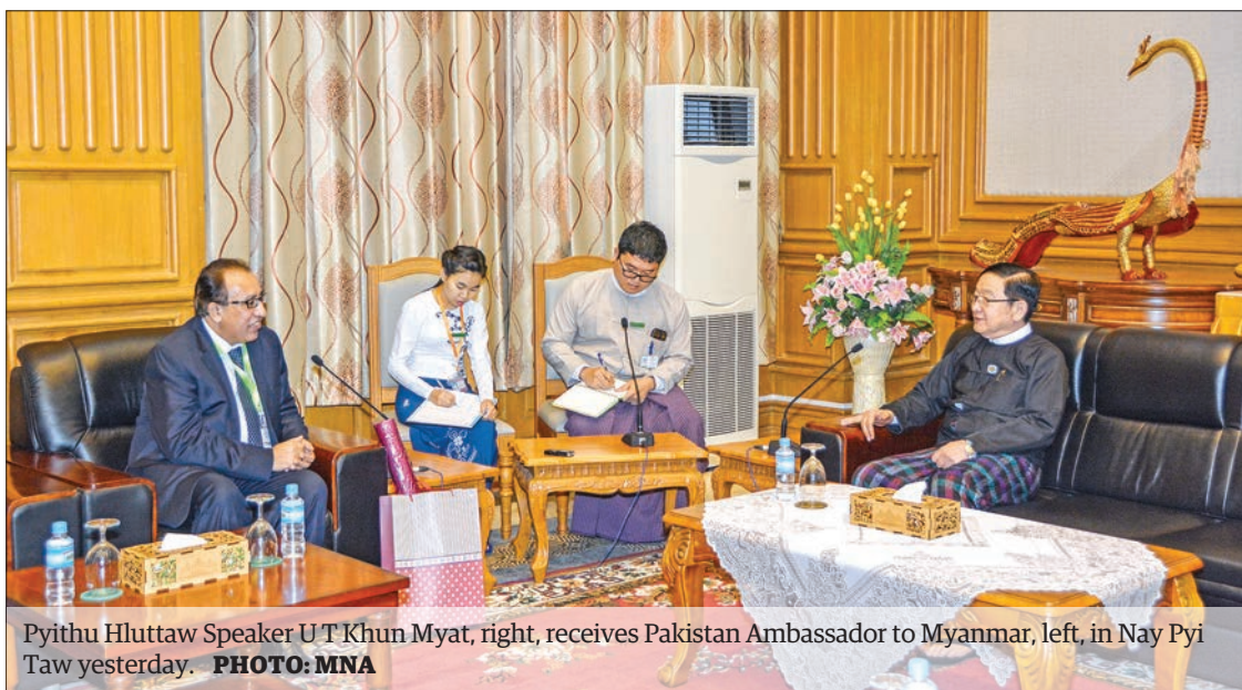
Pyithu Hluttaw Speaker U T Khun Myat, right, receives Pakistan Ambassador to Myanmar, left, in Nay Pyi Taw yesterday.