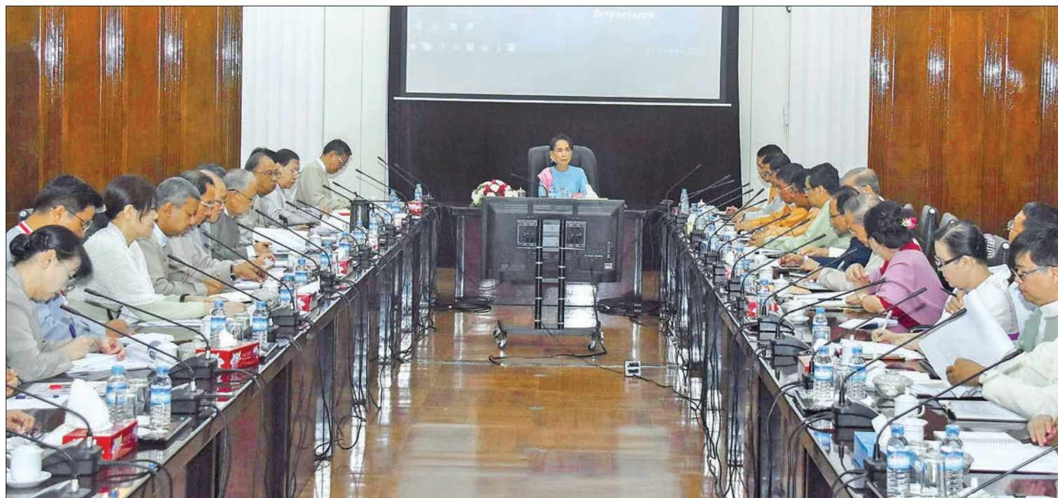
State Counsellor Daw Aung San Suu Kyi addresses the meeting on renovation and upgrading Yangon University.

The State Counsellor also called for giving priorities to water studies in doing research as Myanmar is rich in water resources and the water study is relevant to current time of climate change.