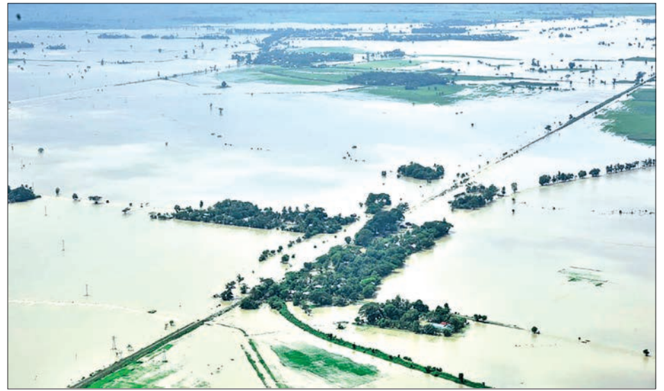
Ariel view of inundation in Yedashe Township caused by overflowed water from Swa Chaung Dam and destruction of the dam's spillway yesterday .