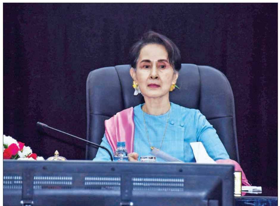
State Counsellor Daw Aung San Suu Kyi delivers address at the meeting on renovation and upgrading Yangon University.