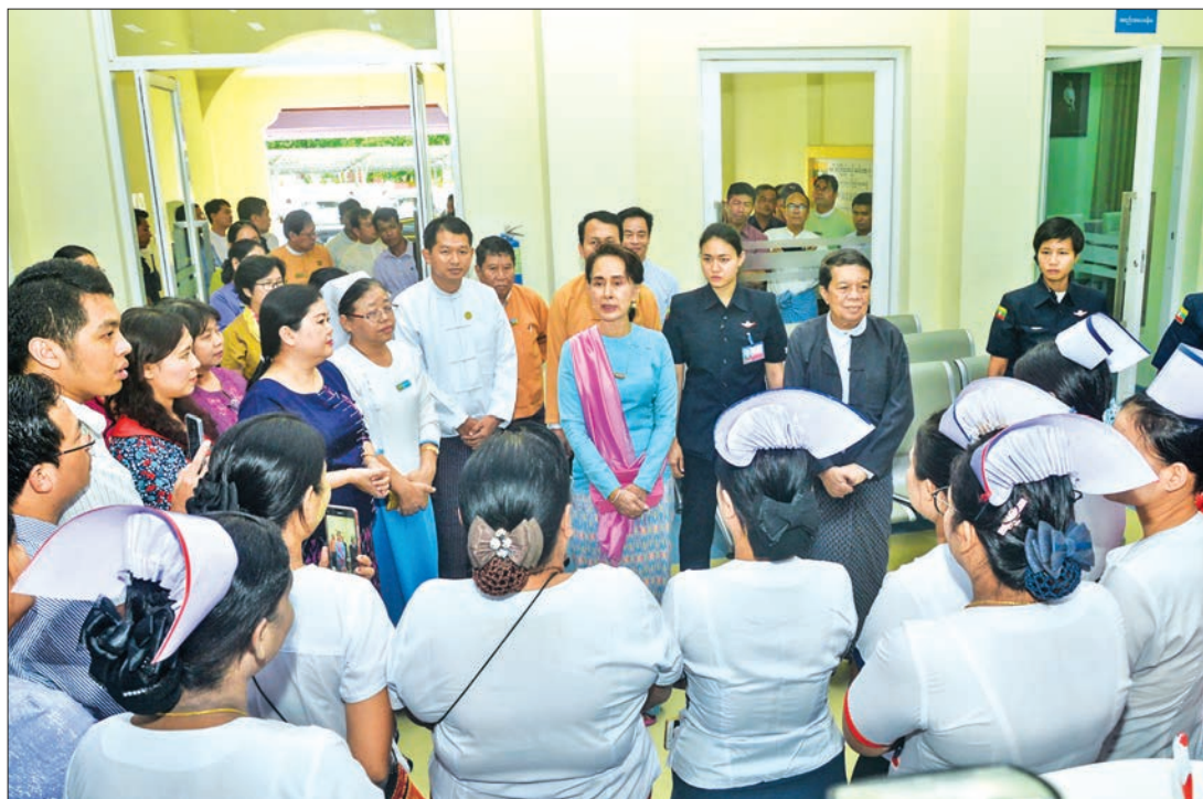
State Counsellor Daw Aung San Suu Kyi speaks to nurses at the Daw Khin Kyi Women's Hospital.