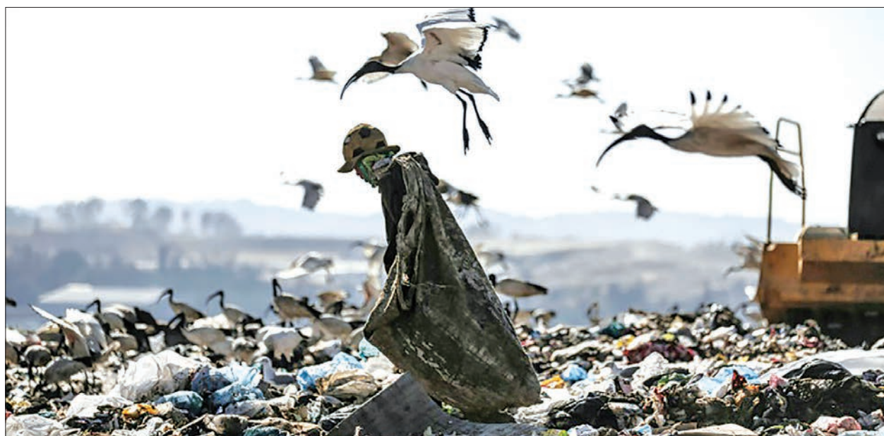
A reclaimer wades through the waste at Robinson Deep landfill, Johannesburg's largest landfill on 29 June, 2018.

Signatories include Auckland, Copenhagen, Dubai, London, Milan, Montreal, New York City,