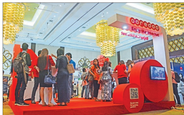
A job fair in Yangon being crowded by youths interested in making changes to their professionals.

the fair, including Nestle, Ooredoo, Wilmar, Anada, CB Bank, Yoma Bank, Success Property, Grab and Hong Kong Shinning Star Investment Co. He added that about 15,000 job seekers are expected to join this year's event. Numerous jobs will be offered for the sectors of sale and marketing, manufacturing, administration, human resources management, accounting, engineering, information technology and public relations. JobNet.com.mm annually holds career fairs in Myanmar for the purpose of helping job hunters find out which professions fit their personality. It hosted VR