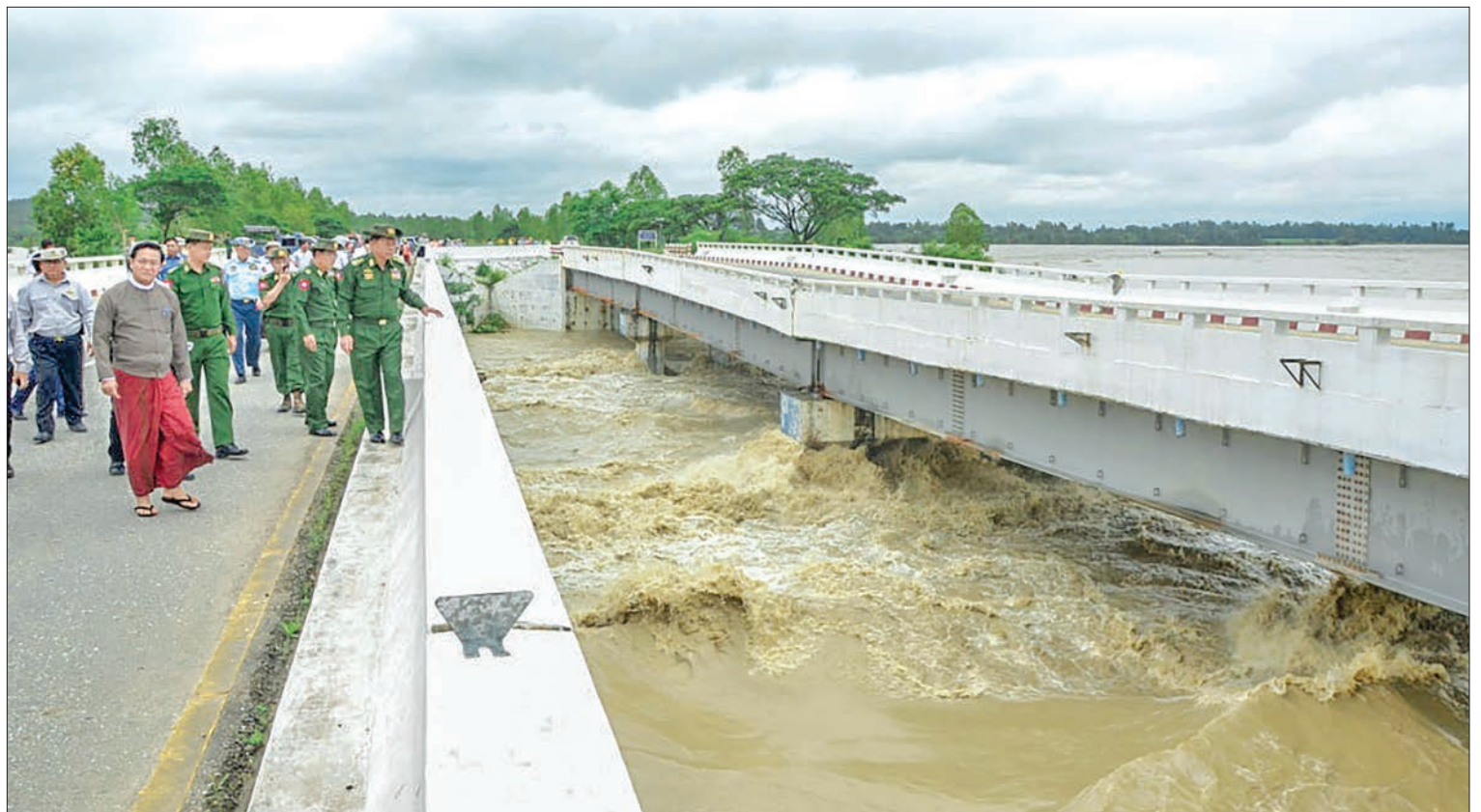
Vice President U Henry Van Thio and Senior General Min Aung Hlaing inspect damages to the bridge on the Yangon-Mandalay Highway caused by overflow of Swa Chaung Dam.

The road section between Mile Post 161 and 166 on the Yangon-Mandalay Highway and the road section between Mile Post