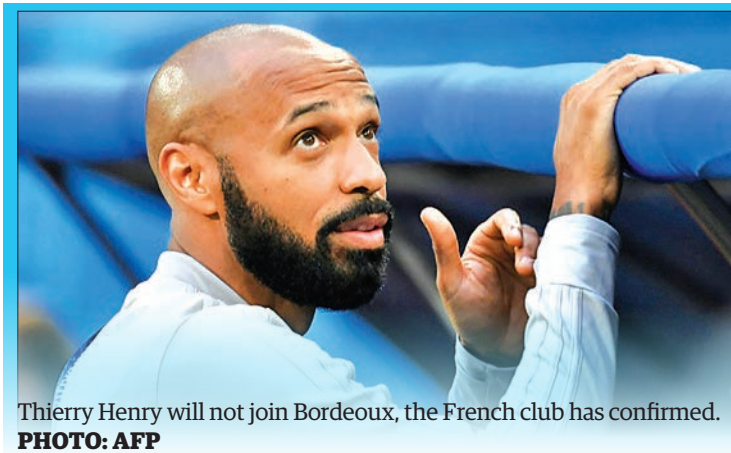
Thierry Henry will not join Bordeaux, the French club has confirmed.

"The idea with the dress code will be much more flexible than the one at Wimbledon, which has hardened over time," he said.— AFP ■