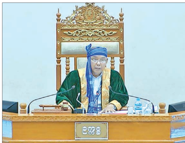
Amyotha Hluttaw Speaker Mahn Win Khaing Than.

U Myint Naing of Rakhine State constituency 5 raised a question on whether farmland in area 784-A and 787 of Lanmadaw Village-tract, Kyauktaw Township, Rakhine State confiscated by No 9 Operations Control Command and land confiscated by the military in area 786-A and B of Peinechaung Village, Nyaungpinhla, Lanmadaw, area 787 of Kyauktawtaung and No 375 Light Infantry Regiment area will have excess land returned, whether land not affiliated with the military will be returned, or compensations be provided in