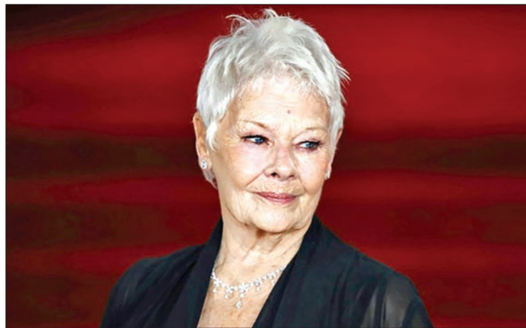
British actress Judi Dench made her screen debut in 1964 and has worked with many star directors including Clint Eastwood and Sam Mendes.