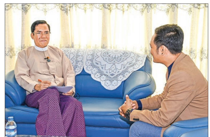
Deputy Minister for Information U Aung Hla Tun interviewed by Executive Producer U Ye Wint Thu of DVB.

Besides, the Deputy Minister called for the participation and cooperation by all the stakeholders from the Myanmar media Industry for the emergence of independent responsible and self-regulated media in order to nurture talented and qualified journalists to carry our proper Myanmar narrative among the international community.—Myanmar News Agency ■