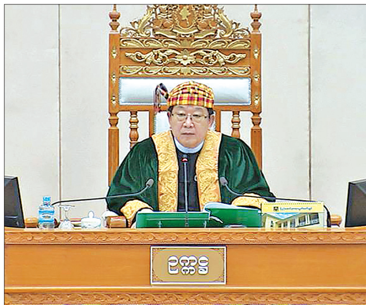
Pyithu Hluttaw Speaker U T Khun Myat.

U Khin Maung Yi of Hinthada constituency raised a ques-