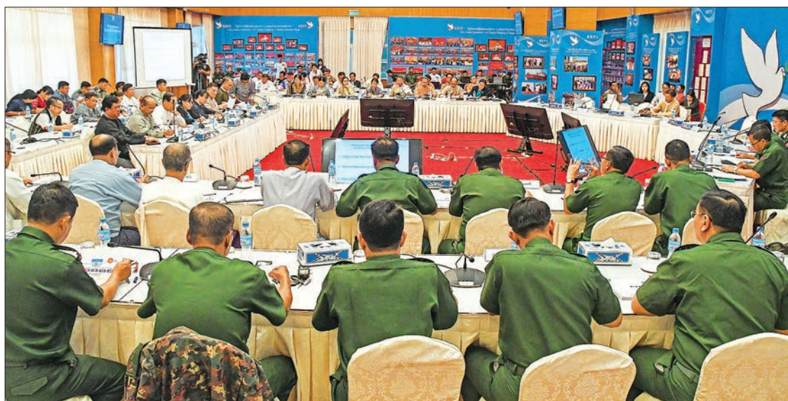
Roundtable discussion on reviewing the policy framework on political discussions being convened.

He continued saying that during the democratic government's second term, State Counsellor Daw Aung San Suu