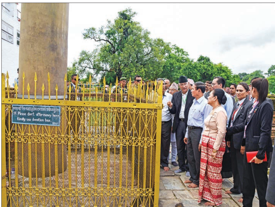
President U Win Myint and First Lady Daw Cho Cho visit Lumbini in Nepal.