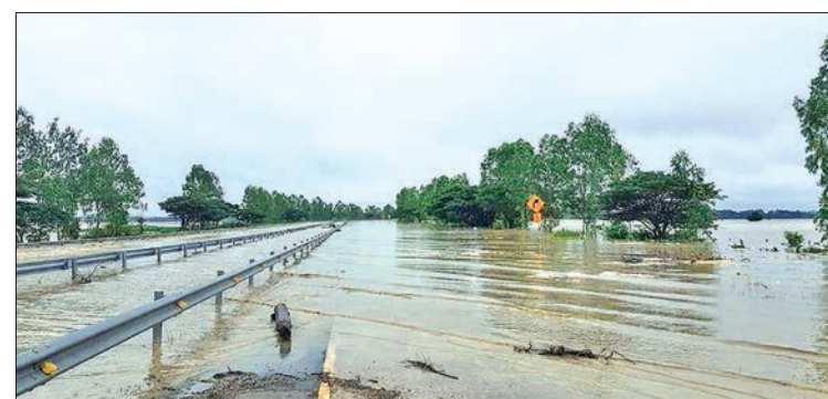
Yangon-Mandalay Highway is submerged by overflow caused by the spillway breach of Swa Chaung Dam.

Foods and aid are being sent timely to the flooded villages by the Bago Region Disaster Supervision Office, according to the Bago Region government.—Myanmar News Agency ■