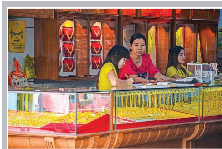
Gold jewellery displayed at a shop in downtown Yangon.

Meanwhile, global gold prices are also seen increasing above $1,200 per ounce, with $1,206 per ounce on 25 August, $1,204 on 27 August, $1,210 on 28 August and $1,214 yesterday. The local gold market is cool, with instability in the local gold price and the US dollar exchange rate. The demand is also low as the buyers are observing the market condition. The domestic gold price was recorded at a high of Ks948,500 per tical in mid-July, but the price dropped to Ks945,500 per tical on 18 July. Then, the price was on a high side again and hit a high of Ks961,300 on 24 August with the US dollar gaining. Meanwhile, the US dollar exchange rate to