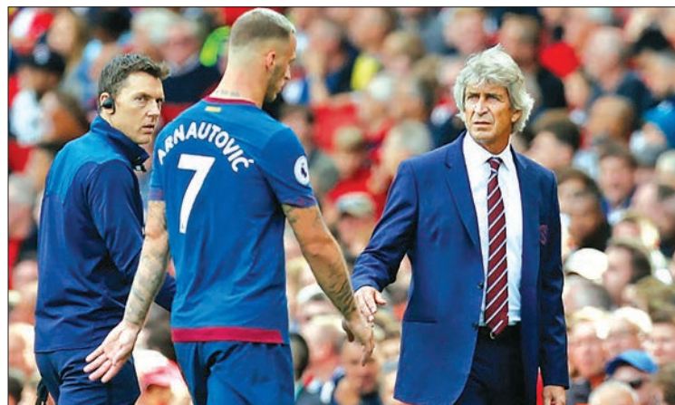
Manuel Pellegrini secured his first win as West Ham manager.

LONDON — West Ham survived a scare from League One Wimbledon to register Manuel Pellegrini's first win in charge and progress to the third round of the League Cup as Premier League sides Cardiff, Huddersfield and