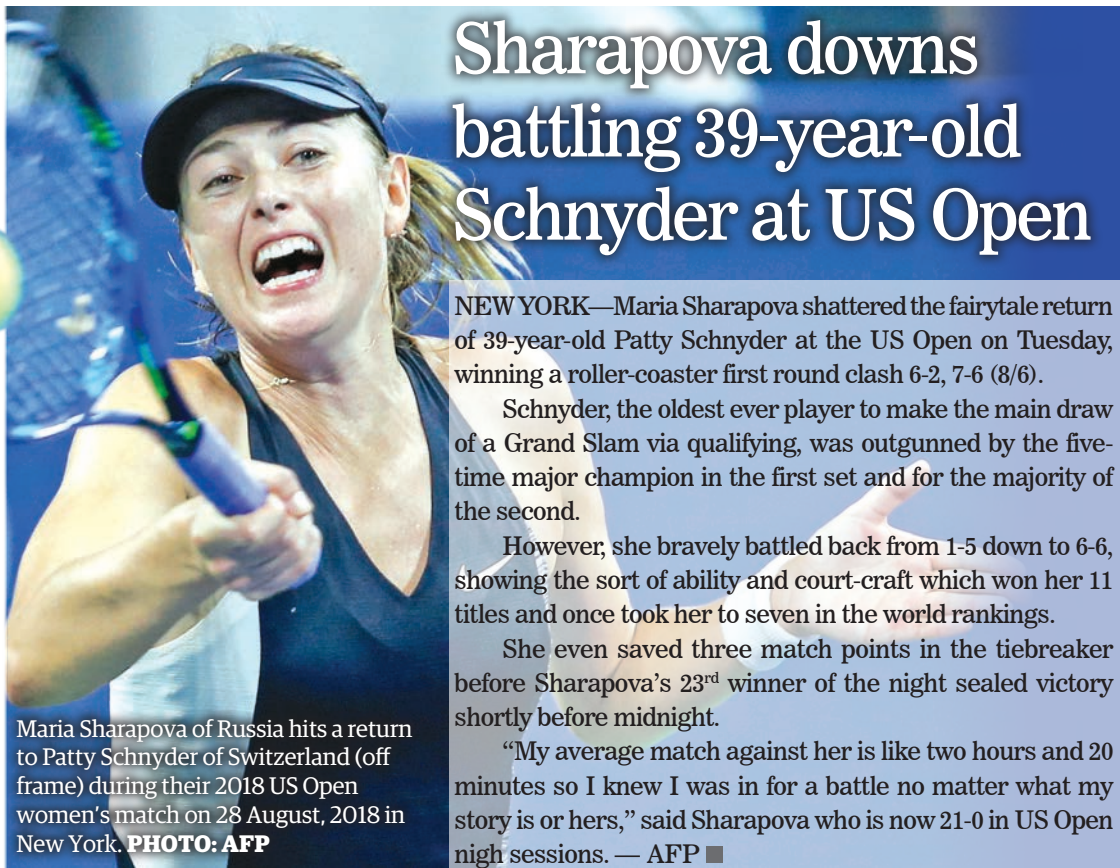
Maria Sharapova of Russia hits a return to Patty Schnyder of Switzerland (off frame) during their 2018 US Open women's match on 28 August, 2018 in New York.