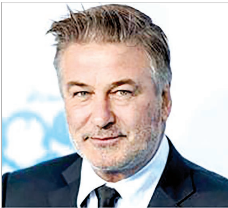
Alec Baldwin.

Also starring Robert De Niro, Zazie Beetz and Frances Conroy, Warner Bros has set on 4 October, 2019 as release date.—PTI ■