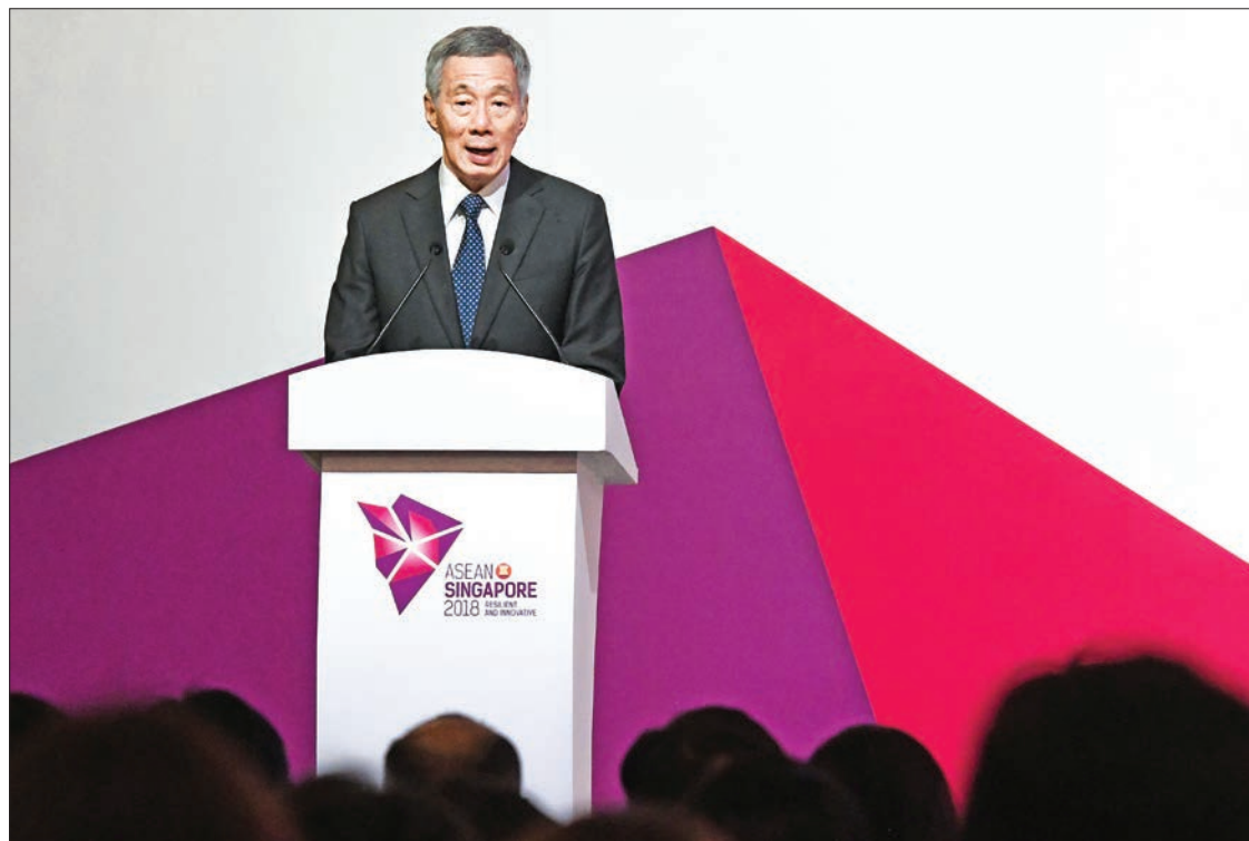
Singapore Prime Minister Lee Hsien Loong delivers the opening address at the 50th ASEAN Economic Ministers (AEM) Meeting and Related Meetings in Singapore on 29 August, 2018.

"The RCEP negotiations have continued for some time, and have now reached a critical stage," Prime Minister Lee Hsien Loong said as he opened a five-day meeting of economy ministers from the Association of Southeast Asian Nations (ASEAN). The Singapore meeting will be joined later in the week by