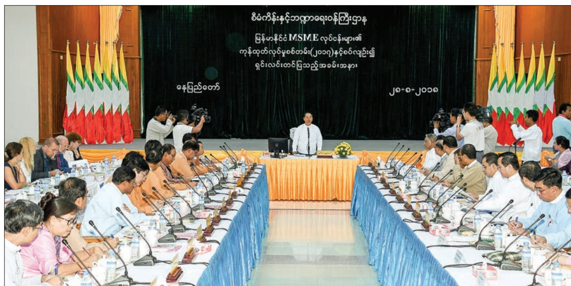
Vice President U Myint Swe addresses the MSME 2017 Survey presentation in Nay Pyi Taw yesterday.

The MSME Survey includes over 71,000 commodity production businesses and highlights the needs for the development of SMEs and to increase their competitiveness while identifying their difficulties, said the Vice President. He added that the survey included invaluable data that charts a detailed map of the SME sphere in Myanmar.