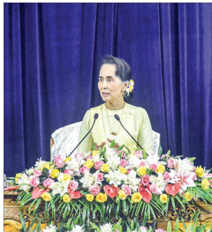
State Counsellor Daw Aung San Suu Kyi talks with university students in Yangon University yesterday.