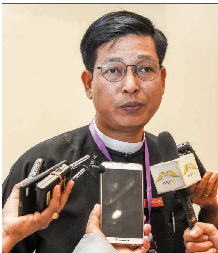
U Zaw Htay, spokesman of the State Counsellor's office.

"Another point is that Fact-Finding Mission (FFM) report is to be submitted on 18 September. The United Nations Security Council hold a briefing on Myanmar on 25 August that is