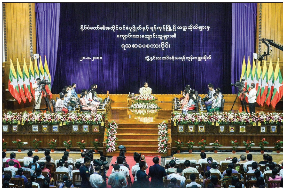
The State Counsellor and Yangon University students hold a talk on literary fiction yesterday.