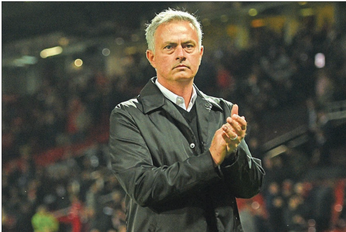
Manchester United's Portuguese manager Jose Mourinho stands on the pitch applauding the home fans that stayed until the end after the English Premier League football match between Manchester United and Tottenham Hotspur at Old Trafford in Manchester, north west England, on 27 August, 2018.

alone than the other 19 managers together. Three for me, two for them. Respect!" a fiery Mourinho raged at reporters on exiting his post-match press conference.