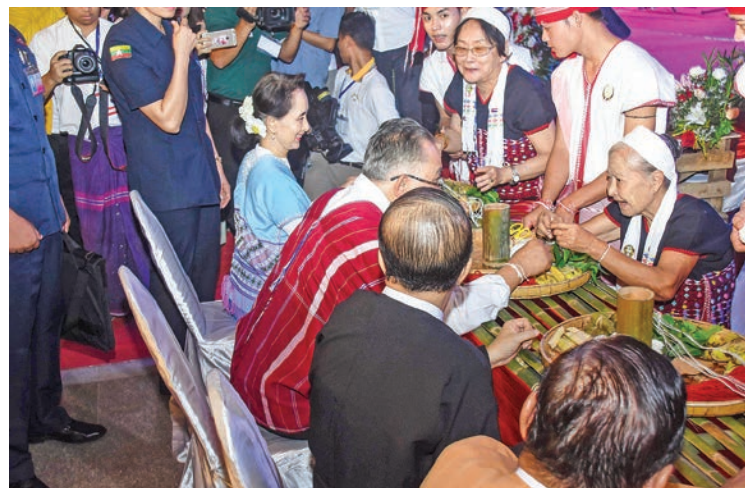
The State Counsellor and her entourage receive traditional Kayin wrist-tying.

"Meanwhile, I thank other ethnic leaders and colleagues for their help to make the peace