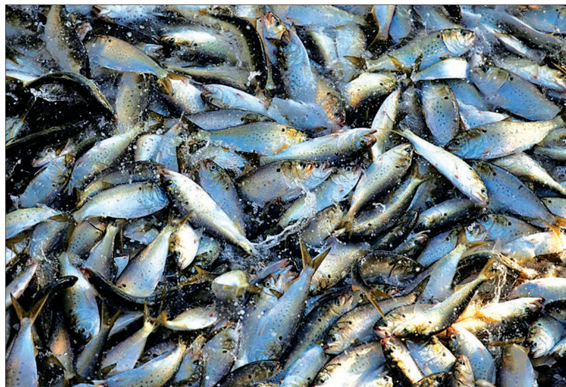
A school of Menhaden fish caught in a net off the coast of Virginia; Atlantic Menhaden are harvested as a nutritional supplement for human and animal consumption in oils, essential fatty acids and specialty protein products.

Earlier SpaceX CEO Elon Musk, who plans to send the first colonists to Mars in the near future, presented a concept of the Martian spacesuit.—Tass ■