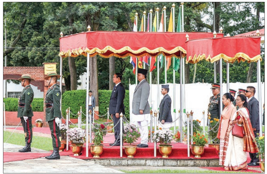
Myanmar President U Win Myint and Nepalese Deputy Prime Minister Mr Ishwor Pokhrel receive honorary salute from the Guard of Honor of the Federal Democratic Republic of Nepal.