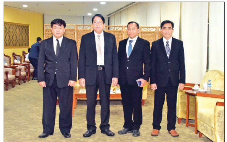
The delegation led by Union Minister Dr. Pe Myint leaves for Republic of Korea yesterday.

The delegation was seen off at the Yangon International Airport by MRTV Director-General U Myint Htwe and officials from the Ministry of Information. — Myanmar News Agency ■