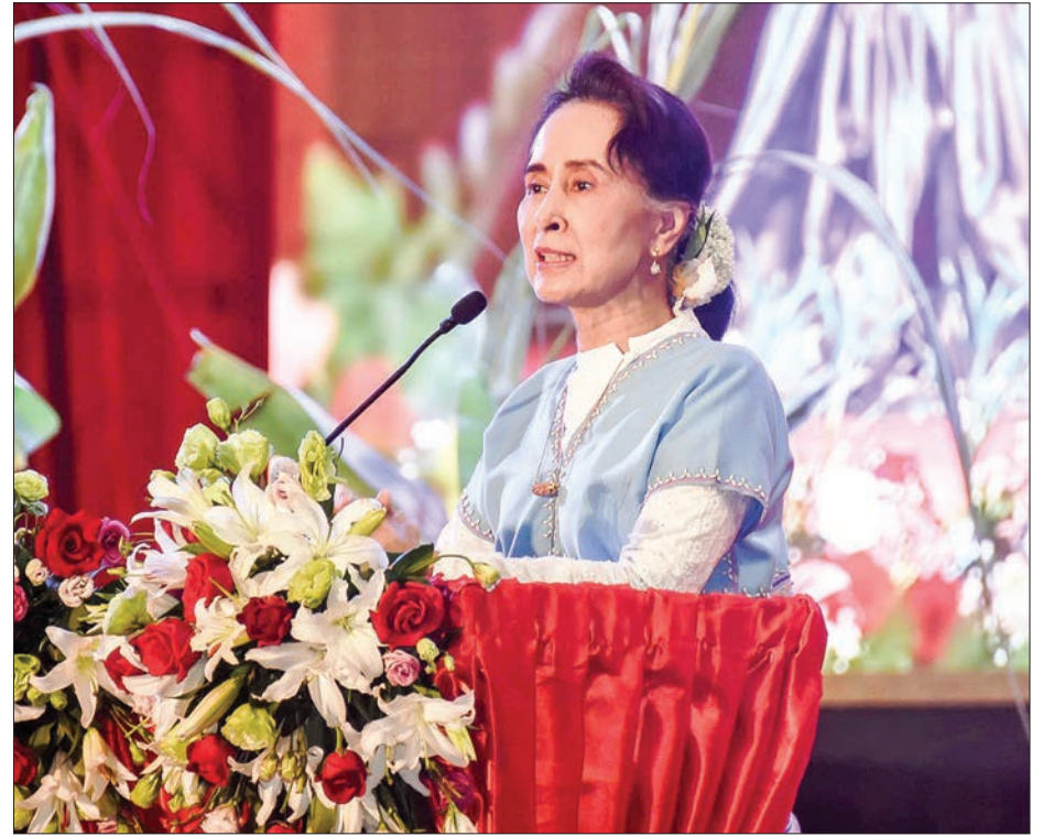
State Counsellor Daw Aung San Suu Kyi delivers address at the Kayin traditional wrist-tying festival in Yangon yesterday.