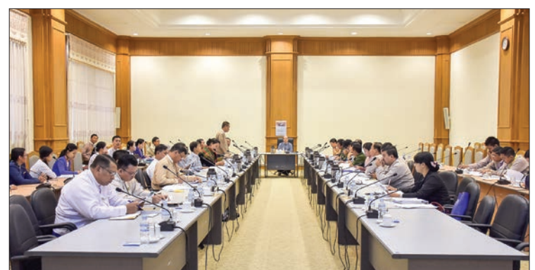
Pyidaungsu Hluttaw Joint Bill Committee holds meeting.

gal Affairs and Special Cases Assessment Commission members, officials from Ministry of Planning and Finance, Union Attorney-General Office and Pyidaungsu Hluttaw Office. — Myanmar News Agency ■