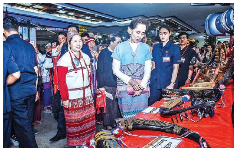
The State Counsellor views Kayin traditional handicrafts on display.