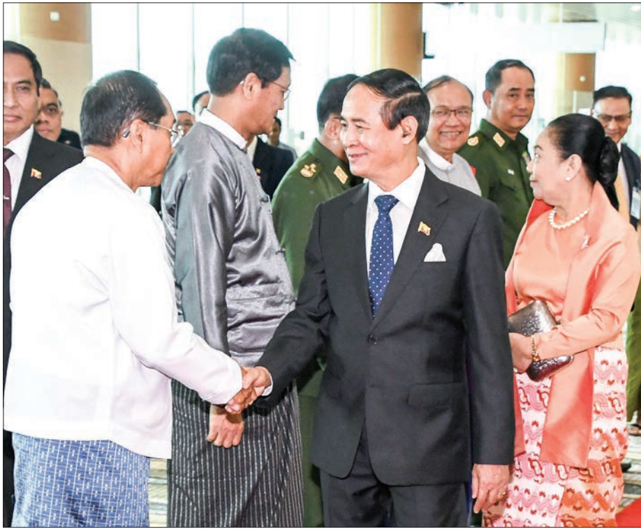
President U Win Myint and First Lady are seen off by Vice Presidents U Myint Swe and U Henry Van Thio, and Senior General Min Aung Hlaing at Nay Pyi Taw Airport.