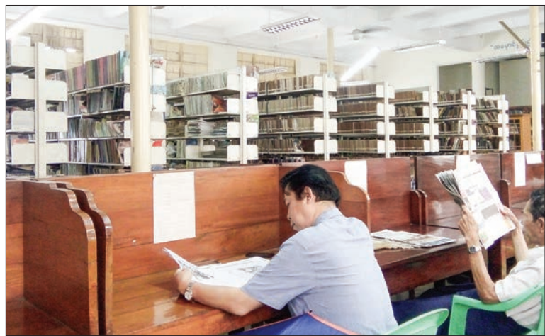
People reading at the library of Sarpay Beikman.

The National Library has a long history. The Bernard