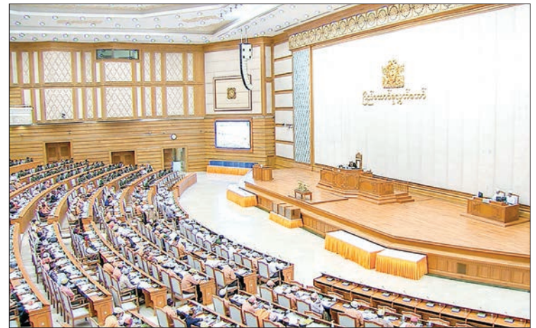
Pyidaungsu Hluttaw is being convened in Nay Pyi Taw.