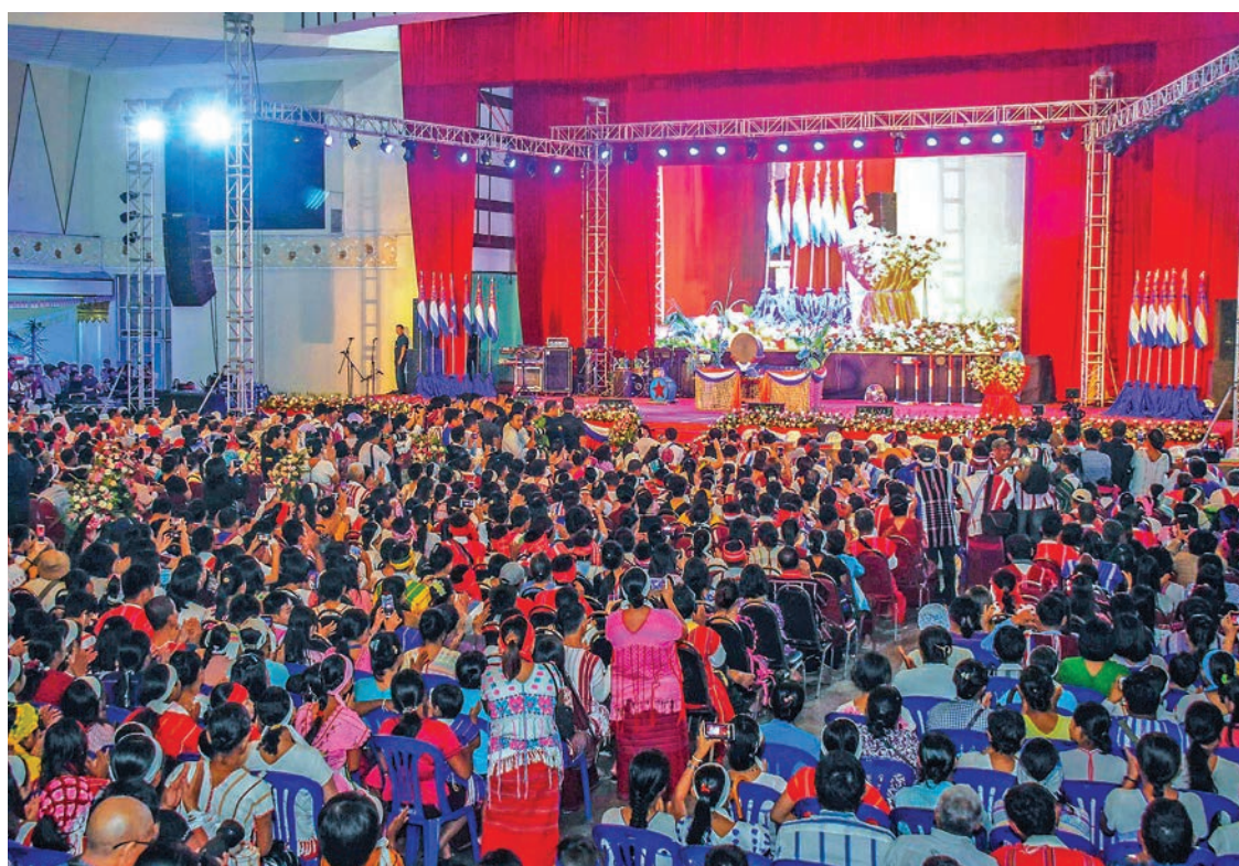
State Counsellor Daw Aung San Suu Kyi delivers the opening address at the traditional Kayin festival in Yangon yesterday.

process a success", said the State Counsellor, "especially, I also thank the people who support us as they aspire for peace."