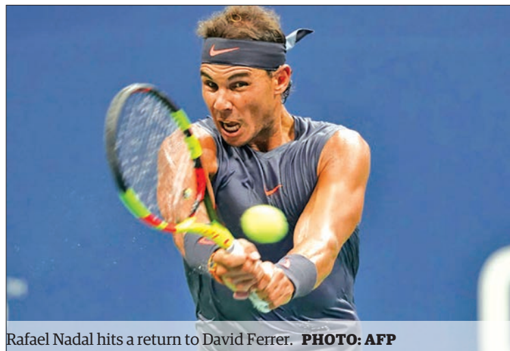
Rafael Nadal hits a return to David Ferrer.

Hugo Lloris kept his place in the Spurs goal and retained the captain's armband despite being arrested for drink driving in the early hours of Friday. — AFP ■