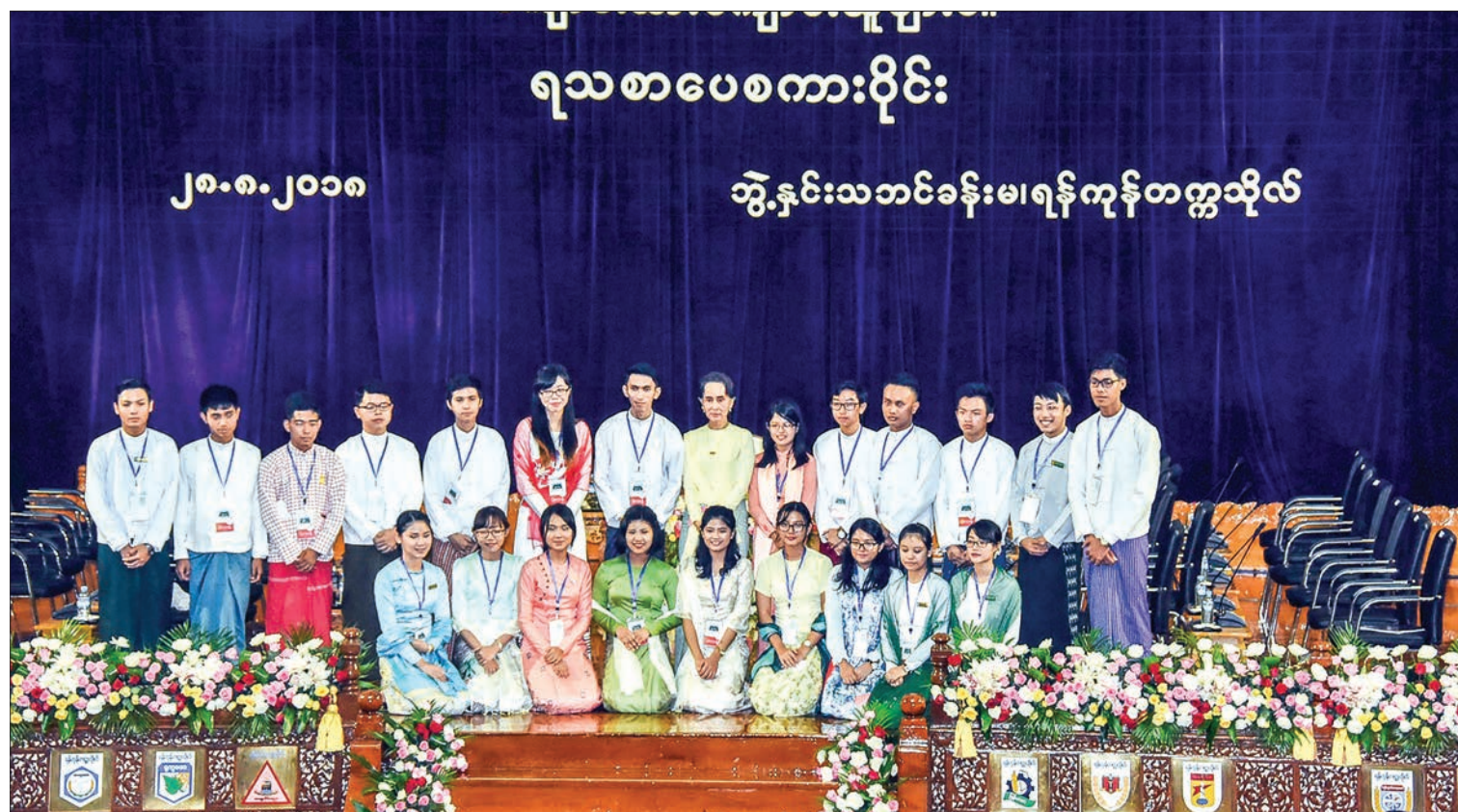
State Counsellor Daw Aung San Suu Kyi poses for photo together with students who took part in the talks over literary fiction.