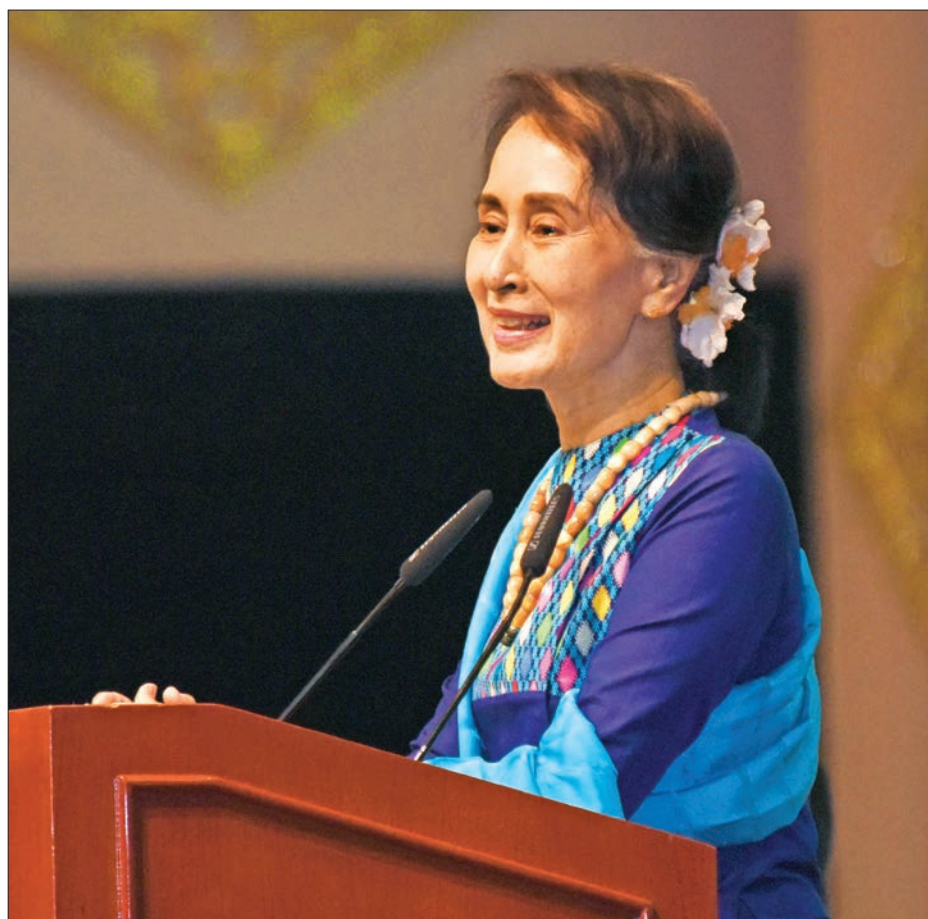
State Counsellor Daw Aung San Suu Kyi delivers address at meeting with business leaders in Nay Pyi Taw yesterday.

If our country is known by the world as corruption free in the economic sector, there'll be more people willing to invest in our country with trust. Most complaints are on tender matters. There are irregularities in tenders. This is related to corruption and we want to be informed about it. The Tender process is a big challenge for us. It is because of the slowness in tender matters that projects in our country were not completed on time.