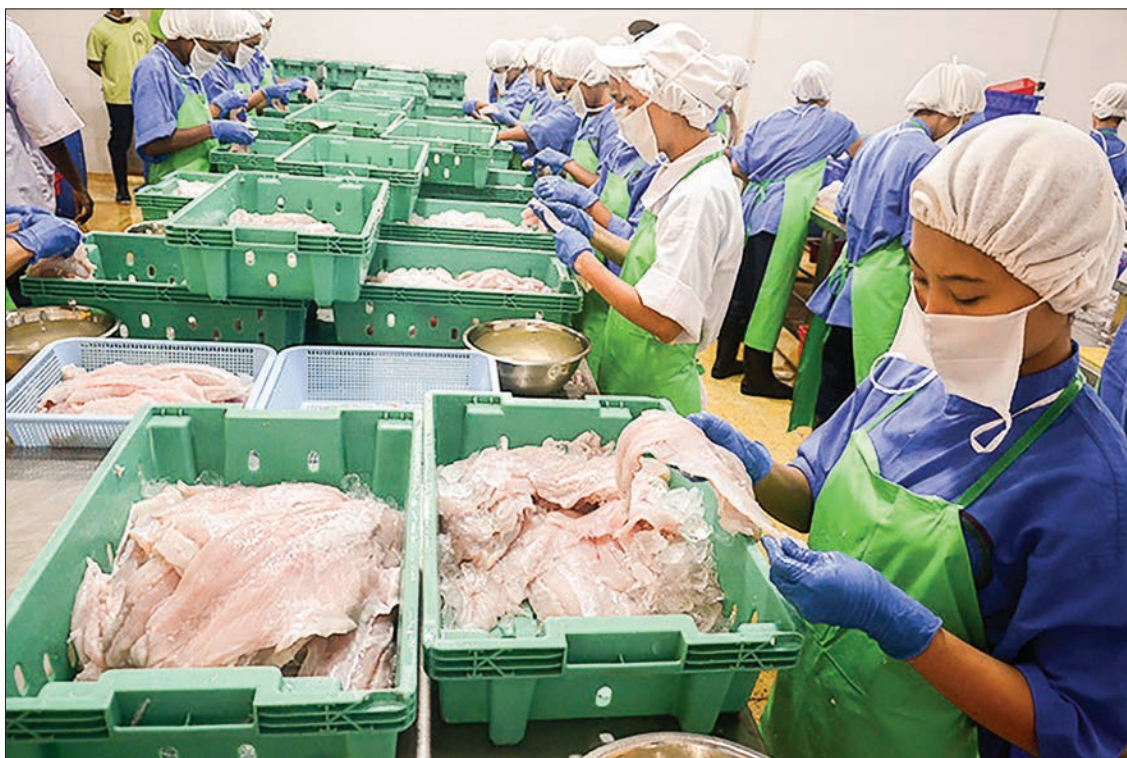
Workers processing fish for export at a marine product factory.

There are over 408,000 acres of fish and prawn lakes across Myanmar. — GNLM ■