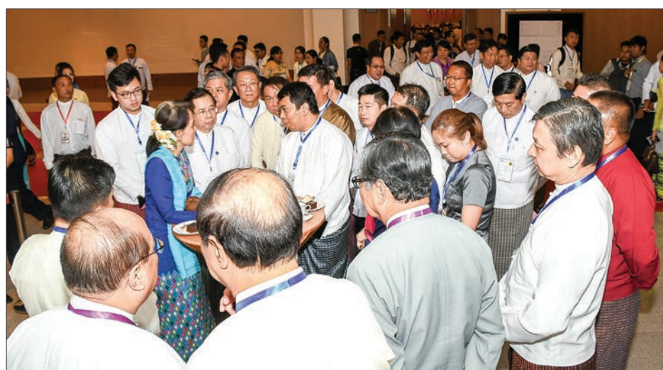
State Counsellor Daw Aung San Suu Kyi talks to business leaders.

For this, we need to have financial strength. But as we don't have enough financial strength, we make this up with our moral strength and unity. I want to urge all business persons to put in not only good will and unity but also their strength of their knowledge and wisdom for the country. I will conclude by urging you all to use your knowledge and wisdom to find a solution.—MNA ■