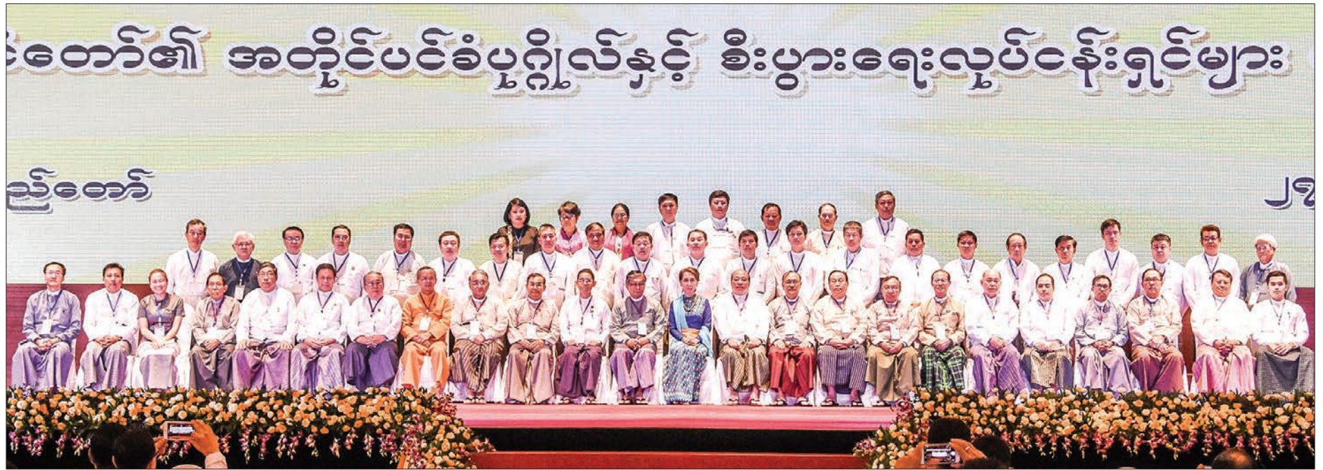
State Counsellor Daw Aung San Suu Kyi, Union Ministers, the Nay Pyi Taw Council Chairman, Governor of the Central Bank of Myanmar, deputy ministers, deputy governors of the CBM, UEHRD's Chief Coordinator, business leaders, bankers, high tax payers and representatives of the UMFCCI pose for documentary photo at their meeting in Nay Pyi Taw yesterday.