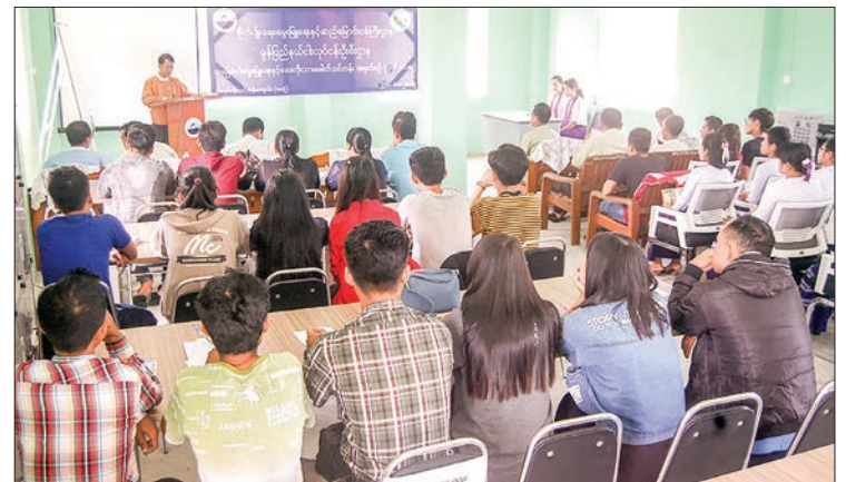
Trainees attend fish farming training in Thaton.

The three-day course includes measuring the quality