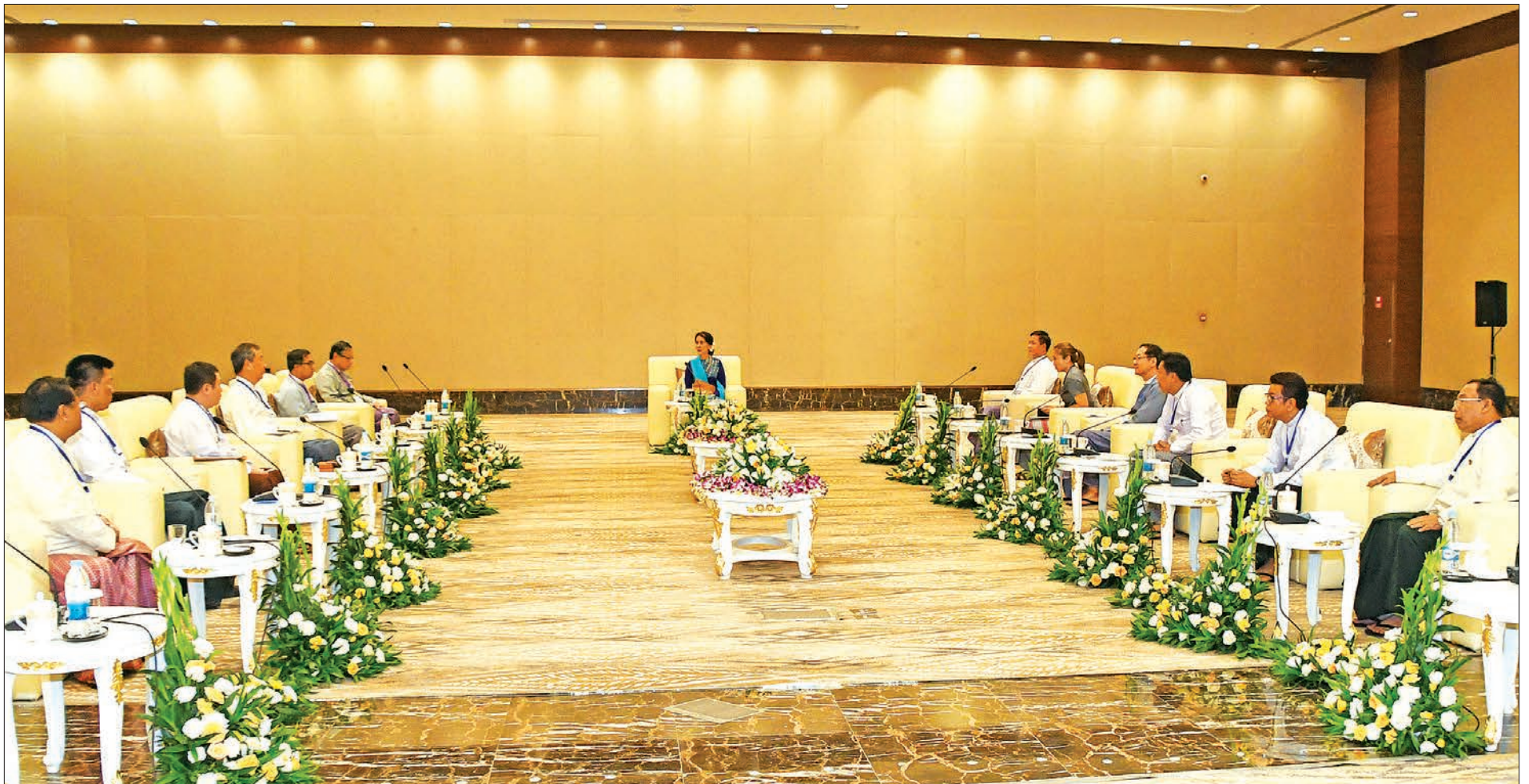
State Counsellor Daw Aung San Suu Kyi holds talks with five donors to UEHRD and five high tax payers in Nay Pyi Taw yesterday.

S TATE Counsellor Daw Aung San Suu Kyi met with local business leaders at the Myanmar International Convention Centre-I in Nay Pyi Taw yesterday, discussing over several business issues.