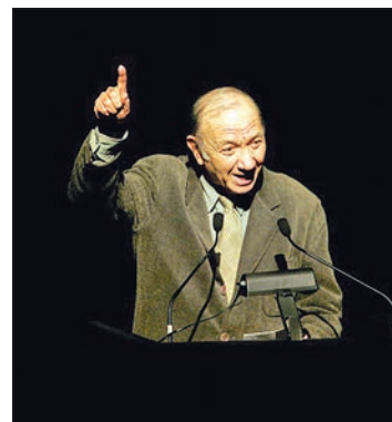
A legend of American theater, Neil Simon was credited with shaping American humor in the 1960s and 1970s in a vein similar to film director Woody Allen, with a focus on life in the big city and family conflict.

were darker, he was best known as the king of comedy, peppering his plays with witty one-liners.