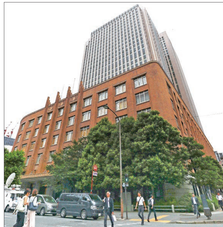
Photo taken on 4 July, 2018, shows the building of the Ministry of Education, Culture, Sports, Science and Technology in Tokyo.

He said under the current system, even students who go