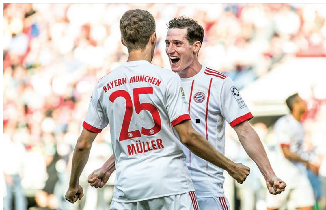
Bayern Munich’s Germany midfielder Sebastian Rudy (R) is set to join Schalke for 16 million euros ($18.2m), according to reports on Sunday.

Rudy was left out of the match day squad by new Bayern coach Niko Kovac for Friday’s 3-1 win over his ex-club Hoffenheim which kicked off the new Bundesliga season. — AFP ■