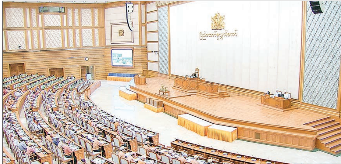
Pyidaungsu Hluttaw being convened in Nay Pyi Taw.