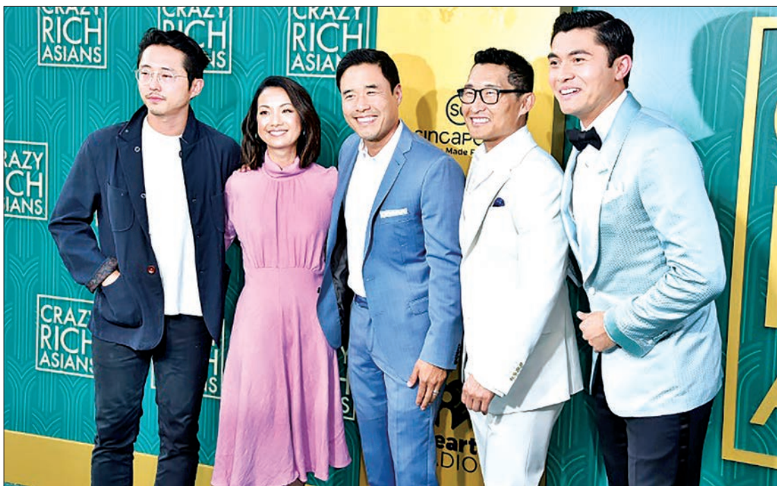
"Crazy Rich Asians," the Warner Bros. adaptation of Kevin Kwan's best-selling novel of the same name, took $25 million.

Shark attack thriller "The Meg" clung on to the runner-up spot for another week, taking $13