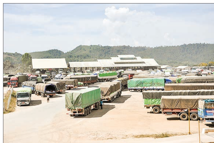
Trucks seen at 105-mile trade zone Muse, northern Shan State.

The four border gates linking China are Muse in northern