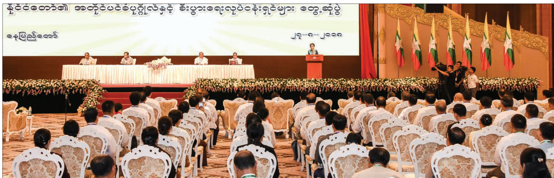
State Counsellor Daw Aung San Suu Kyi delivers address at the meeting with business leaders in Nay Pyi Taw yesterday.