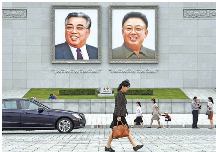
A woman walks past portraits of former North Korean leaders Kim Il Sung (l) and Kim Jong Il in Pyongyang on 11 June, 2018.

The Japanese government has requested all its citizens to refrain from travelling to North Korea, as part of sanctions against Pyongyang, which has developed nuclear weapons and ballistic missiles in defiance of international warnings. — Kyodo News ■