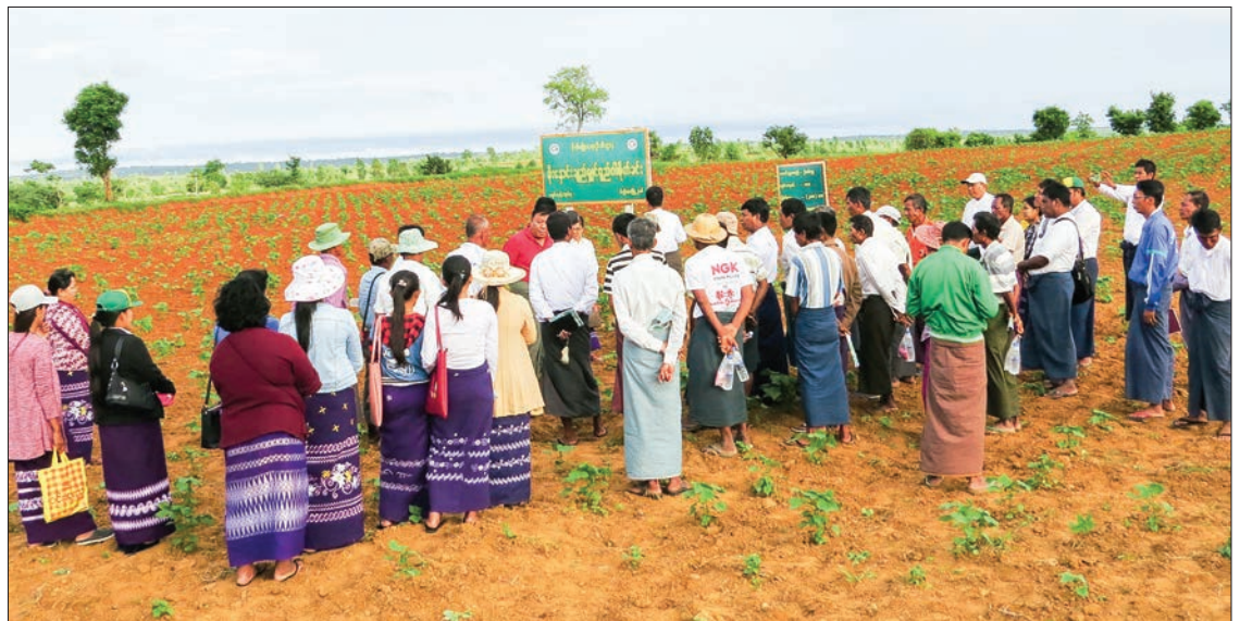
Governmental experts disseminate agricultural knowledge to farmers in Meiktila.

The growers started planting long staple cotton in the third week of July.