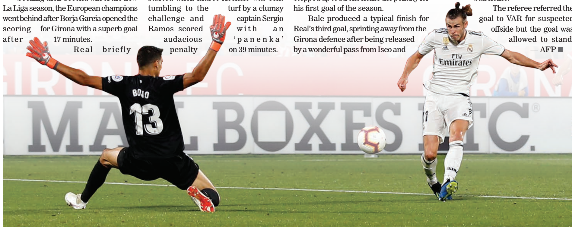
Real Madrid’s Welsh forward Gareth Bale (R) shoots to score a goal during the Spanish league football match between Girona FC and Real Madrid CF at the Montilivi stadium in Girona on 26 August, 2018.