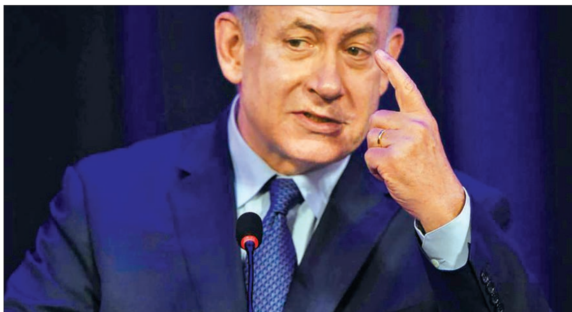
Israeli Prime Minister Benjamin Netanyahu.