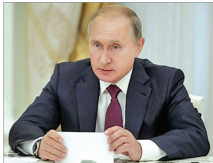
Russian President Vladimir Putin.

Overnight to August 8, 2008, Georgia government forces launched an amassed armed attack on South Ossetia, a hitherto formally region of Georgia that had been pressing for independence as of the early 1990's. Russia rose to defend the residents of the region, many of whom had received Russian citizenship by then, as well as its