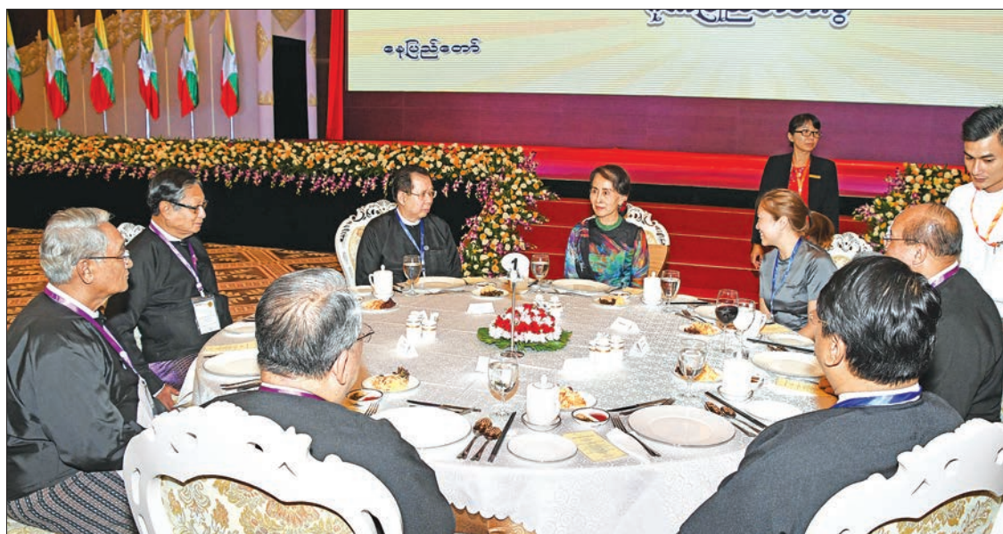
State Counsellor Daw Aung San Suu Kyi hosts dinner in honour of business leaders in Nay Pyi Taw.

The Union Minister also expressed the government's willingness to find resolutions in next meetings.