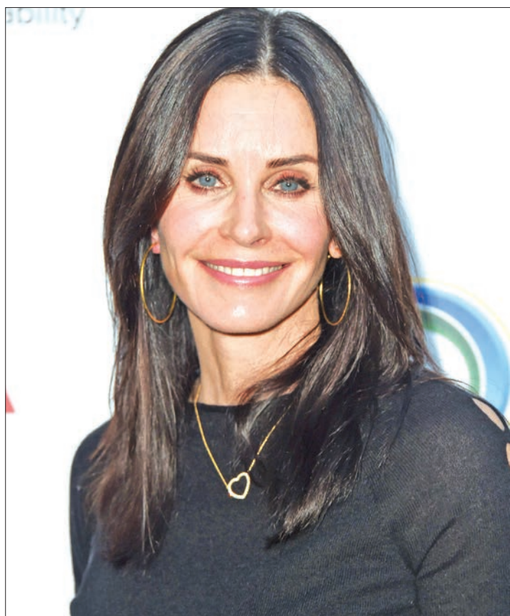
The actress Courtney Cox.

also be appearing in the upcoming ninth season. Sagal, 64, best known for "Sons of Anarchy", will be having a recurring role as Ingrid Jones, a crazed psych patient that Frank (William H Macy) is immediately infatuated with when he encounters her in the ER. The ninth season of "Shameless" will premiere on Showtime in September next year.—PTI ■