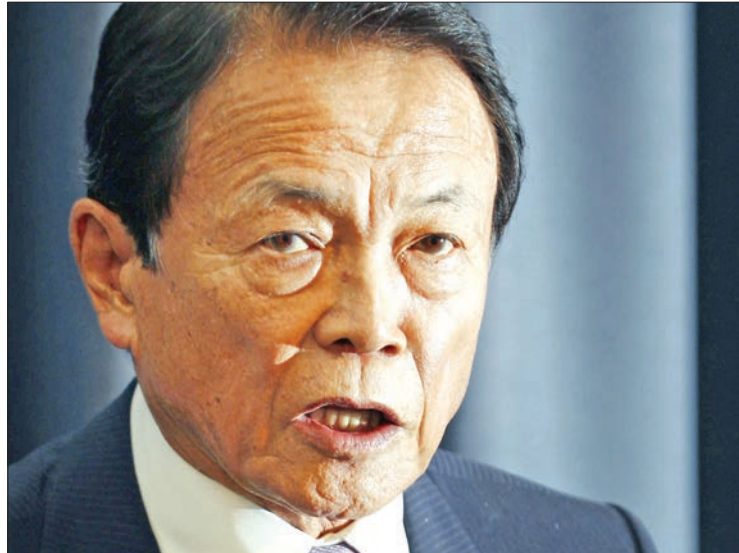
Japanese Finance Minister Taro Aso speaks to reporters at the Finance Ministry in Tokyo on 27 July, 2018.

In the run-up to the upcoming LDP leadership contest, he has said the party should present