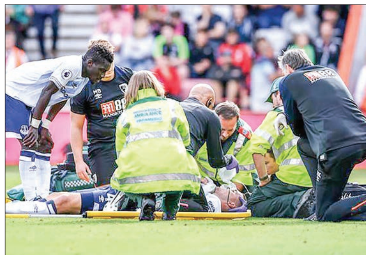
Michael Keane of Everton receives medical treatment during the match between Bournemouth and Everton at Vitality Stadium on 25 August, 2018 in Bournemouth, United Kingdom.