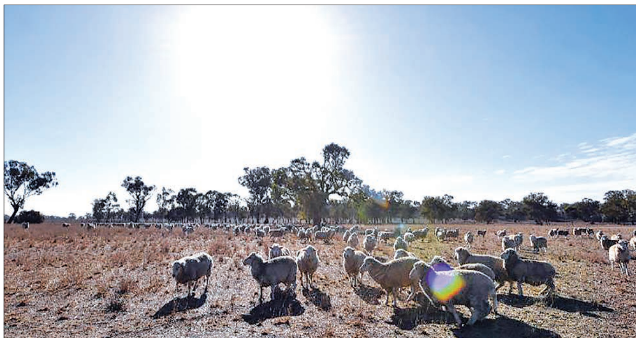
Drought in Australia's eastern states has turned green pastures into dust.

ing, but we know that is nowhere near what is obviously needed.”