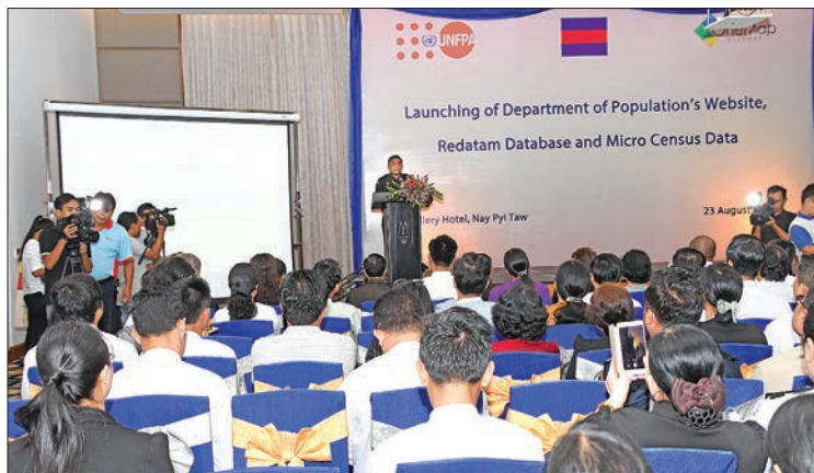
Launching ceremony of Department of Population's website held in Nay Pyi Taw yesterday.

THE Department of Population under the Ministry of Labour, Immigration and Population, United Nations Population Fund (UNFPA) and OneMap Myanmar have collaborated to introduce the Department of Population's website and explain about the REDATAM Database for the 2014 Myanmar Population and Housing Census and online interactive maps in a launch event held at M Gallery Hotel in Nay Pyi Taw yesterday.