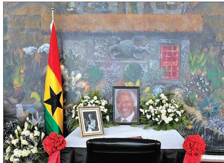
Photo taken on 22 August 2018 shows the Memory Table created for the condolence book in honor of late former United Nations (UN) Secretary-General Kofi Annan at the Accra International Conference Center (AICC) in Accra, capital of Ghana. People from all walks of life have been trooping here to sign the condolence book opened here on Wednesday in honor of the former head of the global body. Annan died on Aug. 18 in Switzerland, at the age of 80.

President Nana Akufo-Addo signed the book of condolence opened in Kofi Annan's family house on Sunday.—Xinhua ■