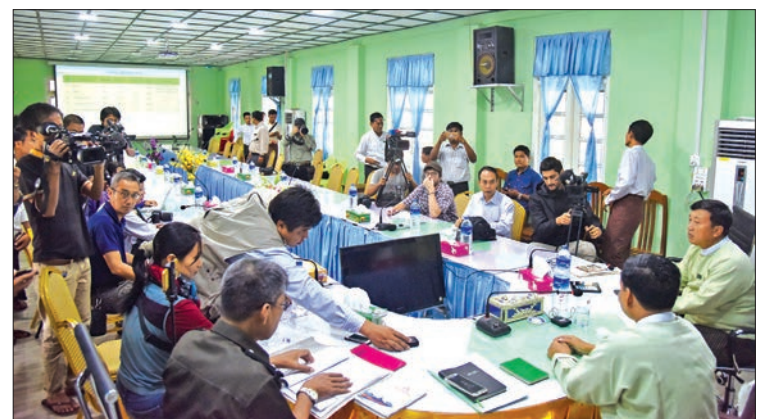
Journalists meeting with officials at the Office of the Maungtaw District General Administration Department in Maungtaw.