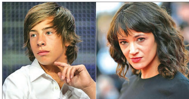
Asia Argento, who shot into the headlines for accusing disgraced Hollywood producer Harvey Weinstein of rape, paid Jimmy Bennett hush money after he claimed that she sexually assaulted him in a California hotel room in 2013.

The main show’s final season premieres on Monday September 24 before shifting back to its regular Thursday time slot. —AFP ■