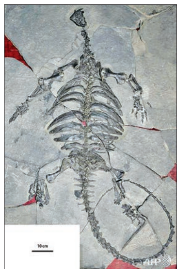
The fossil skeleton of Eorhynchochelys sinensis was found in Guizhou province, China.

The way that turtles evolved into their modern form, with a shell fused to their skeleton and a beak-like face without teeth, has been described as “one of evolution’s most enduring puzzles.”