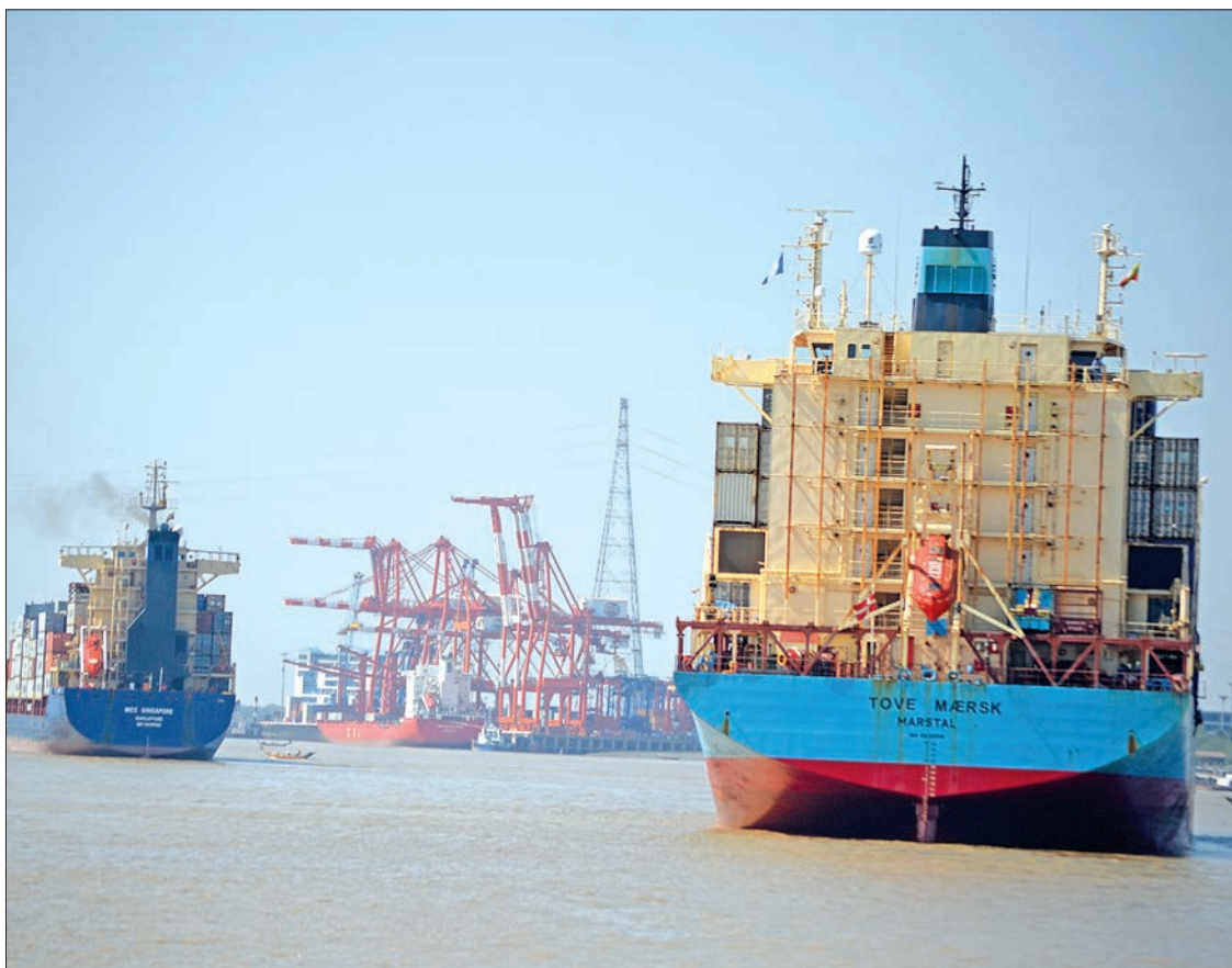
Cargo vessels carrying containers in the Yangon River.

According to the ministry's annual statistical report, the country's maritime trade was valued at $25.019 billion during the last FY. The external trade by sea was $14.67 billion in the 2012-2013 FY, $20.37 billion in the 2013-2014 FY, $22.37 billion in the 2014-2015 FY, $20.56 billion in the 2015-2016 FY and $21.43 billion in the 2016-2017 FY.—Shwe Khine