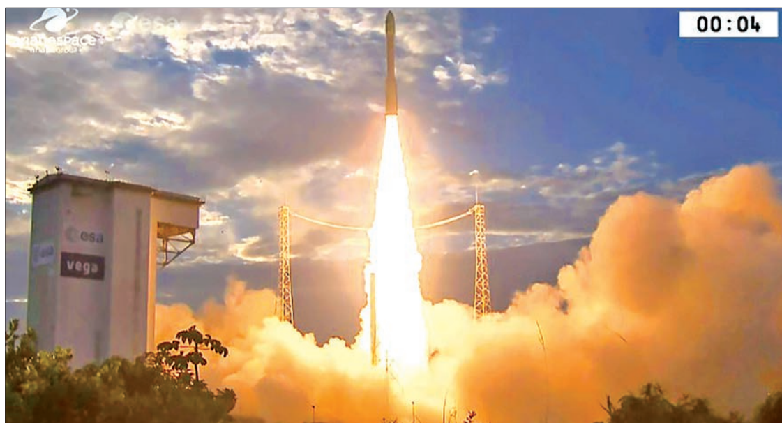
The launch of the “Aeolus” satellite -- named after the guardian of wind in Greek mythology -- took place at 2120 GMT Wednesday, after a 24-hour delay due to adverse weather conditions.

The satellite “will probe the lowermost 30 kilometres (18 miles) of the atmosphere in meas-