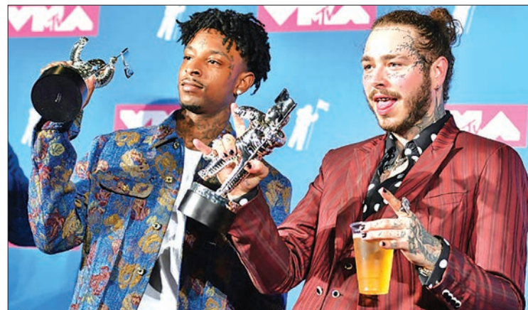
Post Malone (R), who won “Song of the Year” on Monday night’s MTV video awards for “Rockstar,” tweeted: “i landed guys. thank you for your prayers. can’t believe how many people wished death on me on this website”.

“Rockstar,” tweeted: “i landed guys. thank you for your prayers. can’t believe how many people wished death on me on this website.” —AFP ■