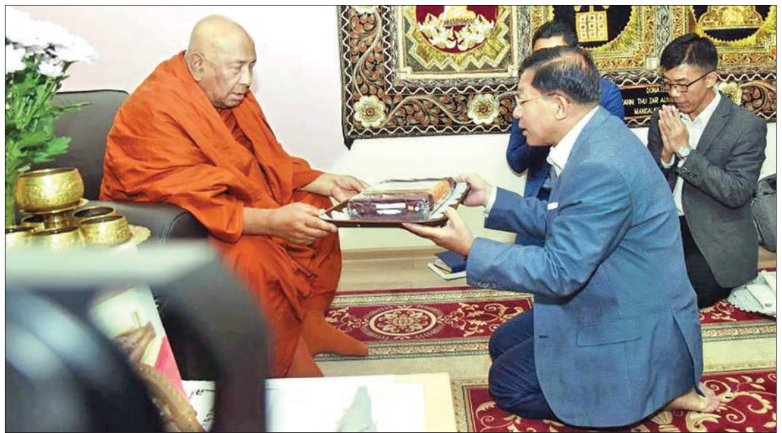
Senior General Min Aung Hlaing donates Waso Robe to Sitagu Sayadaw Ashin Nannissara in Moscow.

Later, Commander-in-Chief of Defence Services donated cash to monastery trustee and