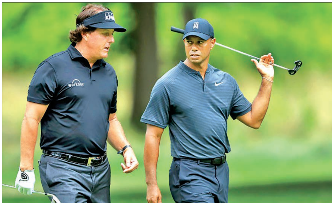
Phil Mickelson (L) and Tiger Woods meet during a preview day of the World Golf Championships - Bridgestone Invitational, at Firestone Country Club in Akron, Ohio, on 1 August 2018.

chance of the duo carving up the lucrative purse between them, insisting that the event would be winner-take-all. "If you (don't) do that, it undermines it," Mickelson said. "The whole point is the