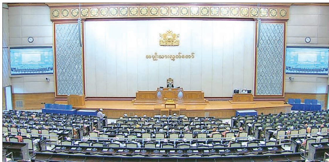
The twelfth-day meeting of the Second Amyotha Hluttaw's ninth regular session being convened in Nay Pyi Taw yesterday.