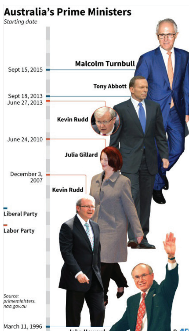
Australia's prime ministers.

“What began as a minority has by a process of intimidation persuaded people that the only way