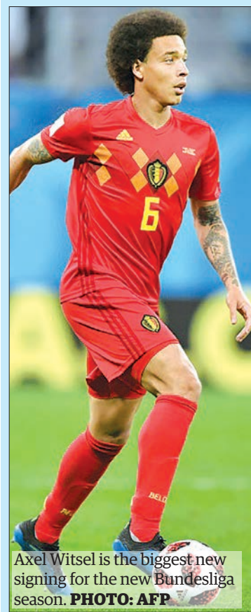
Axel Witsel is the biggest new signing for the new Bundesliga season.

The spotlight will also fall on Kovac in his first home league game after joining from Eintracht Frankfurt, who shocked Bayern 3-1 in May's German Cup final in his final game.—AFP ■