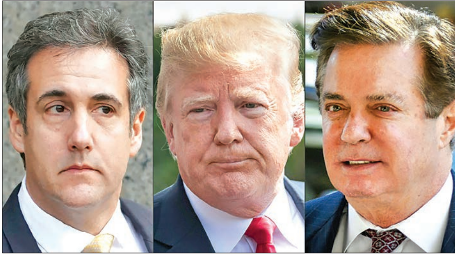
US President Donald Trump was dealt back-to-back blows in the cases of his former lawyer Michael Cohen (L) and former campaign chairman Paul Manafort (R).

WASHINGTON — Donald Trump insisted Wednesday he did nothing wrong after his longtime attorney implicated him in illicit hush payments made before the 2016 election, as experts warned the legal maelstrom swirling around the Republican leader could further threaten his presidency.