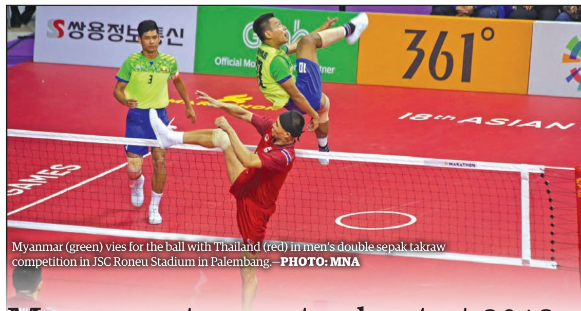
Myanmar (green) vies for the ball with Thailand (red) in men's double sepak takraw competition in JSC Roneu Stadium in Palembang.

In the semifinals, Toungoo (A) team advanced to the final by beating Bago (A) team 3-0, while Toungoo (B) team made the final by winning over Pyay (B) team by 6-5.—Lynn Thit (Tgi) ■