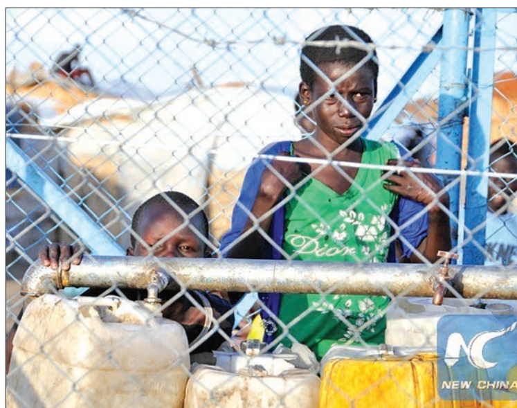
The ICRC called for swift measures to meet the humanitarian needs of displaced people due to inter-communal violence in Ethiopia.

The UN's Central Emergency Response Fund (CERF) last month released 15 million US dollars to urgently scale up humanitarian assistance to people affected by escalating inter-communal violence in Ethiopia.—Xinhua ■