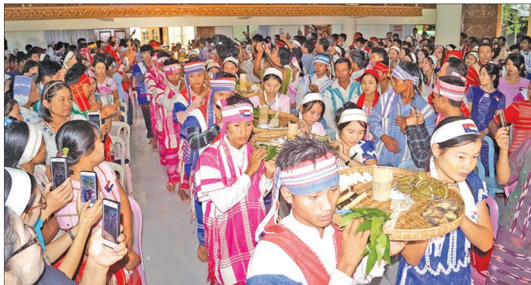
Kayin ethnic people celebrating Kayin wrist-tying event in Minhla Township.

UNDER the supervision of Bago Region Kayin ethnic affairs minister, a Kayin wrist-tying ceremony was held at Myoma monastery, Ward-2, Minhla Township on 21 August around 9 am.