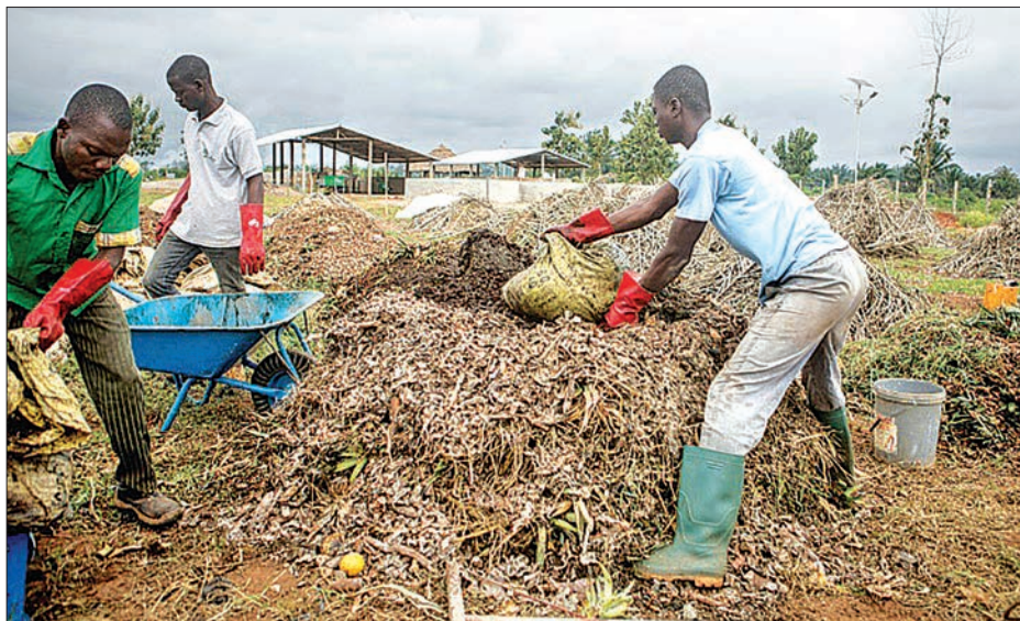
The facility processes around six tonnes of organic waste every week, turning it into 200 cubic metres of biogas.

The centre, which opened late last year, also plans to produce around 400 tonnes of organic fertiliser per year.