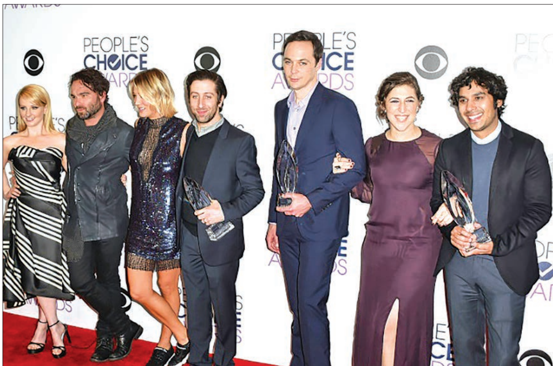
Focusing on a highly intelligent but socially-awkward professor and his group of scientist friends, “Big Bang” was the biggest comedy ratings draw on broadcast television for years, winning 10 Emmys.

“We, along with the cast, writers and crew, are extremely appreciative of the show’s success and aim to deliver a final season, and series finale, that will bring ‘The Big Bang Theory’