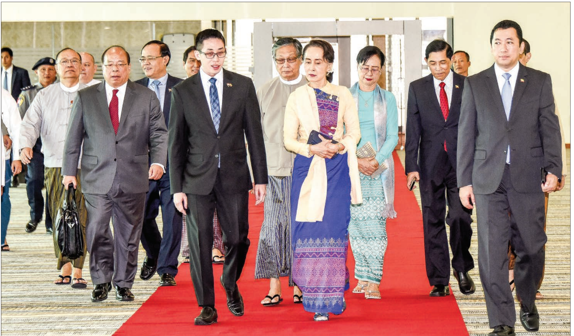
State Counsellor Daw Aung San Suu Kyi being seen off at the Nay Pyi Taw International Airport.

STATE COUNSELLOR Daw Aung San Suu Kyi left Nay Pyi Taw this morning by special flight to Singapore for a working goodwill visit, at the invitation of Singaporean Prime Minister Mr. Lee Hsien Loong.