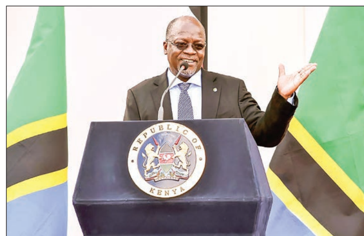
The US statement came amid sustained criticism of the rule of President John Magufuli, pictured in October 2016, who has cracked down on dissent since taking office in 2015.

The US statement came amid sustained criticism of the rule of President John Magufuli who has cracked down on dissent since taking office three years ago. ■