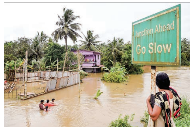
Kerala has been battered by record monsoon rainfall this year.

Authorities said thousands of people have been taken to safety so far but 6,000 more are still waiting for rescue.