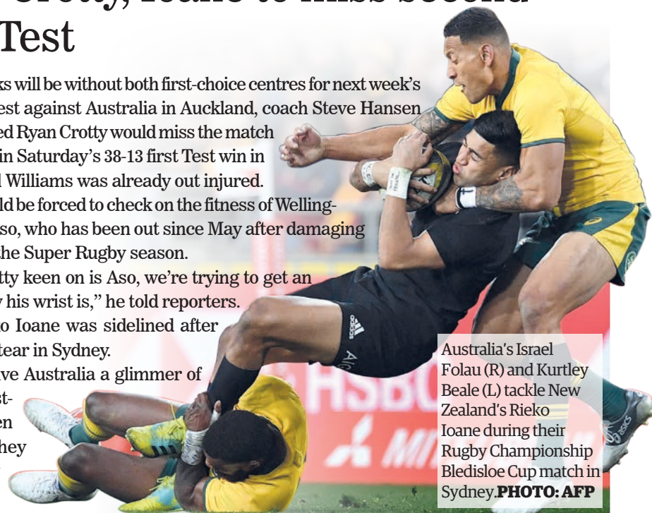
Australia's Israel Folau (R) and Kurtley Beale (L) tackle New Zealand's Rieko Ioane during their Rugby Championship Bledisloe Cup match in Sydney.

The injuries may give Australia a glimmer of hope for next week's must-win second Test at Eden Park, a venue where they have not tasted victory since 1986. —AFP ■