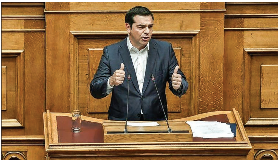
Greece's Prime Minister Alexis Tsipras.

omists, such as Theodoros Stamatou of Eurobank, argued that while bailout programmes were "unavoidable" in a country lagging far behind in reforms, they were also too harsh.