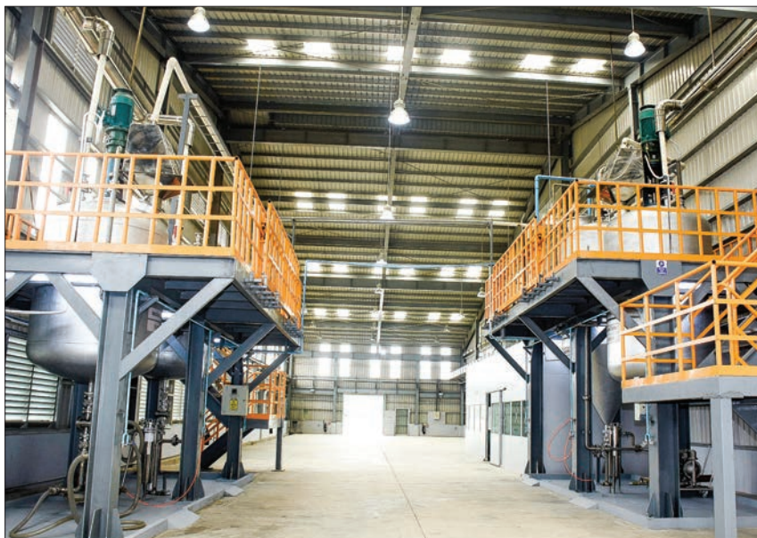
Vice President U Henry Van Thio inspects the agrochemical factory in Hmawbi Township in the northern Yangon Region.

Vice President U Henry Van Thio, Union Minister for Agriculture, Livestock and Irrigation Dr