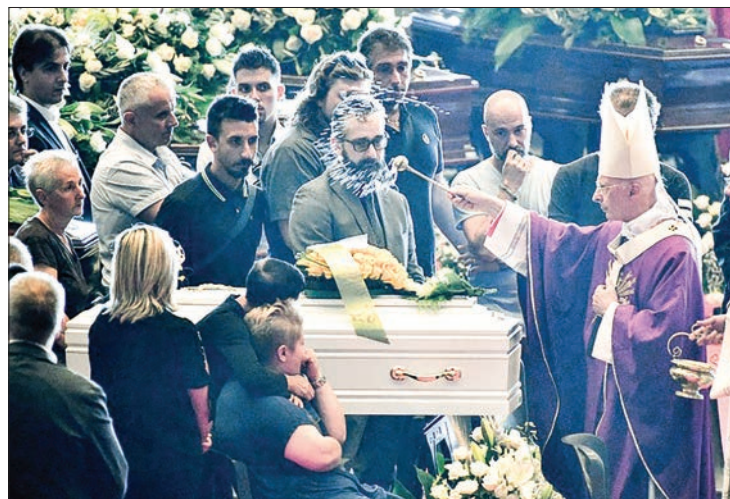
Archbishop Angelo Bagnasco blessed the coffins during the state funeral for victims of the Morandi bridge collapse.

His presence was particularly poignant in a staunchly Catholic country, where the far-right is now in power and which has seen