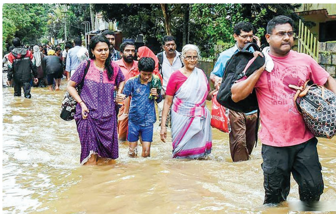
People evacuate from flood-stricken area in Kochi of Kerala State in India

Khan’s Pakistan Tehreek-e-Insaf, or Movement for Justice, emerged as the single largest party in the 25 July parliamentary elections. —Xinhua ■