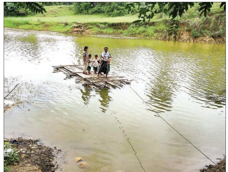
Local people in Meiktila are facing transportation hardships due to lack of a creek bridge.

The project is expected to start after the harvesting of sesame crops cultivated near the area, U Tin Win added.—Chan Tha (Meiktila)■