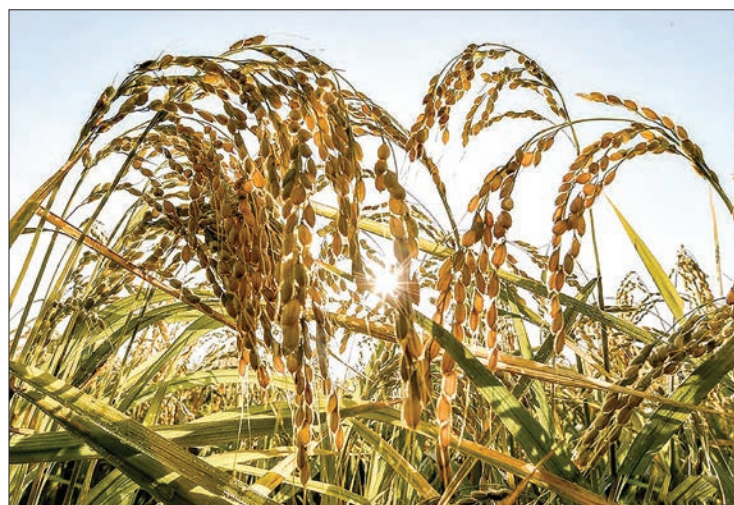
Scientists have found a gene which plays an important role in helping rice.