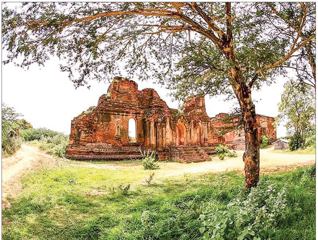
A historic site in Bagan — dating back to the 10 th Century — was damaged by a 6.8-magnitude earthquake that struck central Myanmar in 2016.

All proceeds from both exhibitions will go to BAGAN-COM, an organisation attempting to enrol Bagan on the world heritage list. The organization plans to attend the 43 rd Session of UNESCO’s World Herit-