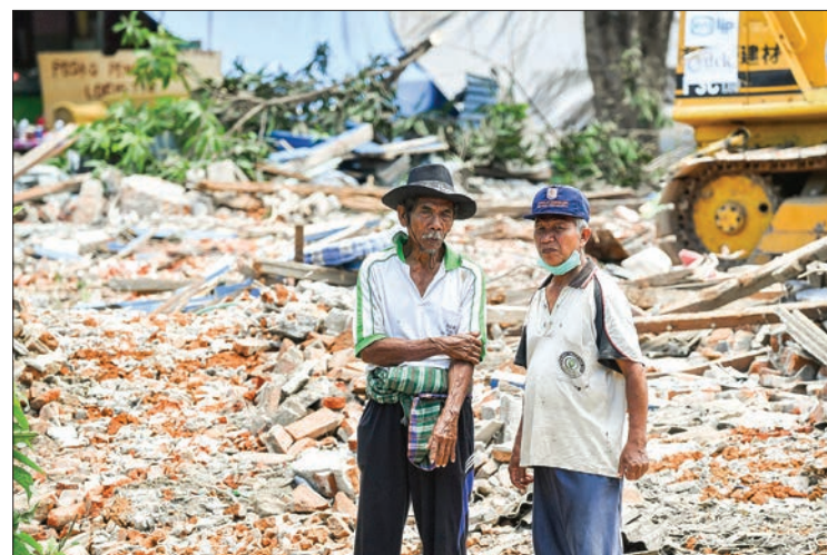
Two residents look on as damaged houses are being destroyed by workers using an excavator after an earthquake hit the area of Gangga on 12 August 2018.

In 2004, a tsunami triggered by a magnitude 9.3 undersea earthquake off the coast of Sumatra, in western Indonesia, killed 220,000 people in countries around the Indian Ocean, including 168,000 in Indonesia. —AFP ■