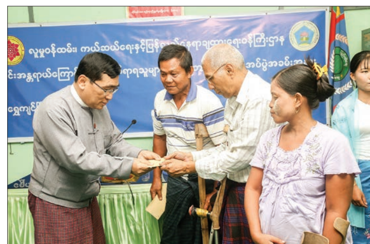
Union Minister Dr. Win Myat Aye donate cash to flood-affected people in Shwekyin.

The Union Minister next travelled to Shwekyin Township and met with and gave words of encouragement to people who became disabled from landmine explosions, and donated Ks 7.4 million to support them. He also donated Ks 543,900 for purchasing rice for flood-affected people. The Union Minister then met with departmental officials in Shwekyin Township and discussed rehabilitation processes in the aftermath of the damages caused by the floods.—MNA ■