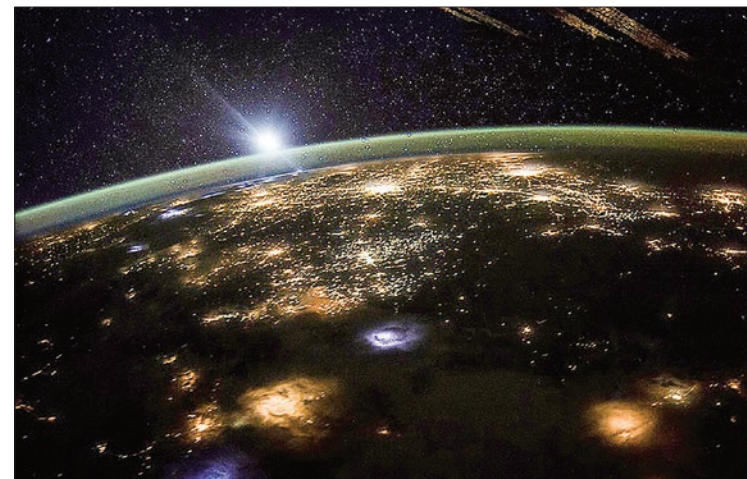
One Russian expert believes that space internet technologies are necessary and feasible.

"At the same time, 50% of the planet's population lives within the 200-kilometer coastal zone, while 70% of the global population inhabit 7% of the global territory. It turns out that the efficiency of a truly global coverage will be fairly low due to a low number of users. At the same time, densely populated areas with great demand and capacity to pay, already have ground-based mobile service operators, which by that time will