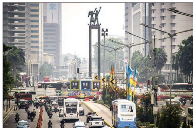
Jakarta's toxic skies have been stuck at unhealthy levels for weeks despite drastic efforts to cut down on congestion.

Meanwhile, annual forest fires in Sumatra are threatening to envelop the sleepy city of Palembang in a different kind of toxic cloud. Other countries have faced similar air pollution challenges including Beijing when it was set to host the Olympics in 2008. The Chinese capital took successful, drastic measures including temporarily closing factories to clean up its skyline. —AFP ■