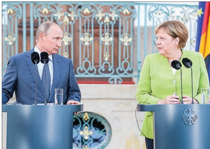
Russian President Vladimir Putin and German Chancellor Angela Merkel. PHOTO: TASS

“In 2017, we delivered 53.8 bln cubic meters of gas, which covers more than 30% of the German market, while the consumption of Russian gas is constantly growing and this year it increased by 13%,”