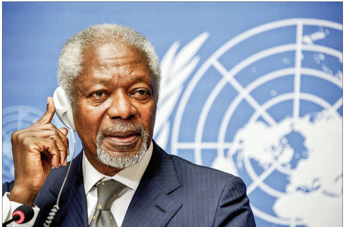
Kofi Annan, who died on Saturday aged 80, is widely credited for raising the United Nation’s profile in global politics.

The UN said it would fly flags at half mast at all of its locations around the world through