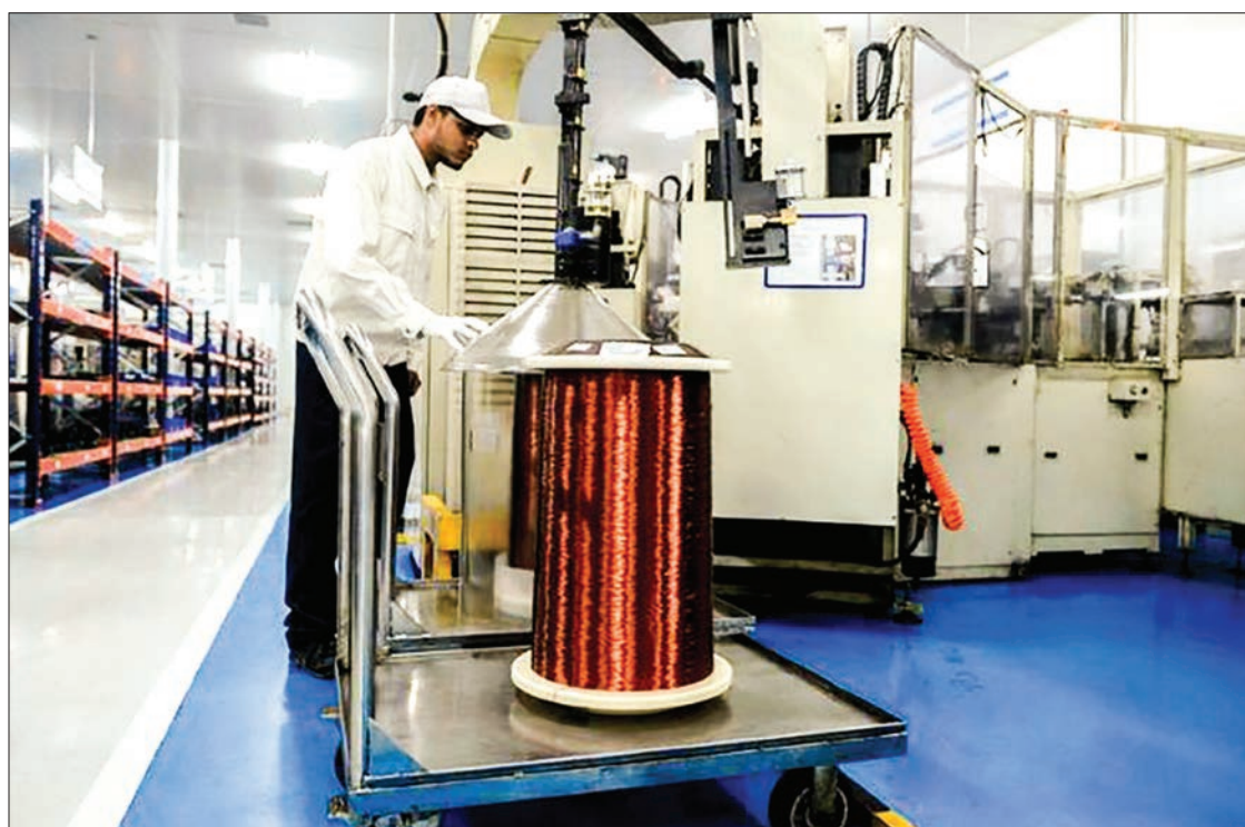
As copper is used extensively in the modern economy the price of the metal is seen an indicator for the health of the global economy, earning it the nickname of Doctor Copper.

Economists at the Bank of England who monitor the global growth to set monetary policy said on their blog that for them it “is crucial to assess what is happening in the world economy in