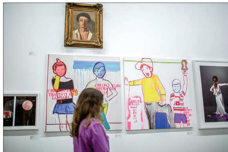
A crowdfunding campaign raised more than a million reais ($275,000) allowing the exhibition to reopen for a month.

A crowdfunding campaign raised more than a million reais ($275,000) allowing it to reopen for a month, with free admission, at the School for Visual Arts in Rio de Janeiro’s Parque Lage — a wooded parkland at the foot of the mountain