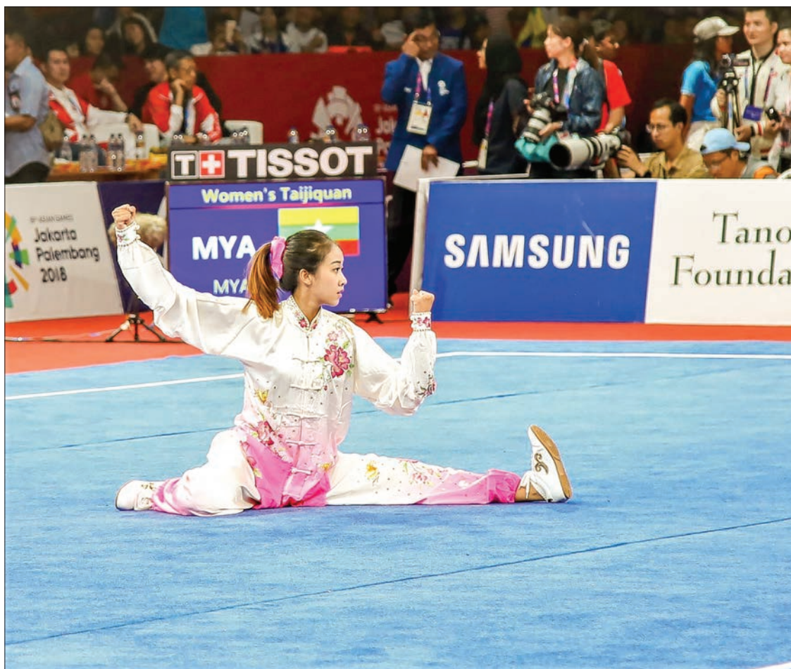
A wushu athlete performing in the demonstration contest in yesterday's 18 th Asian Games 2018 in Indonesia.

In the morning women's sepak takraw contest, Myanmar beat Indonesia 2-1 while in the afternoon of the same event, Myanmar lost to Viet Nam 1-2. —Myanmar News Agency