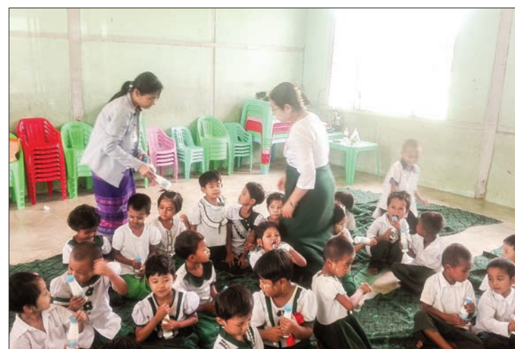
Teachers treat students with milk and dairy products at a school.

Therefore, the department can feed 800 school children a month.—Zeyatu (Magway) ■