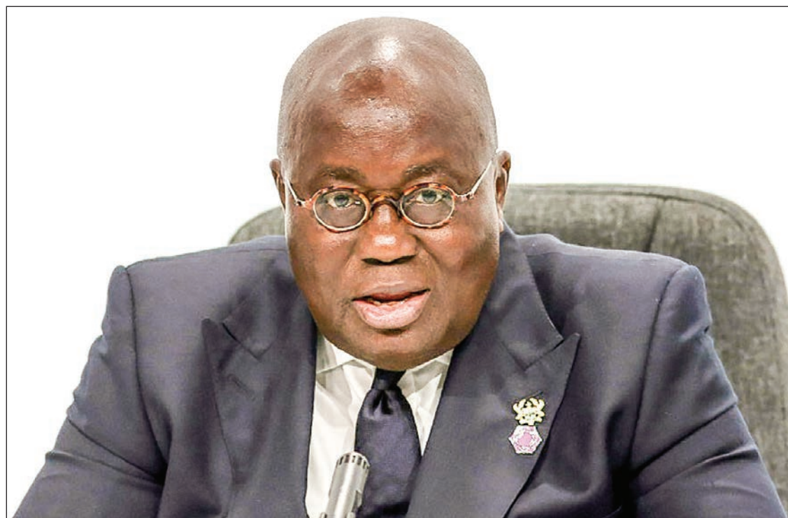
Ghana's President Nana Akufo-Addo was voted into power in 2016 on a pledge to revamp Ghana's economy.

ACCRA — Ghana is backpedalling out of a banking crisis as the government takes on debt to save a troubled sector and vows to punish the executives responsible.