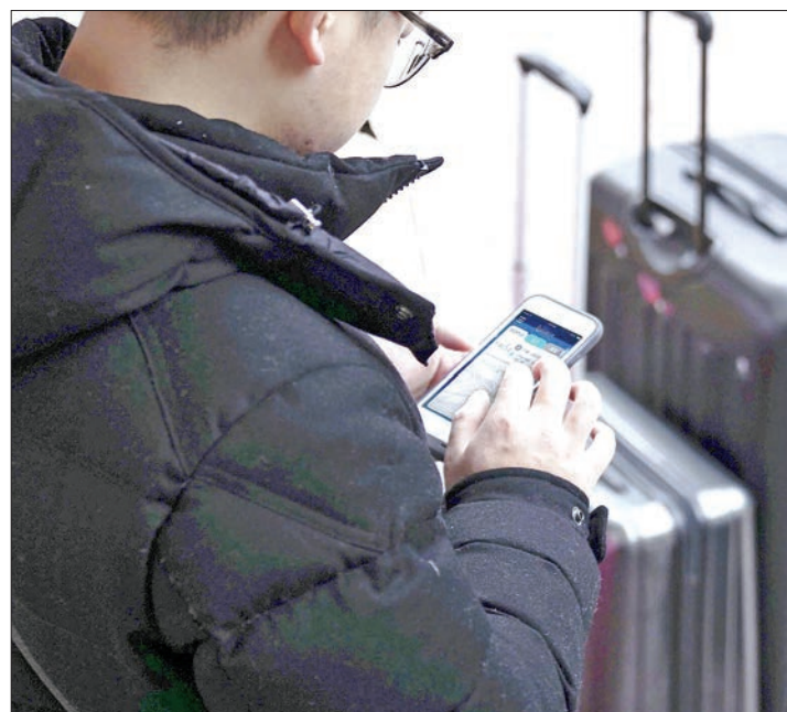
Undated file photo shows a man using his smartphone.

In 2015, the ministry began requiring carriers to unlock smartphones several months after purchase, but had not set similar rules for second-hand devices. —Kyodo News ■