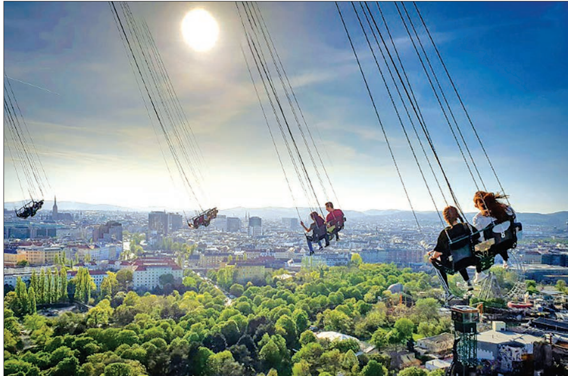
Vienna has been ranked the world's most liveable city in a new survey.

"Those that score best tend to be mid-sized cities in wealthier