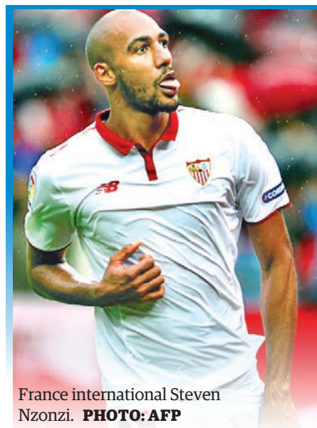
France international Steven Nzonzi.

"The long and the short of it is that first and foremost his priorities are here with Melbourne Victory and the situation will no way compromise any of our games or training," Muscat said.—AFP ■