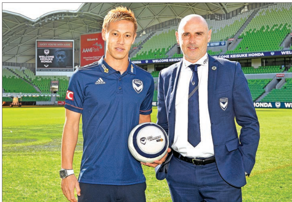
Japanese football player Keisuke Honda (L) poses for a photo with Melbourne Victory's manager Kevin Muscat after signing to play with Melbourne Victory in Australia's A-League, in Melbourne on 15 August, 2018.

MELBOURNE(Australia) — Japanese superstar Keisuke Honda revealed on Wednesday he planned to retire after the World Cup but decided to keep playing after being inspired by Melbourne Victory coach Kevin Muscat.