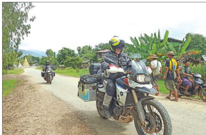
Tourists visiting the country by motorbikes to observe its many traditions, customs and lifestyles.

Their travel tour was arranged by Khaing Lin Tun Co., Ltd., under the supervision of the