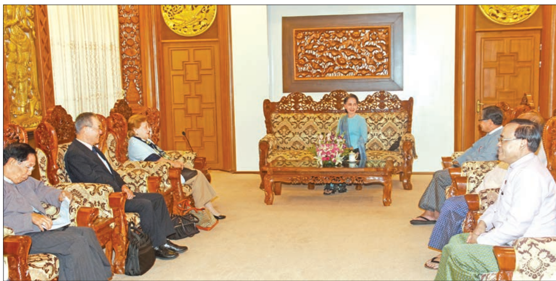
Daw Aung San Suu Kyi holds talks with Ambassador Rosario Manalo, Chairperson of the Independent Commission of Enquiry, and members of the Commission in Nay Pyi Taw yesterday.