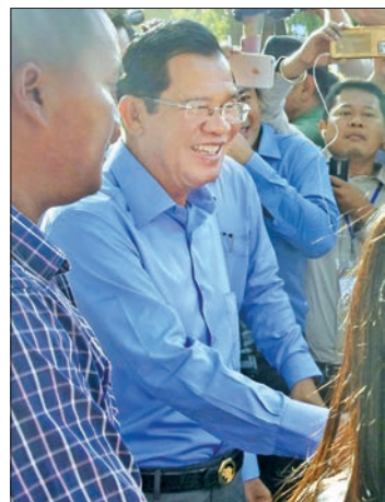
Cambodian Prime Minister Hun Sen (C) smiles after casting his vote in the general election in Kandal Province on July 29, 2018.

Cambodia's ruling party won all parliamentary seats in last month's general election that lacked any serious challengers, the country's election authority confirmed Wednesday.