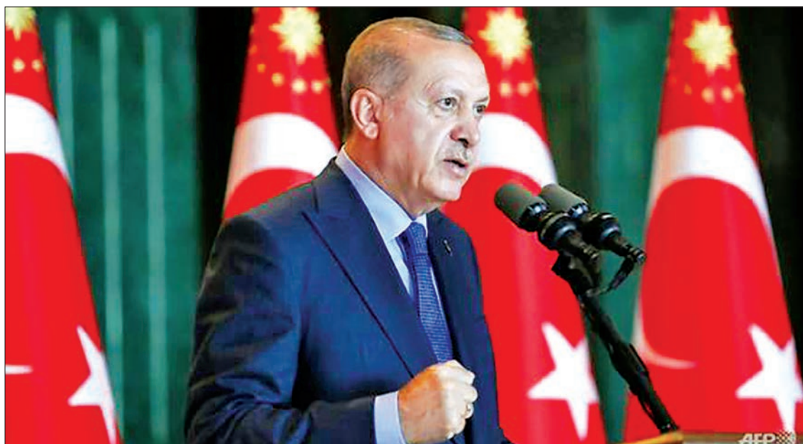
President Recep Tayyip Erdogan has been repeatedly photographed with Apple products including the iPhone and iPad.