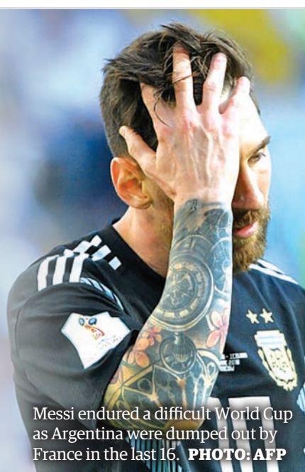
Messi endured a difficult World Cup as Argentina were dumped out by France in the last 16.

Lionel Scaloni has been in temporary charge of Argentina since Jorge Sampaoli left after their disastrous World Cup tournament in Russia, where they were beaten 4-3 in the last 16 by France after an embarrassing 3-0 group-stage loss to Croatia.—AFP ■