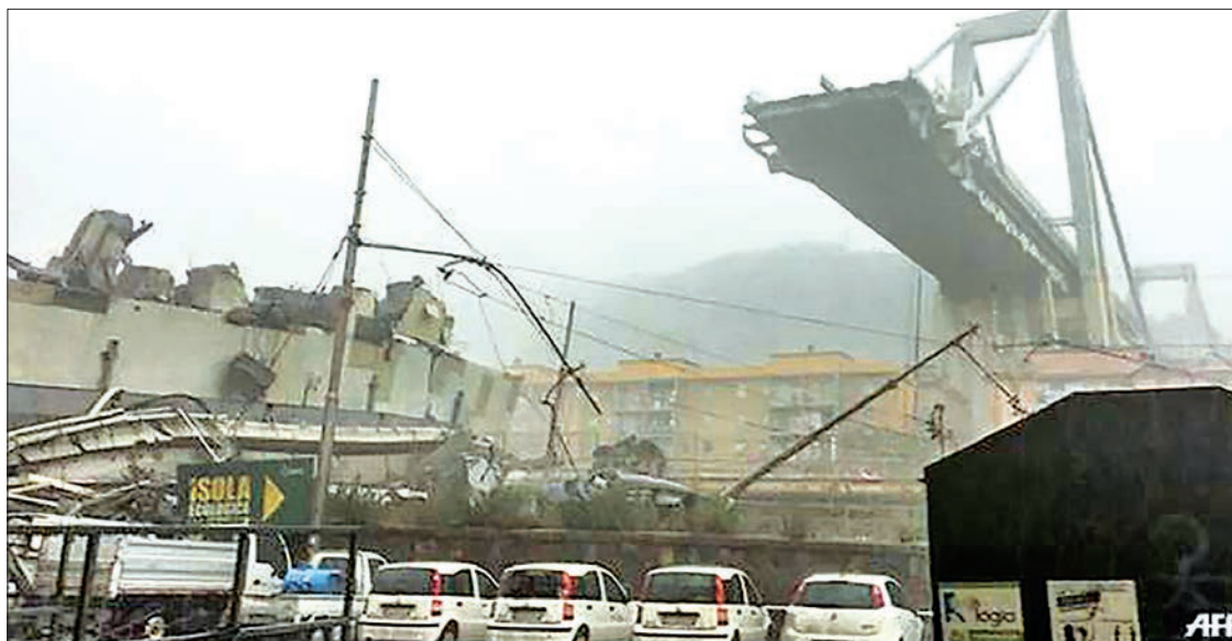
This handout picture provided by the Italian police (Polizia di Stato) on 14 August, 2018 shows a collapsed section of a viaduct on the A10 motorway in Genoa.

The green lorry was still on the bridge late evening, stopped just short of the now yawning gap. The incident — the deadliest of its kind in Europe since 2001 — is the latest in a string of bridge collapses in Italy, a country prone to damage from seismic activity but where infrastructure generally is showing the effects of a faltering economy. —AFP ■