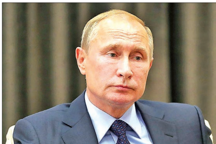
Russian President Vladimir Putin.