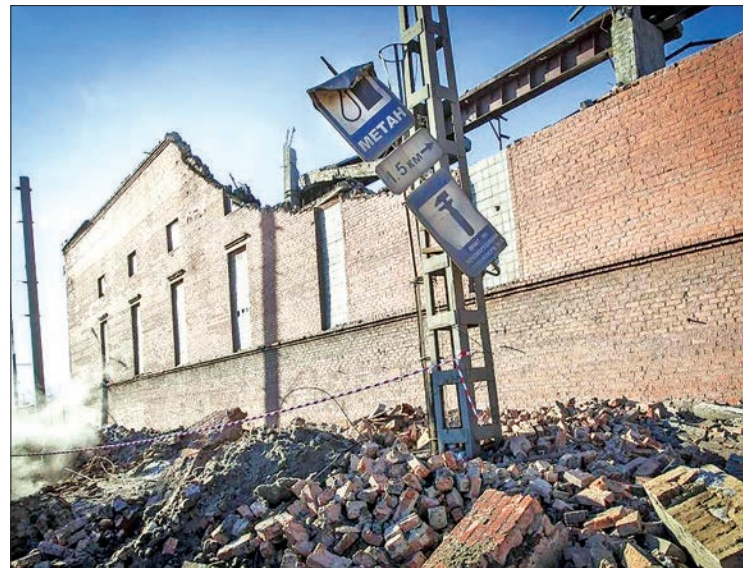
Damage at a factory after a rock exploded in the sky in Siberia.

Meaning these rocks are rare survivors from a very different time on Earth.—Xinhua ■