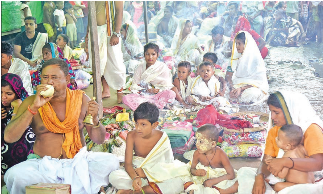
Hindu community attend vigil for 113 Hindus who were killed by ARSA terrorists in 2017 in Maungta.

GRIEF-STRICKEN Hindu community in Maungta, Rakhine State, held a prayer session yesterday for 113 Hindus who were killed in the August-25 ARSA terrorists attack in 2017.