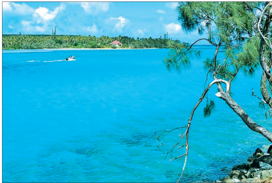
Tougher protections in New Caledonia in the South Pacific are designed to protect near-pristine coral reefs.

After years of work, the New Caledonia government Tuesday voted to set up marine protected areas (MPAs) surrounding the reefs, and to strengthen an existing one around Entrecasteaux, which is already a UNESCO