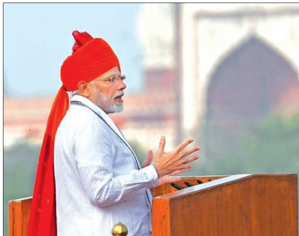
Indian Prime Minister Narendra Modi gestures while delivering his speech as part of India’s 72 nd Independence Day celebrations, which marks the 71 st anniversary of the end of British colonial rule, at the Red Fort in New Delhi on 15 August, 2018.

The conservative prime minister said that India would be only the fourth country — after Russia, the United States and China — to launch its