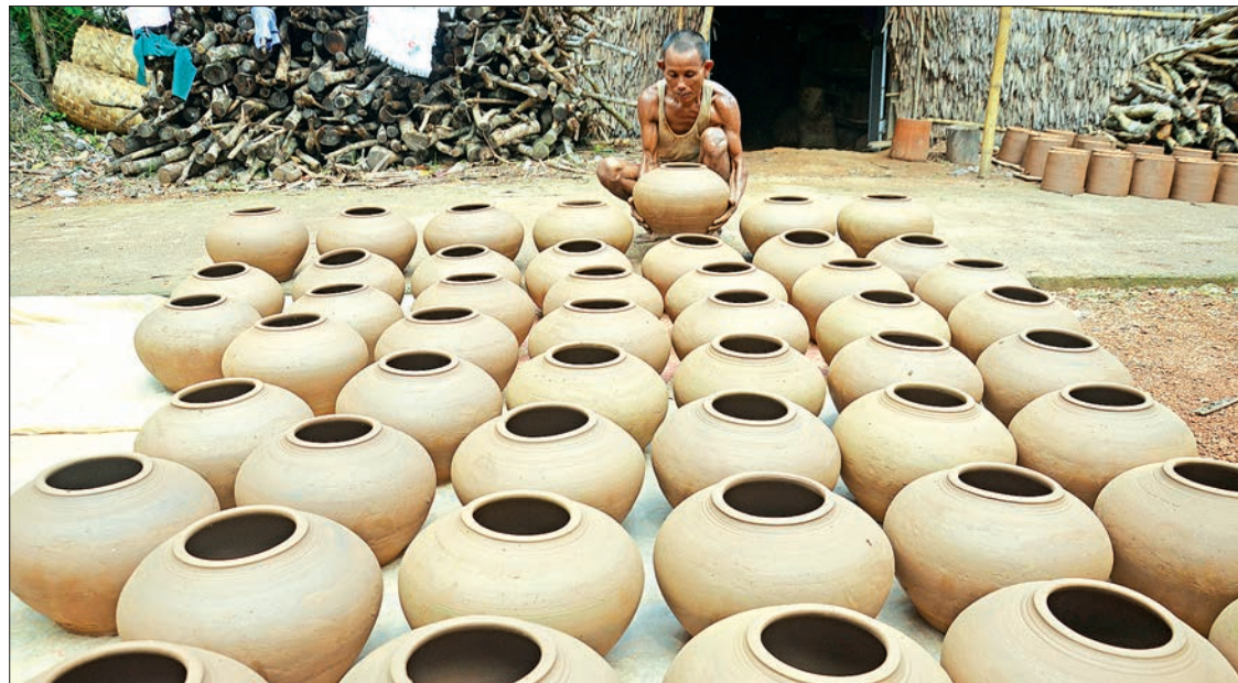
A man drying clay pots in the sun. Informal businesses face hurdles accessing financial support.

from foreign countries, which adds additional cost in production. Therefore, supporting industry is required for SMEs. Additionally, they lack technique to manufacture value-added prod-