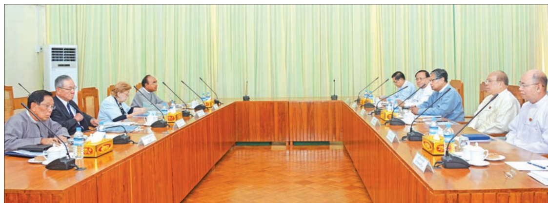
Union Minister U Kyaw Tint Swe meets with Ambassador Rosario Manalo, Chairperson of the Independent Commission of Enquiry, and members of the Commission in Nay Pyi Taw yesterday.

UNION Minister for the Office of the State Counsellor U Kyaw Tint Swe received the Independent Commission of Enquiry at the meeting hall of his ministry in Nay Pyi Taw yesterday morning.