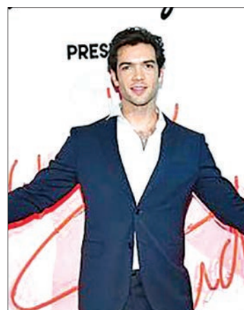
Ethan Peck—known for ABC sitcom "10 Things I Hate About You"—will be unveiled in the second season of "Star Trek: Discovery".

LOS ANGELES — Actor Ethan Peck — whose grandfather was Hollywood legend Gregory Peck — has been cast as iconic half-Vulcan science officer Spock in CBS's "Star Trek: Discovery".