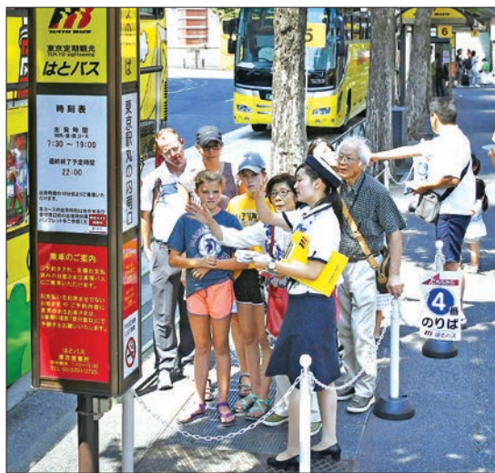
Tourists get ready to board a multilingual sightseeing bus known as Hato Bus at a stop in front of JR Tokyo Station on 10 August, 2018. The guided bus service, dedicated to Tokyo and its vicinity, marks its 70 th anniversary on 14 August.

It introduced its trademark yellow buses from 1979 to attract people's attention, but the business deteriorated and remained low in the 1990s following the burst of Japan's economic bubble. The number of tourists for its Tokyo sightseeing tours stood at around 520,000 in 2001.—Kyodo News ■