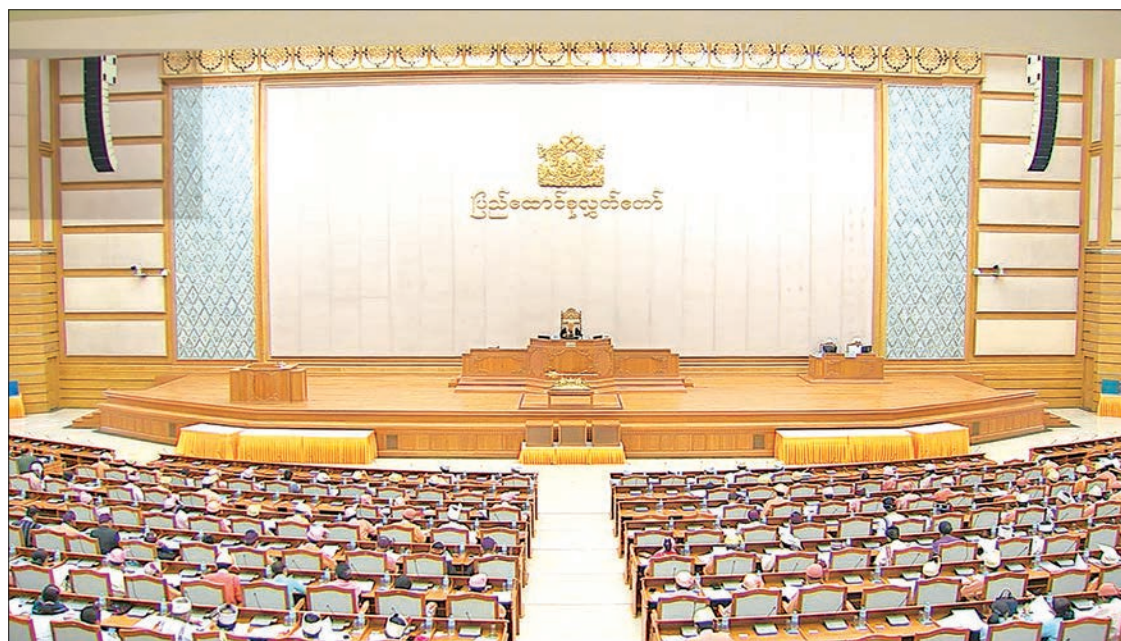
Pyidaungsu Hluttaw is being convened in Nay Pyi Taw.

The Pyidaungsu Hluttaw also discussed the bill amending the Vacant, Fallow and Virgin Land Management Law (2017), which garnered opposing views from the Pyithu Hluttaw and Amyotha Hluttaw.