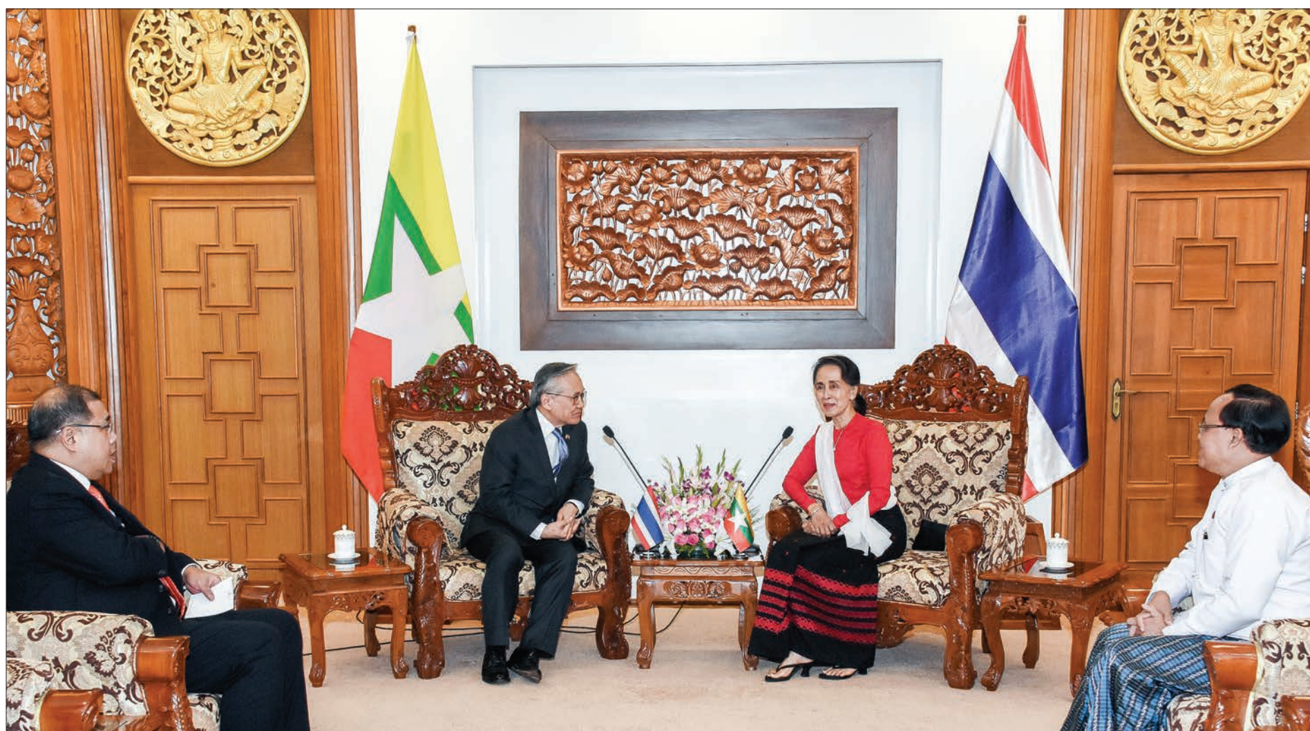
State Counsellor Daw Aung San Suu Kyi (right) holds talk with Thai Foreign Minister Mr. Don Pramudwinai.

Natural Strategic Partnership, Myanmar migrant workers, second Friendship Bridge among issues discussed