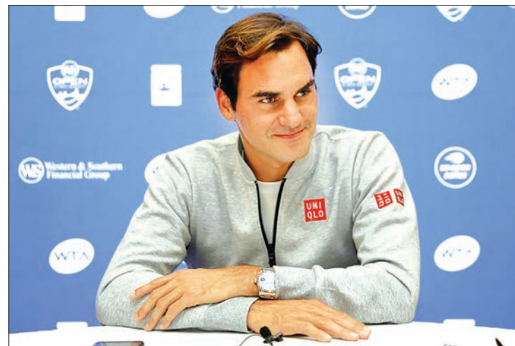
Roger Federer is returning to action for the first time since his quarter-final exit at Wimbledon.

"I'm more relaxed about my schedule now. I have more time for the family, which is important for me," the father of two