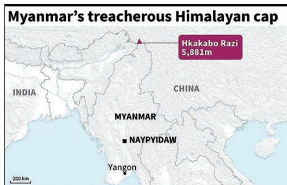
Map showing Hkakabo Razi, a 5,881m peak in the northern tip of Myanmar.

In his book "Burma's Icy Mountains", he describes how the peak "utterly defeated" him, forcing him to turn back a vertical kilometre below the top.