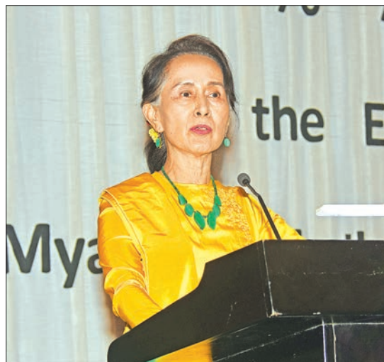
State Counsellor Daw Aung San Suu Kyi delivers a speech at the ceremony to commemorate the 70 th Anniversary of the Establishment of Myanmar-Thailand Diplomatic Relations in Nay Pyi Taw.

Thailand has always been one of our most important regional partners as well as a close neighbor of Myanmar. We share a 2416 km long border, and we have been cooperating in various areas to the mutual benefit of our two peoples since the establishment of diplomatic relations on 24 August 1948. Throughout the 70-year journey, our two countries have resolved issues, large and small, through amicable dialogue and consultations, based on friendship, mutual understanding and mutual respect. Thailand was the very first country outside Myanmar on which I set foot after I was released from house arrest in 2010. Thailand was also the first country I chose for my first official visit abroad after the assumption of my official duties in our new Government. I felt the warmth of friendship, kindness and hospitality extended by the