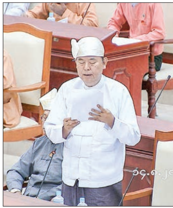
Deputy Minister for Education U Win Maw Tun.