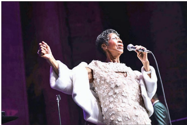
Aretha Franklin is shown here performing at the Elton John AIDS Foundation event in New York in November 2017 -- her last known public performance.