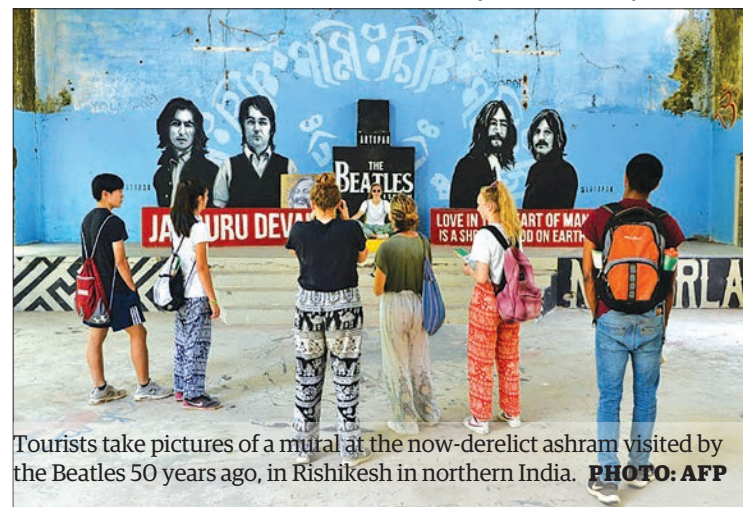
Tourists take pictures of a mural at the now-derelict ashram visited by the Beatles 50 years ago, in Rishikesh in northern India.

After a while though, relations worsened between the Beatles and the Maharishi, the atmosphere soured by the yogi’s rumoured sexual advances and his evident desire to make money from his famous new pupils. McCartney left after five weeks and Harrison and Lennon after two months. Asked the reason by the yogi, Lennon is reputed to have told the guru, “If you’re so cosmic you’ll know why.”—AFP ■