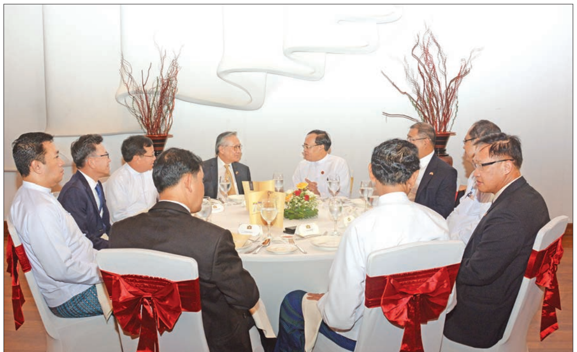
Union Minister for International Cooperation U Kyaw Tin hosts a luncheon in honour of Mr. Don Pramudwinai, Minister of Foreign Affairs of the Kingdom of Thailand, in Nay Pyi Taw.

During the Meeting, the two Ministers touched on a wide range of issues relating to promoting bilateral relations, economic and socio-cultural cooperation; enhancing the bilateral relations between Myanmar and Thailand to the "Strategic Partnership"; doubling the current bilateral trade volume by 2022; working continuously for the promotion and protection of the rights of Myanmar migrant workers; opening of the 2 nd Myanmar-Thailand Friendship Bridge for better connectivity; strengthening the exchanges between the Provinces/States and Regions along the border; implementing of modern villages project to contribute to the efforts of the Myanmar Government for the development of Rakhine