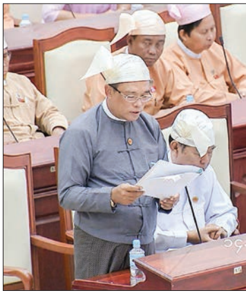
Deputy Minister for Construction U Kyaw Lin. PHOTO: MNA

THE Second Pyithu Hluttaw's ninth regular session held its ninth-day meeting at the Pyithu Hluttaw meeting hall yesterday morning. At the meeting, asterisk-marked questions were answered by Deputy Minister for Education U Win Maw Tun and Deputy Minister for Construction U Kyaw Lin. Also at the meeting, a motion was tabled and a report read.