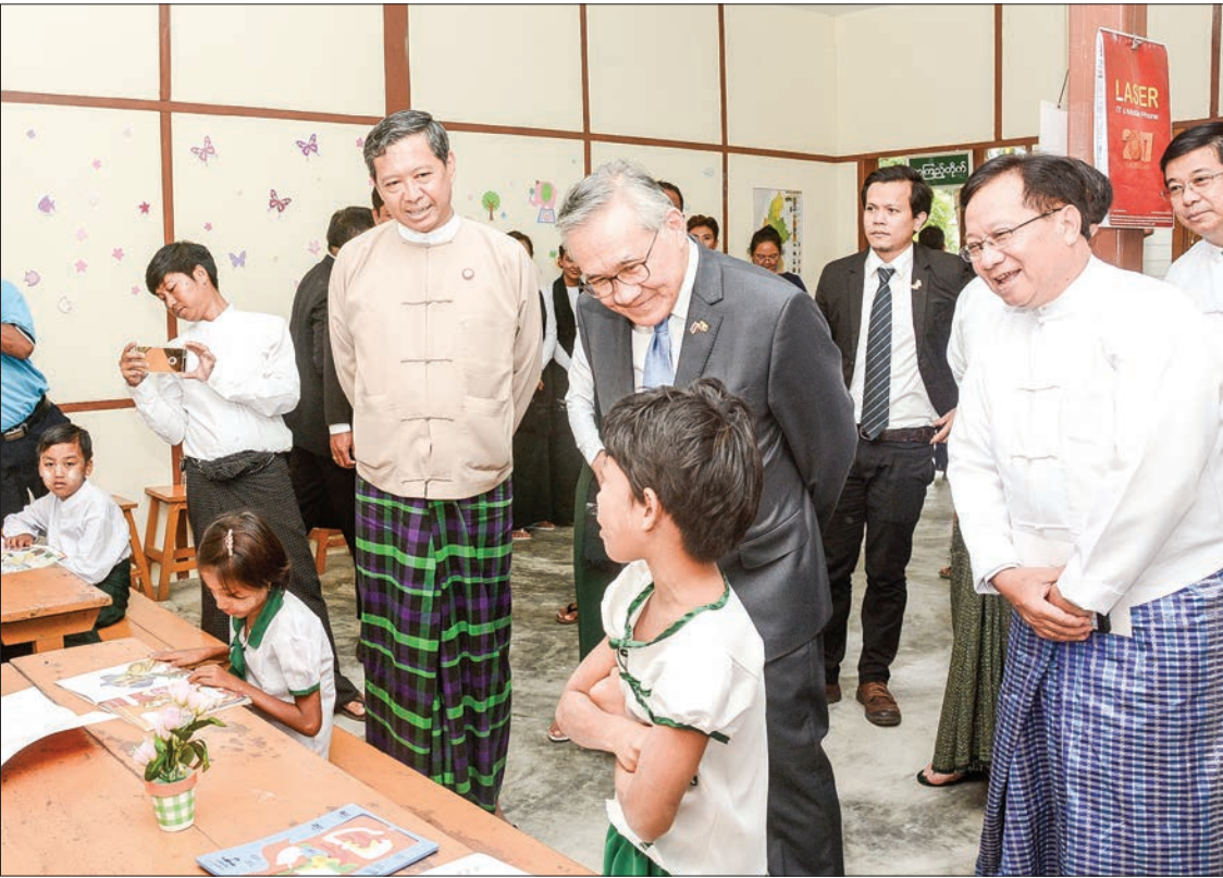
Union Minister Dr. Myo Thein Gyi and Thailand Foreign Minister Mr. Don Pramudwinai meet school children at Basic Education Primary School (Thabyayhla), Nay Pyi Taw yesterday.

The new two-storey school building is a 110 ft. long and 30 ft. wide brick nogging building and the sports ground includes a badminton court and a futsal court.—Myanmar News Agency