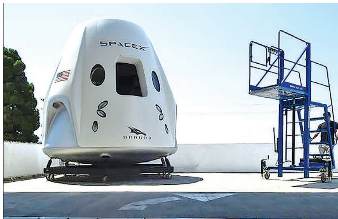
A mock up of the Crew Dragon spacecraft is displayed during a media tour of SpaceX headquarters and rocket factory in Hawthorne, California.

It's not clear why Apple has decided to push the feature back to a later date. —Xinhua ■