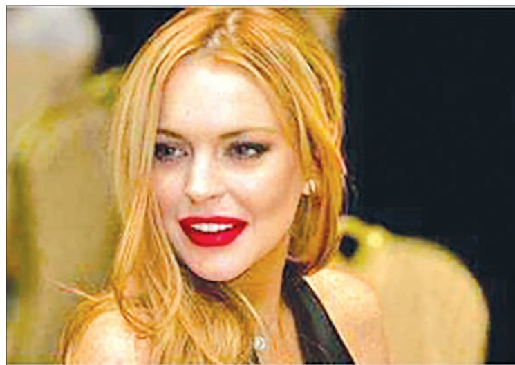
Lindsay Lohan

LOS ANGELES — Actor Lindsay Lohan has apologised for her comments about #MeToo where she had said that women look weak by speaking out about sexual misconduct.