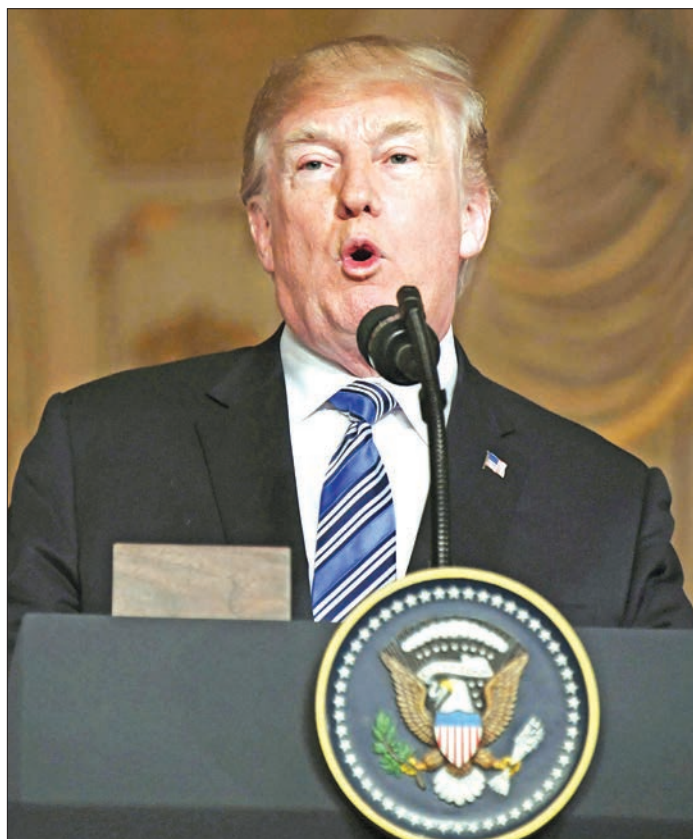
US President Donald Trump in Florida on 18 April, 2018.

The measure will also boost military pay by 2.6 per cent, the largest increase in nine years, the White House said. —Kyodo News ■