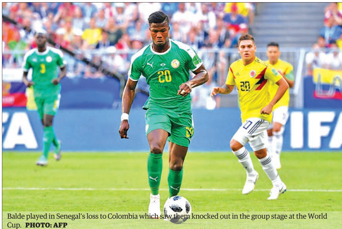
Balde played in Senegal's loss to Colombia which saw them knocked out in the group stage at the World Cup.