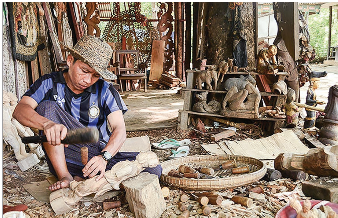
A sculptor manually working on his wooden sculpture.

MYANMAR sculpture market is cool in Bagan area this year and tourists are also asking sculptors to give a recommendation letter when they buy the sculptures, said a sculptor from Bagan area.