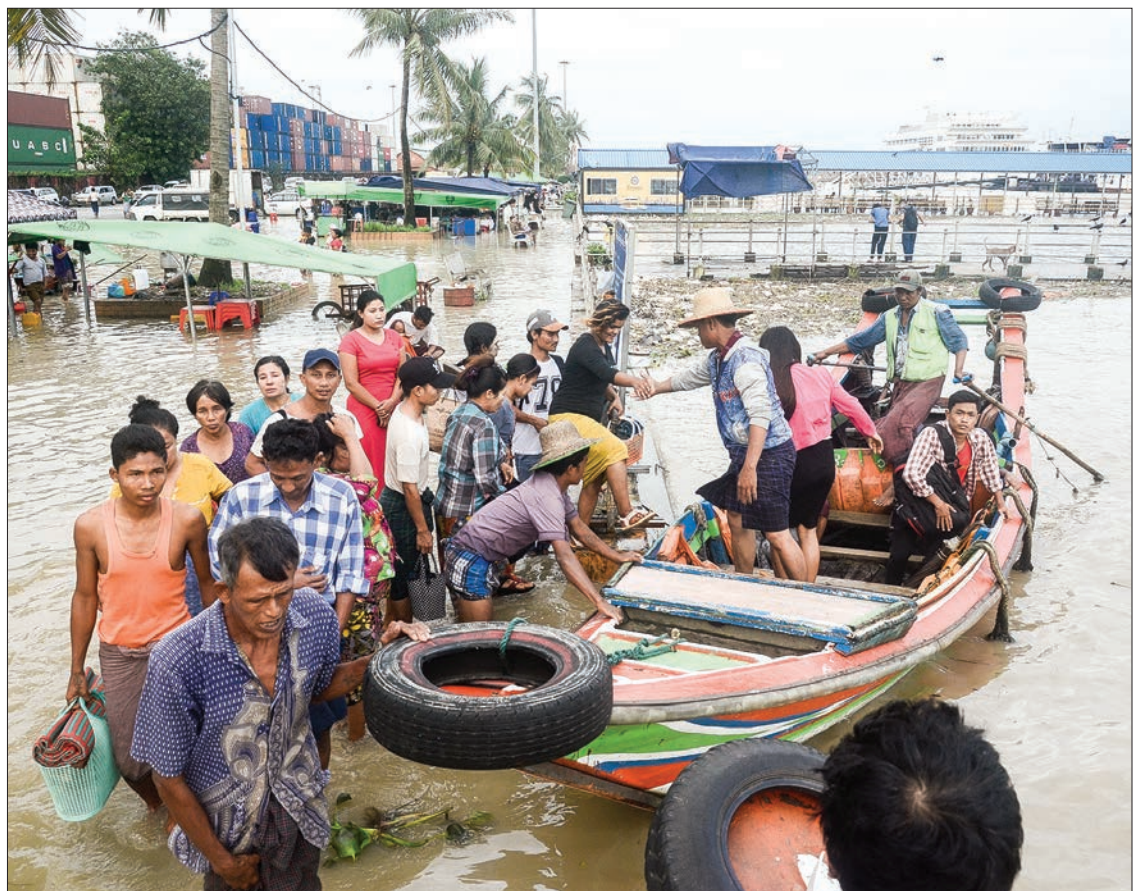
Rising water levels in Botahtaung Jetty raises the ferry over the port's embankment as local residents board to cross the river over to Dala Township.

During the months of monsoon, and during high tide periods water rises to record levels but it usually subsides, it is learnt. —GNLM ■