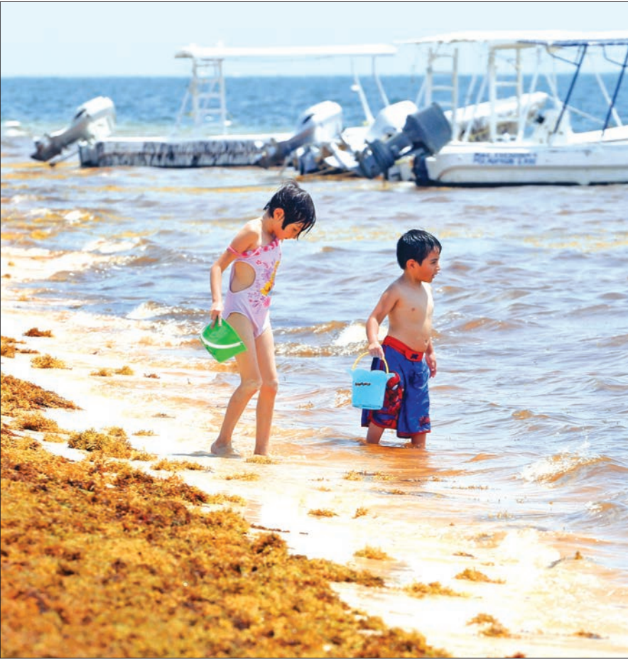
Children are seen next to Sargassum (macroalgae) in Puerto Morelos, Quintana Roo state, Mexico, on 8 August 2018. The Mayan Riviera is suffering a seaweed onslaught this year, which the government is trying to stop with a barrier in the sea. The Sargassum color the water brown and give off a fetid smell.

The Ladda Co., ltd manufacturer incorporated in Thailand has been registered and approved the following pesticide product by the Pesticide Registration Board of Myanmar. It is hereby informed that the product manufacturing company is changed to ICP Ladda Co.,ltd whereby suppling, importing, distribution and sale will be continued.