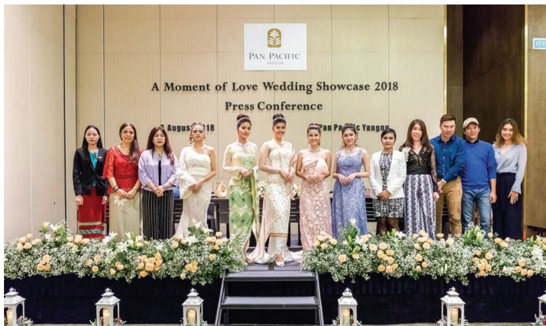
Models and officials pose for a photo at a press conference of A Moment of Love Wedding Showcase 2018.

In addition, couples who confirm their wedding banquets from 1 August this year will enjoy 20 % savings and stand a chance to win prizes including a one-night stay at the hotel's most luxurious Presidential Suite. The 20 % offer on wedding banquets is available throughout this month.—GNLM ■