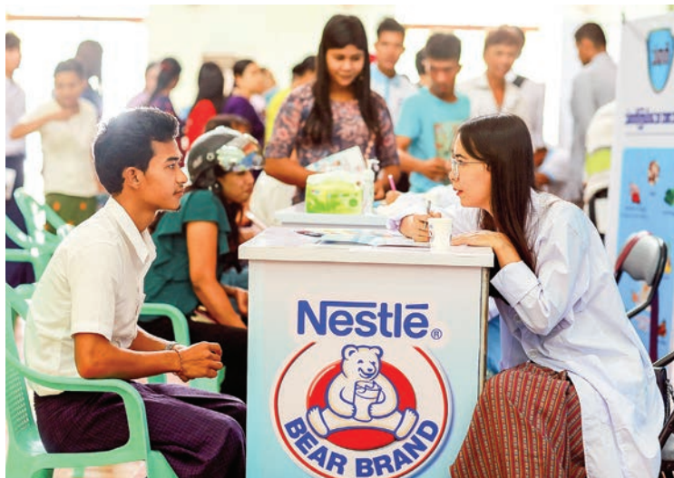
A health officer takes medical record from a customer of the Nestlé.

Iron deficiency is the most prevalent nutritional disorder all over the world, particularly in developing countries. Iron requirements are especially high in infants, young children and pregnant women.—GNLM ■