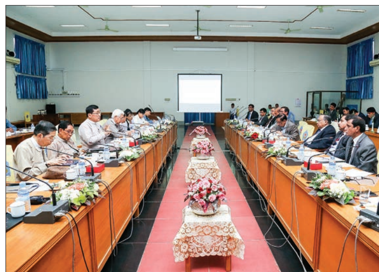
The meeting between Myanmar and Bangladesh focuses on resolving the Rakhine issue amicably.

At the meeting, officials of the UEHRD elaborated on the work of the ten task forces of the UEHRD which is led by the State Counsellor, repatriation readiness in accordance with the bilateral agreement, measures taken for repatriation, rehabilitation and resettlement, in accordance with the existing laws, construction of houses for returnees with assistance from India and Japan, undertakings on the ground by the technical working group for repatriation and rehabilitation in Rakhine State after signing agreement with the UNHCR and UNDP, UEHRD's approaches with the Private Public Partnership for sustainable development and absence of conflicts in the state and implementation of more than 80 points suggested by the advisory