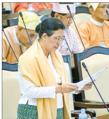
Deputy Minister for Health and Sports Dr. Mya Lay Sein.

U Kyaw Thaung of Sagaing Region constituency 1, on the other hand, asked if hospitals have plans to inform and educate visitors to hospitals, and family member, close relative or friend of a patient who tend to the patient in the hospital to follow the hospital rules. Deputy Minister Dr. Mya Lay Sein replied that hospitals display the hospital rules on notice boards in the hospital. Doctors and nurses occasionally provide demonstration on washing hands and informative talks on prevention against communicable diseases to visitors and those tending to the patient. As visitors and those tending to the patients are worried about their patients, education and information programs for them in person are impractical and thus distribution of pamphlets on prevention against communicable diseases will be made through hospital support group. Health