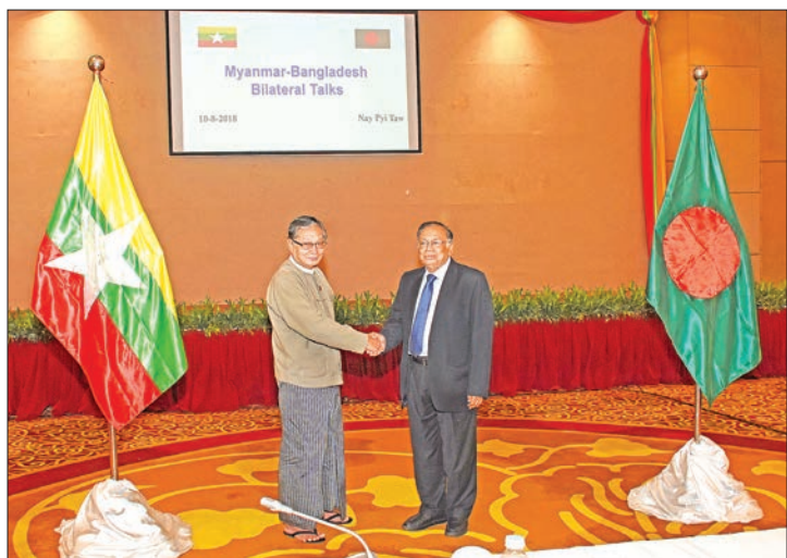
Union Minister U Kyaw Tint Swe shakes hand with Bangladesh Foreign Minister Mr. Abul Hassan Mahmood Ali.

Ministry of the Office of the State Counsellor Nay Pyi Taw 10 August 2018