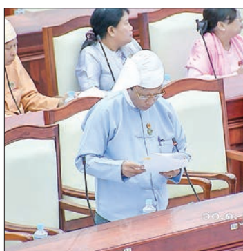
Deputy Minister for Agriculture, Livestock and Irrigation U Hla Kyaw.

In replying to a question posed by U Nay Myo Htet of Kyauktada constituency on plans to implement base load hydro-electric projects and provide electricity to required places in Myanmar, Deputy Minister for Electricity and Energy Dr. Tun Naing said hydro-electricity is not appropriate to produce base load. The Deputy Minister explained further that there are 27 installed hydro-electric plants generating 2,800 MW. Of the 27, 21 are reservoir type, generating