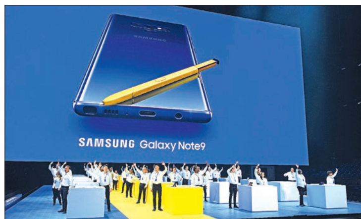
Samsung employees wave as they introduce the new Samsung Galaxy Note 9 smartphone.

NEW YORK—South Korean electronics giant Samsung unveiled the new Galaxy Note 9 smartphone Thursday, its latest effort to address flagging sales of the high-functioning gadgets.