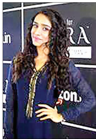
Indian actress Shraddha Kapoor.

The 31-year-old is equally happy to be a part of Prabhas's next film "Saaho", that is being shot simultaneously in Tamil, Telugu and Hindi. She will be doing her own stunts. "It is difficult but I want to do as much as I can do it on my own. If there is a stunt for which I am not qualified enough, I will be happy to use a body double for it. "So one has