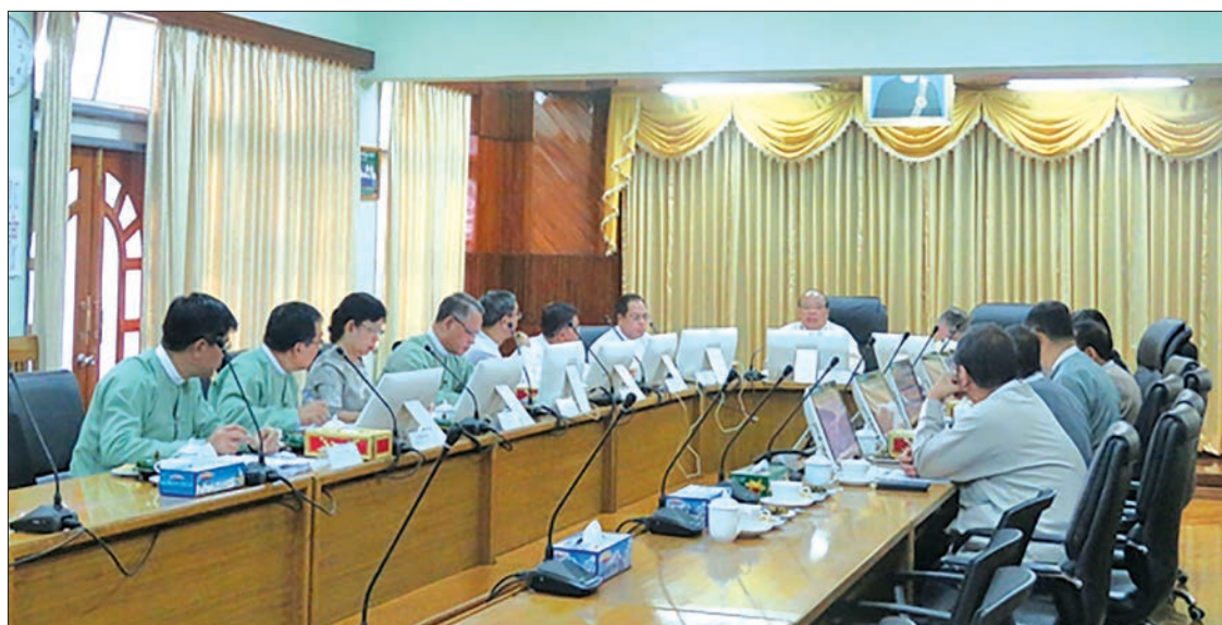
Chairman of Myanmar Investment Commission focuses on activities of MIC-permitted companies during yesterday's meeting.

The MIC meeting (12 / 2018) decided to issue 5 investment permits and 3 endorsements in relation to the investment proposals. — Myanmar News Agency ■