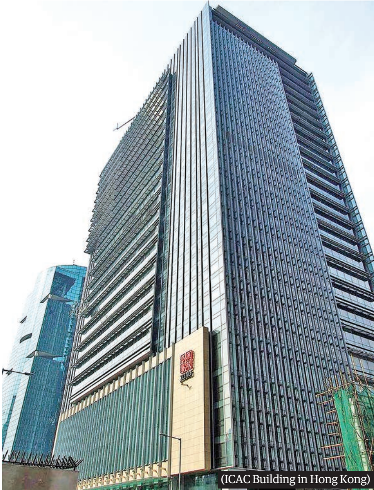
(ICAC Building in Hong Kong)