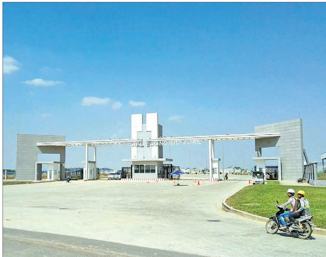
Thilawa Special Economic Zone attracts foreign investors.