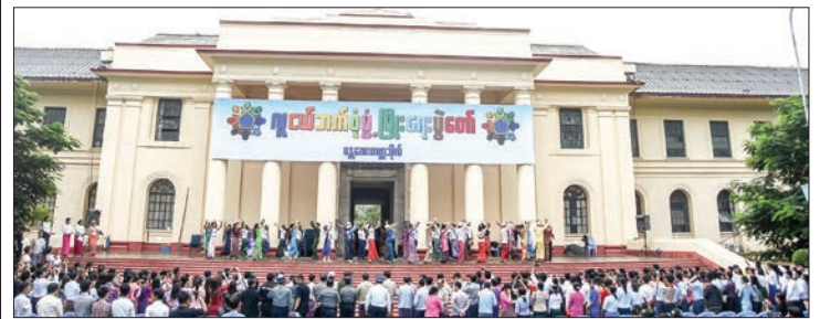
Students participate in the full-dress rehearsal of the All-Round Development Festival at Mandalay University yesterday.

The All-Round Youth Development Festival (Mandalay) is being held with the aim of promoting the development of the five strengths of youths – physical, knowledge, character, friendship and wealth – to support their vision and ideas in building up the future of Myanmar's society.—Tin Maung (Mandalay Sub-Printing House) ■