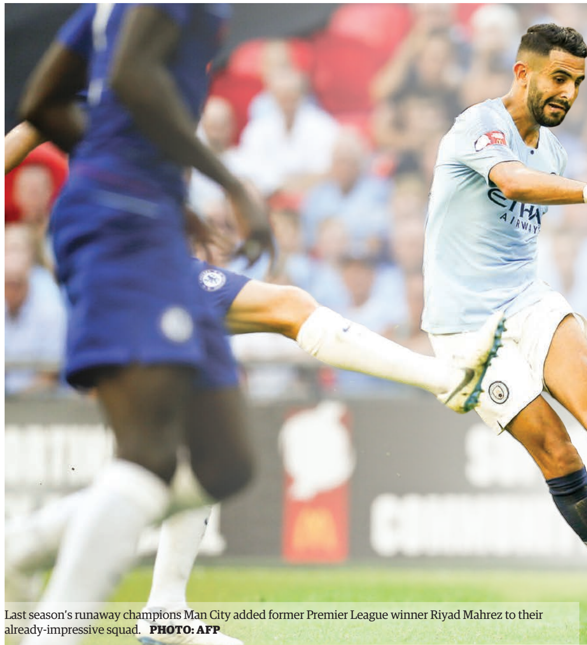
Last season's runaway champions Man City added former Premier League winner Riyad Mahrez to their already-impressive squad.

LONDON—With the Premier League's transfer window closing on Thursday, the top title contenders have completed their squad building until January.