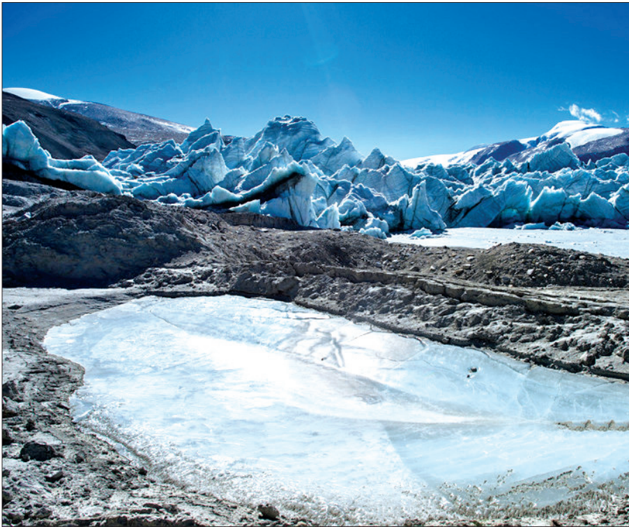
Glaciers are a vital source of freshwater.