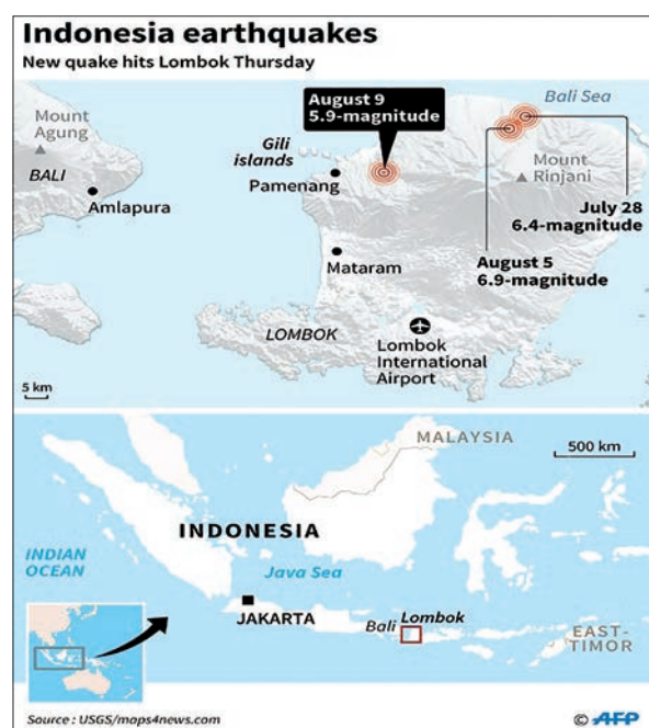
Indonesia earthquake.

The announcement of sanctions caused Russian stock markets to drop dramatically on opening and the ruble reached its lowest point since November 2016. The markets and the currency rebounded slightly over the day while remaining sharply down.—AFP ■