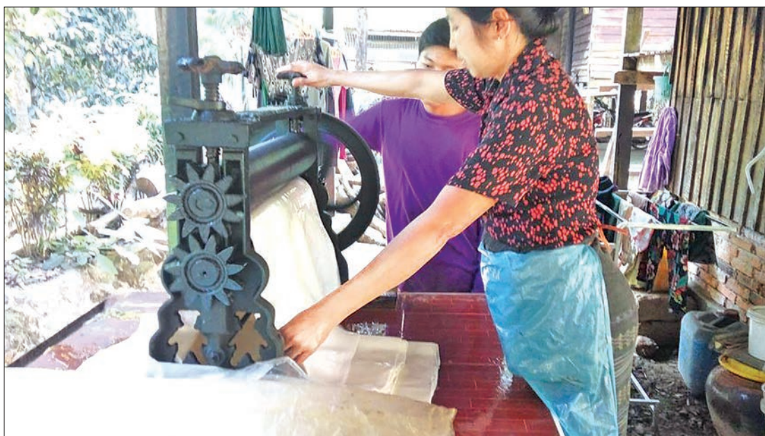
Workers turning out sheets of raw rubber to dry in the sun.