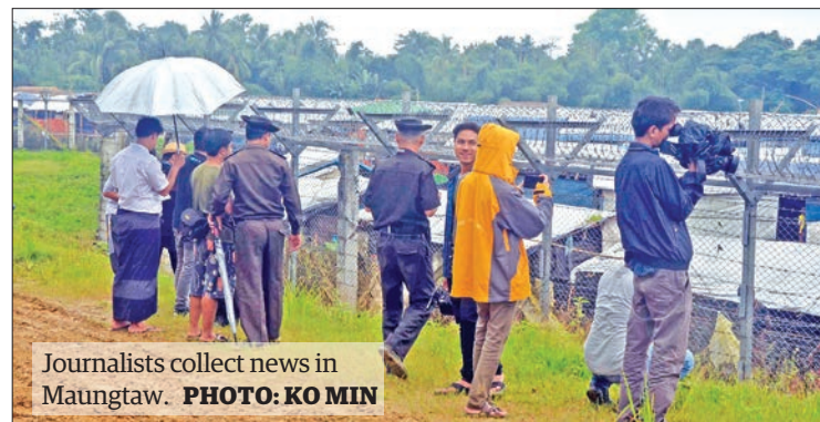
Journalists collect news in Maungtaw.

In the afternoon, the media group arrived in Sittway and then departed for Yangon by flight. ■