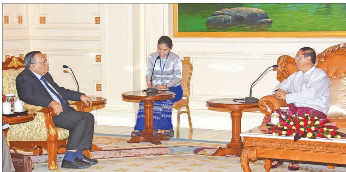
Vice President U Myint Swe receiving Bangladesh Foreign Minister Mr. Abul Hassan Mahmood Ali.

Present at the meeting were U Kyaw Tint Swe, Union Minister for the State Counsellor's Office, U Thein Swe, Union Minister for Labour, Immigration and Population, Dr. Win Myat Aye, Union Minister for Social Welfare, Relief and Resettlement, U Myint