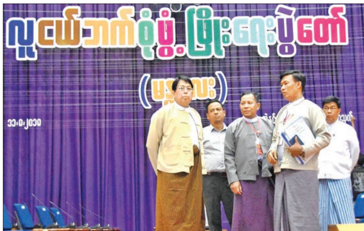
Union Minister Dr. Pe Myint seen inspecting preparations for All-Round Youth Development Festival at the Mandalay University yesterday.

The literature talk will be broadcast live at 9 am today by MRTV, MNTV, Sky Net Up to Date, Sky Net's ethnic channel, Myanmar Radio, MOI Webportal Myanmar Facebook, MRTV Facebook, Myanmar Digital News Facebook, President Office Facebook, Myanmar State