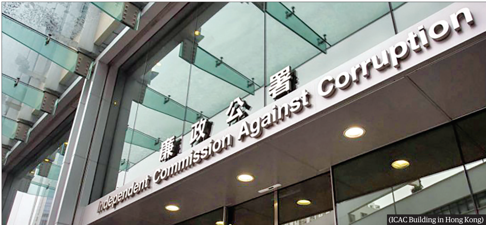
(ICAC Building in Hong Kong)