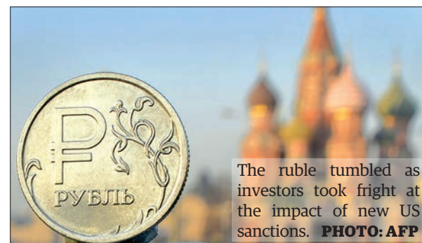
The ruble tumbled as investors took fright at the impact of new US sanctions.

"I'm still in pain from giving birth," she told AFP. "I need diapers, I need milk." —AFP ■