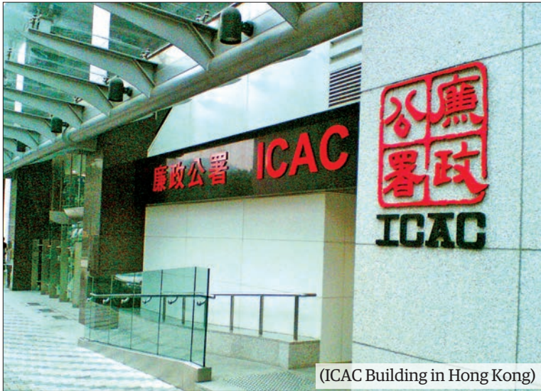
(ICAC Building in Hong Kong)