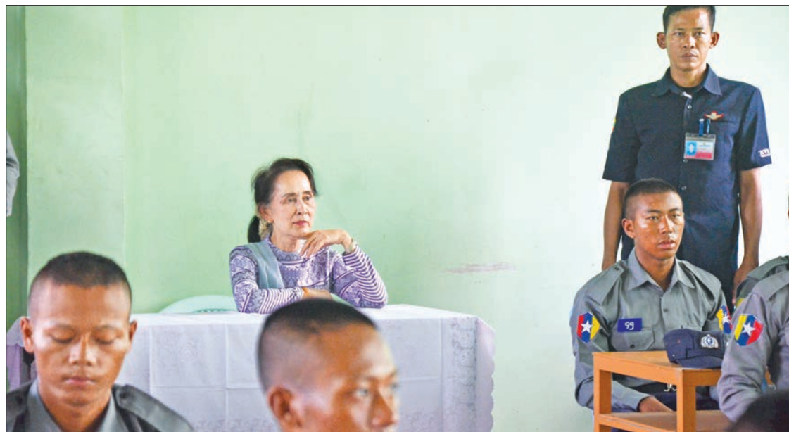
State Counsellor Daw Aung San Suu Kyi attending a lecture together with trainees at the No. (3) Police Training School in Sagaing.