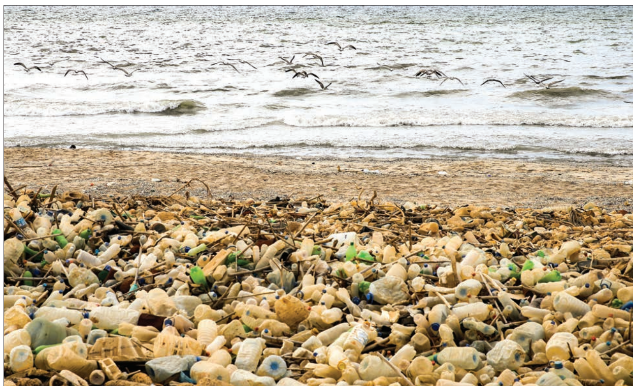
Piles of plastic waste are pictured on the seaside in the coastal town of Khalde, south of the Lebanese capital Beirut, on 22 September 2016.

Researchers have not yet calculated the level of harmful greenhouse gases emitted by plastics in the environment.