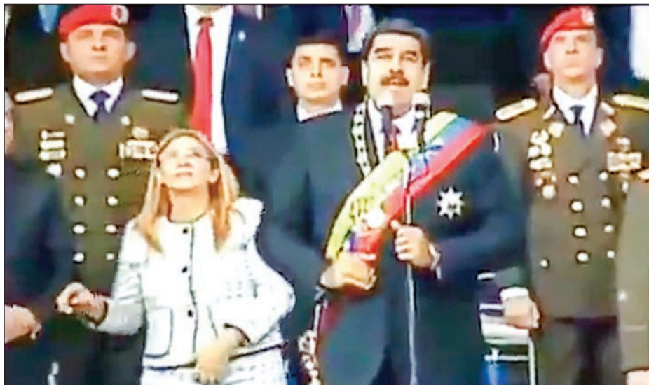
Screengrab released by Venezuelan Television (VTV) showing Venezuelan President Nicolas Maduro who was unharmed after an exploding drone “attack”.

Venezuelan state television images showed Maduro looking up disconcertedly in the middle of a speech Saturday when a bang was heard, then uniformed members