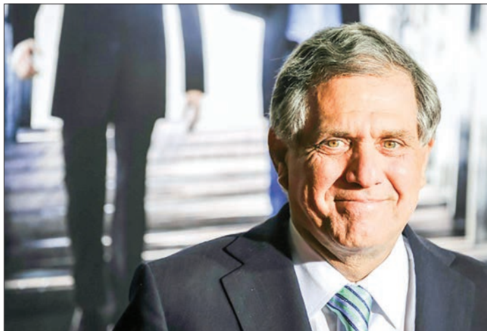
CBS CEO Leslie Moonves, seen here in a file picture from 2010, has been accused of sexual misconduct but remains on the job pending an investigation.