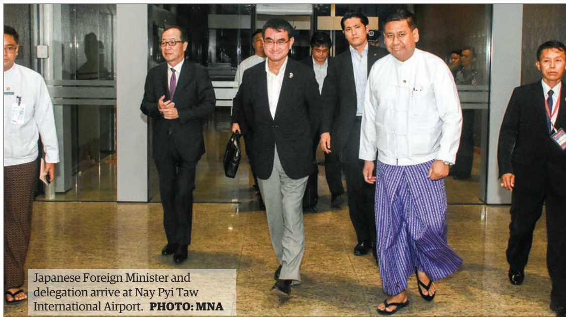
Japanese Foreign Minister and delegation arrive at Nay Pyi Taw International Airport.

tion were welcomed by Permanent Secretary of the Ministry of Foreign Affairs U Myint Thu and Ambassador of Japan to Myanmar Mr. Ichiro Maruyama and officials.—MNA ■