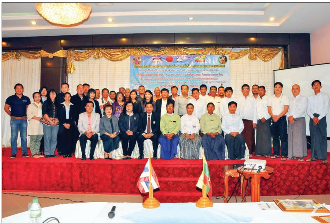
Myanmar and Thai businessmen pose for a photo after discussing promotion of bilateral tourism at Grand Jade Hotel in Myeik, Taninthayi Region yesterday.

About 60 businessmen from Prachuap Khiri Khan and 40 entrepreneurs and officials from Myeik district were present at the meeting. Tourism operators from Prachuap Khiri Khan introduced a tour trip from Prachuap to Hua Hin. Out of 30 tour companies operating in Myeik District, 22 are listed as members of My-