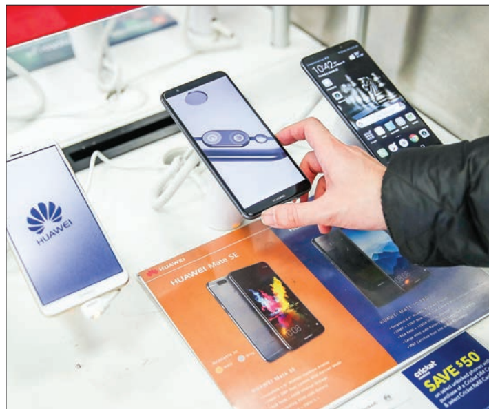
Some applications gain the users' private information by accessing irrelevant services.

Some 89.9 per cent of applications request access to use the camera, and 86.2 per cent request access to the micro-