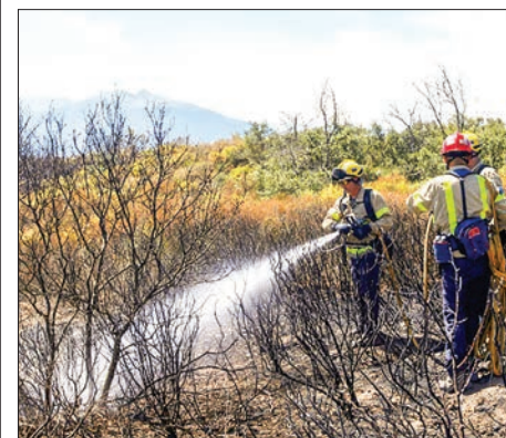
Catalonian firefighters, pictured in August 2016, worked with French firefighters to control a blaze on the border between the two countries.

The fire comes as France experiences the summer’s busiest day on the roads, as July holiday-makers return home and those who vacation in August depart. —AFP ■