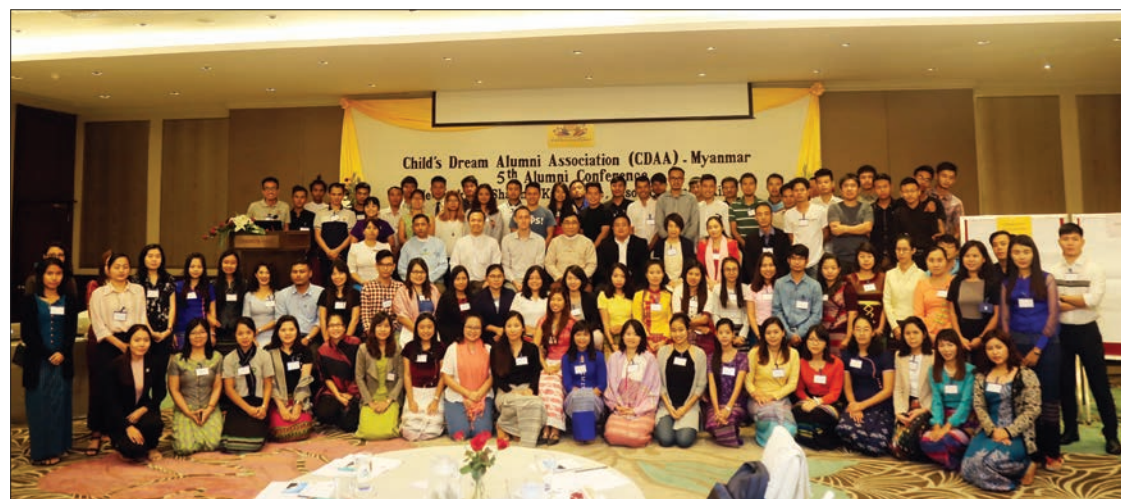
Participants pose for a documentary at the fifth Child's Dream Alumni Association (CDAA) Myanmar Conference.

The Union Minister said there are sixteen sectors to youth development to fulfill the five strengths of youths – physical, knowledge, character, friendship and wealth, and added that