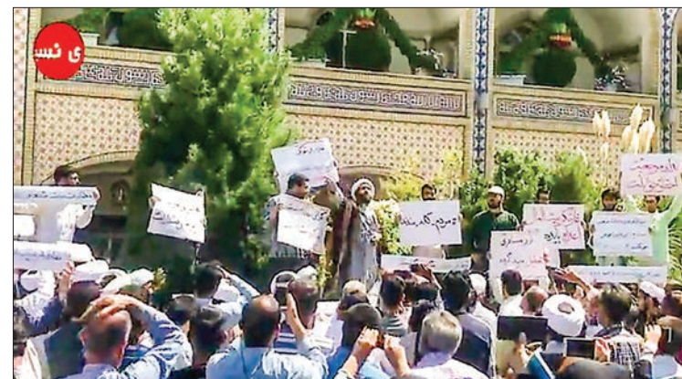
A cleric speaks to protesters in the holy city of Mashhad on August 3, 2018, from a video by Nasim News Agency.

In a Wednesday Twitter post, he called on US President Donald Trump to release a list of “relatives of Iranian government officials that have green cards and bank accounts in the United States”, if such a record exists.—AFP ■