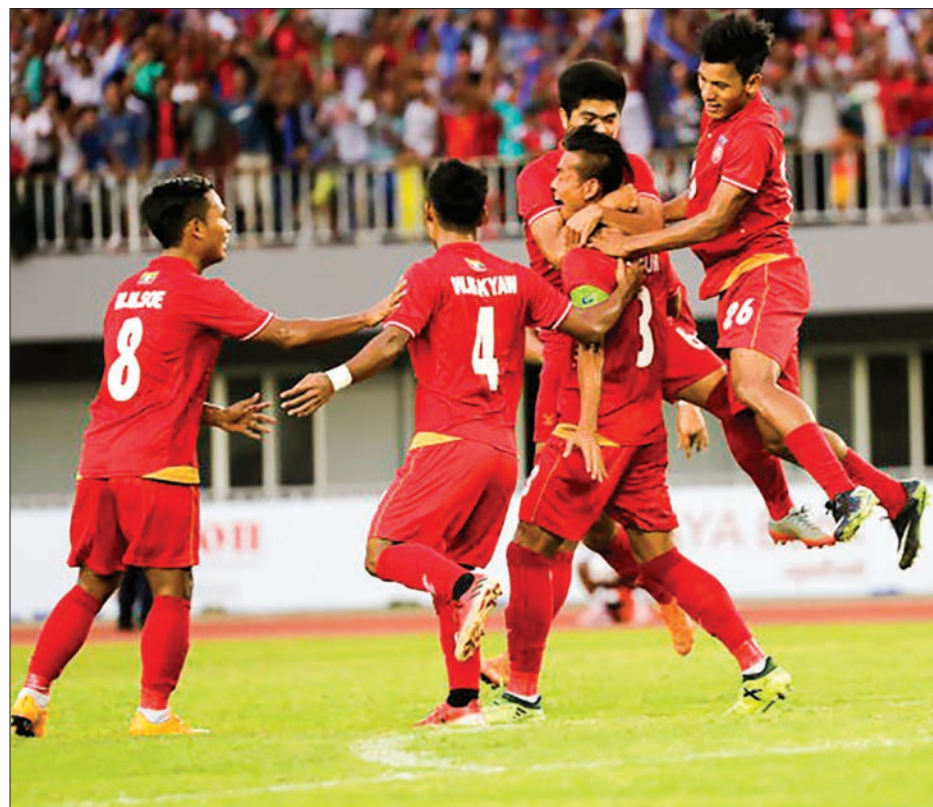
Myanmar team celebrates their victory after beating Thailand at Mandalay Thiri Stadium in Mandalay yesterday.

Thailand scored their consolation goal just before the first half ended by a long-ball kick bypassing Myanmar's goalkeeper. Both teams changed tactics in the second half, with Thailand speeding up play and creating chances for their team, but Myanmar's defense was too strong and no more goals were scored.—Lynn Thit(Tgi) ■