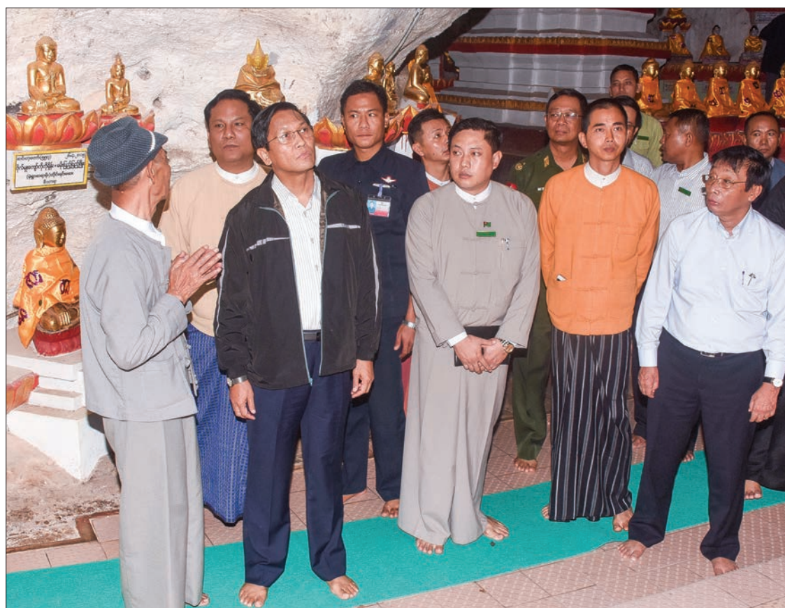
Vice President U Henry Van Thio observes the Shwe Oo Min Cave in Pindaya yesterday.

need to exert efforts for greater success of the camp that has become popular within a short period after its inauguration and for turning the facility into an all-season destination.