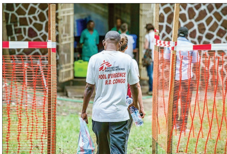
Doctors Without Borders team members (pictured May 2018) walk through an Ebola security zone at the entrance of a hospital in DR Congo, where a fresh outbreak of the virus was declared on August 2018, in the east of the country.

As with the earlier outbreak, "vaccinations will be an integral part of the response," the health ministry said Saturday.