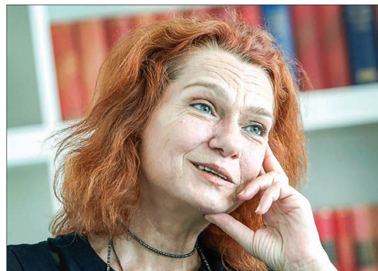
Turkish novelist Asli Erdogan is living in exile in Germany as she risks a life sentence on terror charges at home.