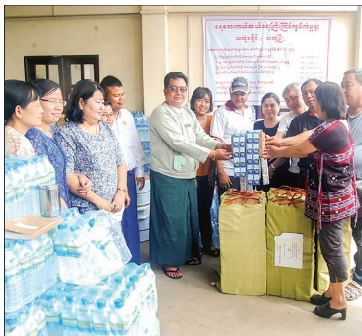
An official receives water purification tablets boxes for flood victims in Thaton.

Due to continuous heavy rains, a total of about a thousand lakes and wells, 2,000 toilets in the Thaton Township area were affected by flash floods. As a result, local people are in dire need of purified drinking water. Hluttaw representatives, officials and township elders are providing purified drinking water, but there is still much to be fulfilled. —Thet Oo (Thaton) ■