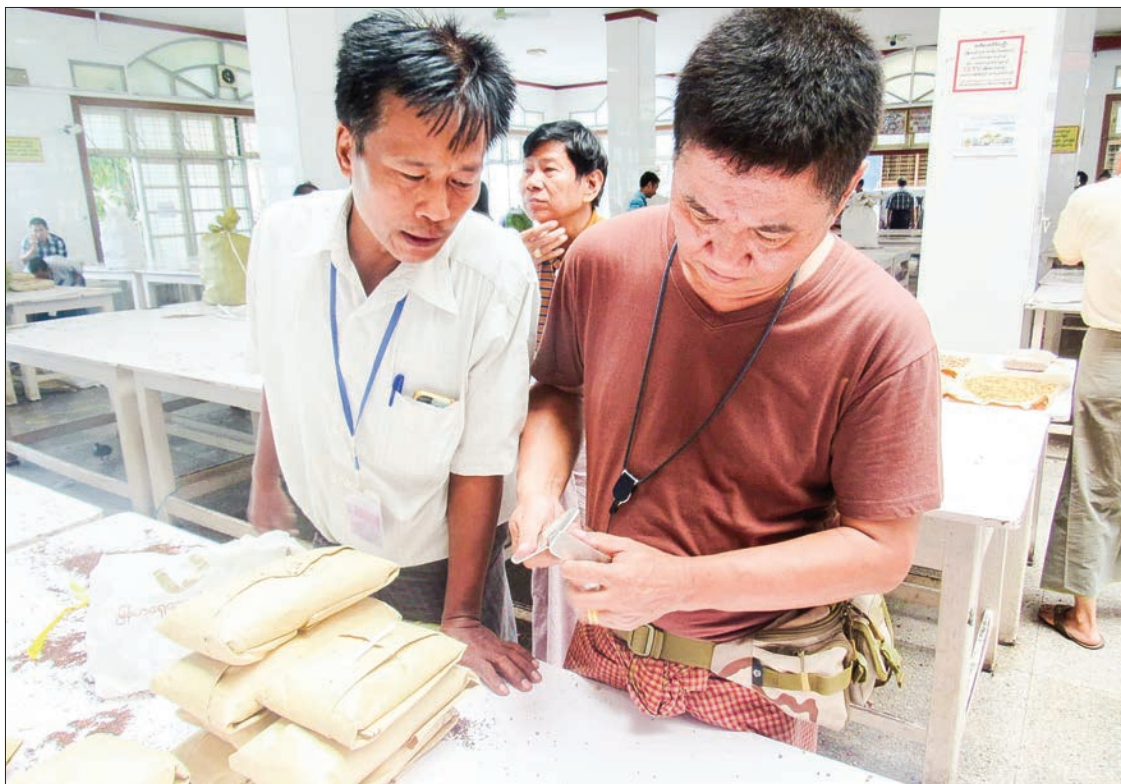
Merchants testing the quality of sesame put up for sale.

At present, the imported toolset to measure acid level in sesame seeds is worth around Ks100,000 per packet, and each tool is valued at Ks800 in the market. The device is able to show the composition of acid in the crop in five colours. — Min Htet Aung (Mandalay Sub-printing House) ■