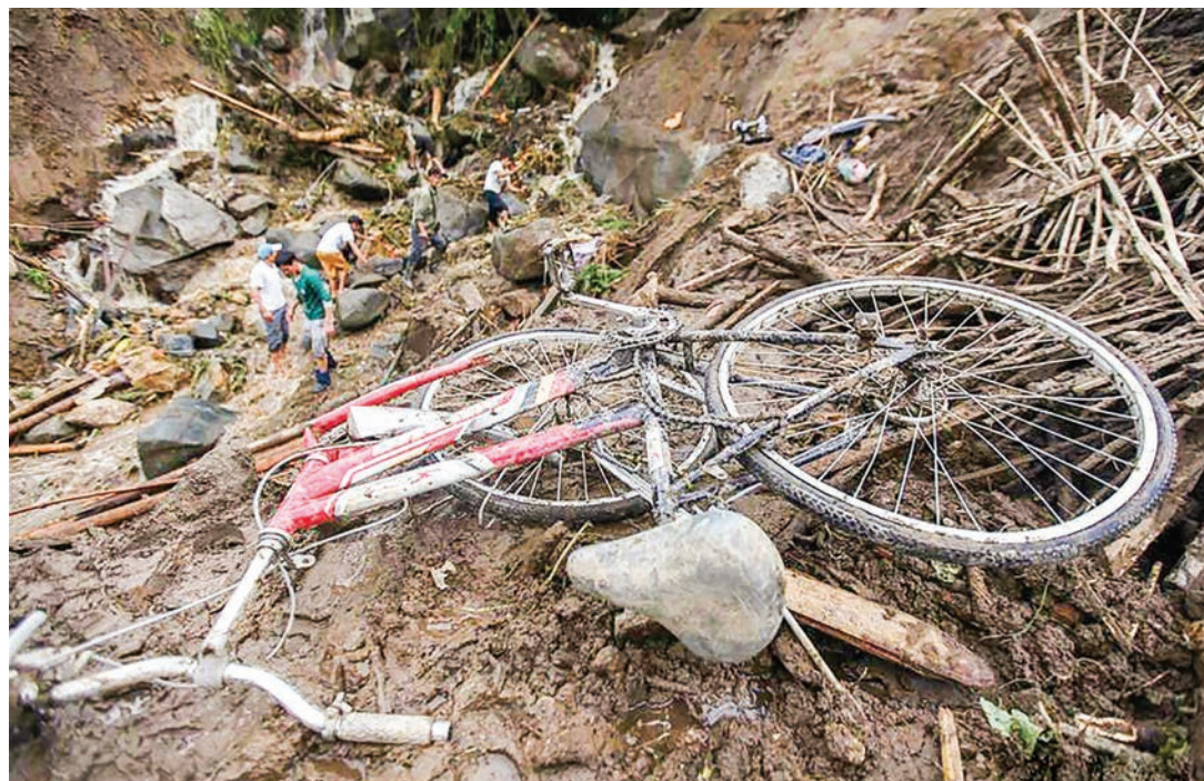
Photo taken on 4 August 2018 shows a bicycle at the site of landslide in Lai Chau province, Viet Nam. Landslides caused by heavy rain on Friday in Vietnam's northern Lai Chau province killed six people, left six others missing, according to Viet Nam News Agency (VNA). The landslides also injured three people.