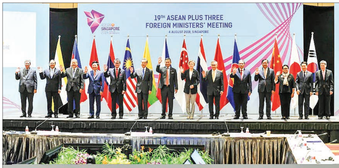
Union Minister U Kyaw Tin and other Ministers seen at the 19 th ASEAN Plus Three Foreign Ministers' Meeting.

On 3 August, the Union Minister attended ASEAN Post Ministerial Conferences (PMC) with India, Canada, Republic of Korea, European Union, Australia and the United States. At