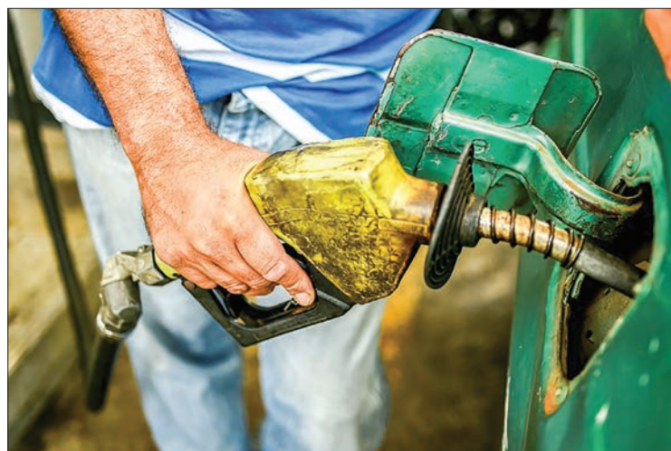
A liter of 91-octane gasoline in Venezuela costs one bolivar — but an egg in the hyperinflation ravaged economy costs 200,000 bolivars, and one US dollar trades on the black market at 3.5 million bolivars.

A dollar on the country's black market is currently trading at 3.5 million bolivars.