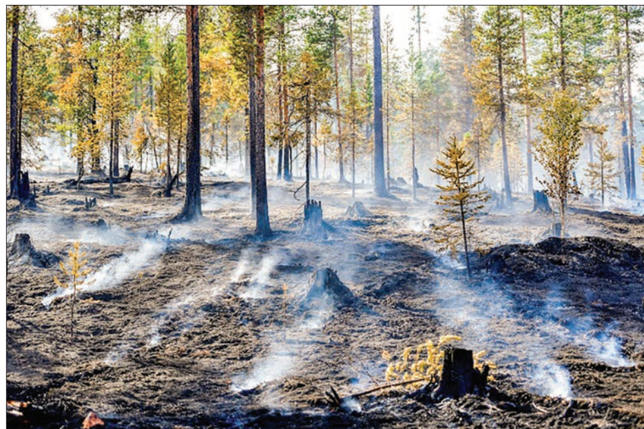
The hottest July in more than 250 years in Sweden saw wildfires as far north as the Arctic Circle.

MADRID—Three men have died from heatstroke in Spain as Europe sweltered in a record heatwave Friday, with temperatures hitting a scorching 45 degrees Celsius (113 Fahrenheit) in some areas and meteorologists saying only scant relief is in sight in the coming days.