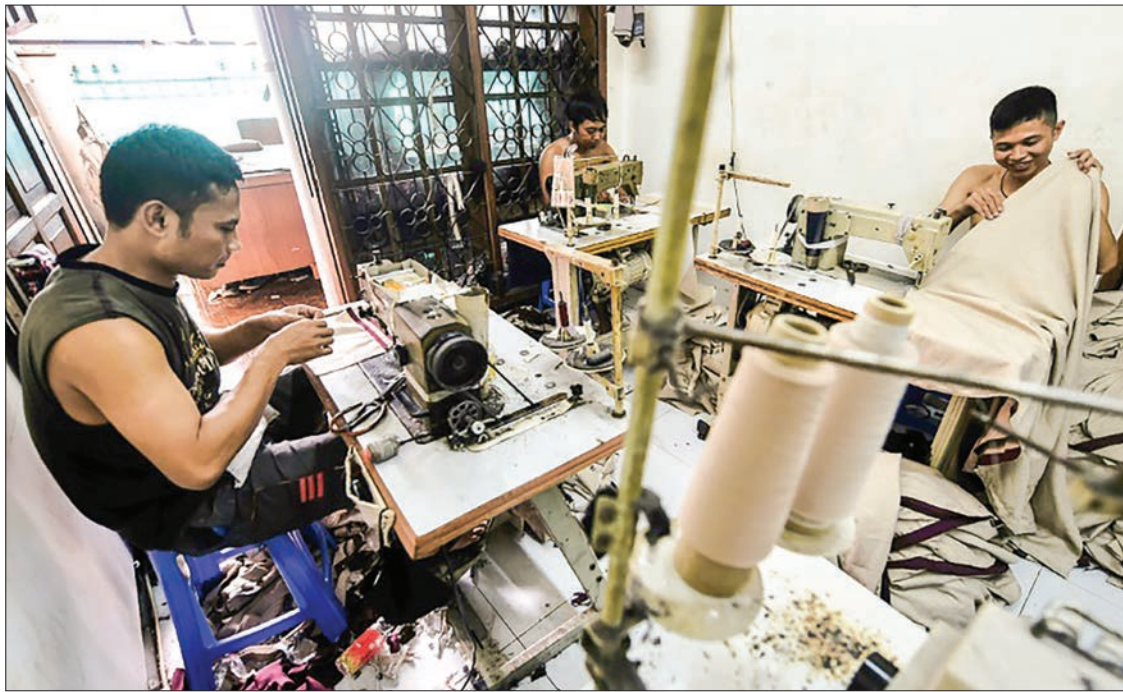
There are fears that a simmering trade spat between the world's top two economies could spiral into a full-blown trade war -- with painful consequences for China's neighbour.

SINGAPORE/BEIJING—Asian countries have voiced concern about the potentially devastating impact of a US-China trade war, with ministers calling for the acceleration of talks for a gigantic Beijing-backed free-trade deal that excludes the United States.