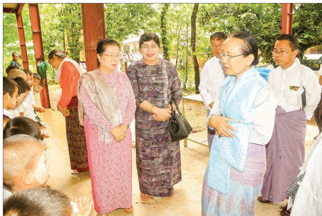
Members the Orphans Reduction and Protection Association (Myanmar) meeting with orphans in Pathein.

Afterwards, they visited the Saytawun Youth Development