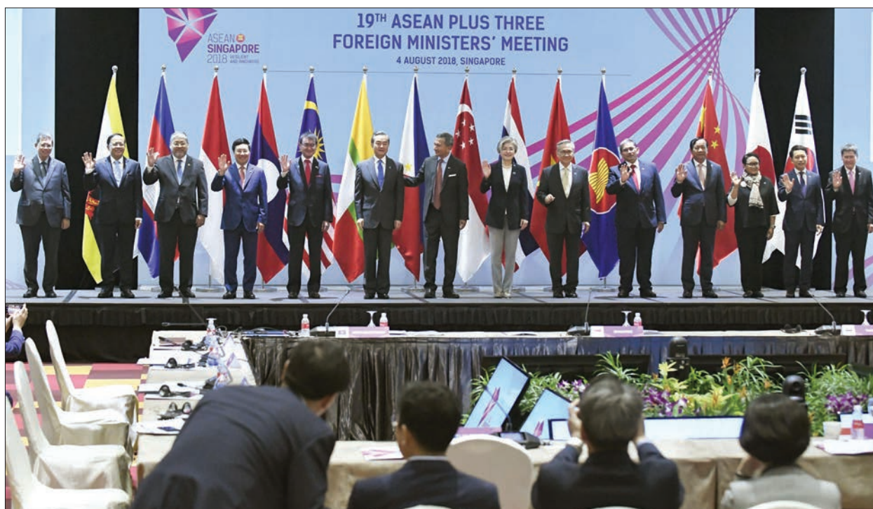
Foreign ministers attending an ASEAN-plus-three meeting pose for photos in Singapore on 4 August, 2018.

pating countries are seeking a broad agreement on their free trade talks by the end of the year.