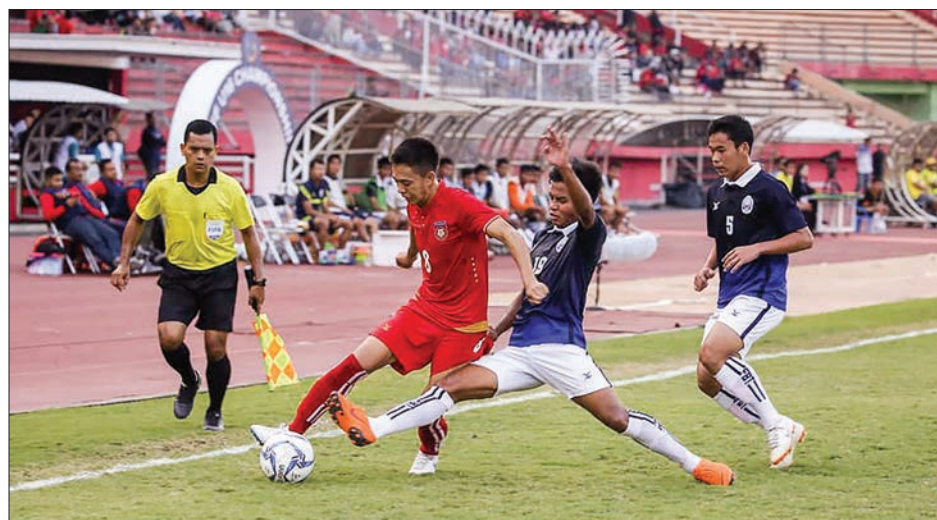
Cambodia (blue) vies for the ball with Myanmar (red) in Group A play of AFF U-16 Championship 2018 in Surabaya, Indonesia.

Both teams played well by putting their utmost efforts and showing their