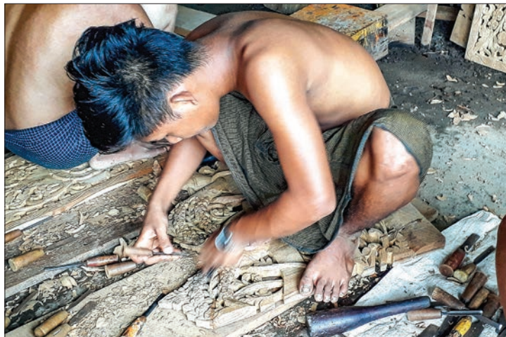
Sculptors carving wood at their work place.

"We need six tons of teak for making ten 6-feet of ceilings. But we are facing difficulties because we have only one ton of teak in each house. If we exceed more than one tons, the forestry department will seize us. The forestry department seized teak from two