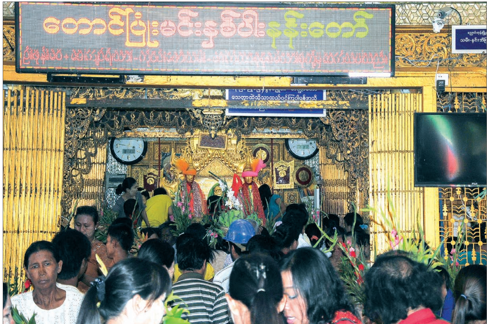
The Taungbyone Nat shrine is crowded with people during the festival.

Myanmar Kings tried to eliminate Nat worship but they failed because firstly Theravada Buddhism neither supported nor