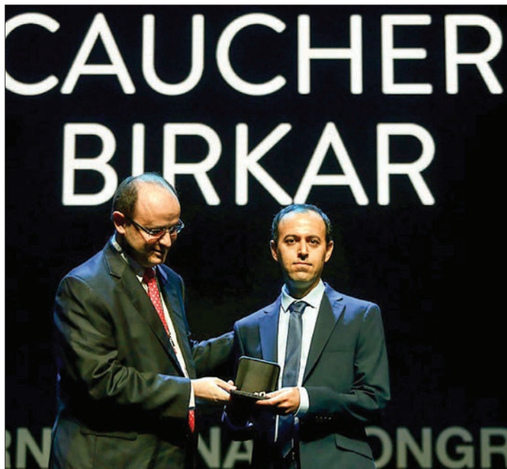
Kurdish mathematician Caucher Birkar will get a replacement for his stolen Fields Medal.

RIO DE JANEIRO, BRAZIL—A Kurdish refugee whose top mathematics prize was stolen minutes after he received