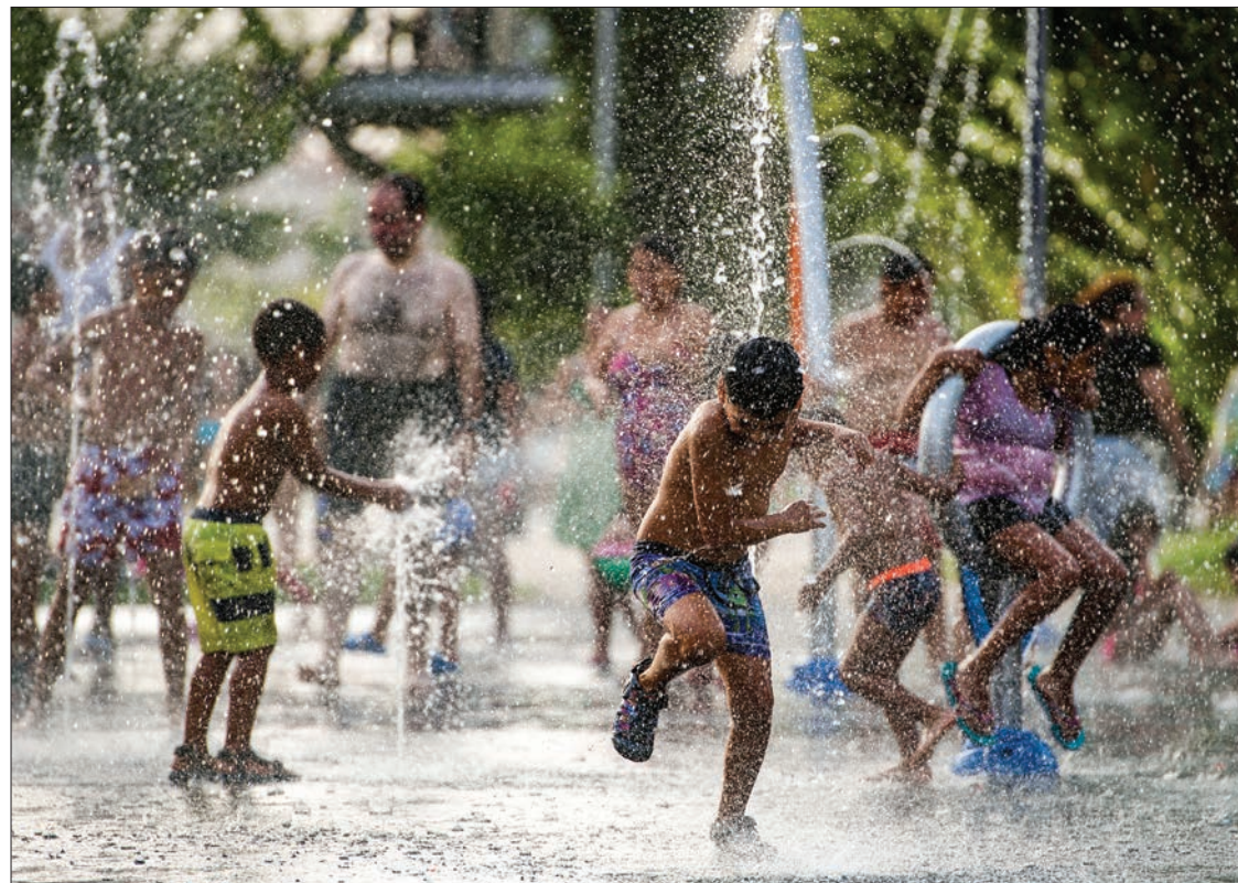
Children cool off in a fountain at Madrid Rio park, located on a bank of Manzanares river in Madrid on 3 August, 2018. Three men have died from heatstroke in Spain as Europe sweltered in a record heatwave today, with temperatures hitting a scorching 45 degrees Celsius (113 Fahrenheit) in some areas and meteorologists saying only scant relief is in sight in the coming days.

On 1 August, 2003 the village of Amareleja, in southern Portugal, the temperature reaches 47.3 degrees Celsius, a record for the country. Europe is sweltering through a major heatwave which causes an estimated 70,000 deaths from June