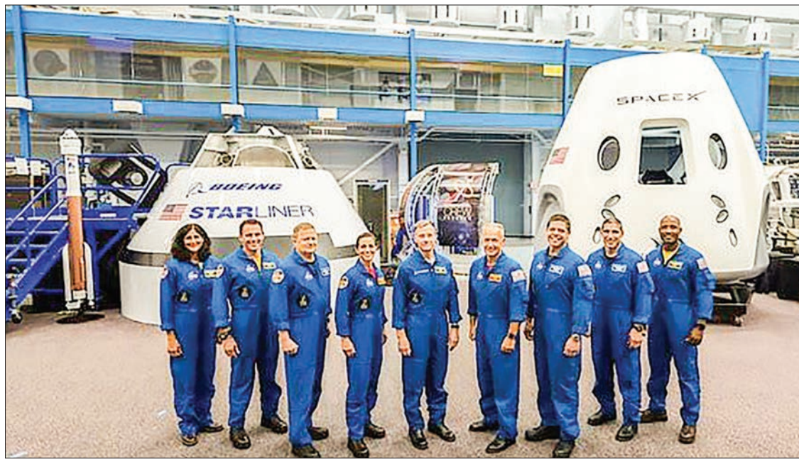
The first US astronauts who will fly on American-made, commercial spacecraft to and from the International Space Station.

NASA astronaut Suni Williams is seen during a NASA event where it was announced that she, and NASA astronaut Josh Cassada are assigned to the first mission to the International Space Station onboard Boeing's CST-100 Starliner, on 3 Friday, August, 2018 at NASA's Johnson Space Centre in Houston, Texas. Astronauts assigned to crew the first flight tests and missions of the Boeing CST-100 Starliner and SpaceX Crew Dragon were announced during the event.