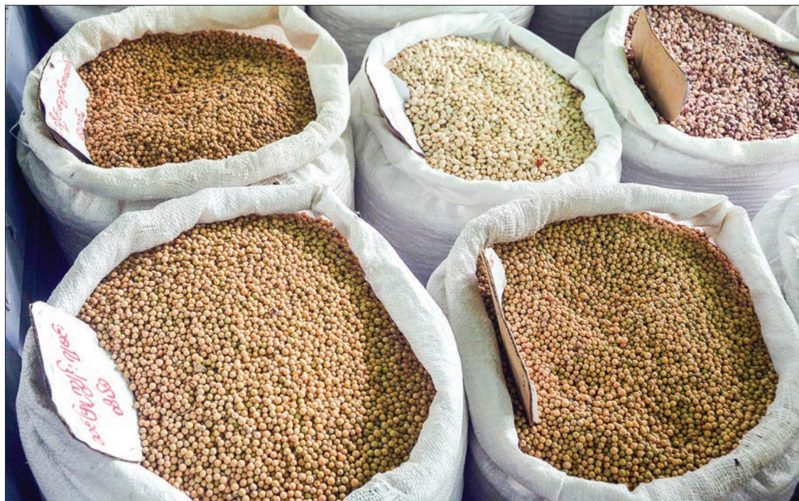
Myanmar pulses are kept on display for sale in a shop at a market.

The current price of a ton of pigeon peas is Ks60,000 more than that of the same volume of mung beans.—Maung Say Aung ■