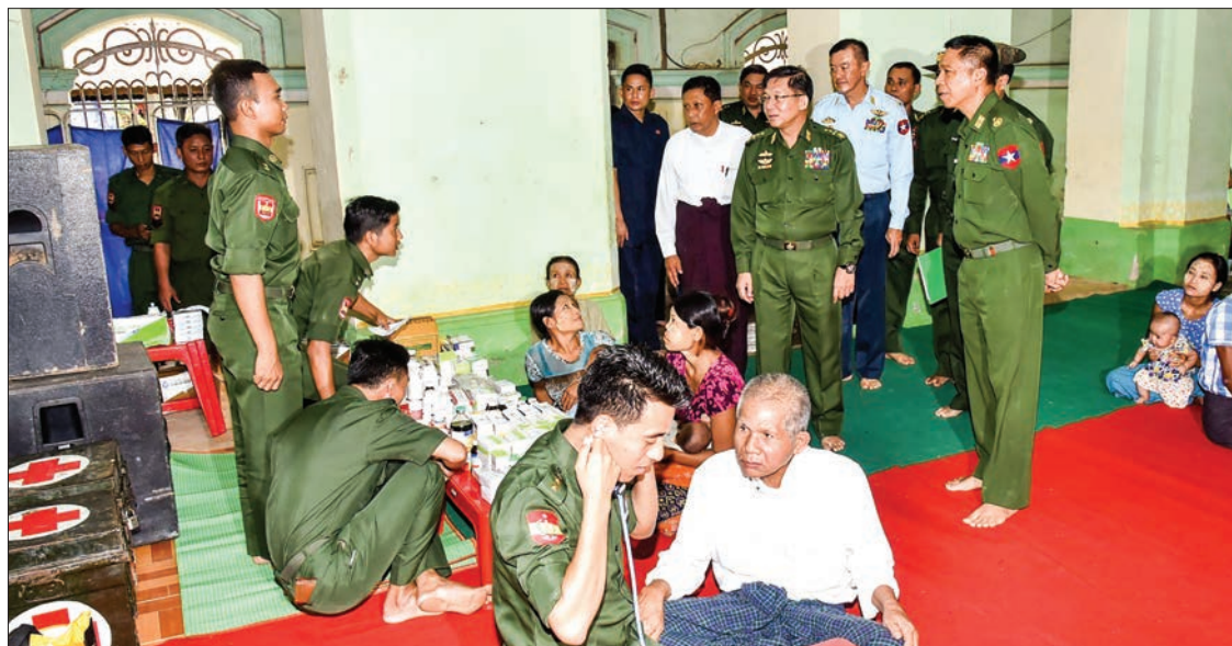
Senior General Min Aung Hlaing inspects mobile military medical team providing health care to flood victims in Shwekyin Township, Bago Region, yesterday.

Temporary flood relief centres have been set up in five locations in Shwekyin Township and in the forty-two villages. Reports also show that 25,500 acres out of the 34,867 acres of farmland for monsoon crops have been damaged due to the floods. —Myanmar News Agency ■