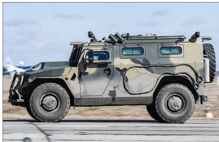
The upgraded vehicle's mine resistance will grow more than three-fold.

According to open sources, Tigr armoured vehicles are used by Special Forces and military police in the fight against terrorists in Syria. In such armed conflicts, a serious threat is posed by terrorists' ambushes with the use of snipers and improvised explosives planted along the routes of military convoys. — Tass ■