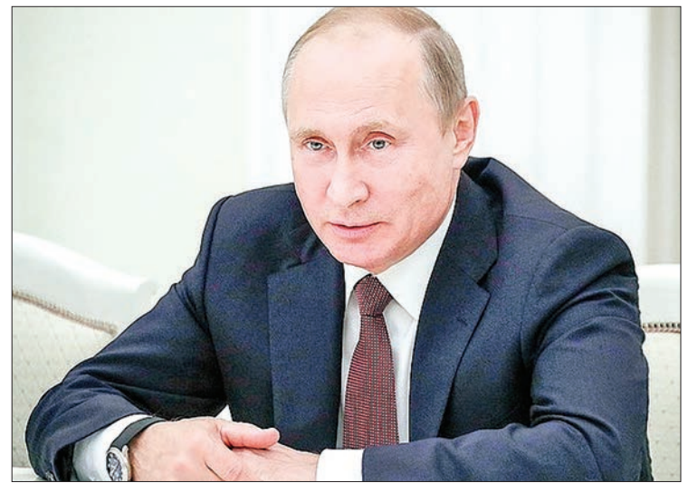
The law also removes the requirement to specify particular loans in the amount no less than 85% of the total amount of external borrowings.