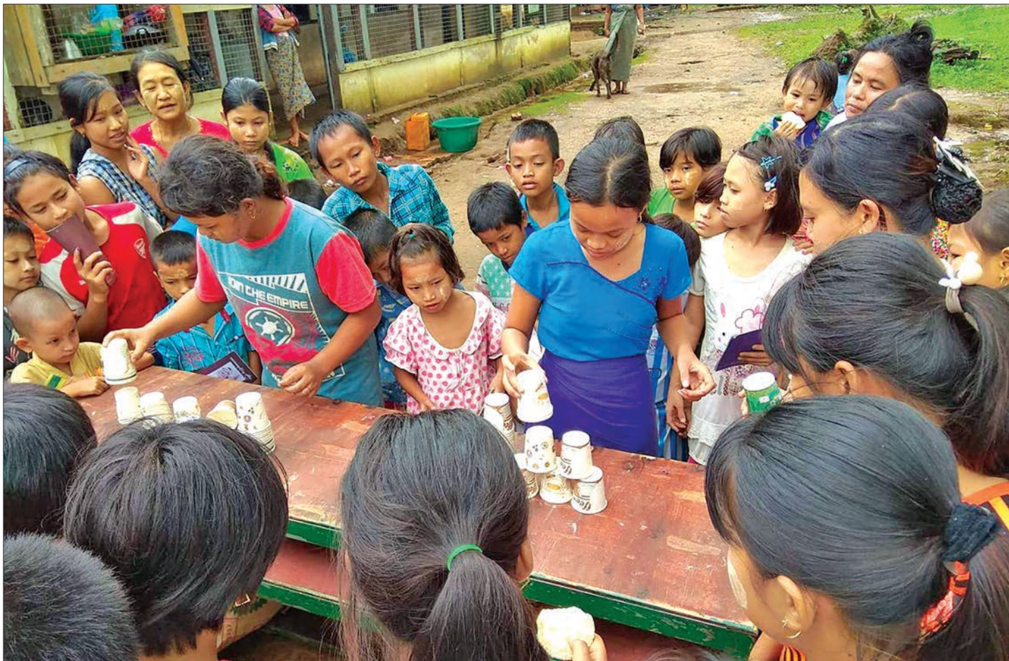
Children take part in playing games at a temporary shelter in Thaton yesterday.