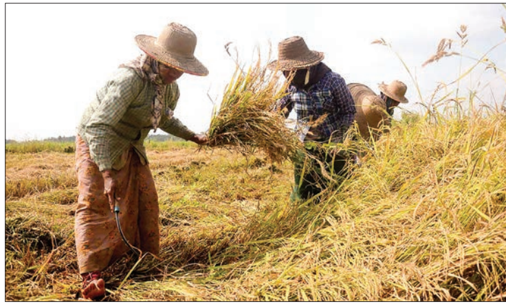
Farmers harvest rice in Ayeyawady Delta.

The country received investments from China (Taipei), the Netherlands and the US, representing 0.5 per cent of the