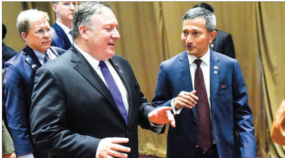
US Secretary of State Mike Pompeo attends the 51st Association of Southeast Asian Nations (ASEAN) - US Ministerial Meeting in Singapore on 3 August, 2018. Leaders, ministers and representatives are meeting in the city-state from 1 to 4 August for the ASEAN Ministerial Meeting (AMM).

Pompeo has met with the foreign ministers of China and South Korea in Singapore, as well as with his Southeast Asian counterparts.