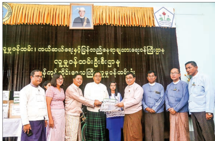
Union Minister Dr. Win Myat Aye accepts the donations from organizations, foundations, and thirty-one families.