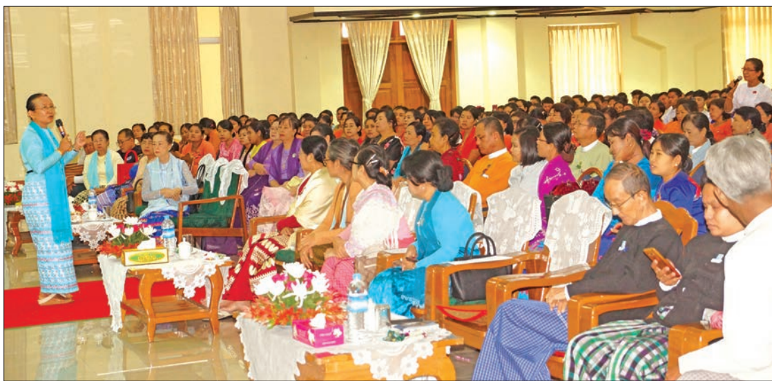
Orphans Reduction and Protection Association's (Myanmar) members held a meeting at Patheingyi University in Patheingyi, Ayeyawady Region yesterday.

Afterwards, commemorative music for the association was played and a book on the associ-