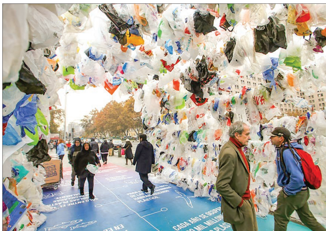
Plastic bags will soon become a thing of the past in Chile following Friday’s historic announcement.

The law was passed on June 1 but appealed by the Associa-