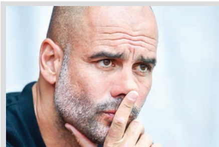
Manchester City manager Pep Guardiola is plotting a Premier League title defence.