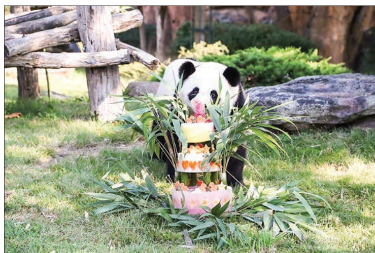
The giant panda baby “Yuan Meng” approaches his birthday cake during his birthday celebration ceremony at the ZooParc de Beauval in Saint-Aignan, France on 4 August 2018.

ferred to play with his mother before tasting the cake while visitors used their phones to record every move of the ceremony’s star.