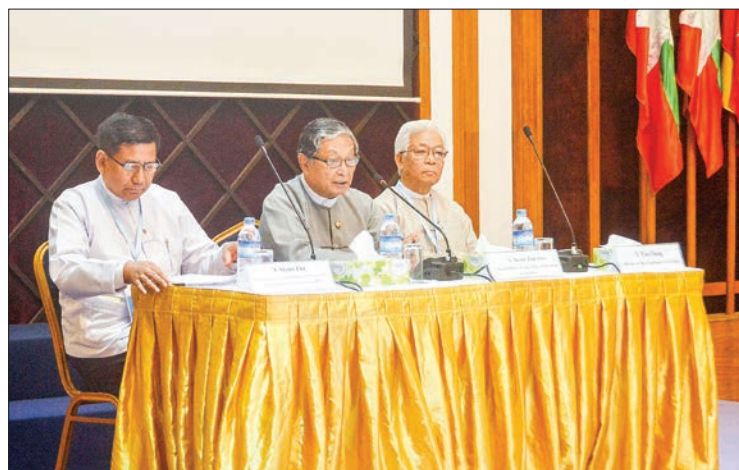
Union Minister for the Office of the State Counsellor U Kyaw Tint Swe (Centre) briefs on repatriation of displaced persons from Rakhine State.

In his briefing, the Union Minister reiterated that Myanmar government is making both bilateral efforts with Bangladesh and cooperation with the UNDP and UNHCR. He stated that Myanmar and UN had successful experience of cooperation in the area of voluntary, safe and dignified return of displaced persons