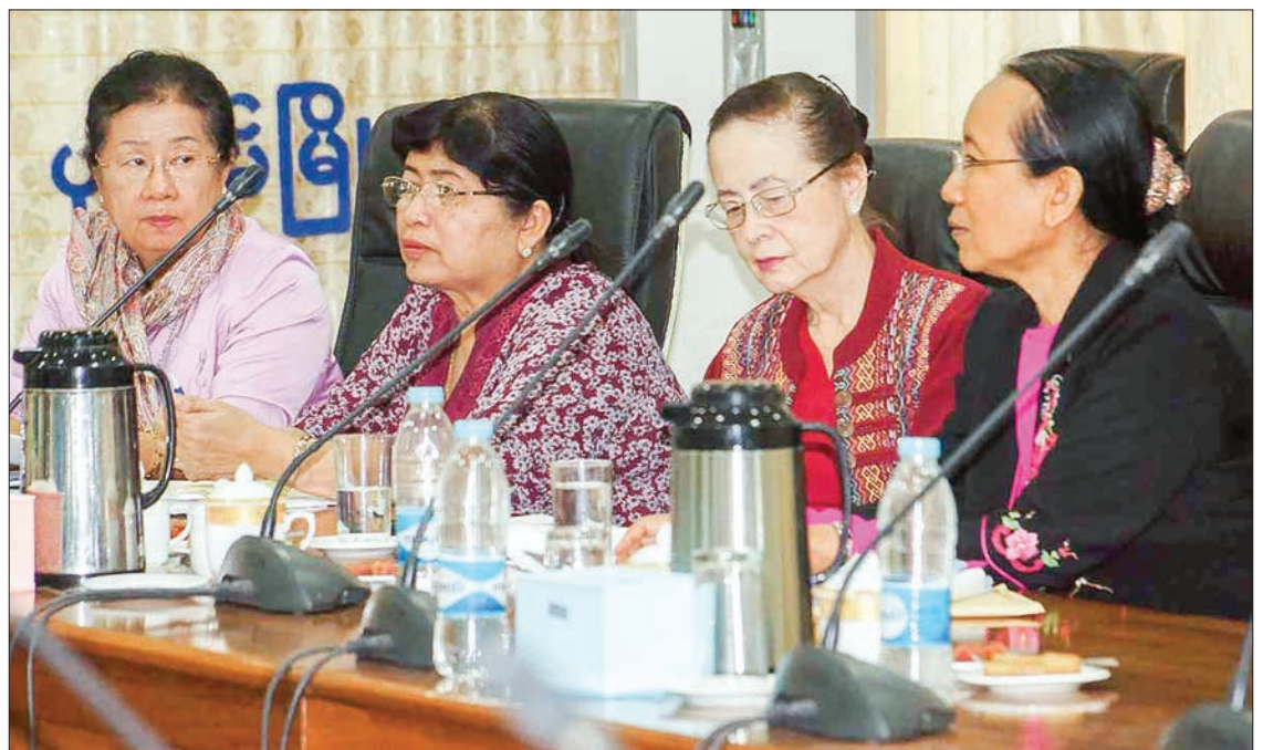
Chairperson, Secretary-General and members of the Orphans Reduction and Protection Association hold a meeting at Ayeyawady Region government office in Patheingyi yesterday.