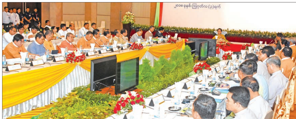
State Counsellor Daw Aung San Suu Kyi delivers a speech at the meeting of Central Committee for the Development of the National Tourism Industry in Nay Pyi Taw yesterday.

I frequently hear about the matter of culture. Sometimes, international visitors ask what