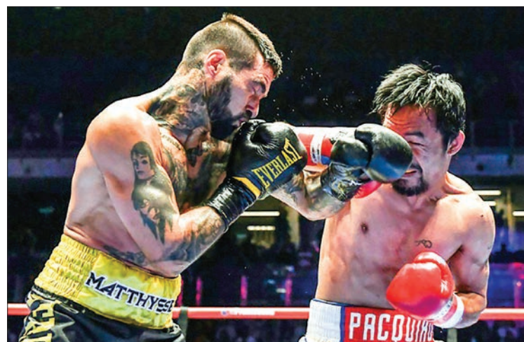
Challenging Filipino great Manny Pacquiao (right) proved a step too far for Argentine Lucas Matthysse.

He previously held the interim WBC super-lightweight title but was narrowly beaten by American Danny Garcia in Las Vegas in 2013 when challenging for the full strap.—AFP ■