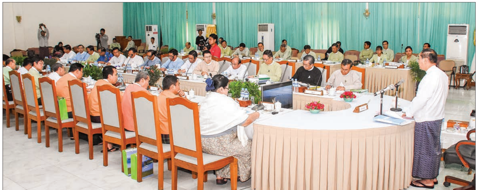
Vice President U Myint Swe delivers a speech at the meeting of National Level Central Committee for the Administration and Management of Natural Resources in coastal areas.

"For sustainability of marine resources, only the fishery sector should not be focused. For con-