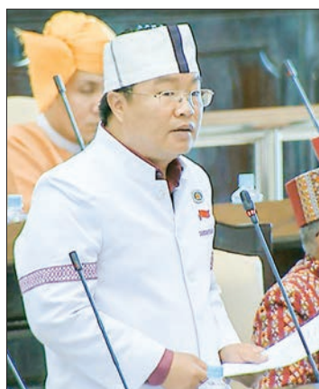
U Zon Hle Htan.

stalling an air conditioner in the departure lounge of the airport as soon as possible, Ks 400 million in fiscal year 2019-2020 and Ks 300 million in fiscal year 2020-2021 are earmarked to expand the present airport building from 120 ft. x 60 ft. to 120 ft. x 100 ft. and to conduct maintenance work on it. Depending upon the receipt of fund, the work will be conducted, replied the Deputy Minister.