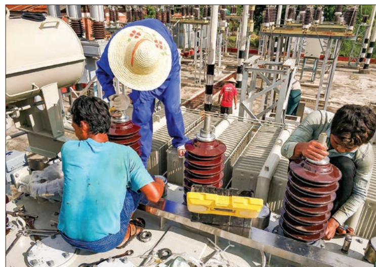
Workers arrange steel plates for a power substation in KhinU, Sagaing Region.

The Ministry of Electricity and Energy is putting