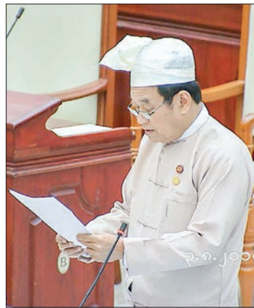
Dr. Myint Htwe.

U Khin Maung Thaung of Pinlaung constituency posed the first asterisk-marked question and asked if there is a plan to build a new ward for patients in Tigyt station hospital. Union Minister for Health and Sports Dr. Myint Htwe replied that there were on an average 29 in-patient and 59 out-patients per day in Pinlaung Township