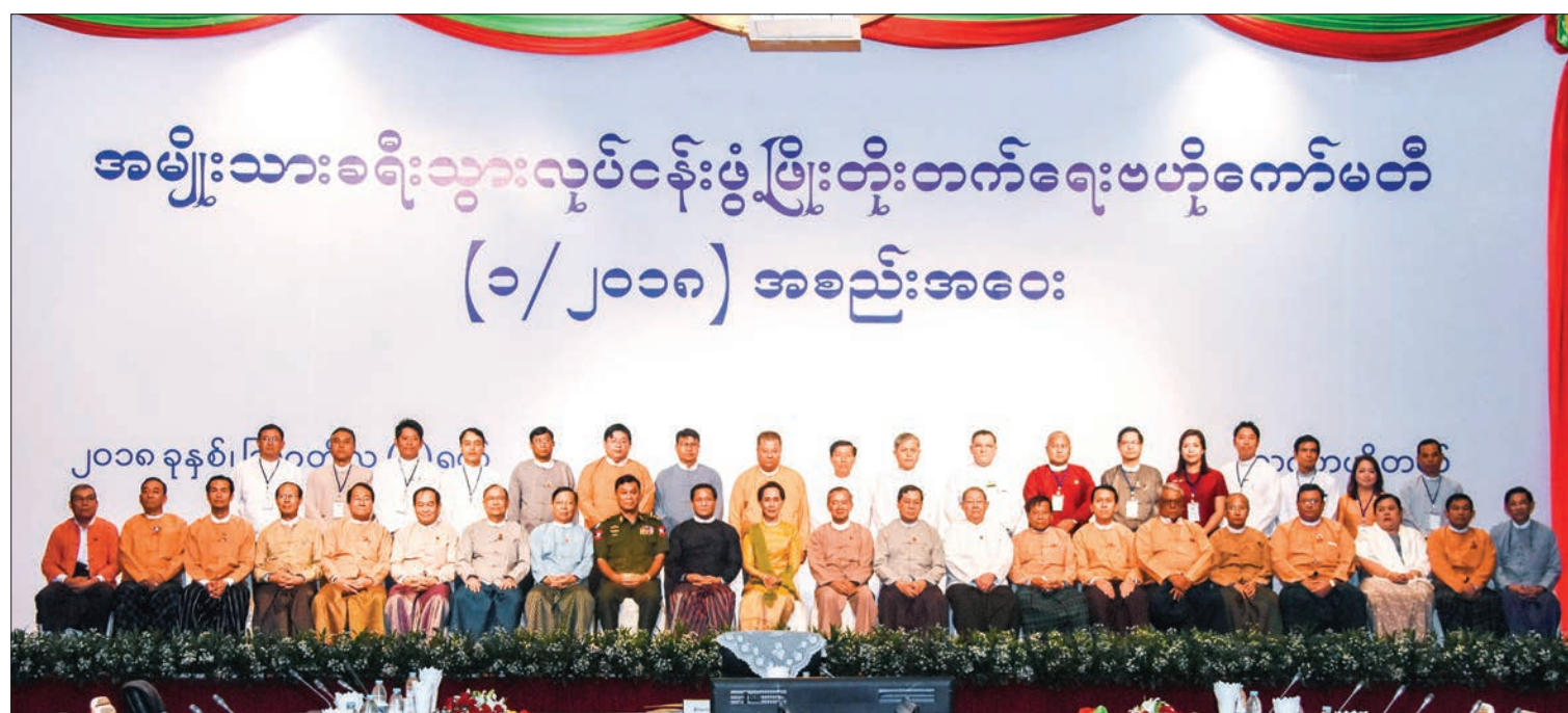
State Counsellor Daw Aung San Suu Kyi, Vice President U Henry Van Thio, union ministers, chief ministers of regions and states and dignitaries pose for a photo at the Central Committee for Development of National Tourism Industry (CCDNTI) meeting (1/2018).

The meeting came to an end with concluding remarks by the Vice President. — Myanmar News Agency