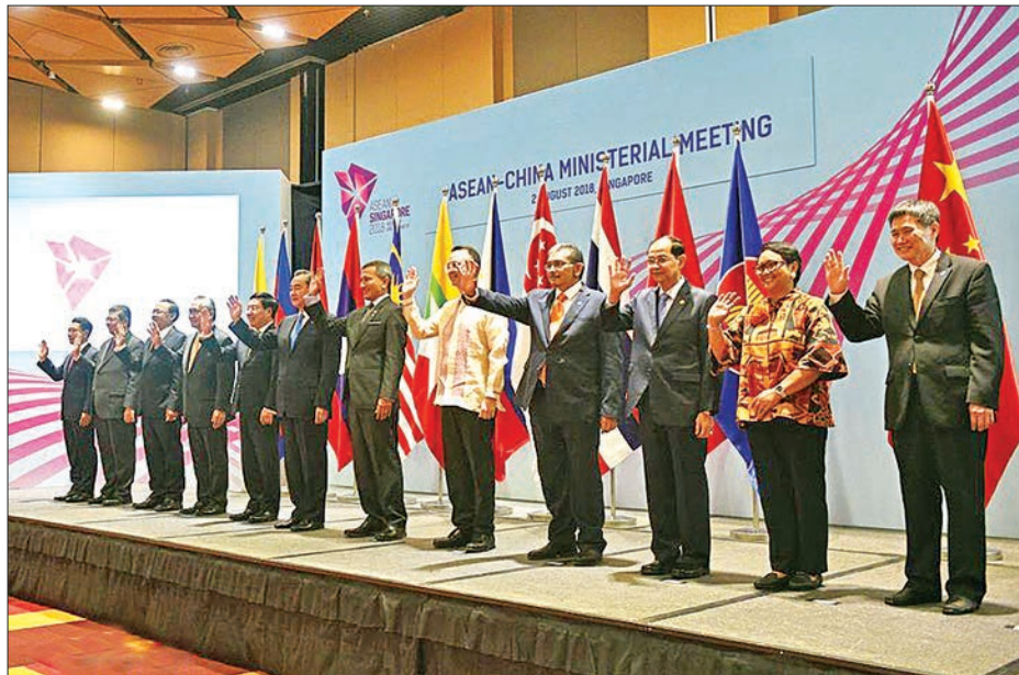
Chinese State Councilor and Foreign Minister Wang Yi (6 th L) attends the China-ASEAN foreign ministers' meeting in Singapore on 2 August 2018.

The ministers said they looked forward to the adoption of the ASEAN-China Strategic Partnership Vision 2030 at the ASEAN-China summit in Singapore in November, as well as the designation of the year 2019 as the ASEAN-China Year of Media