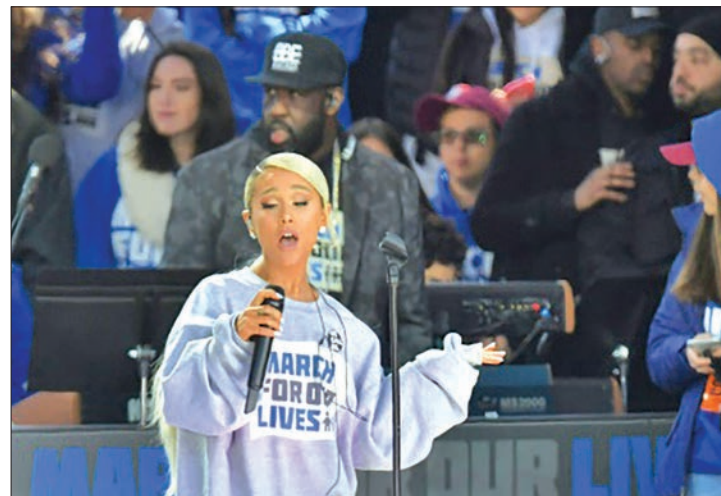
Pop star Ariana Grande - performing here at the Washington DC March for Our Lives rally in March 2018 - will sing "God Is a Woman" about the delights of sex at the MTV Video Music Awards.

But unlike the industry-led Grammys, the VMAs prides itself on outrageous made-for-television moments with less focus on who wins the awards. —AFP ■