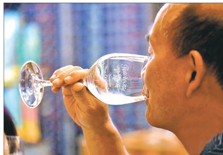
Drinking more than 14 units of alcohol a week could probably cause increased risk of developing dementia.

In Britain, 14 units of alcohol a week is now the recommended maximum limit for both men and