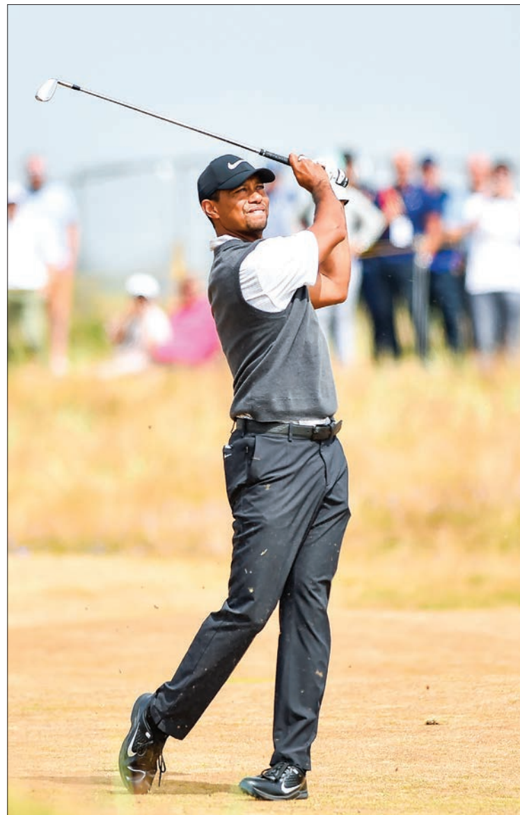
Fourteen-time major champion Tiger Woods is seeking his first victory since 2013 and said solid putting helped compensate for his ball-striking.

"We won't find the golf course on any easier day so you really needed to take advantage of it," said McIlroy, who thought he made the most of his chances. "Any time you