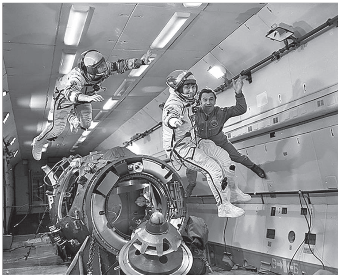
Svetlana Savitskaya (center) became the second woman in space some 19 years after Valentina Tereshkova

It is unclear when these first flights will happen. A report issued last month by a US government auditor said Boeing and SpaceX are unlikely to be able to send astronauts to the ISS next year, resulting in a possible gap in the US presence on the spacecraft.—AFP ■