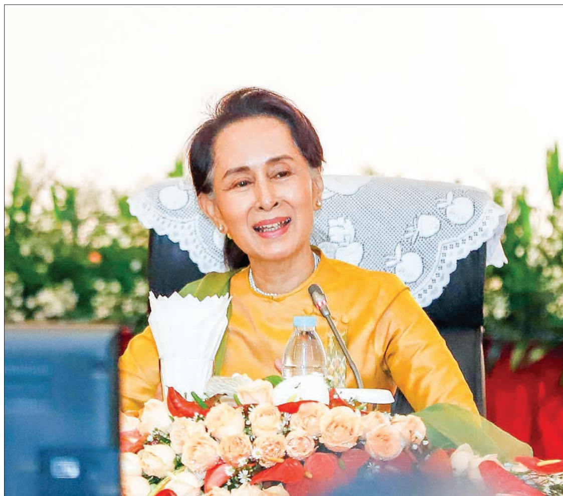
State Counsellor Daw Aung San Suu Kyi delivers a speech at the meeting of Central Committee for the Development of the National Tourism Industry in Nay Pyi Taw yesterday.

The meeting was attended by U Henry Van Thio, Chairman of the CCDNTI, Union Ministers who are members of the central committee, Chairman of Nay Pyi Taw Council, Chief Ministers of regions and states, Deputy Ministers, cabinet members of the region and state governments, departmental heads, representa-