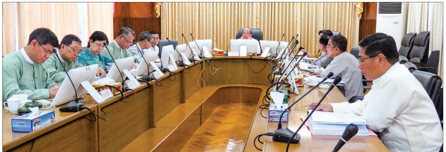
Myanmar Investment Commission meeting ( 11 / 2018 ) convenes in Yangon on 3 August.

The submission of proposals and endorsement applications from investors and post-permit activities of MIC-permitted companies were discussed in the meeting.—Myanmar News Agency ■