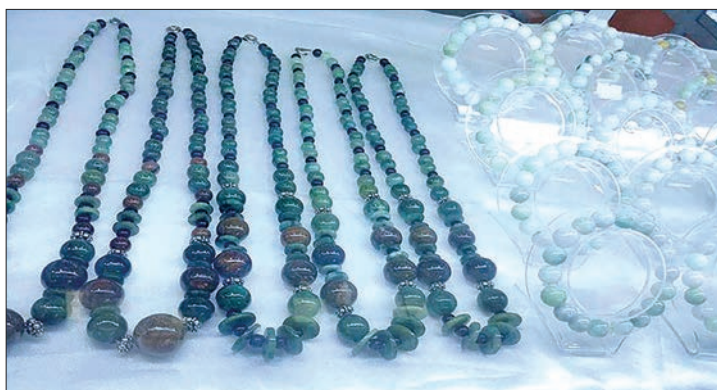
Jade jewellery are displayed inside a glass case.

gion GJEA tried to construct a gems market during the previous government's tenure, it did not materialize. The GJEA has met with the regional chief minister and has requested a