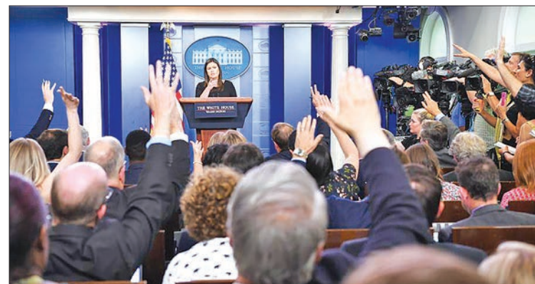
White House spokesperson Sarah Sanders (Rear) attends a press briefing at the White House in Washington D.C., the United States on 2 August 2018.

Earlier on Thursday, Sanders said in a statement that Trump has received a letter from Kim, and “the ongoing correspondence between the two leaders is aimed at following up on their meeting in Singapore and advancing the commitments made in the US-DPRK joint statement.” Trump also thanked Kim via Twitter for returning the remains of fallen US soldiers from the Korean War.—Xinhua ■