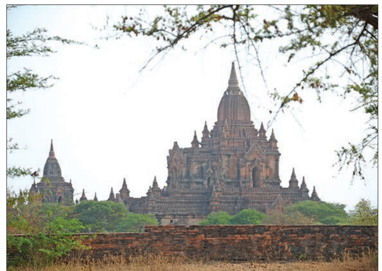
File photo shows a view of Bagan, Mandalay Region.

"In 2015, pagodas were renovated in their original designs, in accordance with designated plans and other procedures from the Archaeology