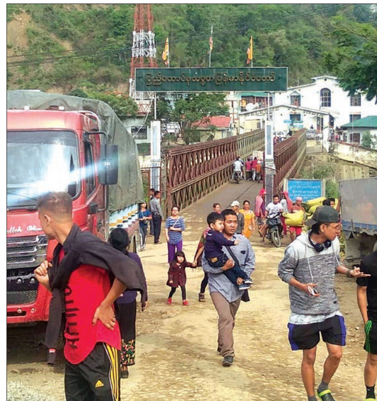
Myanmar-India international border check point in Rekhawda.

Previous border passes allowed visitors from India to enter Myanmar through the border bridge to visit the Reed Lake for a day.—Reekhawda IPRD ■