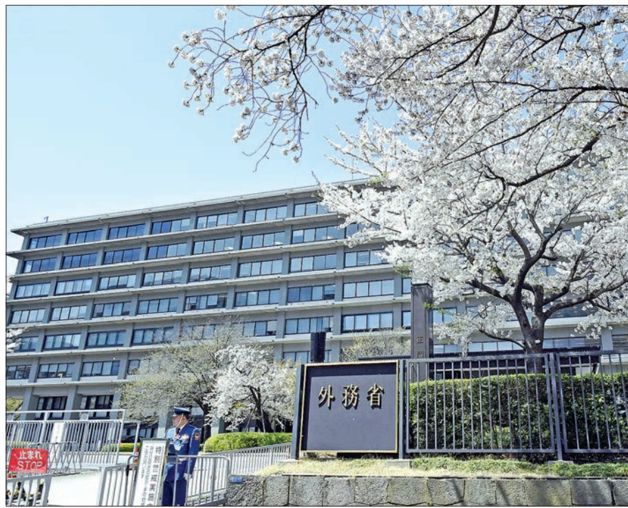
Photo taken in April 2017 shows the Foreign Ministry in Tokyo.