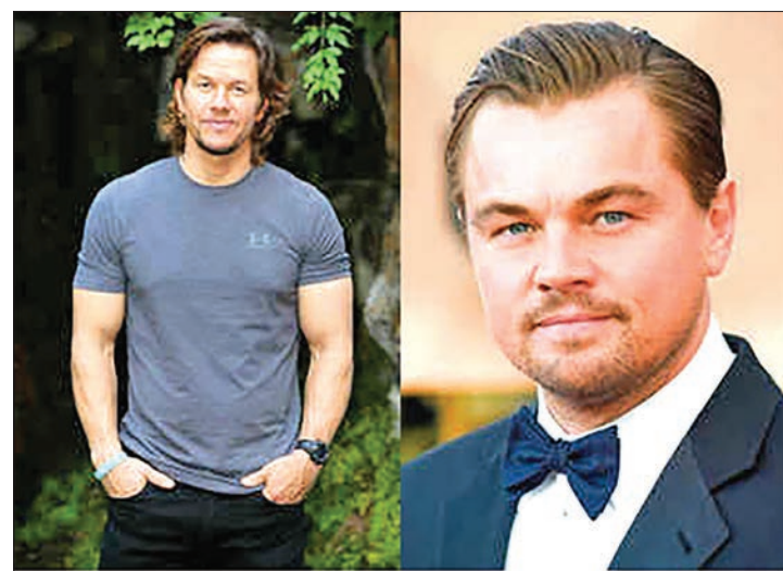
Mark Wahlberg and Leonardo DiCaprio.

After the film, Wahlberg went on to star in features such as "Boogie Nights", "Planet Of The Apes" and "The Departed", where he once again acted alongside DiCaprio.—PTI ■