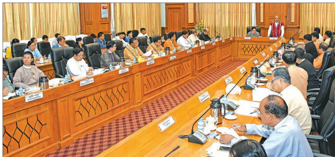
MPU Vice Chairman Mahn Win Khaing Than delivers a speech at the Myanmar Parliamentary Union meeting in Nay Pyi Taw yesterday.

MYANMAR Parliamentary Union held a meeting yesterday to review the budget scrutinizing process for projects in regions and states and Hluttaw affairs.