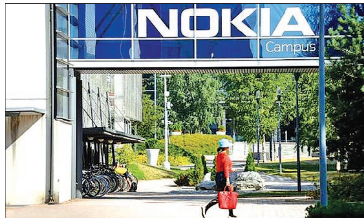
Nokia — its Finland HQ pictured here — is to help T-Mobile deploy a superfast "5G" mobile internet network across the United States. PHOTO: AFP

T-Mobile and Sprint — a subsidiary of Japan's SoftBank — are at present the third and fourth largest US wireless operators, respectively.—AFP ■