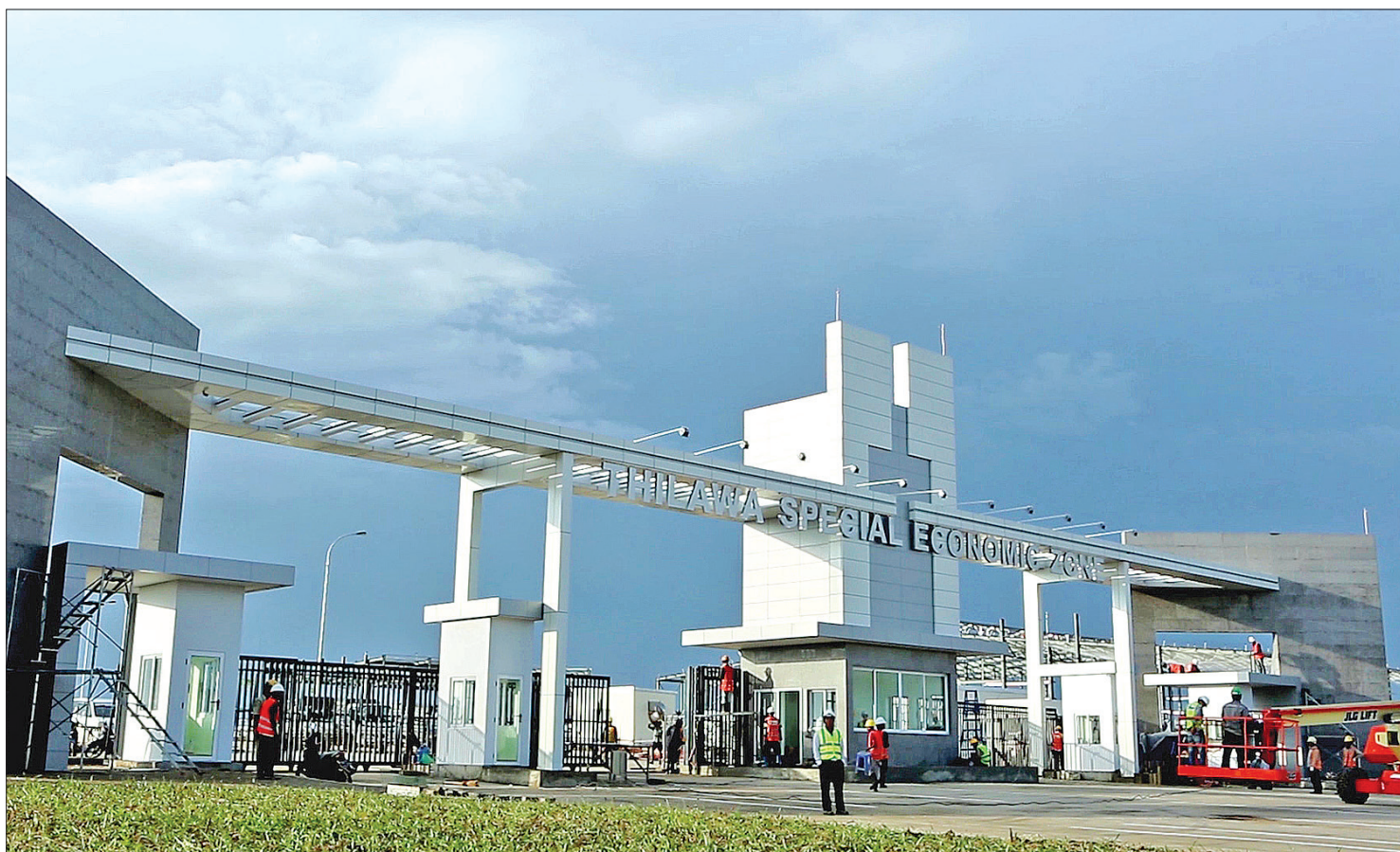
Thilawa Special Economic Zone attracts foreign investors through its manufacturing sector in nearly four months.

Green grams are placed in the market after the cleaning process. There are 10 bean cleaning machines in Mandalay. Previously, they were stockpiled in the warehouse due to low demand. But at present, they are reaping profits and nearly sold out. Green grams are being manufactured by feed processing factories from Yangon as aqua feed, he maintained. Some five or 10 bags of low-quality green grams are produced when Mandalay mills carry out the cleaning process for 100 bags. The poor-quality green grams fetch Ks580 per viss (3.6lb) in the Mandalay beans and pulses market. In early June, green grams were worth Ks128,000 per three-basket bag. The price dropped to Ks95,000 per bag by the end of July, when they were harvested. Over 30,000 bags are supplied daily to the Mandalay beans and pulses market. —Min Htet Aung/Mandalay sub-printing house ■