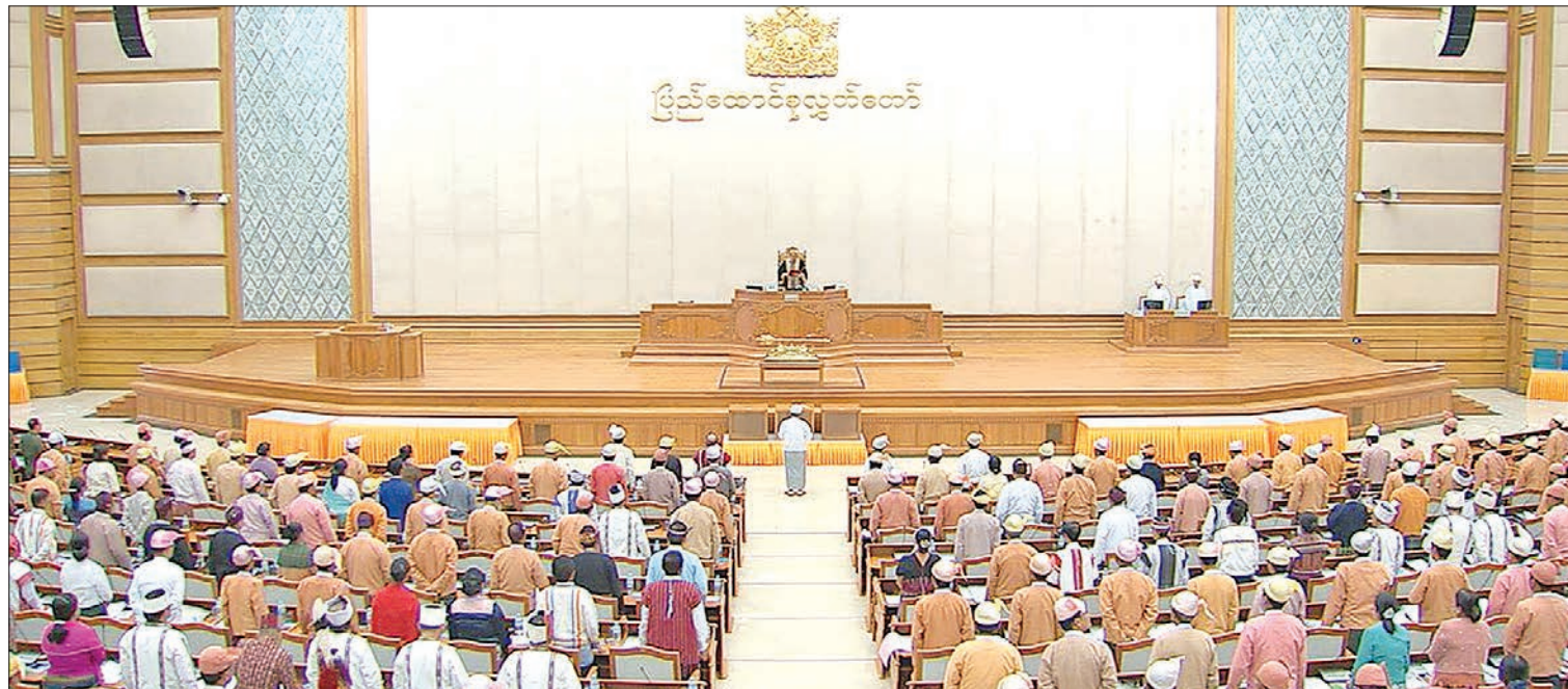
U Kyaw Kyaw Maung, Governor of the Central Bank of Myanmar, taking the oath of office in front of the Pyidaungsu Hluttaw Speaker.

He said at the present time it is focusing on ethnic solidarity and national reconciliation for a long-lasting union peace. He instructed the Hluttaw representatives to work for the peace and rule of law starting from their constituencies up to the