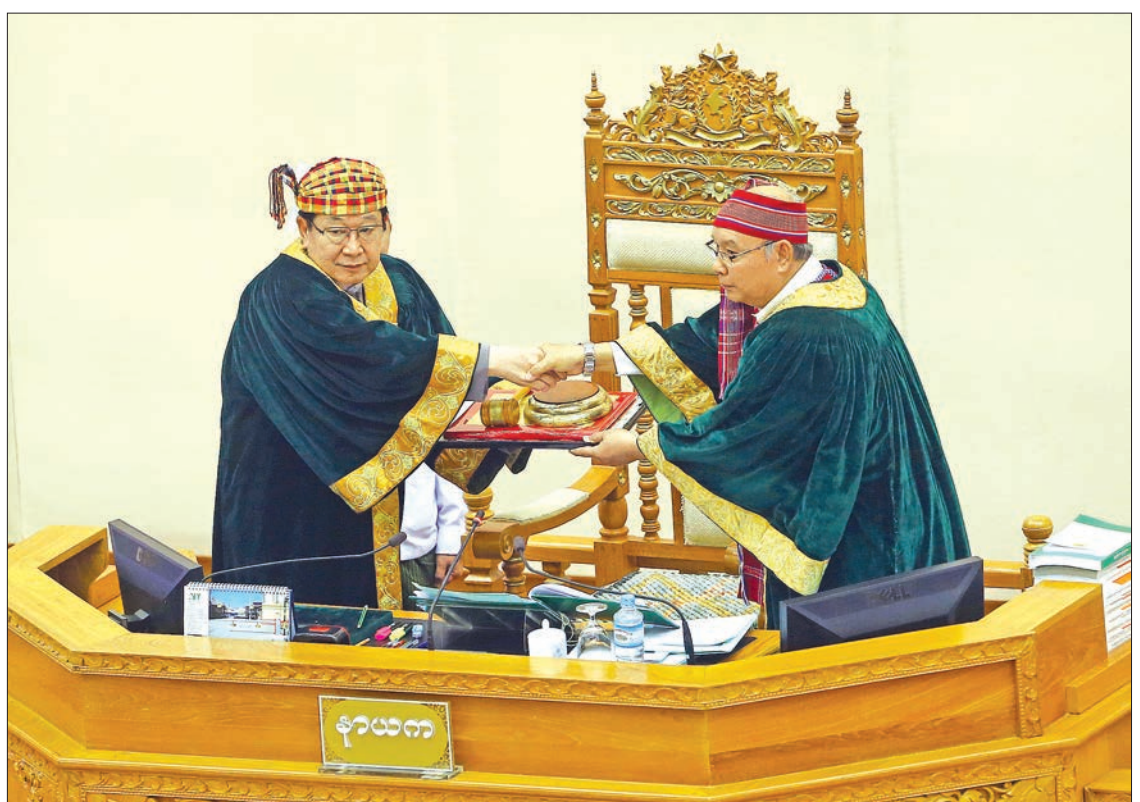
Pyidaungsu Hluttaw Speaker Mahn Win Khaing Than hands over the responsibilities of the Pyidaungsu Hluttaw Speaker to Pyithu Hluttaw Speaker U T Khun Myat at the Second Pyidaungsu Hluttaw's ninth regular session.