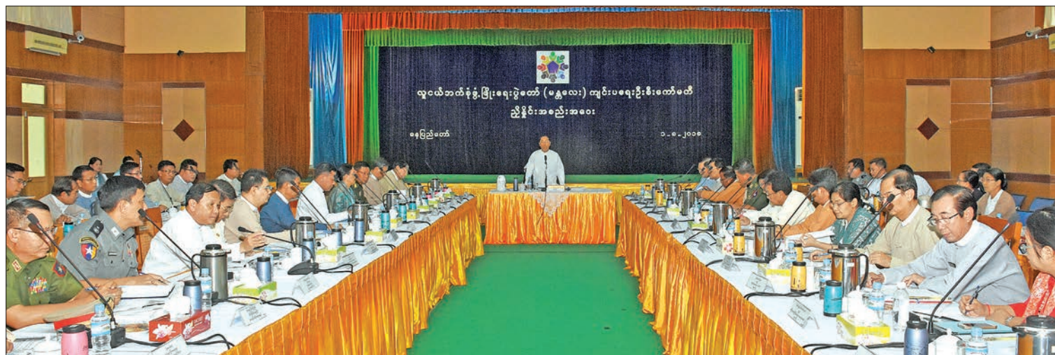
Vice President U Myint Swe addresses the meeting of the leading committee for holding the All-Round Youth Development Festival at Mandalay University in Nay Pyi Taw.

The All-Round Youth Development Festival (Yangon) was held at Yangon University in 2017