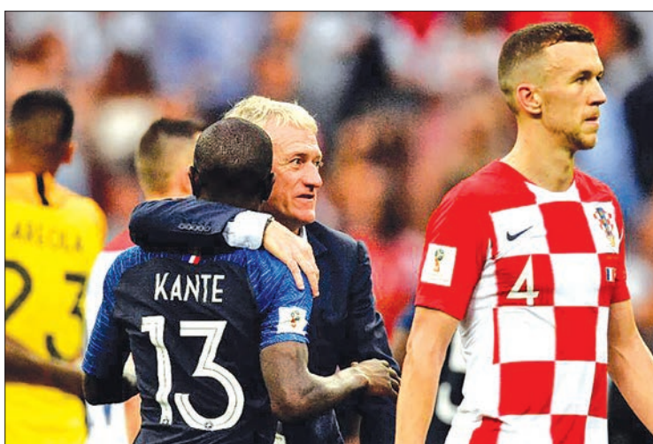
France midfielder N'Golo Kante was labelled the 'essential element' to the World Cup-winning side by coach Didier Deschamps.

The new contract would see Kante's pay almost doubled from his present deal — £150,000 a week — which terminates in 2021. Kante was a pivotal fig-