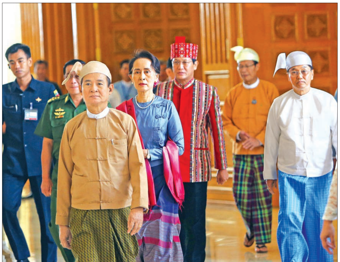
President U Win Myint, State Counsellor Daw Aung San Suu Kyi, Vice Presidents U Myint Swe and U Henry Van Thio arrive to attend the fifth-day meeting of the Second Pyidaungsu Hluttaw's ninth regular session in Nay Pyi Taw yesterday.