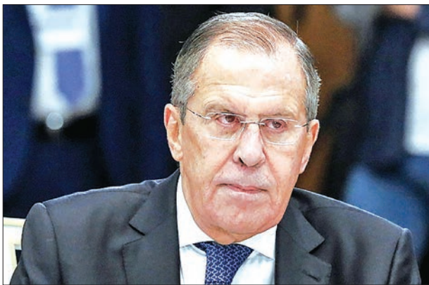
Russian Foreign Minister Sergey Lavrov.

In December 2017, the Japanese government took a decision to deploy two US Aegis Ashore missile defence systems in the north and southwest of the Honshu Island in 2023. Tokyo claims these systems are meant to protect the country from ballistic and, possibly, from cruise missiles. Japan plans to spend about 100 billion yens (about 897 million US dollars) for each of