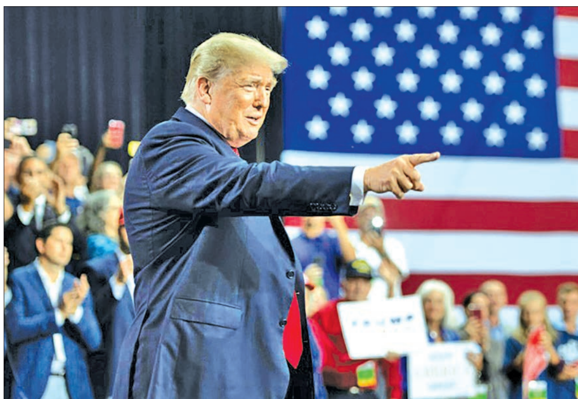
US President Donald Trump recently threatened to slap punitive tariffs on all Chinese imports, which accounted for more than $500 billion last year. PHOTO: AFP

Trump recently threatened to slap punitive tariffs on all Chinese imports, which accounted for more than $500 billion last year.—AFP ■