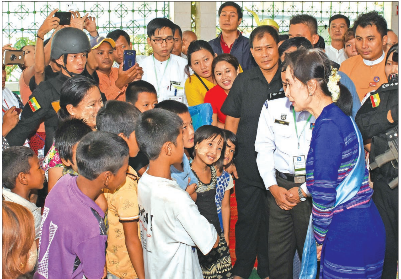
State Counsellor Daw Aung San Suu Kyi meets with local residents at Shweyinmyaw Pagoda's temporary shelter in Hpa-an, Kayin State.

The State Counsellor then met with local residents at the pagoda's temporary shelter, greeted them cordially and gave words of encouragement and provided rice, cooking oil, medical supplies,