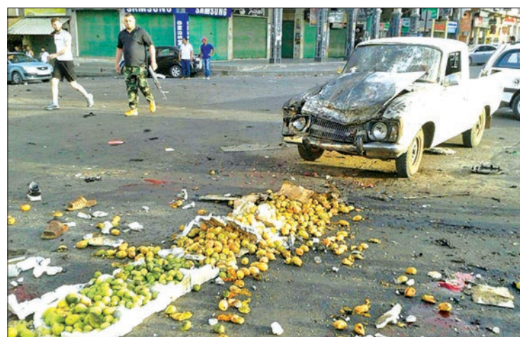
A handout picture released by the official Syrian Arab News Agency (SANA) on July 25, 2018 shows a member of the Syrian security forces walking past a truck damaged in a suicide attack in the southern city of Sweida.

Pro-government forces ousted IS from urban centres in eastern Syria last year, but IS raids in recent months have killed dozens of regime and allied fighters.—AFP ■