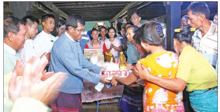
Deputy Minister U Soe Aung provides assistance to locals affected by flooding in Kayin State.

his contingent then travelled to Hlaingbwe and met with local residents seeking shelter at the cyclone shelter and nursery school and provided humanitarian aid.