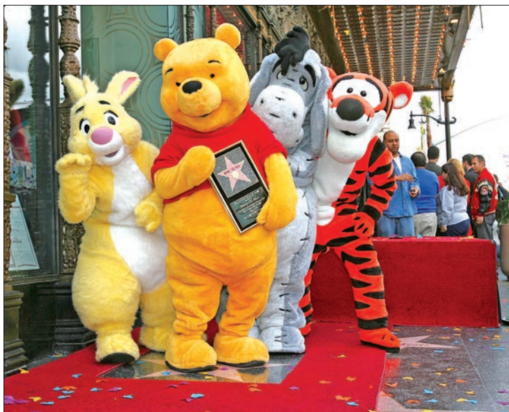
Rabbit, Winnie The Pooh, Eeyore and Tigger pose for photos as Winnie The Pooh receives a star on the Hollywood Walk of Fame on 11 April 2006.

In the new live action adventure, the young boy who embarked on countless adventures in the Hundred Acre Wood with his band of spirited and lovable