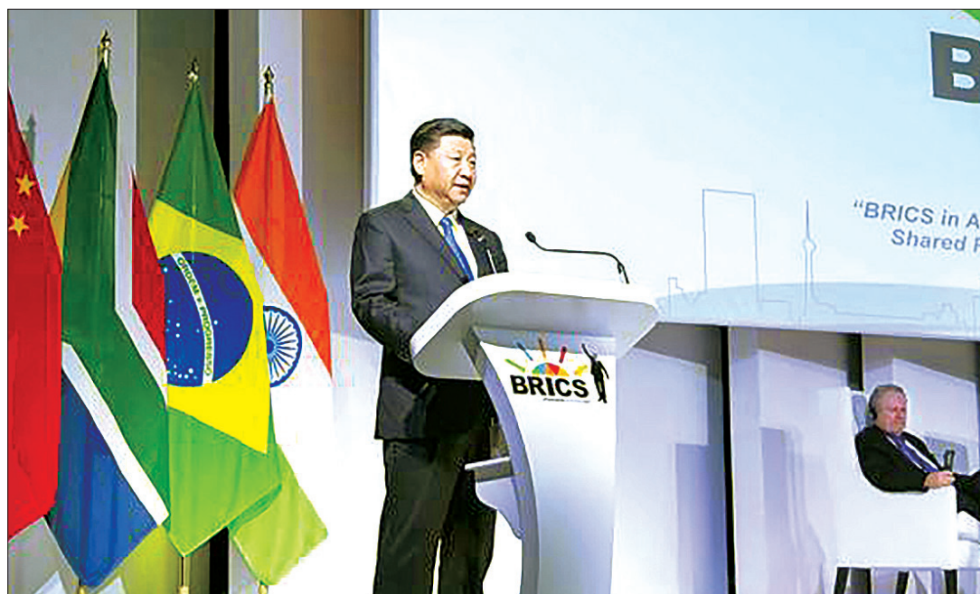
Chinese President Xi Jinping delivers a speech titled "Keeping Abreast of the Trend of the Times to Achieve Common Development" at the BRICS Business Forum in Johannesburg, South Africa on 25 July 2018.

has been gaining momentum in areas such as finance, agriculture, trade, combating transnational crime, science and technology, health, education, security and academic dialogue, according to Ramaphosa.