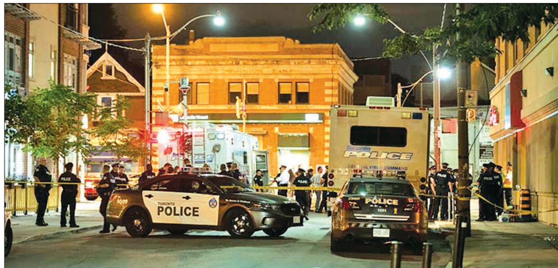
Police officers gather at the crime scene in Toronto, Canada, on 23 July 2018.