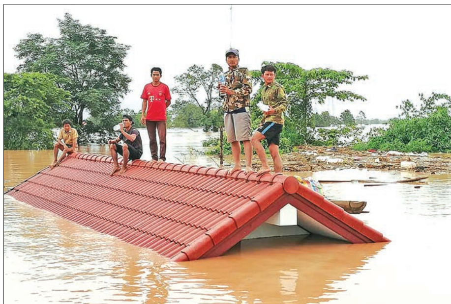
Villagers take to rooftops to escape floodwaters in Attapeu province in Laos.

"We were on the roof of that house the whole night, cold and scared. At 4:00 am a wooden boat passed and we decided to