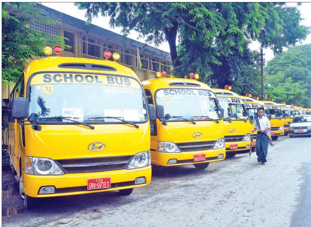
New school ferry buses parked in Yangon.

Due to limitation of space we are only able to publish "Letter to the Editor" that do not exceed 500 words. Should you submit a text longer than 500 words please be aware that your letter will be edited.