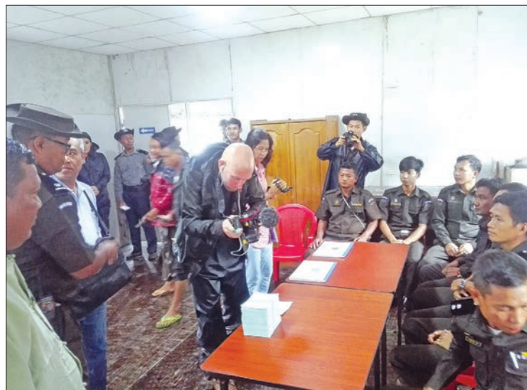
Journalists gathering news at the Taung Pyo Letwe Reception Centre.

The 17-member media delegation comprised journalists from Fuji TV, Sky News TV, New York Times, Myanmar News Agency-MNA, MRTV and MITV.