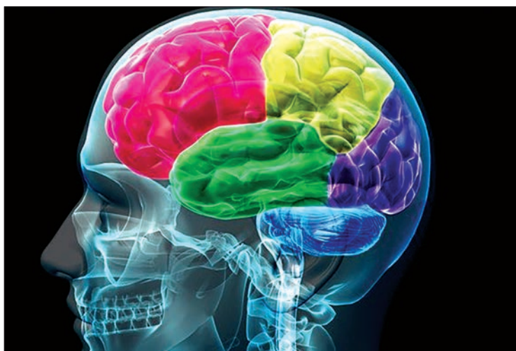
Graphic depicting sections of human brain

They expected to use similar hydrogels in future studies as a noninvasive method to alter flow in the brain. — Xinhua ■