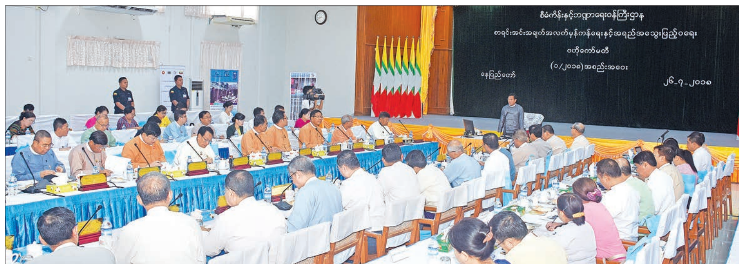
Vice President U Henry Van Thio delivers the speech at the statistics central committee's meeting 1/2018 in Nay Pyi Taw yesterday.

Accurate statistics are very important for developed countries as well as developing countries. Only when the quality of the national statistics is good can the policy makers, private businesses and socio-economic researchers obtain facts to set up policies and projects that create a good economic environment. Resources can be effectively divided and monitoring of projects can be conducted. If there is a need to amend policy, better amendments can be conducted. As business persons are investing based on