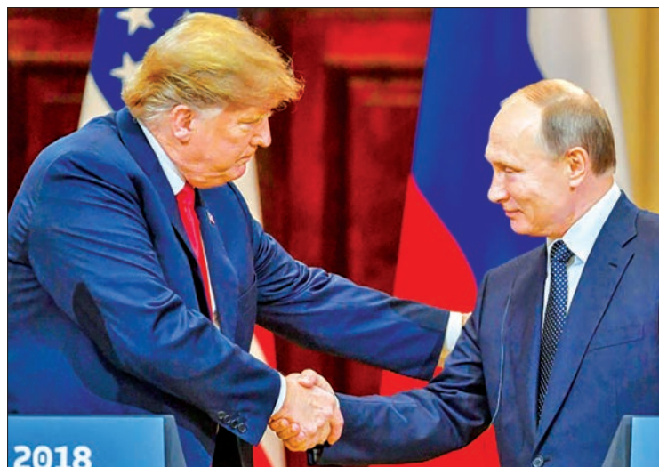
US President Donald Trump (L) and Russia's President Vladimir Putin shake hands before a joint press conference after their summit in Helsinki.

the Russians that there will be severe consequences for interference in our democratic processes," he said in his opening statement.