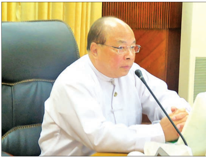
MIC Chairman U Thaung Tun attends the Myanmar Investment Commission meeting in Yangon yesterday.