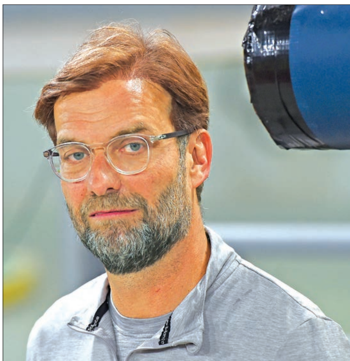
Jurgen Klopp's Liverpool are taking part in the International Champions Cup in the United States. PHOTO: AFP

Liverpool are currently taking part in the International Champions Cup in the United States. —AFP ■