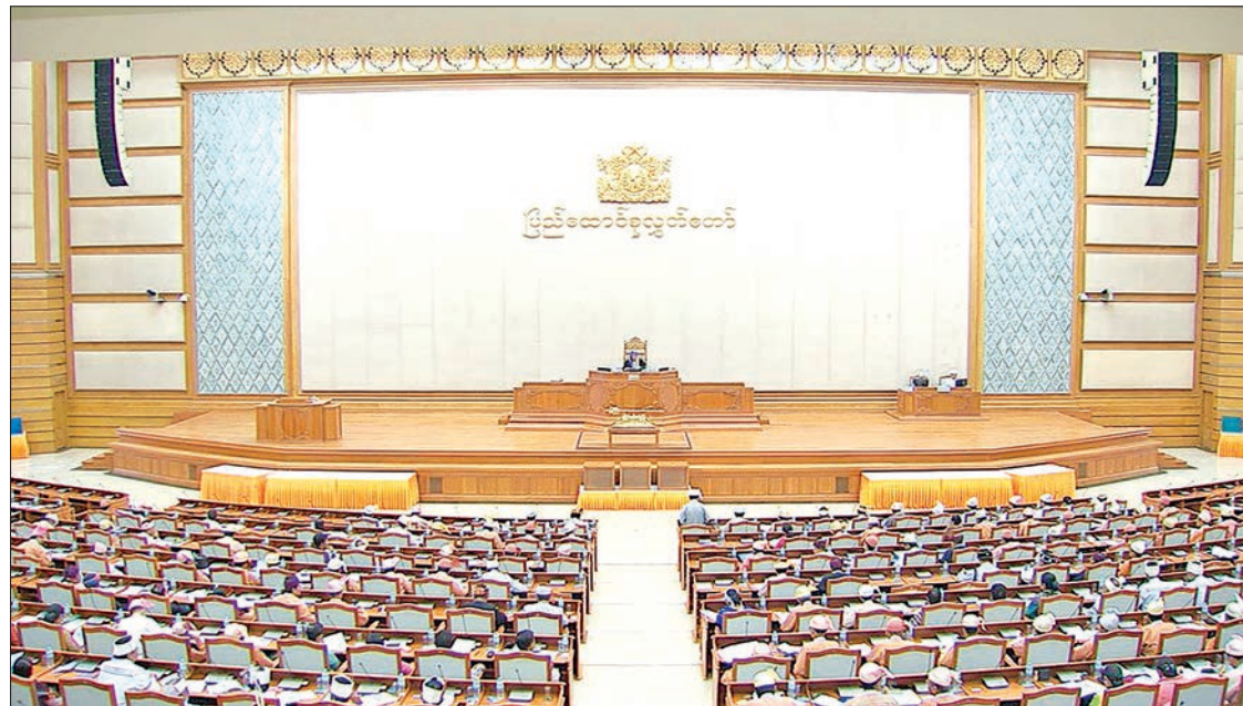
Pyidaungsu Hluttaw being convened in Nay Pyi Taw yesterday.

Union Minister for Labour, Immigration and Population U Thein Swe said 14 policies and 21 aims were set to implement work in the 2018-2019 FY and expenditures requested were for improving work site relations, acquiring full labour rights, setting up a policy to obtain the exact population numbers and indicators and having sufficient