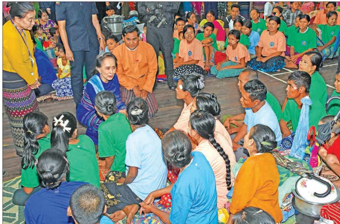
State Counsellor Daw Aung San Suu Kyi meeting with local residents sheltering at the temporary flood relief centre opened at the indoor stadium in Hpa-an, Kayin State.

The State Counsellor later held a meeting with the Kayin State Chief Minister and her state cabinet at the meeting hall of the Kayin State government building. The State Counsellor said the changes in the weather are causing floods, an occurrence that was uncommon in the past. The State Counsellor said these changes that have not been seen before will soon become the norm, and it will require the cooperation of the Union and states and regions to uncover the reasons behind these floods. If the causes are due to dwindling rivers, then river expansion projects to widen the channels must be carried out. Immediate repairs must also be made to damaged bridges for the people's transportation. The State Counsellor said after talking with people seeking shelter in flood relief centres, it was found there were possibilities for giving talks on health education and nutrition, giving training classes for vocational skills, and setting rules to prevent flooding, drain blockages, and careless littering.