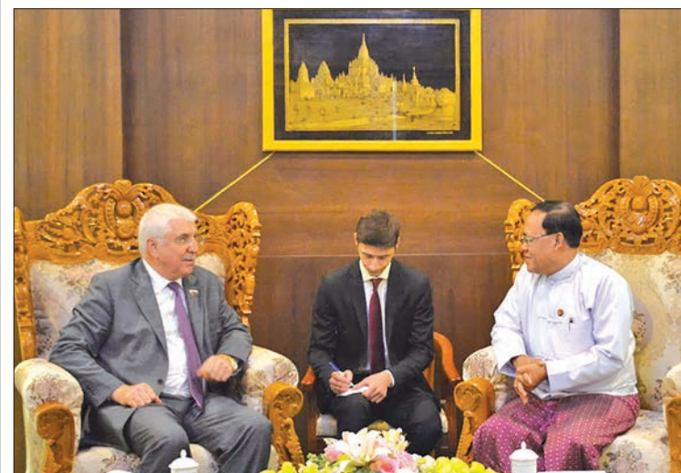
Union Minister U Kyaw Tin meets with Russian Deputy Chairman Mr. Aleksei Chepa in Nay Pyi Taw yesterday.

U KYAW TIN, Union Minister for International Cooperation of the Republic of the Union of Myanmar, received the delegation led by Mr. Aleksei Chepa, Deputy Chairman of the International Affairs Committee of the State Duma of the Russian Federation, at 1pm. yesterday, at the Ministry of Foreign Affairs in Nay