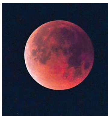
In this file photo taken on 31 January, 2018 the "super blue blood moon" is seen over Los Angeles, California.

Amateur astronomers in the southern hemisphere will be best-placed to enjoy the spectacle, especially those in southern Africa, Australia, India and Madagascar, though it will also be partly visible in Europe and South America.