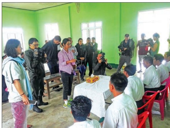
Media delegation interviewing local authorities in Maungtaw, Rakhine State.

At the Maungtaw District Administration Office, journalists interviewed the local authorities about the cultivation of rice during the rainy season, security