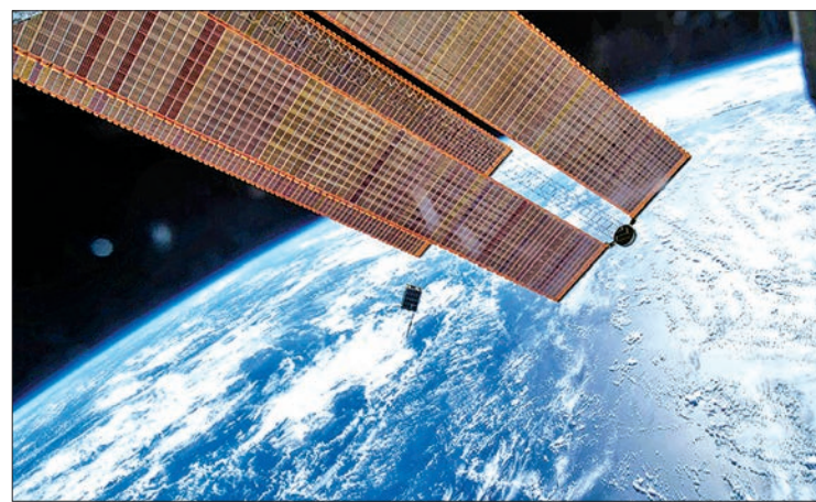
The satellite containing newlyweds' commemorative wedding plaques will be taken up to the International Space Station on a supply ship, and then released by astronauts.

The satellite launch is not expected until next year, but the company will soon start taking orders from couples tying the knot.