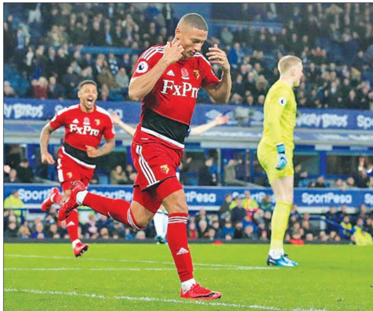
Richarlison celebrates scoring against Everton for Watford last November.

LONDON — Everton have lured Brazilian forward Richarlison away from Premier League rivals Watford on a five-year deal worth a reported £40 million ($53 million, 45 million euros).