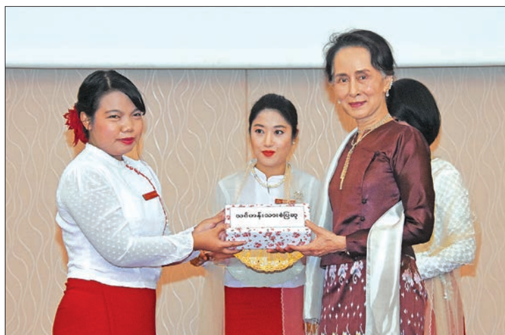
State Counsellor presents award to an outstanding staff who attended and passed the Union Civil Service Board course.

The Ministry of State Counsellor's Office is unique. I want our staff to be unique too. They must develop themselves to be unique. I want all of you to do things in unity. Our ministry