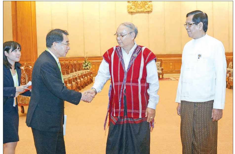
Amyotha Hluttaw Speaker Mahn Win Khaing Than receives former Japanese Minister Mr. Ryu Shionoya in Nay Pyi Taw.