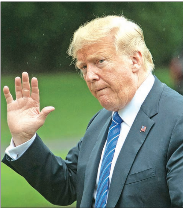
US President Donald Trump walks to the White House in Washington, DC on 24 July, 2018, upon his return from Kansas City, Missouri where he addressed the 119th Veterans of Foreign Wars National Convention.

KANSAS CITY — US President Donald Trump insisted on Tuesday that imposing tariffs forces other countries to negotiate with Washington, a day before the European Union chief visits trying to prevent an all-out trade war. "What the European Union is doing to us is incredible, how bad. They made $151 billion last year, our trade deficit with the European Union. They sound nice, but they're rough," he told a convention of Veterans of Foreign Wars.