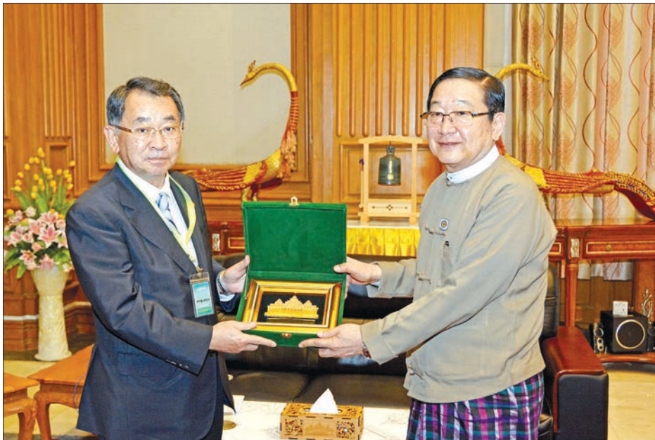
Pyithu Hluttaw Speaker U T Khun Myat presents a souvenir to former Japanese Minister Mr. Ryu Shionoya in Nay Pyi Taw yesterday.