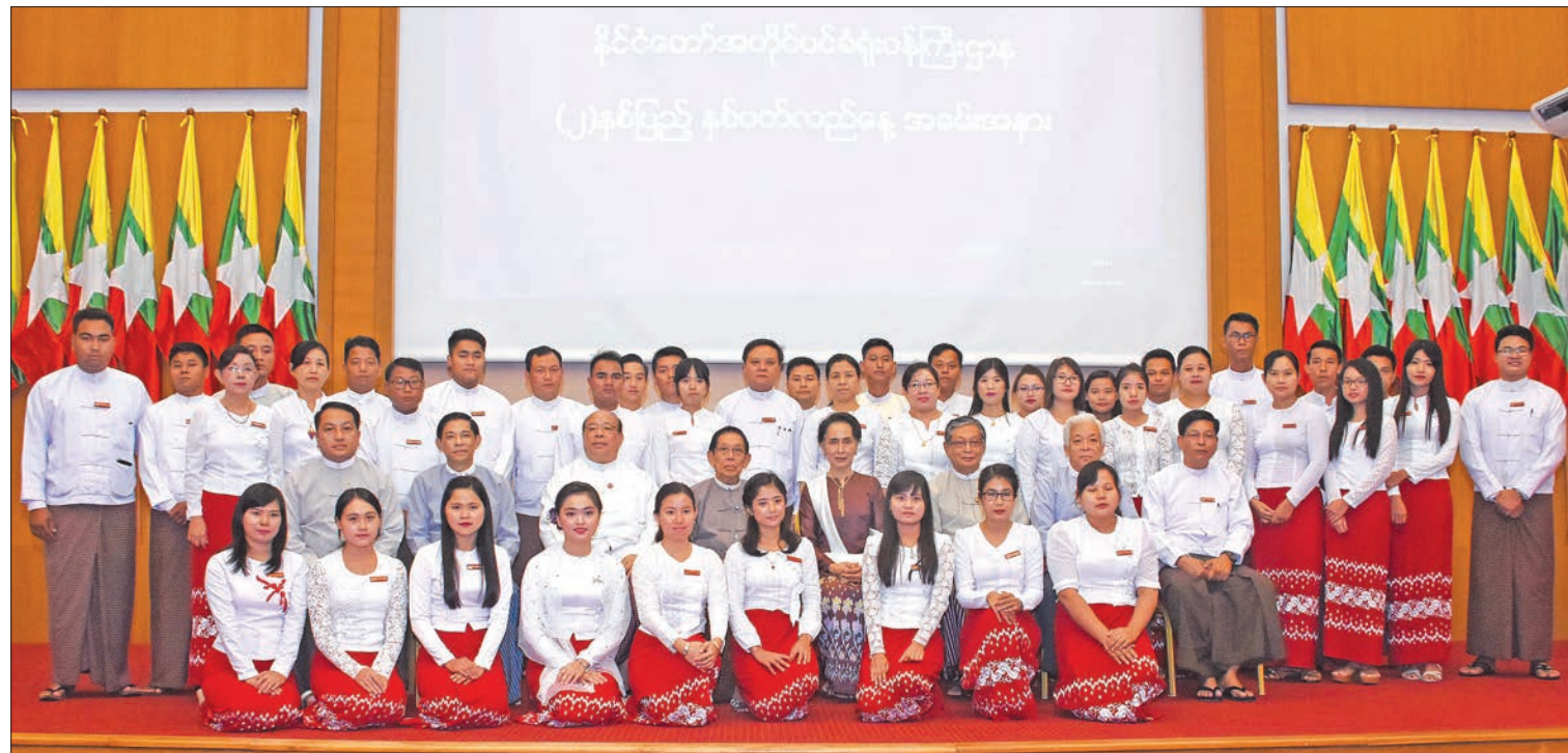
State Counsellor Daw Aung San Suu Kyi poses for a photo together with attendees and staff from Department of Policy Affairs at the ceremony commemorating the second anniversary of the Ministry of the State Counsellor's Office in Nay Pyi Taw yesterday.

But due to the weakness of our education system, two generations of our people did not have good kamma. Their past kamma was not good. But we will have to overcome the bad kamma of our past with good kamma of the present. We didn't know what to do because the education system was not good. But this is not a good excuse. We will have to put in more effort. If we really try, we can succeed. But we must persevere. When it is time to go home and rest in the evening, we like to rest. But to develop and progress, we will have to lessen some of this leisure time and try to improve our ability. Staff members who are young need to