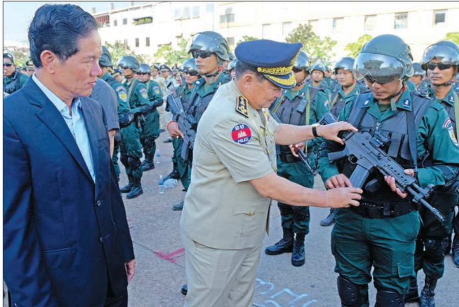
Phnom Penh police chief Chuon Sovann (C) checks firearms as Phnom Penh governor Khuong Sreng (L) looks on during inspection ceremony of the police force at the Olympic National stadium in Phnom Penh on 25 July, 2018 in preparation for the 29 July general election.

Phnom Penh Municipal Governor Khuong Sreng called for the people to vote in Sunday's election, saying that it is the only chance in every five years to elect national