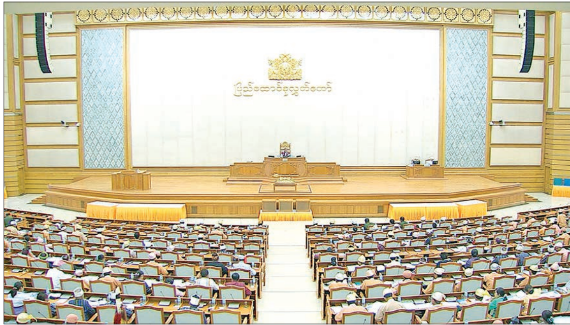
Pyidaungsu Hluttaw being convened in Nay Pyi Taw yesterday.

tender was requested for the broadcasting equipment on 4 February 2018 and the bid was won by Sumitomo Corporation at JPY1,969 million. A contract was signed between MRTV and Sumitomo Corporation on 9 February. The contract states MRTV has to pay in advance 30 per cent of the equipment costs (JPY469.917 million) and 40 per cent of the building renovation costs (JPY46.8 million), a total of JPY516.717 million, between April and September 2018.