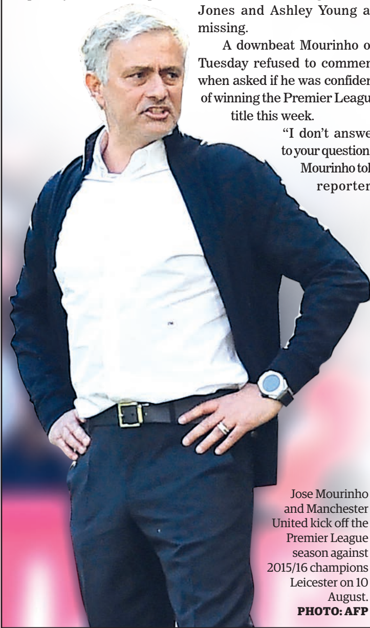
Jose Mourinho and Manchester United kick off the Premier League season against 2015/16 champions Leicester on 10 August.

"Man City and Tottenham in a similar situation as we are, but other clubs are in a different situation."—AFP