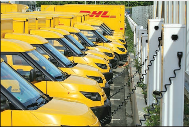
Deutsche Post designed its Streetscooter from scratch as a delivery vehicle for inner cities.