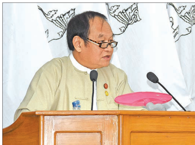
Union Minister for Health and Sports Dr. Myint Htwe delivers the opening speech at the 80 th Central Council Meeting of the Myanmar Red Cross Society (MRCS) in Nay Pyi Taw yesterday.