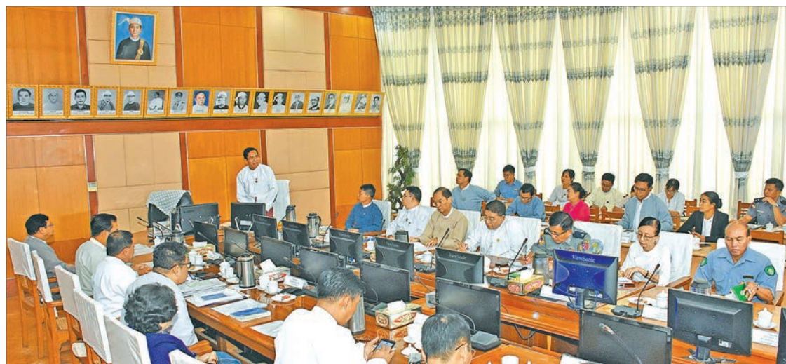
Deputy Minister U Aung Hla Tun delivers the speech at the meeting of Working Committee for holding All-round Youth Development Festival (Mandalay).

Speaking at the meeting, U Aung Hla Tun said that the Steering and Working Committees for Holding All-round Youth Development Festival (Mandalay) had been formed by the President's Office on 25 June and 4 July, 2018 respectively. On the other hand, 14 sub-committees and a