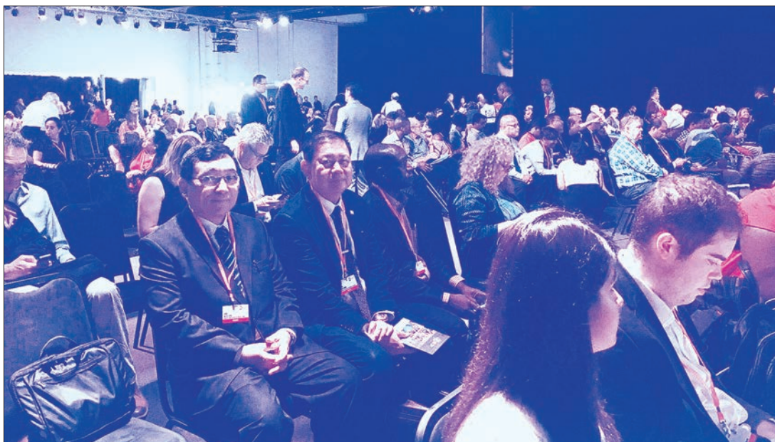
Union Minister Dr Win Myat Aye attends the first-ever Global Disability Summit held in London on 23 July.

Attendees to the ceremony commemorating the second anniversary of the Ministry of the Office of the State Counsellor were then hosted to a luncheon. —Myanmar News Agency ■