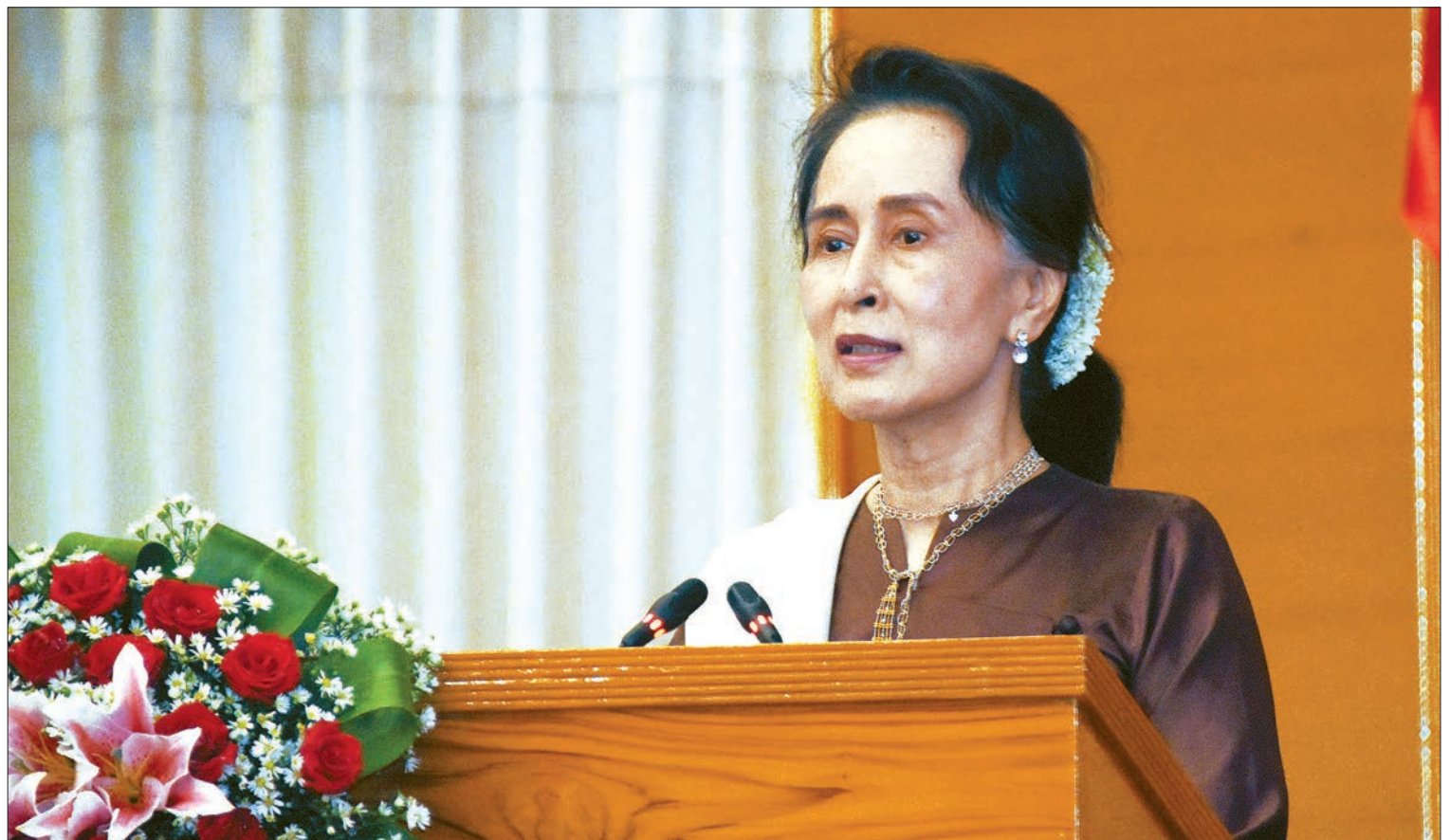
State Counsellor Daw Aung San Suu Kyi addresses the ceremony commemorating the second anniversary of the Ministry of the State Counsellor's Office at the National Reconciliation and Peace Centre (NRPC) in Nay Pyi Taw yesterday.

In her speech at the ceremony, State Counsellor Daw Aung San Suu Kyi said, "As our ministry is new, there can be some