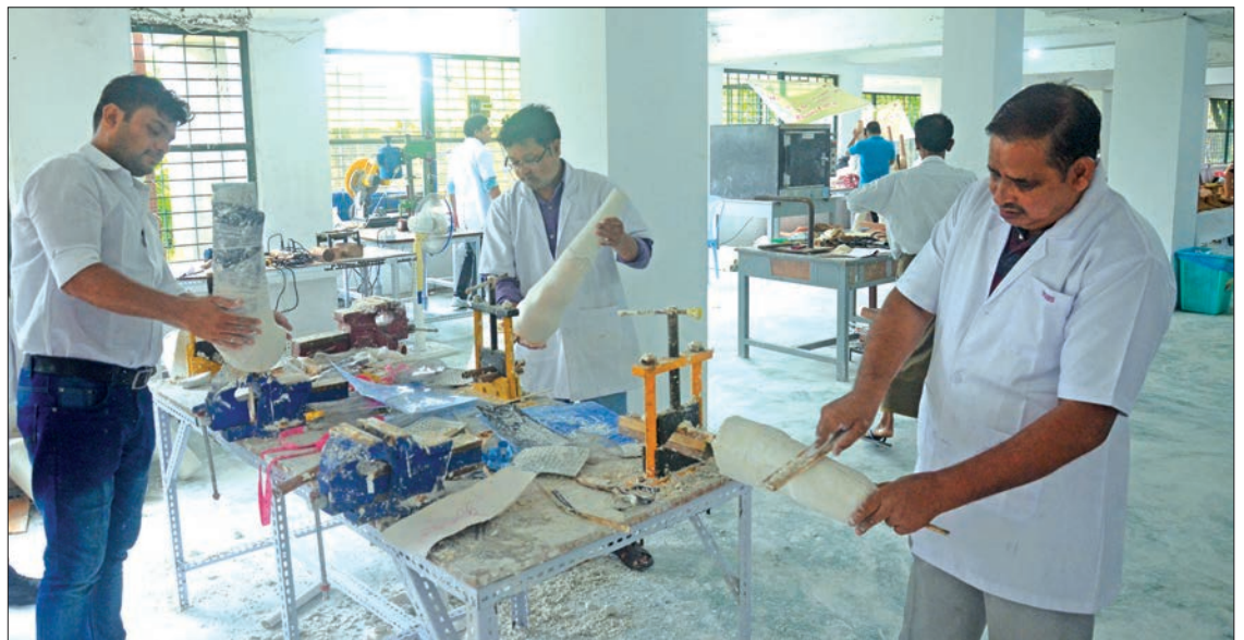
Technicians assembling artificial limbs, manufactured under the India-Myanmar Development Cooperation programme, for people with disabilities in Yangon.

The event is being organised by the Ministry of External