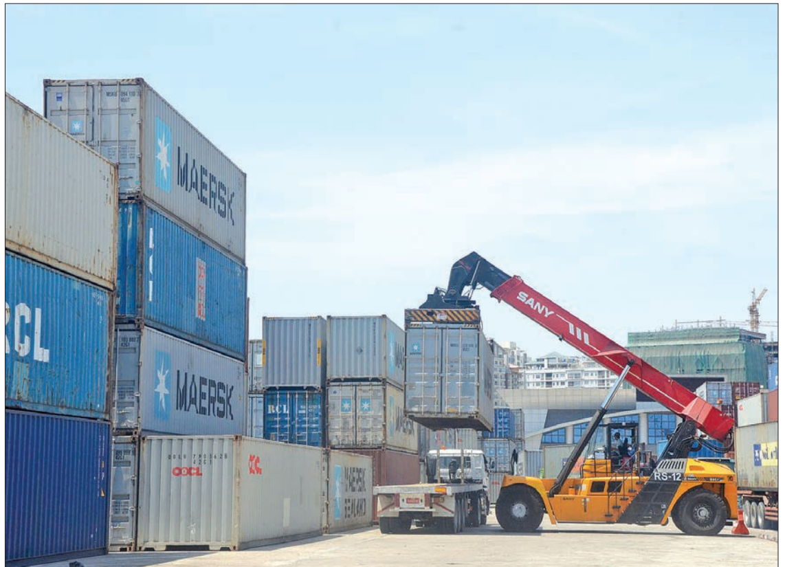
Containers seen at the Asia World Terminal in Yangon.