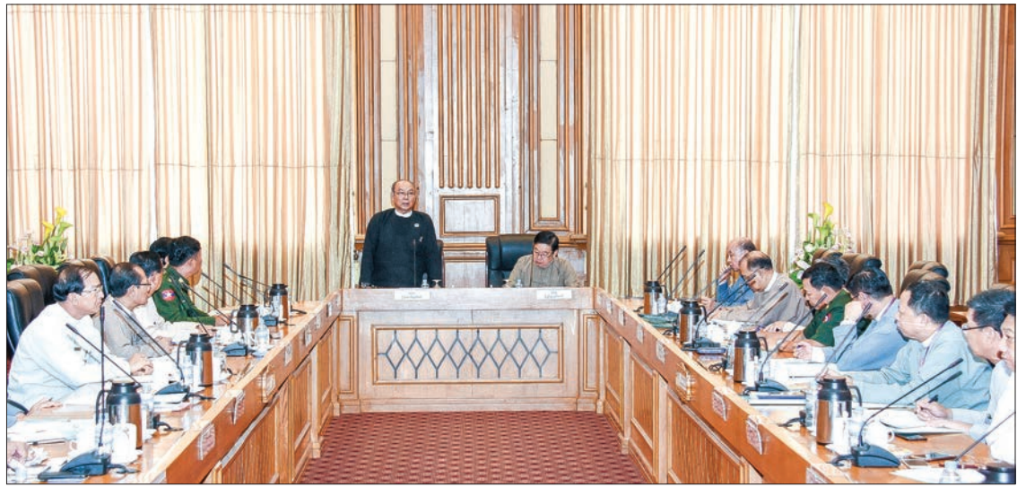
Amyotha Hluttaw Speaker Mahn Win Khaing Than delivers the speech at the coordination meeting of the central committee in Nay Pyi Taw.