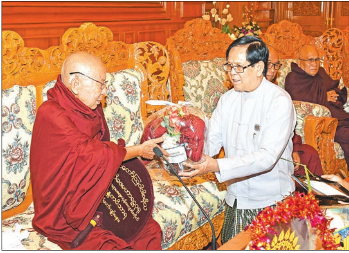
Deputy Speaker of Amyotha Hluttaw U Aye Tha Aung offering Waso robes at the Amyotha Hluttaw's office in Nay Pyi Taw yesterday.