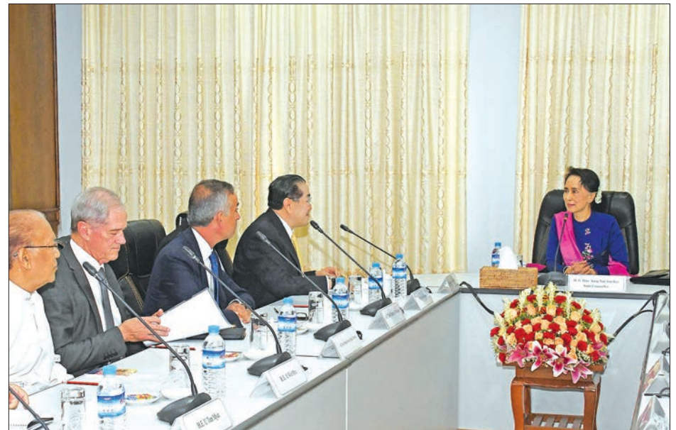
State Counsellor Daw Aung San Suu Kyi meets with Dr. Surakiart Sathirathai, Chairman of the Advisory Board for the Committee for Implementation of the Recommendations on Rakhine State, and its members in Nay Pyi Taw.

of the Memorandum of Understanding (MoU) signed between the Union Government, the UNDP and the UNHCR regarding the repatriation of displaced persons. Present at the meeting were Union Ministers U Kyaw Tint Swe, U Thaung Tun and Dr. Win Myat Aye, members of the Advisory Board for the Committee for Implementation of the Recommendations on Rakhine State and other officials.—MNA ■