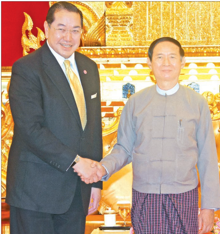
President U Win Myint welcomes Prof. Dr. Surakiart Sathirathai, Chairman of the Advisory Board for the Committee for Implementation of the Recommendations on Rakhine State, at the Presidential Palace in Nay Pyi Taw yesterday.