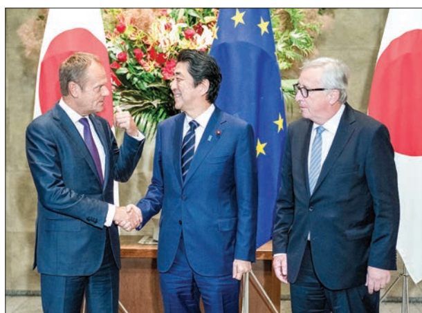
Japan's Prime Minister Shinzo Abe (c) shakes hands with European Council President Donald Tusk (l) as European Commission President Jean-Claude Juncker (r) looks on at the Prime Minister's Office in Tokyo on 17 July, 2018.

The EU — the world's biggest single market with 28 countries and 500 million people — is trying to boost alliances in the face