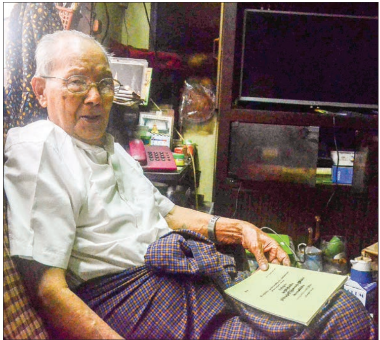
Thauk Kyar Maung Ga Lay.

After regaining independence in 1948, U Maung Ga Lay came to Yangon for the second time and joined the literary circle in 1952, putting his heart and soul in his profession. While editing a short story about Bogoyoke Aung San, Thauk Kyar Maung Ga