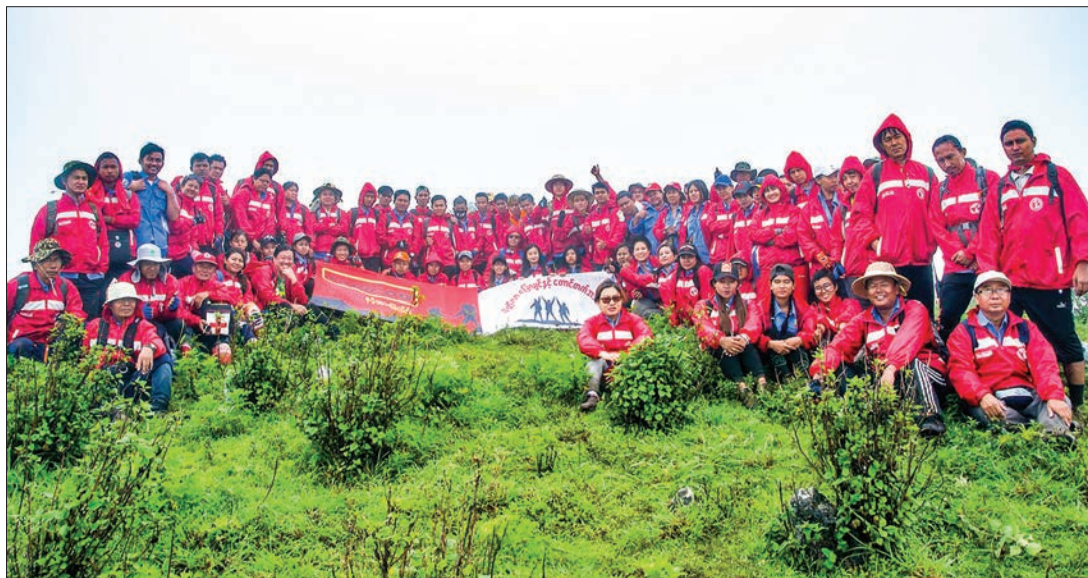
Members of Meiktila mountaineering team pose for a photo on Mt. Elephant in Thazi.

The Meiktila hiking and mountaineering team of 135