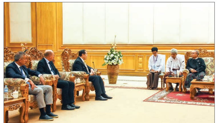
Amyotha Hluttaw Speaker Mahn Win Khaing Than meets with Chairman Dr. Surakiart Sathirathai in Nay Pyi Taw yesterday.

During the meeting, they openly discussed matters related to the work of the Advisory Board and works by the Hluttaw on Rakhine State affairs. Present at the meeting were Amyotha Hluttaw Dep-