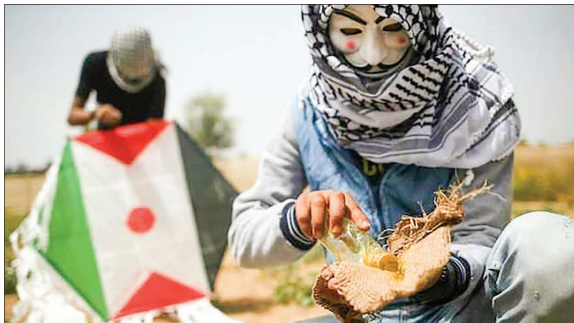
Palestinian protestors in Gaza prepare an incendiary kite before trying to fly it over the border fence with Israel on April 20, 2018.

"In light of the continued terror efforts of Hamas, Defence Minister Avigdor Lieberman has decided, after consulting with