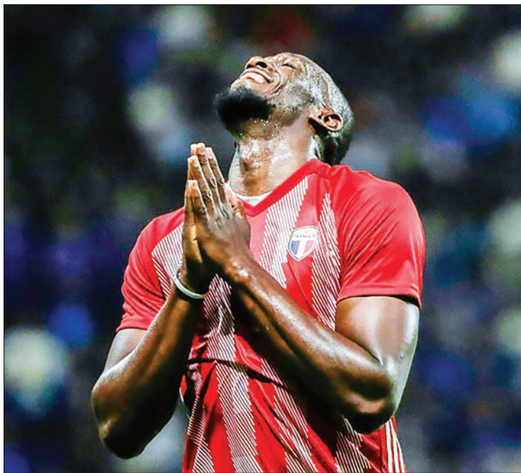
Usain Bolt is trying to launch a career in football.