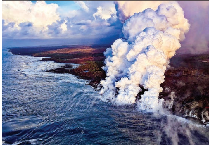
This handout photograph obtained on 16 July, 2018, courtesy of the US Geological Survey (USGS), shows laze plumes rising where lava pours into the sea on the south margin of the fissure 8 flow of the Kilauea volcano on 15 July, 2018 in Hawaii.