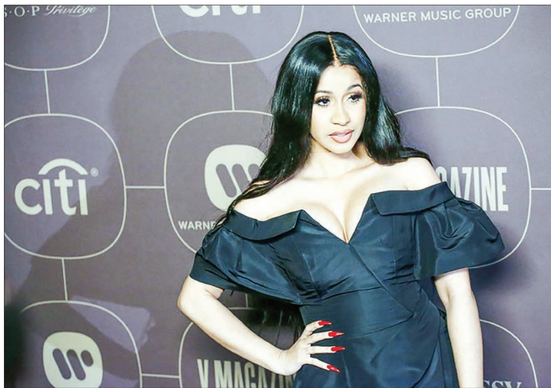
Cardi B was in the running in both hip-hop and Latin categories as well as Artist of the Year and Best New Artist.

Cardi B scored a runaway success last year with “Bodak