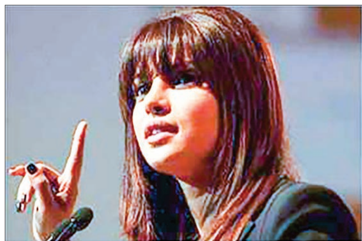
Indian star Priyanka Chopra.

Previous scenes at the VMAs have included Lady Gaga sporting a dress made of meat, Britney Spears and Madonna locking lips and Kanye West declaring his aspirations for the White House.—AFP ■