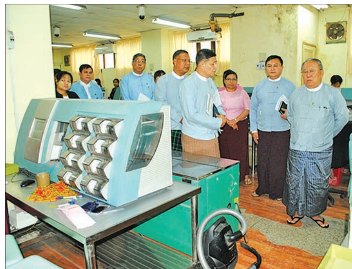
CBM Governor U Kyaw Kyaw Maung inspects Financial Institutions Supervision Department in Yangon.