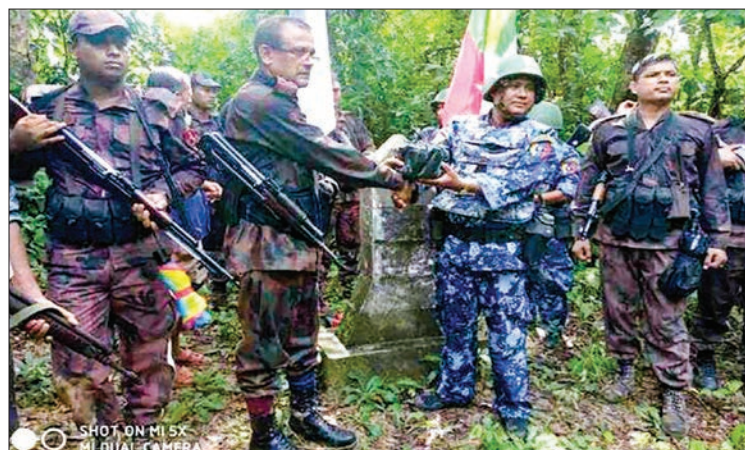
Two border guard forces of Myanmar, right, and Bangladesh, left, exchange gifts after a coordinated patrol along the border.