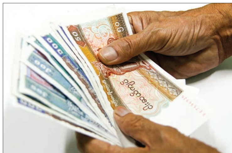
Small denominations of the Myanmar kyat.

At present, retailers need to exchange lower denominations from YBS bus owners. However, it does not provide a solution to this problem due to the high demand for small