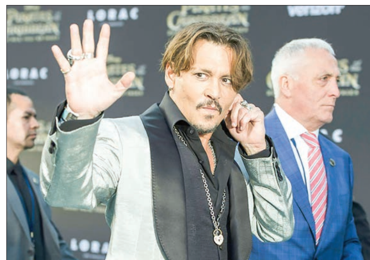
According to the magazine Rolling Stone, American actor Johnny Depp’s $650-million fortune has nearly all evaporated.

Beverly Hills-based TMG had filed a countersuit against the Oscar-nominated actor seeking unpaid fees and damages. The group alleged Depp’s lavish overspending had brought him to the edge of financial ruin, having dropped millions on a yacht, luxu-