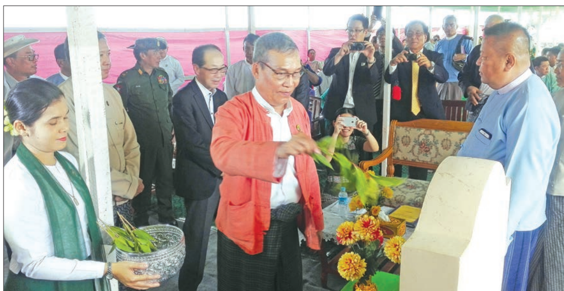
Rakhine State Chief Minister U Nyi Pu sprinkles scented water on the stone inscription of the school at the handover ceremony of new school buildings in Sittway.

The ceremony opened with Myanmar school songs sung