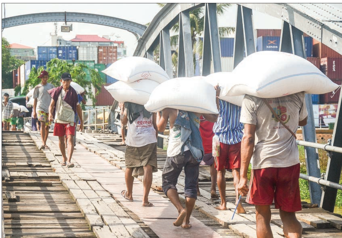
Workers carry bags of rice at the Botahtaung Jetty in Yangon on 7 June.

The Myanmar Investment Commission Notification No. 15/2017 was announced on 10 April 2017, listing nine investment businesses allowed to be carried out only by the State, 12 that are not allowed to be carried out by foreign investors, 22 allowed only in the form of joint ventures with any citizen-owned entity or any Myanmar citizen, and 126 to be carried out with the approval of relevant ministries. ■