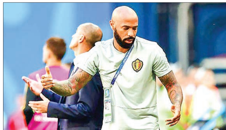
Belgium's French assistant coach Thierry Henry gestures on the sideline during their Russia 2018 World Cup play-off for third place match against England at the Saint Petersburg Stadium in Saint Petersburg on 14 July, 2018.

Cahill, known for his prodigious vertical leap and trademark goal celebration, when he uses the corner flag as a punching bag, also played for China's Shanghai Shenhua and Hangzhou Greentown.—AFP ■