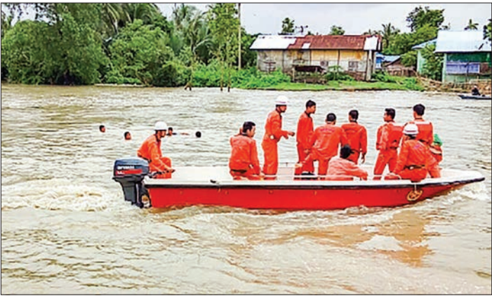
Firefighters and members of the Red Cross take part in a natural disaster preparedness drill in Mrauk U.