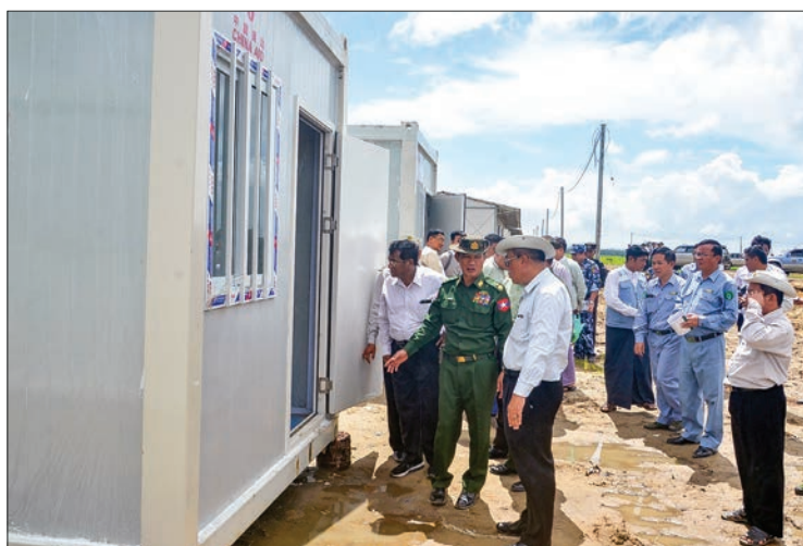
Officials inspect modular houses at Hla Phoe Khaung Transit Centre.

The group went to Kyein Chaung Taung in Maungtaw and inspected work on construction of housing projects, where they asked the progress of the construction project to be completed at a specific time. Then they continued to inspect the plots of land where 60 housing projects donated by Japan in Maungtaw would be built. After inspecting the Nga Khu Ya Reception Centre, they proceeded to the construction