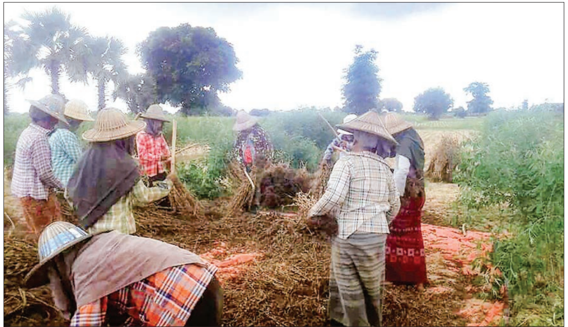
Sesame being harvested in a field.

But, residents said growers are expected to enjoy the financial benefits, as prices are high in the market due to low production. For the time being, a basket of white sesame is sold at Ks48,000 in the Magway market, while black sesame is worth Ks50,000 and red