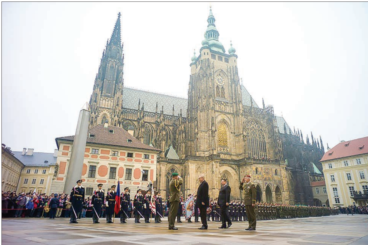
Czech churches are up in arms against Communist party plans to tax the compensation the state is paying them in return for assets seized during the Communists Cold War rule.

Their bill is likely to pass given the leverage the Communists have with the new minority government of billionaire