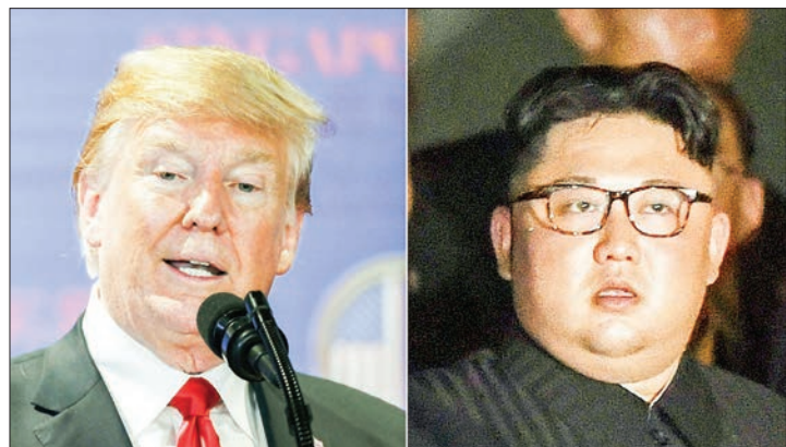
US President Donald Trump (L) and North Korean leader Kim Jong Un.

In a joint statement he signed with Trump, Kim also committed to "complete" denuclearization of the Korean Peninsula.—Kyodo News ■