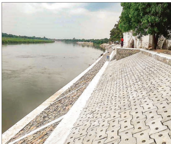
A new-design retaining wall in Amarapura Township, Mandalay.