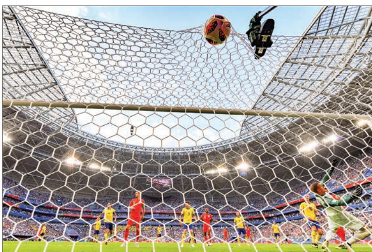
The ambitious stadium in Samara was meant to be topped by a glass dome but ran over budget and was finished in steel.

Russia's dominant leader for most of the past two decades suddenly turned serious and even emotional. The regional bosses he was lecturing via video link froze