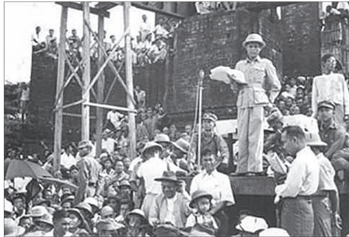
the Shwedagon Pagoda Platform”.

The writer had seen Bogoyoke Aung San twice — first, when he came to Mandalay and gave a political talk to the public, second, in a newspaper report on his “Public Address on