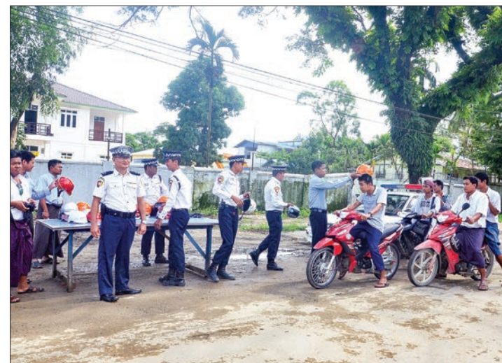
Traffic police contribute helmets to motorcyclists in Maungtaw in Rakhine State.

“Thanks a lot for giving us helmets free of charge. We, the rural people, need helmets, as motorcycles are the only mode of transportation for us for business or any other purpose. In Maungtaw, police always warn us to wear protective headgear for our own safety,” said a villager from Maungtaw Township. Yesterday alone, police gave away 100 helmets in the township, which has 3,000 motorcycle riders. ■