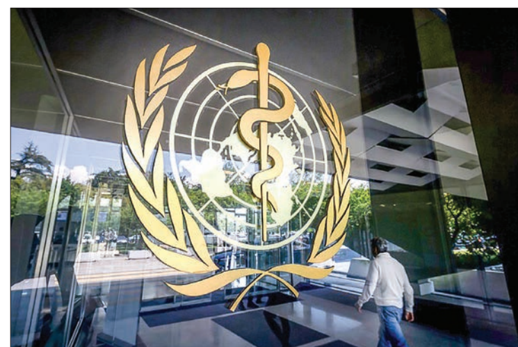
The World Health Organization (WHO) has recognised "compulsive sexual behaviour" as a mental disorder, but is still to establish whether it has an addiction component as drug abuse does.

But even without the addiction label, he said he believed the new categorisation would be