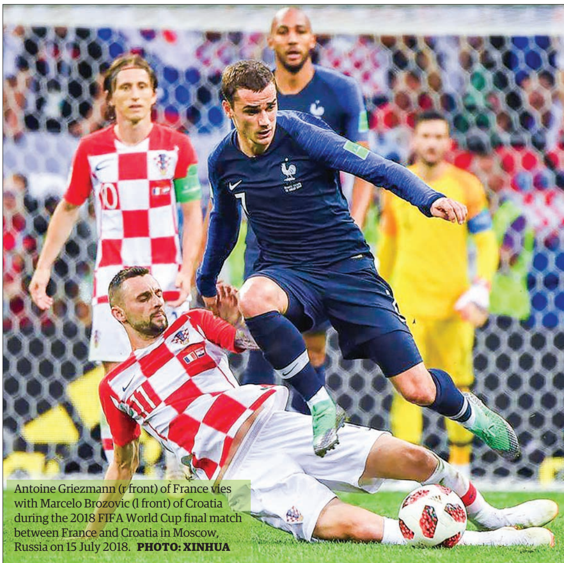
Antoine Griezmann (r front) of France vies with Marcelo Brozovic (l front) of Croatia during the 2018 FIFA World Cup final match between France and Croatia in Moscow, Russia on 15 July 2018.

Mandzukic was unlucky to flick a free kick from man of the match Griezmann into his own net after 18 minutes, although Perisic's 29 th minute left foot shot gave Croatia hope before Griezmann scored a 38 th minute penalty after the referee used the Video Assistant Referee (VAR) to determine Perisic had committed handball. France never looked completely in control against a brave Croatia side, but Mbappe was vital for the French on the break, helping set up Pogba for the third goal and then scoring the fourth from outside of the area. Mandzukic's fortunate goal gave Croatia late hope, but with Samuel Umtiti outstanding in defense France held on for their second World Cup title.—Xinhua