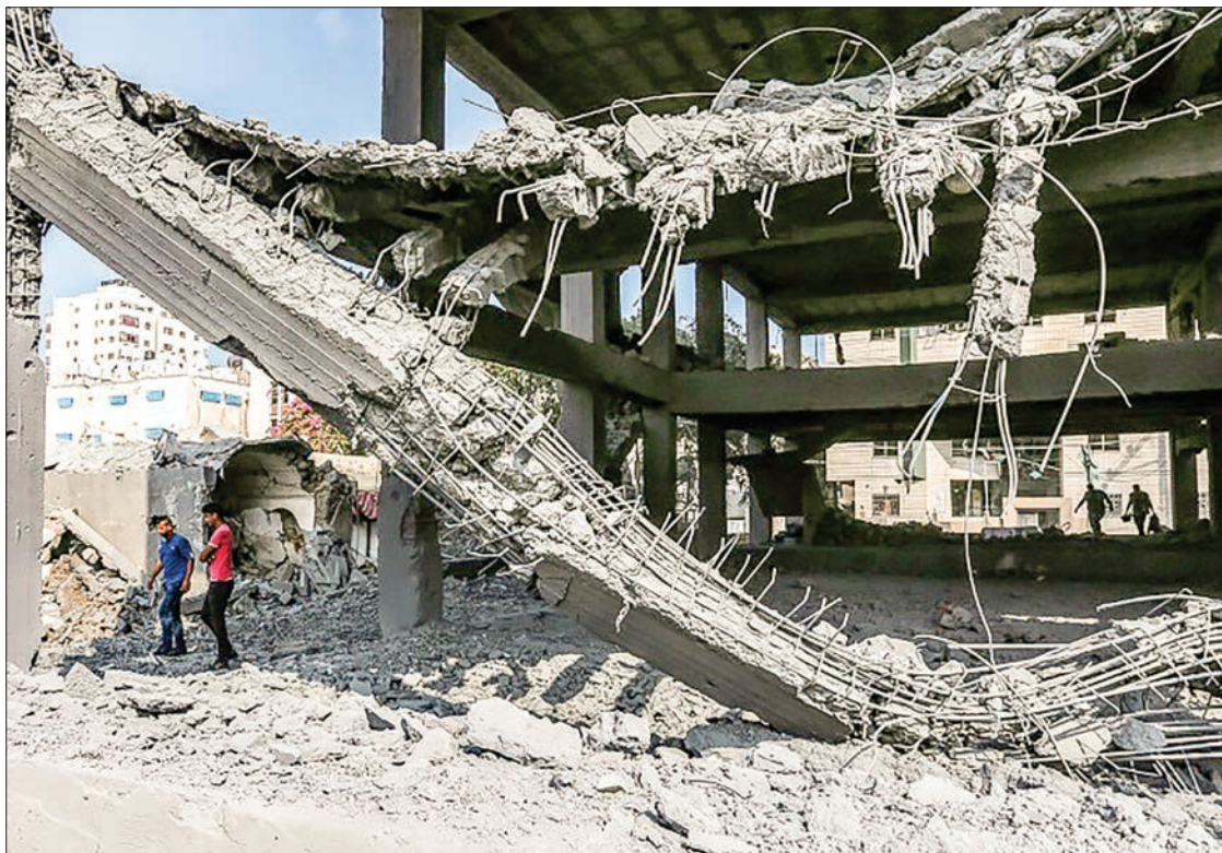
Palestinian youths walk through the wreckage of a building in Gaza City on July 15, 2018, the day after it was hit by Israeli air strikes.

Hamas said it fired at Israel in defence in response to air