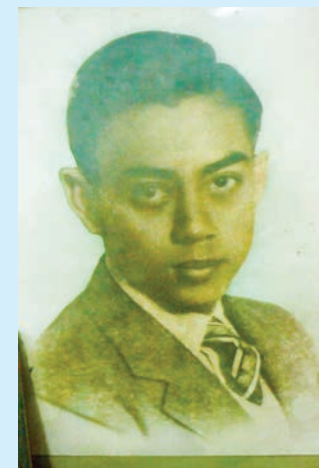
U Ohn Maung (2 February 1913 - 19 July 1947)