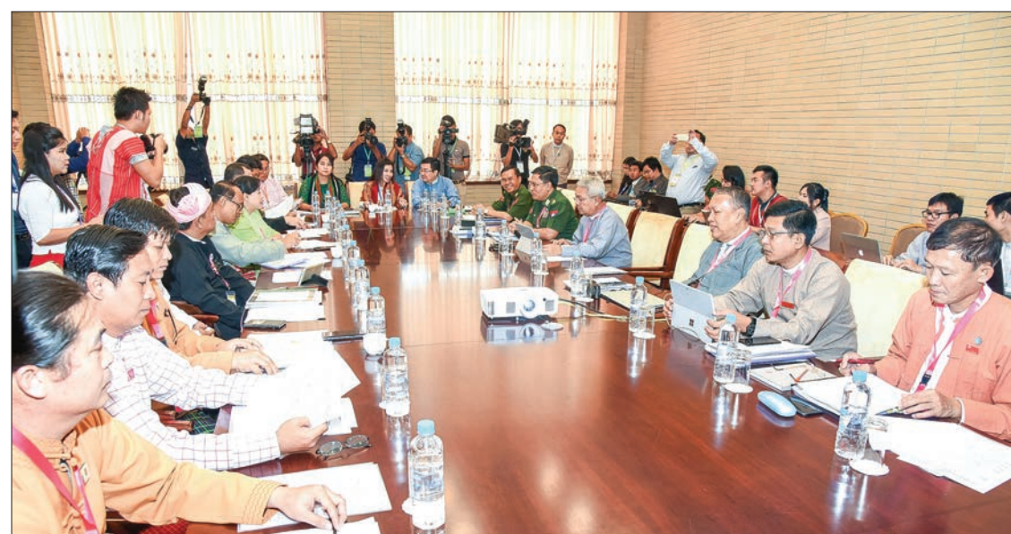
Officials taking part in the Union Peace Dialogue Joint Committee Secretariat meeting.

issues, Statement of the Union Peace Conference – 21 st Century Panglong (Third Session) and the UPDJC agendas, the last day programme of the Union Peace Conference – 21 st Century Panglong (Third Session) along with a selection of the people who will support the agreement.—Thura Zaw, Myo Myint (MNA) ■