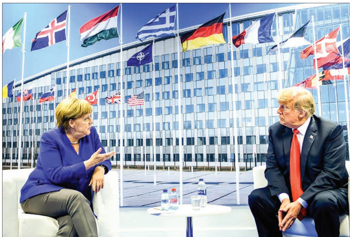
German Chancellor Angela Merkel and US President Donald Trump make a statement to the press after a bilateral meeting on the sidelines of the NATO summit.