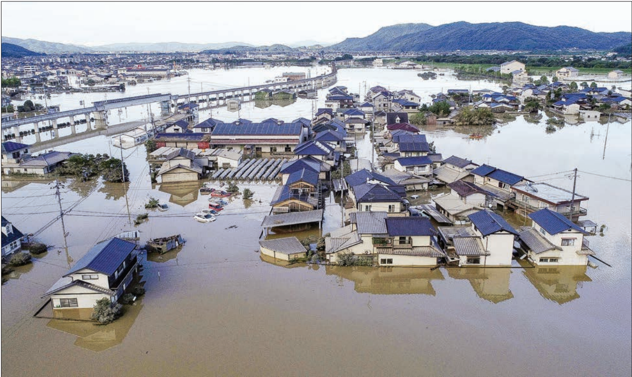
Photo taken from a drone shows a flooded area in Kurashiki, Okayama Prefecture, on 8 July 2018, following torrential rains that hit a wide area of western Japan.

The death toll from the floods and landslides caused by the torrential rains has risen to 217, ac-