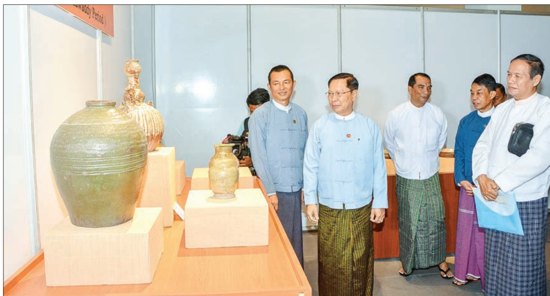
Union Minister Thura U Aung Ko observes displays at the Myanmar Traditional Glaze Art Exhibition at the National Museum in Nay Pyi Taw.

“Developed countries have designated museums as a must-visit place for youths to increase their patriotism and nationalistic fervour through historical knowledge,” said the union minister, who also elaborated on the development of museums