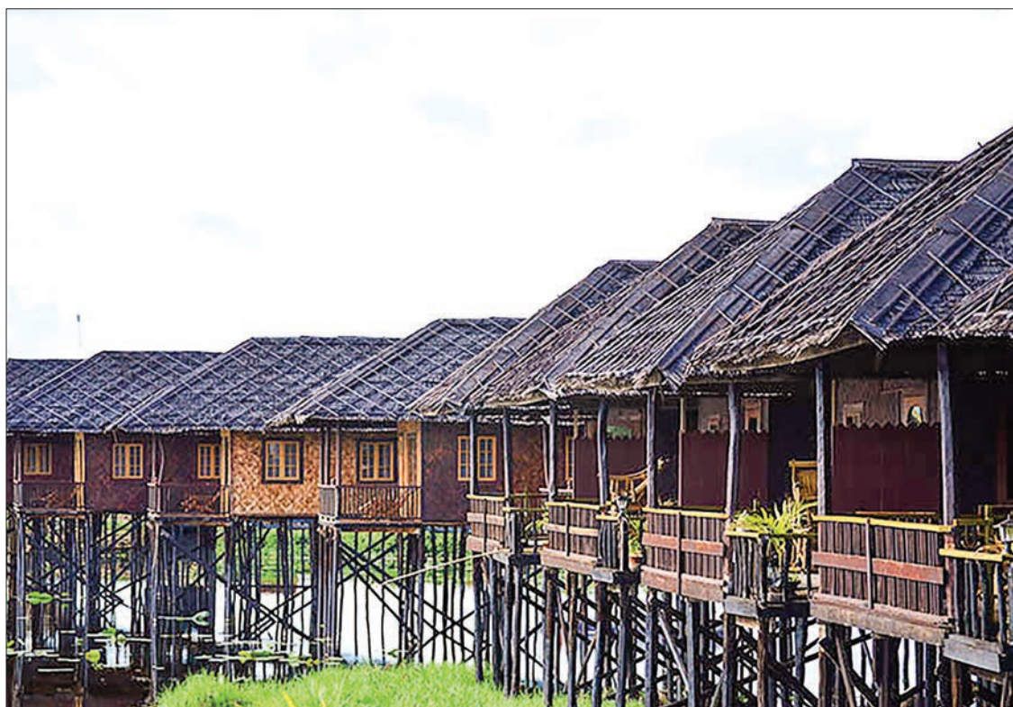
Shwe Kyun Myaw Hotel in Inle, Nyaungshwe Township, Shan State.