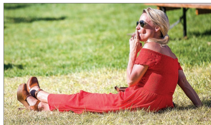
A woman at Cape Town's Met horse race, one of the richest horse races in Africa

President Thabo Mbeki's "denialism" caused life expectancy to drop from 62 years in 1994 to 52 years in 2006 as he questioned the link between HIV and AIDS and resisted a public treatment programme. Harvard researchers estimated that 330,000 people died unnecessarily. South Africa changed course in 2008 and now has largest anti-retroviral therapy programme in the world, financed