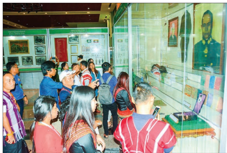
Attendees of the Union Peace Conference-21 st Century Panglong Third Session visiting the Jade Museum, the National Museum and Defence Services Museum in Nay Pyi Taw.

Next, the representatives visited the Defence Services Museum and observed former military gears and instruments,