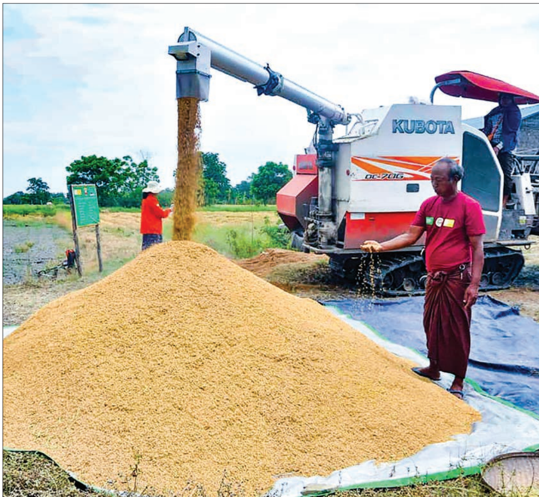
A man checks rice as summer paddy is being harvested at a field in Mandalay.

Chinese merchants are reducing the price of rice, as exported rice is sent from various townships to the Sino-Myanmar border trade channel. In addition, there is tight confiscation along the trade route, as China considers rice that exceeds the quota, as illegal. This being so, the price of rice is decreasing, said a merchant. Rice meant for export is primarily produced in Magway, Yamethin and Sagaing areas. The price of rice has decreased from Ks24,000 to Ks22,000 per bag weighing 30.75 viss (one viss equals 3.6 lb). The rice market needs to be traded through a government-to-government agreement or policy change. Nevertheless, the price of rice is likely to continue to be on the decline.—Min Htet Aung (Mandalay Sub-Printing House) ■