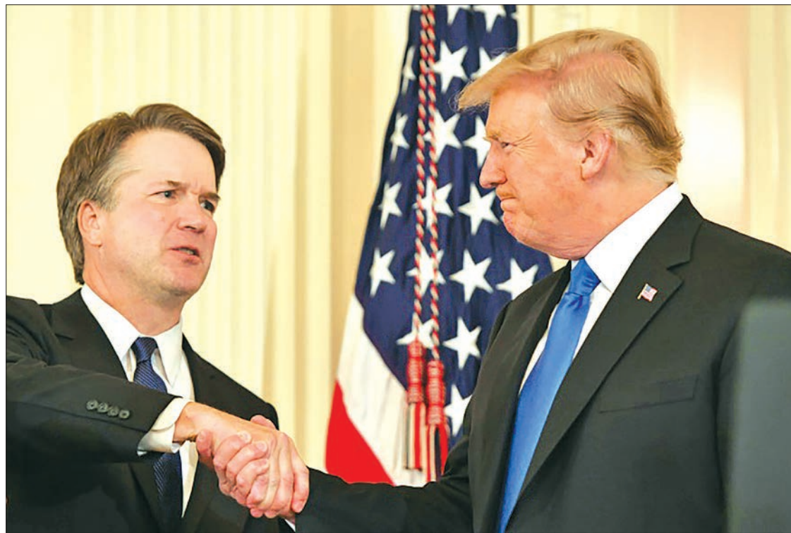
Brett Kavanaugh shakes hands with President Donald Trump after being nominated to the Supreme Court.

While conservative on firearms and election financing,