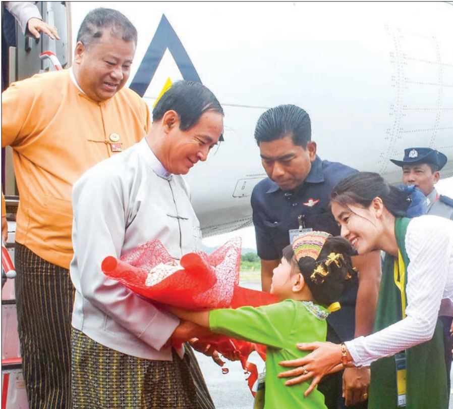
A child presents a bouquet of flowers to President U Win Myint as a welcome gesture at the Lashio Airport in northern Shan State yesterday.