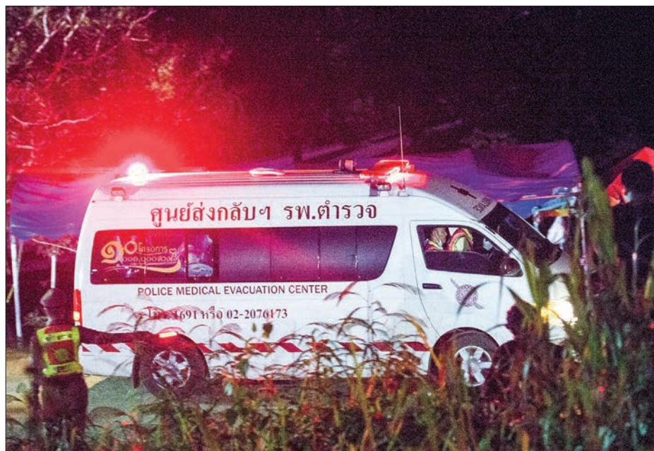
An ambulance allegedly transporting rescued members of the children's football team leaves Tham Luang cave area in Khun Nam Nang Non Forest Park in the Mae Sai district of Chiang Rai province on 10 July, 2018.

“Our thoughts and prayers are with those af-