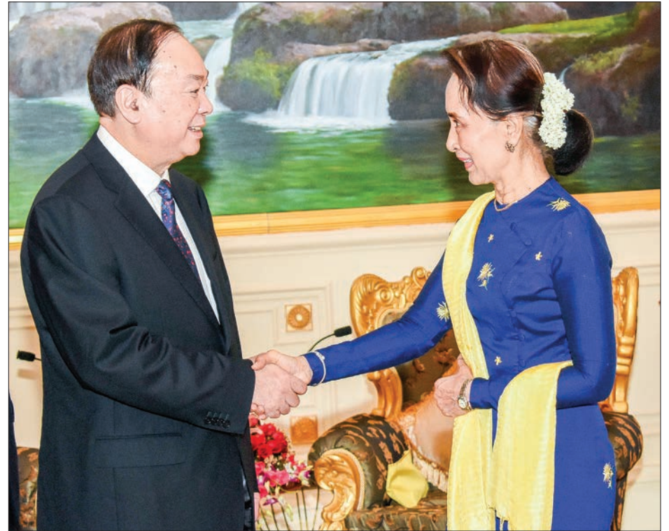
State Counsellor Daw Aung San Suu Kyi shakes hands with Mr. Huang Kunming, member of the Politburo of the Communist Party of China (CPC), in Nay Pyi Taw.