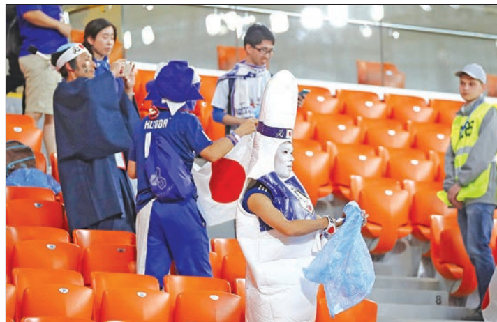
A Japanese football fan collects litter after a World Cup Group H match against Senegal on 24 June, 2018, in Ekaterinburg, Russia.

In the beginning, Japanese supporters brought blue trash bags with them because blue is the national team's color and they would use them to turn the stands blue. Gradually, however, supporters began to use them