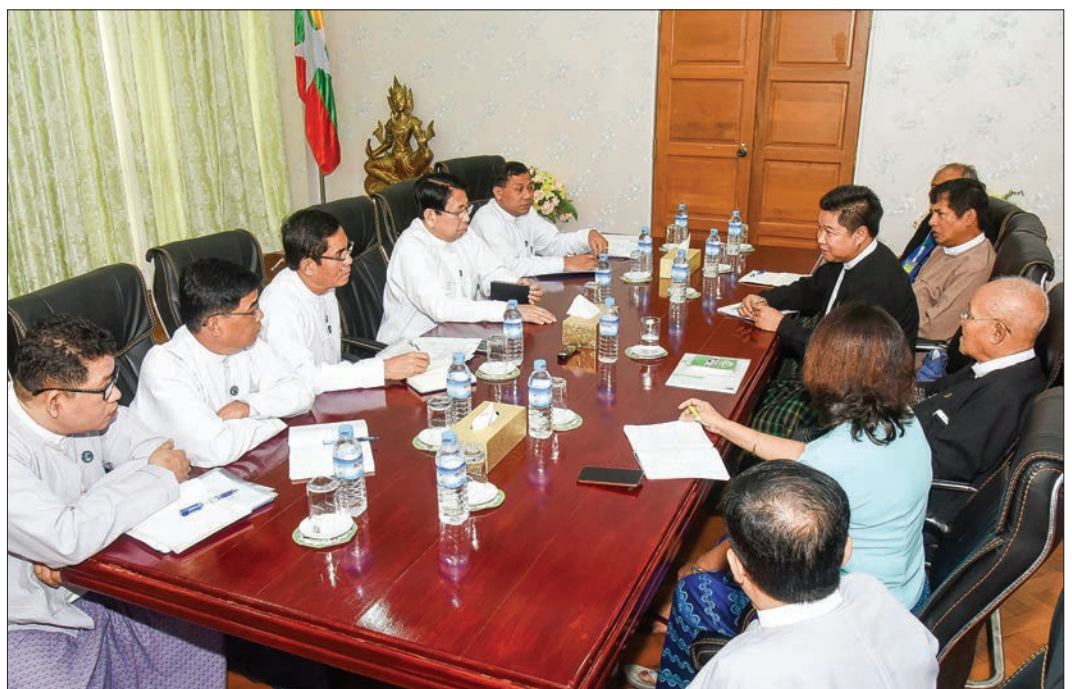
Union Minister for Information Dr. Pe Myint meets with members from the Myanmar Press Council (MPC) in Nay Pyi Taw yesterday.