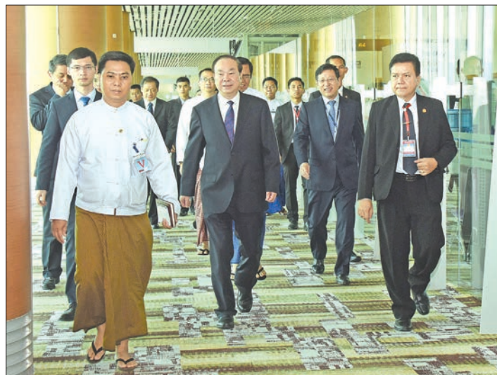
Chinese Communist Party delegation led by Mr. Huang Kunming, seen at Nay Pyi Taw International Airport before departure.

The Chinese delegation was seen off at the Nay Pyi Taw International Airport by Deputy Minister for Information U Aung Hla Tun, Chinese Ambassador to Myanmar Mr. Hong Liang, Ministry of Foreign Affairs Deputy Director-General U Aung Ko and officials.—Myanmar News Agency ■