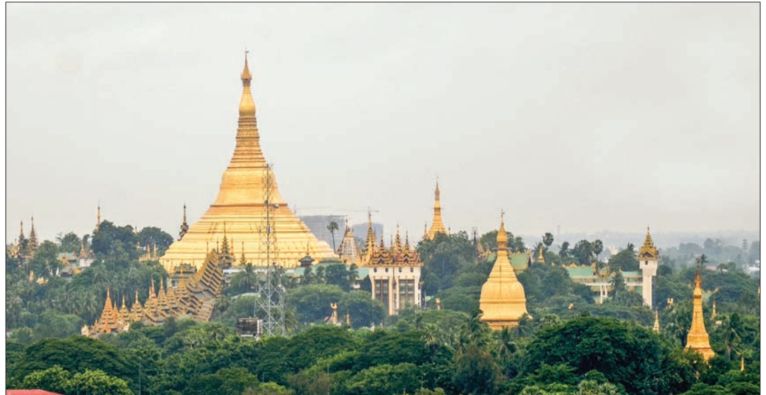
Shwedagon Pagoda is the most famous landmark of Myanmar.

The land, buildings and apartments, which had been donated under contract include a two-storey house located on 11 th Street, a two-storey house on 12 th Street, a two-storey house on Hledon Street, two ground floor apartments on Shwe Taung Dan Street, a two-storey house on Sin Oh Dan Street, all in Lanmadaw Township, a two-storey house on Htee Tan -1 Street in Kyeemyindine Township and