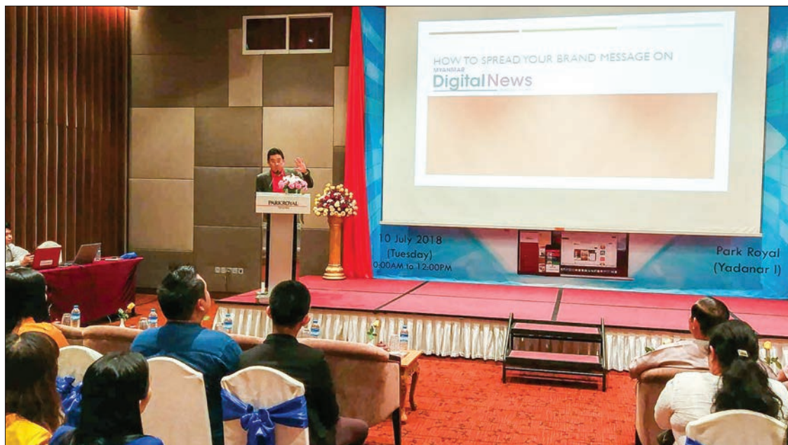
Advertising promotion for MDN's website and mobile application event held in Yangon.