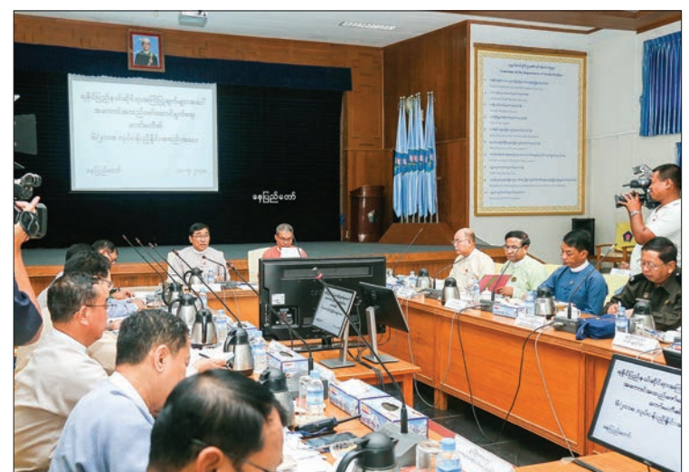
Union Minister Dr. Win Myat Aye and Rakhine State Chief Minister U Nyi Pu attend the sixth coordination meeting of Rakhine Implementation Committee in Nay Pyi Taw.

Committee Vice-Chairman and Deputy Minister for the State Counsellor's Office U Khin Maung Tin said, "Efforts are being made to increase the numbers of government staff at the IDP camps from different min-