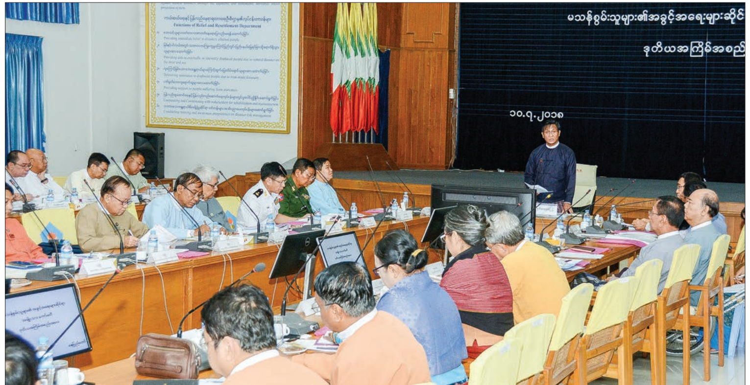
Vice President U Henry Van Thio addresses the committee's second meeting of the National Committee on the Rights of Persons with Disabilities at the Ministry of Social Welfare, Relief and Resettlement in Nay Pyi Taw yesterday.

The Vice President said if respective ministries in Myanmar can fulfill the 17 Sustainable Development Goals (SDG) set by the UN for 2015-2030, then PWDs, other vulnerable popula-