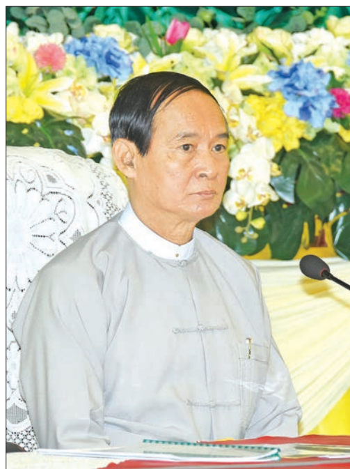
President U Win Myint attends a meeting with officials from the state government, the state high court, members of the Self-Administered Division and Zone in Lashio, Shan State, yesterday.

The President also said that policies laid down by the State should be followed in handling the matter of seized land and farms. Assessments should be