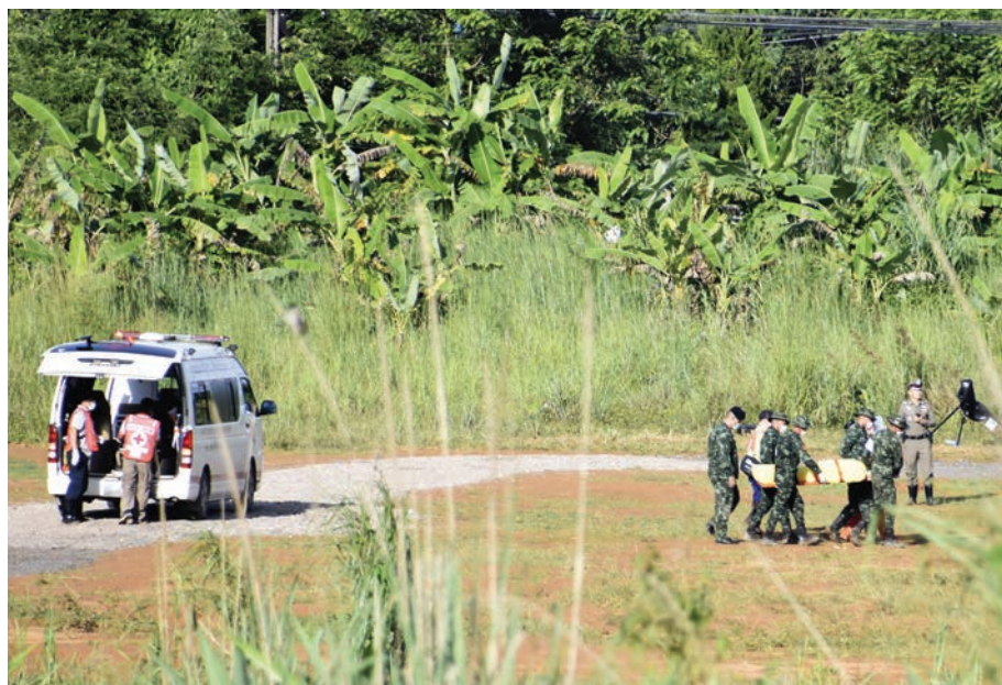
A stretcher carrying what is believed to be a fifth boy rescued from a cave in northern Thailand is carried from an ambulance parked near the Tham Luang Nang Non cave in the northern province of Chiang Rai on 9 July 2018.

He cited favorable factors for a successful rescue, including the fact