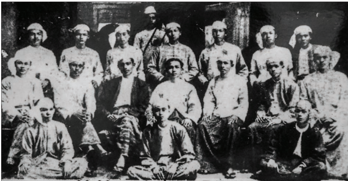
၁၉၂၀ တက္ကသိုလ်သပိတ်ကာလအတွင်း ထူထောင်ခဲ့သော ကြည့်မြင်တိုင်အမျိုးသား (နေရှင်နယ်) အထက်တန်းကျောင်း၏ ဆရာများအဖွဲ့ (ထိုင်နေသော အလယ်တန်းလက်ဝဲဘက် ဒုတိယလူမှာ ဆရာမြဖြစ်သည်)