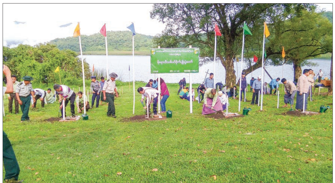
Departmental officials plant saplings in Reedhorda, a border town in Chin State.

A total of 50,000 fingerlings were released into Reed Lake by the attendees and staff from the Department of