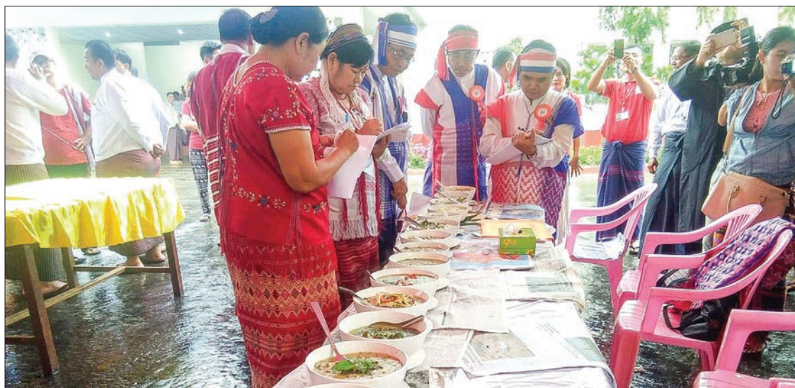
Judge take some note in the cooking arena in Hpa-an.

The ceremony concluded after the awarding ceremony. — Myo Minn San ■