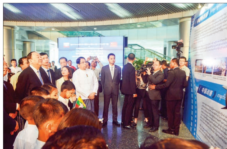
CPC Politburo member Mr. Huang Kunming and Union Minister Dr. Pe Myint attend the ceremony to launch Chinese cartoon series.

broadcast every Sunday at 9.30 am on MRTV, starting from August this year.