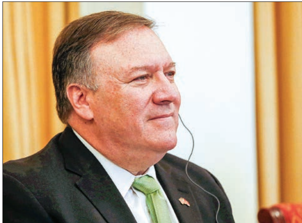
US Secretary of State Mike Pompeo.

KABUL, AFGHANISTAN — US Secretary of State Mike Pompeo made a surprise visit to Kabul Monday for talks with Afghan leaders, an Afghan official said, amid renewed optimism for peace in the war-weary country.