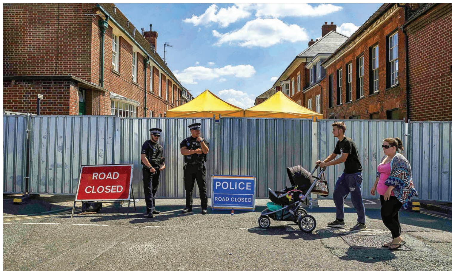
Pedestrians walk past police officers standing guard near barriers across Rolleston Street, outside the John Baker House Sanctuary Supported Living in Salisbury, southern England, on 8 July, 2018.

Police said they could not yet say whether the nerve agent