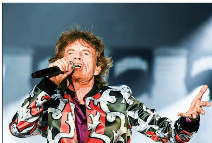
British rock star Mick Jagger of The Rolling Stones touched on Poland's controversial judicial reforms at a concert in Warsaw, after anti-communist freedom icon Lech Walesa urged the rockers to support Poles "defending freedom".

"Many people in Poland are defending freedom, but they need support. If you can say or do anything while in Poland, it would really mean something to them," Walesa, the country's first post-communist president,