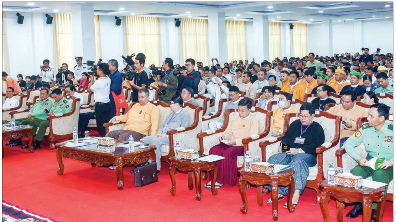
President U Win Myint meeting with officials from the administrative, legislative and judicial sectors in Shan State.