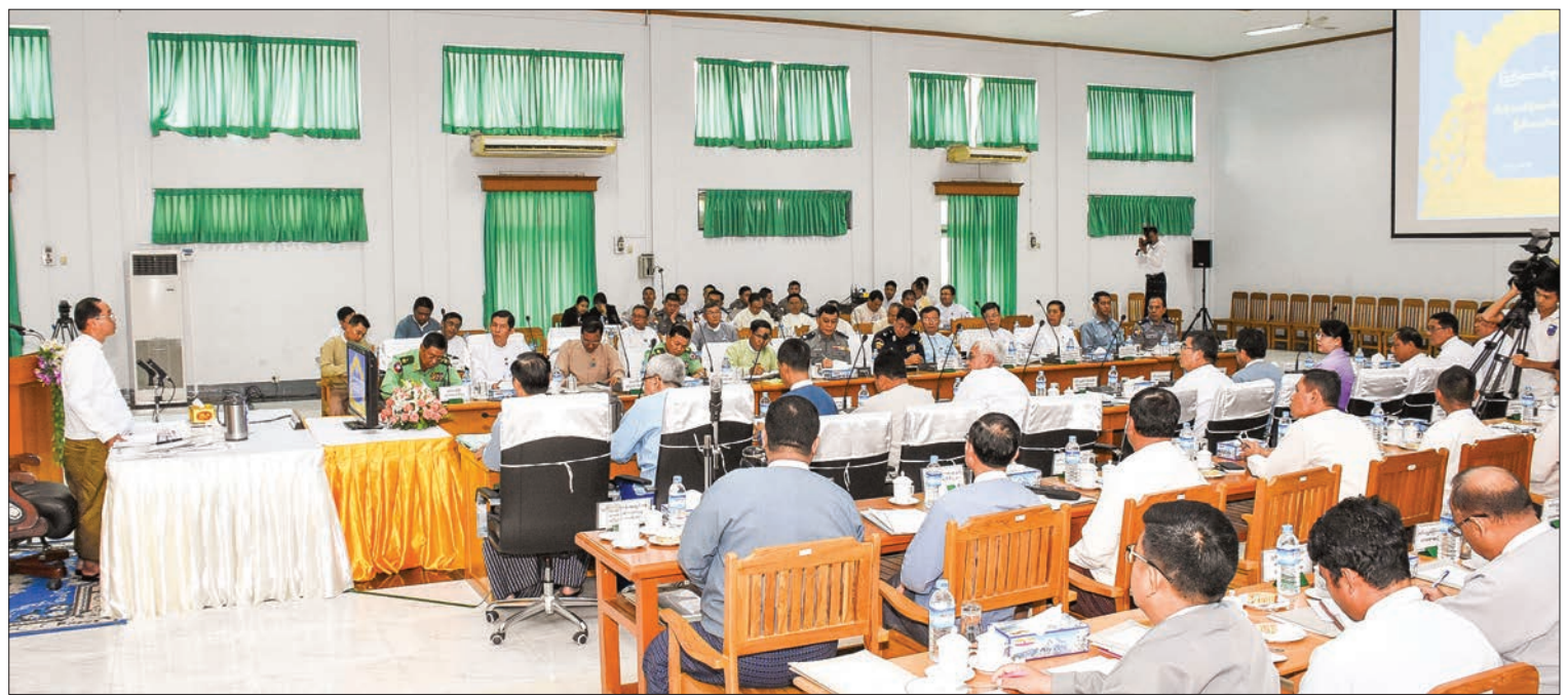
Vice President U Myint Swe delivers a speech at the coordination meeting to hold Waso-robe offering ceremony in Nay Pyi Taw.

In order to successfully implement the guidelines set by the committee and to coordinate among departments, the