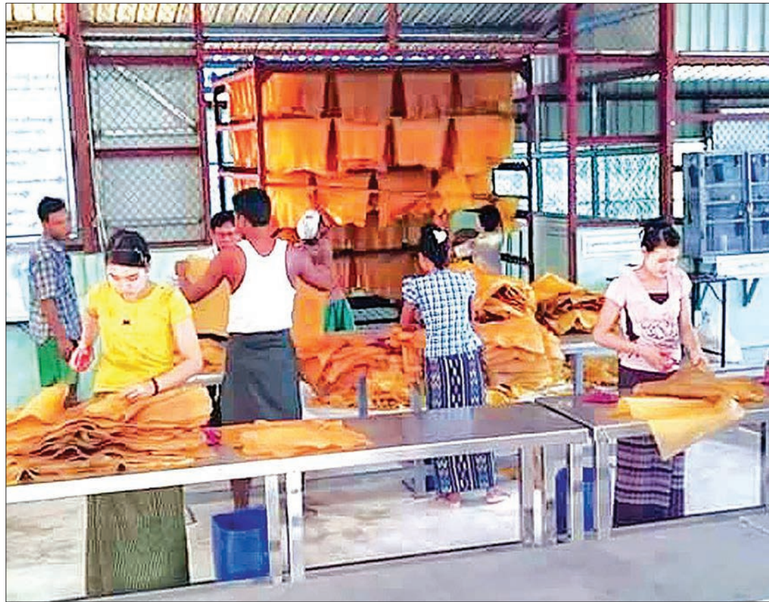
Workers inspect the quality of rubber sheets at a processing plant.

To implement group processing, rubber sellers are conducting a series of discussions, as it cannot happen with their sole efforts and they need the participation of rubber associa-