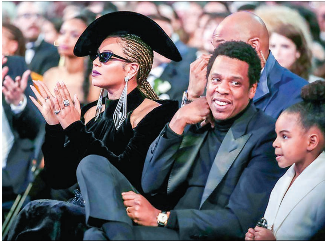
Beyonce and her husband Jay Z, pictured with their daughter Blue Ivy Carter, will headline an anti-poverty music festival in Johannesburg, South Africa.

Global Citizen has held festivals since 2012 in New York's Central Park on the sidelines of