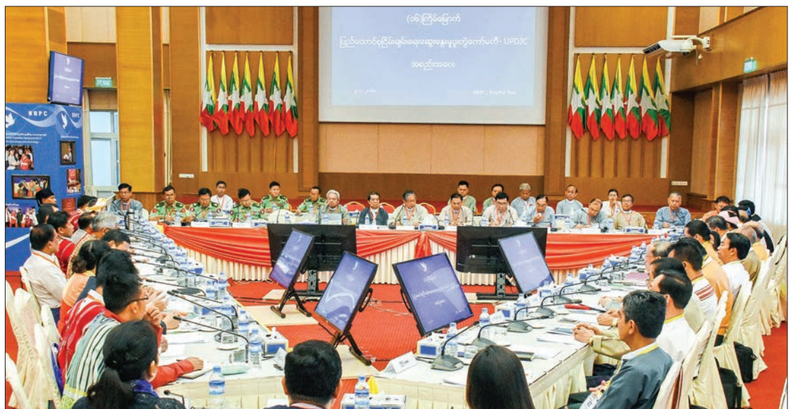
Union Peace Dialogue Joint Committee holds the meeting in preparation for the third session of the Union Peace Conference-21 st Century Panglong in Nay Pyi Taw yesterday.

He said it is important to have a political mindset that