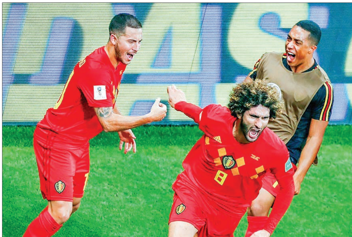
Fighting back: Eden Hazard (left) and Marouane Fellaini celebrate coming from 2-0 down to beat Japan in the World Cup last 16.

With his side clinging onto a 2-1 lead, Hazard repeatedly carried the ball forward in the dying minutes, drawing fouls to offer the Belgian backline some