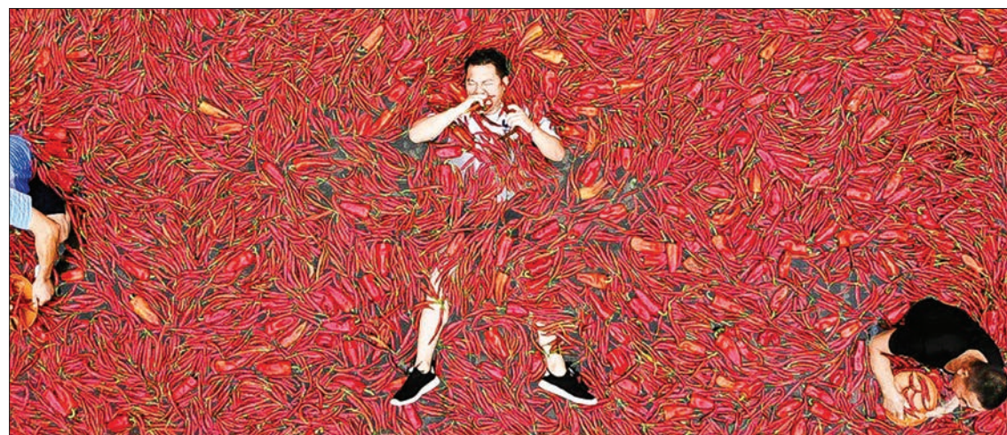
An annual chilli pepper festival kicked off Monday in central China's spice-loving Hunan province with a chilli-eating contest in which the winner set a blistering pace by downing a gut-busting 50 peppers in just over a minute.

Hunan cuisine is marked by its spicy peppers and richly coloured dishes and is considered among China's eight great food traditions along with Sichuan, Cantonese and other cuisines. The festival lasts until the end of August, with a fresh chilli-eating contest held daily. —AFP ■