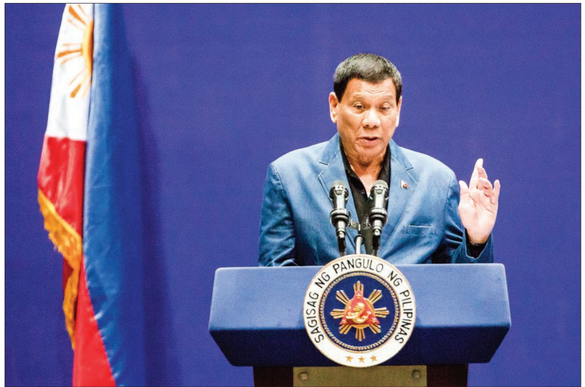
Philippines President Rodrigo Duterte.

The draft also allows the president to use “lawless vio-