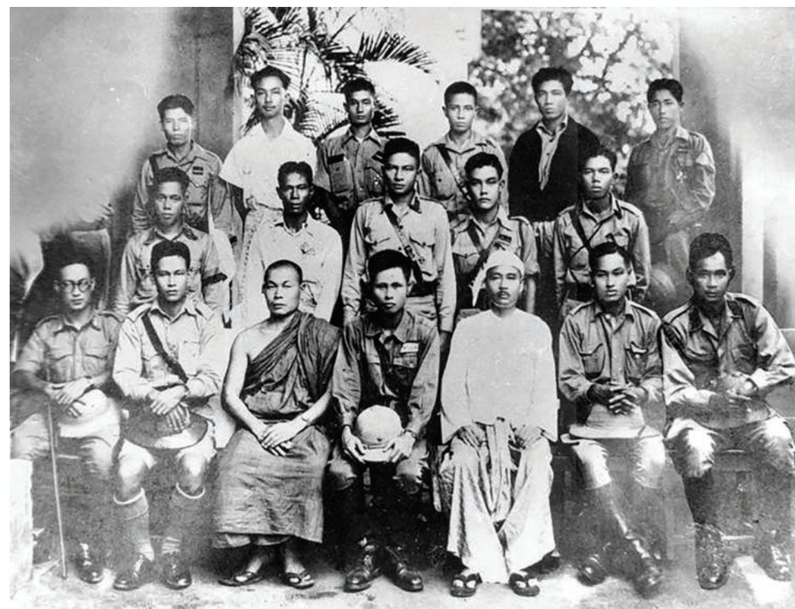
Portrait of members of the Thirty Comrades

In history, a colony is a territory under the immediate complete political control of a state, distinct