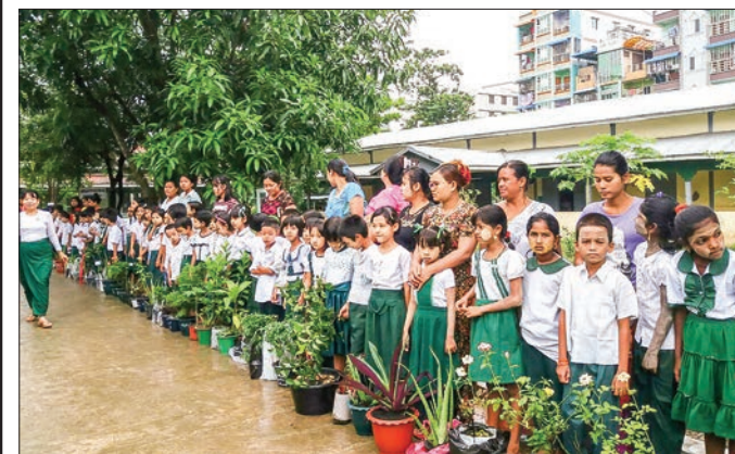
Students, parents and teachers from Dawbon Township, Yangon Region, plant various flora as commemoration of School Environment Day observed during the second week of July.