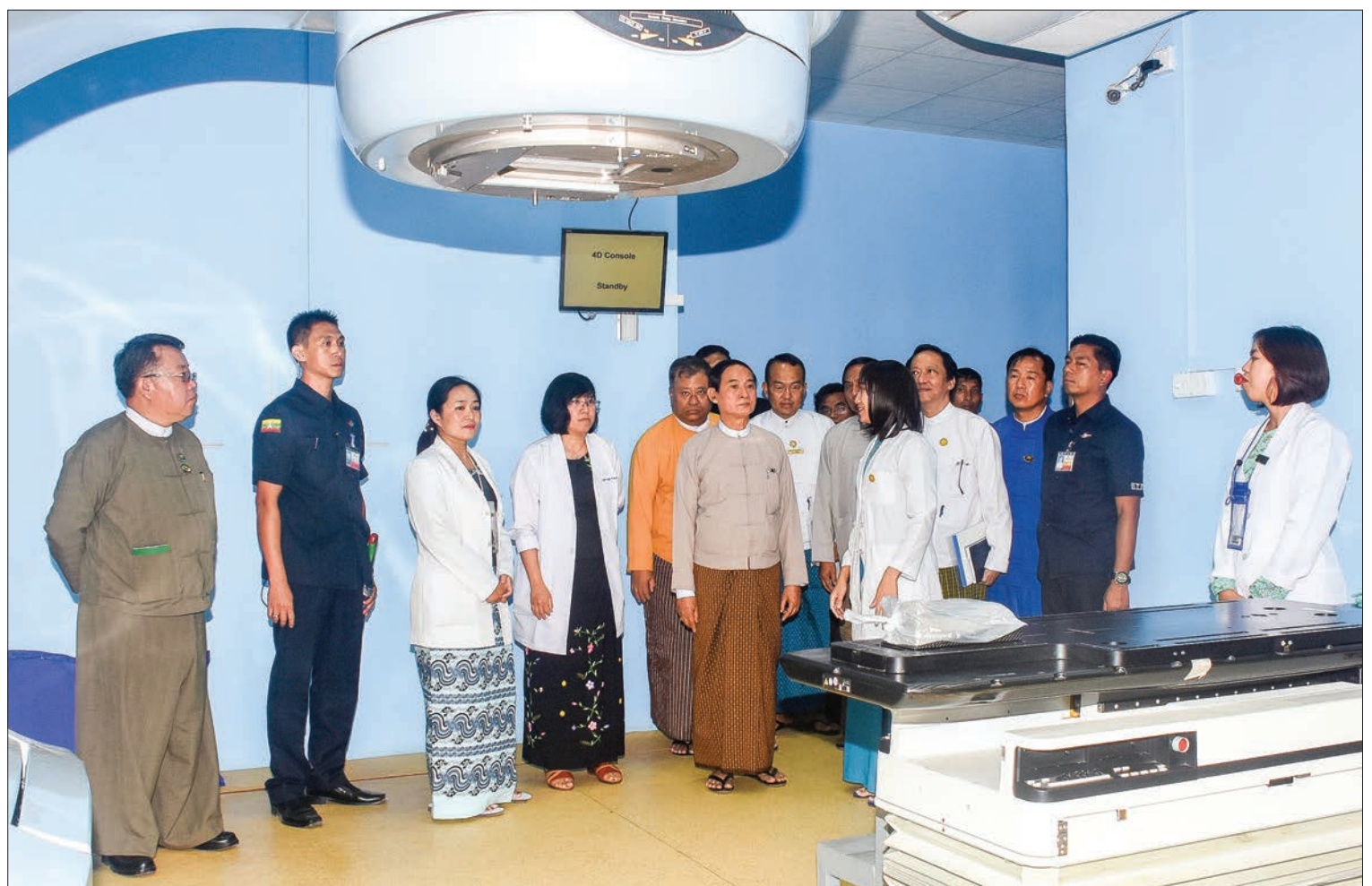
President U Win Myint visits Sao San Tun Hospital in Taunggyi during his visit to Shan State yesterday.

A rare opportunity to change and transform from an old to a new system is being realized. Only when relevant and responsible officials transform, can the transformation succeed. Officials from departmental organizations are the ones who are implement-