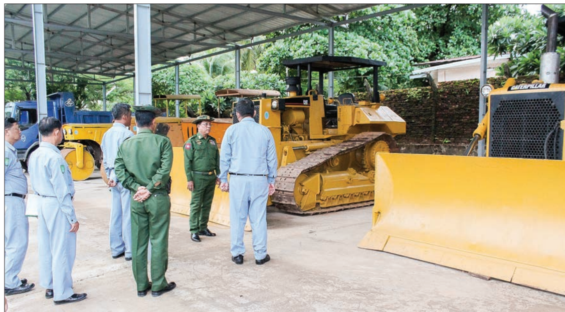
Union Minister for Border Affairs Lt-Gen Ye Aung instructs requirements to the officials.

UNION Minister for Border Affairs Lt-Gen Ye Aung travelled to Mon State on 5 July and was welcomed by Mon State Minister for Security and Border Affairs Col. Win Naing Oo.