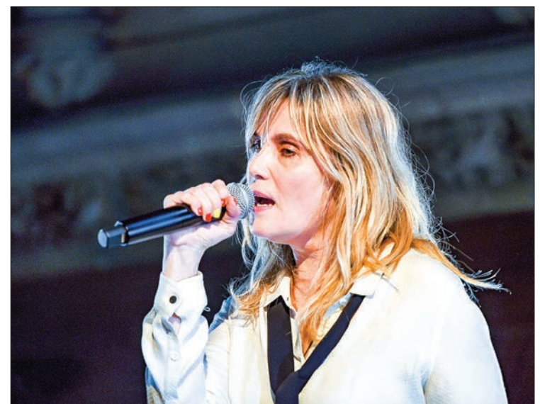
French actress and singer Emmanuelle Seigner rejected an invitation to join the body that awards the Oscars in protest at its decision to expel her husband Roman Polanski.

According to court documents, Polanski was promised by the judge overseeing the case that the seven weeks he spent in custody would be the only time he would serve.