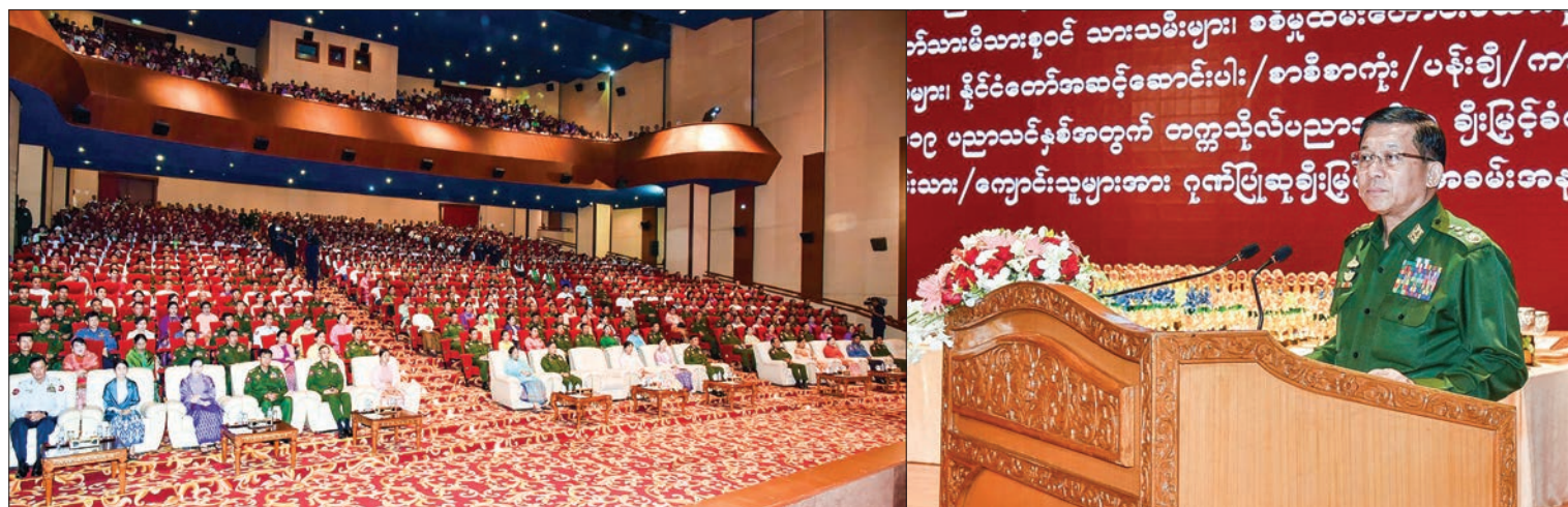
Commander-in-Chief of Defence Services Senior General Min Aung Hlaing addresses the audience at a ceremony honouring soldiers and children of Tatmadaw families who passed the 2017-2018 matriculation examination held in Zeyathiri Beikman in Nay Pyi Taw yesterday.