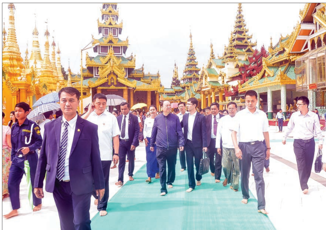
Mr. Huang Kunming, member of the Politburo of the Communist Party of China (CPC), center, and his delegation tour the Shwedagon Pagoda.

Later, the Chinese delegation paid homage to the Jade Buddha image and Sacred Buddha's Tooth Relic and later went