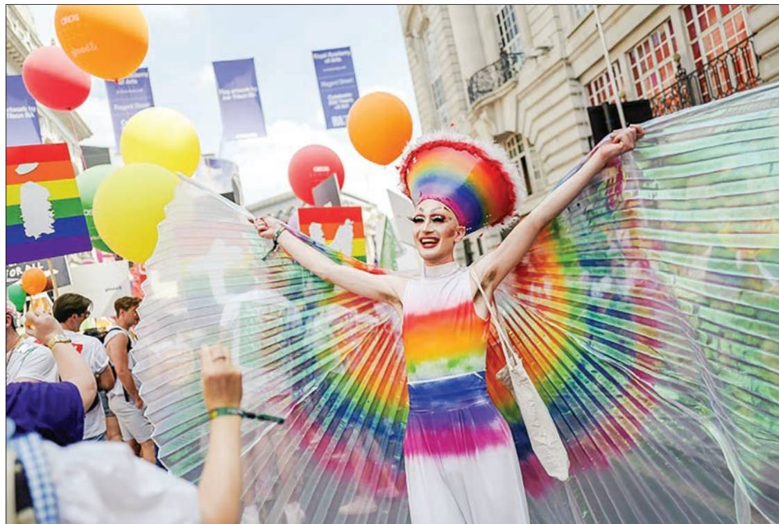
Prime Minister Theresa May has vowed to ban the practice of conversion therapy in an announcement timed with this weekend’s Pride events.

“We went to the doctor and the doctor told me there was