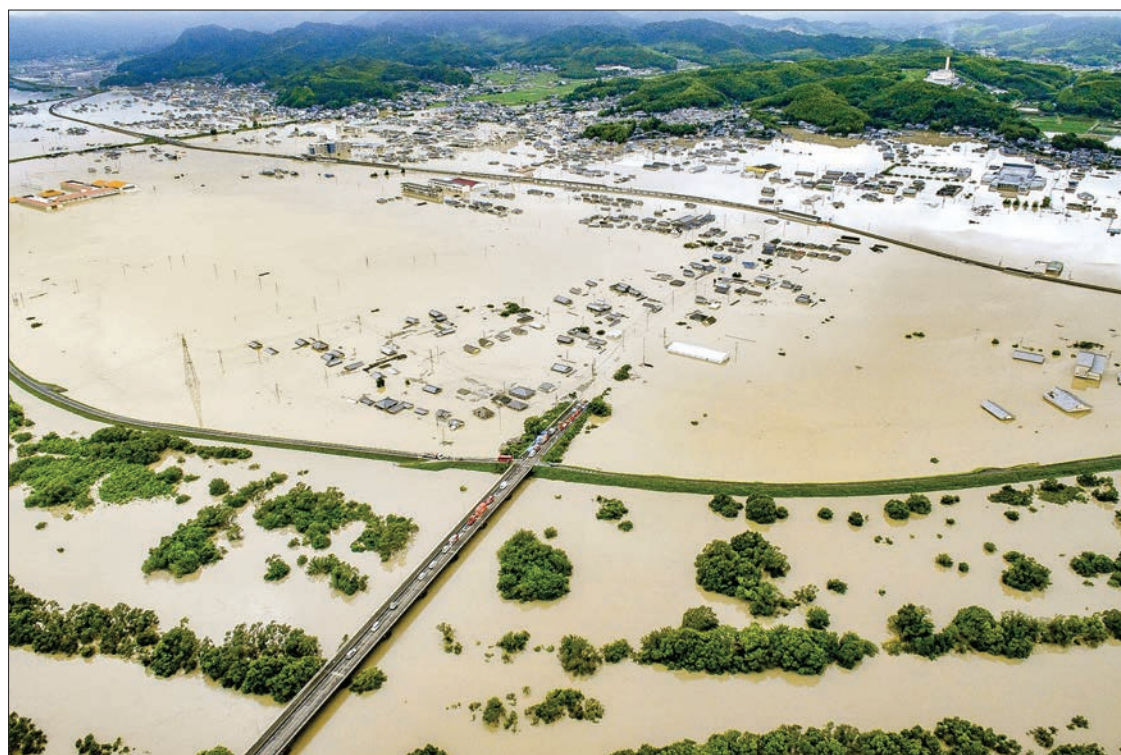
Photo taken from a Kyodo News helicopter on 7 July 2018 shows a town in Kurashiki, Okayama Prefecture, with extensive flooding following torrential rains that hit a wide area of western Japan.

In Okayama Prefecture, one of the hardest-hit areas, about 1,850 people, mostly trapped on the roofs of buildings sub-