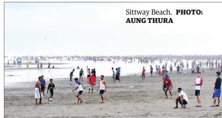
Sittway Beach. PHOTO: AUNG THURA

Along the strand road and beach in Sittway Township, thousands of people exercise, walk and run in the mornings. They also play football in the evenings, especially on weekends and public holidays. — Aung Thura/ Han Lin Naing