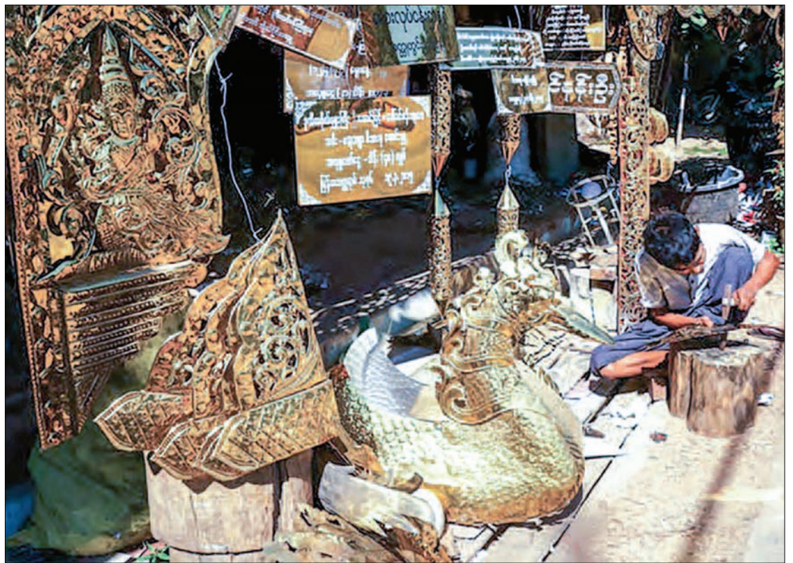
A worker creates a traditional floral design for a religious edifice.

THE Myanmar Arts and Crafts Association (MACA) requested the government to set up a handicrafts centre or construct a handicraft village so that shops and workshops can all be arranged in one place, said U Thardu, chair of the association, at a recent meeting between Vice President U Myint Swe and the businessmen.