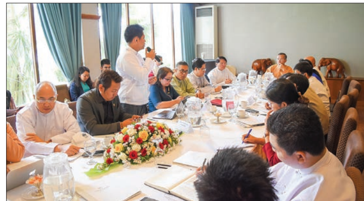
Officials discuss at the coordination meeting for tourism held at Inya Lake Hotel in Yangon.