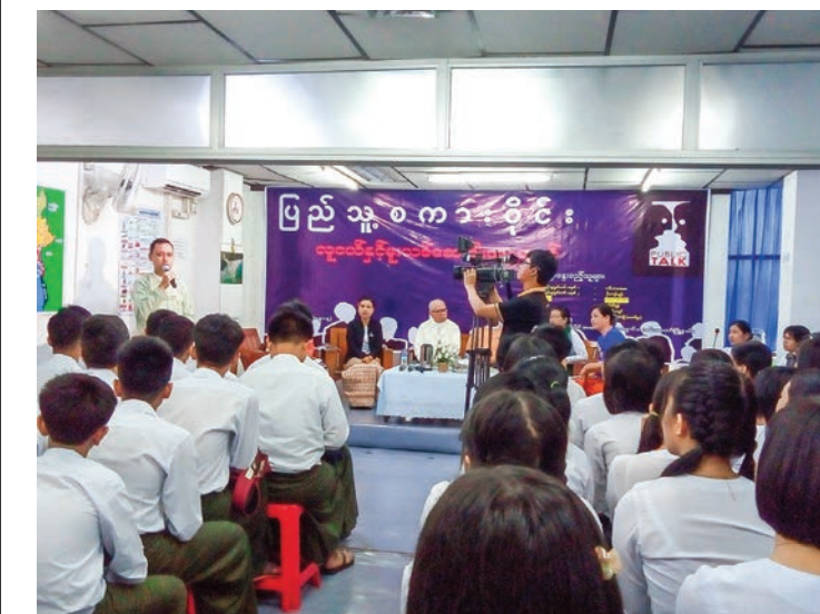
Knowledge being shared on the dangers of narcotic drugs.

Officials answered the questions raised by attendees. Authorities from Lanmadaw Township, civil social organisations, guests and students attended the talk. — Aung Myint(IPRD) ■