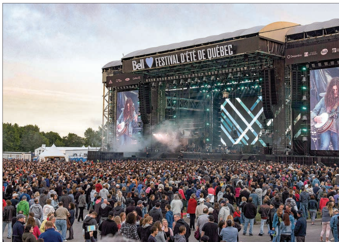
The crowd at Quebec's Festival d'été de Québec watching rocker Kurt Vile on the huge stage in the Plains of Abraham park.

He kicked off with his 1982 song "Like an Inca," with 10 minutes' worth of crackling guitars setting the tone for the evening.