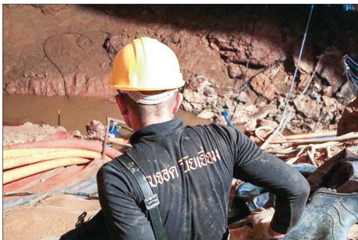
The first six boys trapped in a flooded Thai cave have been rescued.

The group became trapped in a cramped chamber deep in