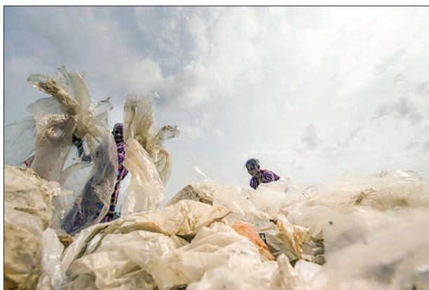
Despite the war on plastic bags, they are still a huge problem for the environment.

Here are a few things to know about the world of plastic.