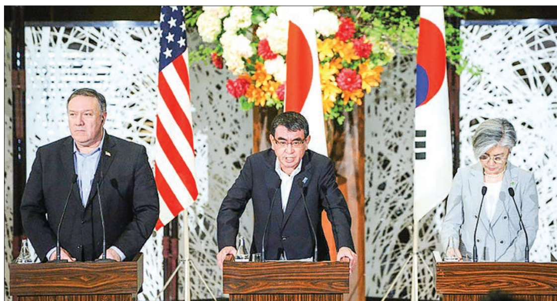
Pompeo briefed his Japanese and South Korean counterparts on the talks, and sought to reassure them that the dialogue with North Korea would continue.

peted a denuclearisation goal, but one that it sees as a lengthy process of undefined multilateral disarmament on the entire Korean peninsula, rather than a unilateral dismantlement of its nuclear arsenal.