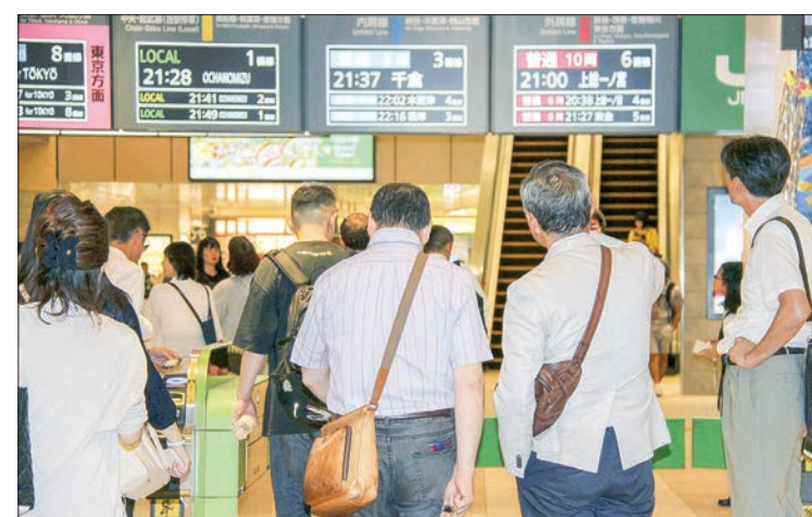
People face train delays at JR Chiba Station on 7 July 2018 following an earthquake with a preliminary magnitude of 6.0 that rattled eastern Japan, including Tokyo, earlier in the day.

TOKYO — An earthquake with a preliminary magnitude of 6.0 rattled eastern Japan, including Tokyo, on Saturday evening, the Japan Meteorological Agency said. No tsunami warning was issued. There were no immediate reports of casualties or damage from the 8:23 pm quake, which registered lower 5 on the Japanese seismic intensity scale of 7 in eastern Chiba Prefecture and caused some buildings in central