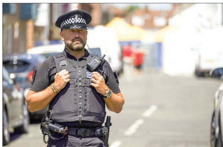
A police officer stands guard at a cordon near Rollestone Street in Salisbury, southern England.

Amesbury is not far from the city of Salisbury where a former Russian spy, Sergei Skripal, and his daughter were poisoned by the same type of nerve agent in