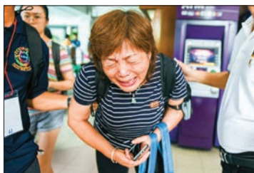
Recovery divers have pulled 42 bodies from the sea off the resort island of Phuket, but authorities have said 14 other passengers remain unaccounted for.

wiped back tears in a waiting area of the Vachira Hospital on Sunday while several got increasingly agitated when asked for further information.