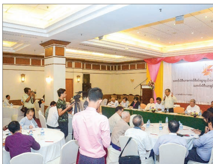
U Thiha Saw, Chairman of election committee, addresses attendants at the press meet on electing new members for the Myanmar Press Council, held in Summit Park View Hotel in Yangon.

In the afternoon, they went shopping at the Bogoyoke Aung San market. The guests flew from Yangon to Nay Pyi Taw in the evening where they were welcomed by Deputy Minister for Information U Aung Hla Tun and officials at Nay Pyi Taw International Airport. —Myanmar News Agency ■