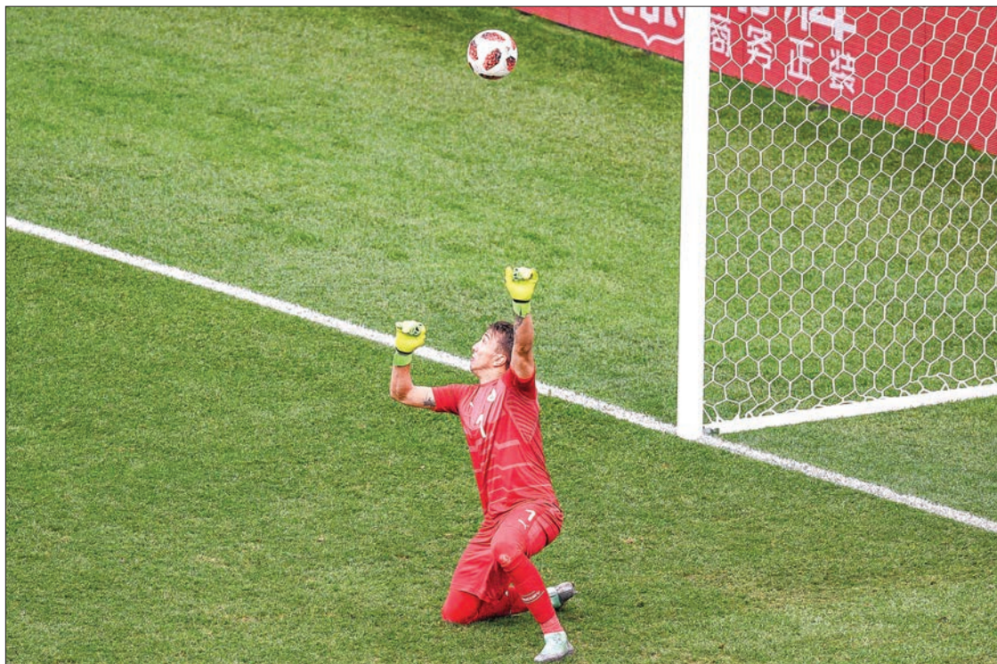
Fernando Muslera made a terrible misjudgement to hand France their second goal.

goal of this World Cup, but his first not from a penalty.