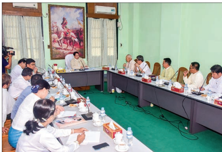
Union Minister Dr. Pe Myint addresses the coordination meeting yesterday.

At the meeting, Union Minister for Information Dr. Pe Myint said efforts should