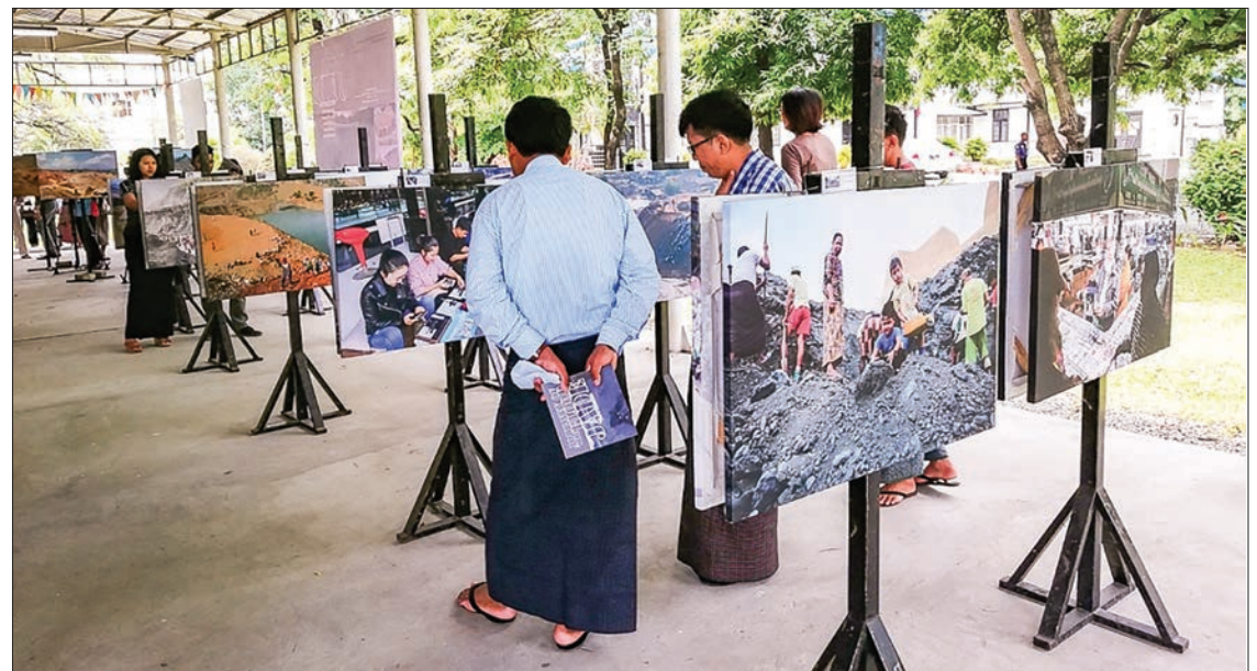
Guests at the Mandalay photo exhibition.

The photographs depict the life of jade workers, jade fields and excavation sites