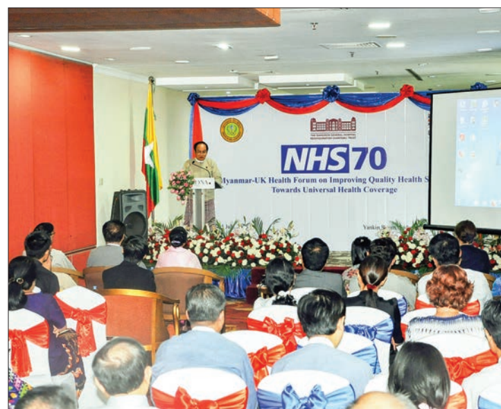
Union Minister Dr. Myint Htwe delivers the speech at 70 th anniversary celebration of the British National Health Services at Sedona Hotel in Yangon.

Moreover, £97 million for the Access to Health Fund and bringing UK expertise will also be supported during the five-year period from 2019 to 2023. — Myanmar News Agency ■