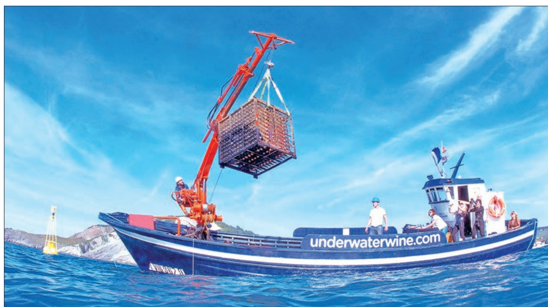
Spain's Crusoe Treasure lowers cages loaded with bottles of wine into the sea where they remain to age in what has become a growing niche market.

Crusoe Treasure expects to sell 30,000 bottles of red and white wine this year, up from just 7,000 in 2017. The prices of its wines start at 58 euros ($67.50)