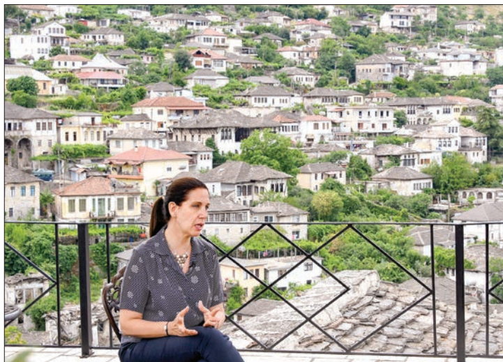
Albanian Culture Minister Mirela Kumbaro insists Gjirokastra "is no longer in danger" and that the government has taken the problem in hand.

"It was surely the only place in the world where, if you slipped and fell in the street, you