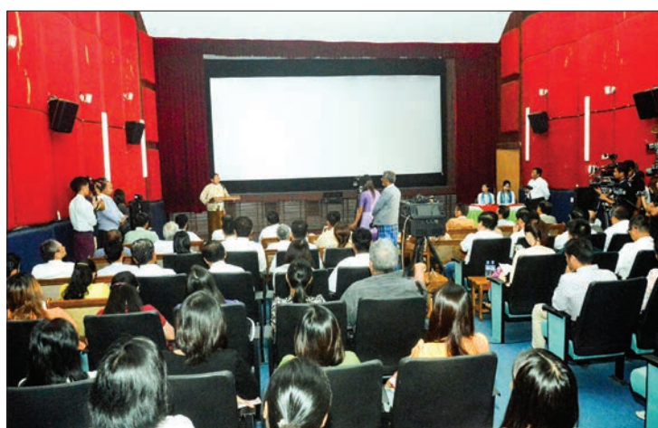
Union Minister Dr. Pe Myint gives some instructions for a film studio project in Nay Pyi Taw yesterday.

High quality products of the motion industry can attract the interest of local people and neighbouring countries as well, and the country's image can be