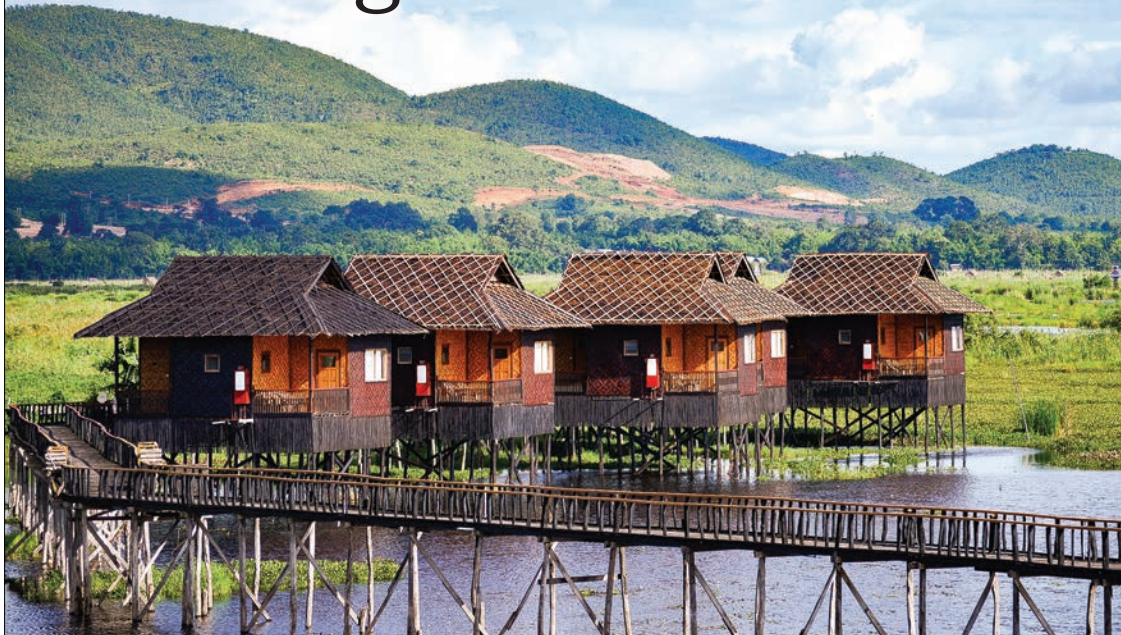
Shwe Kyun Myaw Hotel in Inle, Nyaungshwe Township, Shan State.

A total of 1,666 licensed hotels, motels, guesthouses and inns are operating in Myanmar, as of the end of June, offering 66,913 rooms, according to statistics provided by the Ministry of Hotels and Tourism.