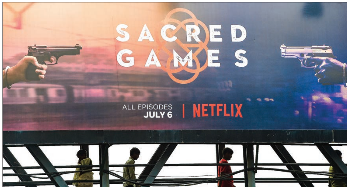
Indian commuters walk below a poster of "Sacred Games", the Indian series on Netflix, in Mumbai.