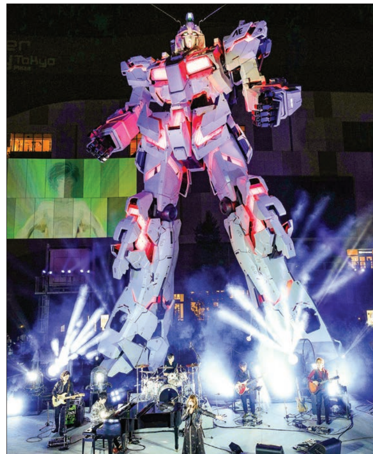
A statue of the Unicorn Gundam robot from the "Mobile Suit Gundam Unicorn" anime series is unveiled in Tokyo's Odaiba waterfront area on 23 September, 2017. The 19.7-meter-tall statue, weighing 49 tons, transformed itself into the Unicorn Gundam Destroy Mode, as it does in the anime.

Hollywood production company Legendary, whose films include "Godzilla" and "Pacific Rim," is currently producing another live-action movie, "Detective Pikachu," based on Japanese animated series Pokemon. — Kyodo News ■