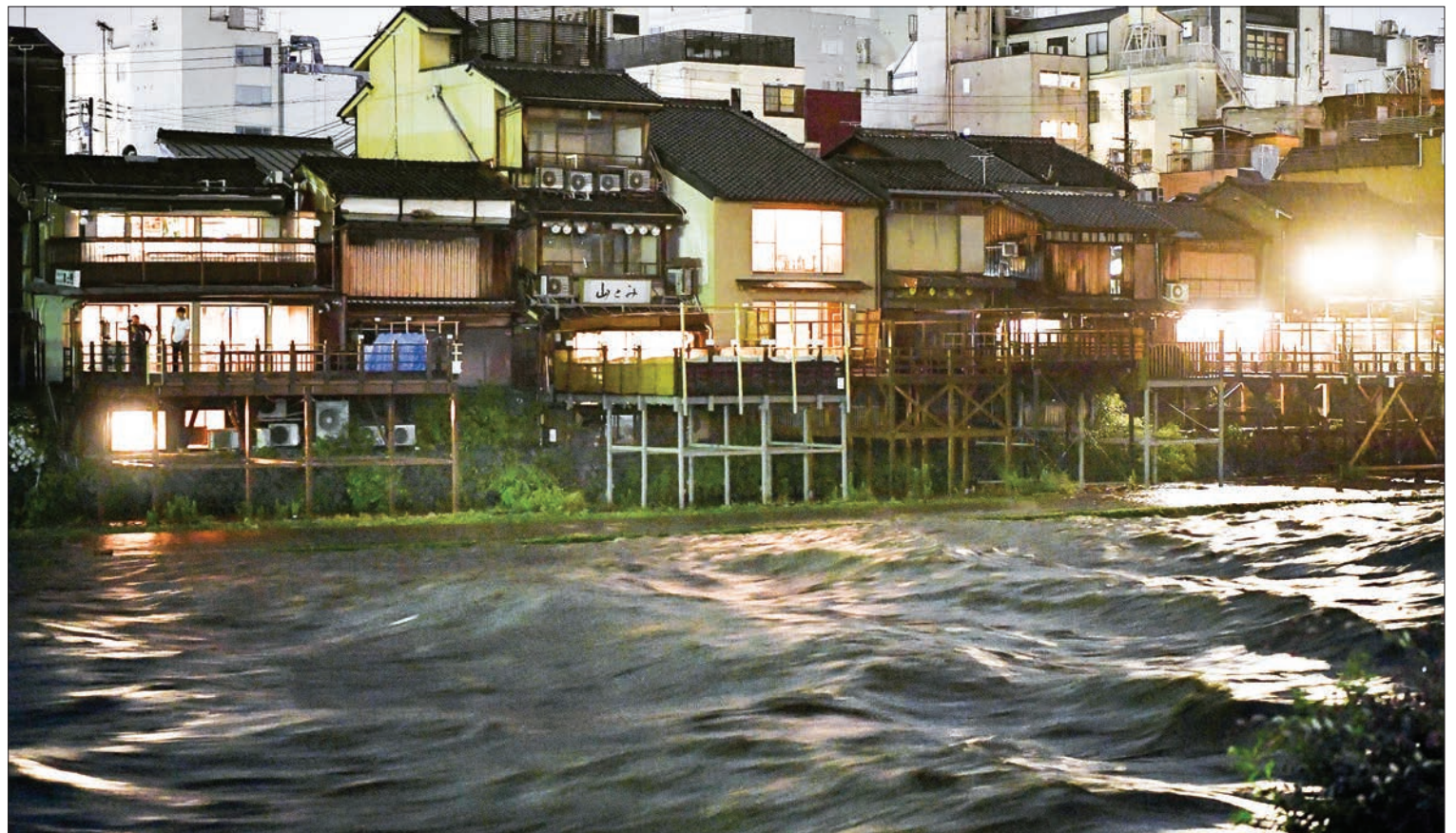
Photo taken on 5 July 2018 shows wooden terraces on the bank of the swollen Kamo River following heavy rainfall in Kyoto, western Japan.

A woman in her 50s went missing in Kyoto Prefecture, after leaving home in a car that was found in a swollen river around 2:40 am, according to lo-