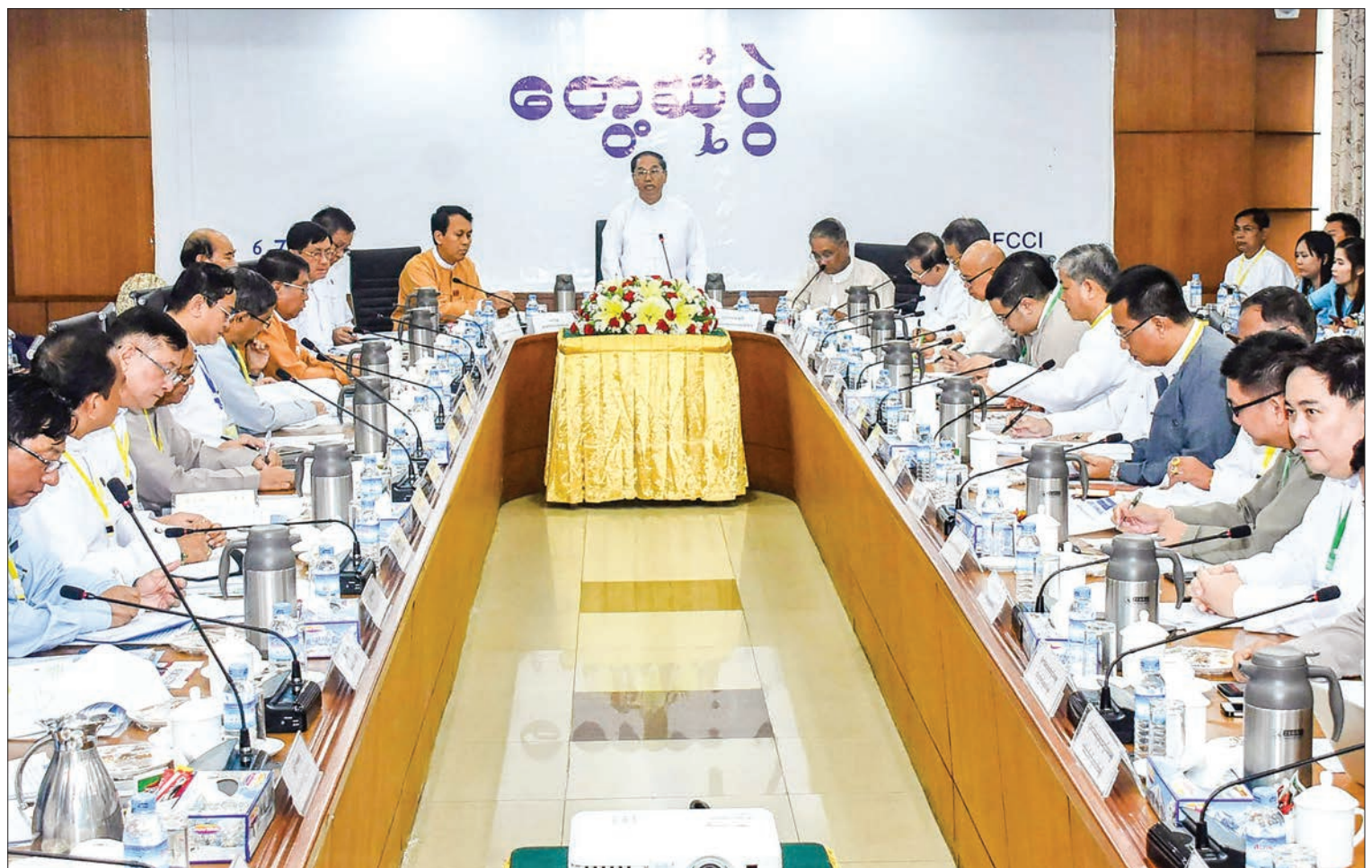
Vice President U Myint Swe, centre, Chairman of the Private Sector Development Committee (PSDC), addresses the 18 th regular meeting between the Private Sector Development Committee and Myanmar entrepreneurs at the UMFCCI office in Yangon yesterday.

In his address to the meeting the Vice President said PSDC was formed over one and a half years ago by the Office of the President on 24 October 2016 to effectively implement Private