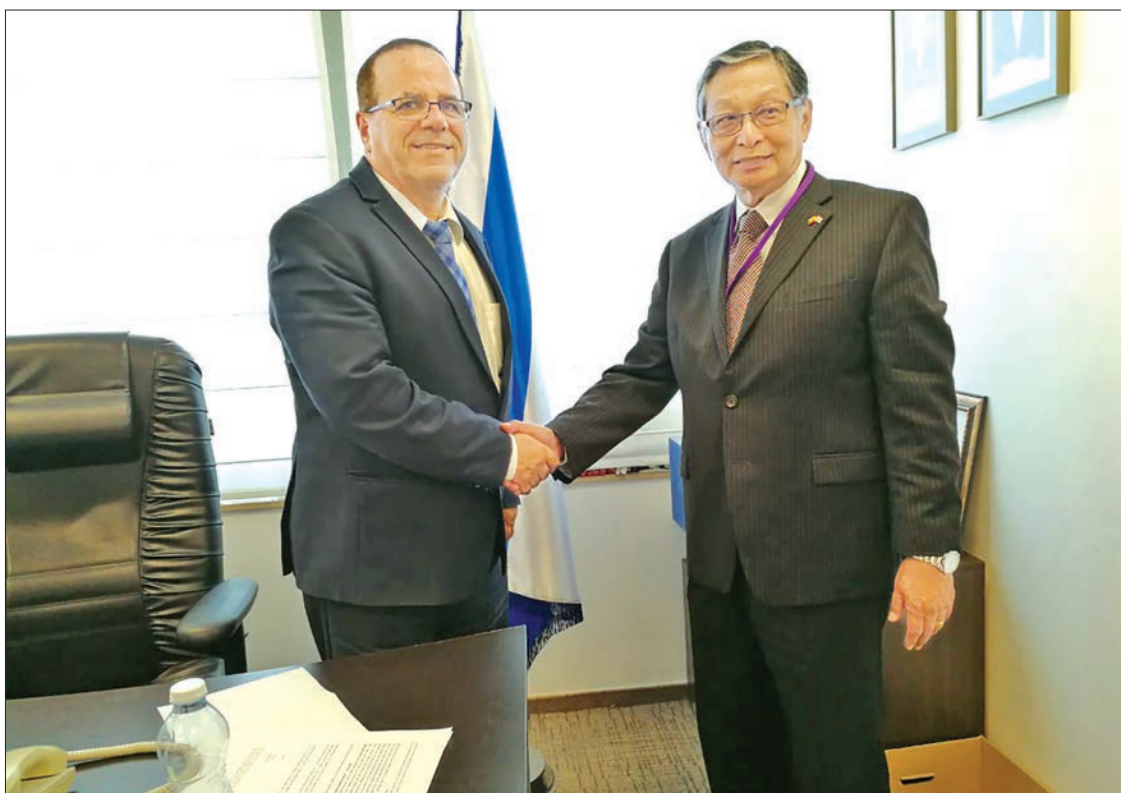
Union Minister U Kyaw Tint Swe (right) shakes hand with an official during his visit in Israel.

During the visit, Union Minister U Kyaw Tint Swe also held talks with Mr. Michael Oren, Deputy Minister of the Prime Minister's Office and Maj. Gen (Retd) Mr. Amos Yadlin, Executive Director of the Institute of National Security Studies (INSS) respectively and discussed matters of mutual interest. —Ministry of Foreign Affairs ■