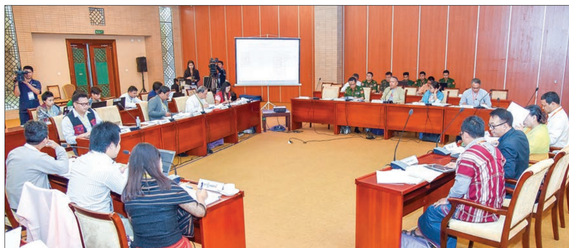
The third day meeting of the economic committee in preparation for the Union Peace Conference-21 st Century Panglong (Third Session) was held at MICC-II, Nay Pyi Taw, yesterday.

Discussions were widely held on refugees displaced to border areas due to conflicts, IDP camps in the country and ownership of farmlands upon return to their places of origin.