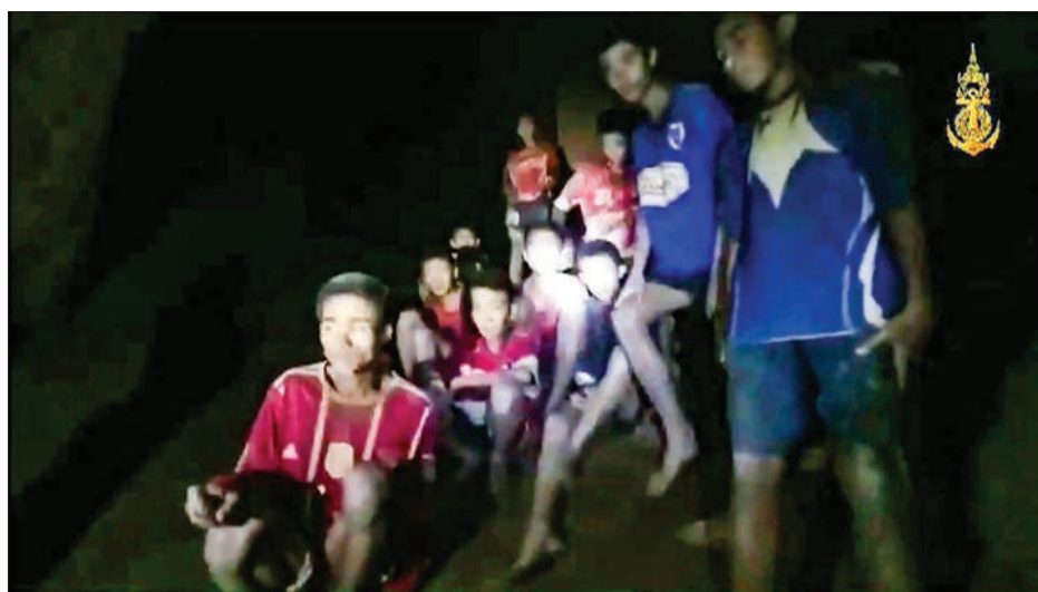
This handout video grab taken from footage released by The Royal Thai Navy late Monday shows missing children inside the Tham Luang cave of Khun Nam Nang Non Forest Park in the Mae Sai district of Chiang Rai province in Thailand.

He refused to speculate how long they might be