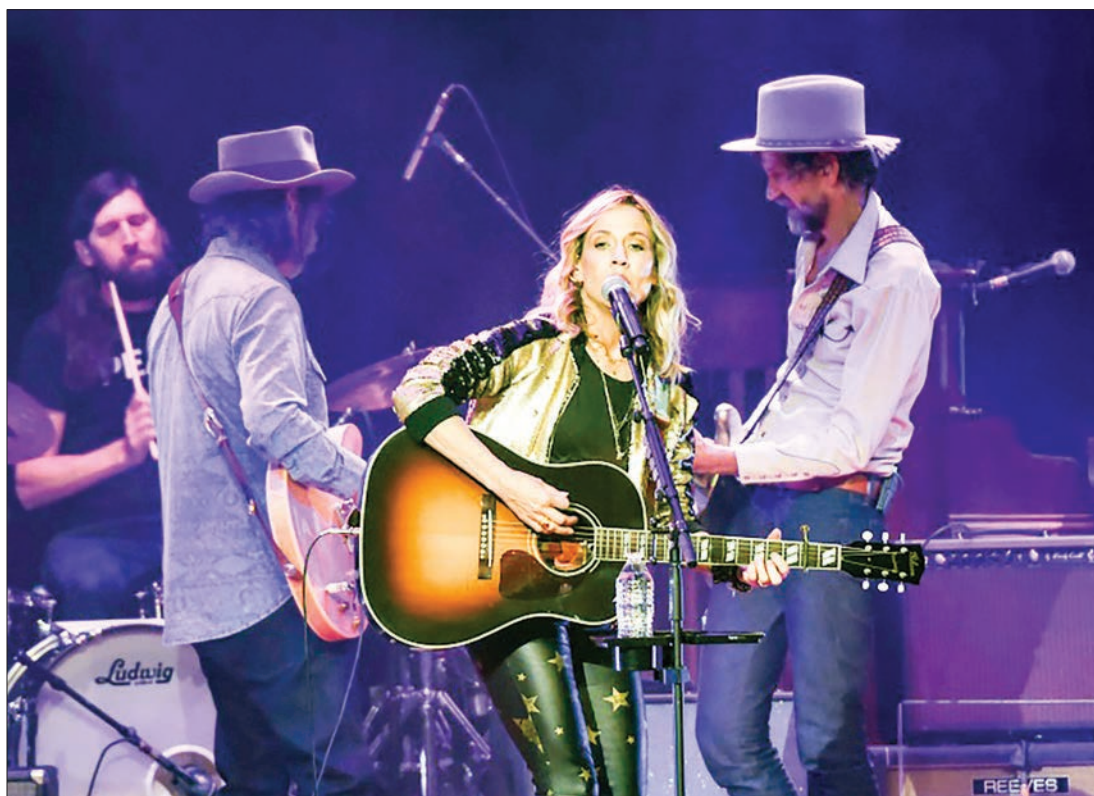
In an interview broadcast Monday, nine-time Grammy winner Sheryl Crow said that her 2019 album will feature Stevie Nicks, Keith Richards, Don Henley and the late Johnny Cash.