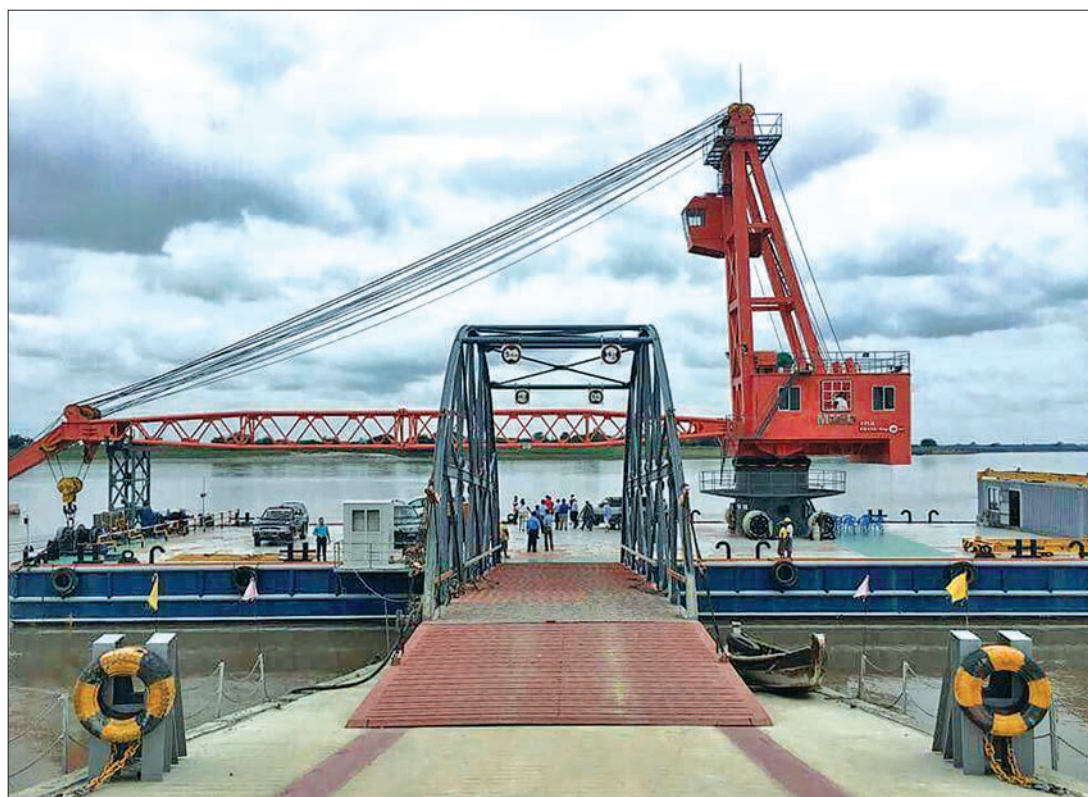
A newly renovated port on the Ayeyawady River in Mandalay is ready to handle ships.

The region government gave the green light to five FDIs worth $13.633 million and