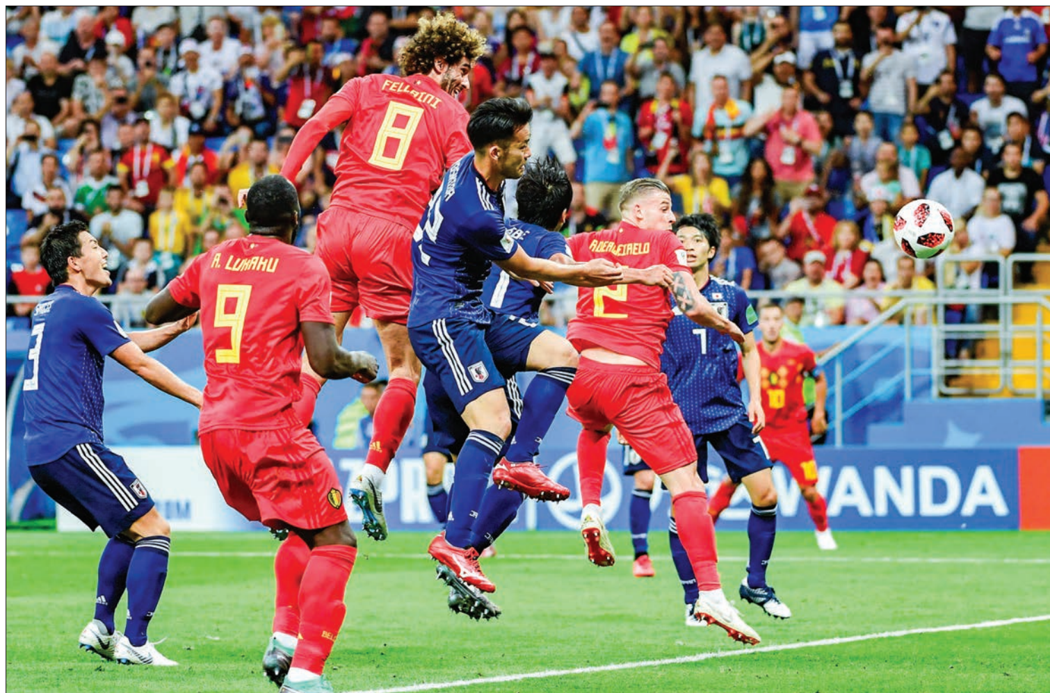
Belgium’s midfielder Marouane Fellaini (31) heads the ball and scores his team’s second goal during the Russia 2018 World Cup round of 16 football match between Belgium and Japan at the Rostov Arena in Rostov-On-Don on 2 July, 2018.

RTVE broadcast the story only a short time after Neymar was decisive in Brazil’s 2-0 win over Mexico in the Samara Arena on Monday evening which booked their place in the quarterfinals of the World Cup. Neymar scored the opening goal and made the second when Mexico keeper Guillermo Ochoa parried his shot into the path of Roberto Firmino. However, he was also involved in controversy after overreacting to a possible slight contact on his ankle from Mexico substitute Miguel Layun, stopping the game for four minutes as he received treatment. —Xinhua ■