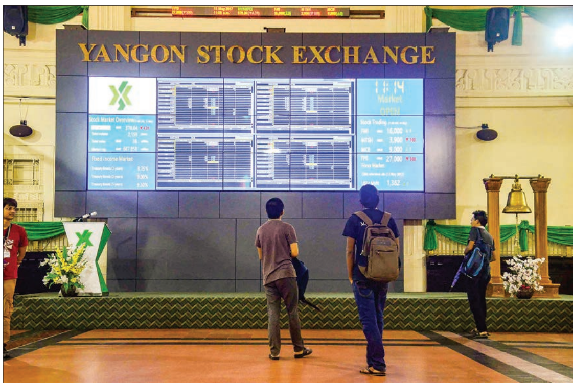
Visitors look at the board showing the stock exchange rates in YSE.

There are over 480,000 acres of fish and prawn farming lakes across the country. ■