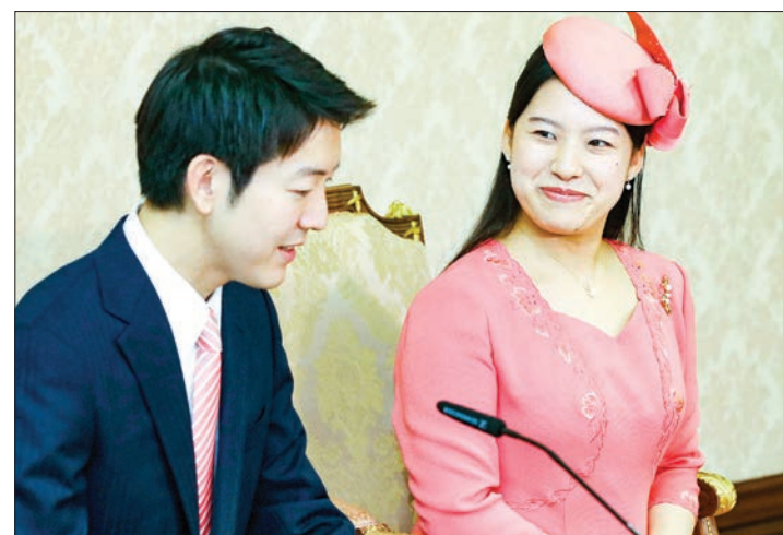
Princess Ayako, the youngest daughter of Emperor Akihito's late cousin Prince Takamado, and Kei Moriya attend a press conference at the Imperial Household Agency in Tokyo on 2 July, 2018, following an official announcement of their engagement earlier in the day.

The heritage list currently included over 1,000 sites, 52 of which are in China.—Xinhua ■