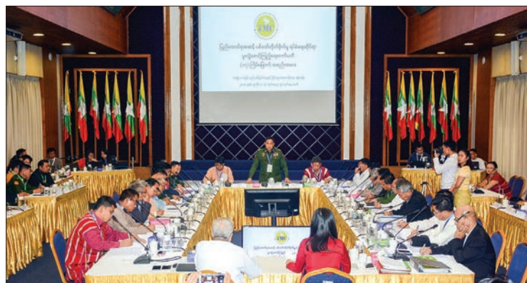
Peace makers participating in the 17 th regular meeting of JMC-U in Yangon.