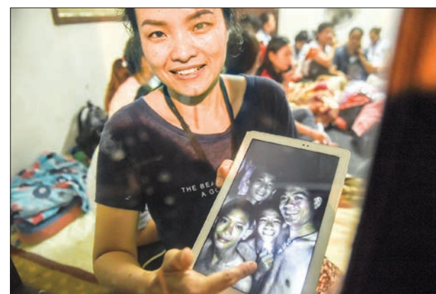
A family member shows a picture believed to have been taken in 2017 of four of the 12 missing boys after hearing the news that the group was found near the Tham Luang cave at the Khun Nam Nang Non Forest Park in the Mae Sai district on Monday. Twelve boys and their football coach trapped in a flooded Thai cave for nine days were "found safe" in a miraculous rescue after days of painstaking searching by divers.