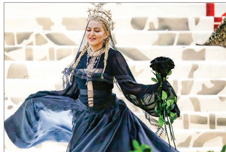
Special parking arrangements for US pop diva Madonna in the Portuguese capital Lisbon have sparked a political row including a warning to the mayor that the city does not belong to him.