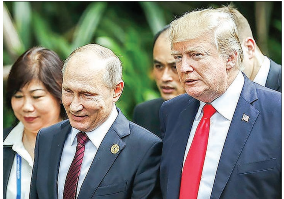
Presidents Vladimir Putin and Donald Trump.

As the Kremlin press office reported earlier, the Putin-Trump encounter will take place in Helsinki on July 16. According to Kremlin Spokesman Peskov, the two leaders will discuss a number of uneasy issues, including the comprehensive discussion of the situation in Syria.— Tass ■