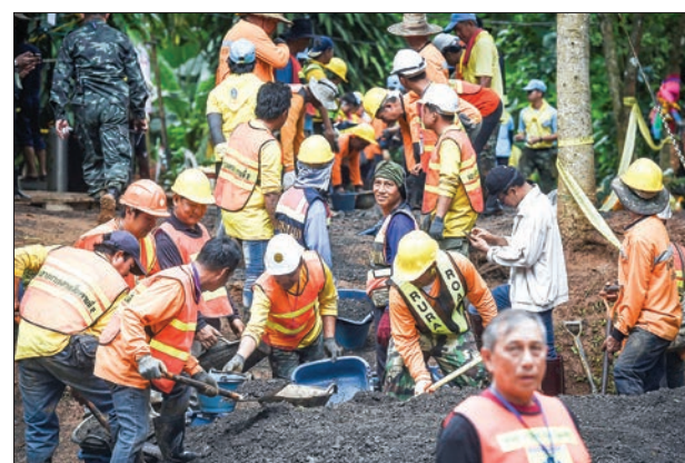
Workers fix the road leading to Tham Luang cave in Khun Nam Nang Non Forest Park following news all members of children's football team and their coach were alive in the cave in Mae Sai district on Monday. Food and medical help reached 13 members of a Thai youth football team found rake thin but alive, huddled on a ledge deep inside a flooded cave nine days after they went missing. Attention is now focused on how to get them out.

bicycles, football boots and backpacks near the cave's opening, and spotted handprints and footprints further in — leading them to the spot they were eventually found.