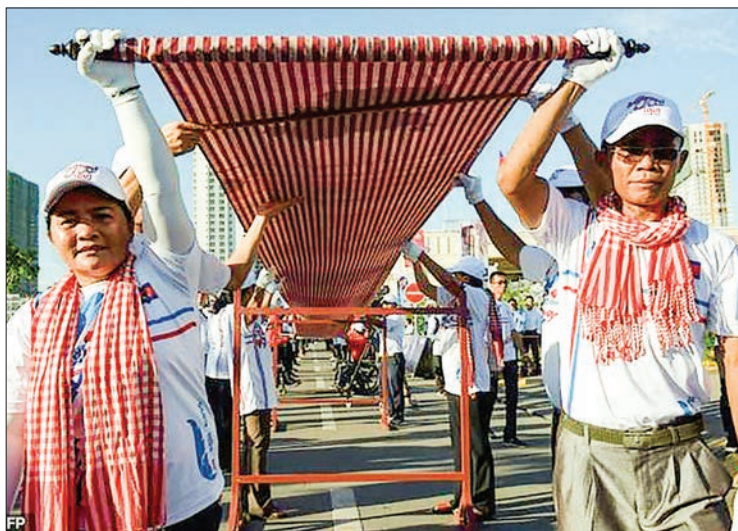
Thousands of young people roll out the krama along a street in the capital on Sunday for a visiting Guinness official to measure the garment.

“With 1,149.8 metres, you have set a new Guinness World