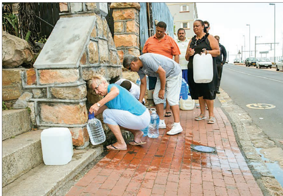
Drought-hit Cape Town earlier this year came within weeks of shutting off all its taps and forcing residents to queue for water rations at public standpipes.

To tackle the drought, Cape Town has enacted measures ranging from building seawater desalination plants to issuing strict instructions to only flush