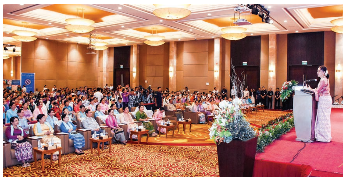
State Counsellor Daw Aung San Suu Kyi delivers the address at the Myanmar Women's Day event in Nay Pyi Taw.

Looking at the present moment in a practical manner, in the education sector, women are playing the primary and main role in guiding and teaching the children. Therefore, we need to think of how to develop their moral strength. Are we teaching our children properly in our own home? Are we building up their