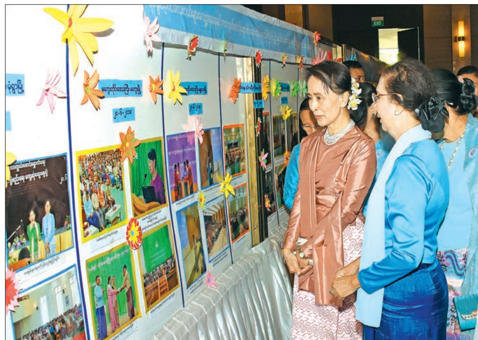
State Counsellor Daw Aung San Suu Kyi browse documentary photos of the Myanmar Women's Committee displayed at the Myanmar Women's Day event.

Present on the occasions were Union Minister for International Cooperation U Kyaw Tin, Deputy Minister for Office of the President U Min Thu and Director-General of the Protocol Department U Thant Sin. —Myanmar News Agency ■