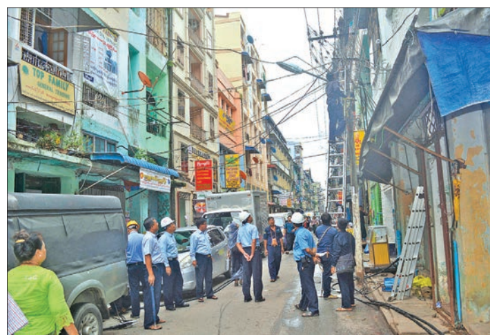
Officials of the Electricity Supply Corporation check cables in a street in Yangon.