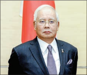
Former Malaysian Prime Minister Najib Abdul Razak. Mohamad's rag-tag four party Alliance of Hope. Mahathir, who was

2:35 pm at his private residence in Kuala Lumpur. He was taken to MACC headquarters and is scheduled to be charged in court Wednesday at 8:30 am, reportedly after spending the night in lock-up. Najib was in power from 2009 until the historic 9 May election that saw his National Front coalition routed by former Prime Minister Mahathir