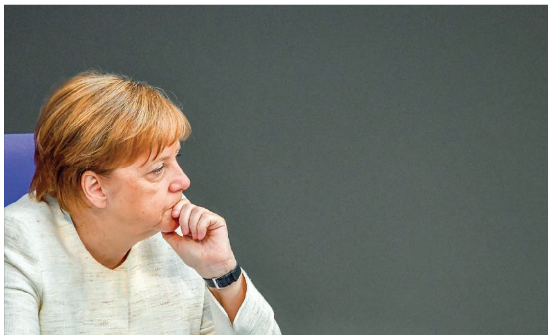
German Chancellor Angela Merkel looks on during a session on the federal budget at the Bundestag (lower house of parliament) in Berlin on 3 July, 2018.

Of those arriving so far this year, some 18,349 — almost one in four — had an asylum claim already open in another country, according to media reports last