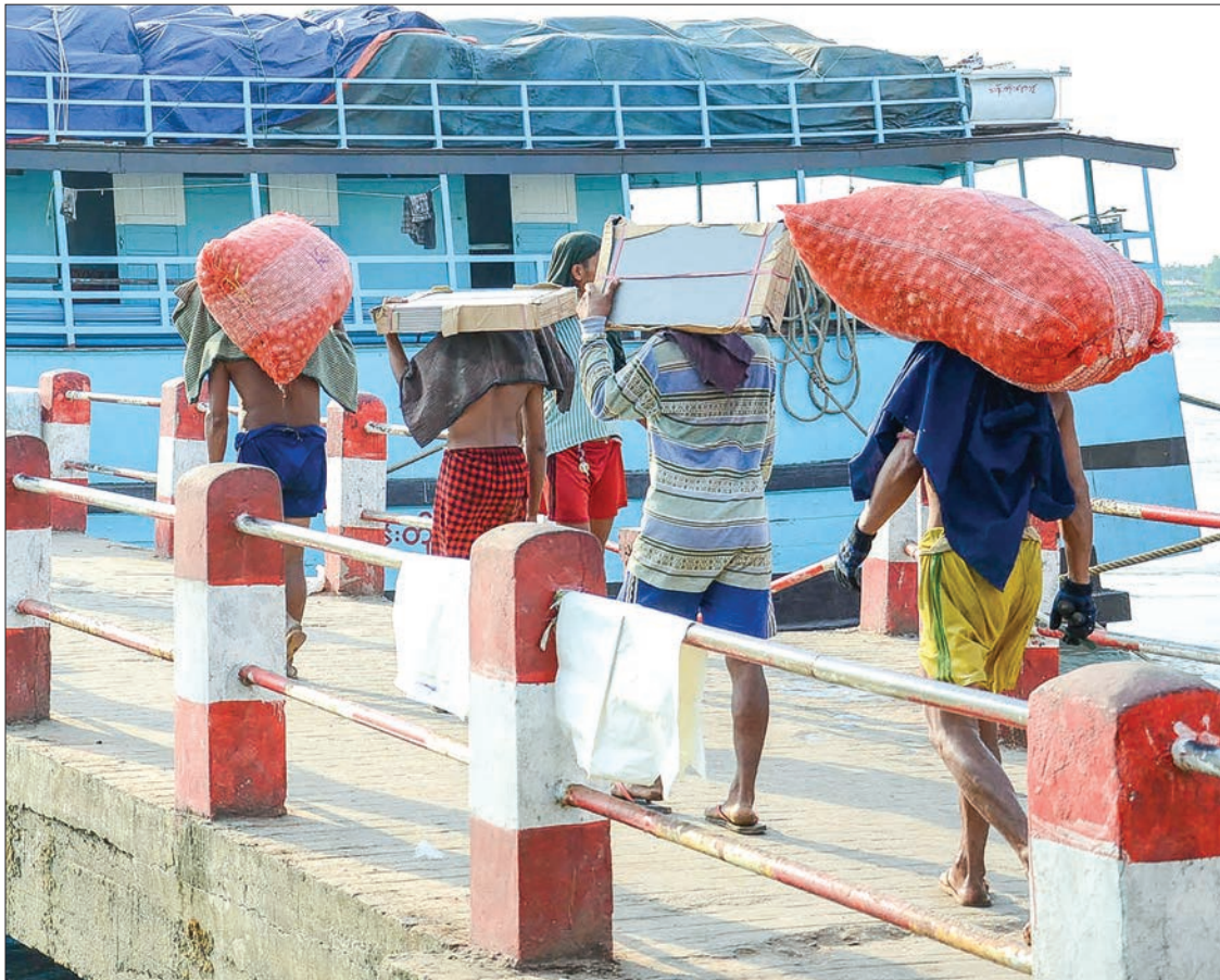
Labourers carrying sacks of onions to a vessel in Yangon.