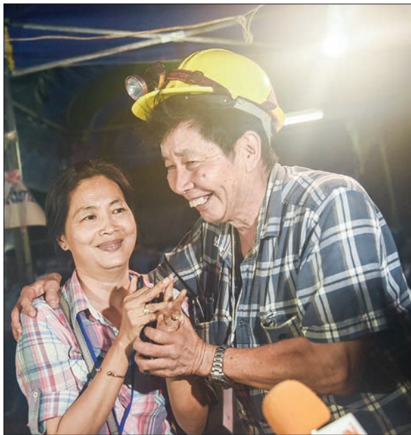
Family members of one of the missing boy celebrate while camping out near Tham Luang cave following news all members of children's football team and their coach were alive in the cave at Khun Nam Nang Non Forest Park in the Mae Sai district of Chiang Rai province late July 2, 2018.

tage of a brief window of good weather on Monday to edge further into the cave, with the water levels dropping slowly but steadily every hour thanks to round-the-clock pumping.