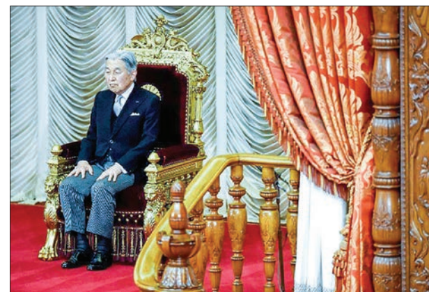
Japan's Emperor Akihito, 84, cancelled his official duties on Monday after suffering vertigo and nausea.

TOKYO — Japan's 84-year-old Emperor Akihito cancelled his official duties on Monday after being taken ill, the country's top government spokesman said.