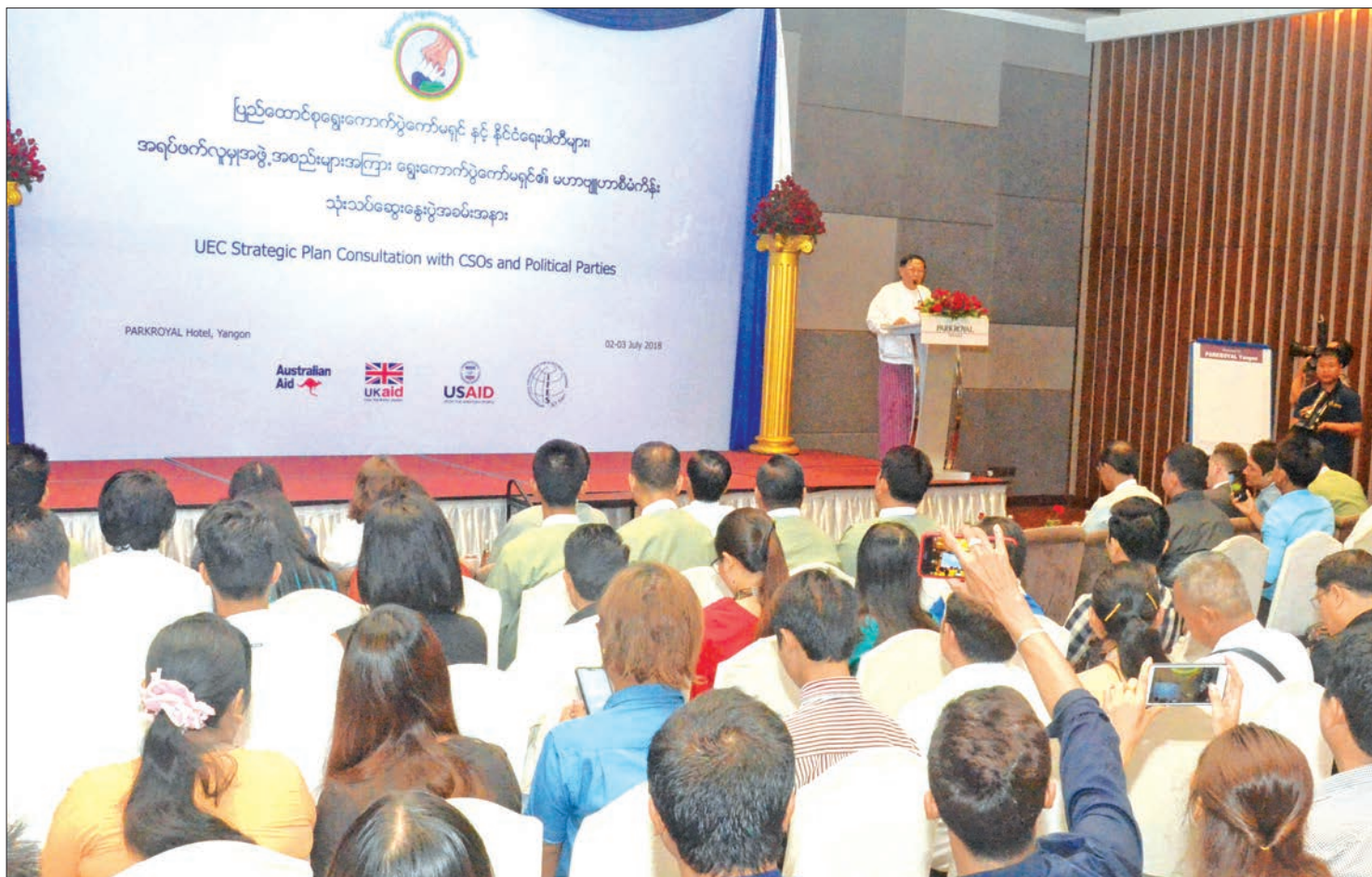
UEC Chairman U Hla Thein delivers the opening speech at the UEC Strategic Plan Consultation with CSOs and Political Parties.