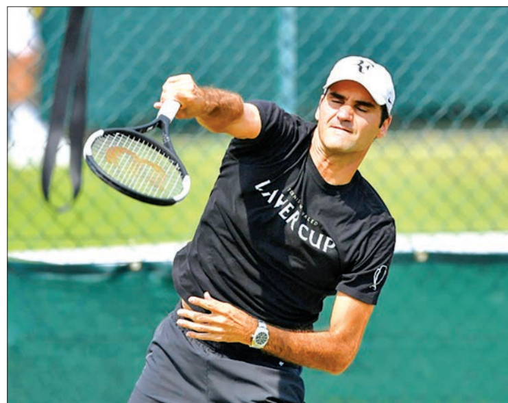
Switzerland's Roger Federer practices at The All England Tennis Club in Wimbledon on 1 July, 2018.

what to expect — the beaten by in straight the second round of Wimbledon in 2017. Federer is the overwhelming favourite to lift a ninth title and 21 st career major especially with old rival Rafael Nadal, fresh from an 11 th French