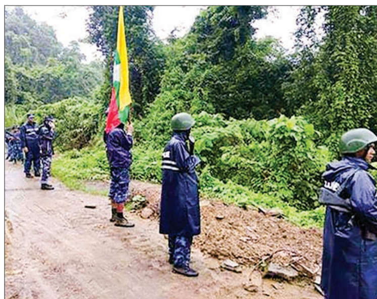
Myanmar Border Police patrolling along the border.

A total of 55 coordinated ground patrols were conducted. The coordinated ground patrols were deployed 14 times in February, 7 times in March, 16 times in May and 18 times in June. Coordinated naval patrols along the Naf River were also held eight times.— Myanmar News Agency ■