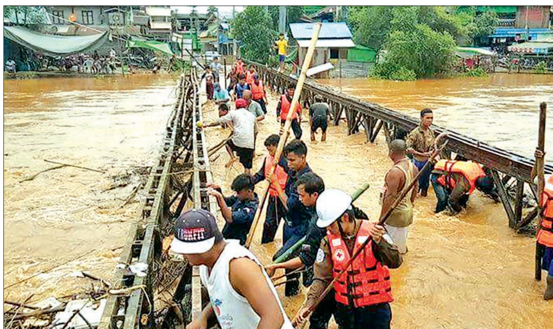
Local residents and firefighters in Phakant Township clear debris from Lonkhin Bridge to prevent it from being swept away by the rising Uyu River.

Because of the heavy rains, wards in Phakant Town were flooded up to a depth of six to ten feet, said officials. — Ni Toe (Mohnyin) ■