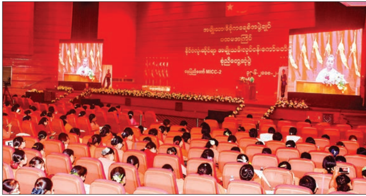
Chairperson of the Central Women's Committee Dr. May Win Myint delivers the speech at the Nationwide Women's Work Committees Congress in Nay Pyi Taw.

Later, Chairperson of the Central Women's Committee Dr. May Win Myint discussed the ongoing work of the committee. Following this, they delivered computers to the offices of the women's work committees. — Myanmar News Agency