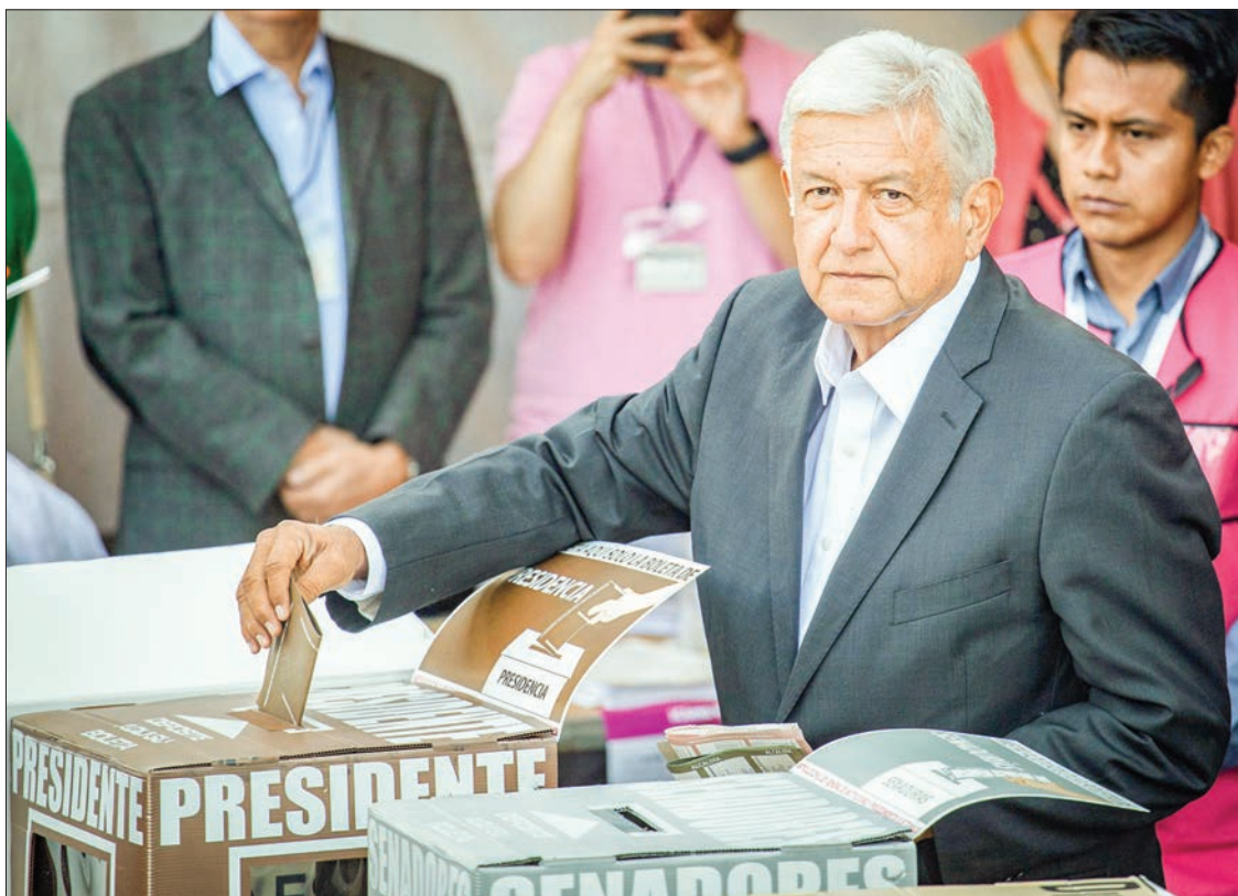
Presidential candidate Andres Manuel Lopez Obrador casts his vote during the presidential election on 1 July, 2018, in Mexico City.