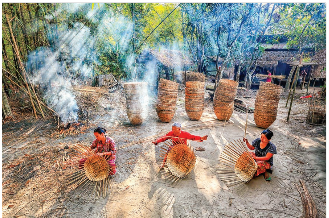
Weavers make baskets from bamboo at a village in Yangon Region.

He added that basket makers can produce two baskets used to store betel leaves from bamboo poles. A basket weaver can make 10 baskets of this kind per day. This type of basket is sold for Ks1,000,