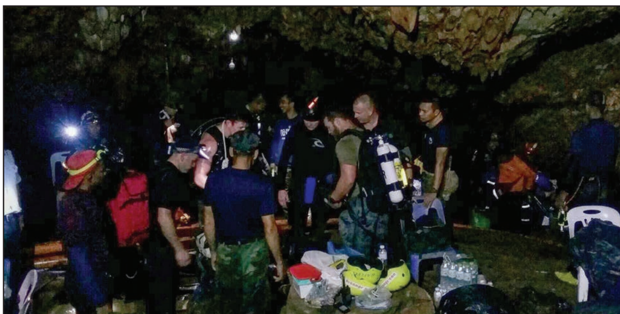
This photo taken and released by the Royal Thai Navy on July 2, 2018 shows a group of foreign divers preparing to search flooded section of Tham Luang cave at the Khun Nam Nang Non Forest Park in the Mae Sai district of Chiang Rai province as the rescue operation continues for a missing children's football team and their coach. Classmates of 12 boys trapped in a flooded Thai cave spoke of their hopes for a miracle rescue on July 2, as divers inched through thick mud and water towards an air pocket where the group is believed to be. PHOTO: AFP

Akihito shocked the country in 2016 when he signalled his desire to step down after nearly three decades in the job, citing his age and health problems. He will be the first emperor to retire — on 30 April, 2019 — in more than two centuries in the world's oldest imperial family. Akihito's eldest son, 58-year-old Crown Prince Naruhito, is set to ascend the Chrysanthemum Throne a day later. — AFP ■