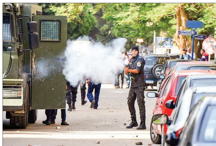
A new report claims at least 8 French companies have "profited from (Egyptian) repression" despite a European Union declaration in 2013 that member states had suspended export licences to Egypt for equipment that could be used for domestic repression.

The report notably cited companies selling technology used for mass data interception and crowd control, used for a surveillance system under which tens of thousands of opponents and activists had been arrested.