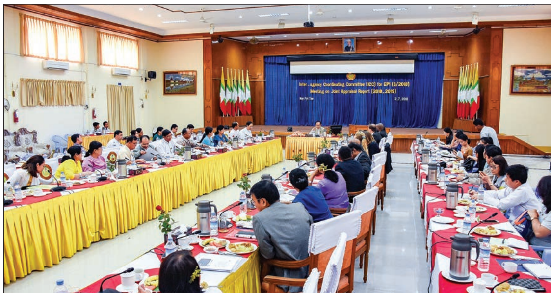
Union Minister Dr. Myint Htwe addresses attendants at the third meeting of the Inter-Agency Coordination Committee held in Nay Pyi Taw yesterday.

The union minister said the joint approval survey was conducted systematically by experts with international experience and will provide immense support for future vaccination programmes.