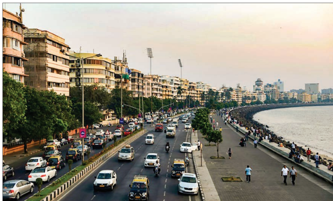
Art Deco buildings line the three-kilometre long palm-fringed Marine Drive promenade.