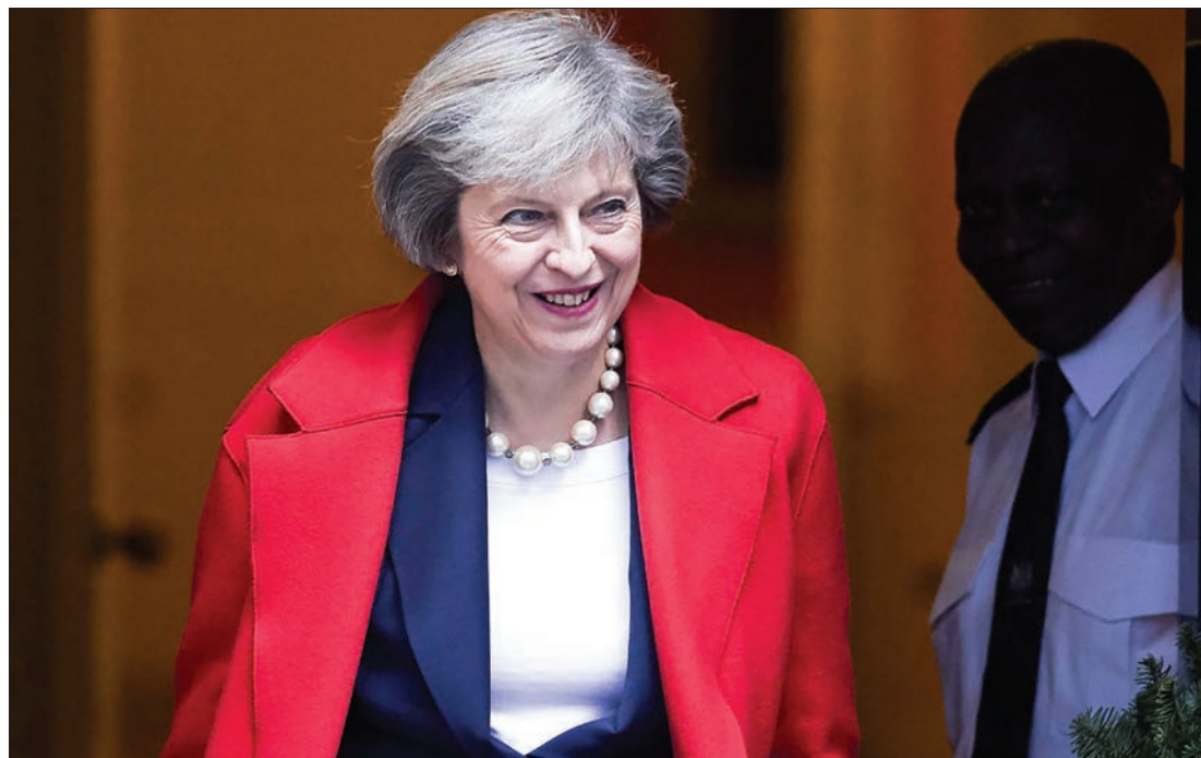
British Prime Minister Theresa May.

The intervention of Jacob Rees-Mogg, who represents Tories who want a clean break with the EU, sparked a backlash from members of the party