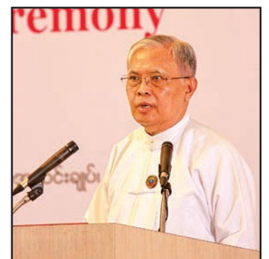
U Aung Kyi, Chairman of the Anti-Corruption Commission.

Corruption Prevention Units to be formed in government departments