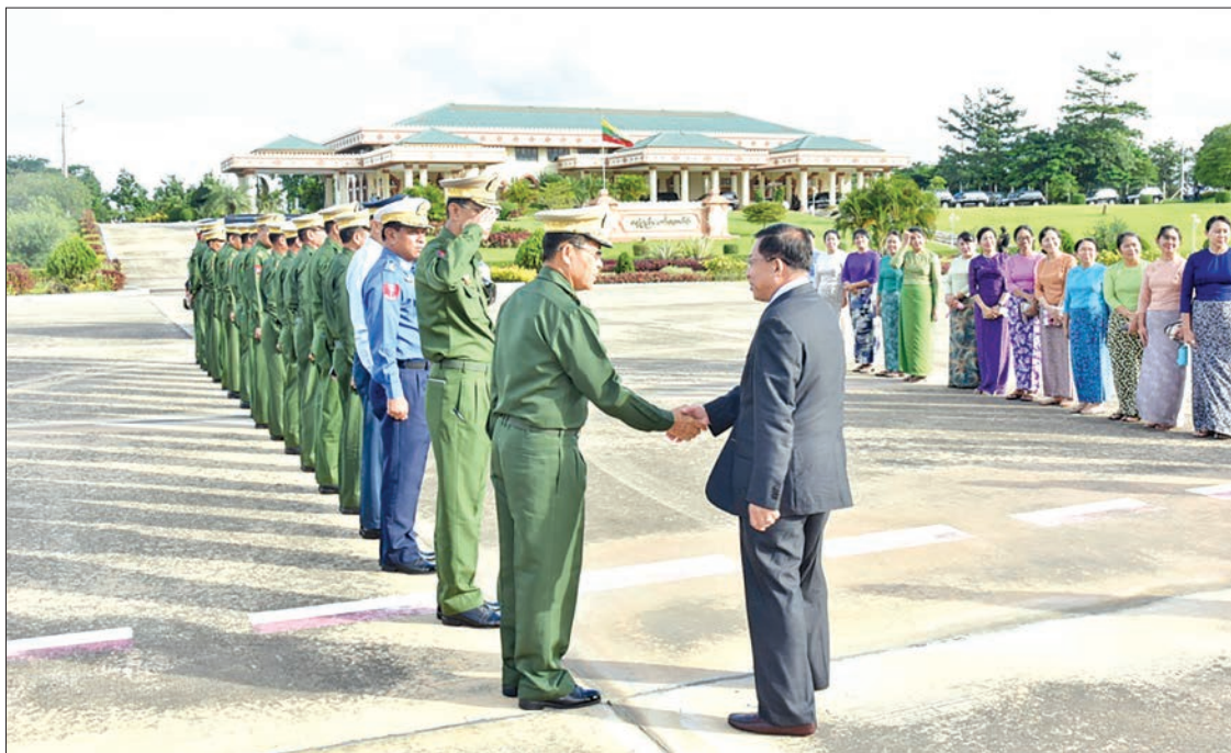
Senior General Min Aung Hlaing welcomed back by Vice Senior General Soe Win at the Nay Pyi Taw Airport yesterday.

Upon arrival at Nay Pyi Taw Airport, the Senior General and party were welcomed back by Deputy Commander-in-Chief of Defence Services Commander-in-Chief (Army) Vice-Senior General Soe Win and wife, Chief of the General Staff (Army, Navy and Air) General Mya Tun Oo and wife, senior military officers from the Commander-in-Chief's Office, the Nay Pyi Taw Command Commander and officials.— Myanmar News Agency ■