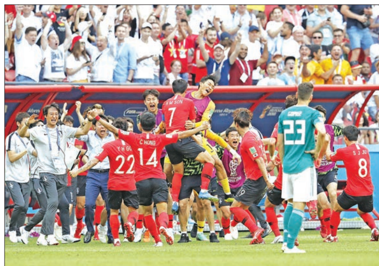
South Korean players celebrate their first goal during the second half of a World Cup Group F match against Germany in Kazan, Russia, on June 27, 2018. South Korea won 2-0.

Sweden finished top of Group F and will play the runner-up of Group E in the round of 16, while Mexico finished second and will play the Group E winner.—Kyodo News ■