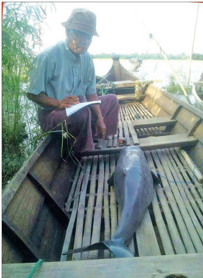
The dead baby dolphin seen on the boat.

Due to limitation of space we are only able to publish "Letter to the Editor" that do not exceed 500 words. Should you submit a text longer than 500 words please be aware that your letter will be edited.