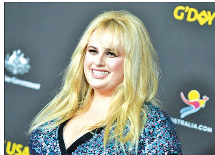
Wilson has been ordered to return most of the payout from what was the largest defamation payout in Australian legal history.

The Sydney-born actress told the trial she was sacked from DreamWorks animated feature