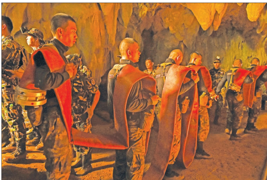
Thai soldiers carry hose deep into the Tham Luang cave to pump out water at the Khun Nam Nang Non Forest Park in Chiang Rai on 27 June, 2018 during a rescue operation for a missing children’s football team and their coach.

Conditions in the cave also proved tough for the