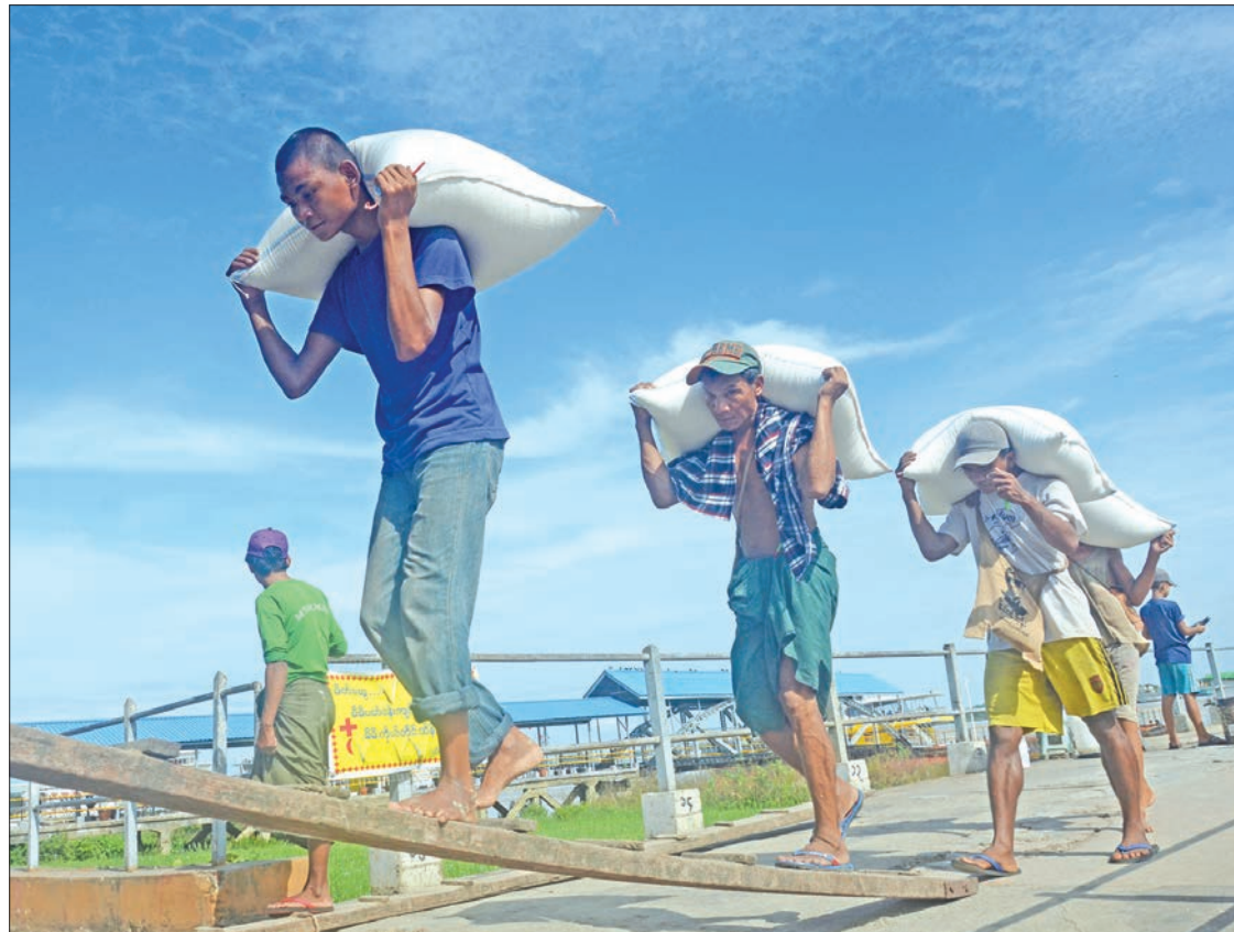
Workers carry bags of rice at the Botahtaung Jetty in Yangon on 7 June 2018.

A total of 10,000 tons (2 million bags) were supplied to the Muse depot per day from No-