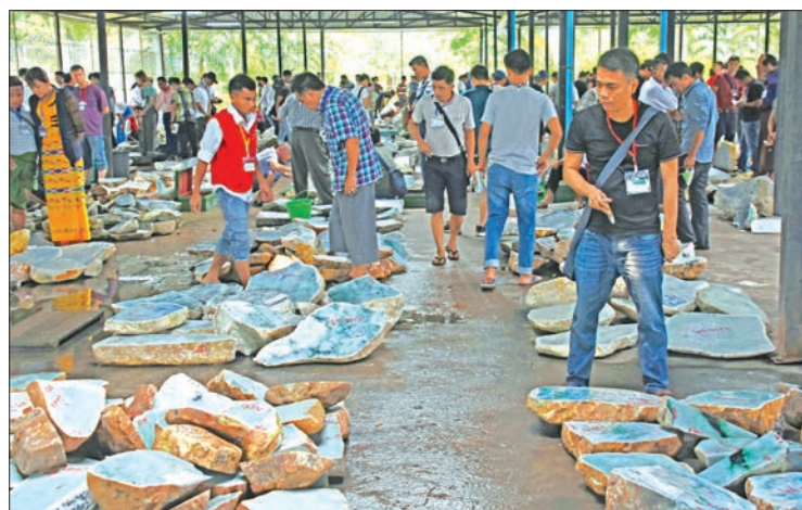
Gem merchants checking quality of jade stones at 55 th Myanma Gems Emporium in Nay Pyi Taw.

The list of tender winners will be announced on the afternoon of 28 June. A total of 1,045 jade lots from lot numbers 5,751 to 6,795 will be put on sale on 29 June through the open tender