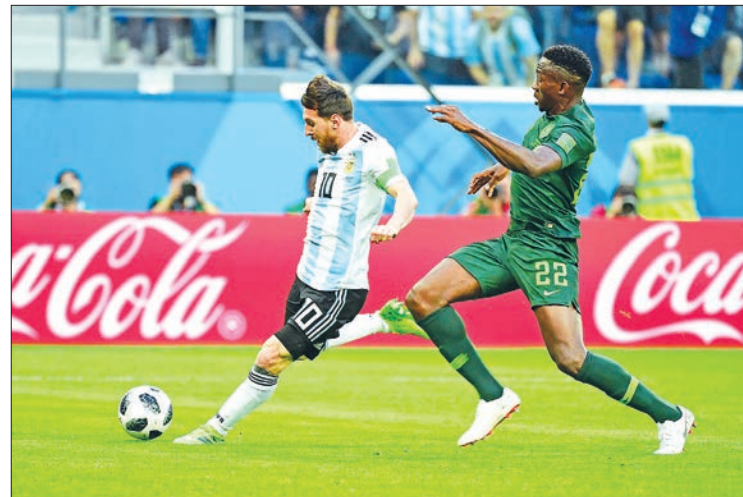
Argentina's forward Lionel Messi (L) shoots score as he is marked by Nigeria's defender Kenneth Omeruo (R) during the Russia 2018 World Cup Group D football match between Nigeria and Argentina at the Saint Petersburg Stadium in Saint Petersburg on 26 June, 2018.

to Leo so he can create chances," added Sampaoli. "If not we suffer, we know we have the best player in the world and we have to benefit from that."