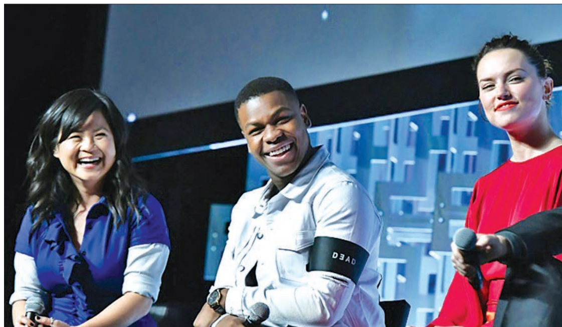
"The Last Jedi" stars Kelly Marie Tran, John Boyega and Daisy Ridley — shown at the Star Wars Celebration in April 2017 in Orlando, Florida — have been the targets of abuse by male, white fans of the blockbuster space saga.

The most female-friendly release, "The Last Jedi," features women during less than half of the running time while men get two-thirds of the dialogue in "The Force Awakens." "Yet this