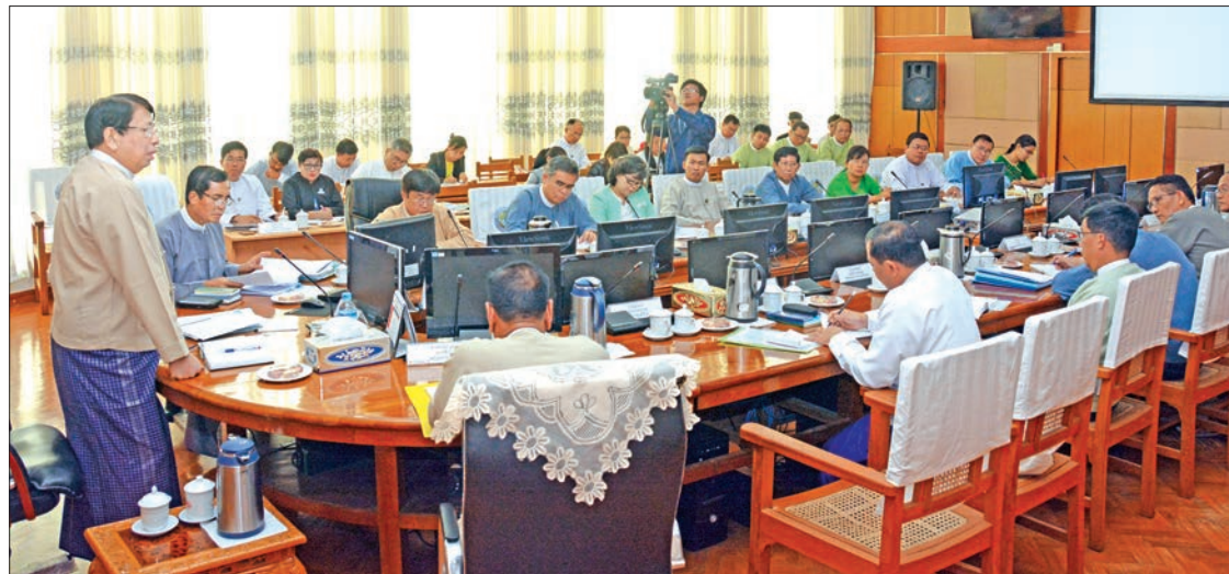
Union Minister for Information Dr Pe Myint addresses the coordination meeting for constructing a movie studio in Nay Pyi Taw yesterday.

The Union Minister said building the movie studio in Nay Pyi Taw will promote the film industry in Myanmar as well as develop Nay Pyi Taw's image. He said there are three sectors to this; artistic creativity, technical support in construction, and investment. He added the committee listens to the suggestions and ideas from artists, actors,