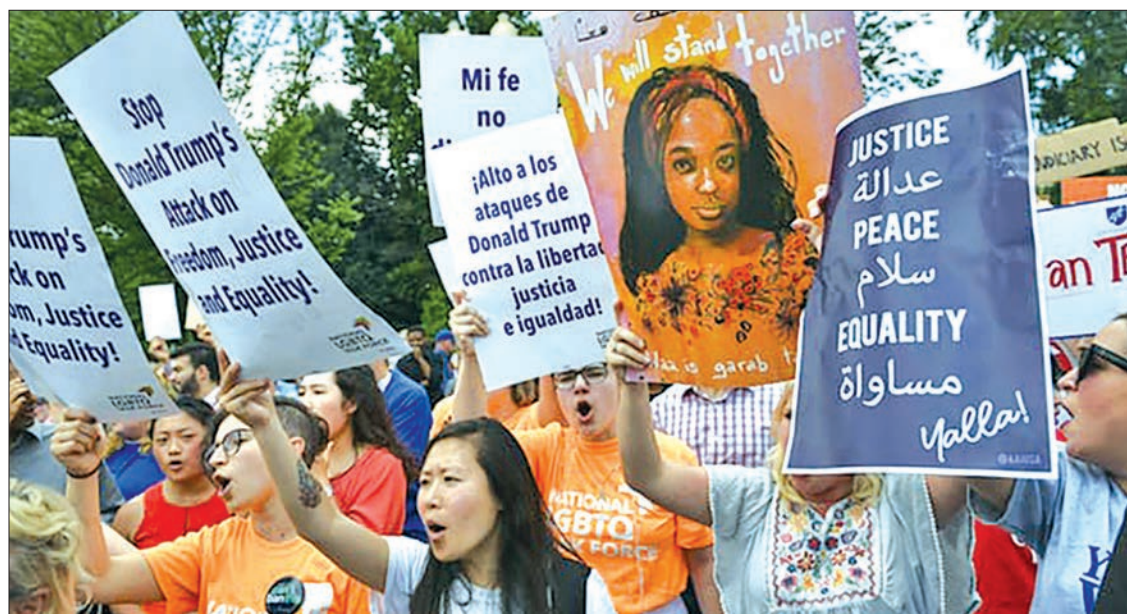
Protesters outside the supreme court in the wake of Tuesday's ruling. The White House said the court had 'upheld the clear authority of the president'.

NEC said that 20 political parties will contest in the election, which will see some 8.3 million people cast their ballots. —Xinhua ■