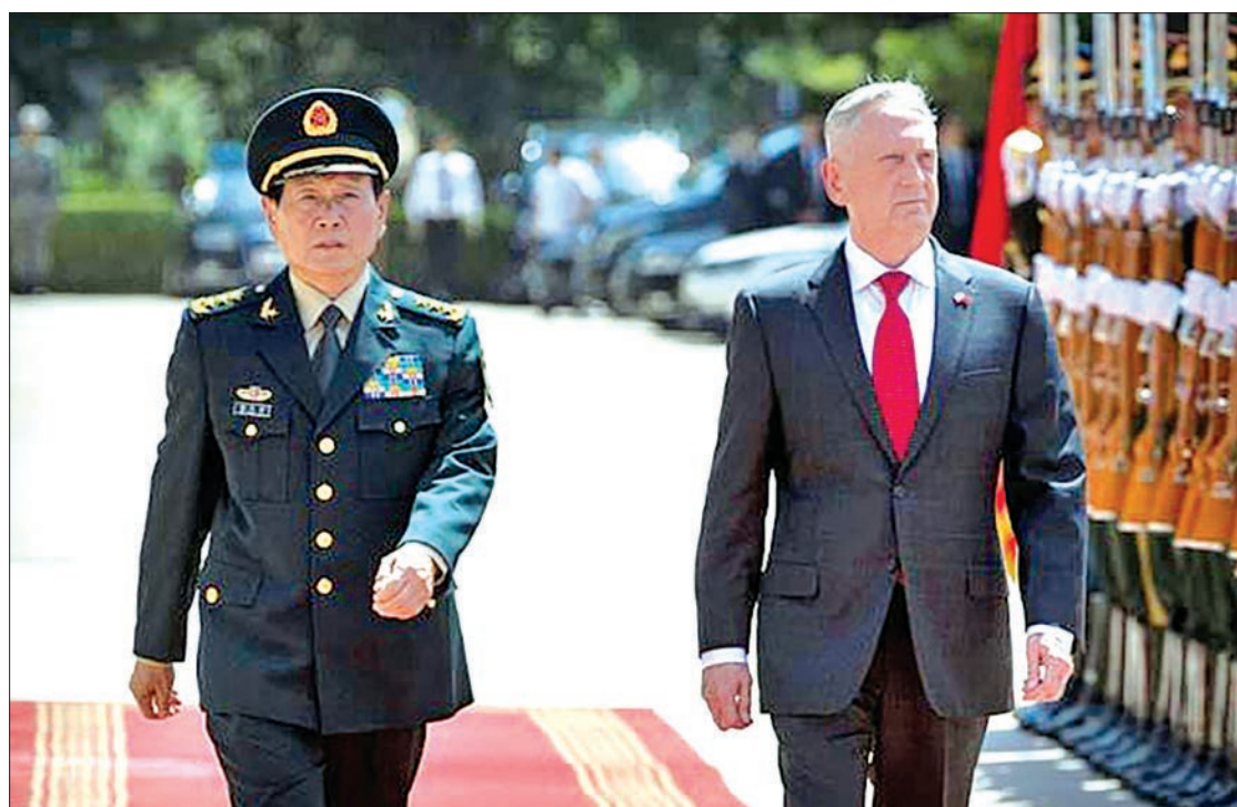
US Defence Secretary James Mattis (R) told his Chinese counterpart Wei Fenghe (L) that military relations were crucial to the broader relationship between the two countries.

His first meeting with Wei, who became defence minister earlier this year, comes under a cloud of festering tensions over China's placement of advanced weapons systems on built-up islets in the South China Sea, a projection of force that has