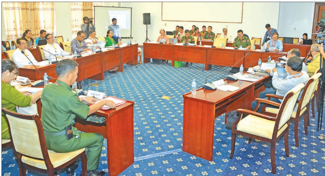
Members of the Security Sector Work Committee discussing the security sector in Nay Pyi Taw yesterday.

The Social Sector Work Committee mainly discussed equal rights for men and women, youth affairs and drug abuse problems, the culture and literature of ethnic minorities, points discussed during the national-level dialogues, the remaining points of the previous session of the peace conference, papers from the CSO