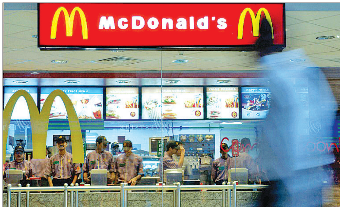
Burger King, McDonald's and Starbucks are among dozens of companies fined for violating a new ban on single-use plastics in India's commercial capital Mumbai.