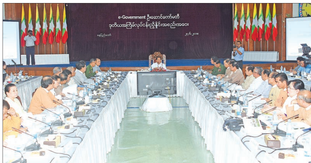
Vice President U Myint Swe delivers the speech at the second coordination meeting of e-Government Steering Committee in Nay Pyi Taw yesterday.

tation of services with a “quick win” and public private partnership format after considerable research and asked for all committees and subcommittees to give monthly progress reports.