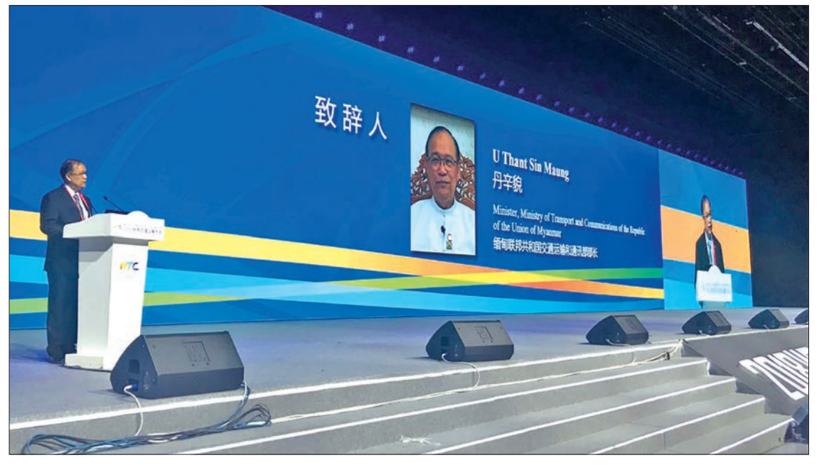
Union Minister U Thant Sin Maung delivers the address at World Transport Convention-2018 (WTC-2018) in Beijing, China.