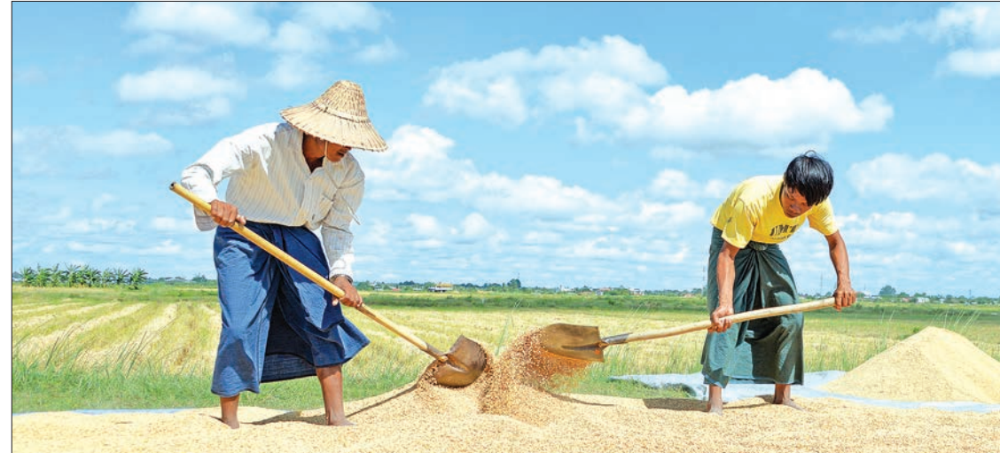
Workers spread paddy to dry under the sun at a field in Nay Pyi Taw