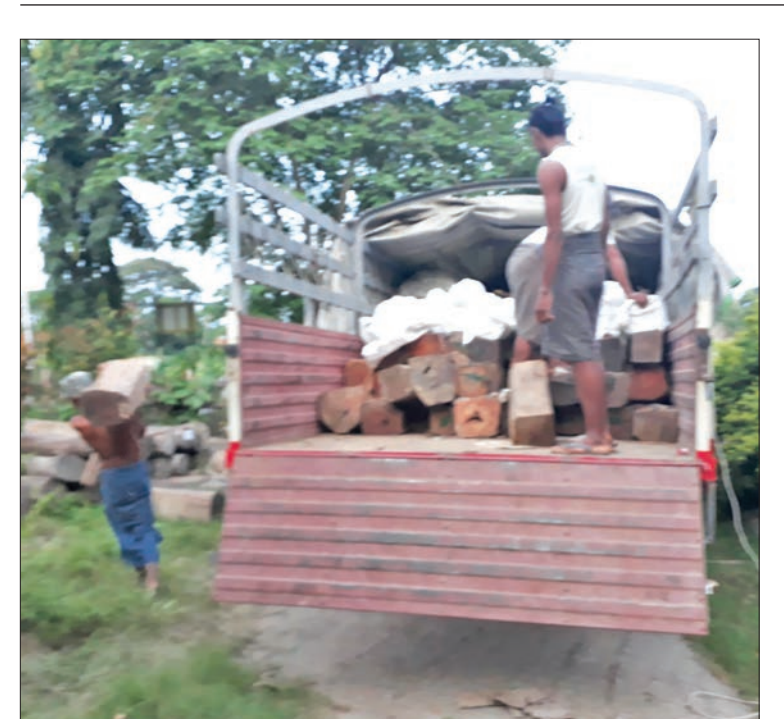
Labours unload the hardwood seized by police in Htigyaing Township, Sagaing Region.