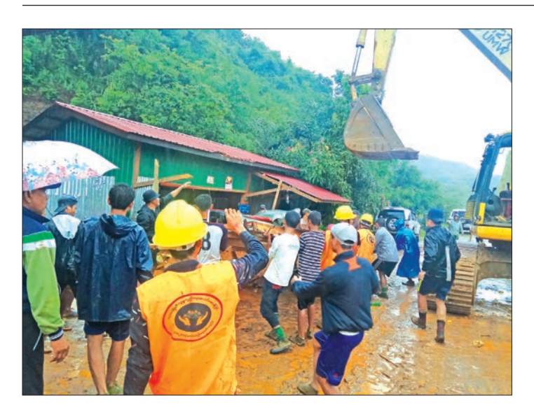
Police officers, local authorities and social organisations clear debris in Phakant Township, Kachin State on Friday.