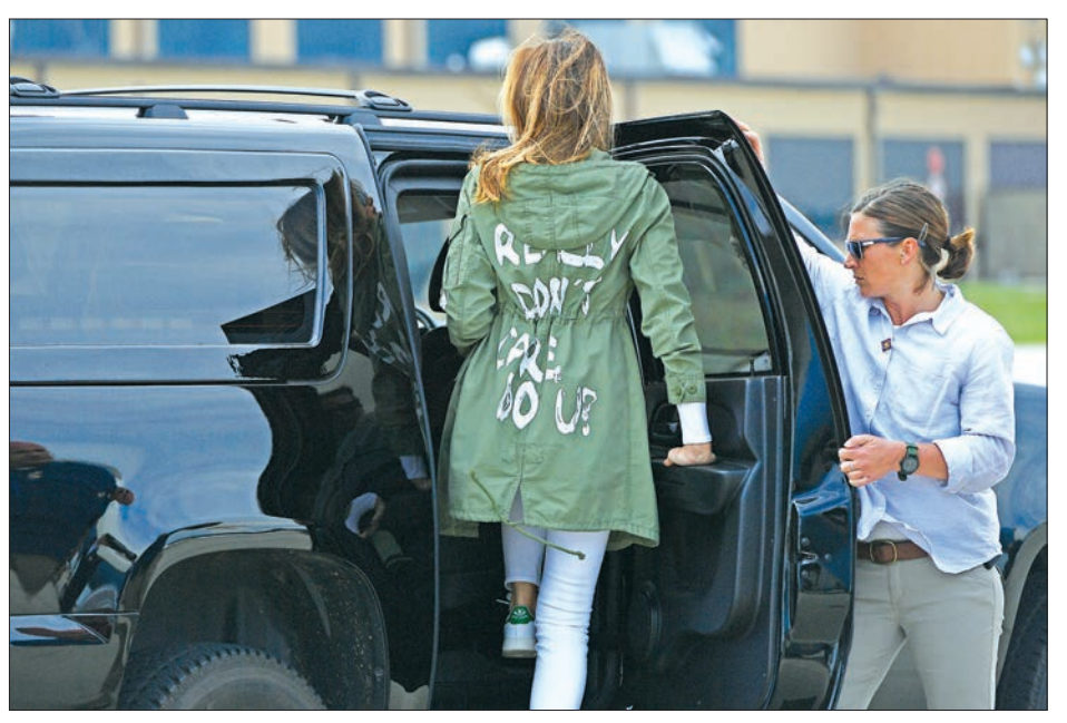
US First Lady Melania Trump departs Andrews Air Force Base in Maryland 21 June 2018 wearing a jacket emblazoned with the words "I really don't care, do you?" following her surprise visit with child migrants on the US-Mexico border.

Asked about the military-style jacket with large white brush-style lettering - apparently sold for $39 at