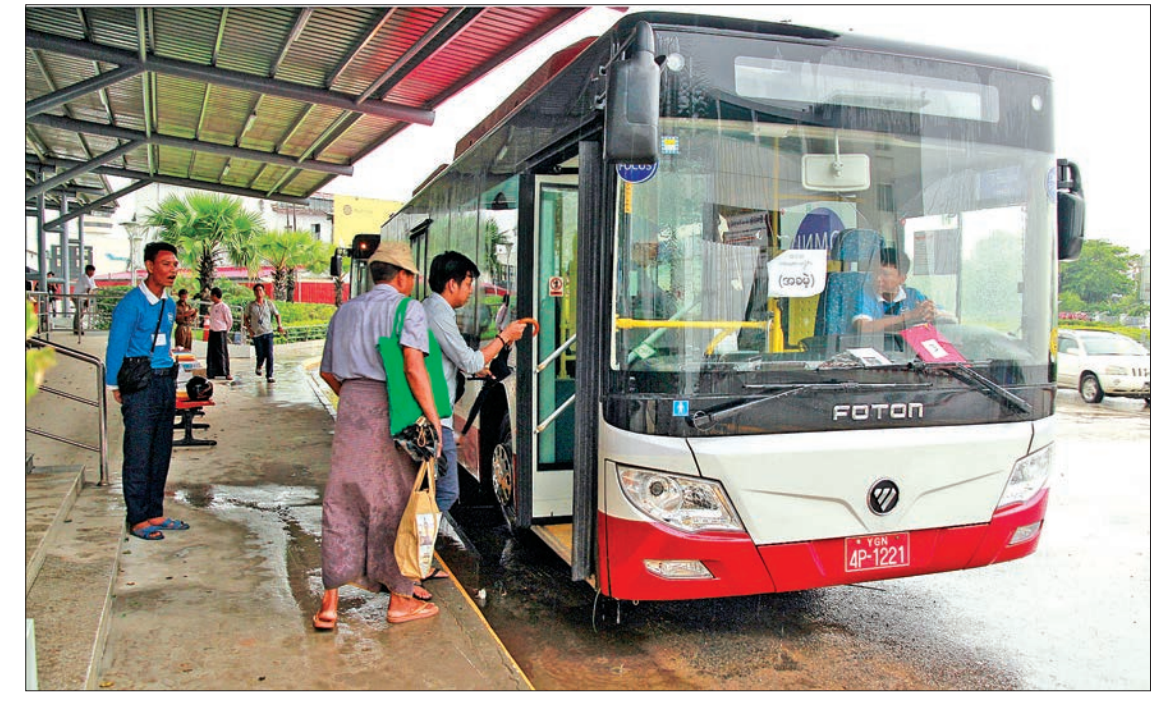
Commuters board the airport shuttle bus at Yangon International Airport yesterday.

For information passengers can call the Omini Focus Control Centre at 094212 22622, 094212 22822 and 094212 22922.—MDN