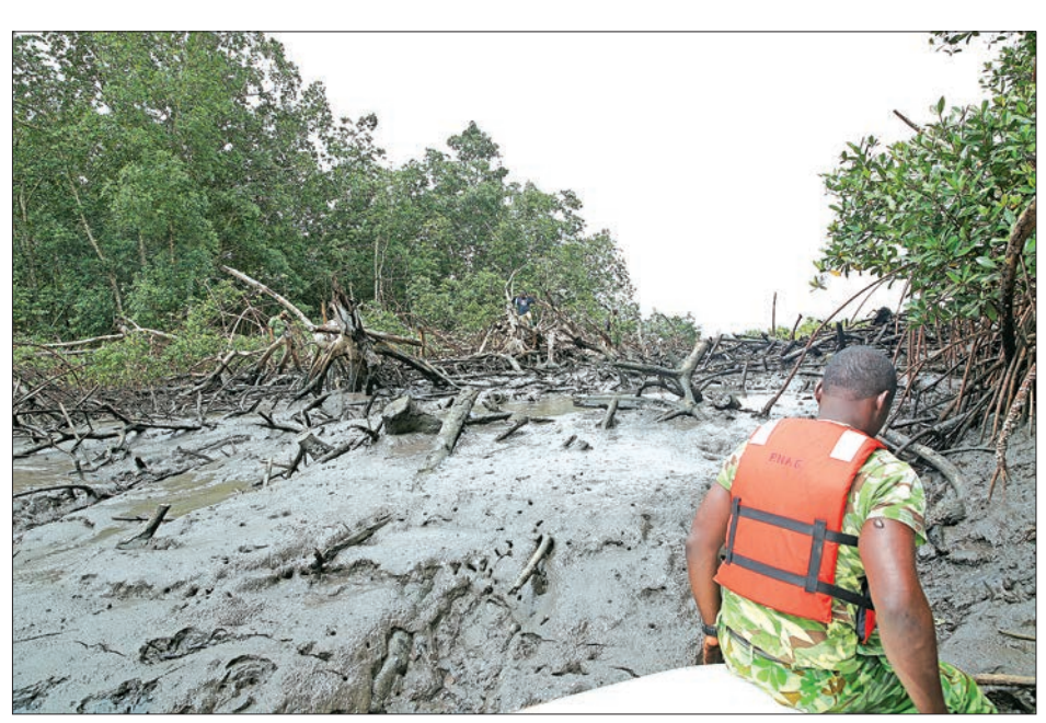
A ranger sits on a boat where mangroves once flourished, before cleared away for the rapid expansion of Gabon's capital Libreville.

But, say experts, their destruction is de-