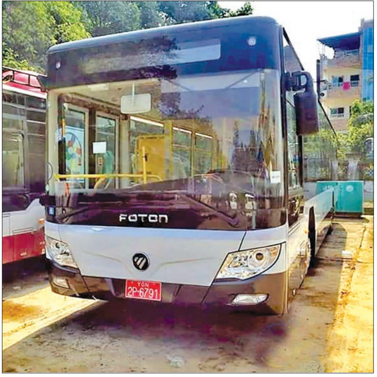
A bus from YBS 32 line is parked in the terminal.

LUDUMAIKSWE Public Bus Line said its YBS 32 will operate a new route between Myanmar Maritime University in Thanlyin Township and Htaukkyant in Mingaladon Township for the convenience of commuters.