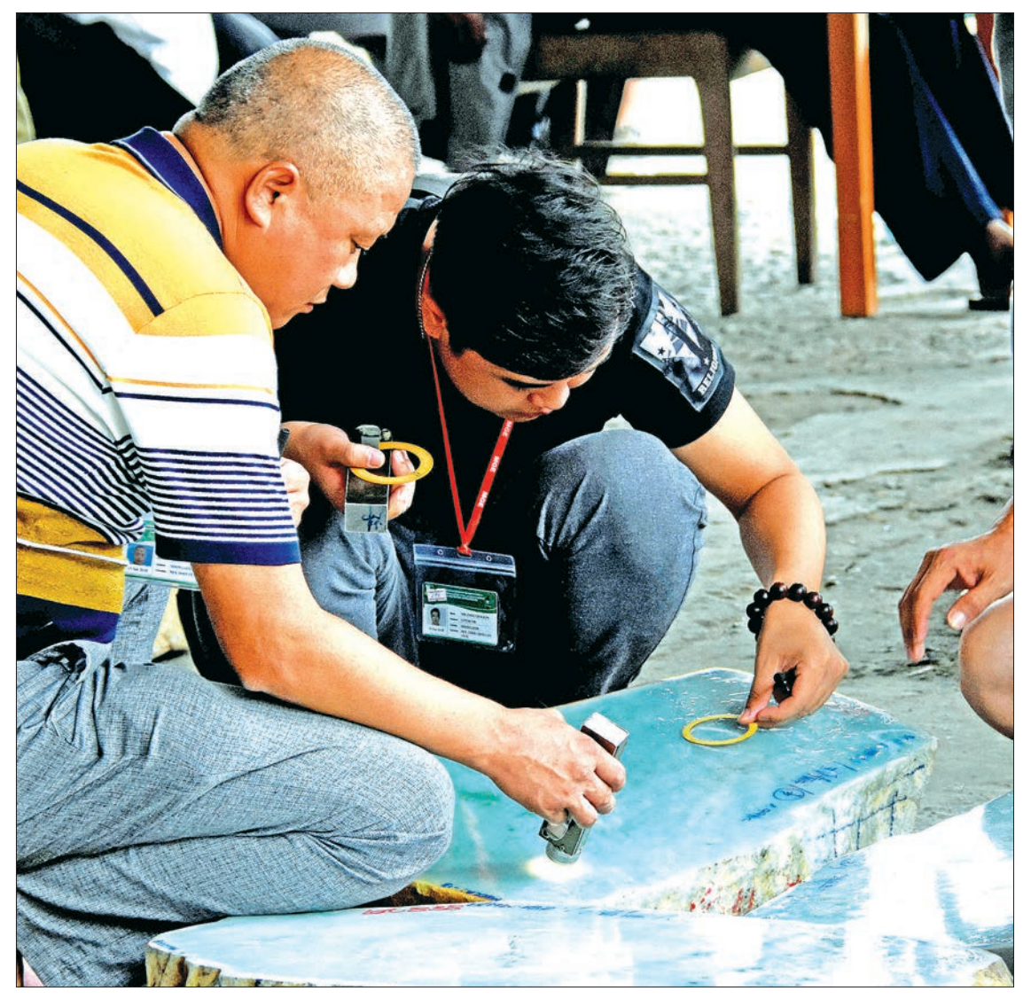
Merchants inspect a large jade stone on the third day of the 55th Myanma Gems Emporium.

Gem merchants from China. Thailand, Canada, Australia and the United States visited the emporium, with most of them being from China. Over 1,200 local gem merchants and over 3,000 foreign gem merchants are attending the emporium.