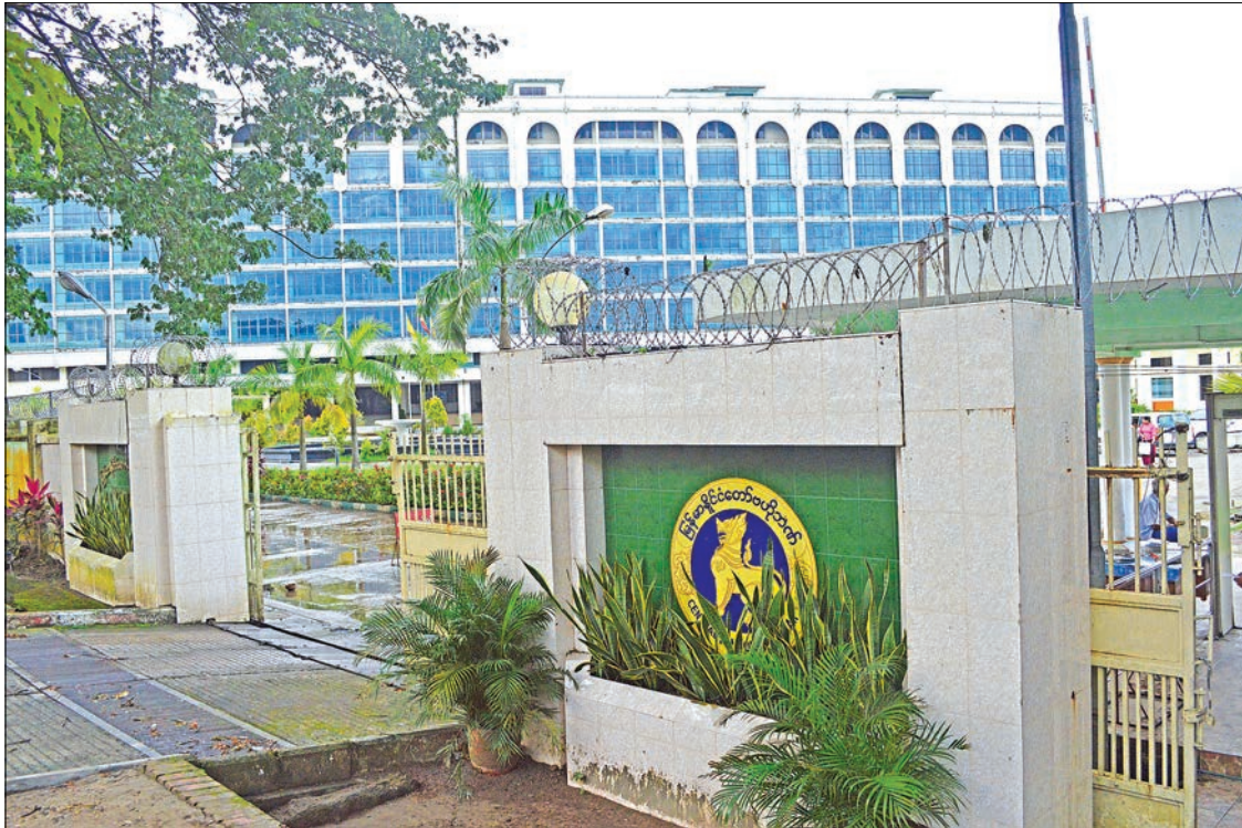
Former Head Office of the Central Bank of Myanmar in Yangon.