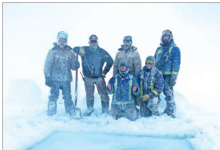
This handout photo taken on 19 June 2018 and released by the Australian Antarctic Division (AAD) on 21 June shows a swimming hole being prepared at the Casey research station as Antarctic researchers welcome the solstice by plunging into icy waters.

"Swimming in Antarctica's below freezing waters is something of a mad tradition, but our hardy expeditioners look forward to it, with 21 of the 26 people on