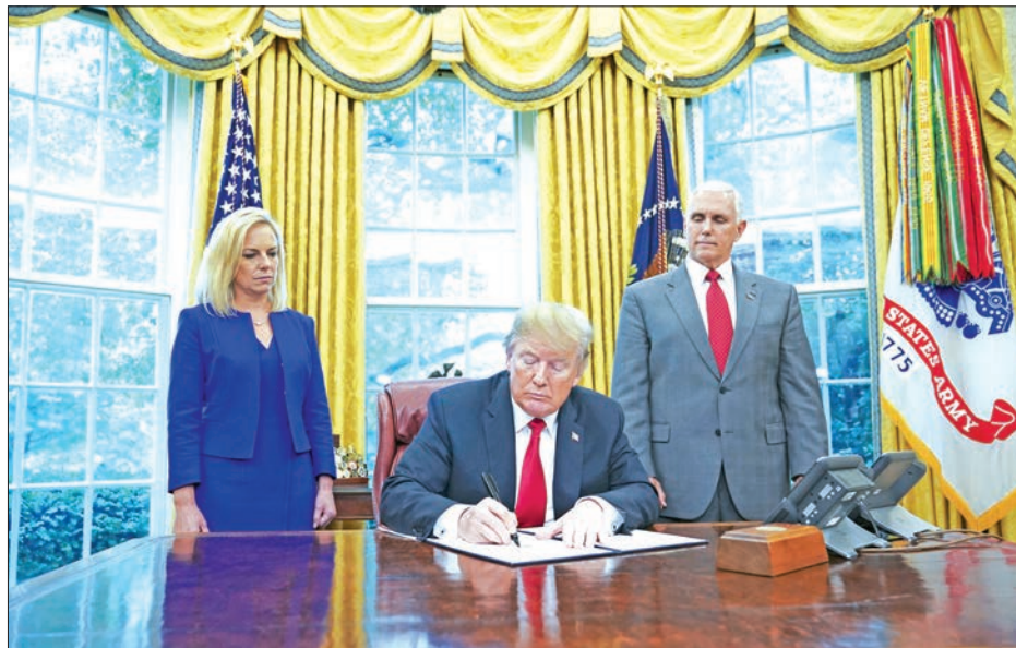
US President Donald Trump — flanked by Homeland Security Secretary Kirstjen Nielsen (L) and Vice President Mike Pence — signs an executive order to end family separations at the border.

Despite the order, there was no plan in place to reunite the thousands of children already separated from their families, according to multiple US media reports citing officials from the Health and Human Services Department (HHS).