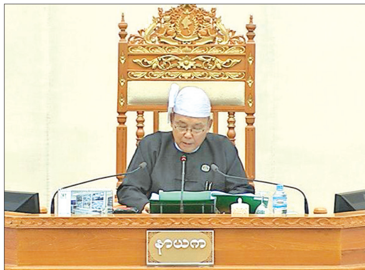
Pyidaungsu Hluttaw Speaker Mahn Win Khaing Than.

Next, the Pyidaungsu Hluttaw Speaker announced the approval of the Hluttaw on the Science, Technology and Innovation Bill, sent by the President with comments, after the Hluttaw decided on the bill by paragraph.