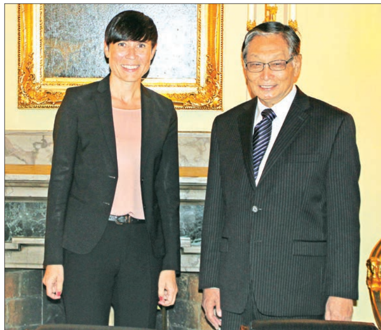
Union Minister U Kyaw Tint Swe meets with Minister for Foreign Affairs of Norway H.E. Ms Eriksen Søreide in Oslo, Norway.