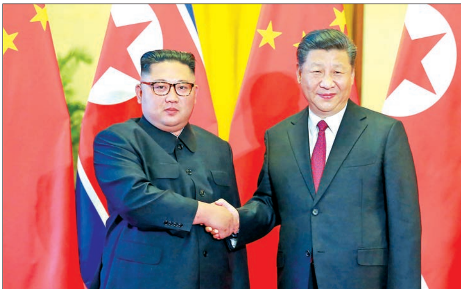
Relations between China and North Korea have experienced a renaissance in recent months.

In recent months, as relations between China and North Korea have experienced a renaissance,