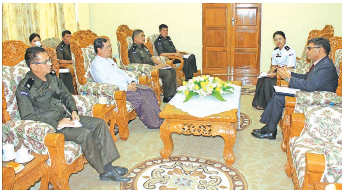
Union Minister U Thein Swe holds talks with Indian Ambassador Mr. Vikram Misri in Nay Pyi Taw.

and Rikhawdar-Zokhawthar gates, construction of buildings in international border gates, work requirements, cooperation plan between the two immigrations to smooth the border entry/exit process, works conducted for officials to conveniently cross the Paletwa-Zoripui gate and assist in the registration works and other border crossing related works were discussed.—Myanmar News Agency ■