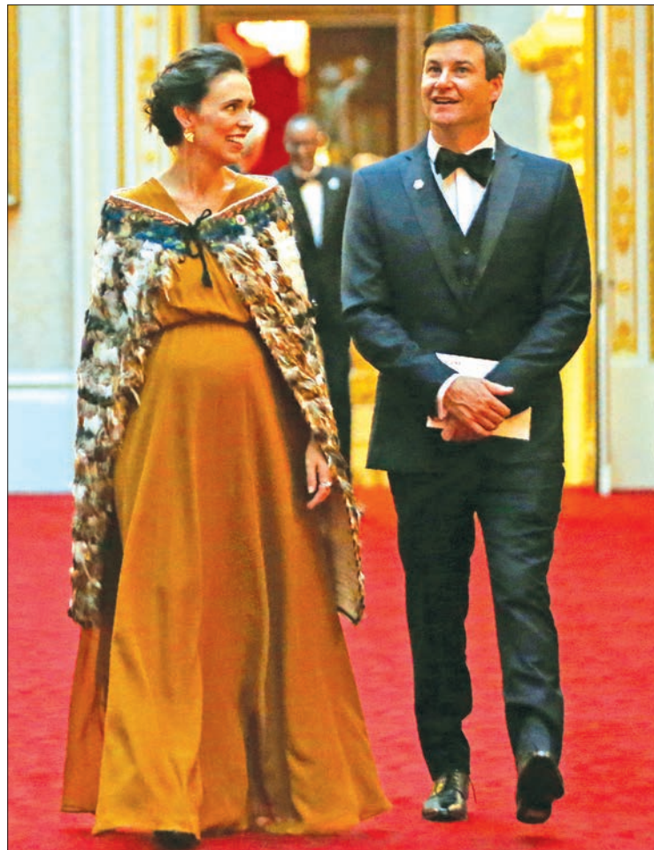
Jacinda Ardern is only the second leader to give birth while in office.

lican from Montana and leading activist, was the first woman to be elected to the US Congress, in 1916.