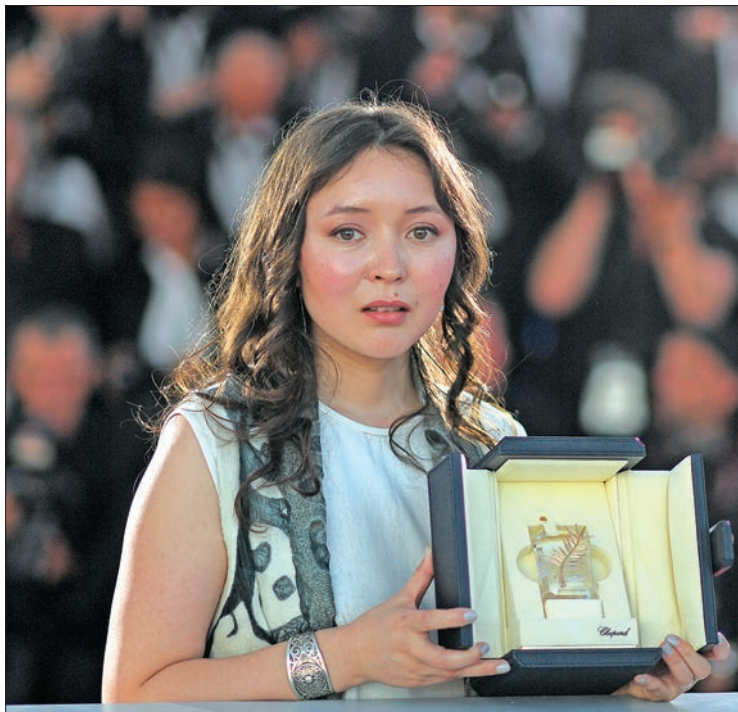
Kazakh actress Samal Yeslyamova won international acclaim for her wrenching portrayal of a Central Asian single mother struggling for survival in Russia in Sergey Dvortsevov’s film “Ayka”.

Dressed in a navy suit and wearing no makeup — just like her character — the actress sounded almost nostalgic as she recalled her gruelling on-set experience. Dvortsevov, who is known for his documentary style, insisted that she must be — and not simply look — exhausted — in front of the camera, the actress said, adding she would run before