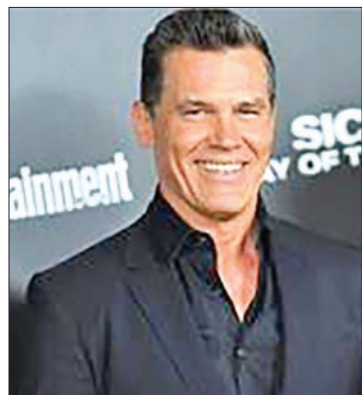
American actor Josh Brolin.

LOS ANGELES—Josh Brolin says he was initially sceptical about playing Thanos in “Avengers: Infinity War”, but when he saw Benedict Cumberbatch in “The Hobbit”, he was inspired to dig deep into his character.