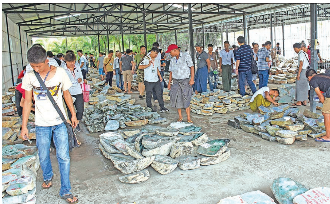
Jade merchants viewing pieces of jade at the Myanma Gems Emporium in Nay Pyi Taw yesterday.

cult to round up 4 to 5 gem merchants to inspect 4, 5 or 10 lots, said U Than Zaw Oo.