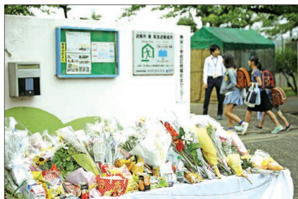
Gate of the Juei Elementary School.

The pair signed the Havana Declaration, which called for an end to Islamist abuses against Christians in the Middle East. But the agreement with the Moscow Church, which leads more than 130 million of the world’s 250 million Orthodox Christians, had been criticised by Greek-Catholic Ukrainians who felt betrayed by the pope.—AFP ■