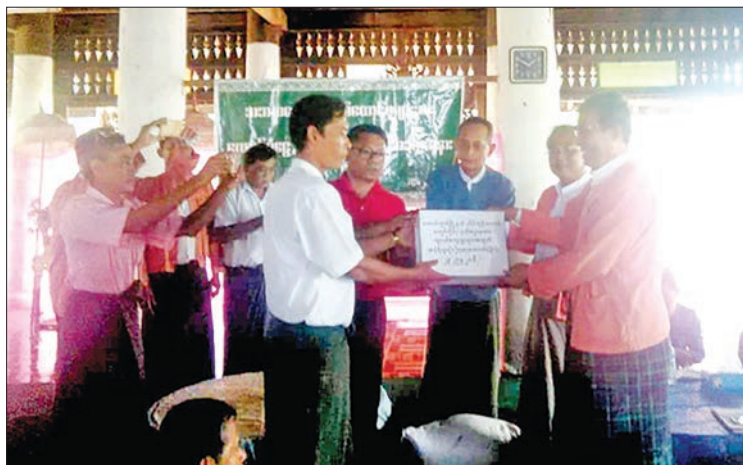
Rakhine State Chief Minister U Nyi Pu presents aids to flood-affected people at Bushwemaw village in Taungup Township.

RAKHINE State Chief Minister U Nyi Pu attended a ceremony in Taungup Township Lamumaw Village-tract, Bushwemaw Village monastery in Lamumaw Village-tract, Taungup township, on 20 June, to present rice bags donated by the Ministry of Social Welfare, Relief and Resettlement, the Rakhine State government and Daw Khin Kyi foundation for the flood-affected people.