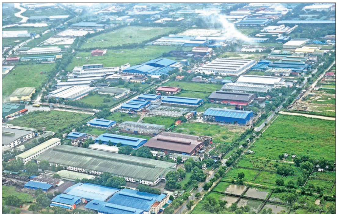
Following a survey in several areas including Hlinethaya Industrial Zone in Yangon's western outskirts, the authorities announced recently to establish industrial zones in 11 townships..

By implementing the industrial zones in 11 townships, the