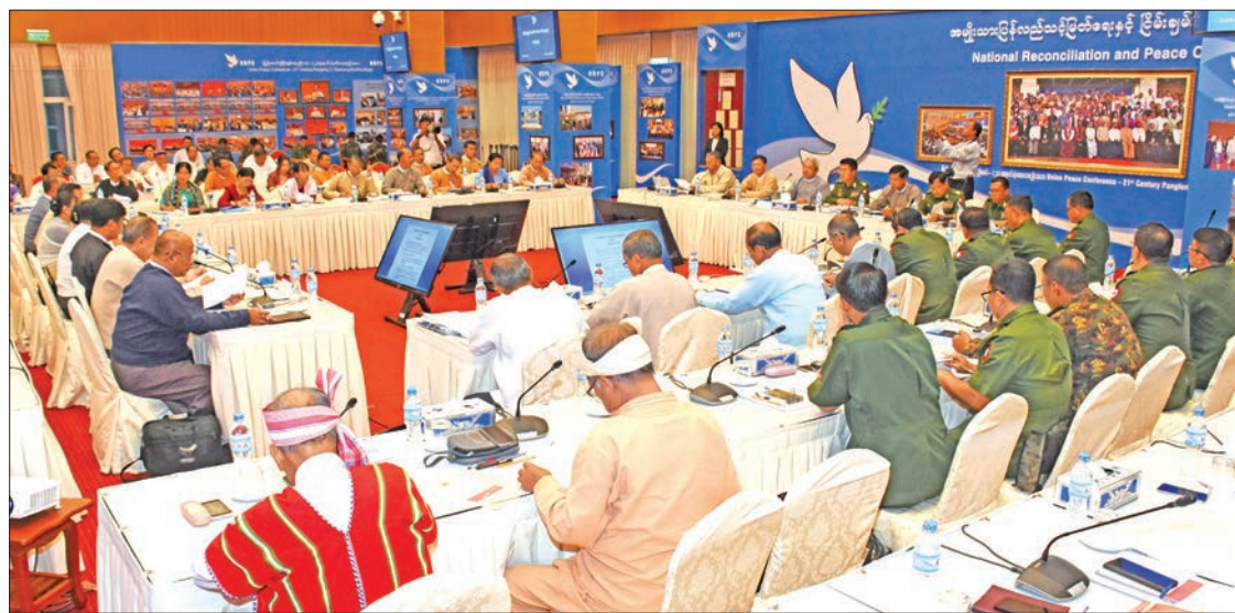
The preparatory meeting for the Union Peace Conference-21 st Century Panglong holds its meeting.

The meeting reviewed the sectors concerning the government, the Hluttaw, and the Tat-