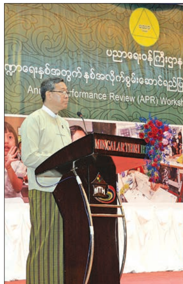
Union Minister Dr Myo Thein Gyi delivers the opening speech at the Annual Performance Review (APR) workshop on the NESP Nay Pyi Taw.

In his opening address, Union Minister for Education Dr. Myo Thein Gyi said the Ministry of Education had designated nine sectors in the NESP (2016-2021) with an aim towards creating education opportunities and providing students quality education, as well as set up 12 priority works to implement the reform. According to the NESP, emphasis is placed on no discrimination at all levels of education while creating opportunities, and ensuring that no one is left behind, that there are no dropouts and gender equality. The teaching and learning processes that enable the students to become good human beings, as well as cooperative, dutiful, responsible and innovative, will