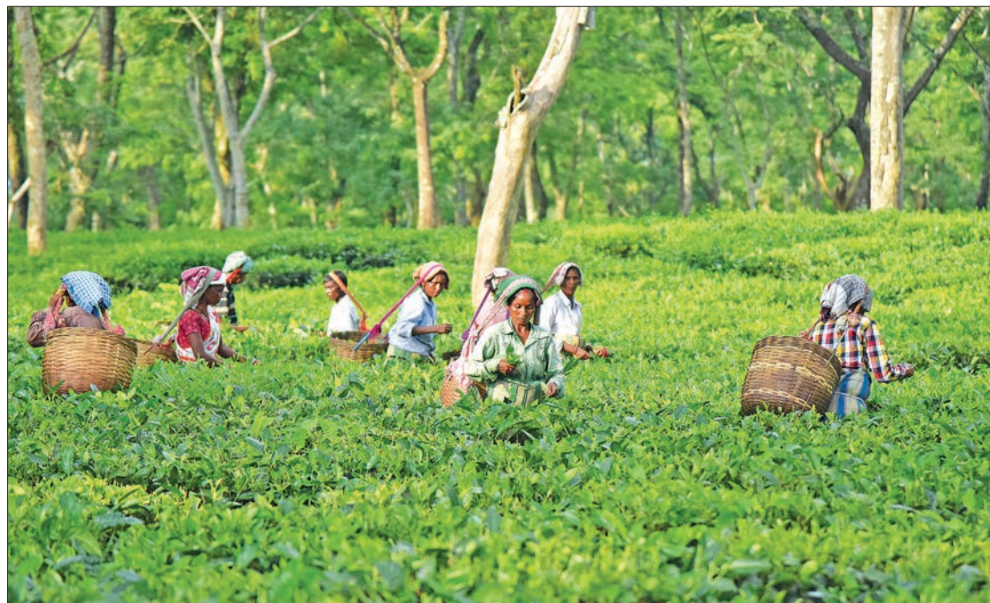
Indian tea farmers, many of them women, are scraping a living, Oxfam says.

to raise prices in order to take into account increases in the minimum wage, it said.