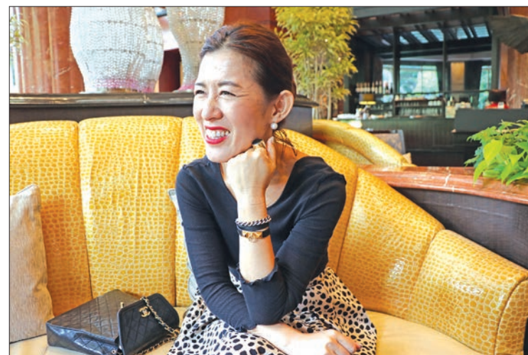
Japanese fashion stylist Naoko Okusa is interviewed in Tokyo on 13 June 2018.

post divorce, she says. At that time she needed to wear bright, vivid colors to make herself believe she was happy. She looks back on the few photos she has from those days and sees a lost girl trying hard to conceal her emotions.