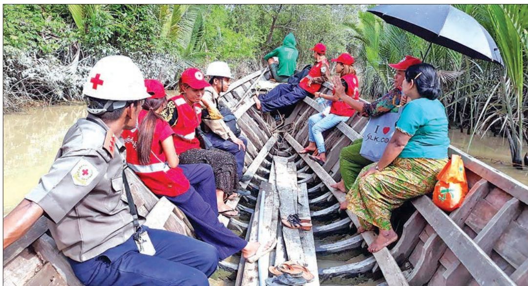
ICRC members visit to provide humanitarian assistance to victims of terrorist attacks and natural disasters in Rakhine State.

The ICRC provides unbiased humanitarian assistance to victims of terrorist attacks or other causes, while taking a neutral stance, with 16,000 staff members in over 80 countries around the world.—Min Thit (MNA) ■