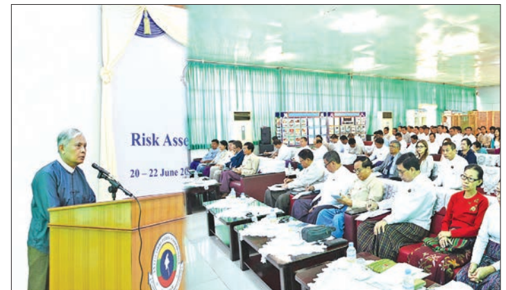
Anti-Corruption Commission Chairman U Aung Kyi addresses the workshop on "Risk Assessment in Public Procurement" in Nay Pyi Taw.

Preventing losses of public funds triggered by violations of