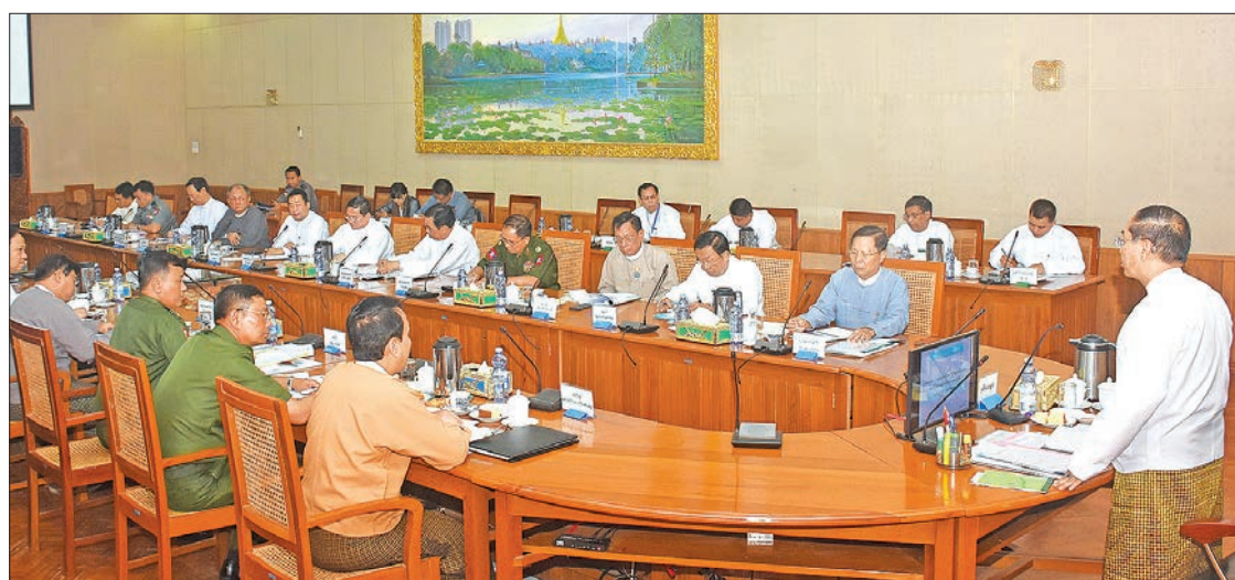
Vice President U Myint Swe addresses the first coordination meeting for holding 71 st Anniversary of Martyrs' Day in Nay Pyi Taw.

Vice President U Myint Swe is the patron of the central committee and Union Minister for Religious Affairs and Culture Thura U Aung Ko is the chairman of the 18-member committee.