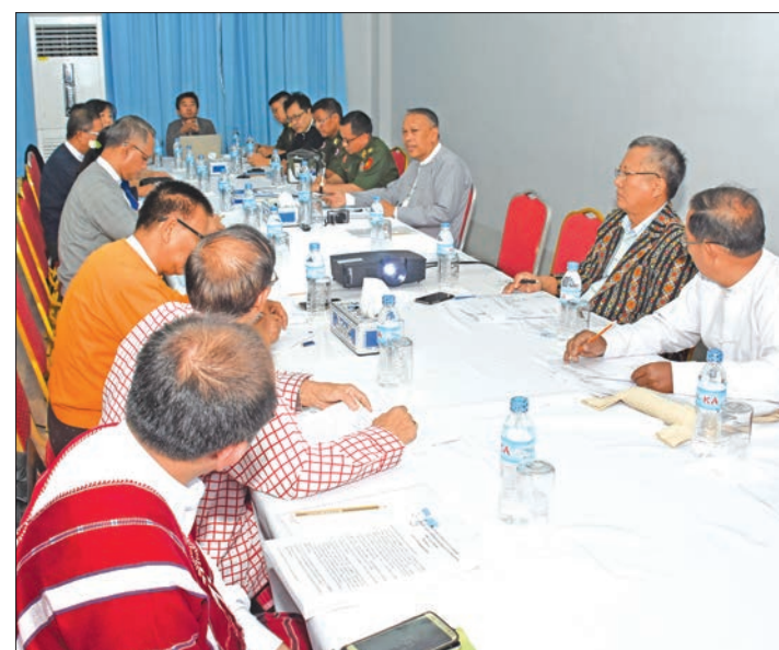
Participants discuss the economic sector in preparation for the Union Peace Conference—21 st Century Panglong (Third Session).

The Myanmar booth displayed the background designs of Myanmar's tour destinations, scenery, culture, beaches and traditional foods and vegetables.— Myanmar News Agency ■