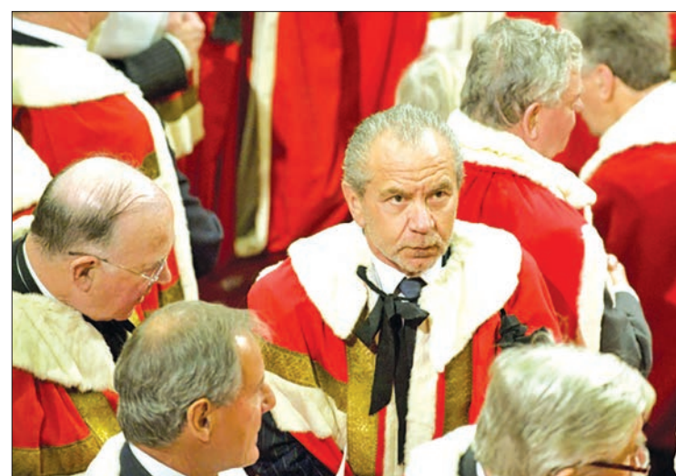
Labour prime minister Gordon Brown made Alan Sugar, 71, a lord in 2009, but he left the party in 2015, citing its "negative business policies".

The 13th edition of the famed film festival will run from 18-28 October.—PTI ■