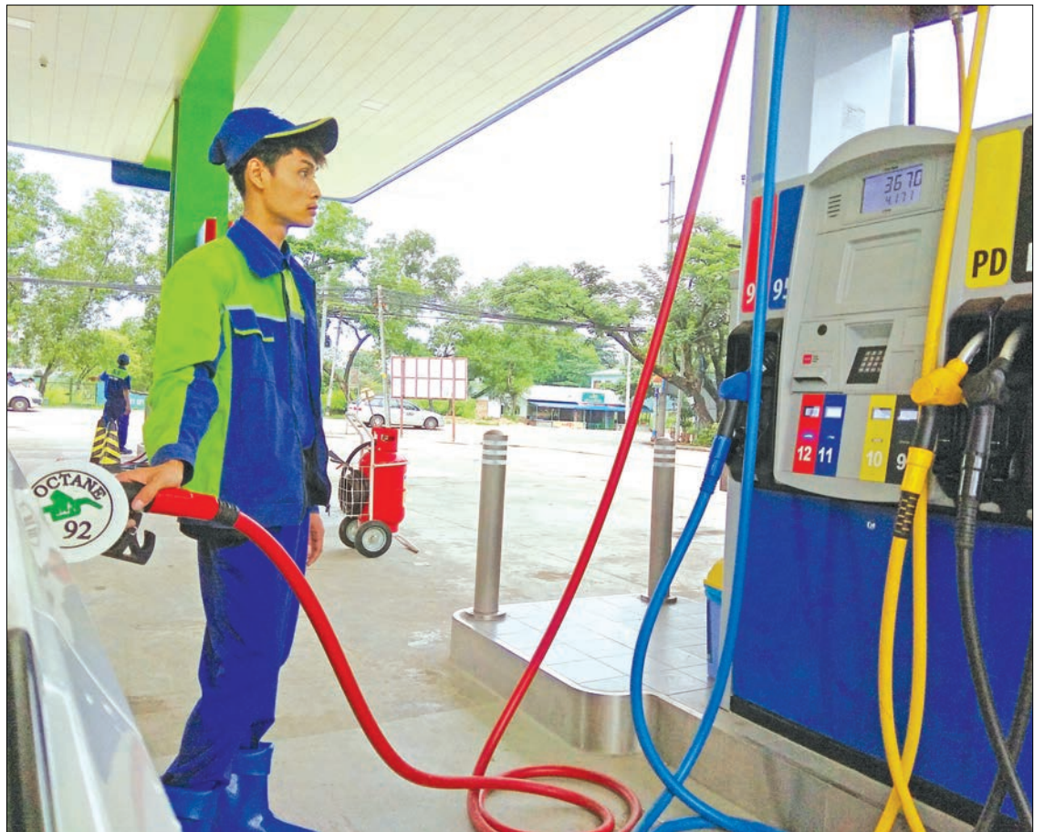
A man refilling the car with fuel at a filling station in Yangon.

South Korea is listed as the sixth largest foreign investor in Myanmar. Investments worth over US$3.8 billion were brought into Myanmar by Korea, as of May 2018, according to statistics of the Directorate of Investment and Company