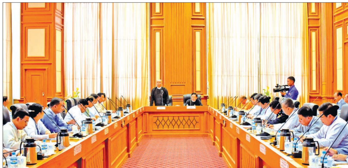
Pyidaungsu Hluttaw Speaker Mahn Win Khaing Than delivers the speech at the meeting on maintenance of Hluttaw buildings in Nay Pyi Taw yesterday.

THE central committee and working committees for maintenance of Hluttaw buildings, held a coordination meeting regarding maintenance of electrical, multimedia and communications systems and fire safety. The meeting was held inside the Zabuthiri Hall of the Hluttaw Building in Nay Pyi Taw yesterday.