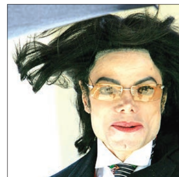
US pop singer Michael Jackson, seen here in a picture taken in 2005, is the subject of a Broadway musical that producers hope to premiere in 2020.

Jackson died while under propofol, a powerful anesthetic administered by his personal doctor to help him sleep. The singer had been acquitted four years