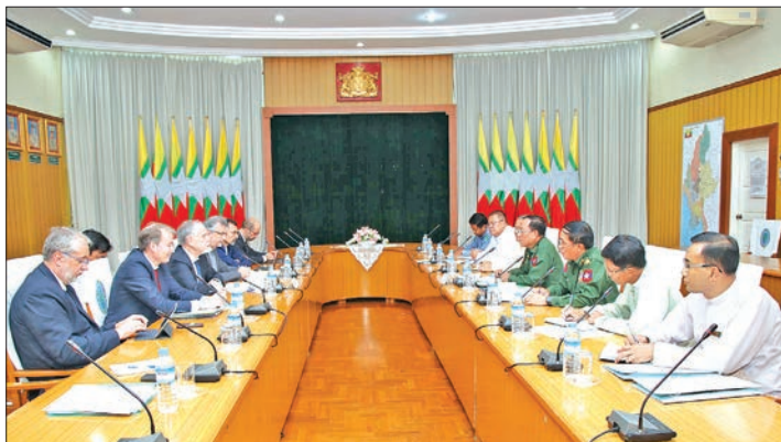
Union Minister Lt-Gen Ye Aung holds talks with Mr. Jean Louis Ville from European Commission in Nay Pyi Taw.

During the meeting, they discussed matters related to cooperation between the Ministry of Border Affairs and UN organisations, international governmental organisations and International non-governmental organisations, cooperation between the Myanmar government and the European Union, as well as teaching the ethnic people in the border areas, in accordance