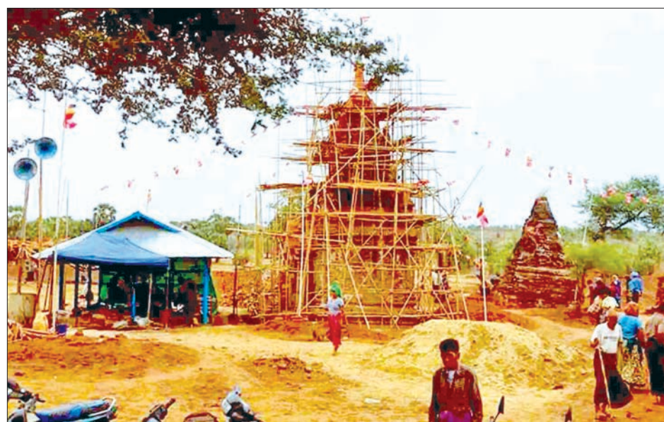
Locals renovate ancient pagodas in Nyaung U Township, Mandalay Region.

Financial contributions from donors to ren-