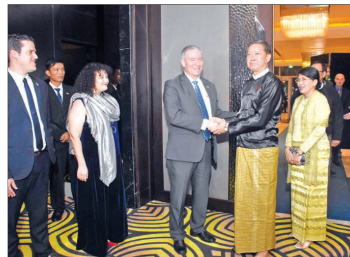
Union Minister Dr Myo Thein Gyi and wife Daw San San Yu welcomed by the Ambassador of Israel Mr. Daniel Zonshine.

The ceremony was attended by Yangon Command Commander Maj-Gen Thet Pone and wife; ambassadors and diplomats from foreign embassies in Myanmar; and representatives from the United Nations and guests.—MNA ■