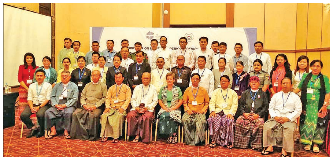
Hluttaw representatives and attendees pose for the photo at the Universal Periodic Review (UPR) - Myanmar Workshop in Nay Pyi Taw.

The Universal Periodic Review — Myanmar Workshop will be held until 21 June. —Myanmar News Agency ■