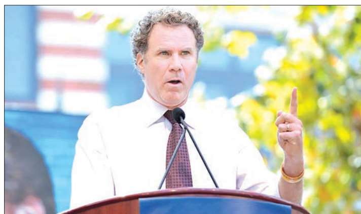
Actor Will Ferrell — shown here in 2012 at a press conference for the release of "The Campaign" — is reportedly working on a film for Netflix about the Eurovision Song Contest.

No release date has yet been set for "Eurovision," which would be Ferrell's second Netflix project after romantic comedy "Ibiza," which he co-produced though he did not appear in it. AFP reached out to Ferrell and Netflix but neither was immediately available to comment.—AFP ■