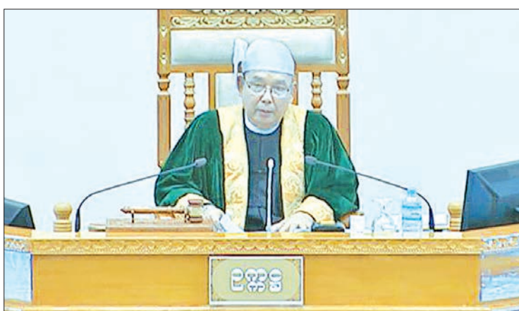
Amyotha Hluttaw Speaker Mahn Win Khaing Than.

Dr. Kyaw Ngwe of Magway constituency (10) asked if national support can be given to Myedaw, Nayin, Sinte, and Nweni village tracts located beside the Ayeyarwady River in Yesagyo Township in Magway Region. He said the villagers are facing erosion from the river and are constructing their own make-shift dykes and embankments. Deputy Minister for Transport and Communications U Thar Oo replied that they have submitted a budget of Ks350 million for the Magway Region Government's 2018-2019 Fiscal Year. He said the Directorate of Water Resources and Improvement of River Sys-