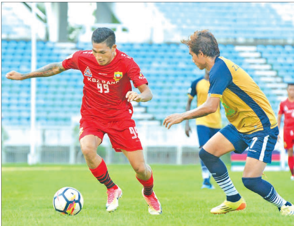
Shan United (red) Rakhine United (yellow) vie for the ball in yesterday's Quarterfinal of General Aung San Shield 2018 at Thuwunna Stadium.

With the win, Shan United will take on Hanthawady United in the semifinal. Hanthawady beat Sagaing United by a score of 2-1 in the other quarterfinal match.—Lynn Thit(Tgi) ■