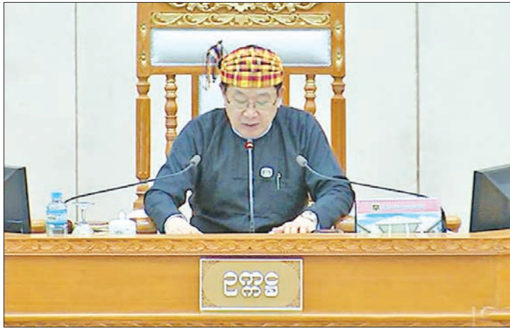
Pyithu Hluttaw Speaker U T Khun Myat.

The 18th-day meeting of the eighth regular session of the second Pyithu Hluttaw was held at the Pyithu Hluttaw meeting hall in Nay Pyi Taw yesterday morning. Union Minister for Industry U Khin Maung Cho and Deputy Minister for Agriculture, Livestock and Irrigation U Hla Kyaw replied to starred questions and the MPs discussed a motion.