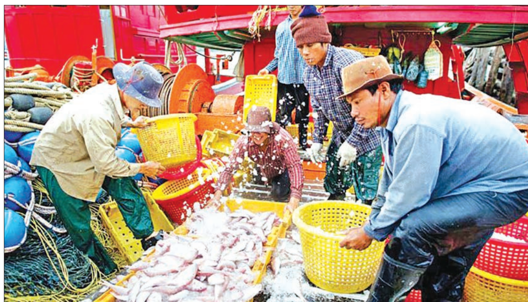
Migrant workers sort out fish on a fishing boat in Thailand.

Those who do not have the required documents in hand,