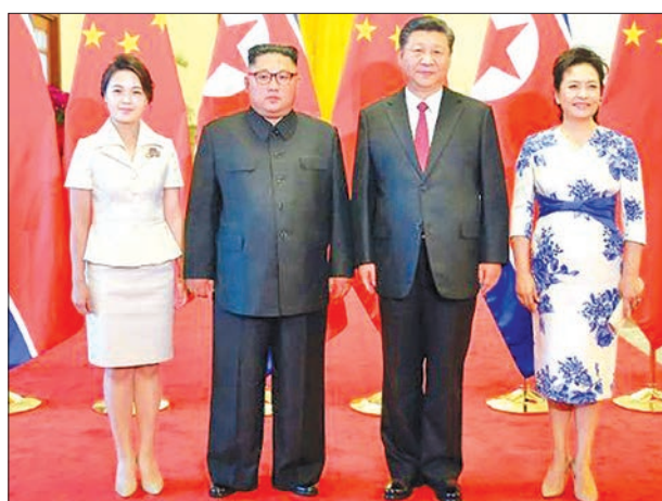
The first ladies of North Korea and China joined their husbands Kim Jong Un and Xi Jinping at the gathering in Beijing.

The Cold War-era allies, which fought side-by-side against US-led UN forces and South Korea in