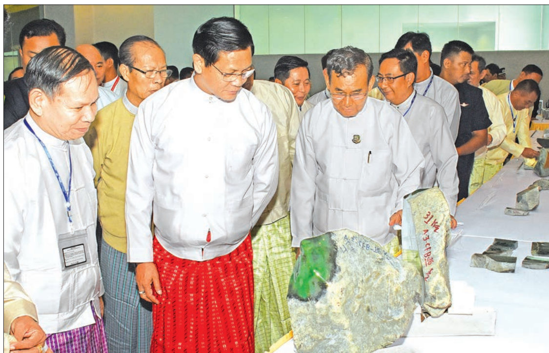
Vice President U Henry Van Thio looks at jade stones displayed at the 55 th Myanmar Jade and Gems Emporium in Nay Pyi Taw.

The Myanmar Gems Emporium has been held since 1964 and