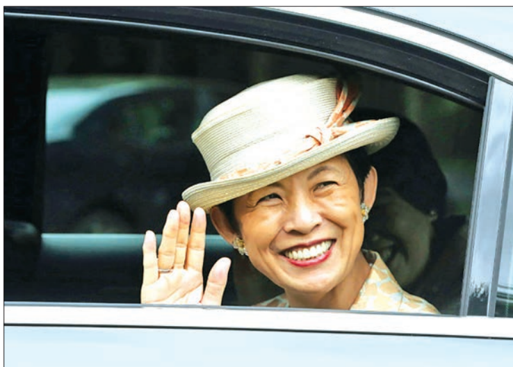
Princess Takamado of Japan, pictured here in Dublin, is a keen football supporter who has travelled to every World Cup to support Japan since 1998.

Ties between Japan and Russia have been strained for decades over four islands occupied by the Soviet Union in the closing days of World War II