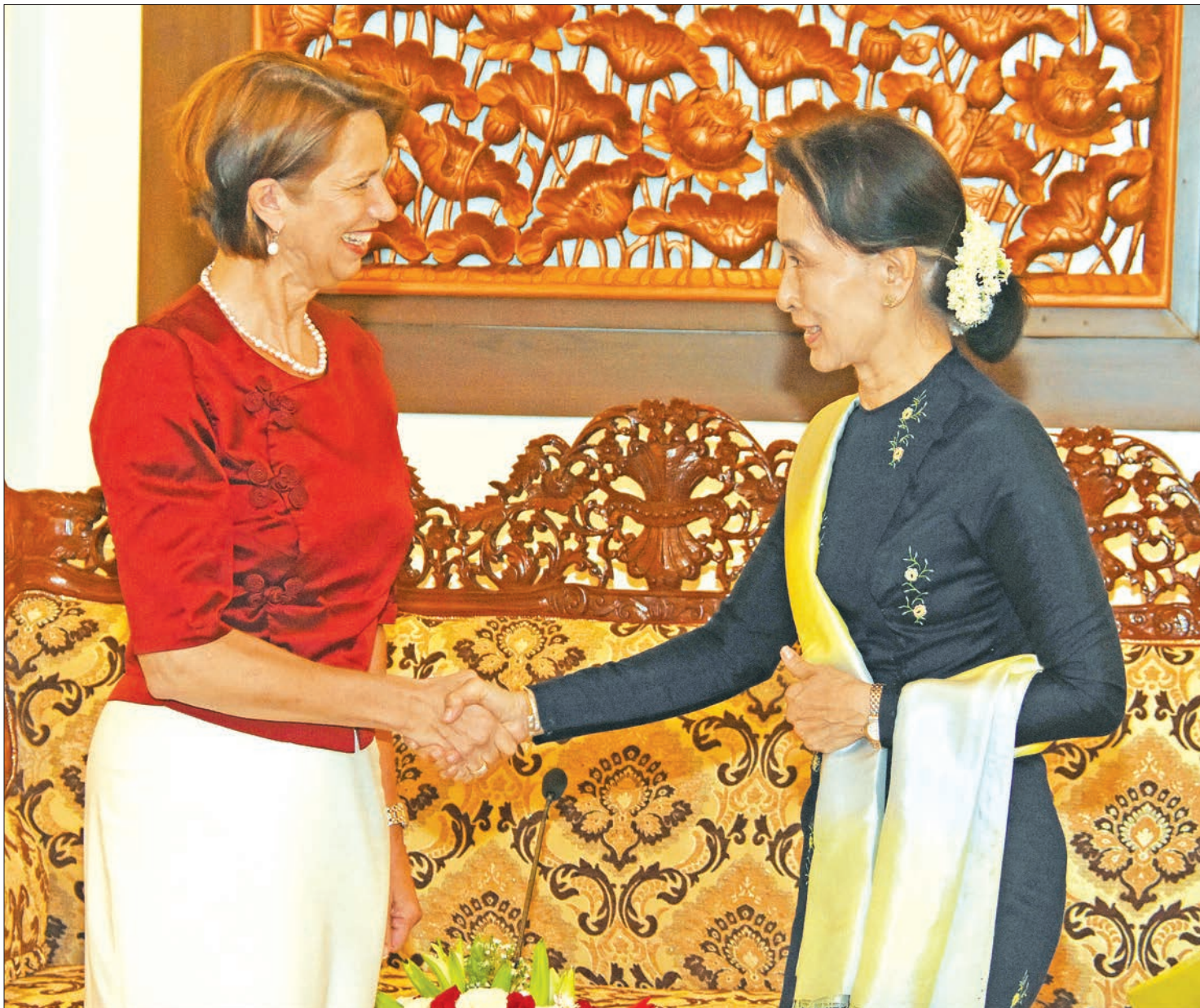
State Counsellor Daw Aung San Suu Kyi welcomes United Nations Secretary-General's Special Envoy Ms. Christine Schraner Burgener at the Ministry of Foreign Affairs in Nay Pyi Taw yesterday.