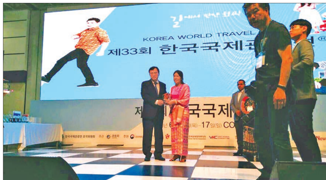
Myanmar representative receives the Best Booth Operation Award at the KOTFA 2018 - 33 rd Korea World Travel Fair in Seoul, South Korea.