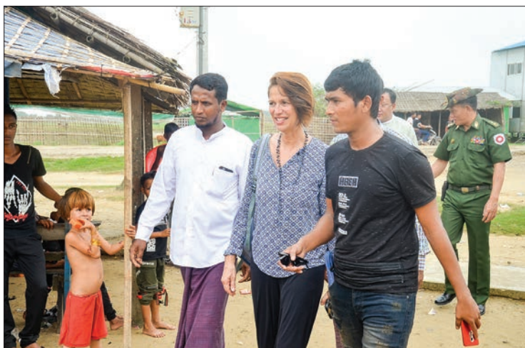
UNSG's Special Envoy Ms. Christine Schraner Burgener visits IDP camp in Thakkepyin Village in Maungtaw.

Yesterday, The UN Special Envoy, deputy minister, and state