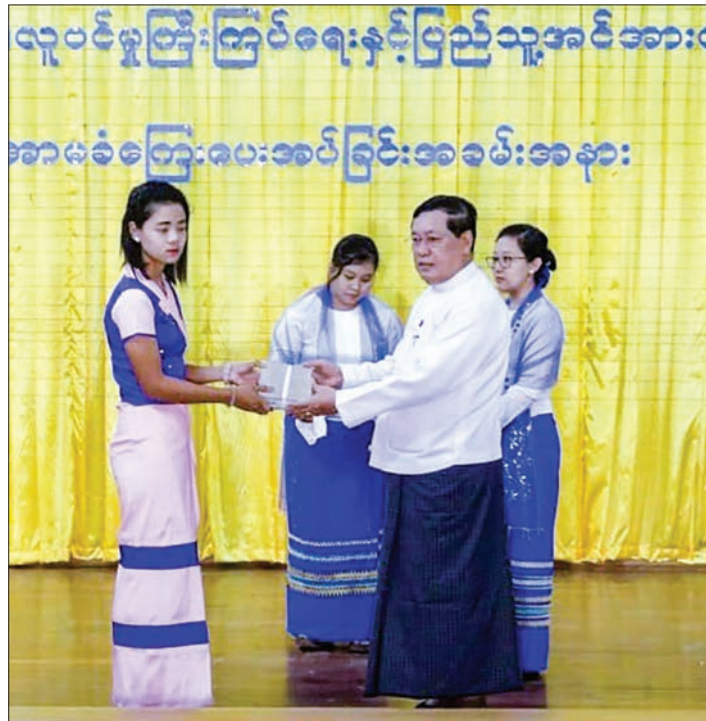
Union Minister for Labour, Immigration and Population U Thein Swe hands over life insurance payment to a family member of the deceased workers.

At the ceremony, the Union Minister said a total of 700,000 baht—400,000 baht under the Thai travel law and 300,000 baht under car insurance—were pro-