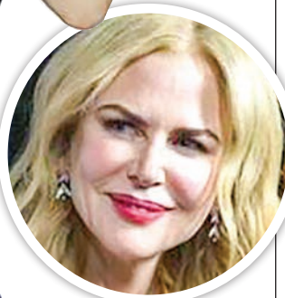
Hollywood star Nicole Kidman.