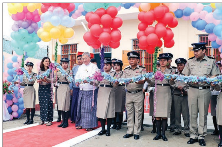
Officials cut ribbon to open the first new health clinic at the handover ceremony in Myitkyina Prison, Kachin State.

in Myanmar's prisons, and they have only a limited access to healthcare services. Therefore, they are highly susceptible to communicable diseases such as tuberculosis, HIV, hepatitis and cholera.