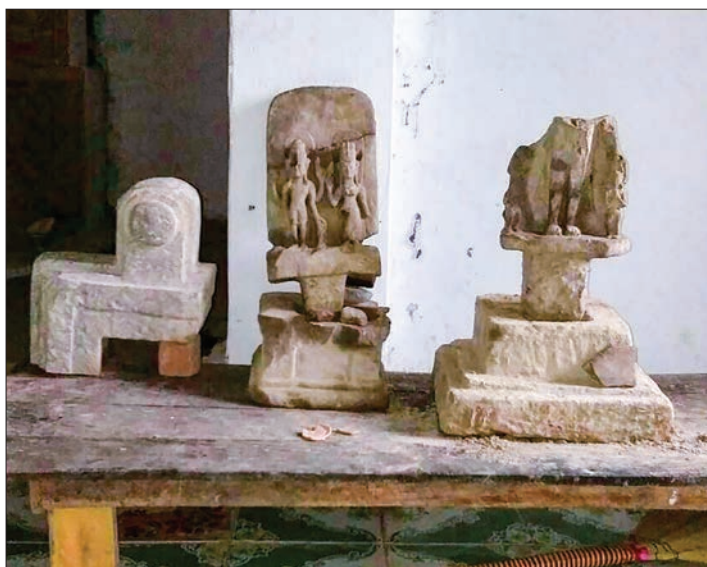
Photo Shows Old Stone Statues found by a traveller.

All the statues were dug out from the creek with the help