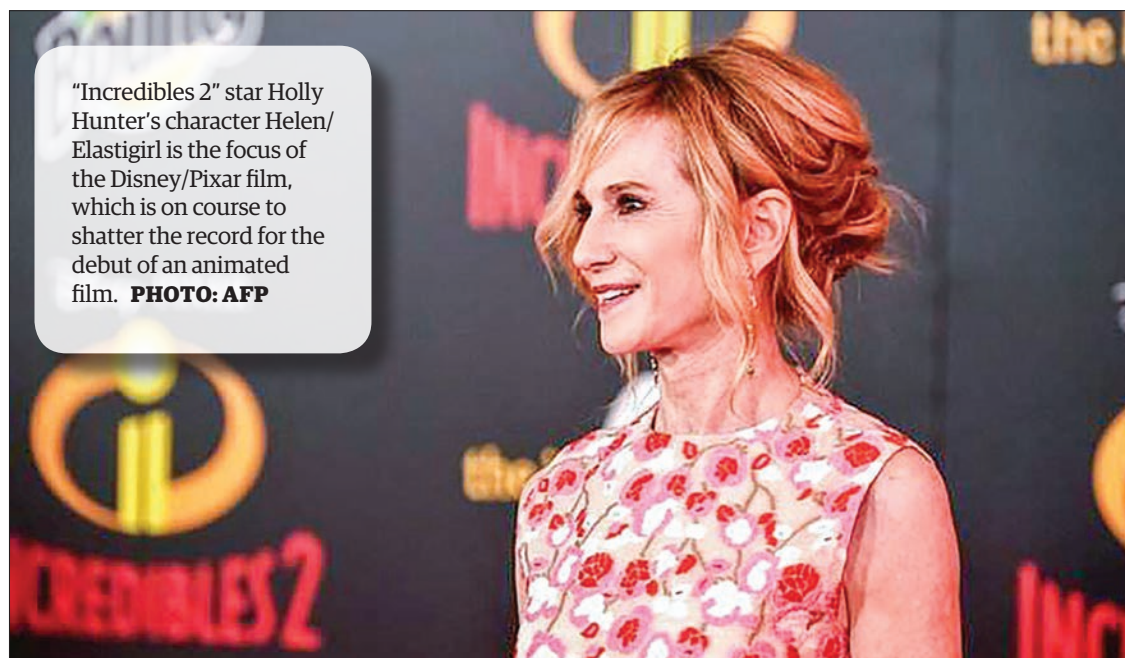
“Incredibles 2” star Holly Hunter’s character Helen/Elastigirl is the focus of the Disney/Pixar film, which is on course to shatter the record for the debut of an animated film.

LOS ANGELES — “Incredibles 2,” the long-awaited return of a quirky animated superhero family from Disney-Pixar, reigned supreme at the North American box office, raking in a record $180 million in its debut, industry estimates showed Sunday.