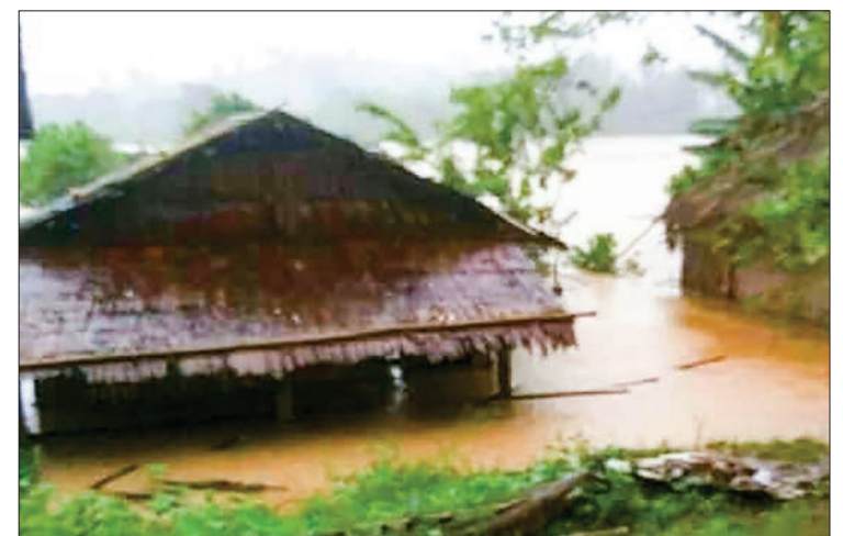
Floods in Maei submerge rice fields and destroys paddies stored in granaries.

SOME villages in Maei Township, Rakhine State were inundated with rain and a few reservoirs broke after the combination of heavy rains and strong winds, damaged farmland and tons of paddy.