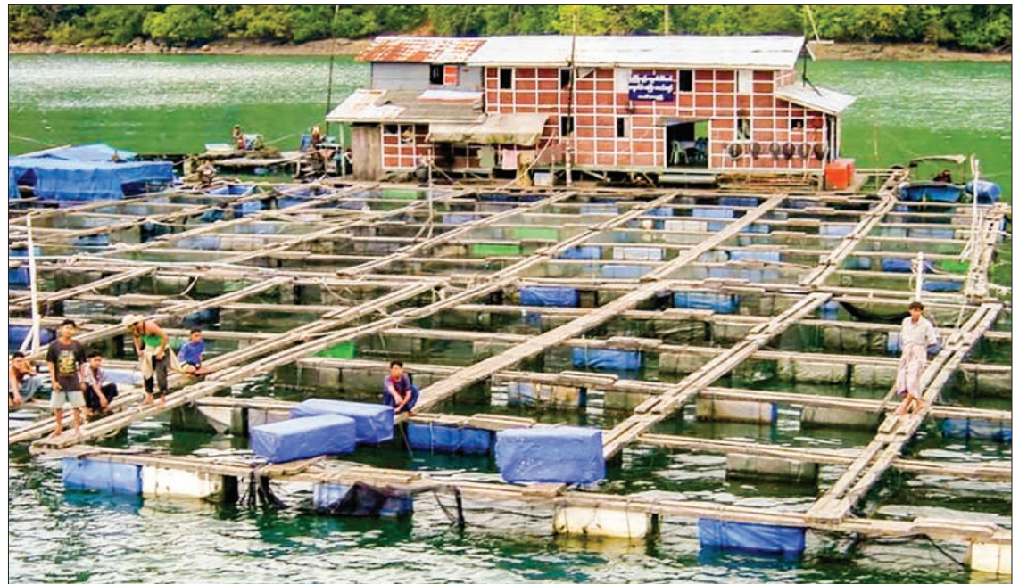
An artificial pond is used for fish farming.

Earlier, the Fisheries Department had published