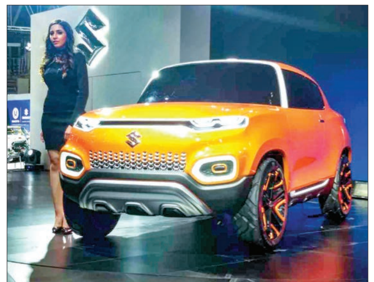
A model stands next to the Concept Future S, a prototype vehicle made by Maruti Suzuki India Ltd., displayed in Greater Noida, India on 9 February, 2018.

“In a certain developed country, a swing back to (steps based on) result-oriented criteria has been emerging,” the report said.—Kyodo News■