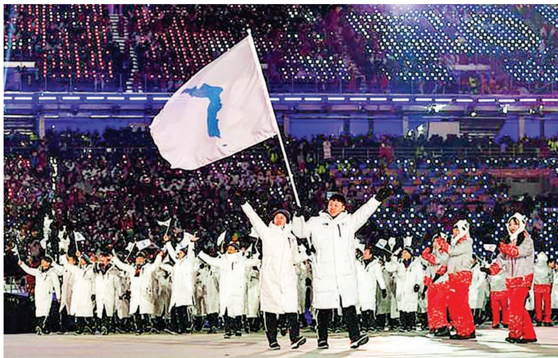
Athletes from the two Koreas marched together at the Winter Olympics this year.