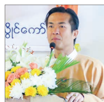
Kayah State Chief Minister, U L Phaung Sho, speaking at the workshop.

The workshop focussed on the state and region budget