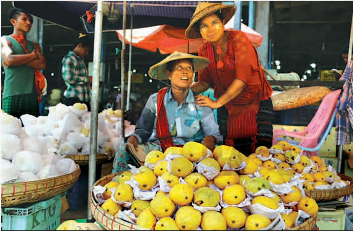
Mangoes vendors wait for customers.