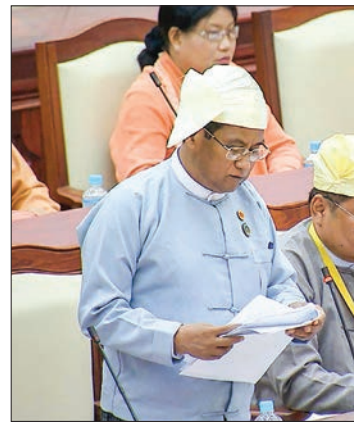
Deputy Minister for Social Welfare, Relief and Resettlement U Soe Aung.

teachers in Mongton Township's Mansap Village middle school, Union Minister for Education Dr. Myo Thein Gyi said the school had one principal, six middle school teachers, four primary school teachers and three office staff. Of those 11 assigned from afar, seven were staying in the school, while four were living in the village. The ministry should do something about the living conditions and toilet facilities that are found lacking, but there is not enough funding for this in the 2018-2019 fiscal year. As the teachers and staff are facing some difficulties, the ministry will review whether some repair works through maintenance cost, allocated for the 2018-2019 fiscal year, can be utilised for this matter. The ministry will include