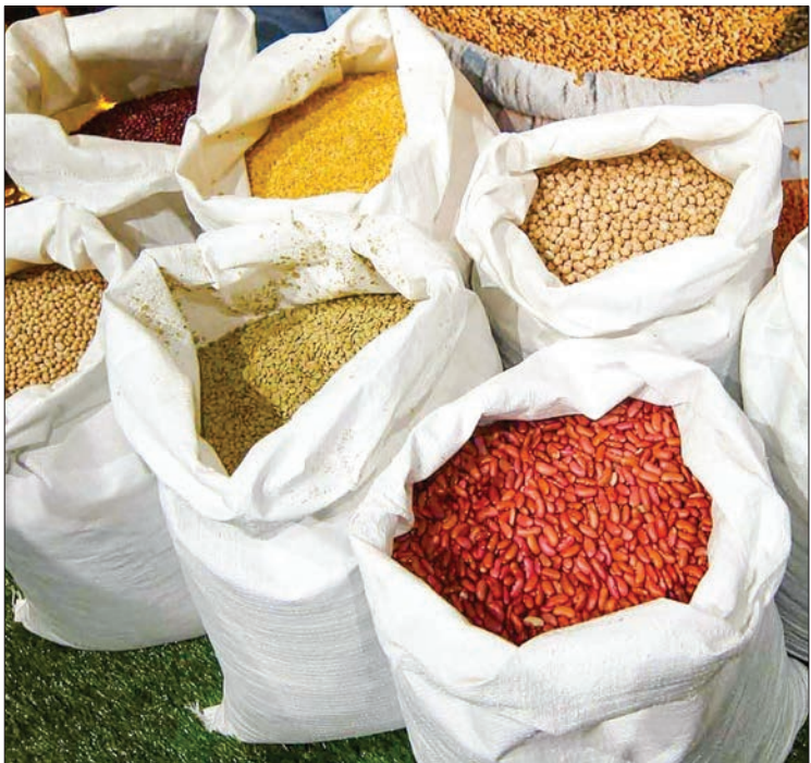
Myanmar pulses are kept on display for sale in a shop at a market.

Nevertheless, India buys only 30 per cent of pigeon peas from Myanmar, making its market uncertain. The commerce ministry has already requested growers not to choose pigeon peas in the coming cultivation season. Various pulses, including green grams, which are exported to other foreign markets, are also fetching a good price in the market. ■