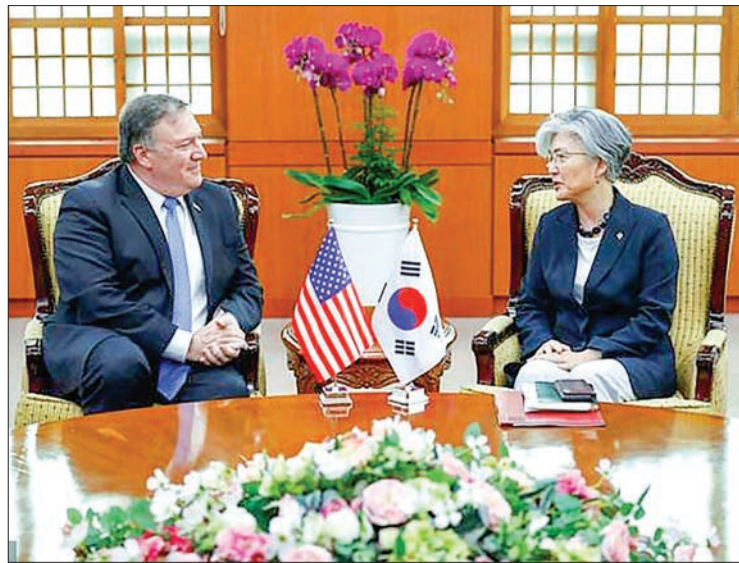
Kang meets Pompeo in Seoul last week: she has suggested sanctions on North Korea could be eased before full denuclearization.

Amid fears the summit would weaken the international coalition against the North’s nuclear programme, US Secretary of State Mike Pompeo stressed after the meeting that sanctions would remain in place until North