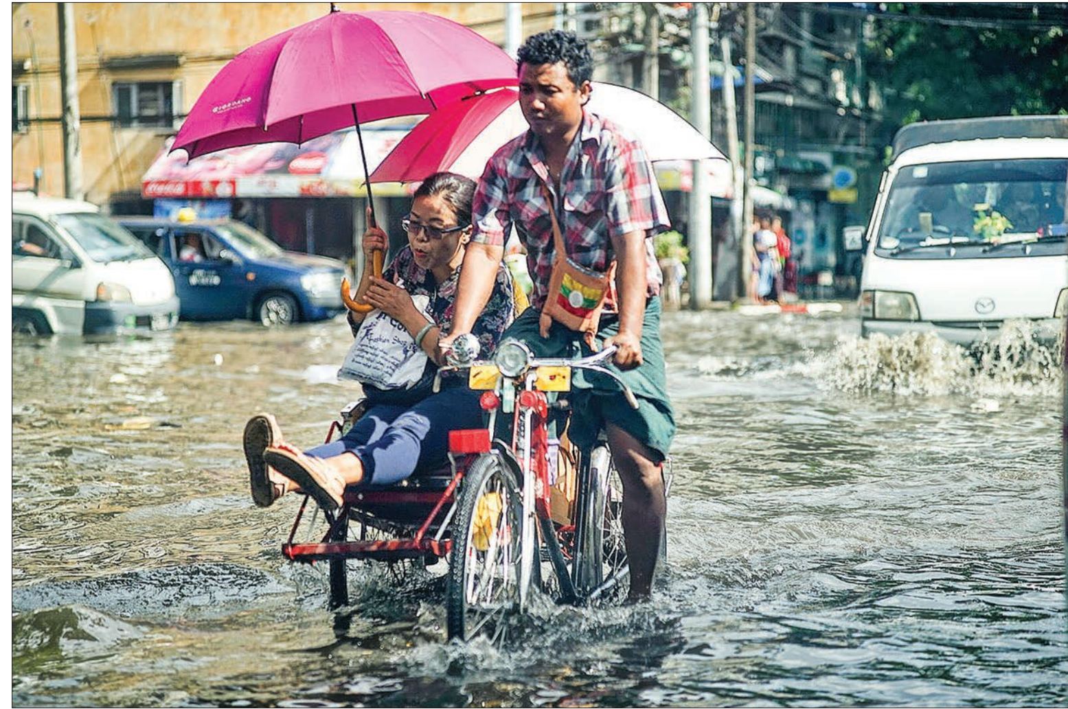
A trishaw carrying a passenger wades through a flood road after heavy rain in Yangon recently.

While countries are improving their national emergency capabilities, central governments often defer to their local counterparts for the choice of the systems to adopt. Advances in ground-based networks of radars, but increasingly also on satellite data, are key to nearly continuous observation of global weather. As satellites provide