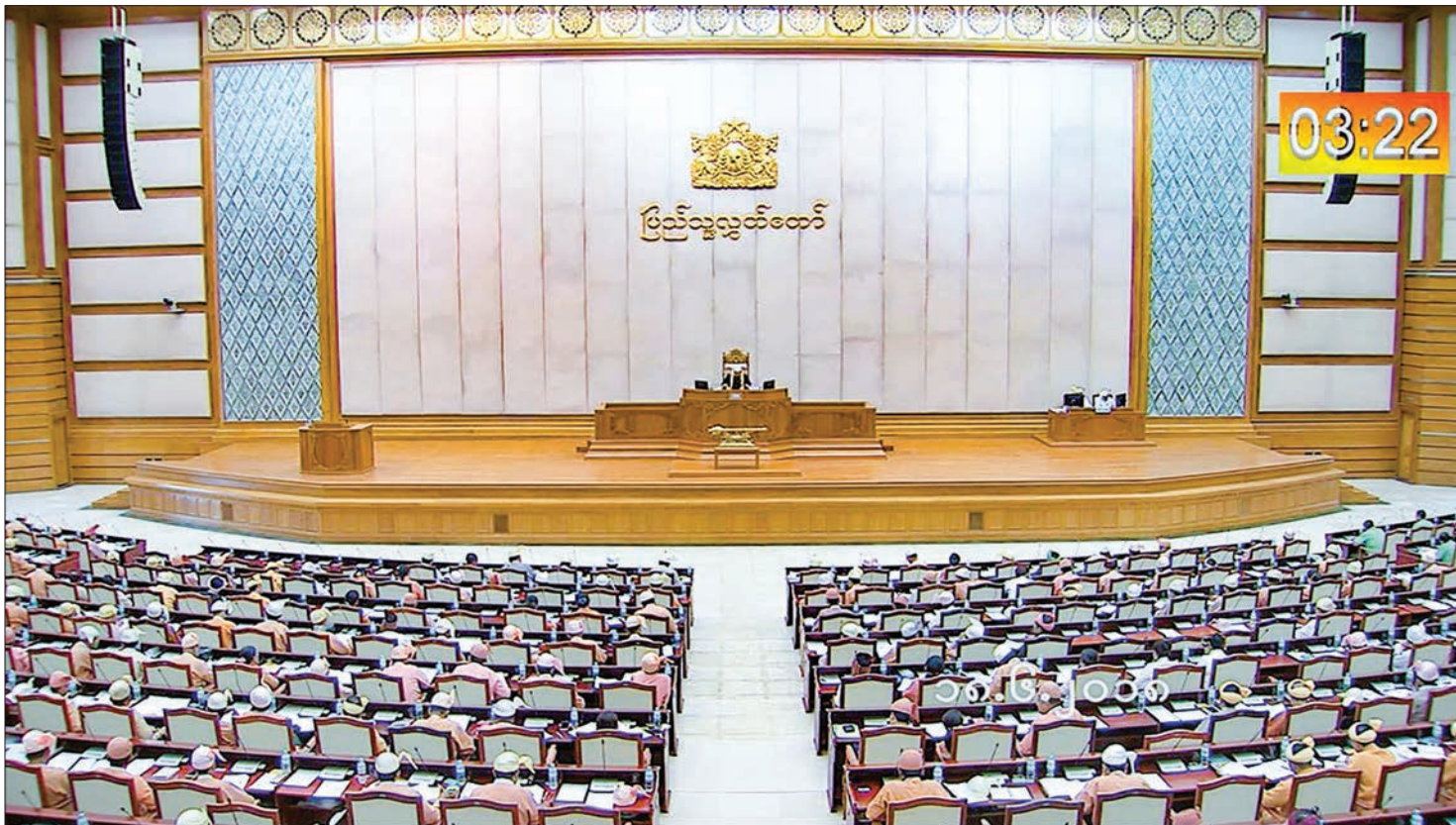
Pyithu Hluttaw is being convened in Nay Pyi Taw.