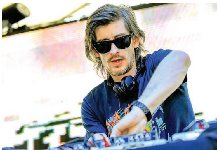
Kavinsky, one of several DJs associated with the “French Touch” sound, will be among the performers at a free concert at the Elysee Palace in Paris on Thursday.