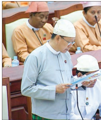
Union Minister for Education Dr. Myo Thein Gyi.

Replying to the first question posed by Daw Nan Moe of Mongton constituency on the plan to construct houses for