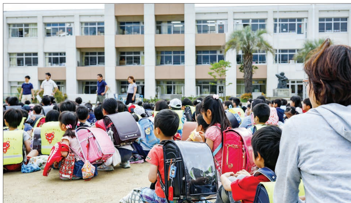
Students of a public elementary school in Osaka's Ikeda city evacuate to the school yard after a strong earthquake with a preliminary magnitude of 5.9 hit western Japan on 18 June, 2018.