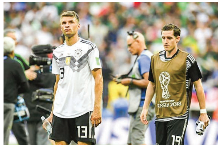
Germany’s media reacted with concern and worry to the World Cup holder’s shock 1-0 defeat against Mexico on Sunday.

Magazine Sports Bild commented “There were no world champions to be seen on the pitch” in a damning verdict on the below-par performance.—AFP ■