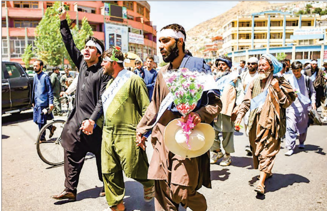
Afghan peace activists shout slogans demanding an end to fighting as they arrive in Kabul.

The Taliban refused to extend their three-day ceasefire beyond Sunday night despite