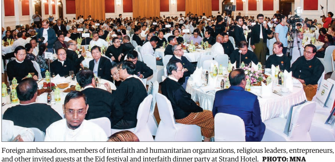
and other invited guests at the Eid festival and interfaith dinner party at Strand Hotel.

AN interfaith get-together dinner party for the Eid festival was held at the Strand Hotel in Yangon yesterday evening.