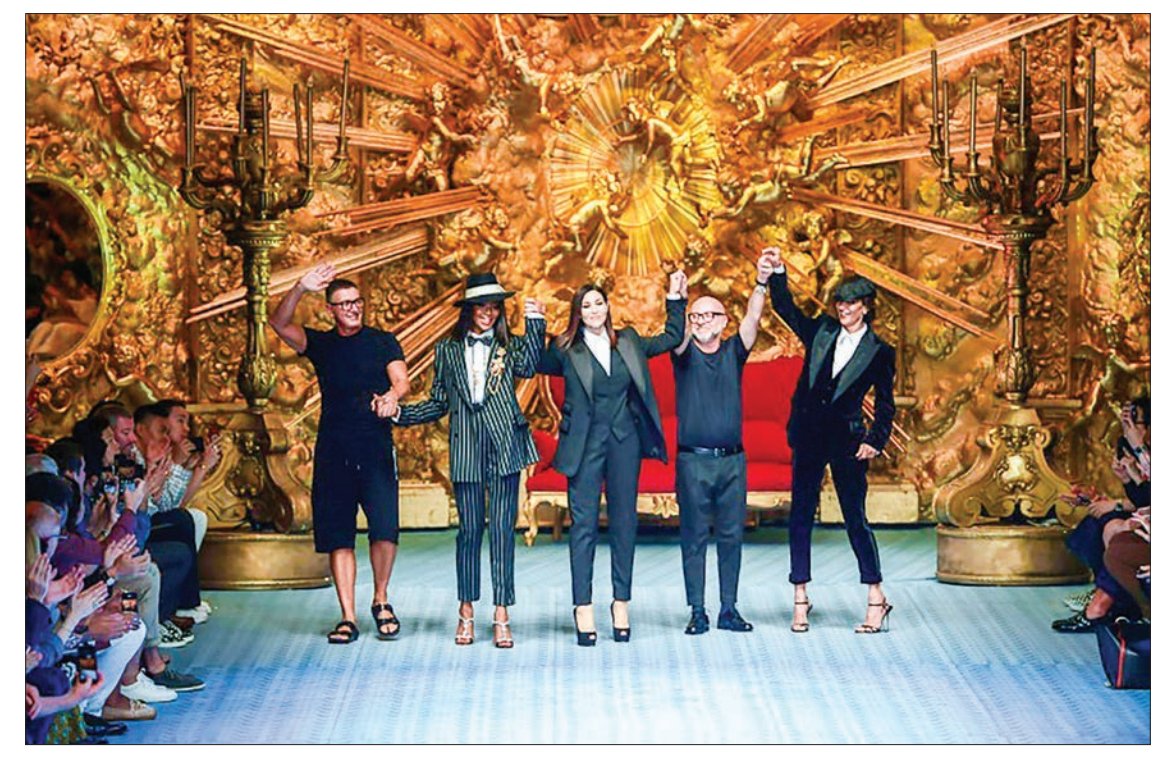
Campbell and Bellucci pose with designers Domenio Dolce and Stefano Gabbana.

Bellucci showed off a threepiece coal black suit with a wide lapel, teetering on vertiginous