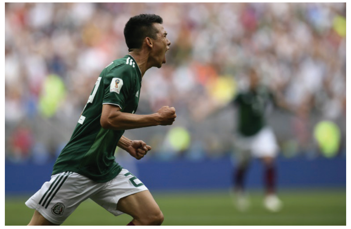
Hirving Lozano scored the goal that stunned Germany. PHOTO: AFP

One desperate last attack had Neuer come up for a corner, but a towering header from the veteran Marquez and subsequent claim from Ochoa allowed Mexico to close out an unforgettable triumph.—AFP