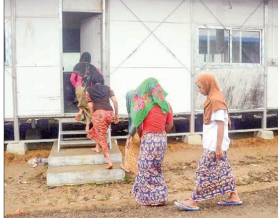
Men and women enter separate housing facilities during their stay at Nga Khu Ya reception centre.

aged from bad weather and the boatmen docked at the nearest coast. We have reason to believe the people who claim they are from Buthidaung and Maungtaw have stayed in camps on the Bangladesh side.