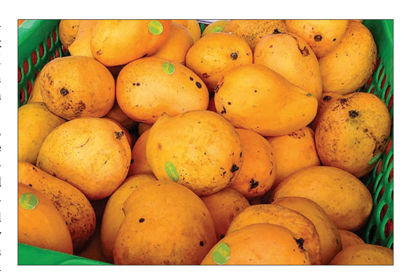
The price of Sein Ta Lone mangoes from Monywa Township has increased.

South Korea's investments in Myanmar at the end of May this fiscal year reached $6.98 million, according to a report of the Directorate of Investment and Company Administration. Its investment in Myanmar last