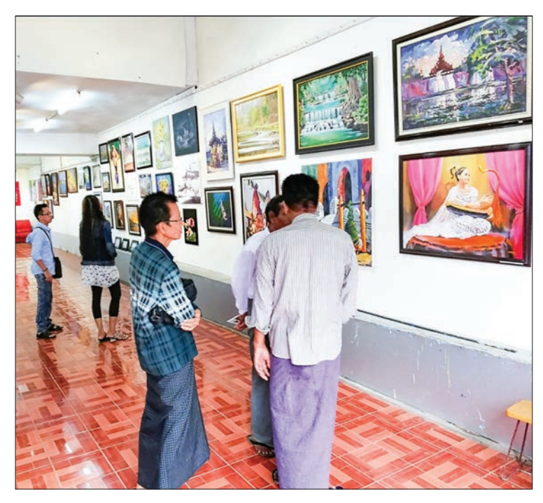
Guests viewing the numerous works of arts on exhibit at the Mandalay Hill Art Gallery by its ninety-three member artists.

The Mandalay Hill Art Gallery is located at the base of Mandalay Hill near the prominent lion statutes of Aungmyethazan Township.