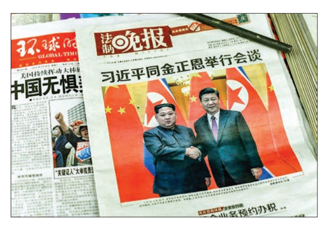
Chinese officials have moved quickly to remind both the US and North Korea that Beijing was indispensable in negotiations with Pyongyang.

"The results of the Singapore Summit are basically in line with China's expectations," said