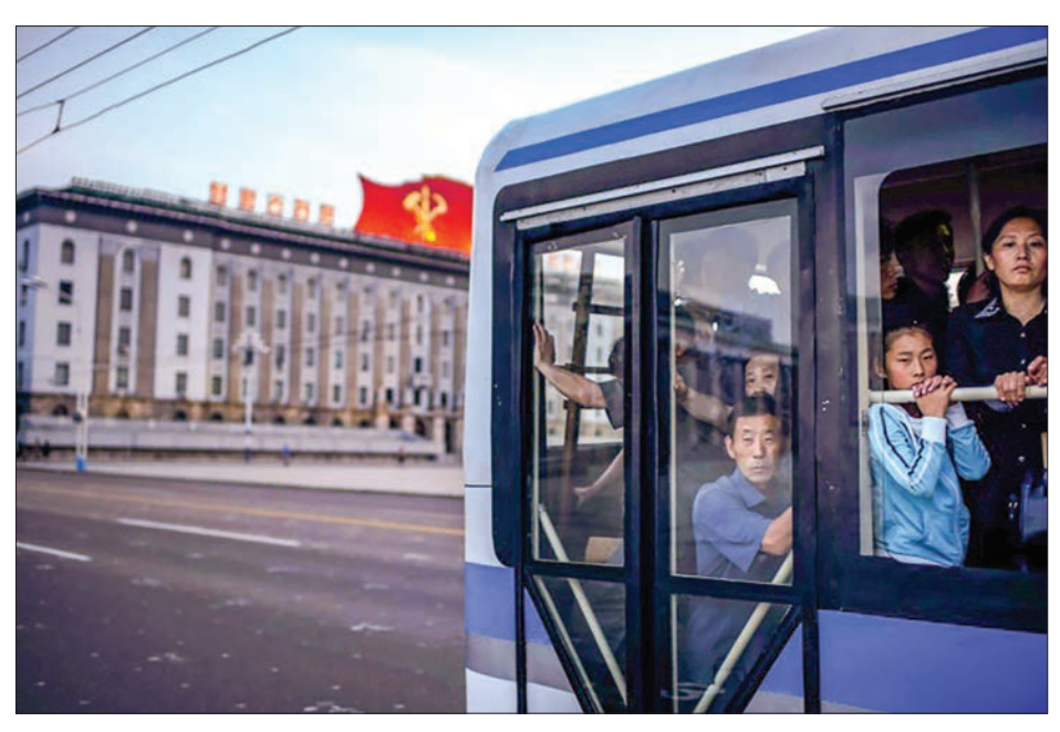
Optimists say that with mineral wealth, cheap labour, and a helpful geographical location, the North has huge potential.

But the history of overseas firms who have tried to set up operations in the isolated, impoverished country is a long and sorry one. Rules that can change on a whim, bills that are never paid, and the threat of expropriation hang over foreigners who step into