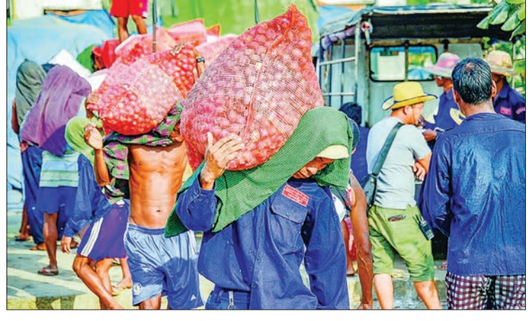
Labourers unload sacks of onion from a truck.

Both countries conduct bilateral border trade primarily through Sittway and Maungtaw border trade camps. Between 1 April and 8 June this year, trade via the Sittway gate was $2.093 million, including $0.02 million in the imports whereas trade via the Maungtaw trade station was $2.278 million. During the period, there was no