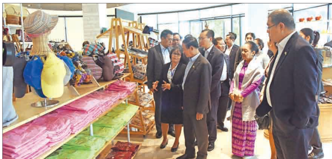
President U Win Myint and First Lady Daw Cho Cho, view products at the Mado Pavilion agricultural museum in Pathum Thani, Thailand.

In the evening, President U Win Myint and First Lady Daw Cho Cho attended a dinner hosted by Thai Prime Minister General Prayut Chan-o-cha (Retd) in honour of the leaders from ACMECS countries who will attend the 8 th ACMECS Summit and 9 th Cambodia-Lao-Myanmar-Viet Nam- CLMV Summit. — Myanmar News Agency ■