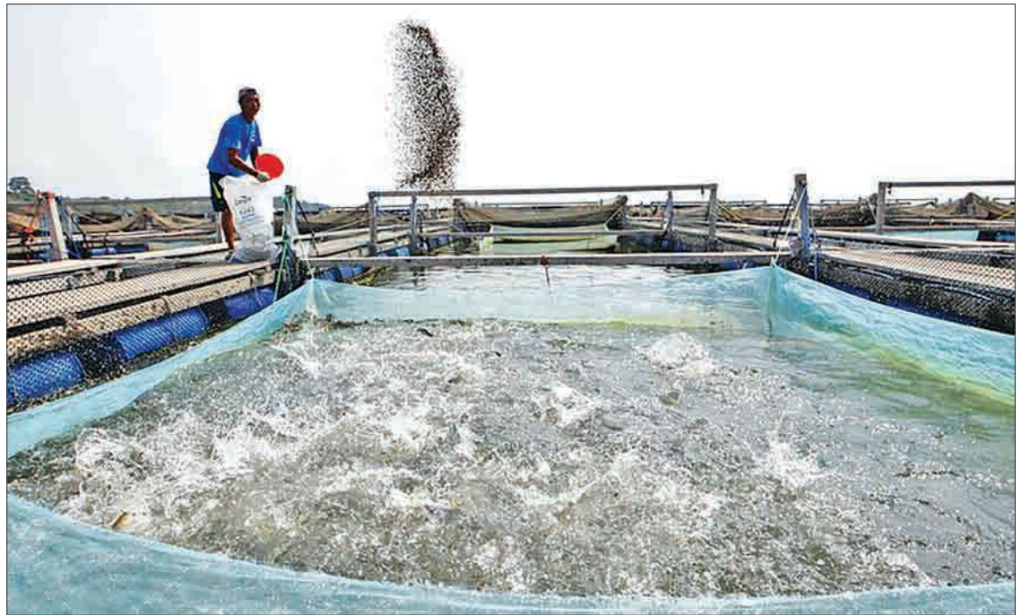
A fish farm worker feeds his stock.

Some 30 hatcheries are operating under the Myan-