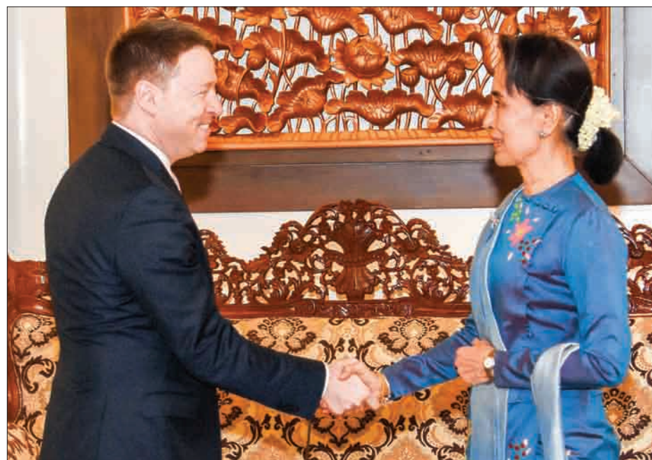
State Counsellor Daw Aung San Suu Kyi welcomes Mr. Matt Pottinger, Senior Director for Asian Affairs, at the White House National Security Council. (NEWS ON PAGE-1)