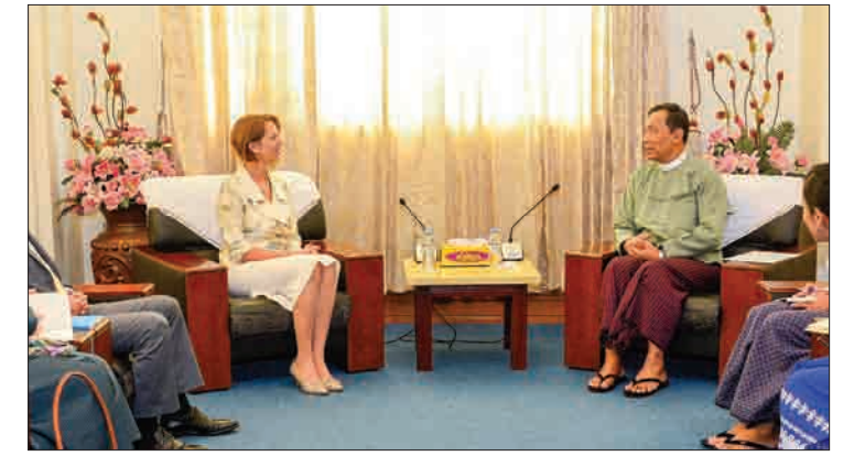
Thura U Shwe Mann meets with UNSG's Special Envoy Ms. Christine Schraner Burgener in Nay Pyi Taw.