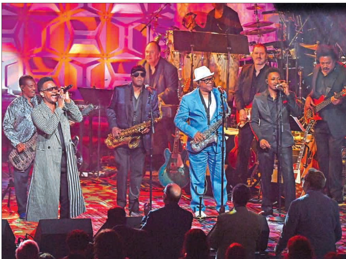
Kool & The Gang perform onstage during the Songwriters Hall of Fame 49 th Annual Induction and Awards Dinner in New York.