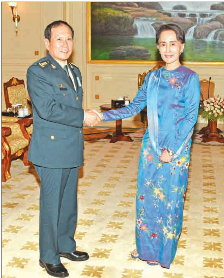
State Counsellor Daw Aung San Suu Kyi welcomes Chinese Defence Minister General Wei Fenghe in Nay Pyi Taw.