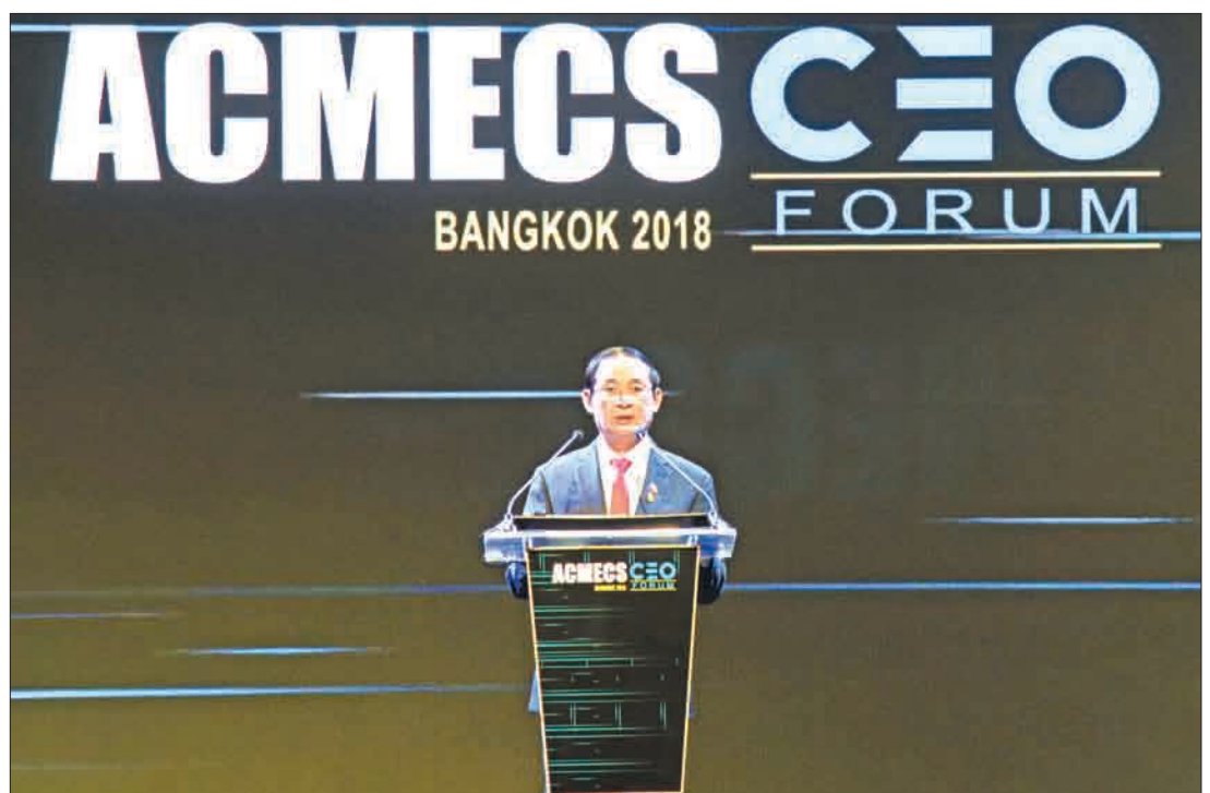
President U Win Myint addresses the ACMECS CEO Forum at Shangrila Hotel in Bangkok.