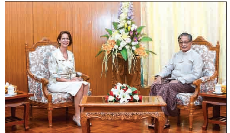
Union Minister U Kyaw Tint Swe meets with United Nations Secretary-General's Special Envoy Ms. Christine Schraner Burgener in Nay Pyi Taw yesterday.

sellor in Nay Pyi Taw at 3 p.m. yesterday. During the meeting, they discussed matters relating to the cooperation between Myanmar and the United Nations. They also discussed the issue on Rakhine State. —Myanmar News Agency ■