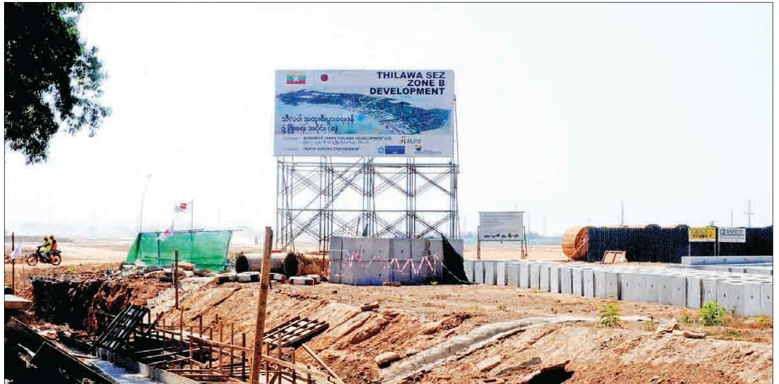
File photo shows the construction site at the Thilawa Special Economic Zone's Zone B, in Yangon.

20,000 staff and a total investment amount of over 1.4 billion from 17 countries with 94 investments across various sectors with these numbers expected to grow. Myanmar notably has a sizable labor force and untapped