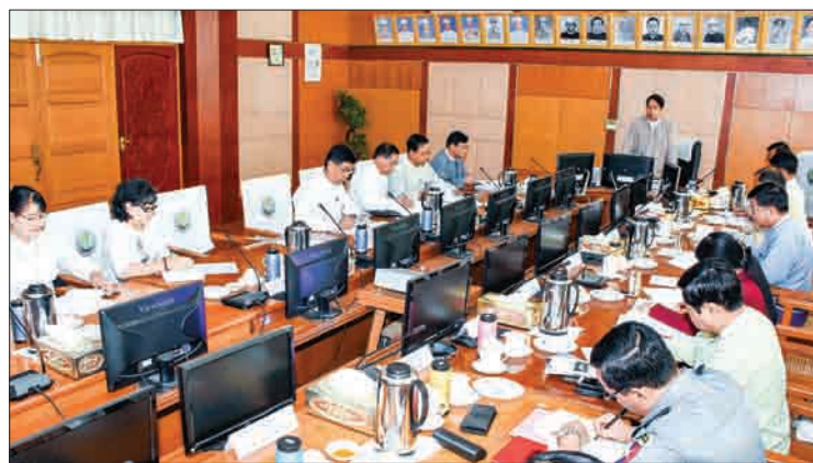
Union Minister Dr. Pe Myint addresses the coordination meeting to conduct an all-round youth development festival.

Ministry of Religious Affairs and Culture, Ministry of Education, Ministry of Health and Sports, Ministry of Planning and Finance, Ministry of Social Welfare, Relief and Resettlement, Ministry of Home Affairs, Ministry of Transport and Communications and the Union Auditor General's office also discussed their related sectors.