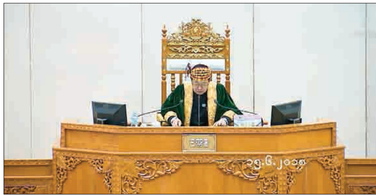
Pyithu Hluttaw Speaker U T Khun Myat.

"We understand that it is needed to safeguard the inter-