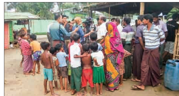
Journalists interview villagers at the temporary relief camp for Hindus in Maungtaw.

In the afternoon, the independent media delegation arrived back Yangon by air.— Min Thit ■