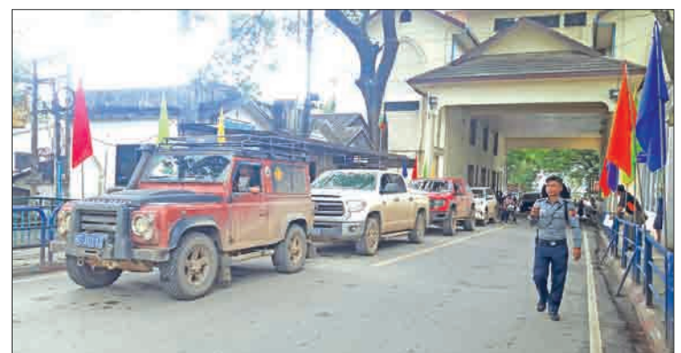
A busy scene at the Tachilek border between Myanmar and Thailand.

Foreigners visit Myanmar to enjoy its beautiful landscapes, scenic views along its mountain ranges, its archaeological and histor-