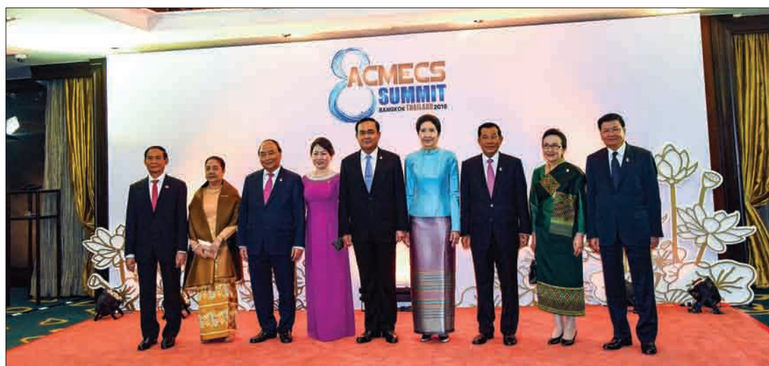
President U Win Myint and First Lady Daw Cho Cho pose for photo together with leaders of ACMECS countries.

The opening ceremony of the ACMECS CEO Forum concluded after the President, Thai Prime Minister, Cambodian Prime Minister had a documentary photo