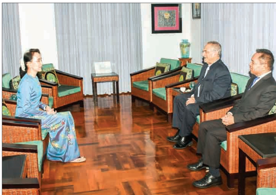
State Counsellor Daw Aung San Suu Kyi receives Mr. Jose Ramos Horta, Senior Minister and Former President of Timor-Leste. (NEWS ON PAGE-1)