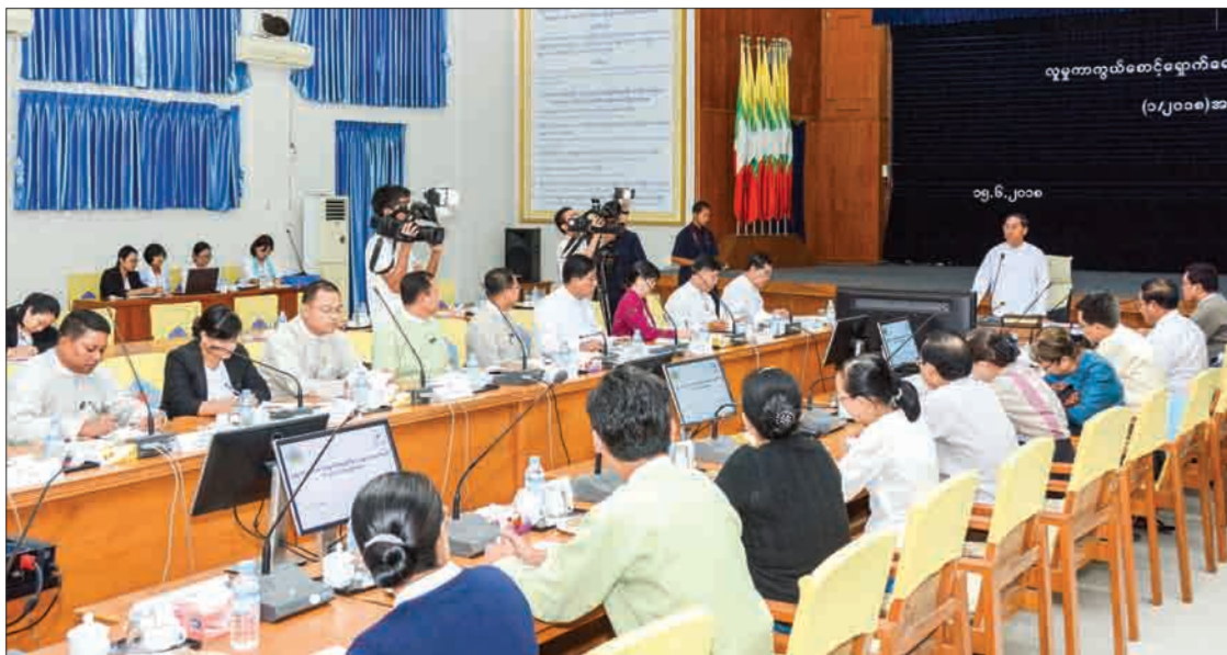
Vice President U Myint Swe addresses the National Level Social Protection Committee meeting 1/2018 in Nay Pyi Taw.