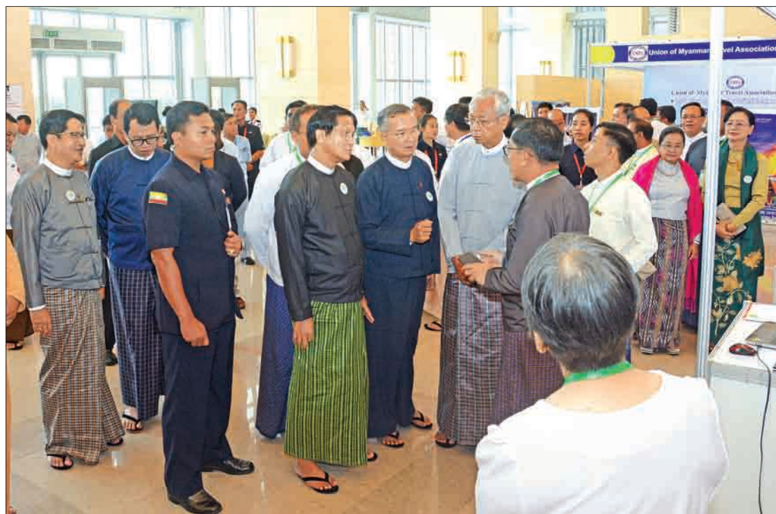
Vice President U Henry Van Thio and former President U Htin Kyaw visit the booth displaying travel documentary photos at the Myanmar Tourism Conference 2018.

All the countries in the world were making arrangements to