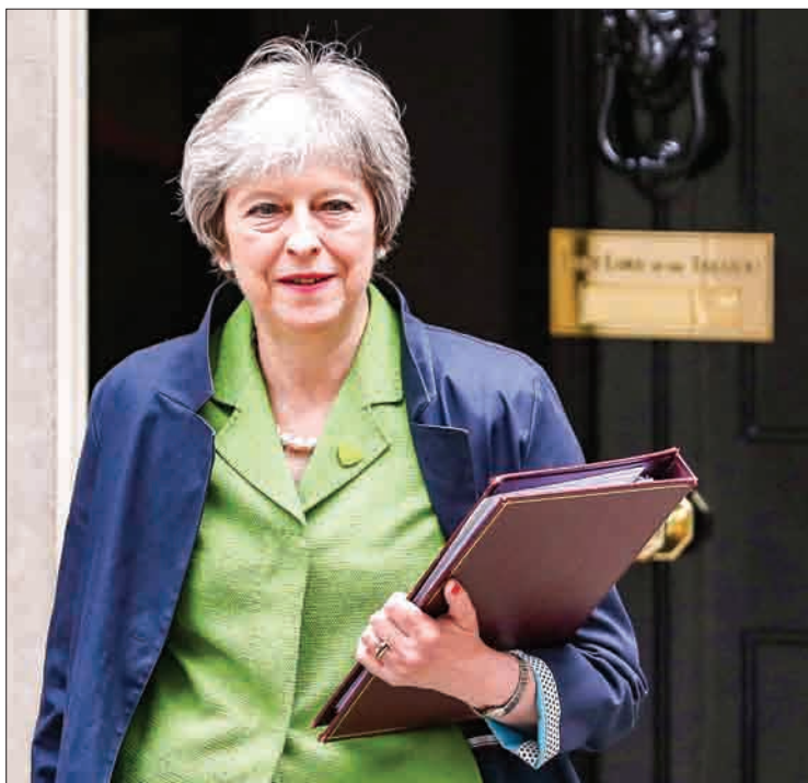
Britain's Prime Minister Theresa May leaves 10 Downing Street in central London on 12 June, 2018.

The front pages of Leave-backing British newspa-