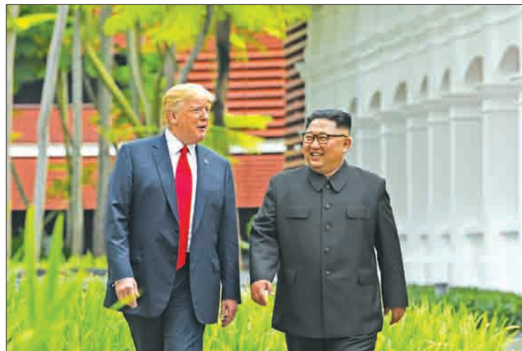
North Korea's leader Kim Jong Un (R) walks with US President Donald Trump (L) during a break in talks at their historic US-North Korea summit, at the Capella Hotel on Sentosa island in Singapore on 12 June, 2018.

But he added: "The silver lining is that dialogue will continue, and where there is diplomacy there is hope."—AFP ■