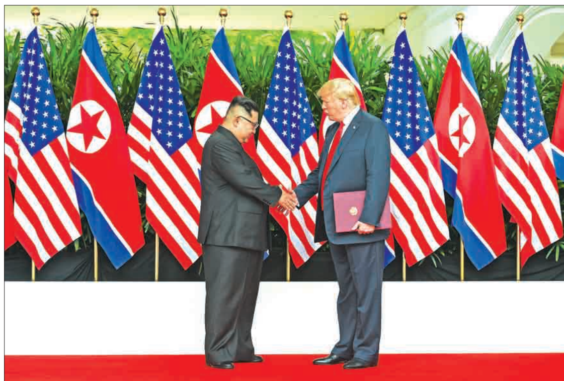
North Korea's leader Kim Jong Un (L) shakes hands with US President Donald Trump (R) after taking part in a signing ceremony at the end of their historic US-North Korea summit, at the Capella Hotel on Sentosa island in Singapore on 12 June, 2018.

"We will be stopping the war games which will save us a tremendous amount of money," Trump told reporters, adding