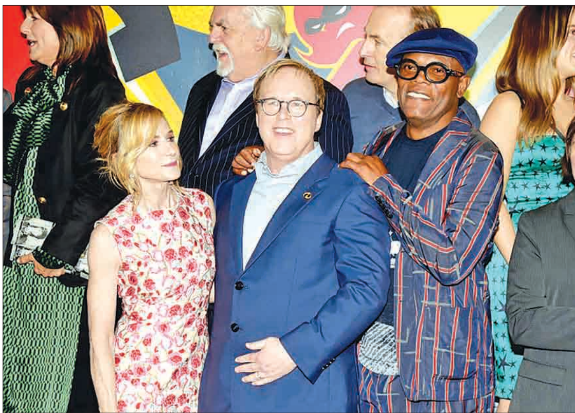
Director Brad Bird (C) — shown with Holly Hunter and Samuel L. Jackson — waited a full 14 years to release the sequel to the wildly popular first "Incredibles" film.