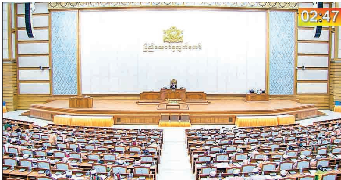
Pyidaungsu Hluttaw being convened in Nay Pyi Taw.

Next, the Revenue Appellate Tribunal Bill, sent by the union government, was dis-