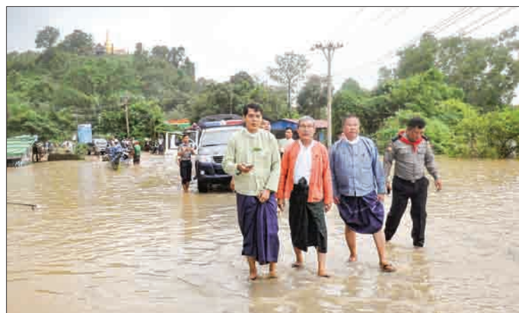
Rakhine State Chief Minister U Nyi Pu inspects damage caused by flooding in Thandwe Township yesterday.

Military personnel from Thandwe garrison, police officers, firefighters, officials, and the local people are all working collectively to carry out relief and protection operations in the area. — Myanmar News Agency ■