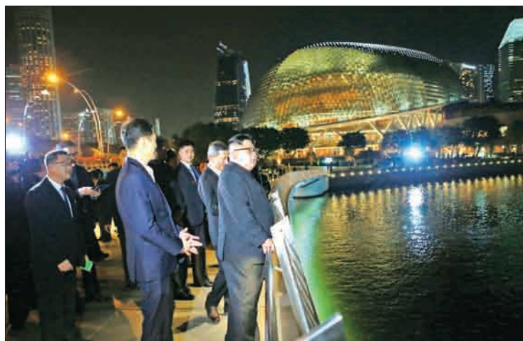
This picture taken on late June 11 and released from North Korea's official Korean Central News Agency (KCNA) on 12 June, 2018 shows North Korean leader Kim Jong-Un walking on the Jubilee bridge during a tour in Singapore.

The Singapore summit was a potentially legacy-defining meeting for both men — comparable to president Richard Nixon's 1972 visit to China, or Ronald Reagan's 1986 summit with Mikhail Gorbachev in Reykjavik.