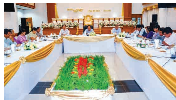
Union Minister for Health and Sports Dr Myint Htwe at the meeting with the heads of state and region health departments in Pyin Oo Lwin.

The union minister said the state and region health departments are extensions of the ministry and thus require