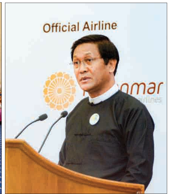
Vice President U Henry Van Thio addresses the opening ceremony of the Myanmar Tourism Conference 2018 in Nay Pyi Taw yesterday.

P ROMOTING tourism sector in Myanmar requires more cooperation through the Public-Private Partnership system between the government and the people, said Vice President U Henry Van Thio yesterday at the Myanmar Tourism Conference in Nay Pyi Taw.