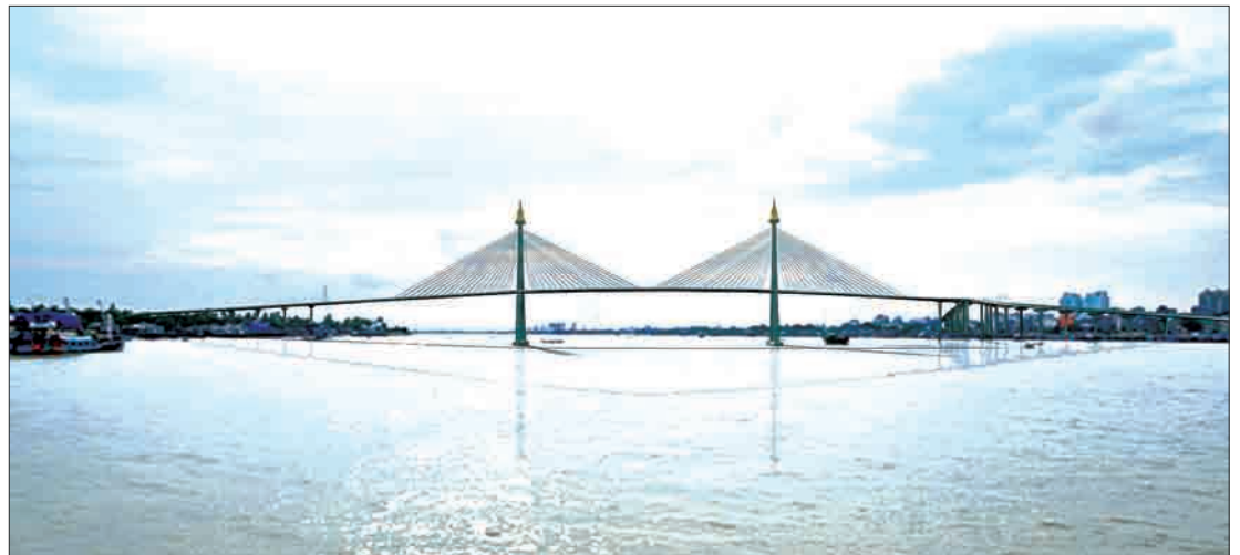
The architectural design of Yangon-Dala friendship bridge between Myanmar and South Korea.

The Bridge Management Department under the Ministry of Construction has been conducting a feasibility study since the 2012-2013 fiscal year, together with Top Engineering Consultant International Co. Ltd, South Korea's EXIM