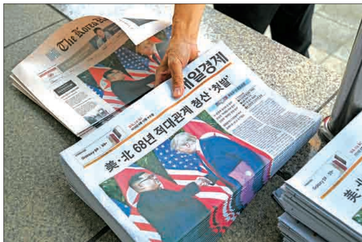
A South Korean newspaper deliveryman collects newspapers in Seoul reporting the summit between US President Donald Trump and North Korean leader Kim Jong Un on 12 June, 2018. South Koreans erupted in applause on June 12 as Donald Trump and Kim Jong Un met in Singapore for what local media billed as the "talks of the century".