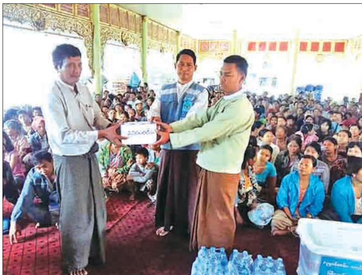
Staffs from Social Welfare, Relief and Resettlement provide aid to local affected by flooding.

On 11 June in Magway Region, Pwintbyu Township, Chinkon village, a house belonging to a family of six was damaged after an uprooted tree fell on it. A Yepotegyi villager was swept away by the water and died. Due to the rising Mann creek, six houses in No. 3 Ward, Saku Town, Minbu Township, were swept away and 18 people from six households faced difficulties, while a child was swept away and drowned. In Sissno village, Minhla Township, a person was swept away and died while crossing the Sissno creek. Yesterday, over 1,800 houses in