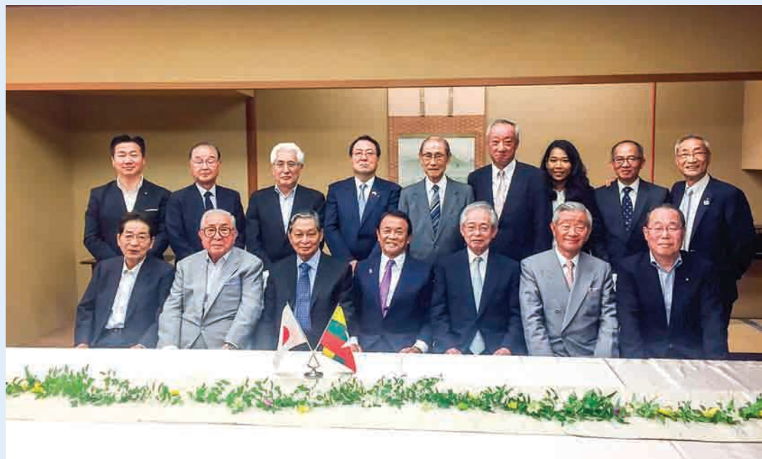
Union Minister U Kyaw Tint Swe (third from left in the front row) poses for the documentary photo together with dignitaries at the working dinner in Japan.

During the informal meetings, both sides exchanged views on the perpetuation of Japan-Myanmar friendship, the on-going peace process, My-