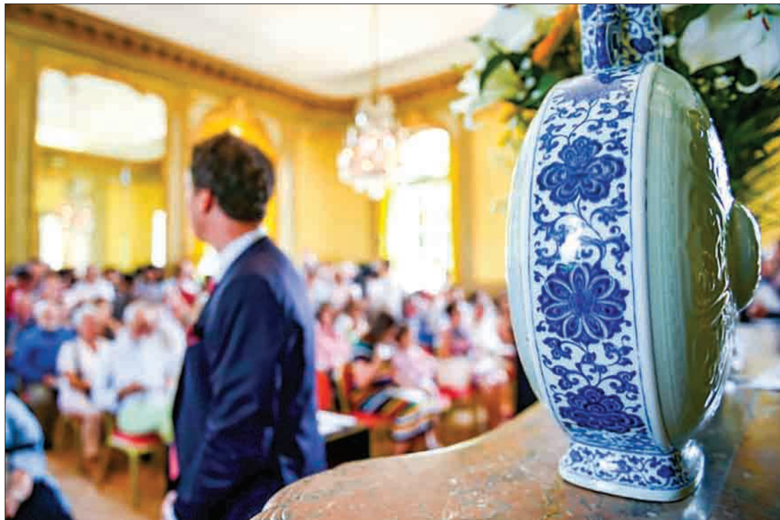
A rare blue, white and celadon porcelain moon flask belonging to the Emperor Qianlong was sold at Artigny’s castle in Montbazon.

The other flask was sold for 1.8 million euros at Sotheby’s in Hong Kong in 2016.—AFP ■