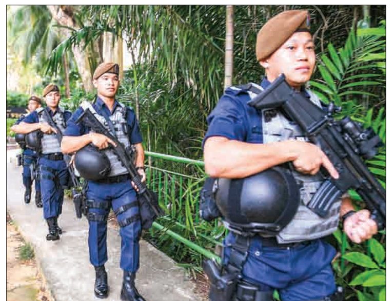
Armed police officers patrol outside the Shangri-La hotel where US President Donald Trump will stay ahead of the US-North Korea summit in Singapore on 10 June, 2018.

It formally referred to Trump by his full name in the Monday report, including his middle initial — the first time it has done so. Kim's sister and close aide Kim Yo Jong is also in Singapore, and is believed to have travelled separately on the ageing Soviet-made Ilyushin-62 that is the leader's personal aircraft.—AFP ■