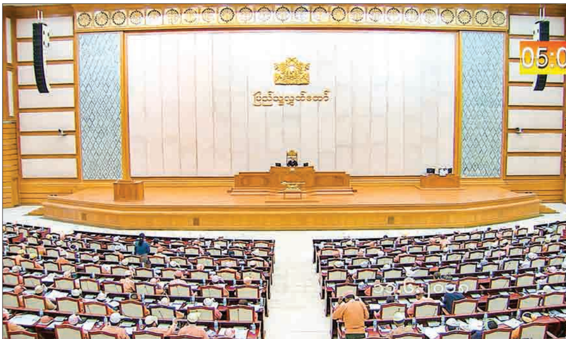
Pyithu Hluttaw is being convened in Nay Pyi Taw yesterday.

Motion against formation of independent enquiry commission with one international person rejected by vote