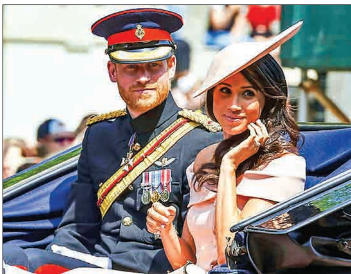
The Duke and Duchess of Sussex, Prince Harry and his new wife Meghan, will visit Australia, Fiji, Tonga and New Zealand.

“The Duke and Duchess of Sussex will undertake an official visit to Australia, Fiji, the