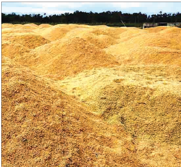
Numerous piles of rice paddy are left to dry in the sun after they've been reaped to keep them from spoiling.

The main challenges in the rice industry are pedigree seeds, high input costs, high production costs, the lack of technology, high transaction costs and logistic problems, said an expert.