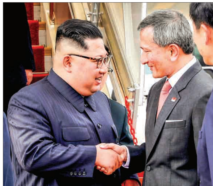
A handout photo taken by Ministry of Communications and Information of Singapore on 10 June, 2018 shows North Korean leader Kim Jong Un (L) being welcomed by Singapore's Foreign Minister Vivian Balakrishnan (center-R) upon his arrival at Singapore International airport in Singapore.