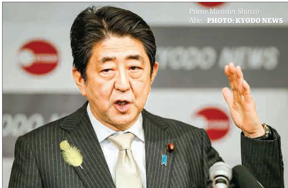
Prime Minister Shinzo Abe.

"I hope that the (US-North Korea) summit