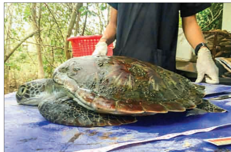
The green turtle washed up on a beach in Chanthaburi province on 4 June and died two days later.

Weerapong said that in the past about 10 per cent of the green turtles stranded on beaches in the area had ingested plastic or suffered infections after coming into contact with the waste, but this year about 50 per cent of the incidents were trash-related.—AFP ■