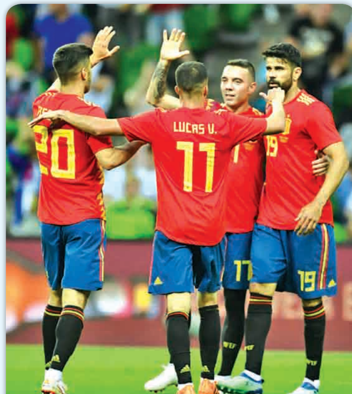
Iago Aspas (2nd R) takes the acclaim of his Spain teammates after netting the winner against Tunisia on Saturday.

sarily about the result," coach Loew — who has left Manchester City's Leroy Sane behind — reminded Kicker.