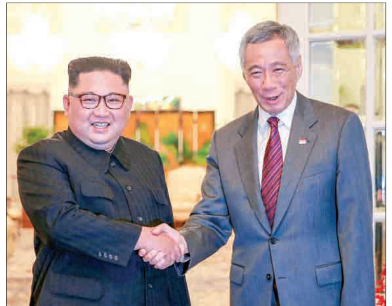
In this picture taken on 10 June, 2018 and released from North Korea's official Korean Central News Agency (KCNA) on 11 June, 2018, North Korean leader Kim Jong Un (L) shakes hands with Singapore's Prime Minister Lee Hsien Loong (R) following Kim's arrival in Singapore.

The summit has also raised hopes of progress towards a peace treaty to formally end the Korean War, the last festering legacy of the Cold War, after hostilities only stopped with an armistice. But critics have warned it risks becoming more of a media circus than an occasion for substantial progress. The US leader has whipsawed on expectations for the meeting, signalling that it could be the beginning of a "process" of several meetings, only to call it a "one-time shot" for peace as he embarked for Singa-