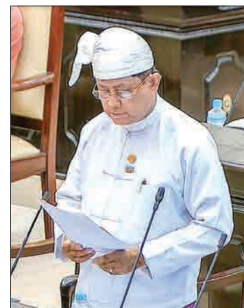
Deputy Minister for Planning and Finance U Maung Maung Win.

sion payment to elderly pensioners who had reached the age of 70. Deputy Minister for Planning and Finance U Maung Maung Win said pensioners can get a certain amount of lump-sum pension payment in certain situations, but this would affect the long-term regular pension pay-