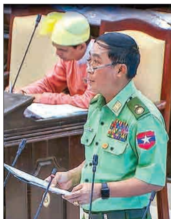
Deputy Minister for Border Affairs Maj-Gen Than Htut.

U Baw Rae Soe Wai of Kayah State constituency (3) then asked if there was a plan to pay a one-time lump-sum pen-