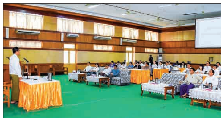
Deputy Minister U Aung Hla Tun delivers the speech at the News Writing Course No. (2) in Nay Pyi Taw.

A total of 22 trainees from various ministries and the Office of Union Election Commission are taking part in the course that will last from June 11 to 15. — Myanmar News Agency ■