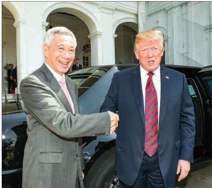
A handout photo taken by Ministry of Communications and Information of Singapore on 11 June, 2018 shows US President Donald Trump (R) shaking hands with Singapore's Prime Minister Lee Hsien Loong (L) following his visit to The Istana, the official residence of the prime minister, in Singapore.

In Seoul, President Moon Jae-in had a 40-minute phone call with Trump, after telling key aides that it could take "one year, two years or even longer to completely resolve the issues concerned".