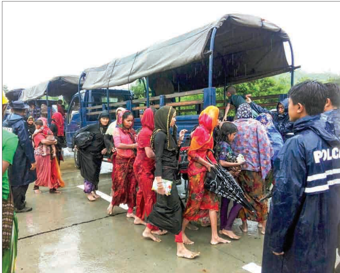
Officials transport Islamic people to Nga Khu Ya Reception Centre for scrutinization.

SECURITY forces found a boat broke apart and 104 people stranded at a sea shore in Yathedaung Township yesterday and transported them to the Nga Khu Ya Reception Centre.