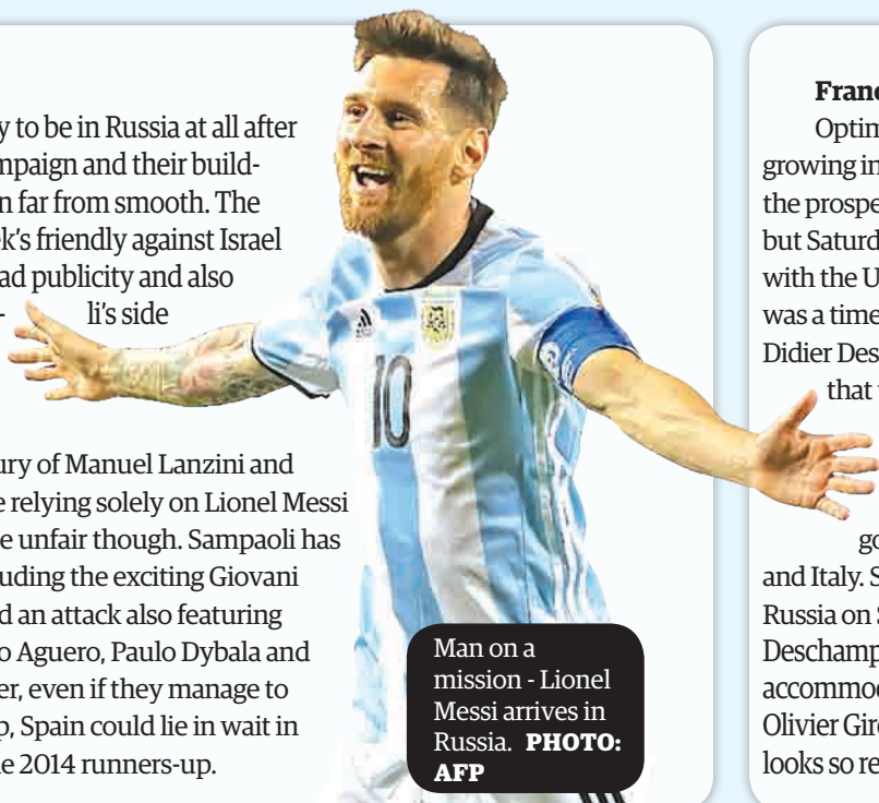
Man on a mission - Lionel Messi arrives in Russia.

Argentina are lucky to be in Russia at all after a chaotic qualifying campaign and their build-up to the finals has been far from smooth. The cancellation of last week's friendly against Israel in Jerusalem brought bad publicity and also denied Jorge Sampaoli's side much-needed match practice. The build-up has been further hampered by the loss to injury of Manuel Lanzini and critics say Argentina are relying solely on Lionel Messi for success. That may be unfair though. Sampaoli has talent in his squad, including the exciting Giovanni Lo Celso in midfield and an attack also featuring Gonzalo Higuain, Sergio Aguero, Paulo Dybala and Angel Di Maria. However, even if they manage to win a challenging group, Spain could lie in wait in the quarter-finals for the 2014 runners-up.