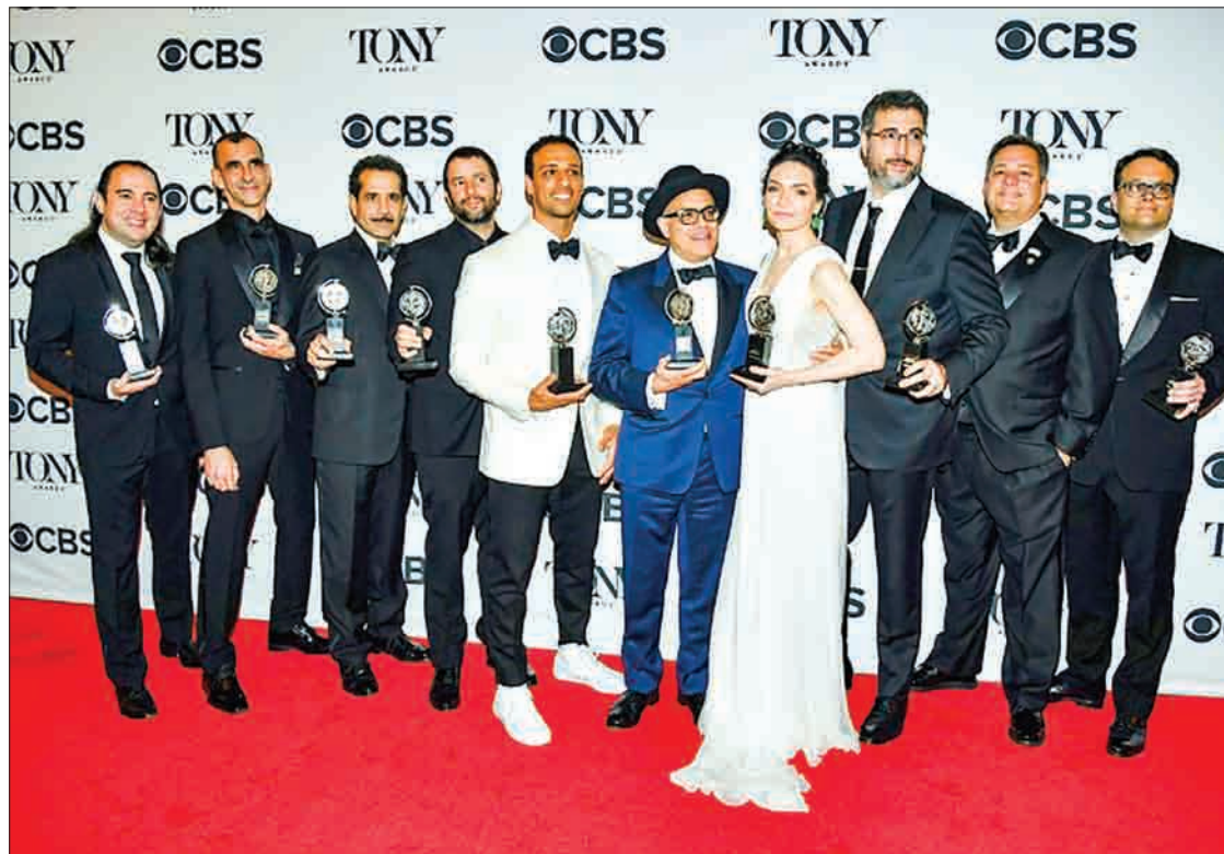
Cast and creative team of "The Band's Visit" pose for photos in the 72 nd Annual Tony Awards Media Room, at 3 West Club in New York on 10 June, 2018.

of unity in a world that more and more seems bent on amplifying our differences. In the end, we are far more alike than differ-