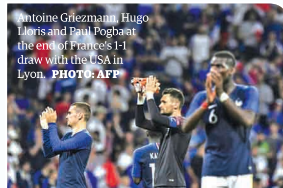
Antoine Griezmann, Hugo Lloris and Paul Pogba at the end of France's 1-1 draw with the USA in Lyon.

Kylian Mbappe goal to earn a draw in their final friendly, which followed wins against Ireland and Italy. Sports daily L'Equipe called it a "cold blast" before the French travelled to Russia on Sunday. Paul Pogba's performance in that game was a boost, though, and Deschamps appears to have found a formation that suits him. A diamond midfield accommodates Pogba and allows Antoine Griezmann to play just behind Mbappe and Olivier Giroud up front, but there is maybe a worry in goal, where Hugo Lloris no longer looks so reliable. Nevertheless, they are capable of reaching the last four. —AFP ■