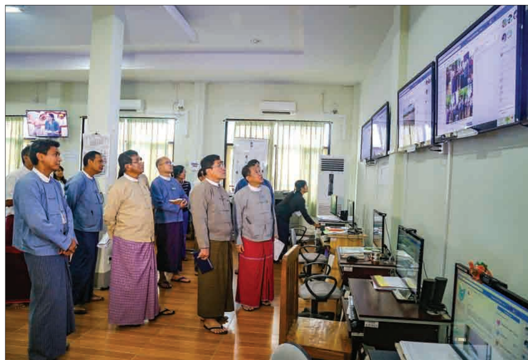
Union Minister Dr. Win Myat Aye and officials view TV showing activities of quick response to recent flash flood in Myanmar.

Since the legislation on the Printing and Distributing Law on 10 October 2014, some 2,381 permits have been granted to 104 news agencies, 1,514 printing houses, 46 distribution agencies, 539 journals, 442 magazines, and 1,354 general publications. Further information are available at the ministry's website at www.moi.gov.mm . — Myanmar News Agency ■