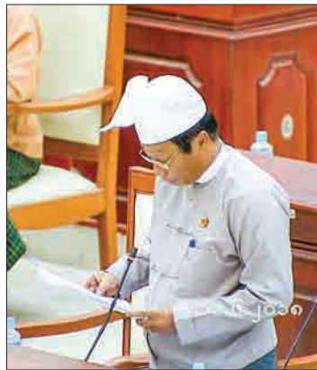
Deputy Minister for Agriculture, Livestock and Irrigation U Hla Kyaw.

U Thaung Aye of Pyawbwe constituency supported the motion and commented that countries around the world are protecting their territory, their people, their government and their sovereignty. Non-disintegration of the union, non-disintegration of national solidarity and perpetuation of sovereignty are the duties that every citizen has to uphold and this is clearly stated in the Constitution. If the Rakhine issue is handled, we should be aware of the aim of the extremist terrorist groups to