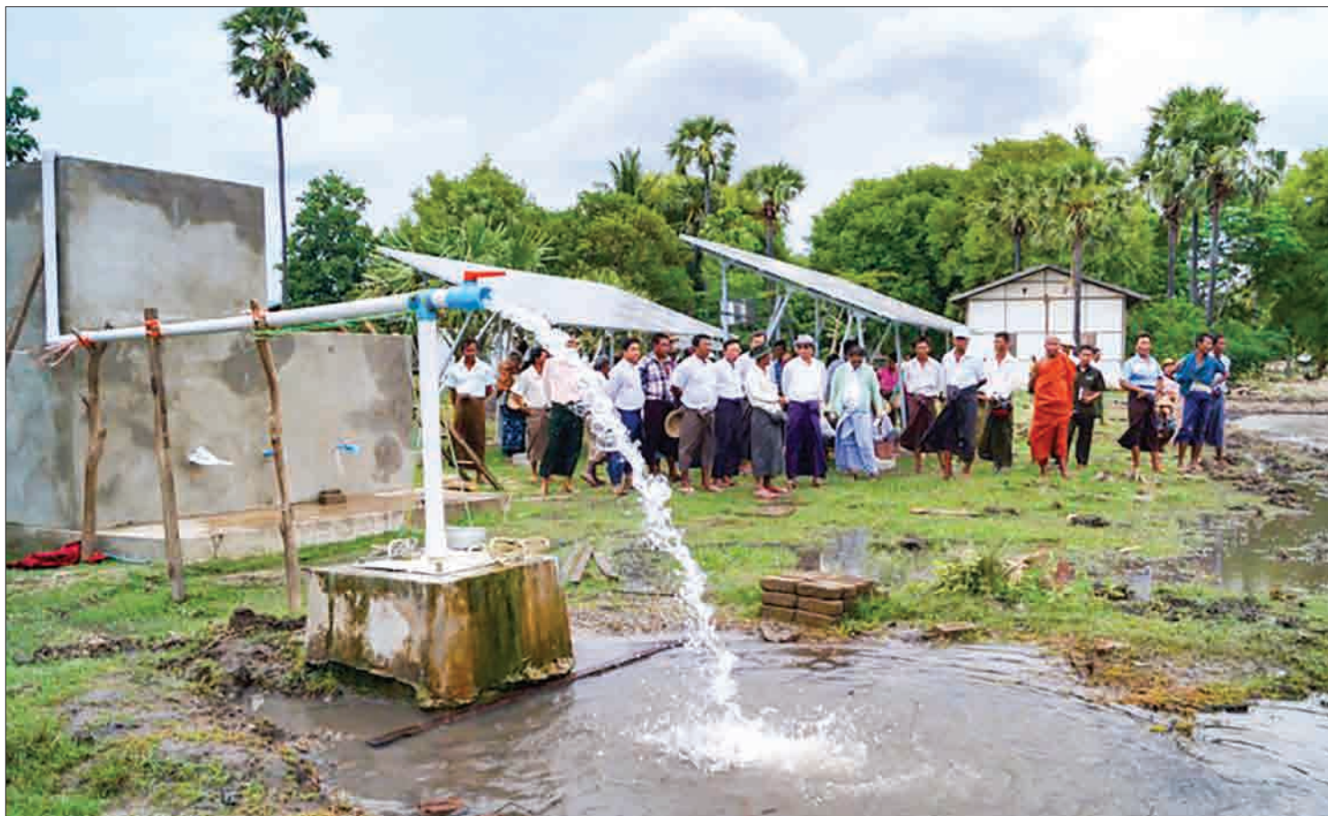
Pumping underground water for household use is popular in rural areas and outskirts of Yangon.

Due to limitation of space we are only able to publish "Letter to the Editor" that do not exceed 500 words. Should you submit a text longer than 500 words please be aware that your letter will be edited.