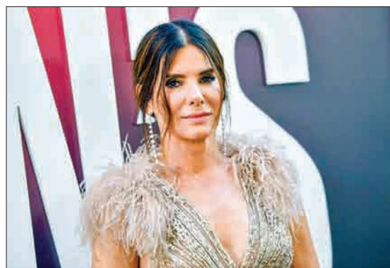
Sandra Bullock, star of top box-office draw "Ocean's 8," is seen at the recent premiere of the film in New York.

LOS ANGELES—The women of "Ocean's 8" proved this weekend that they know how to steal the show—and much more—as the new heist flick took in an estimated $41.5 million in North American theaters.