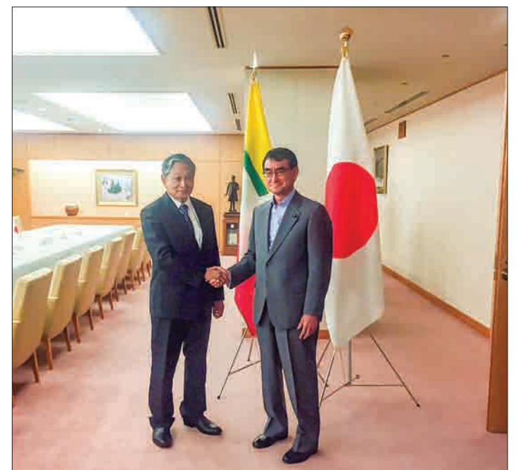
Union Minister U Kyaw Tint Swe shakes hands with Japanese Minister for Foreign Affairs Mr. Taro Kono in Japan.

The delegation departed for Japan from Yangon International Airport on 10 June.— Myanmar News Agency ■