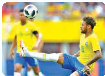
Neymar in action for Brazil in Sunday's friendly against Austria in Vienna.

The absence of the injured Dani Alves at right-back is a blow but Neymar has proven