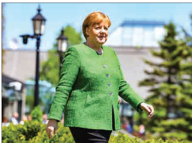
German Chancellor Angela Merkel.

German and French ministers are set to meet later this month to find common ground on EU reform, ahead of a meeting of all EU leaders on 28-29 June.