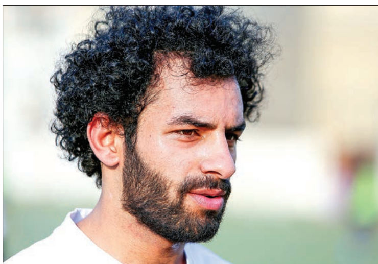
Mohamed Salah carries the weight of Egyptian expectations on his shoulders at the World Cup.

Salah has been picked in the Egypt squad despite suffering from a shoulder injury picked up in Liverpool's 3-1 Champions League final defeat to Real