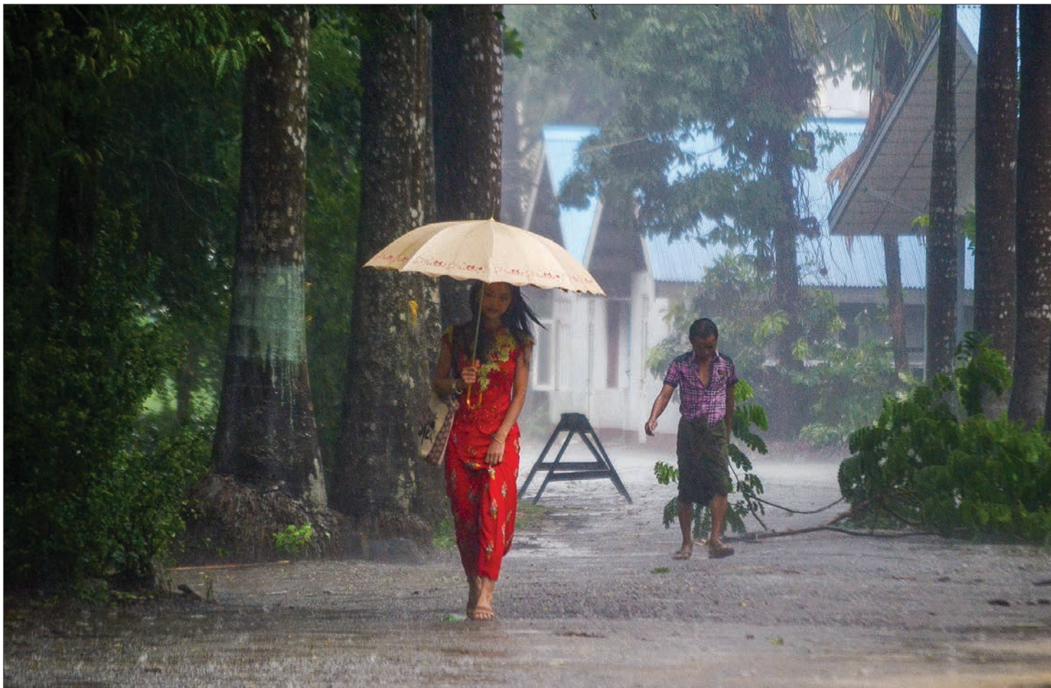
A woman shields herself against the rain in Yangon yesterday as the depression is crossing northeast of the Bay of Bengal into Bangladesh.