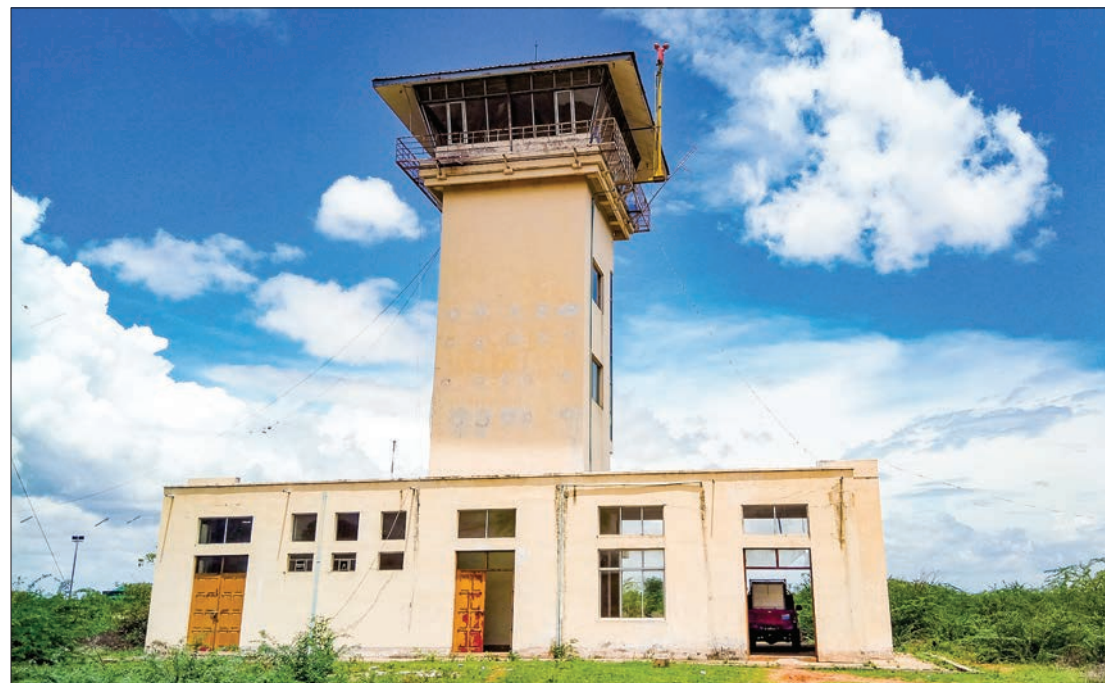
Photo shows the domestic airport in Magway Township, the capital of Magway Region in central Myanmar.