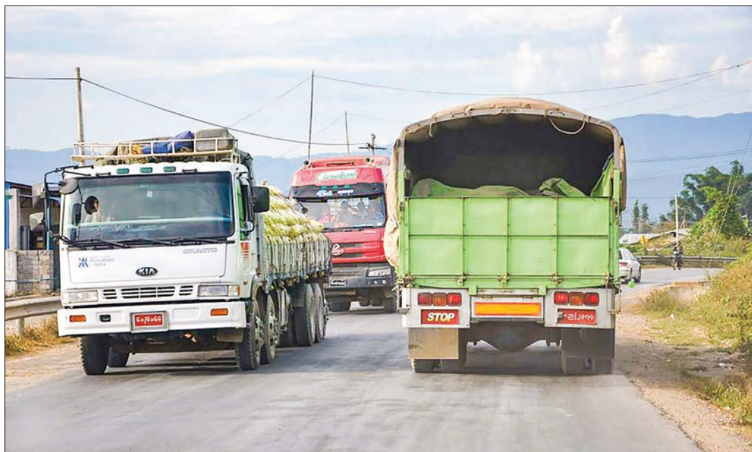
Trucks are seen near the 105-Mile Muse Border Trade Zone in northern Shan State.