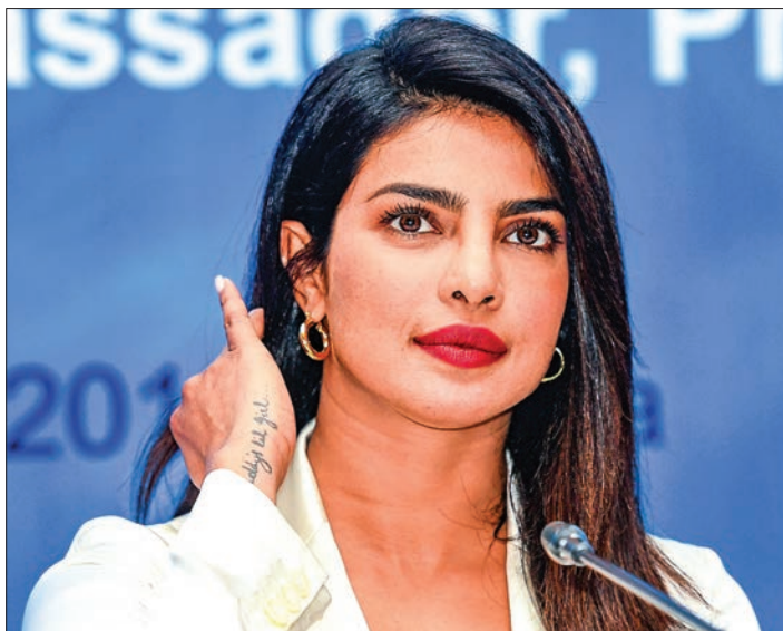
Bollywood star Priyanka Chopra, who plays an FBI agent in 'Quantico', is the first Indian to headline a US network series.

"The episode has stirred a lot of emotion, much of which is unfairly aimed at Priyanka Chopra, who didn't create the show, nor does she write or direct it,"