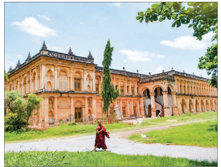
Built with western style architecture, the Yaw Min Gyi monastery hosts an array of interesting artefacts including stone figures of a winged man, decorated pillars and L-shaped stairs.

As VoLTE technology is used, users can use data and voice simultaneously with better quality. A Mytel SIM user will get free 1,500 MB data and 150 minute voice call that can be used in three months. When a voice call is made with the use of charging block 1s+1s, the user will be charged depending on duration. For Myanmar's socio-economic development, a wide variety of services such as modern agriculture, education and health are provided. Now, Mytel 4G SIM cards and top-up cards are available at 50 Mytel brand shops and 50,000 other shops across the country. —Myanmar News Agency ■