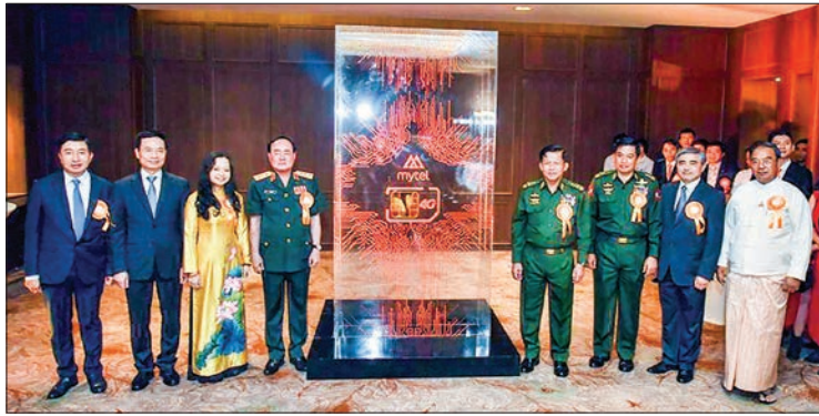
Senior General Min Aung Hlaing, fourth from right, poses for a documentary photo at Mytel's ceremony held at Centerpoint Hotel in Yangon on 9 June.