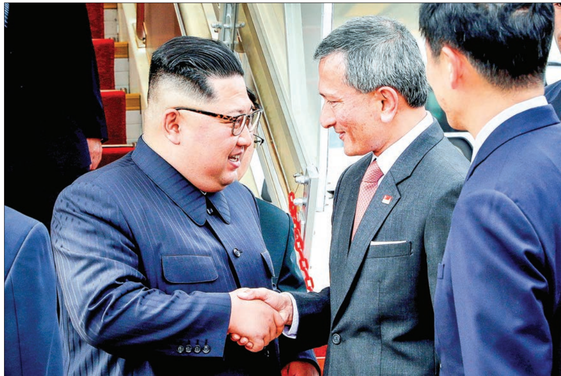
Kim is welcomed by Singapore's Foreign Minister Vivian Balakrishnan (center-R) upon his arrival at Singapore International airport.

Instead he flew on an Air China Boeing 747. According to flight tracking website Flightra-