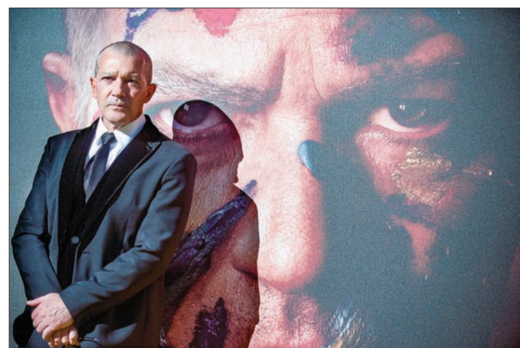
Antonio Banderas says Salma Hayek never said anything about the abuse she had suffered at the hands of Harvey Weinstein.

They would go on to work together in other films, including "Once Upon a Time in Mexico" and "Puss in Boots." The Weinstein scandal first erupted last October, drawing in other big names in the entertainment industry and leading to movements like #MeToo and Time's Up. — AFP ■