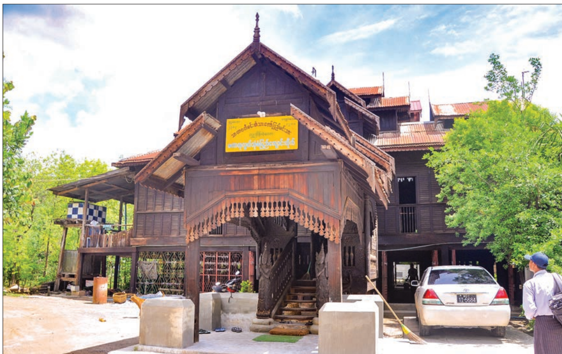
The 180-year-old wooden monastery has Buddha statues in different positions and styles.

Built with 146 teak columns, the 89-foot by 69-foot building has doors decorated with figures of celestial beings and floral de-