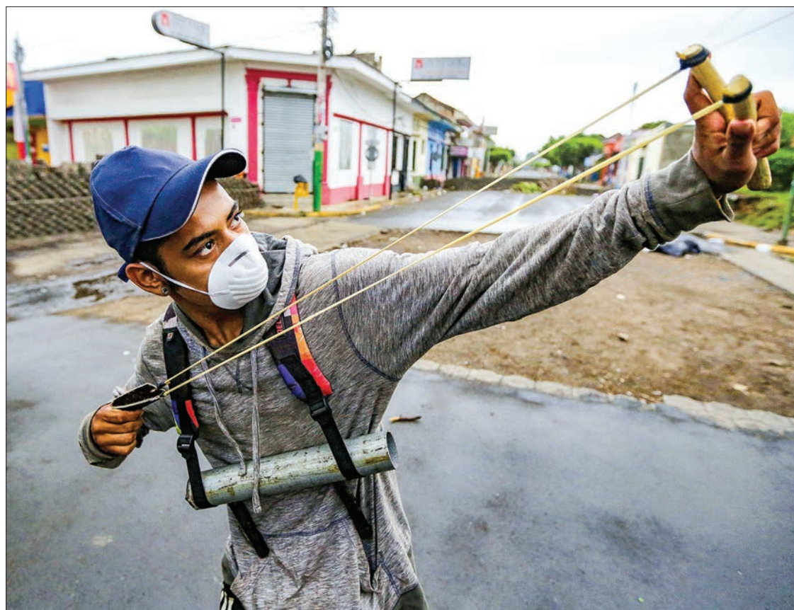
An anti-government demonstrator holding a homemade mortar uses a slingshot during clashes with riot police at a barricade in the town of Masaya, a flashpoint city of anti-government protests demanding President Ortega's ouster.