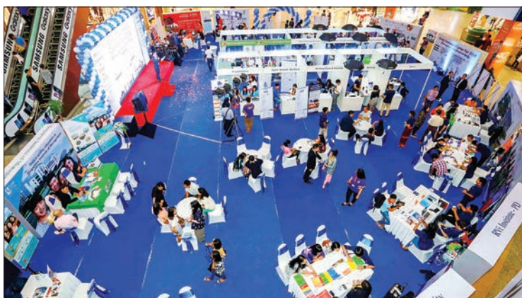
This year's RVi Institute Study Overseas and Career Fair events prove the growing interest of students to explore educational opportunities overseas.

The fair was targeted at high school graduates or those who recently received their Matriculation examination results, Higher National Diploma (HND) holders,