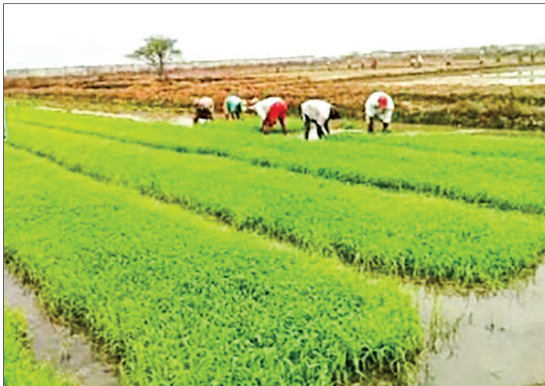
Farmers work in monsoon paddy field in Thanlyin.

Myanmar exports rice to more than 60 countries, with the majority of the crop going to China, Bangladesh, Afri-