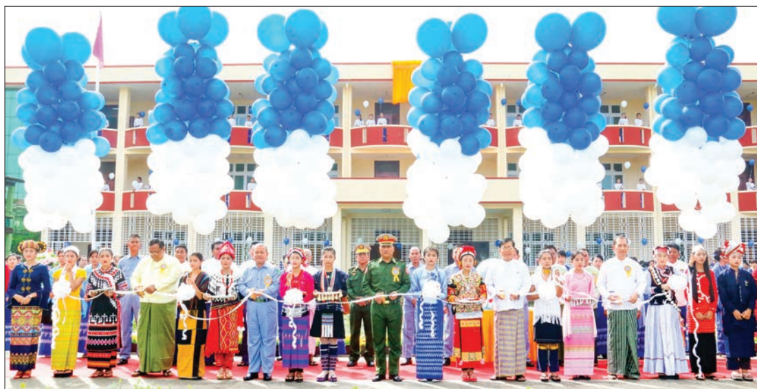
Cabinet members of Yangon Region and high-level official formally open the Nationalities Youth Resource Development Degree College (Yangon).

A three-storey hostel, a two-storey building dining and a two-story library built with the funds allocated for the 2017-2018 financial year for Nationalities Youth Resource Development Degree College (Yangon), Department of Education and Training (DET), Ministry of Border Affairs, were opened at the degree college in Yangon yesterday.