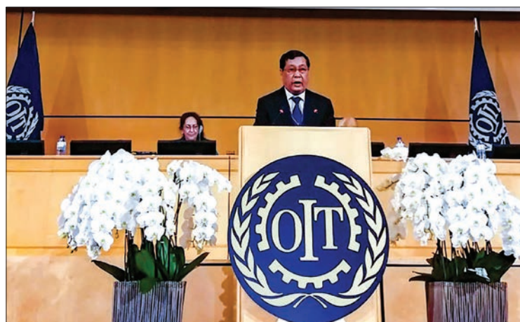
Union Minister for Labour, Immigration and Population U Thein Swe delivers address at a meeting in Geneva, Switzerland.

The country will write its laws from the gender angle, he added. The union minister expressed pleasure at the century-long ILO's efforts to ensure full rights for workers all over the world, and the UN's endeavours for the success of the Sustainable Development Goals. He said the country has adopted gender equality as its goal and accelerated its activities, as the report "The Women at Work Initiative: the Push for Equality," presented by the ILO director-general, is in accordance with the current sit-