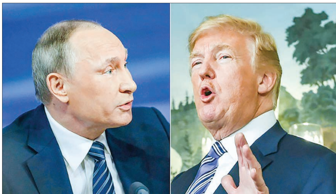
Putin said "many" countries including Austria were keen to help in organising such a US-Russia summit.

The Wall Street Journal, citing a senior European official, reported that Putin asked Austrian Chancellor Sebastian Kurz on a visit to Vienna earlier this week to help organise such a meeting and that Washington was considering it.