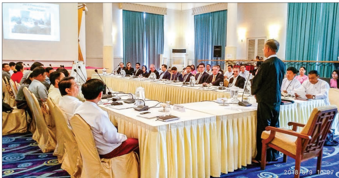
Union Minister U Ohn Maung addresses the participants at a photo contest in City Mall (St John) in Yangon on 9 June.

Union Minister for Hotels and Tourism U Ohn Maung attended a photo contest titled Amyin Thit Photo Contest held by the Myanmar Hotelier Association at City Mall (St John) in Yangon on 9 June.