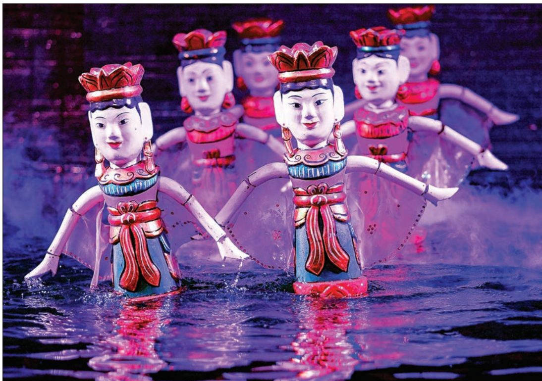
Viet Nam is the birthplace of the centuries-old art of water puppets, which emerged in the northern rice paddies as entertainment for farmers.