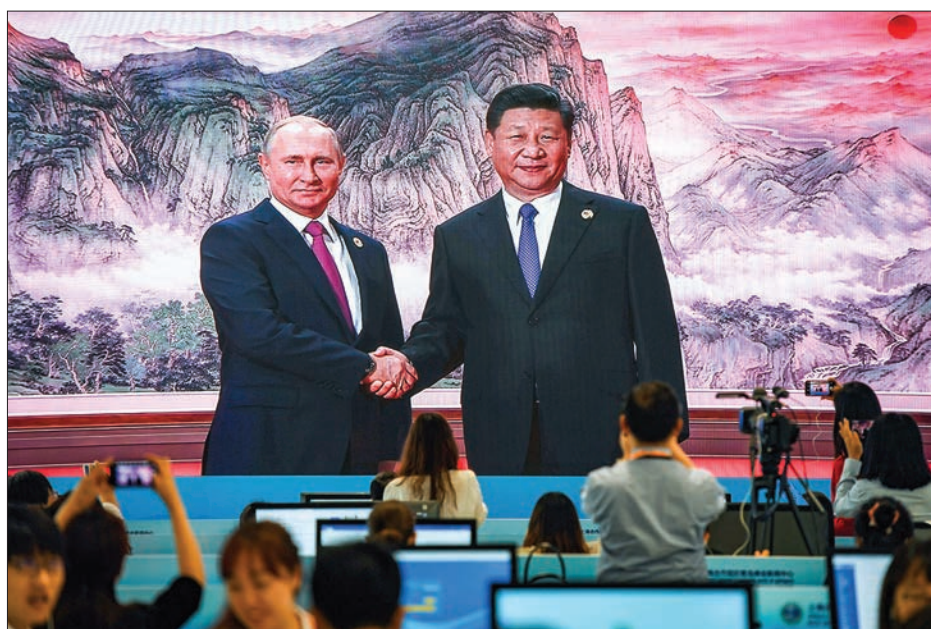
A large video screen shows Chinese President Xi Jinping shaking hands with Russia's President Vladimir Putin before the summit.

Warning that "unilateralism, trade protectionism and a backlash against globalisation are taking new forms", Xi spoke up for the "pursuit of cooperation for mutual benefit". While never mentioning the United States by name, he added: "We should reject the Cold War mentality and confrontation between blocs, and oppose the practice of seeking absolute security of oneself at the expense of others, so as to obtain security of all." Xi, whose government is locked in tough negotiations with the United States to avoid a trade war, said World Trade