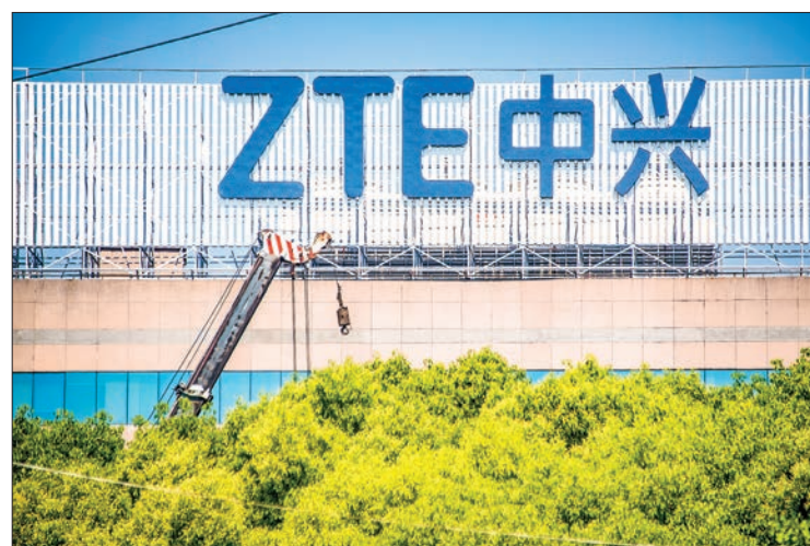
US officials say China's telecoms giant ZTE poses an espionage threat to the United States.

"We are deeply concerned about the risks of allowing any company or entity that is beholden to foreign governments that don't share our values to gain positions of power inside our telecommunications networks," said FBI Director Christopher Wray.—AFP ■