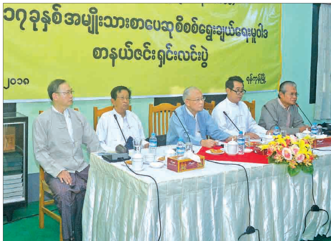
The press conference on the 2017 National Literature Award selection policy in progress.

non-involvement of the Ministry of Information and the minister in the selection of the National Literature Award. The committee led by Sayagyi U Thaw Kaung strived to make the commission independent, without being influenced by outside entities or persons.