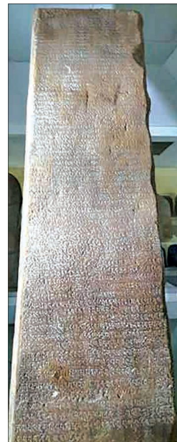
Anandachandra Stone Inscription.