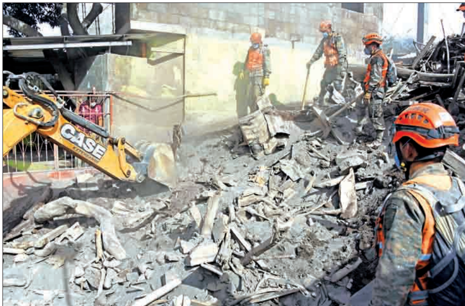
Soldiers search for victims of the Fuego volcano eruption in the ash-covered village of San Miguel Los Lotes.

"The explosions are generating moderate avalanches that have an ap-