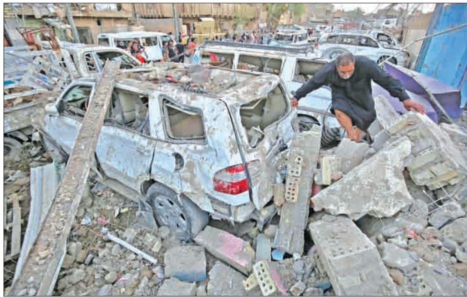
Iraqis inspect the aftermath of an explosion in Baghdad's Sadr City district, on 7 June 2018. PHOTO: AFP

Witnesses reported heavy material damage to homes and other buildings in the Sadr City district, which is a stronghold of populist Shiite cleric Moqtada Sadr. — AFP ■