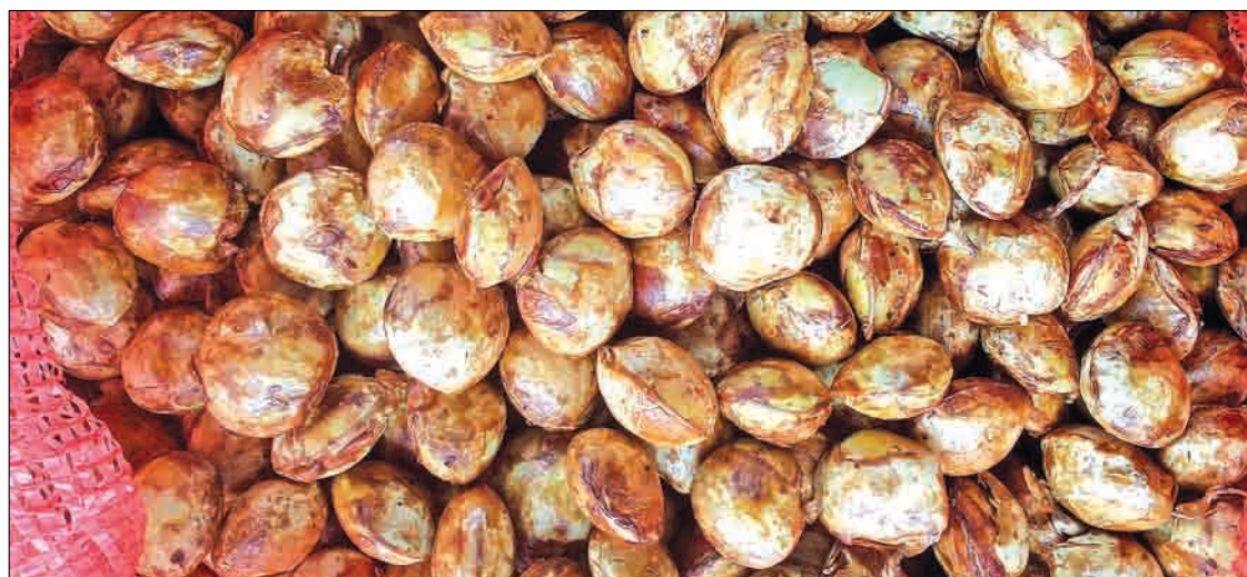
Djenkol fruits.

The SMID started its operations on 15 February 1996 and has 19 branches. The bank has provided Ks630 million worth of loans to 30 businessmen without receiving mortgage and Ks90 billion loans with mortgage documents. ■