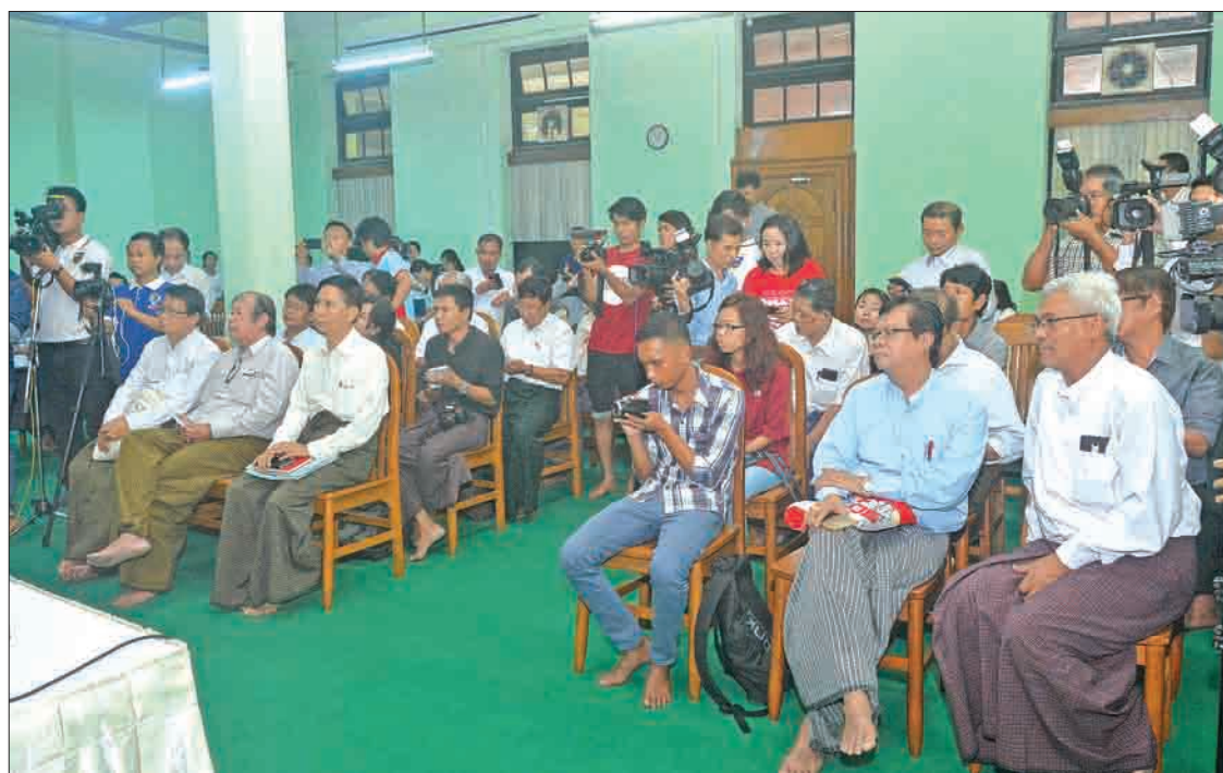
Attendees seen at the National Literature Award Selection Committee's press conference on the 2017 National Literature Award selection policy in Yangon yesterday.

There are a lot of misunderstandings and misstatements. The biggest misstatement is about the Union Minister for Information Dr. Pe Myint. He said the literature conference had told him to think about giving two, three or four awards for