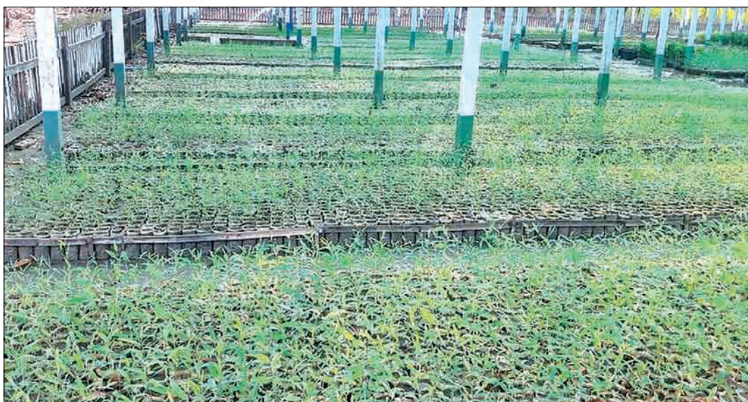
A seedlings nursery in Sagaing Region.

District, 189,800 seedlings in eight townships of Shwebo and Kantbalu districts, 129,700 seedlings in seven townships of Katha District, 57,600 seedlings in three townships of Kalay District, 15,000 seedlings in Tamu Township, 25,000 seedlings in two townships of Mawlaik District and 18,000 seedlings in two townships of Khamti District.—Win Oo (Zayar Tine) ■