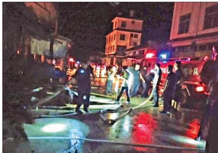
Firefighters manage to control the fire one hour after the blaze.

No casualties were reported and an estimated loss of property from the fire is about K 4.5 million.—Myanmar Digital News ■