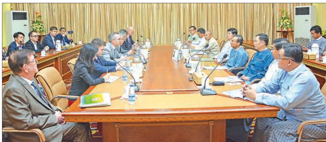
Union Minister for Natural Resources and Environmental Conservation U Ohn Win holds talks with US Ambassador Mr. Scot Marciel yesterday.

vironment sector and extractive industries (forest, gems and mineral), according to international standards, US businesses investing in various sectors, the status of conducting an environmental impact assessment and holding regular meetings between the ministry and the American Chamber of Commerce in Myanmar were discussed.—MNA ■