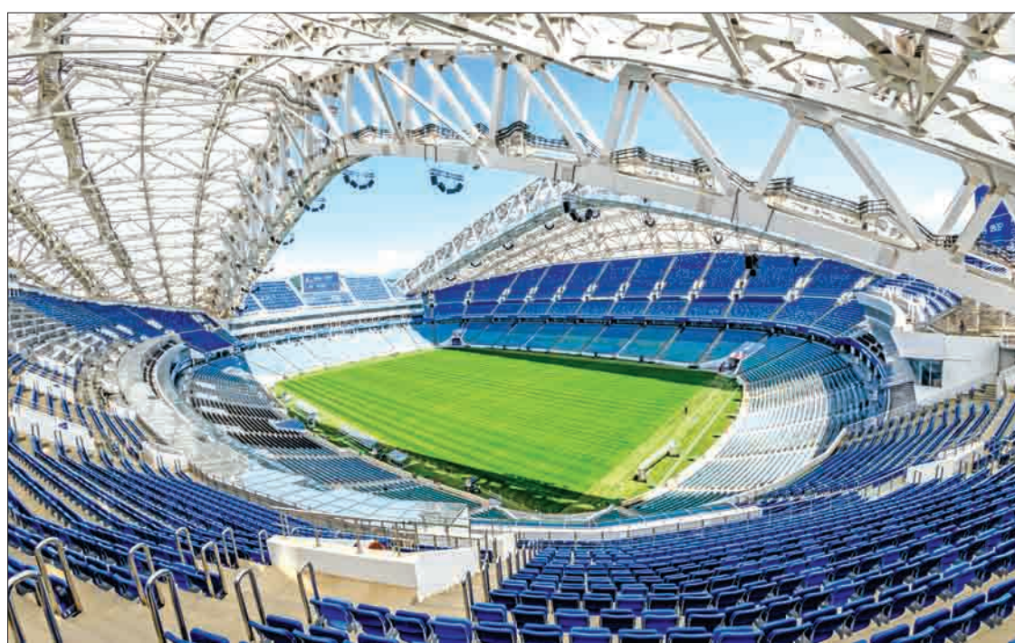
Around $450 million was spent on Sochi's Fisht Olympic Stadium in Sochi.

There won't be an “Oranje” army in Russia, because the Dutch failed to qualify, but there will still be the clapping Icelanders, the chanting English and the distinctive personalities of the supporters of the other 29 visiting countries. The differing languages, songs, flags and fan cultures of the world will energise the streets of Russia's host cities until the middle of July. The figure of one million seems to have been reached by a surprisingly unscientific manner. FIFA has deducted the number of tickets sold to Russians, 872,578, from the two million it says have been sold in total. The biggest demand, outside the host nation, has come from the United States, whose team failed to qualify, with 86,710