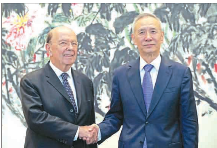
US Commerce Secretary Wilbur Ross (L) chats with Chinese Vice Premier Liu He after their meeting at the Diaoyutai State Guesthouse in Beijing, on 3 June 2018.

For goods alone, the US trade deficit with China hit a record $375 billion last year, and