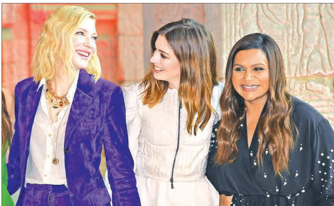
Actresses Cate Blanchett, Anne Hathaway and Mindy Kaling attend the "Ocean's 8" worldwide photo call at The Metropolitan Museum of Art on May 22, 2018, in New York City.

It's at this party — organized by Vogue editor Anna Wintour — that Debbie wants to get her hands on a $150 million Cartier