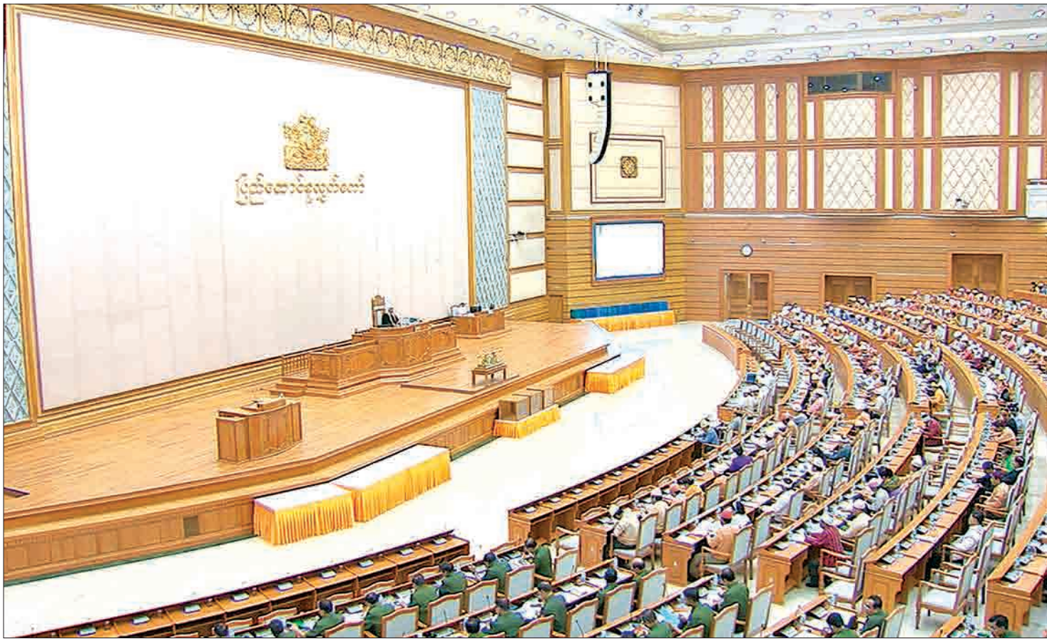
Pyidaungsu Hluttaw is being convened in Nay Pyi Taw yesterday.