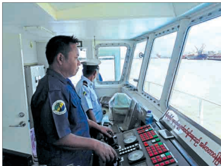
Inland Water Transport conducts disaster preparedness drill on a ferry in Dala Township, Yangon Region.

A DISASTER preparedness drill was held on a vessel at a jetty in Dala Township, Yangon Region yesterday morning.