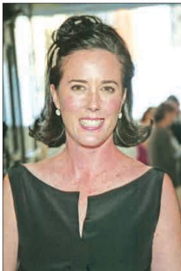
Designer Kate Spade was treated for depression and anxiety for five years, her husband said.