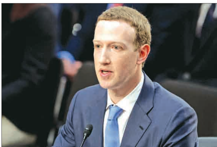
Some lawmakers say Facebook CEO Mark Zuckerberg, seen here at an April congressional hearing on personal data protection, should return to explain its deal allowing smartphone makers to access user information.

Facebook, which has been blocked in China since 2009, also had data-access deals with Chinese companies Lenovo, OPPO