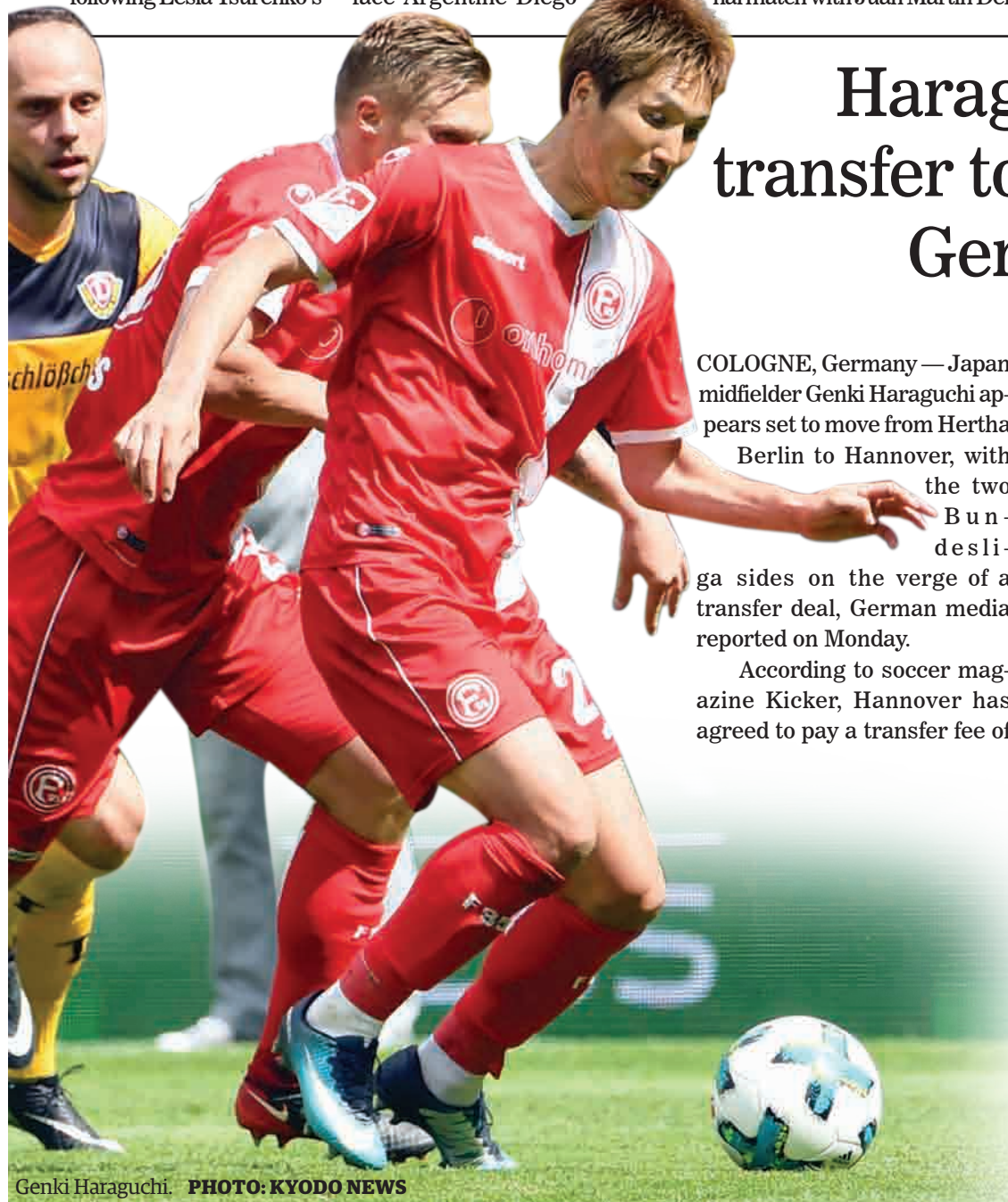
Genki Haraguchi.

COLOGNE, Germany — Japan midfielder Genki Haraguchi appears set to move from Hertha Berlin to Hannover, with the two