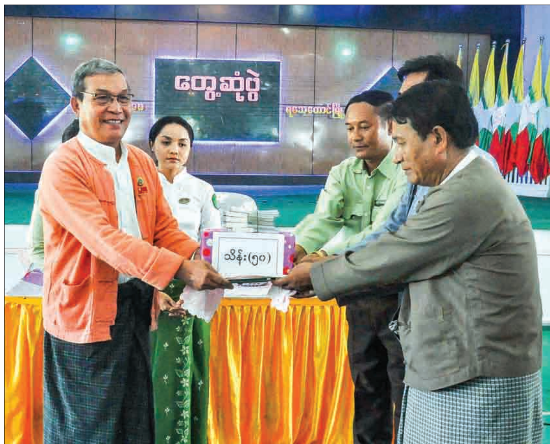
Rakhine State Chief Minister U Nyi Pu delivers cash assistance to residents of Yathedaung Township, Rakhine State.

At the meeting, the Chief Minister also expressed the government’s commitment to building a Federal Democratic Country through negotiation, mutual respect and transpar-