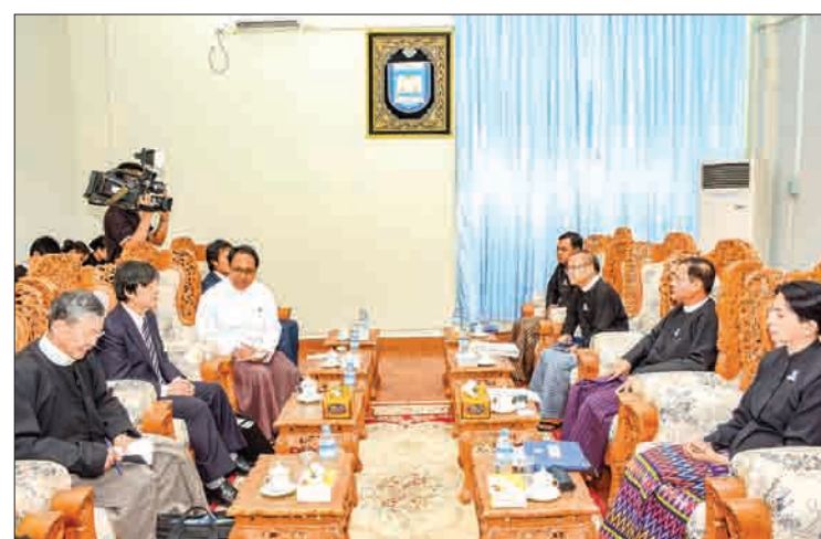
Union Attorney-General U Tun Tun Oo holds talks with board members of the ICCLC in Nay Pyi Taw yesterday.