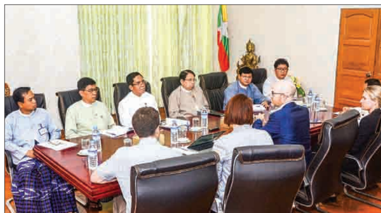
Union Minister for Information Dr Pe Myint meets with Facebook Vice President Mr. Simon Milner at the Ministry of Information yesterday.

People around the world use from 500 million to 1 trillion tons of plastic every year, while one million plastic bags are thrown away every minute. Burning plastic releases ethylene oxide and dioxide, among other chemicals, which can harm living things via air pollution. If the chemicals released in the air are breathed in and seep into the bloodstream, they can cause cancer. Furthermore, people usually pack food in plastic bags, which will also release these dangerous chemicals into the food if the food is hot and kept inside for a long period of time.