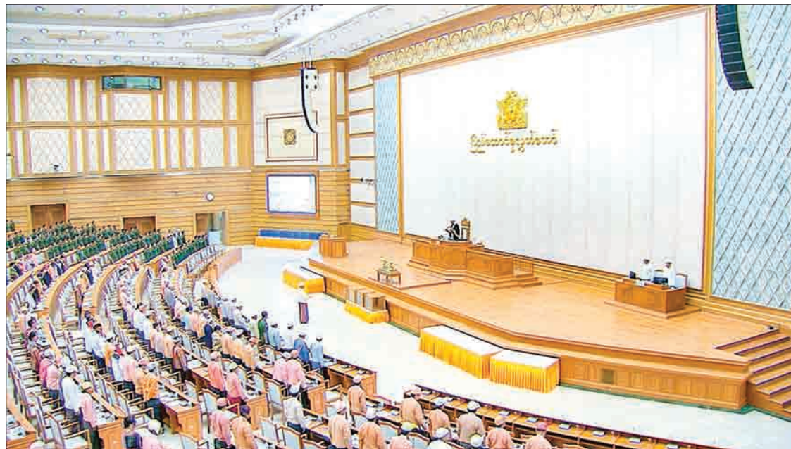
Union Minister U Soe Win takes the oath in the presence of the Pyidaungsu Hluttaw Speaker.

Later, the Joint Bill Committee reports on three bills were read by the committee secretary and members.