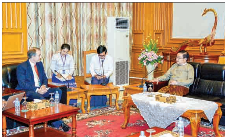
Pyithu Hluttaw Speaker U T Khun Myat meets with EU Ambassador Mr. Kristian Schmidt in Nay Pyi Taw yesterday.

The second Pyidaungsu Hluttaw's eighth regular session's eighth-day meeting is scheduled to be held on 7 June. ■