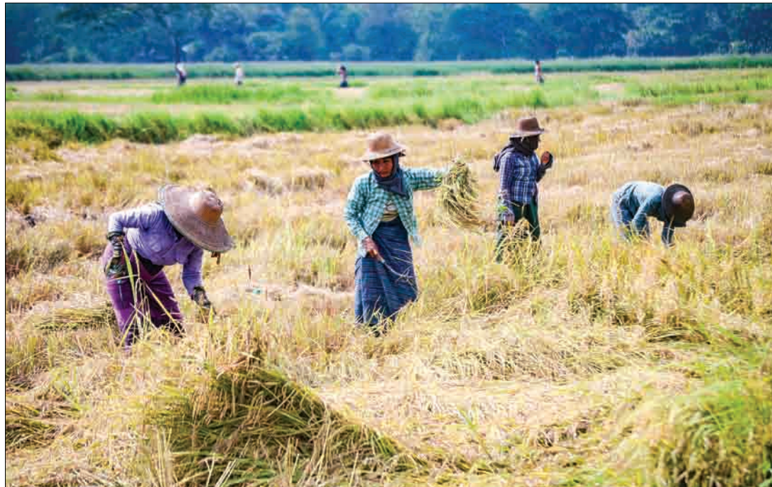
The joint survey will include an inspection of the weather conditions in each region, crop varieties and previous climate-related hazards.

Crop insurance pays for liabilities, depending on the rate that both parties agreed to when