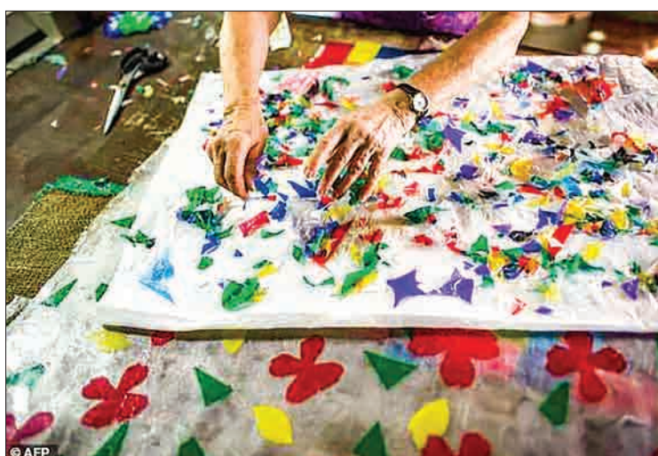
Chu Chu, which means ‘plastic’ in Burmese, started in 2013 with just two workers, and now sells its products in Yangon and across the country.