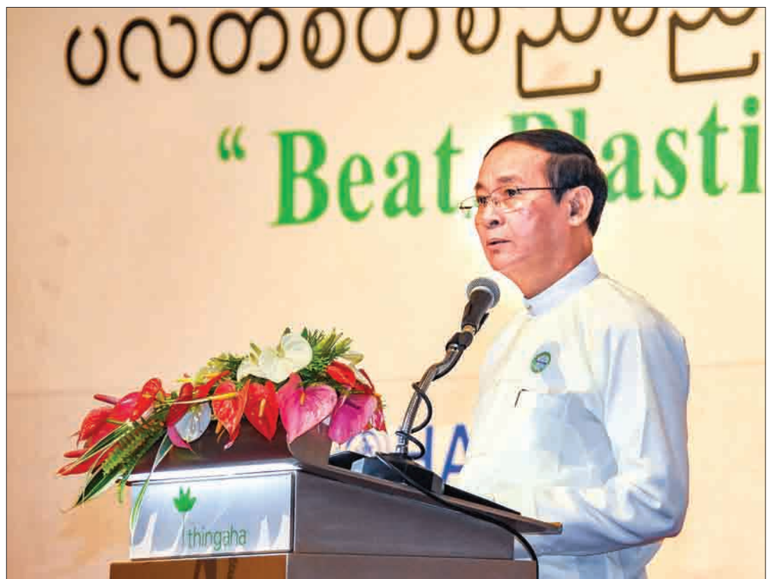
President U Win Myint delivers a speech stressing the need for revised waste management laws at the ceremony to commemorate World Environment Day 2018 in Nay Pyi Taw yesterday.

Speaking at a ceremony to commemorate World Environment Day 2018 in Nay Pyi Taw yesterday, President U Win Myint stressed the need to revise the enacted laws, rules and regulations in line with updated technology and conditions as part of efforts to ensure systematic waste management in the country.