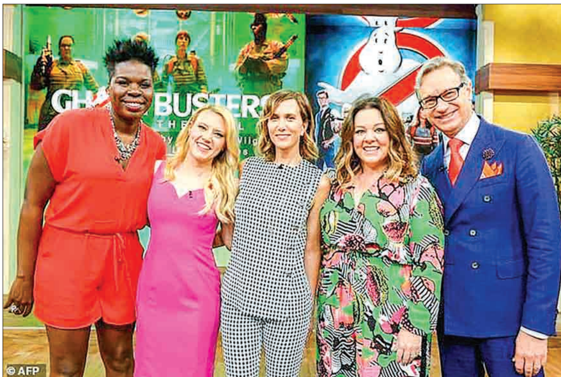
The “Ghostbusters” remake could well be studied in future film history classes for the bizarre backlash it received from the legion of “ghostbros” who swore lifelong loyalty to the 1984 original.

“Ghostbusters” (2016) could well be studied in future film history classes for the bizarre backlash it received from the legion of “ghostbros” who swore lifelong loyalty to the 1984 original.