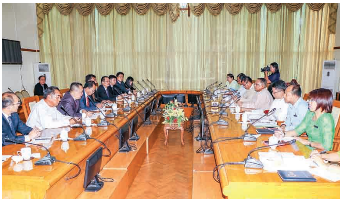
Union Minister Dr Than Myint holds talks with Chinese delegation led by Mr. Yang Haodong, Lancang County Secretary of Communist Party yesterday.