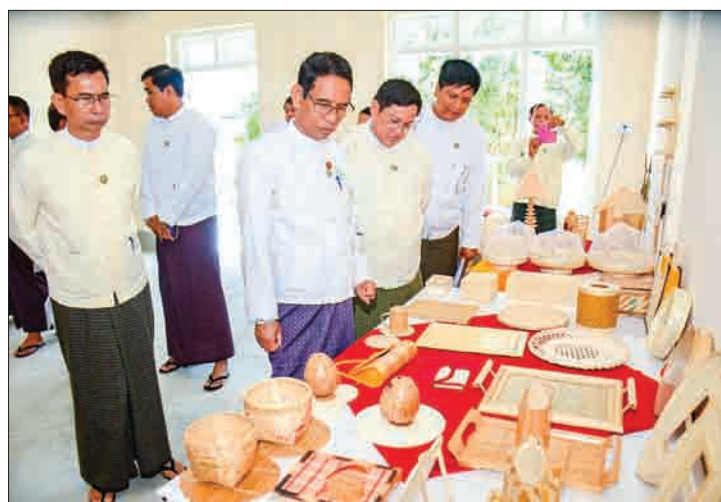
Union Minister Dr Aung Thu observes bamboo products displayed at the vocational training course.

The union minister and the officials who attended the meeting, inspected the