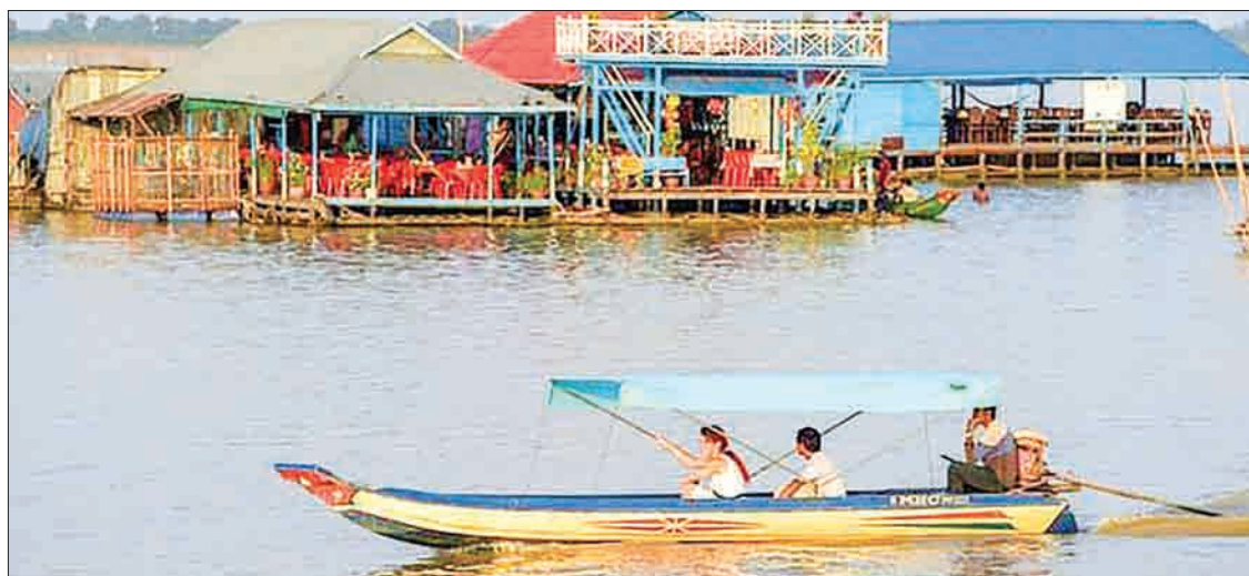
The Tonle Sap lake expands to several times its size during the monsoon rains, attracting tourists to the stilt villages and floating restaurants.

“It’s a great way to spend the afternoon or morning exploring, staying on the little boats, seeing the beautiful lake, it’s an amazing place,” she said.—AFP ■