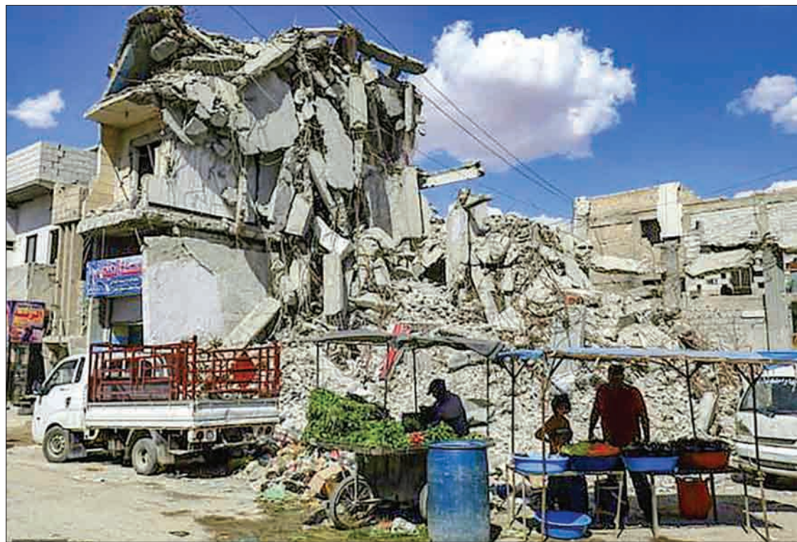
The United States led a four-month campaign of air strikes from June last year, dubbed a "war of annihilation" by US Defence Secretary James Mattis, to liberate Raqqa from IS control.

Amnesty researchers travelled to the devastated city in February and spent two weeks