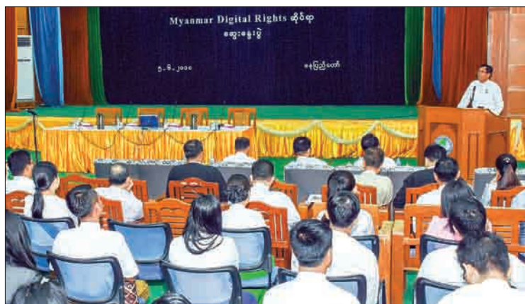
Deputy Minister U Aung Hla Tun addresses the forum on Myanmar Digital Rights in Nay Pyi Taw.

"Being invented around 1970, digital technology has developed very speedily and had