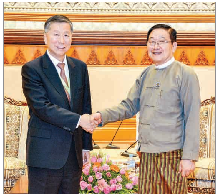
Pyithu Hluttaw Speaker U T Khun Myat shakes hands with Chairman Mr. Shang Fulin in Nay Pyi Taw yesterday.

During the meeting, they discussed several issues, including cooperation in all-round strategic bilateral relations through the Pauk Phaw relations, industrial zones and