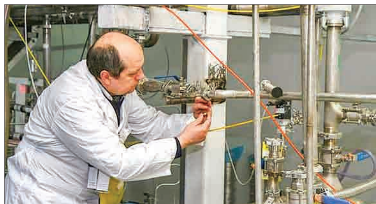
An International Atomic Energy Agency (IAEA) inspector in January 2014 disconnects cascades for 20 percent uranium production at the nuclear power plant of Natanz, some 300 kilometres south of Tehran.

European governments have been trying to salvage the agreement ever since the United States announced its withdrawal last month and said it would reimpose sanctions on foreign companies working in the Islamic republic by November.—AFP ■