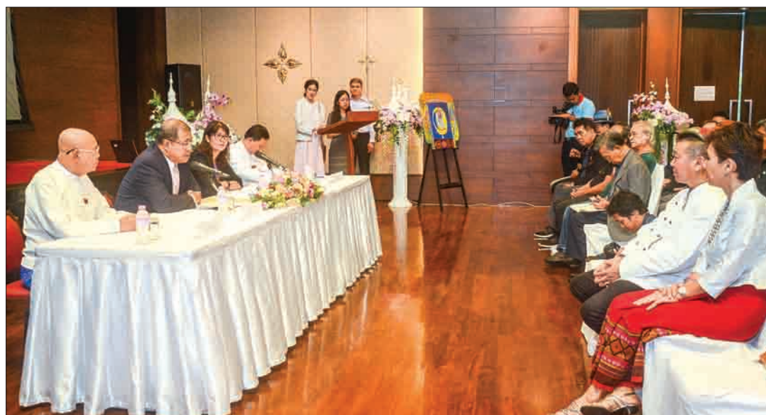
Thai embassy plans to hold cultural activities to mark 70 th anniversary of diplomatic relations with Myanmar.

The performance will feature a Thai version of the Ramakien.