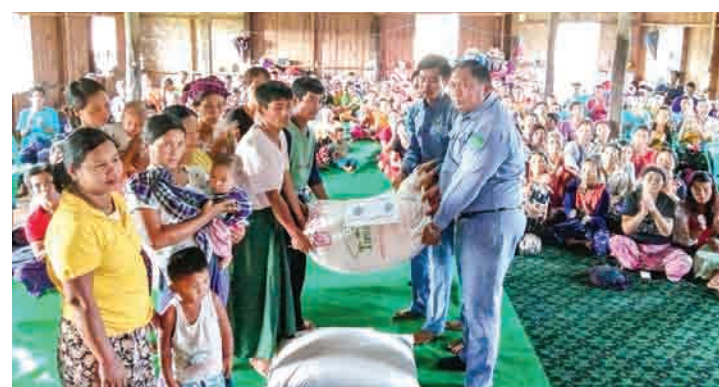
Ministry of Border Affairs delivers aid to displaced persons in Tanai Township, Kachin State.

The Ministry of Border Affairs has provided 2,869 displaced persons in Kachin State Phakant, Myitkyina, Mogaung, Tanai and Waingmaw townships with 1,116 bags of rice, 1,788 viss of cooking oil, 1,856 viss of peas, 548 viss of salt, 162 blankets and 82 mosquito nets in cooperation with local Tatmadaw forces. — Myanmar News Agency ■