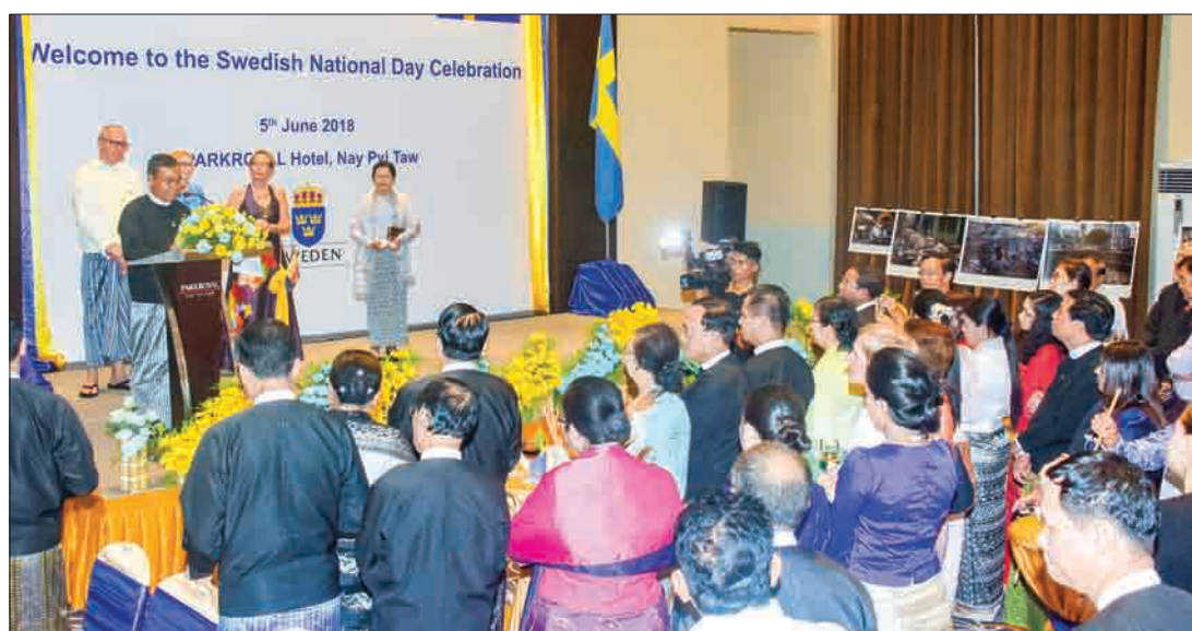
Union Minister U Ohn Win extends greeting at the reception to mark Swedish National Day in Nay Pyi Taw yesterday.