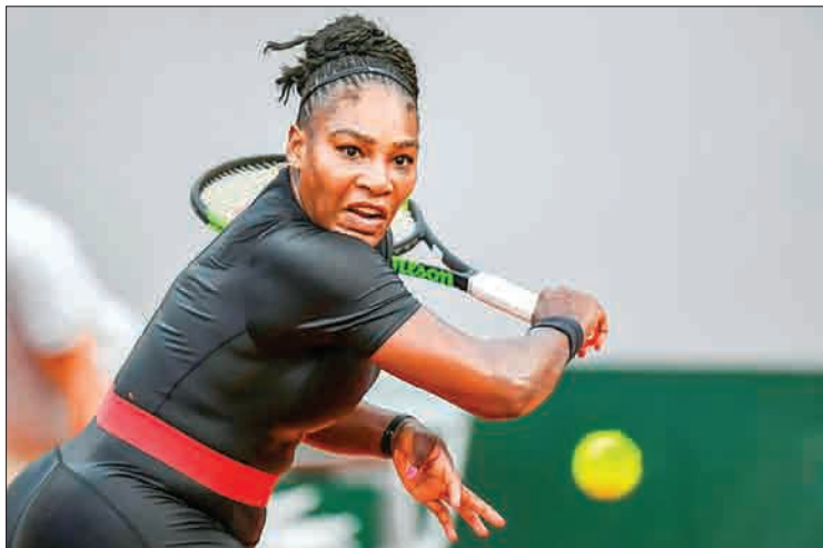
Serena Williams pulled out of her French Open clash with bitter rival Maria Sharapova on Monday.

Sharapova will take on third-seeded Garbine Muguruza, who advanced to last eight following Lesia Tsurenko's