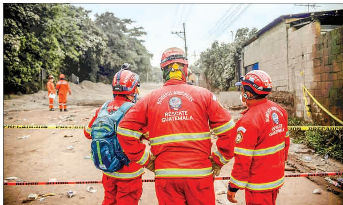
Firefighters observe the damage in effected area by eruption in the community of San Miguel Los Lotes in Escuintla, Guatemala on 4 June, 2018.

The volcano spewed ash over a wide area causing the international airport in Guatemala City to temporarily close. However operations were restored to some degree on Monday.—Kyodo News ■