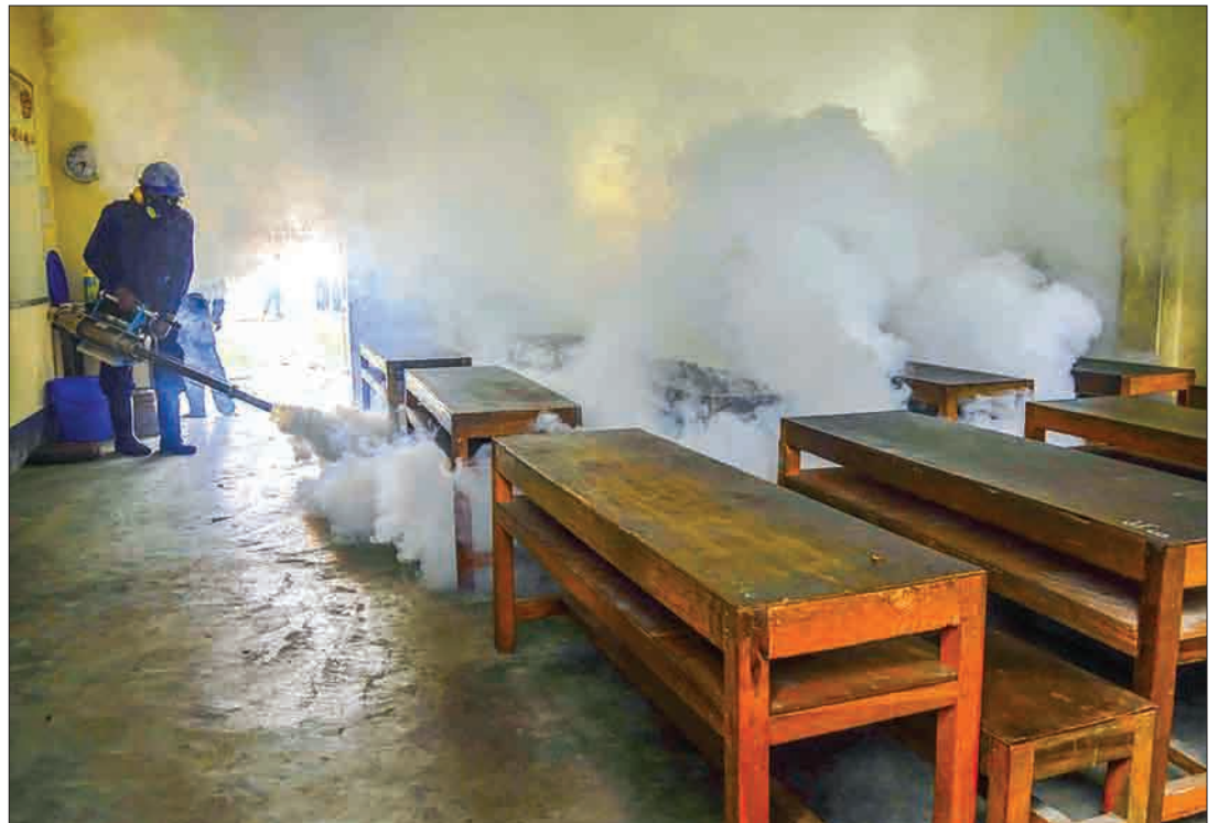
A man fumigates a classroom in South Okkalapa Township.

Dengue is a mosquito-borne disease, transmitted by a mosquito bite. Overcrowding and poor sanitation are the main factors contributing to the rapid