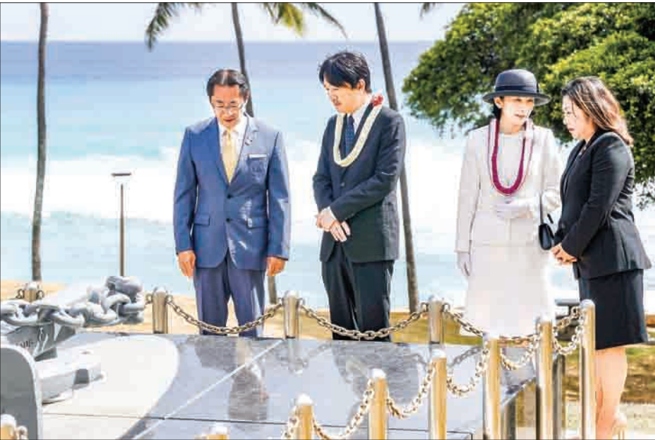
Japanese Prince Akishino (2 nd from L) and his wife Princess Kiko (2 nd from R) visit on 4 June, 2018, a monument in Honolulu dedicated to nine people who died in a 2001 collision off Oahu Island between the Japanese fisheries school training boat Ehime Maru and a US naval submarine.