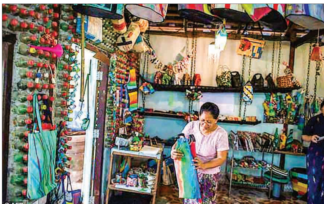
Even the shop is made from reused waste, with walls formed by cemented plastic bottles and a roof made from old tyres.

“We try to make things that are good quality, well constructed, nicely designed and beautiful — and can be considered useful.”