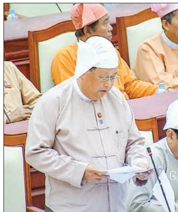
Union Minister for Electricity and Energy U Win Khaing.

Next, Union Minister for Electricity and Energy U Win Khaing replied to a question