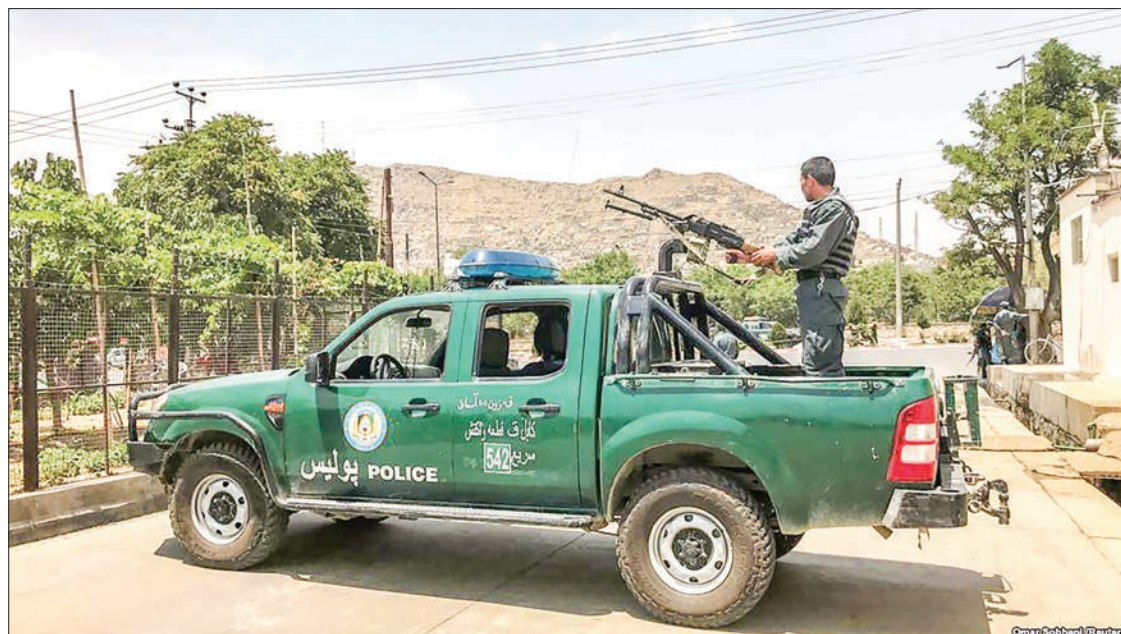
Militants are stepping up their headline-grabbing assaults on the heavily fortified capital.

The tent is a huge venue often used for top religious or government gatherings. "Loya Jirga" means "grand assembly"