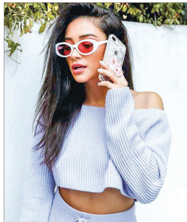
Shay Mitchell.

‘It can get really dangerous if you start to believe that social media is realistic. If you can go into it knowing there’s filters behind each and every one of those photos, or this is a photo that was professionally shot, then I feel like it allows yourself to be less harsh on your own photos. Everybody’s life in general isn’t maybe always what it seems,’ Mitchell, 31, told InStyle magazine.—PTI ■