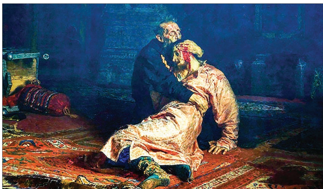
Ivan the Terrible and His Son by Ilya Repin.

While, two guards protect The Night Watch," she reiterated, citing more examples.