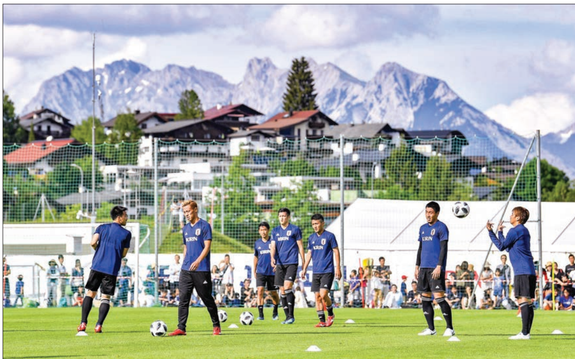
Japan's World Cup squad members train at the team's camp in Seefeld, Austria on 3 June, 2018.

after the shock firing of his predecessor Vahid Halilhodzic in early April, said following the Ghana match that the back-three was just one of the formations he was considering for the World Cup.