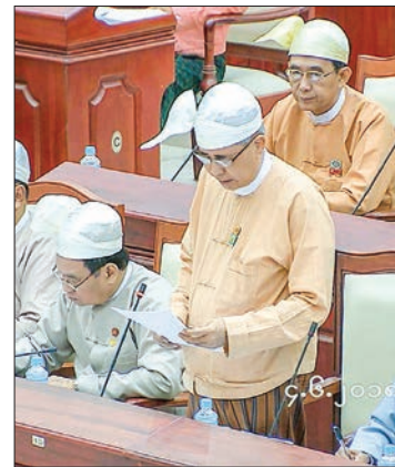
Deputy Minister for Transport and Communications U Kyaw Myo.

The union minister said that to provide electricity to the Akyiban and Aleban villages in Htilin Township, Gangaw District, Magway Region, three 11/0.4-KV, 200 KVA transformers and 7 miles of 11-KV power line from 66/11 KV, 5 MVA Htilin sub-station is required. To provide electricity to Anyaban village via Aleban village, 5 miles