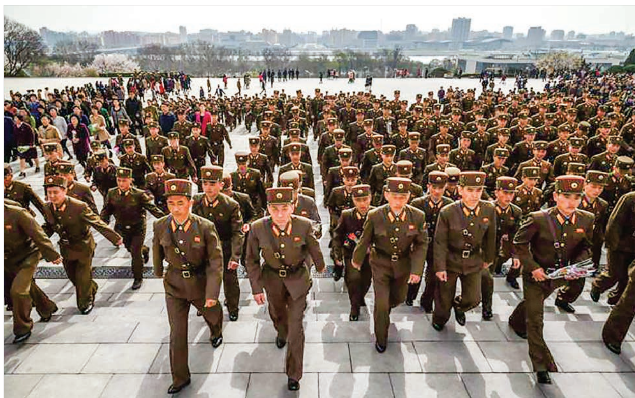
File photo showing North Korean soldiers paying their respects before the statues of late North Korean leaders Kim Il Sung and Kim Jong Il, at Mansu hill in Pyongyang on 15 April, 2018.

The wholesale reshuffle would be unusual if con-