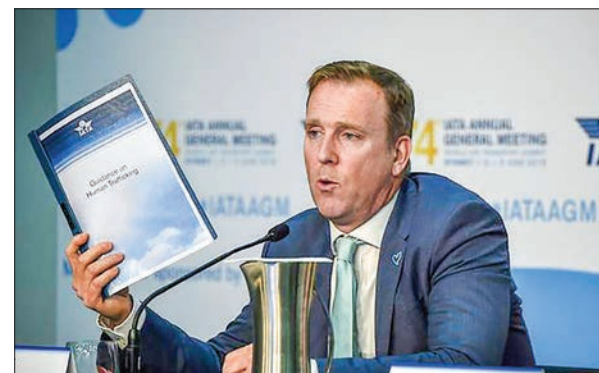
The new guidelines will include comprehensive checklists on how to identify suspected cases and handle victims after landing.

Key transregional flows include from sub-Saharan Africa to the Middle East and western and southern Europe, and from South Asia to the Middle East and East Asia and the Pacific, according to UNODC.—AFP ■