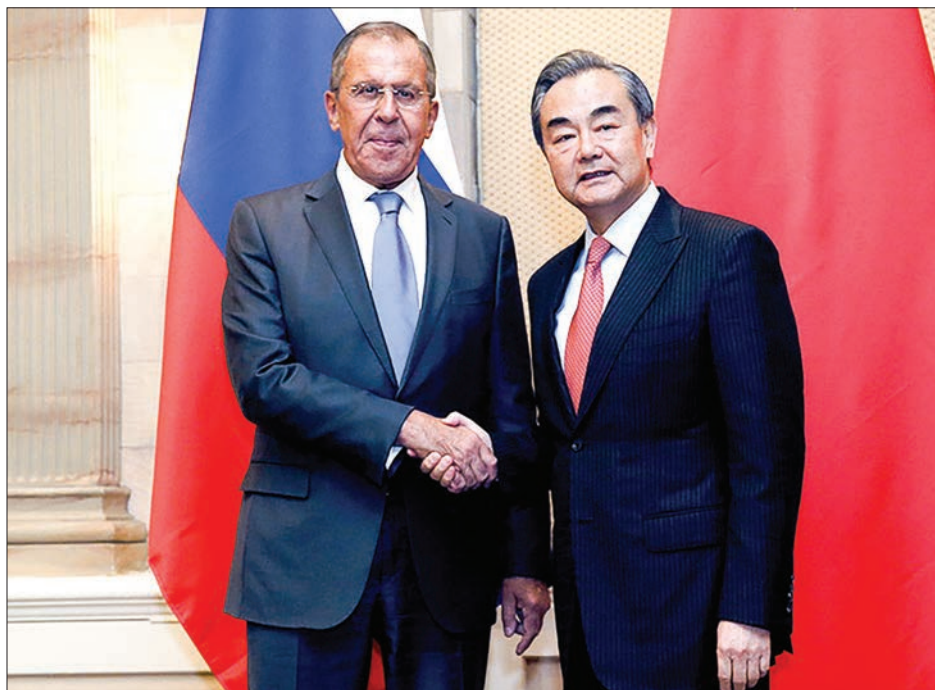
Russian Foreign Minister Sergei Lavrov announced it at meeting with Chinese Foreign Minister Wang Yi.