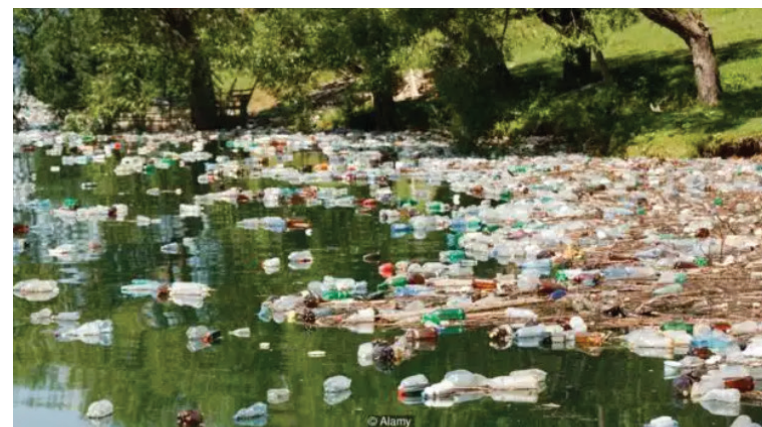
Rivers may be a major source of ocean plastic pollution

freshwater could have a long-term negative effect on such ecosystems. Sewage sludge disposal to the fields as fertilizers affects the health and functions of soil. Chlorinated plastic can release harmful chemicals into the surrounding soil, which can then seep into ground water or surrounding water sources, and also the ecosystem. Consequently, this can cause a range of potentially toxic effects on the species that drink water. According to the research, the terrestrial microplastic pollution is about four to 23 times higher than marine microplastic pollution, depending on the environment.