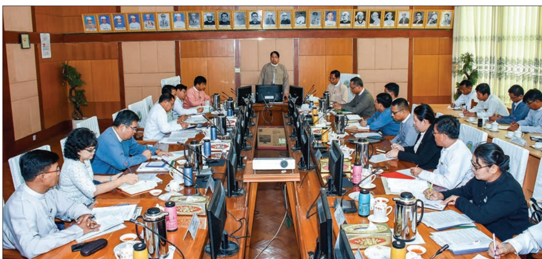
Union Minister Dr. Pe Myint delivers the speech at the coordination meeting for movie studio, entertainment city in Nay Pyi Taw.

At the meeting, Union Minister for Information Dr. Pe Myint said arrangements are being made to establish a modern movie park in Nay Pyi Taw with the aim of developing the Myanmar motion picture sector, to promote the country's image in film making and to develop Nay Pyi Taw. The move is aimed at presenting the traditions and culture of Myanmar in a more interesting way through the art of motion pictures, enabling the people of Myanmar to know more about their country and to take pride in their nation and