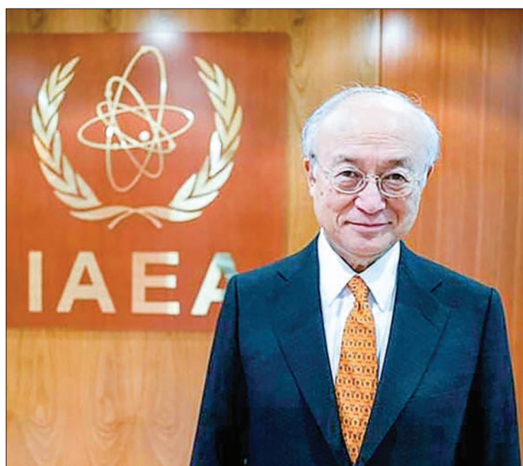
IAEA chief Yukiya Amano says the body has had access to all nuclear sites in Iran it had needed to visit.

A senior diplomat in Vienna, where the IAEA is based, said the call for timely cooperation did not mean that Iran had breached any of the rules of the accord but that the agency was "encouraging (Iran) to go above and beyond the requirements" of the deal.