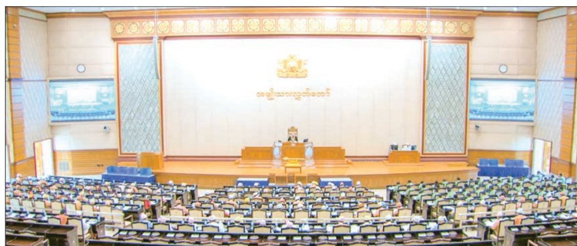
Amyotha Hluttaw is being convened in Nay Pyi Taw.

Replying to a question by U Shar Aww of Chin State constituency (2) on a plan to upgrade Surkhua-Dumva-Fahua inter-village connecting road