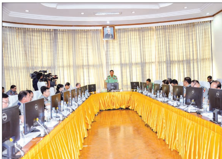
Union Minister for Home Affairs Lt-Gen Kyaw Swe delivers the speech at the central committee for anti-money laundering meeting.

THE CENTRAL COMMITTEE for Anti Money Laundering held its Meeting No. 1/2018 yesterday at the Ministry of Home Affairs in Nay Pyi Taw where the Committee Chairman Union Minister for Home Affairs Lt-Gen Kyaw Swe delivered an opening address.