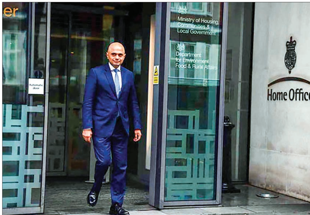
Home Secretary Sajid Javid.

The government want firms to raise the alarm as quickly as possible if they have evidence of unusual transactions — such