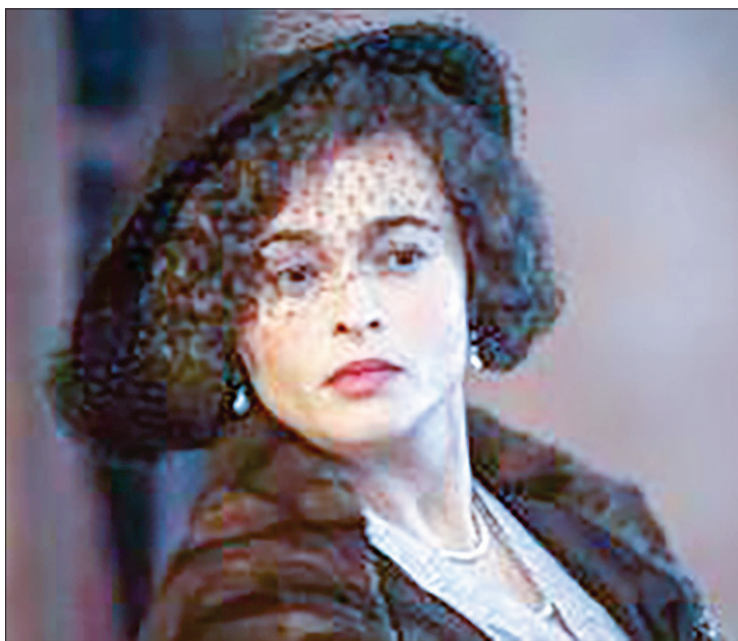
Actress Helena Bonham Carter.

If Jolie gets the role, it would mark her second time acting alongside Craig after 2001’s “Lara Croft: Tomb