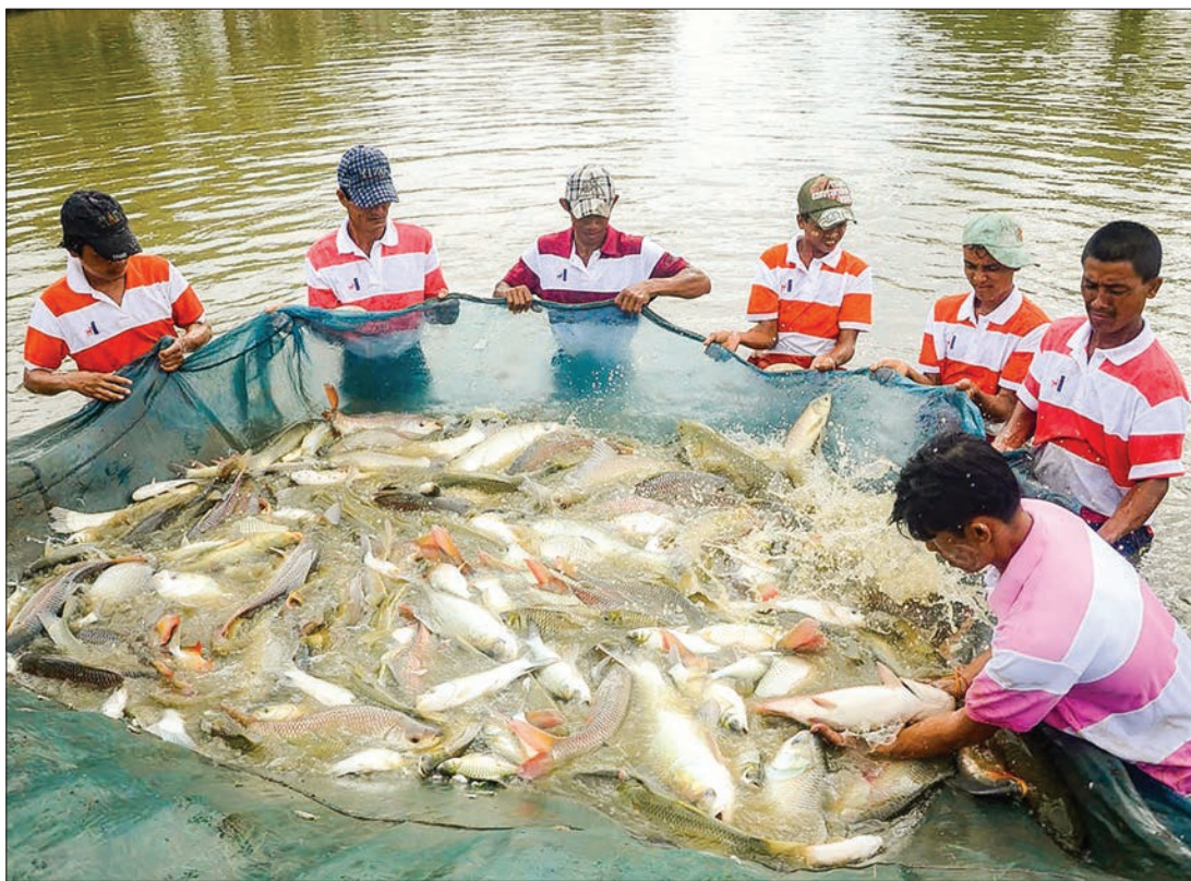
Workers harvest freshwater fish at a farm in Yangon.