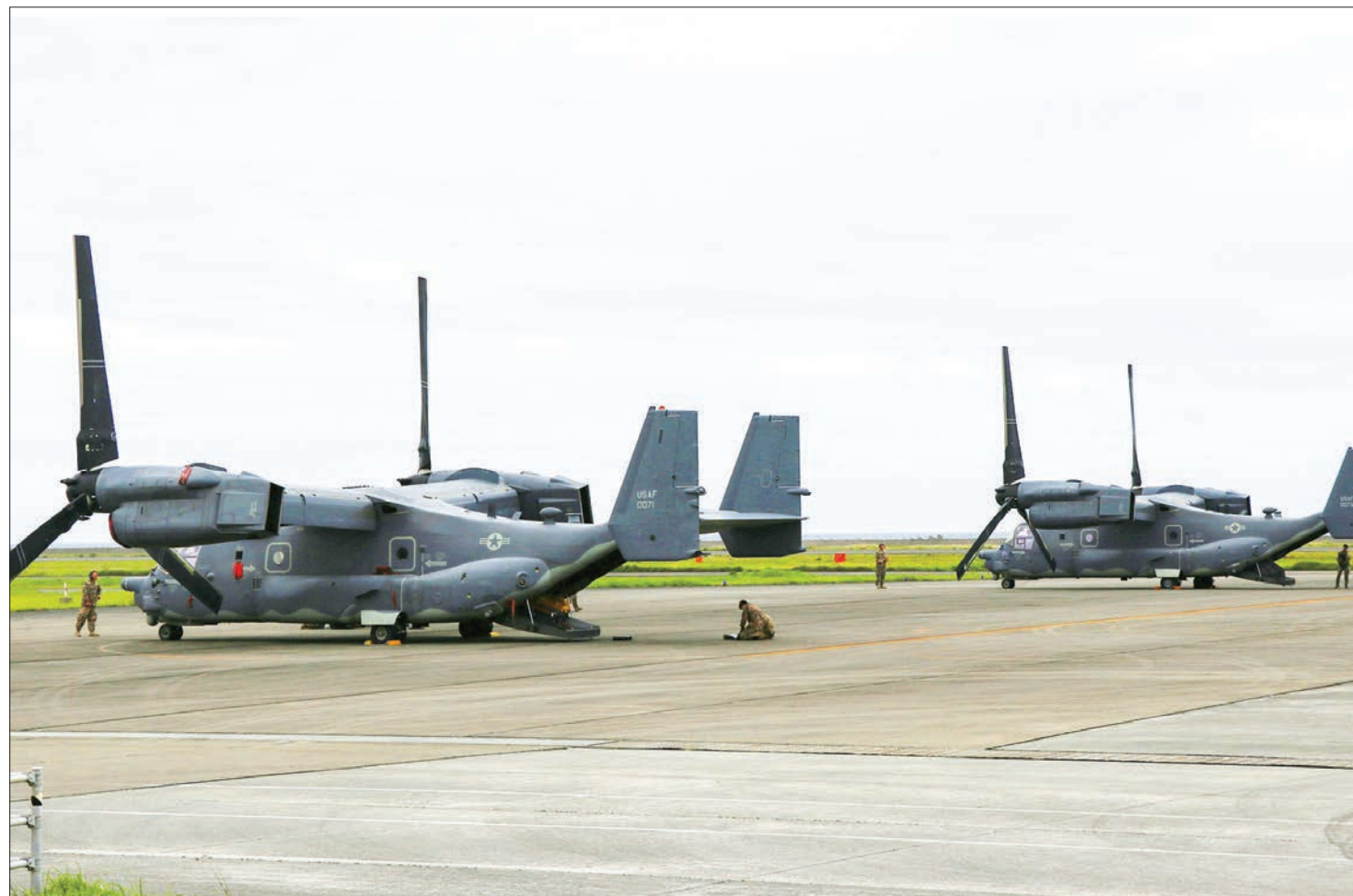
Photo shows two CV-22 transport aircraft of the US Air Force at Amami airport in Kagoshima, southwestern Japan, on 4 June, 2018 after they made an emergency landing at the airport.

While a US Marine Corps variant of the Osprey, known as MV-22, is already stationed in Okinawa, the deployment of the CV-22 at the Yokota air base will be the first time the aircraft is assigned to a base on mainland Japan. —Kyodo News ■