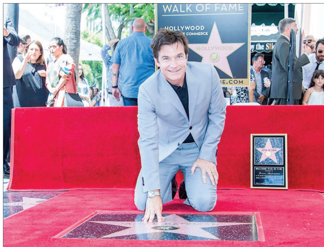
Actor Jason Bateman.