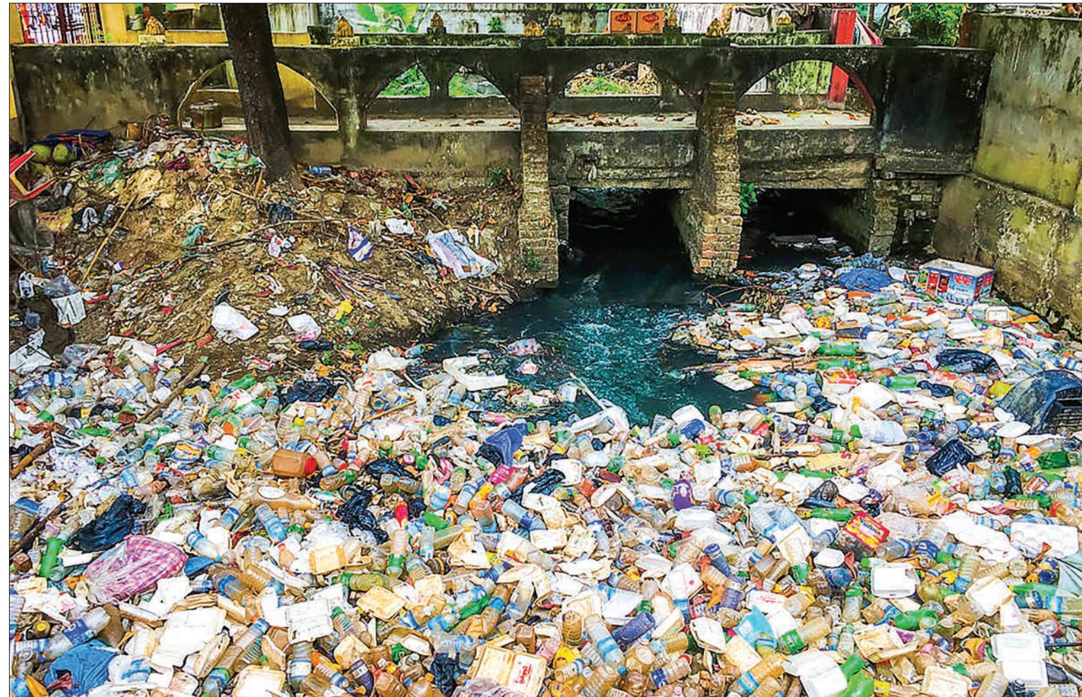
Plastic clogs up a waterway in Yangon, Myanmar.

Very little of the plastic we discard every day is recycled or incinerated in waste-to-energy facilities. Much of it ends up in landfills, where it may take up to 1,000 years to decompose, leaching potentially toxic substances into the soil and water. The impact of terrestrial microplastic pollution in soils, sediments and