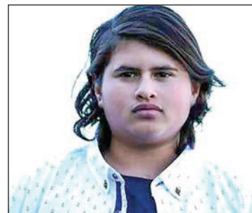
“Deadpool” actor Julian Dennison.

The first installment for the Monsterverse was 2014’s “Godzilla,” followed by “Kong: Skull Island” (2017), which grossed more than USD 565 million worldwide.