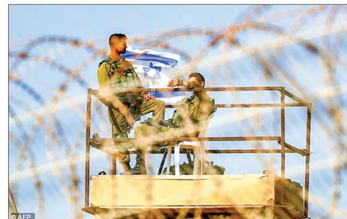
Israeli soldiers keep watch along the Gaza border fence on 15 May, 2018.

The Jewish state accuses Gaza's Islamist rulers Hamas of using the protests as an excuse to carry out attacks.—AFP ■