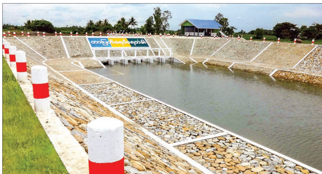
Tarpyatzayat sluiceway in South Yangon Region is supplying irrigation water to farms in southern Yangon Region.

As farmers of the two southern townships – Kyungyangon