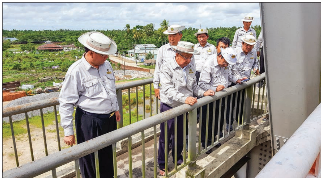
Union Minister for Construction U Han Zaw inspects the maintenance of Hlinethaya-Twantay-Kawhmu-Kungyangon-Dedaye road and Kyaikthale-Yaykyaw selected-soil road on 2 June, 2018.

The union minister then inspected the progress in laying the Dedaye-Tawkamae-Kyokkyat-Thayagon-Thandizeebu-