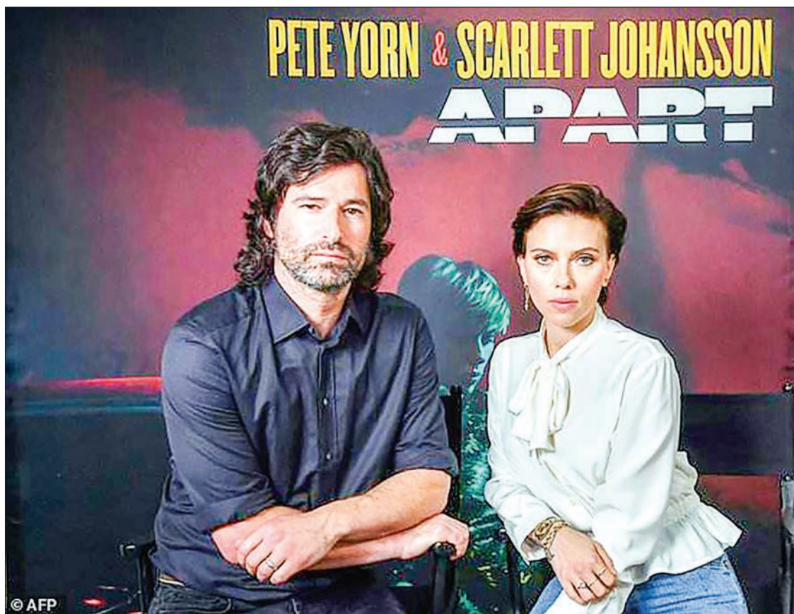
Pete Yorn, left, and Scarlett Johansson have launched their new extended play record "Apart".

"It's a long process and you have to keep your eye on the prize, and you have to be patient and progressive and persistent and you keep moving forward,"