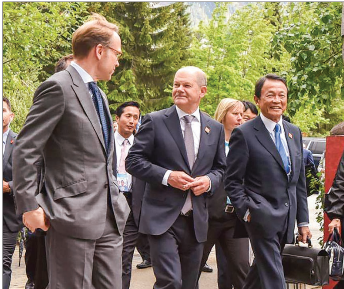
German Finance Minister Olaf Scholz (C) and his Japanese counterpart Taro Aso (R), attend the opening of the G7 finance ministers and central bank governors conference in Whistler, British Columbia on 31 May, 2018.

German Finance Minister Olaf Scholz told reporters the US tariffs were "a very severe problem" for transatlantic relations.