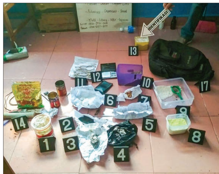
Photo taken on 2 June, 2018 shows explosive materials found during a police raid at a building of the Sociopolitical Science Faculty of the Riau Public University in Sumatra's Riau provincial capital of Pekanbaru.

It was not immediately clear if the call was related to a recent amendment of the country's 2003 Antiterrorism Law, which granted the military a bigger counterterrorism role, lengthened the detention period for terror suspects and ensured additional punishment for terrorist acts involving children. — Kyodo News ■