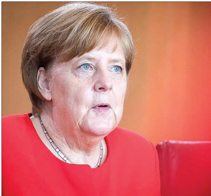
German Chancellor Angela Merkel unveiled on Sunday her ideas for EU reform in response to French President Emmanuel Macron's urging that the two countries take in the lead in bringing needed change to the bloc.

"We need quicker economic convergence between the member states," she said.