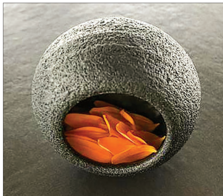
A dish of rice pudding and trout roe is displayed at the restaurant Vespertine in Culver City, California — part of a new generation of restaurants where the experience of eating is matched by an equally sumptuous feast for the other senses.

“Maybe one or two and, at the end of the day, how important was the food? The important thing was the connection that you felt, and that's long lasting.”—AFP ■