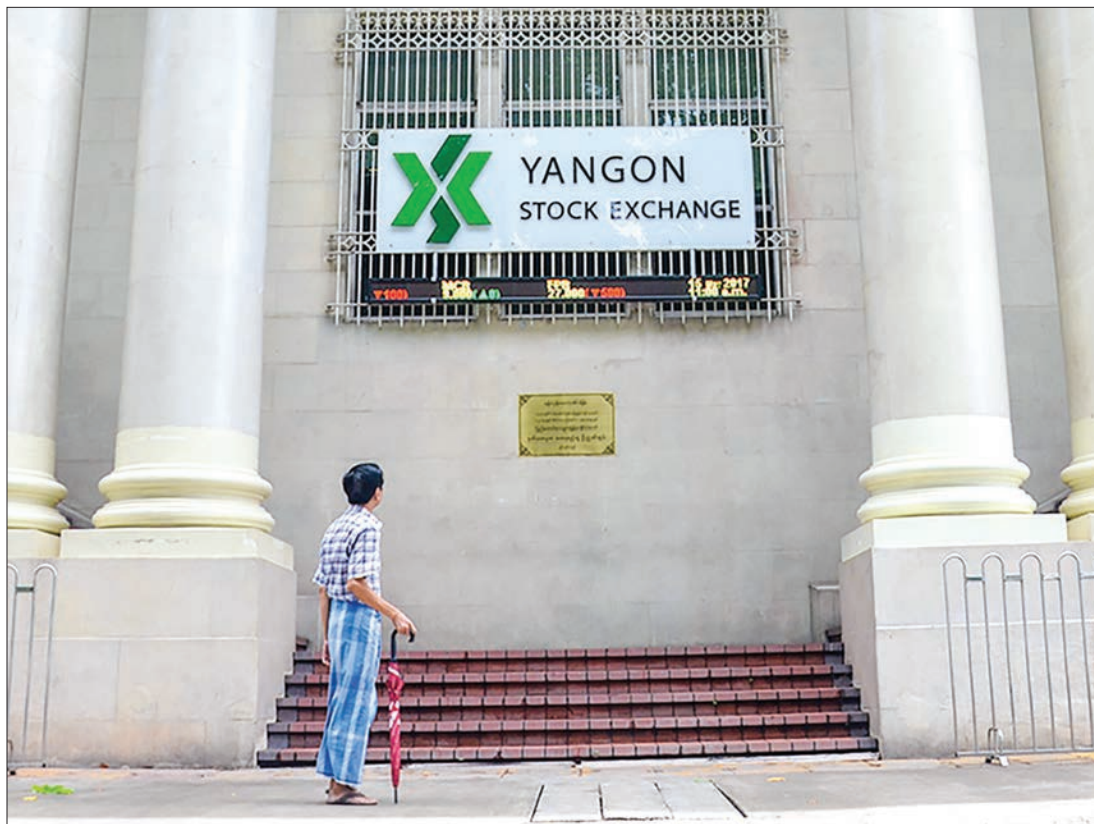
A man looks at the LED board showing the stock exchange rates at YSX, in Yangon.