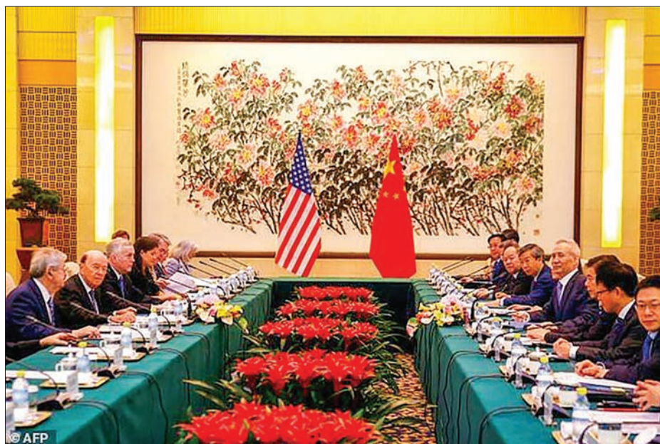
The US and China have been at loggerheads over trade and industrial practices for months.

The discussions in Beijing, led by US Commerce Secretary Wilbur Ross and