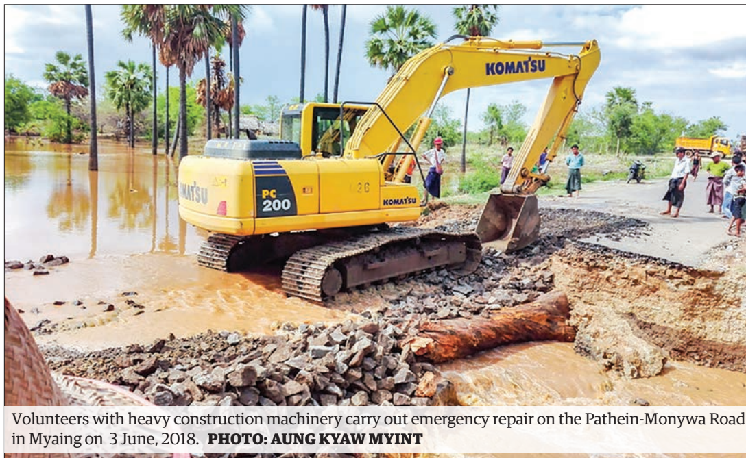
Volunteers with heavy construction machinery carry out emergency repair on the Pathein-Monywa Road in Myaing on 3 June, 2018.

Due to limitation of space we are only able to publish "Letter to the Editor" that do not exceed 500 words. Should you submit a text longer than 500 words please be aware that your letter will be edited.