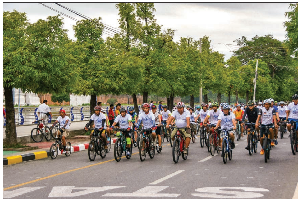
Officials and local people participate in Public Bicycle Event in Mandalay yesterday in commemoration of the World Bicycle Day.

The event concluded with physical exercises by the participants at the gathering point.—Myanmar News Agency ■