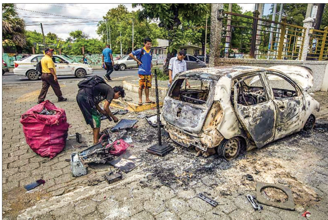
Anti-government demonstrators burned a car in Managua on 31 May, 2018.

The embattled president denies repressing them.—AFP