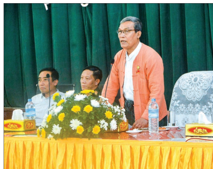
Chief Minister of Rakhine State U Nyi Pu meets village/ward administrators and local elders at U Ottama Hall in Buthidaung Township, Rakhine State.