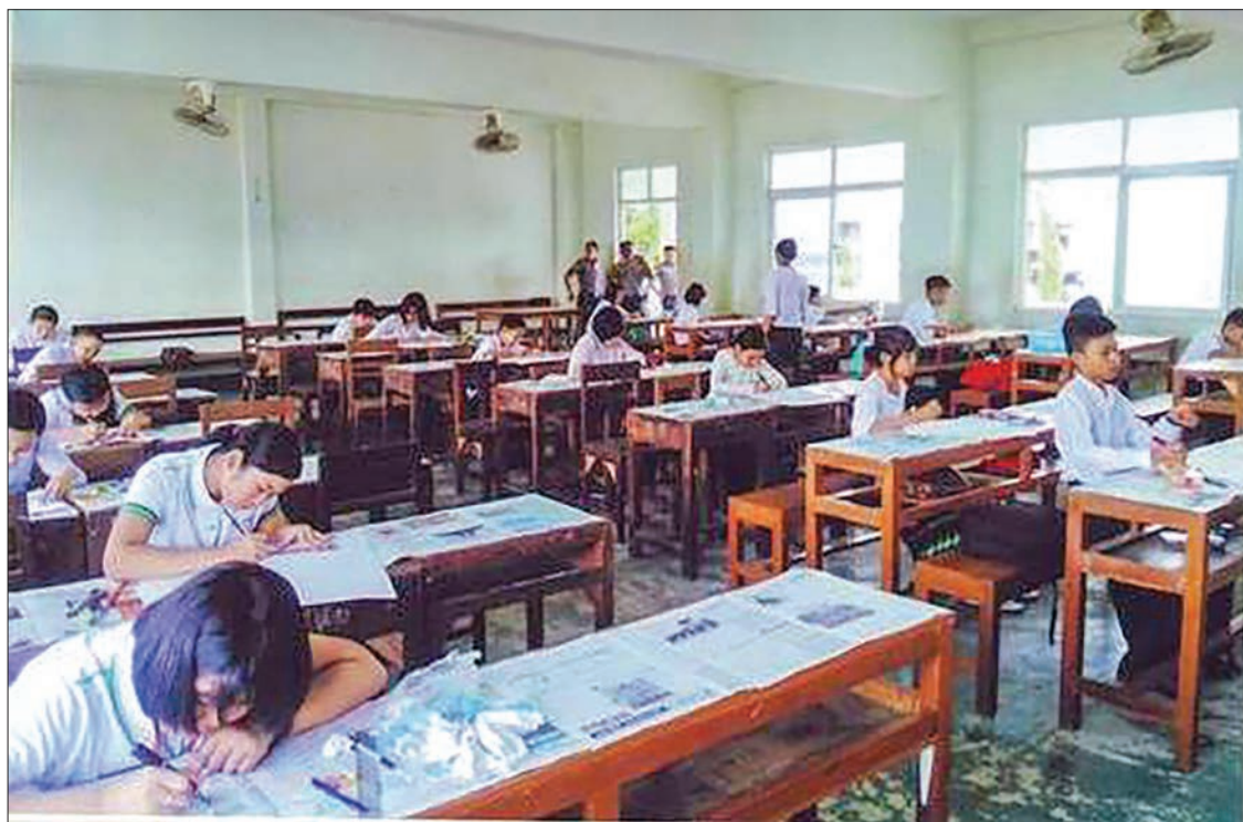
The Students are taking part in painting completion for marking the 21 st International Day against Drug Abuse and Illicit Trafficking.