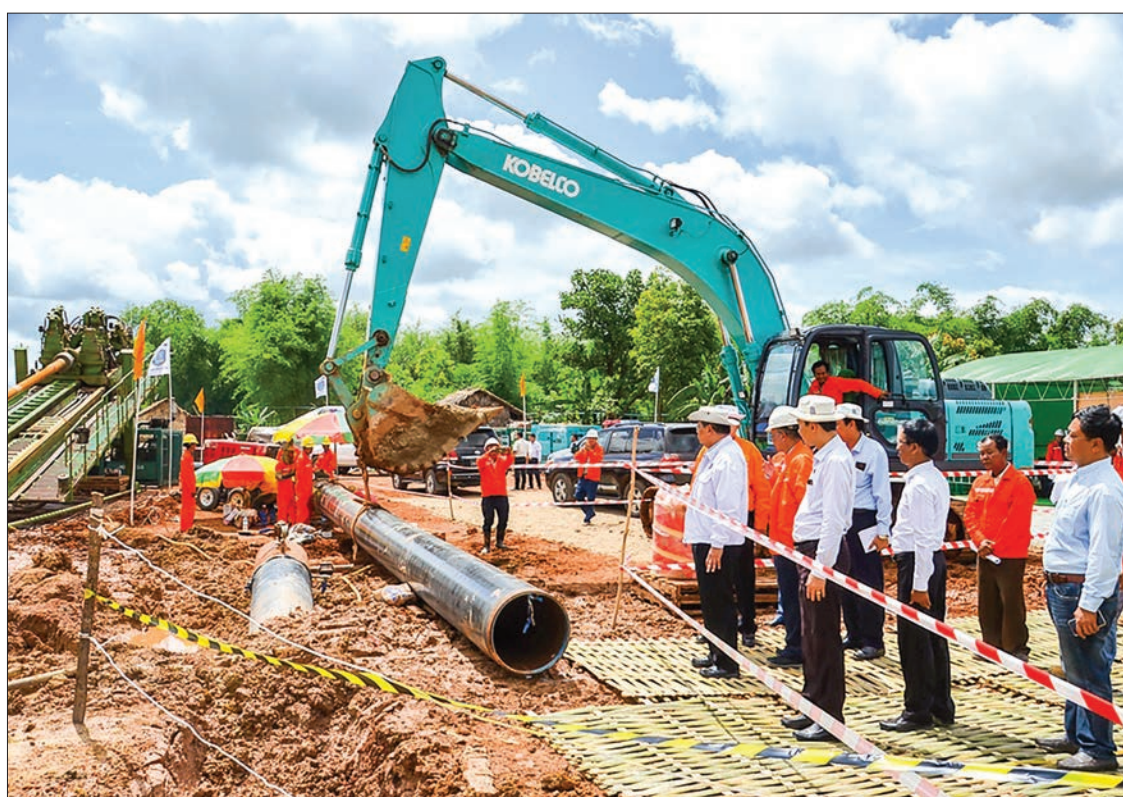
Union Minister for Electricity and Energy U Win Khaing inspects laying of the new gas pipeline across the Sittaung river. PHOTO: MYANMAR NEWS AGENCY

At the control room of the station, the union minister inspected the power distribution works and functions of the switchyard, gave instructions on power supply system safety, stable flow of electricity and prevention of power interruptions. — Myanmar News Agency ■