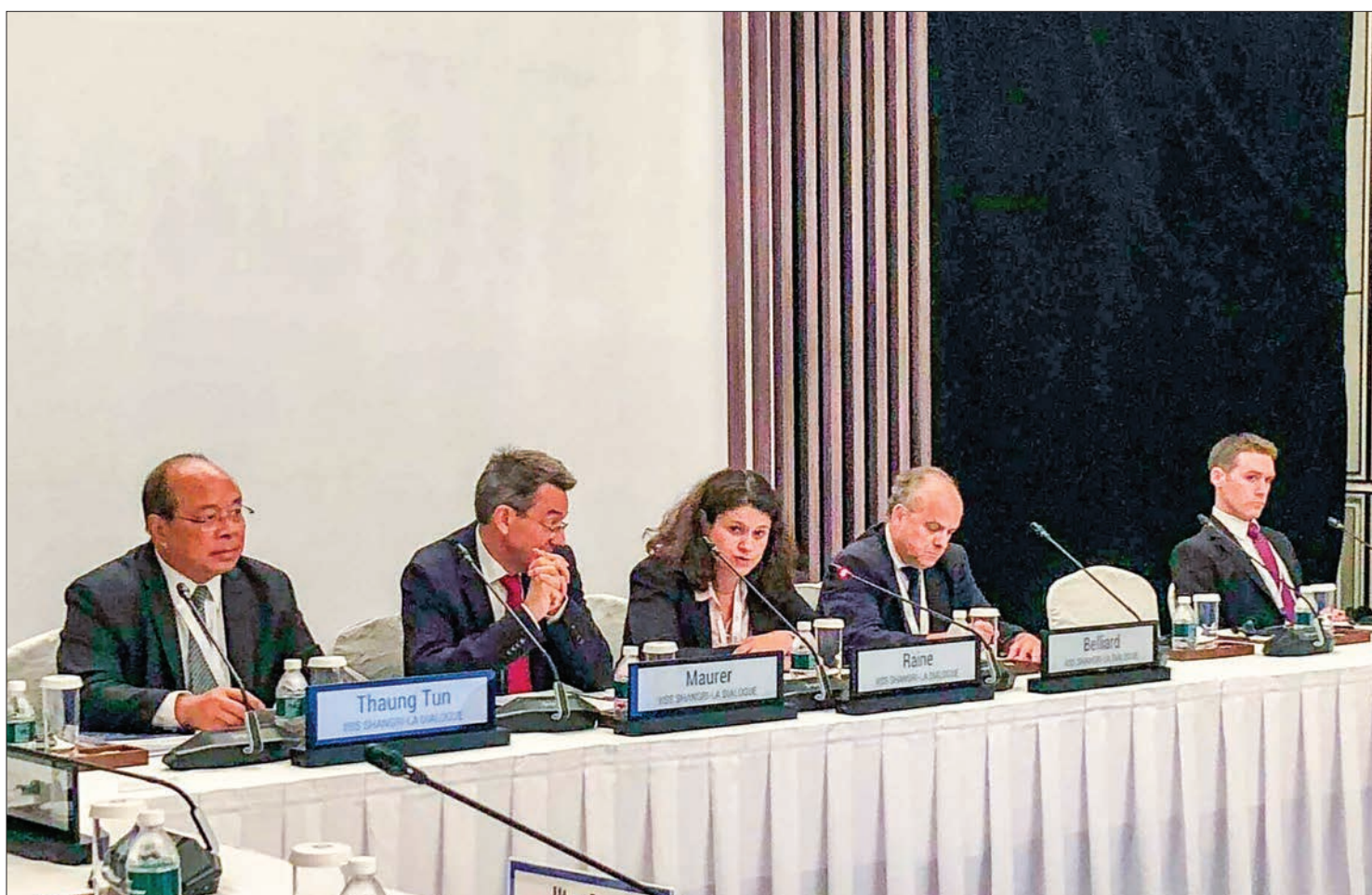
National Security Advisor U Thaung Tun (Left) takes part in the Asia Security Summit / The IISS Shangri-La Dialogue held in Singapore.