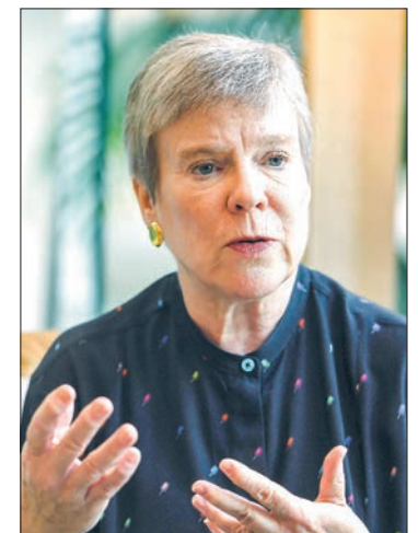
Rose Gottemoeller, deputy secretary general of the North Atlantic Treaty Organization, speaks in an interview in Singapore on 2 June, 2018.

Gottemoeller took up her position as NATO's No 2 in October 2016, prior to which she served as an undersecretary at the US State Department, handling arms control issues, for around five years. NATO was founded by 12 original member states in 1949 as a military alliance to