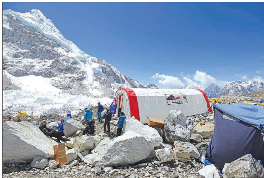
The tent clinic at Everest base camp is at an altitude of 5,364 metres (17,600 feet).

A few days’ rest, and he would be back at work.—AFP ■