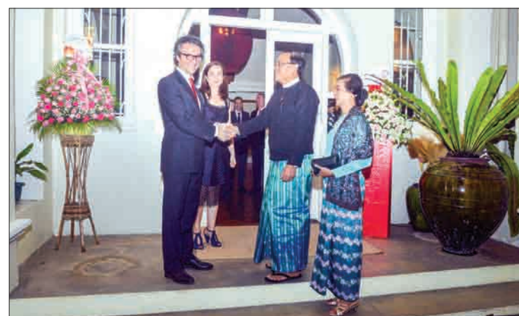
Italian Ambassador to Myanmar Mr. Pier Giorgio Federico Aliberti welcomes Union Minister U Kyaw Tin as the latter arrives to attend the National Day celebration of Italy in Yangon.

A celebration to mark the National Day of Italy was held at No. 33 Inya Myaing Road, Bahan Township, Yangon, yesterday evening.