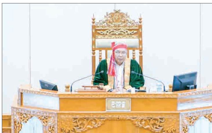
Amyotha Hluttaw Speaker Mahn Win Khaing Than.

The Union Minister replied that regional instructions and notifications on road areas were sent to district general Administration departments of Hpa-an, Kawkaireik, Papun and Myawady districts, which in turn informed the public to prevent and reduce illegal settling and encroachment onto the roads. In addition