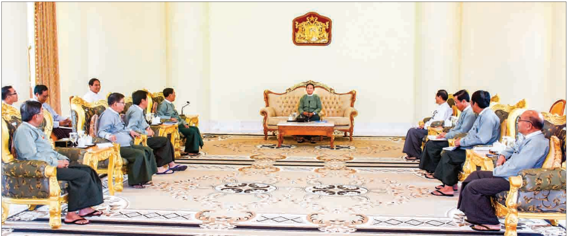
President U Win Myint, centre, meets with members of the Union Election Commission at the Presidential Palace in Nay Pyi Taw yesterday.