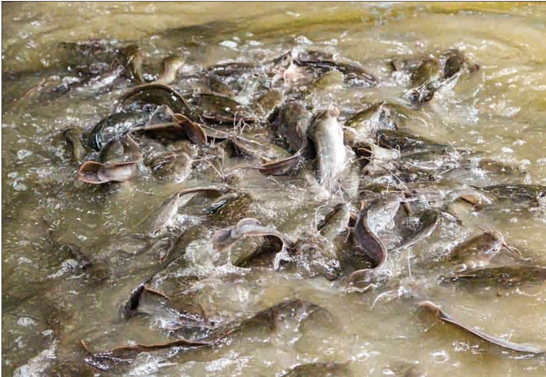
Freshwater catfishes are seen at a small-scale fish farm.