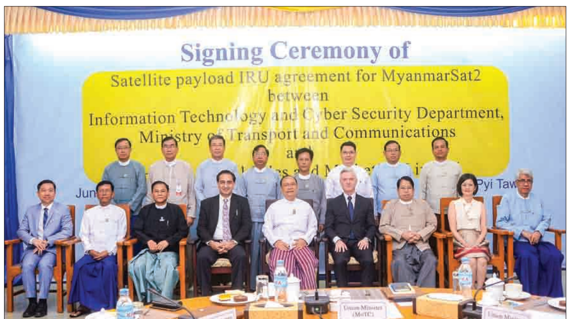
Officials pose a documentary photo at the Signing Ceremony of Satellite payload IRU agreement for Myanmar Sat 2 in Nay Pyi Taw yesterday.