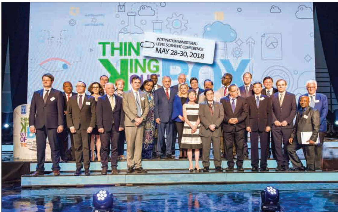
Union Minister for Education Dr. Myo Thein Gyi and other officials pose for a documentary photo at the signing ceremony of a cooperation agreement in Israel.