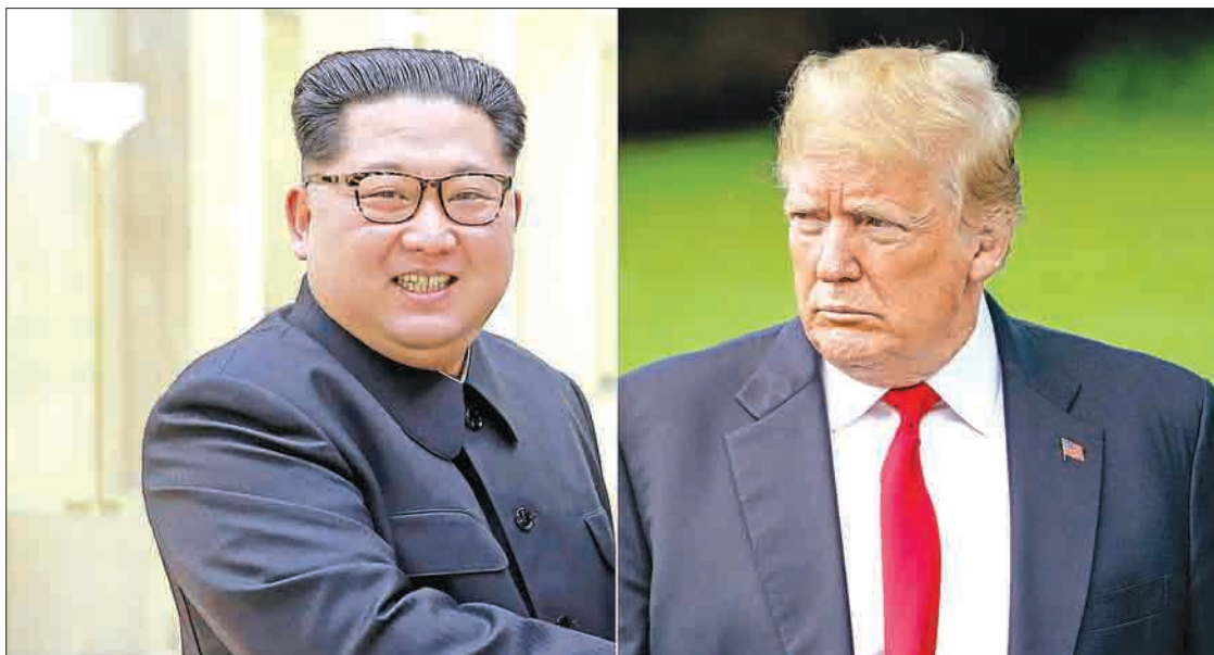
Trump to receive Kim letter as nuclear summit takes shape.

Simultaneously, Kim met Russia's Foreign Minister Sergei Lavrov and, according to official