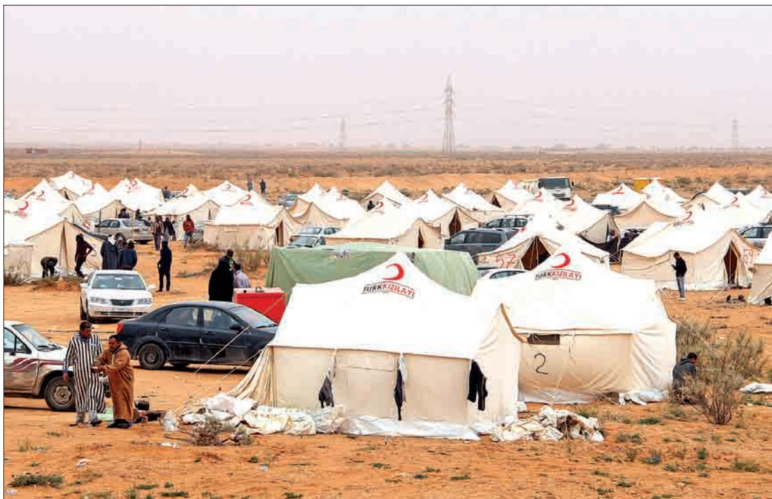
Since the 2011 fall and killing of dictator Moamer Kadhafi, Libya has become a key launchpad for migrants trying to reach Europe.

“This latest deadly incident demonstrates, once again, the huge challenge of providing protection to refugees in Libya, where many people fleeing war and persecution fall prey to criminal networks,” UNHCR further said. — AFP ■