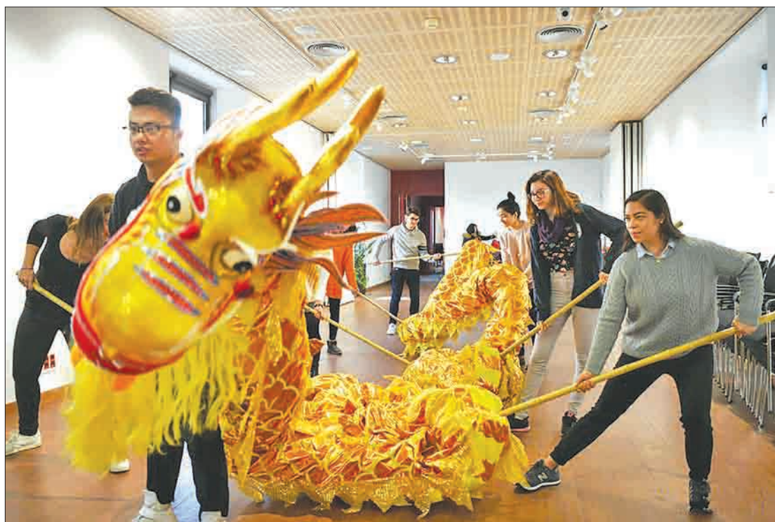
Students prepare for dragon dance at the Confucius Institute in Barcelona, Spain, on 15 February 2018. In recent years, a surge in the learning of the Chinese language has been observed around the world. Confucius institutes and classrooms worldwide play an undeniable role in the process of bringing the Chinese language and culture closer to the international community.