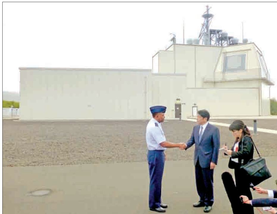
Japanese Defense Minister Itsunori Onodera (2nd from L) visits a test complex of the land-based Aegis Ashore missile defense system on the Hawaiian island of Kauai on 10 January 2018, ahead of the planned introduction of the US-developed system to Japan.

"It is extremely important that North Korea abandon all of its weapons of mass destructions