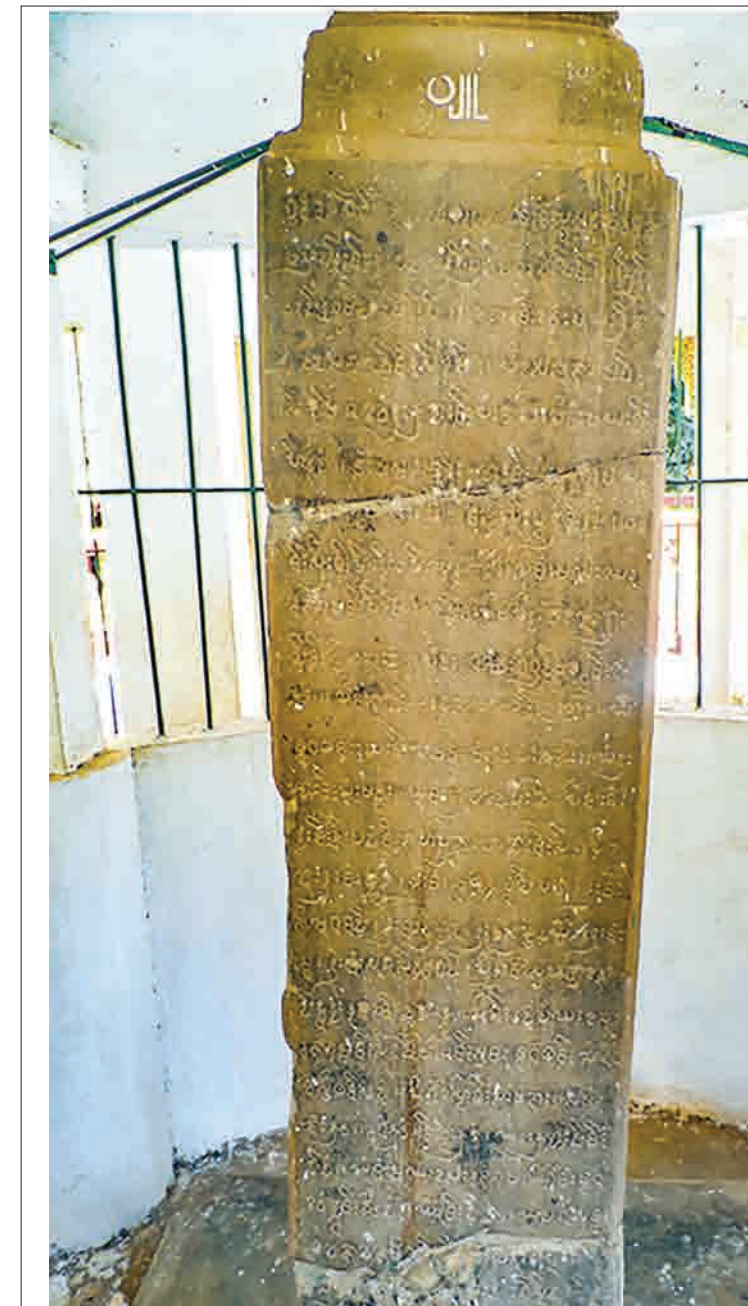
The Myazedi Stone Inscription.