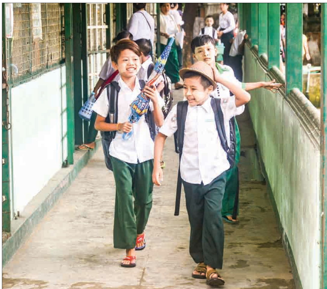
School children seen with their cheerful faces in a school.

Schools in Nay Pyi Taw have seen higher enrolment rate this year.—MNA