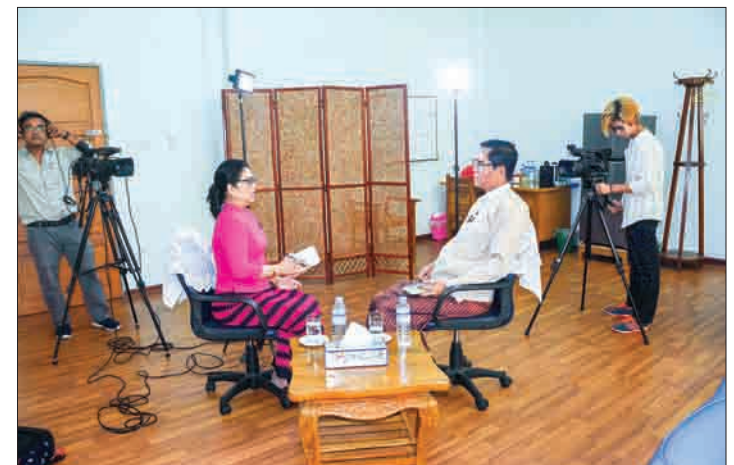
Deputy Minister for Information U Aung Hla Tun gives the exclusive interview to Yangon Bureau Chief of VOA, Daw Khin Soe Win in Nay Pyi Taw yesterday.

The Deputy Minister answered VOA's questions concerning current Myanmar media landscape at the interview.—Myanmar News Agency