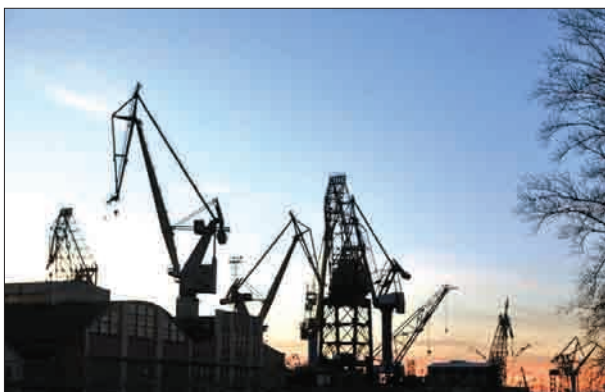
After the repairs with the upgrade are over, "the service life of the Sindhukesari will be extended by 10 years to 35 years," the source said.

The Sindhukesari is undergoing medium repairs with the upgrade in Russia for the second time now. Another Indian submarine of this class, the Sindhuraj, is also cur-