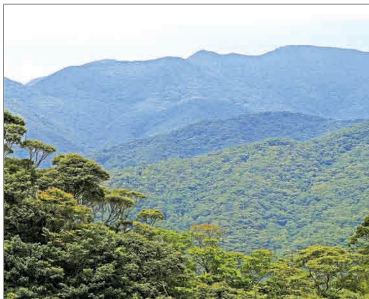
Photo taken 28 April 2018, shows the forest-covered Mt. Yuwan on Amami-Oshima Island, southern Japan.

chief of a nonprofit organization offering eco-tours in the northern Okinawa area, called the withdrawal "disappointing," but added she has seen improving conservation activities.