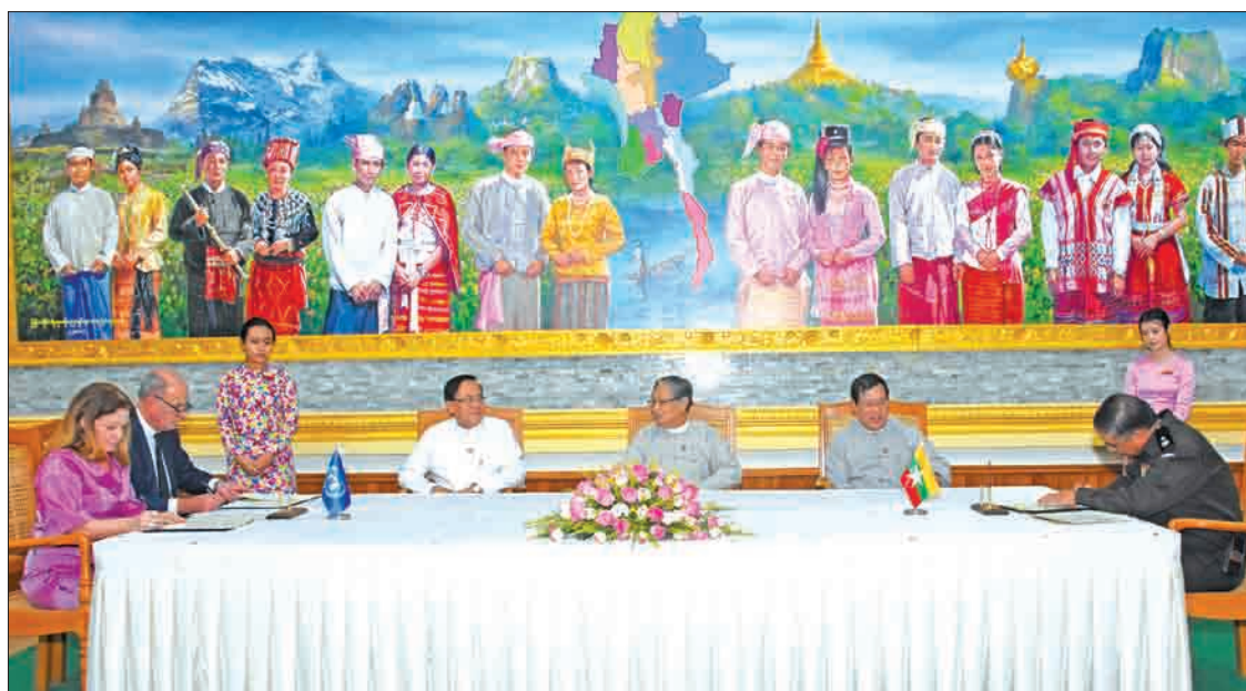
A ceremony to initial MoU on assistance for repatriation process of displaced persons from Rakhine State between Myanmar and UNDP and UNHCR in progress in Nay Pyi Taw on 31 May, 2018.

The Government of Myanmar, UNDP and UNHCR are expected to sign the MoU soon. — Myanmar News Agency ■