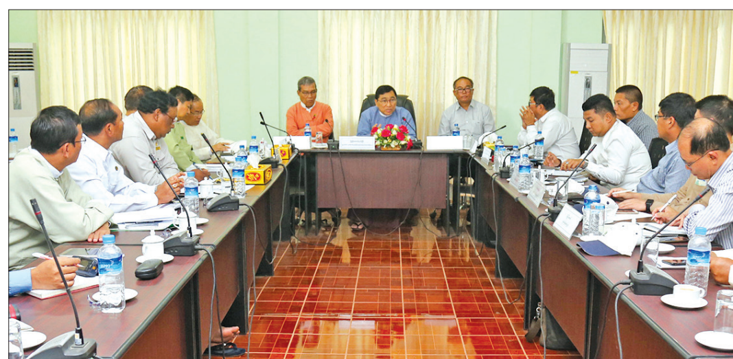
Union Minister Dr. Win Myat Aye addresses the meeting of construction and infrastructure task force in Sittway yesterday.

"I can understand that the working hours are few because it depends on the weather conditions. In doing so, scrutiny and review are of great importance to carry out the tasks. There are some obstacles in the process of joining UEHRD projects. As for the UEHRD committee, and Committee for the Implementation of Peace and Development,