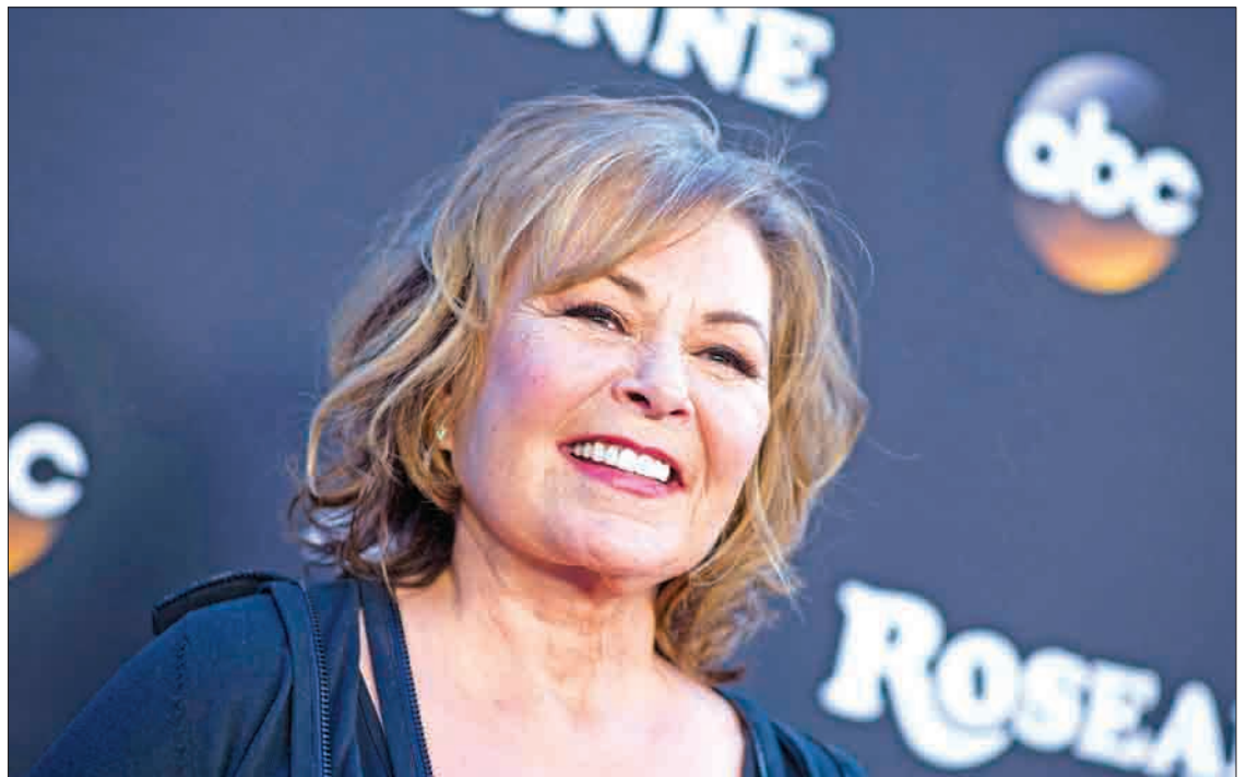
Roseanne Barr has had her show taken off air and been dropped by her talent agency amid outrage over a racist tweet.

Barr, a vocal supporter of President Donald Trump who has previously used Twitter to voice hard-right and conspiracy theorist views, has been dropped by her talent agency ICM amid