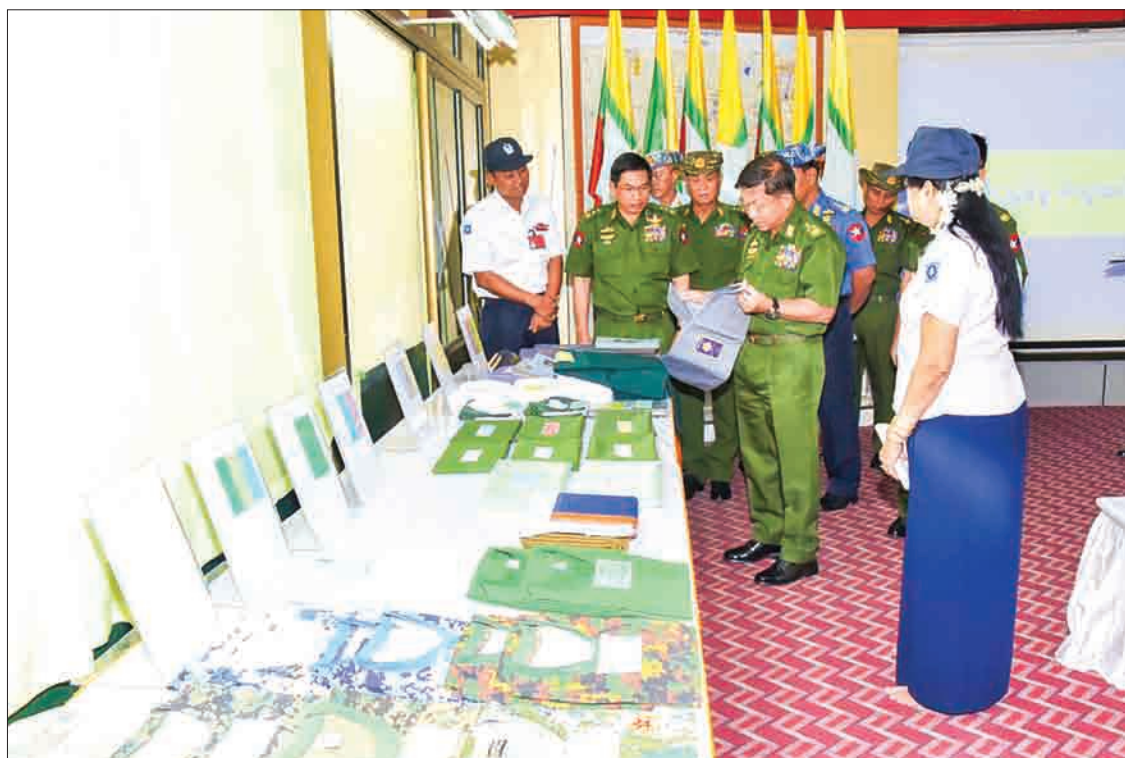
Senior General Min Aung Hlaing observes Tatmadaw uniforms and clothes produced by Tatmadaw textile and garment factory in Meiktila yesterday.

In the afternoon, the senior general and party visited the Tatmadaw waterproof sheet factory and shoe factory in Hlinetet and inspected the products made by the factory.—MNA