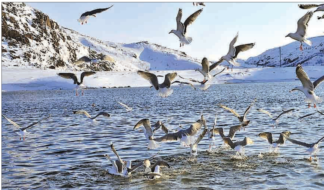
Scientists are also paying close attention to Gulfstream, as it influences climate in the Arctic's western parts.

This discovery was made as the scientists had installed marks on gulls. Formerly, biologists were sure about two separate populations of those birds in the western Arctic and in the Far East, but the scientists saw that the two groups' representatives "travel to see each other." As yet, however, they cannot explain what makes the birds make those long trips.—Tass ■