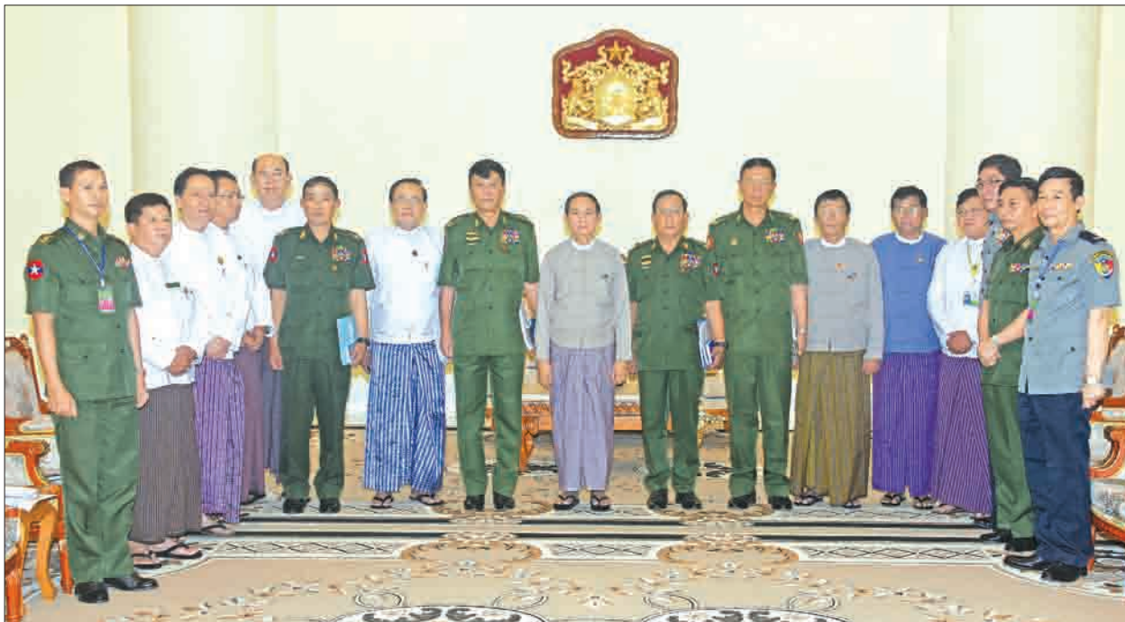
President U Win Myint, centre, poses with the chairman and members of Central Committee for Drug Abuse Control at the Presidential Palace in Nay Pyi Taw yesterday.