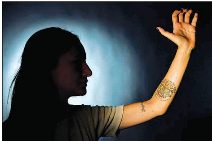
One of the victims who was wounded at Paris' Bataclan concert hall during the November 2015 attacks shows her tattoo bearing the date 13-11-2015.

But their documentary mini-series, "Attack on Paris" -- which starts on Netflix on Friday -- tells the story through the eyes of those at the heart