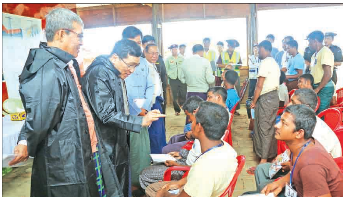
Union Minister Dr Win Myat Aye greets returnees during granting National Verification Cards (NVC) to them at the Hla Pho Khaung Transit Centre in Maungta Township yesterday.