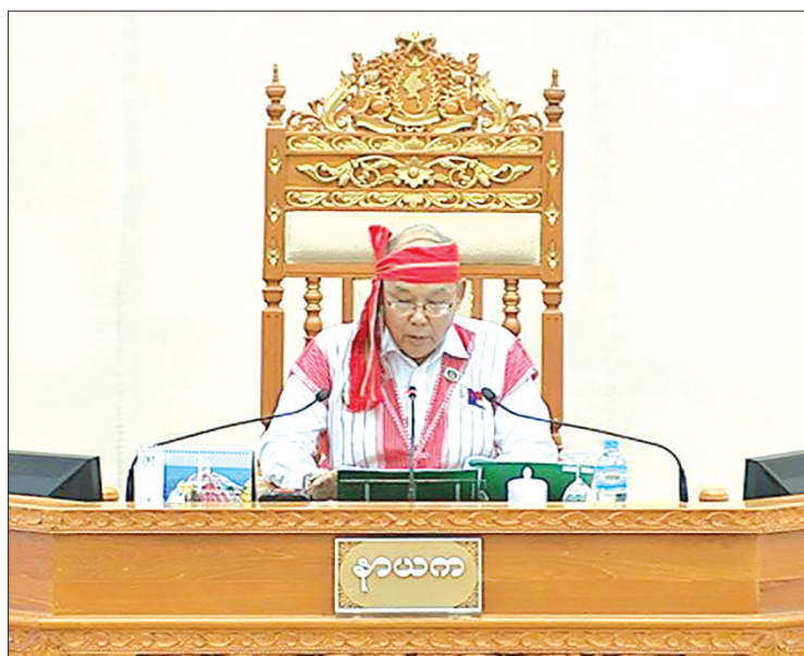
Pyidaungsu Hluttaw Speaker Mahn Win Khaing Than.

The report said the committee was formed to coordinate with partner organisations for the Hluttaw's development. The committee is systematical-