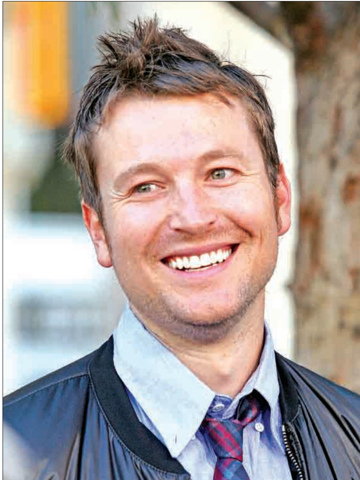
Leigh Whannell, the writer of the best “Saw” movies and the entire “Insidious” franchise, whose cyborg thriller “Upgrade” hits US theaters on Friday.

netic organism” — is a person with restored or enhanced mechanical or electrical body parts, typically giving them abilities beyond those of normal humans.