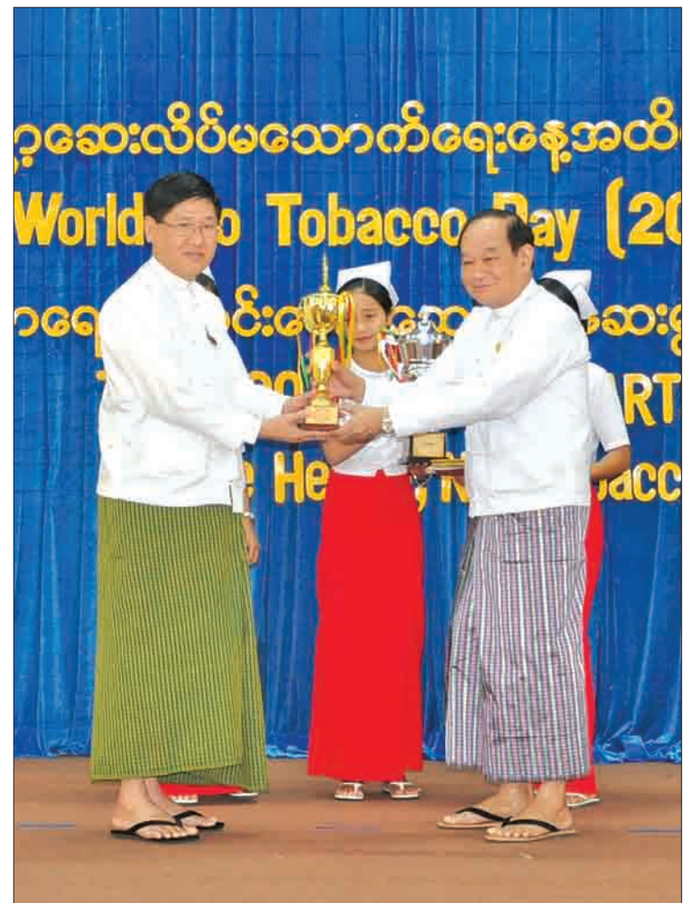
Union Minister Dr. Myint Htwe honours those who have made greatest progress toward a tobacco-free campus at universities.

Afterwards, Dr. Myint Htwe and guests toured the booths displayed for World No-Tobacco Day.—Myanmar News Agency ■