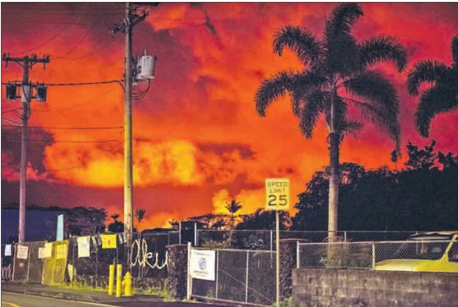
Around 2,000 residents have already abandoned their homes as a result of Kilauea’s eruption, which has destroyed 71 houses so far.

Authorities had earlier advised that lava flow from Fissure 8 had