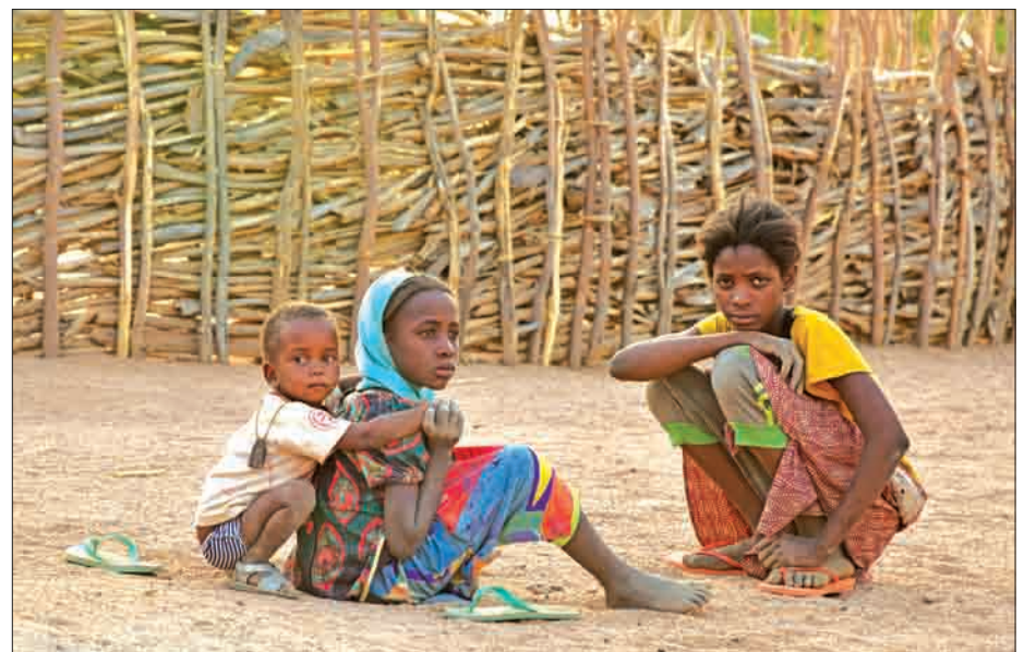
Niger is the country in which children face the biggest threats from conflict, poverty and discrimination, Save the Children says.

By contrast, Singapore and Slovenia were classed as the countries with the lowest incidence of such problems. “More than half the world's children start their lives held back because they are a girl, because they are poor or because they are grow-