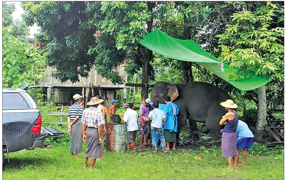
An Elephant gets medical free treatment from mobile elephant clinic team.

"One of the big challenges for the team is looking for private elephant owners. Next, the team lacks experienced veterinary surgeons. We also need sustainable funding for the mobile elephant clinics. We have only one vehicle for private enterprise elephants. In this case, when we are providing treatment in the southern part of Myanmar, we cannot go to the northern part of My-