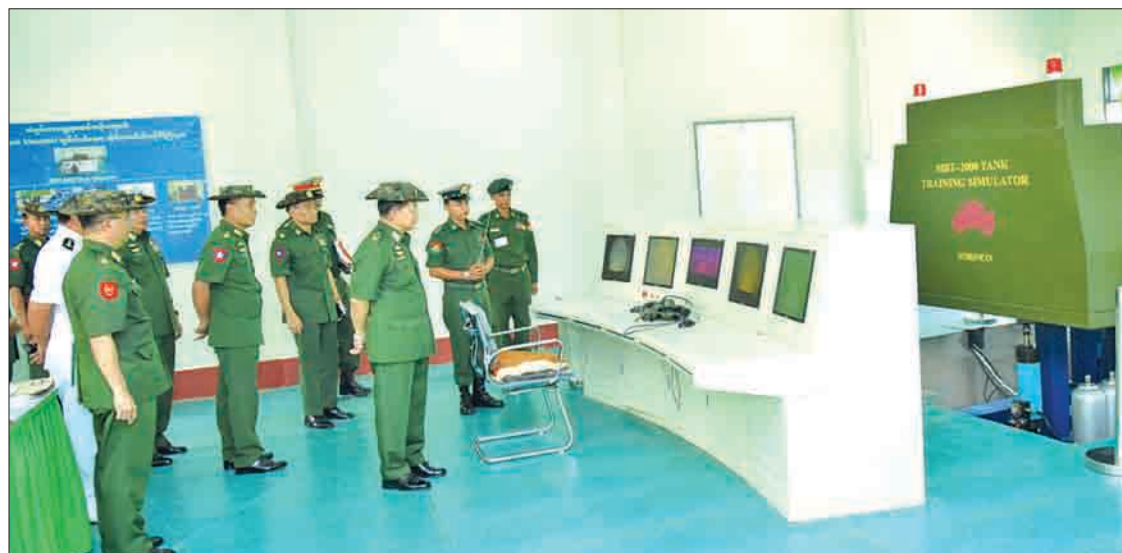
Senior General Min Aung Hlaing visits Armoured Training School in Kyaukse.