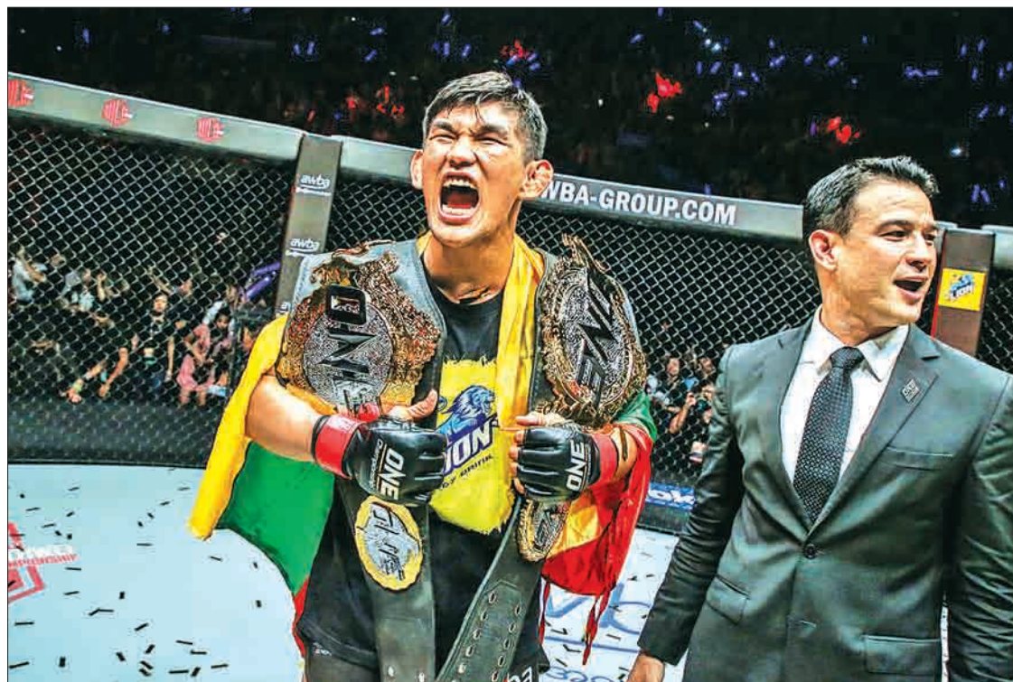
One Championship's middleweight and light-heavyweight world champion, Aung La N Sang.

"I have studied his strengths and weakness, which I can use to my advantage. My team and I have come up with a sound game plan to capitalize on his unique style. I feel no pressure. I'm just excited to get in there and defend my title. This is going to be a huge bout and I am training for