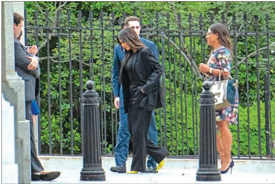
Kim Kardashian entered the grounds of 1600 Pennsylvania Avenue wearing a black suit and canary yellow stilettos.

with fellow TV personality, President Donald Trump — formerly of “The Ap-