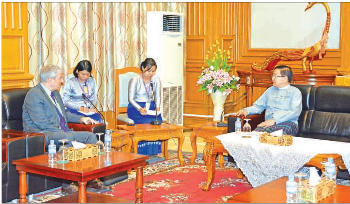
Pyithu Hluttaw Speaker U T Khun Myat meets with Israeli Ambassador Mr. Daniel Zonshine in Nay Pyi Taw yesterday.