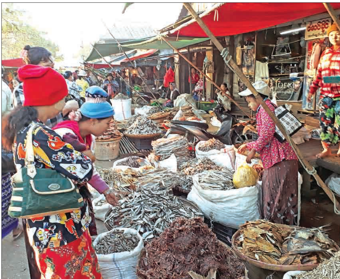
Woman selling dried fish at the market.

Myanmar conducts trade with Asian countries, ASEAN member states, island nations, Middle East countries, European and African states, and some other western countries mainly through shipping routes. It is seeking new trade opportunities to boost the country's production of valued-added products to penetrate global markets.—Shwe Khine ■