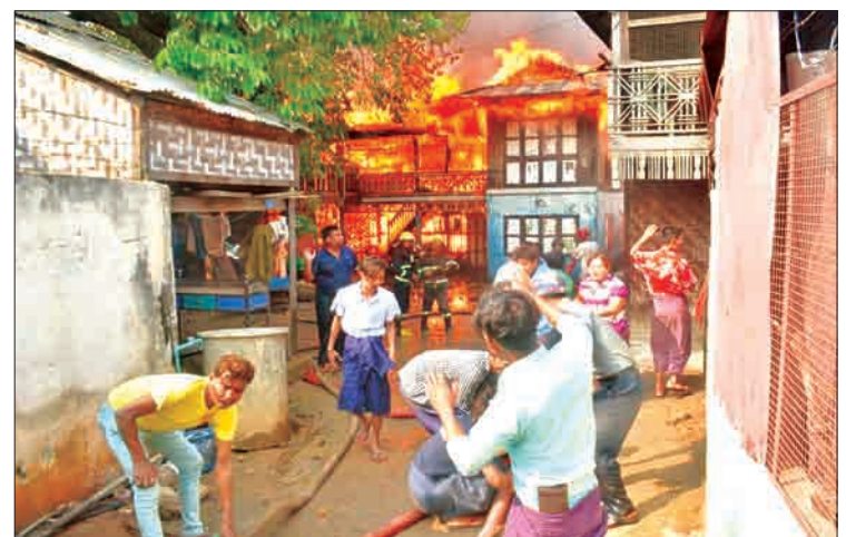
House engulfed in flames with local people working to extinguish a fire.

Thousands of firefighters from the department are offering fire services to the region through 621 fire engines in the Sagaing Region.—Win Oo (Zeyataing)■