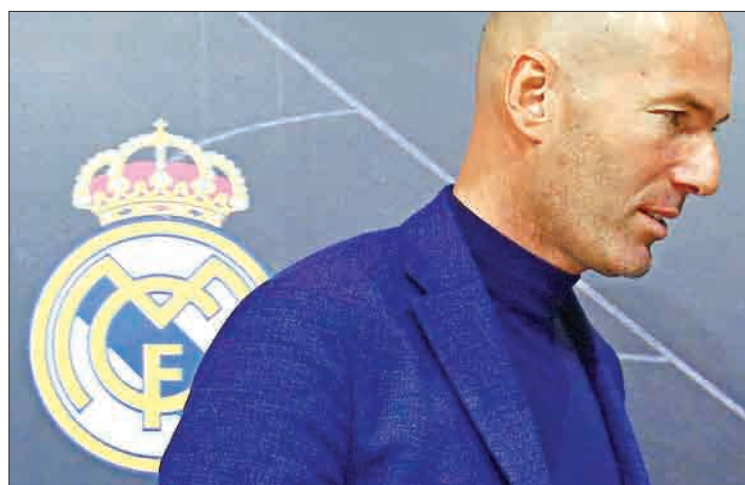
Zinedine Zidane is the only coach in history to win three Champions Leagues in a row.

MADRID — Real Madrid coach Zinedine Zidane said Thursday he was leaving the Spanish giants in a surprise move announced just days after winning the Champions League for the third year in a row.