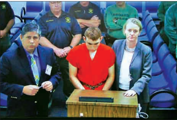
Nikolas Cruz (C) faces the death penalty if he is convicted of first-degree murder.

“My name is Nik, and I’m going to be the next school shooter of 2018,” said the 19-year-old, in clips apparently in part filmed on 14 February, the day of the shooting, which killed 17 students and staff members at Marjory Stoneman Douglas High School. “My goal is at least 20 people,” he added, speaking in a calm, nonchalant voice in an outdoor setting. “You’re all going