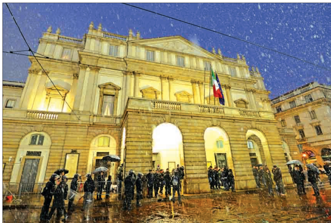
La Scala's 2018-19 season will include Woody Allen's version of Puccini's comic opera "Gianni Schicci" set in 1930s New York.

"Let's not give that too much weight," La Scala di-