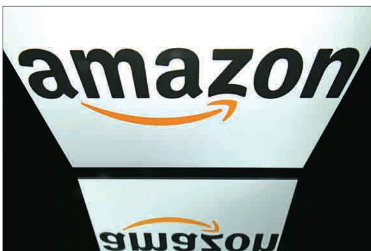
Amazon said Australian shoppers wanting to use its global platforms will instead be directed to its smaller Australian site, which offers much less for sale.

“While we regret any inconvenience this may cause customers, we have had to assess the workability of the legislation as a global business with multiple international sites,” it said in a