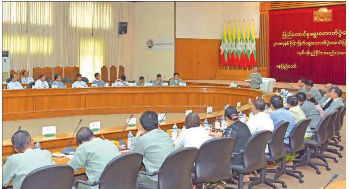
UEC Chairman U Hla Thein delivers the opening speech at the work coordination meeting with the ministries concerned in Nay Pyi Taw yesterday.

The meeting came to an end with concluding remarks made by the UEC chairman.— Myanmar News Agency ■