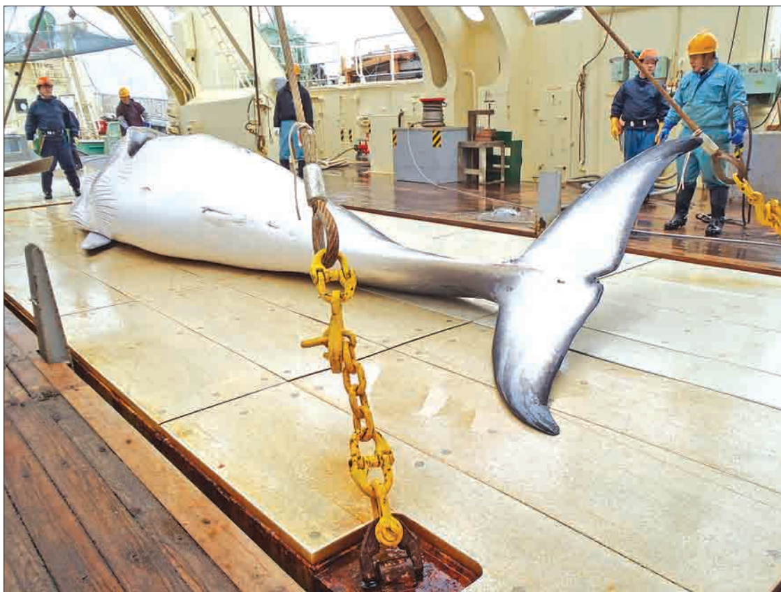
Japan’s four-month expedition in the Antarctic ended in March after the fleet killed 333 minke whales, according to a report submitted by Japanese authorities to the International Whaling Commission last month.