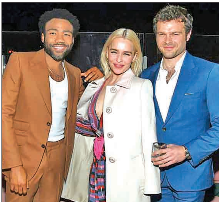
Donald Glover, Emilia Clarke and Alden Ehrenreich (left to right) at the recent New York premiere of ‘Solo: A Star Wars Story,’ which has opened in North America with ticket sales far below expectations.

In fourth, with $13.1 million in ticket sales, was a movie featuring no superheroes or interplanetary battles, and with a sedate sounding title — “Book Club” —