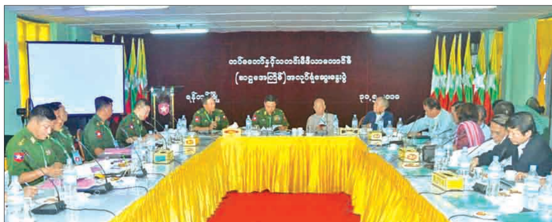
Attendees seen at the Tatmadaw and Myanmar Press Council workshop in Yangon.

The MPC vice-chairmen delivered separate keynote