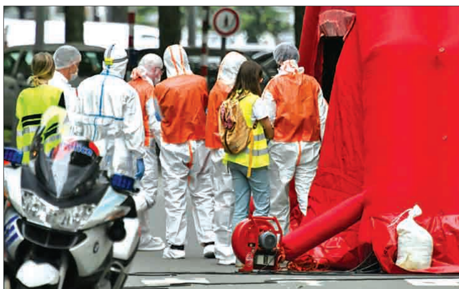
Forensic police worked at the scene of the in shooting in Liege, Belgium, where a gunman shot dead two policewomen with their own weapons before killing a bystander.

Prosecutors said this assessment was based on a number of "first elements" from the investigation, including the "modus operandi" of attacking police