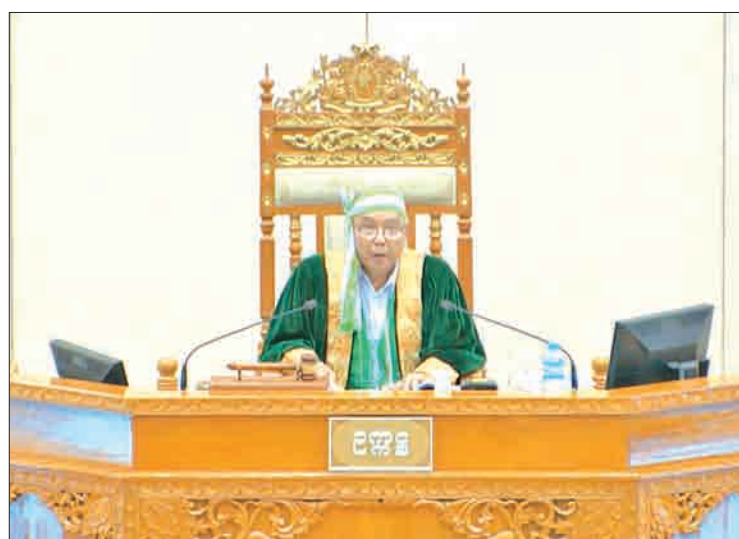
Amyotha Hluttaw Speaker Mahn Win Khaing Than.

The deputy minister replied that certificates to use the farmland were issued for all levels of Administrative Body of the Farmland, in accordance with section 3 to 14 of Chapter (II) under the 2012 Farmland Rule. He said it would take considerable time, staff and finance to investigate every form-7 issued across the country. Therefore, the forms are usually only scrutinised when their illegal use is evident, or a complaint or suspicion is sub-