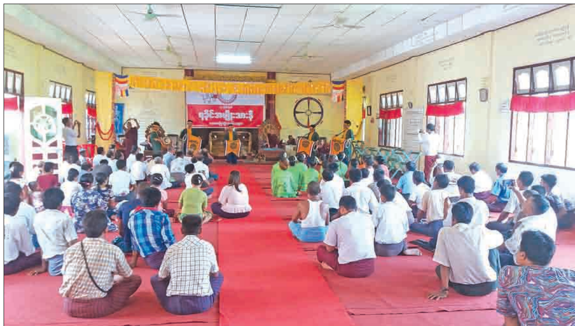
Local people attend the ceremony to celebrate 5th Rakhine National Day in Maungta.

Local residents across Sittway, Mrauk U, Pauktaw, and Maungta townships in Rakhine State celebrated the 5th Rakhine National Day yesterday.