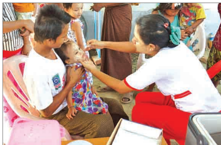
A nurse gives the polio vaccine to a child.

Moreover, nurses are receiving low pay and facing unequal opportunities, discriminatory treatment and delays in job promotions. Therefore, most of them have left their jobs, he added. The Myanmar Nurse and Midwife Council (MNMC) only issues licence