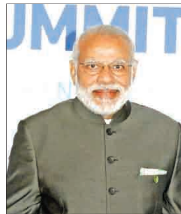
Indian Prime Minister Narendra Modi.

Amid China’s rising presence in the South China Sea and East China Sea, and the Indian Ocean, some political analysts view the Indo-Pacific concept an attempt to move the focus away from China to emphasize India