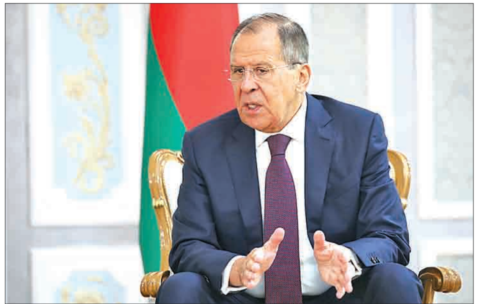
Russian Foreign Minister Sergey Lavrov.

Foreign Ministry Spokeswoman Maria Zakharova earlier reported that the Russian side scheduled a number of contacts on the settlement on the Korean Peninsula. During his visit to Moscow in April North Korean Foreign Minister Ri Yong-ho invited Lavrov to visit Pyongyang, and the Russian minister accepted the invitation then.—Tass ■