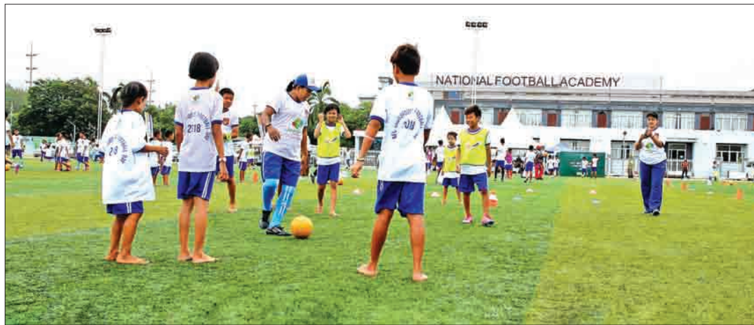
A trainer shows football skills to children at the ceremony of 2018 AFC Grassroots Football Day in Yangon yesterday.