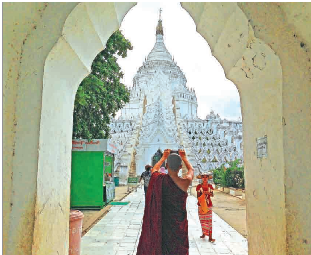
A monk takes a photo at Mya Thein Tan Pagoda located on the northern side of Mingun and on the western bank of the Ayeyawady River in Sagaing Region.

The Khamti site is a little known tourist site because of