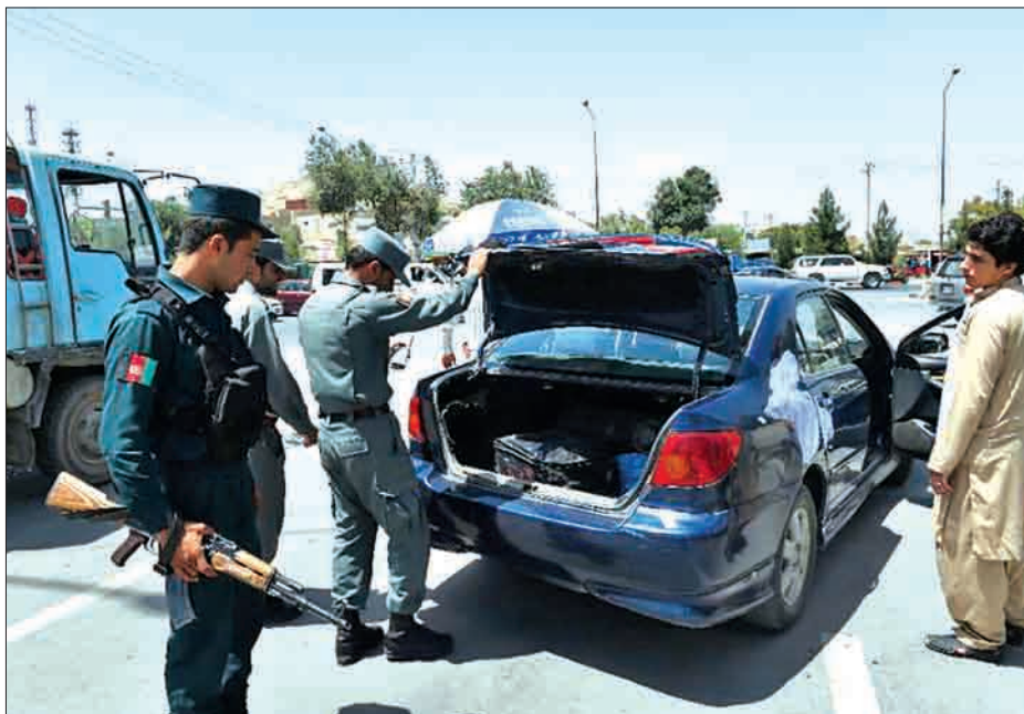
A checkpoint in Kabul: the Taliban have vowed to target the city despite tight security.

when I heard a blast followed by gunfire. We were told to stay inside our offices as the compound was attacked,” one ministry employee told AFP earlier.