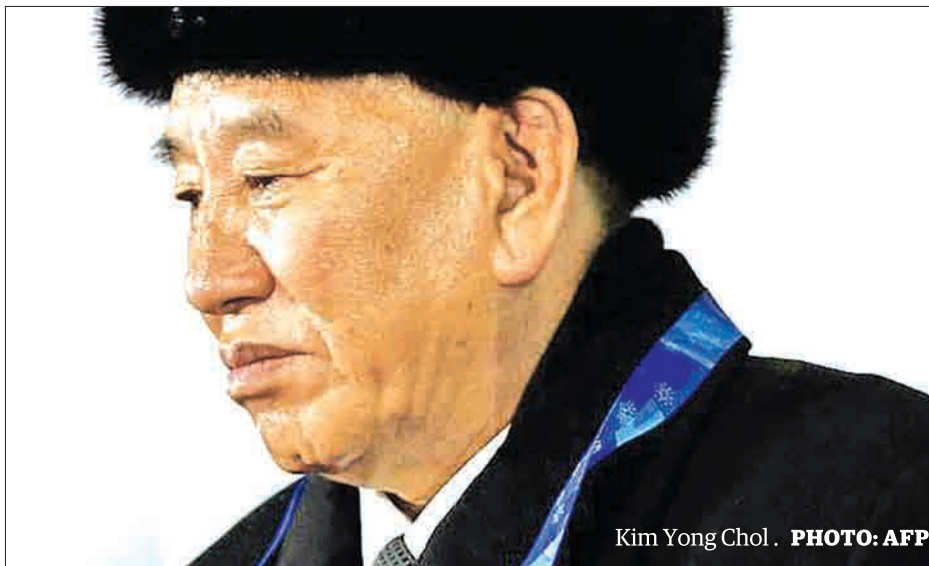
Kim Yong Chol.

Kim Yong Chol, described as Kim Jong Un's right-hand man, left Beijing on Wednesday bound for the North's "imperialist enemy" where he will meet US Secretary of State Mike Pompeo, and possibly Donald Trump. The man blamed by South Korea for the 2010 sinking of a warship that killed 46 sailors will become the most senior North Korean to step on US soil in nearly two decades. The meeting is the latest in a flurry of diplomacy as the two sides lay the