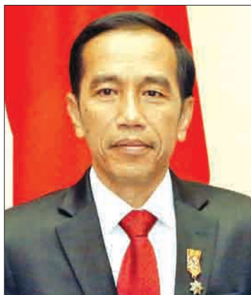
Indonesian President Joko “Jokowi” Widodo

having been promoted by Japanese Prime Minister Shinzo Abe since 2007 when he initiated a quadrilateral security dialogue between Australia, India, Japan and the United States, has grown in usage over the past few years.