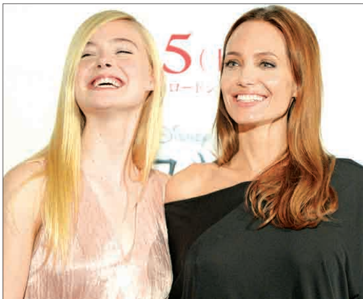
US actresses Angelina Jolie (R) and Elle Fanning (L).

acclaimed British stage and screen actor Robert Lindsay (“Wimbledon”) would be among the newcomers, while Sam Riley, Imelda Staunton, Juno Temple and Lesley Manville return from the original movie.