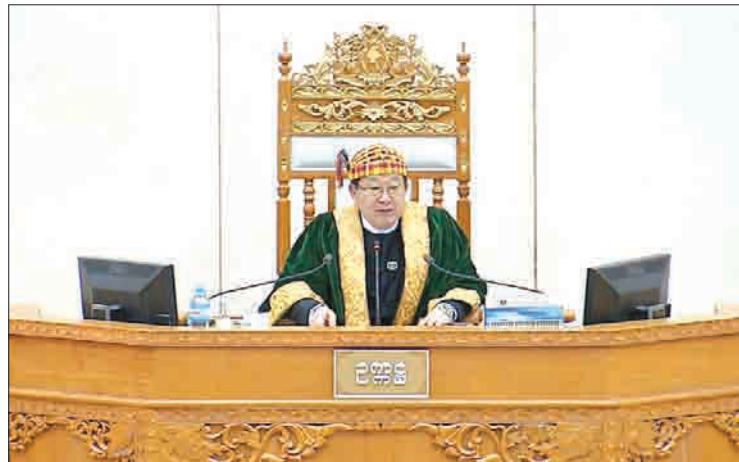
Pyithu Hluttaw Speaker U T Khun Myat.

A Pyithu Hluttaw representative from Pyawbwe constituency, U Thaung Aye, said, "A motion has been made to give enough protection measures for the stability, rule of law, sovereignty and perpetuation of the State, and for violent attacks not to occur,