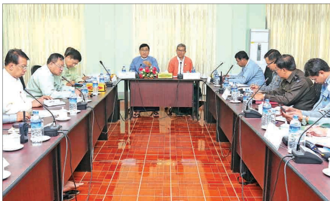
Union Minister Dr Win Myat Aye and Rakhine State Chief Minister U Nyi Pu attend the meeting for the resettlement of displaced people who returned from Bangladesh.

turnees, those who have a home in Myanmar will be handed over to their families, he added.