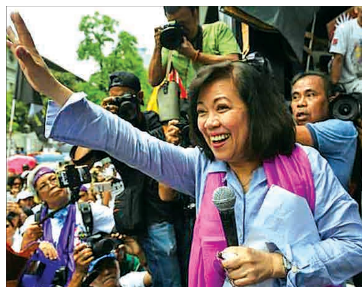
Sereno waves to supporters outside the supreme court building after judges voted on 11 May to oust her.

Other Duterte critics have also been ousted, punished or threatened, including Senator Leila de Lima who has been jailed, the Commission on Human Rights and an anti-corruption prosecutor who investigated al-