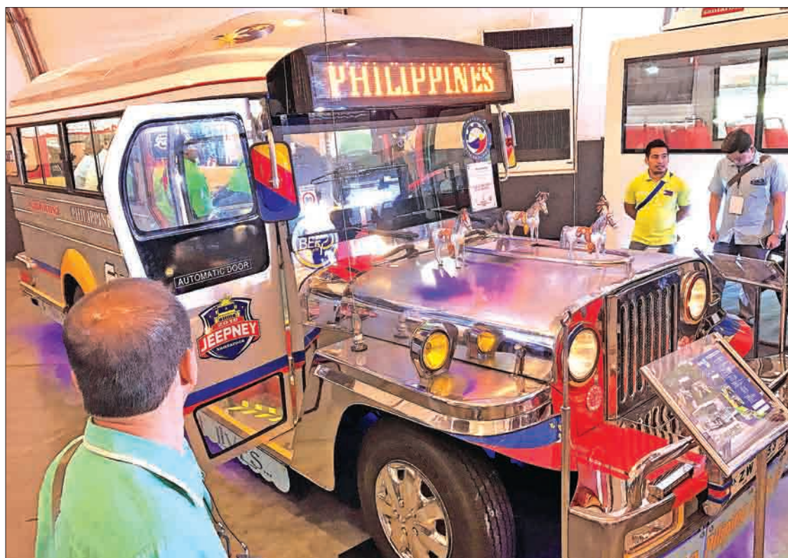
Photo taken on 3 April, 2018 in Manila shows a prototype of a new jeepney which has a door on the side of the vehicle in compliance with the government’s Public Utility Vehicle Modernization Programme. Traditional jeepneys have the door for passengers at the rear.