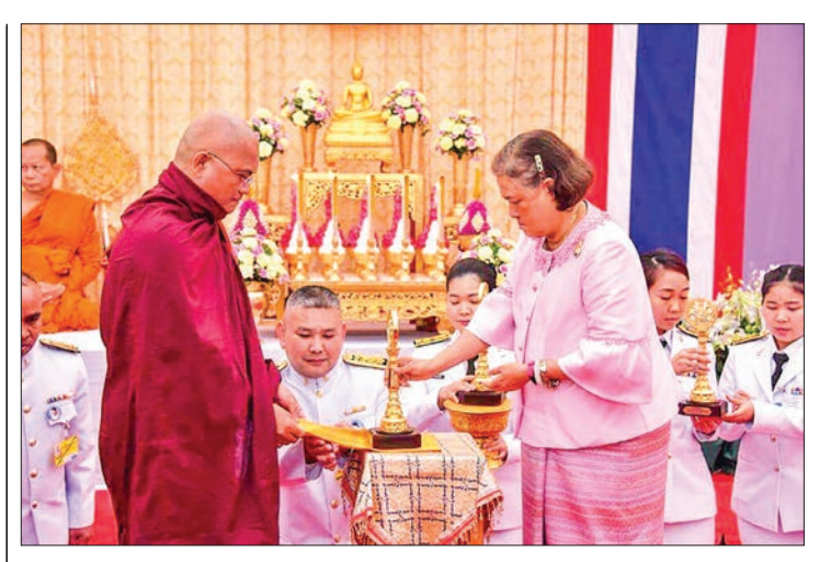
Princess Maha Chakri Sirindhorn conferring Dhammajakra religious title, on Myanmar Sayadaw.