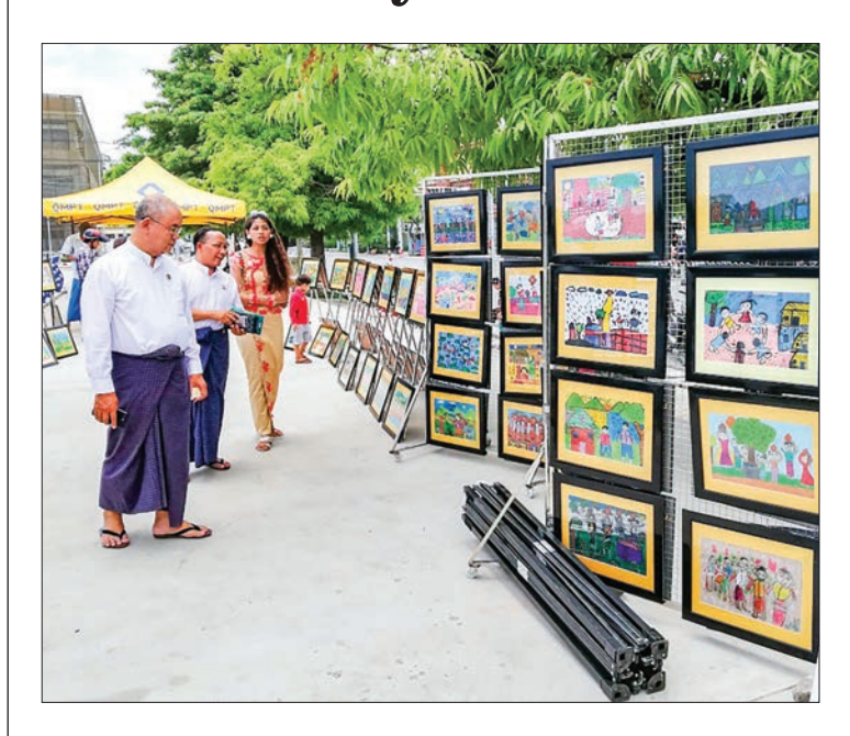
People visit the drawing expo in Mandalay.

CHILDREN displayed 165 showed paintings as a show of their art skills at a drawing expo in Mandalay on Saturday.