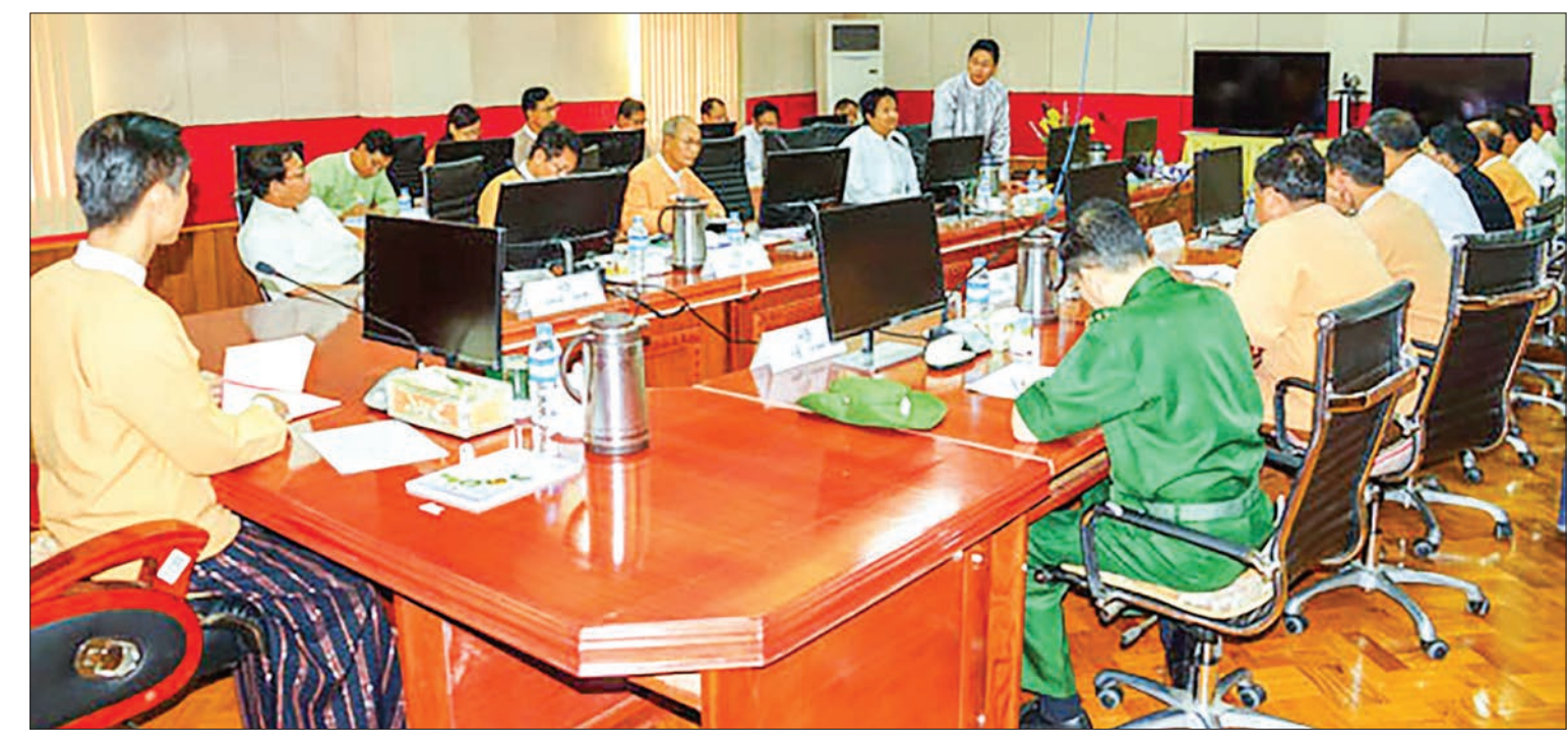
A meeting between investors and Kayah State cabinet in progress in Loikaw.

their interest in the production of marbles of international standards. They also discussed prospects for hotels and mining businesses in the state.