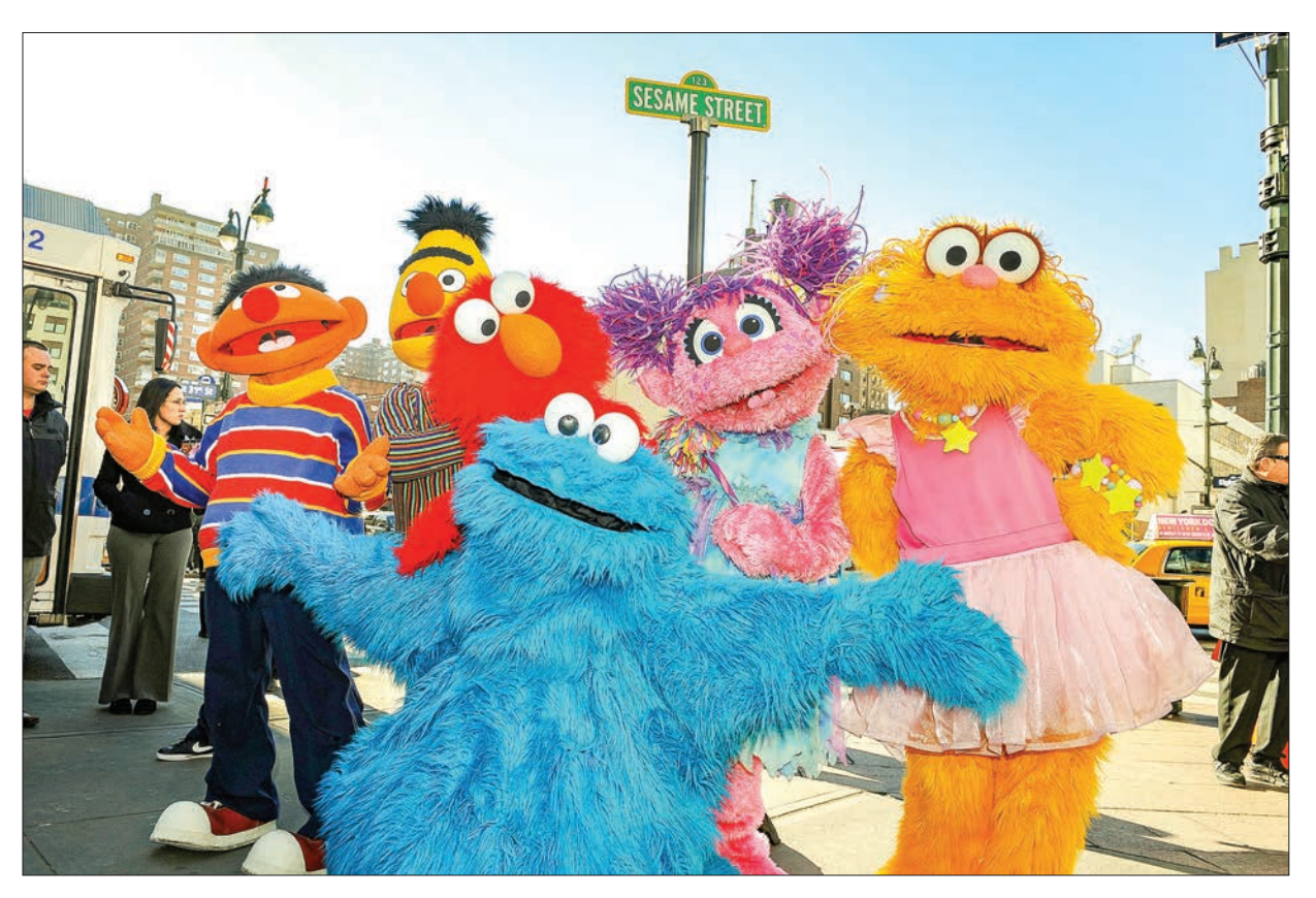
The creators behind "Sesame Street" are suing over a marketing campaign for a new bawdy puppet movie, on the grounds that it's confusing viewers into believing the film is connected to the beloved show for kids.