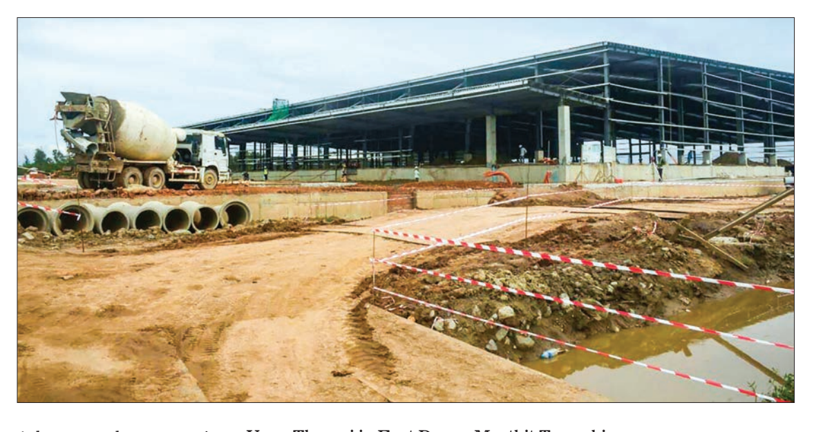
A dry port under construction at Ywar Thargyi in East Dagon Myothit Township.

After the completion of that project at the end of the year, there will be convenient in transportation by rail from Thilawa to Ywar Thargyi to Myitnge, it is learnt. —Myanmar News Agency ■