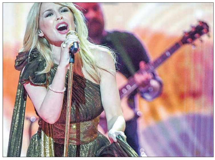
Pint-sized Australian singer Kylie Minogue is turning 50.

appeared in the television series "Skyways", but is best known for her star turn as Charlene in long-running soap opera "Neighbours" from 1986 to 1988.