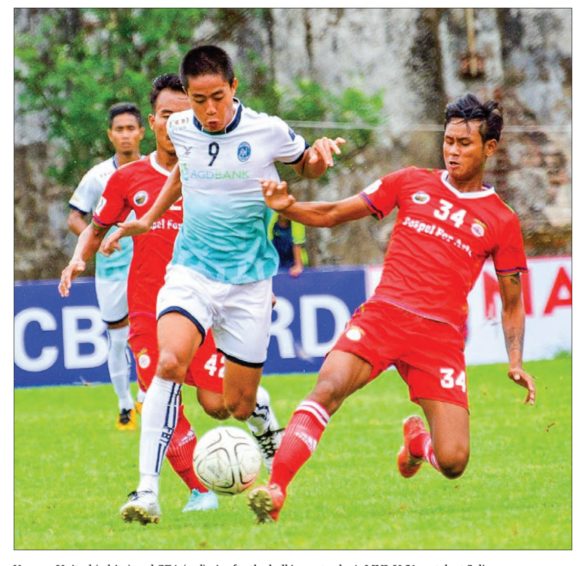
Yangon United (white) and GFA (red) vies for the ball in yesterday's MNL U-21 match at Salin Stadium.

The first half ended with both teams having scored a goal apiece. Yangon United were better in the second half.