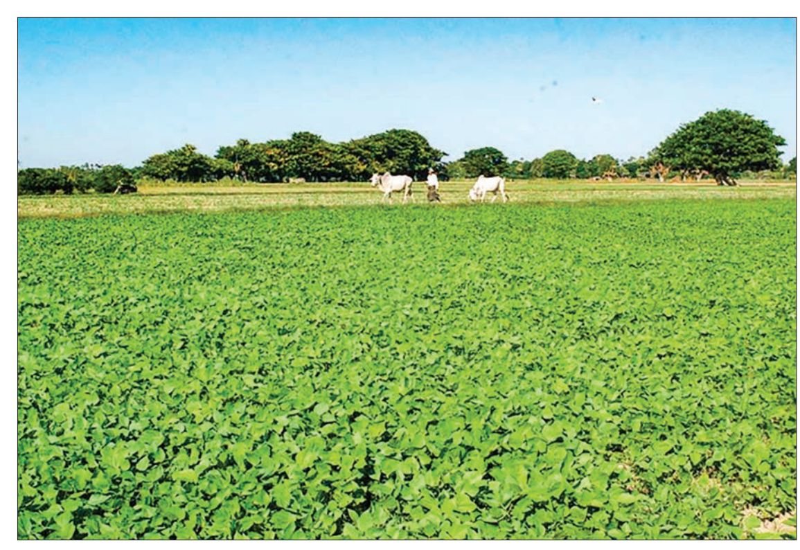
Sagaing Region will put over 1 million acre under beans.

The plan targets to cultivate 133,588 acres of pigeon peas, 7,242 acres of mung beans and 37,611 acres of green grams in Monywa District; 120,011 acres of pigeon peas, 185 acres of mung beans and 44,415 acres of green grams in Yinmabin District; 155,396 acres of pigeon peas, 240 acres of mung beans and 78,727 acres of green grams