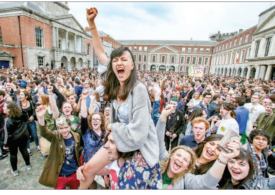
Ireland voted by a landslide to ditch its strict abortion laws, with eyes now on British-ruled Northern Ireland.

on the historic vote, while the government promised to allow abortion in the first 12 weeks of pregnancy and between 12 and 24 weeks in exceptional circumstances.