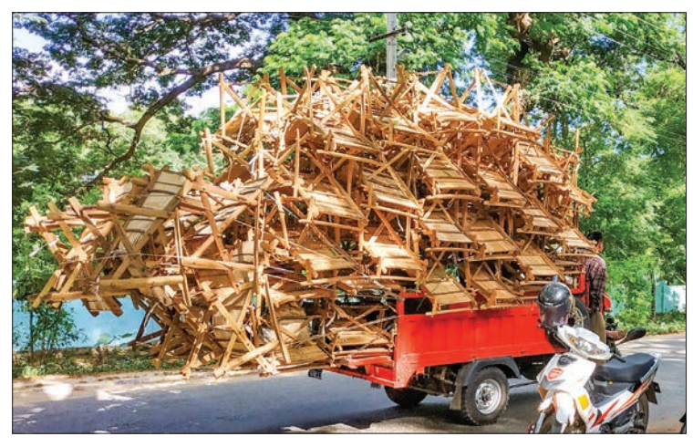
Chairs made with toddy-palm are seen in the car.

The villagers collected the branches of toddy palm in summer and make the chair in the raining season. They sell a chair with Ks 3,500 on the tricycles driving in the towns of Myothit, Natmauk and Taungdwingyi.