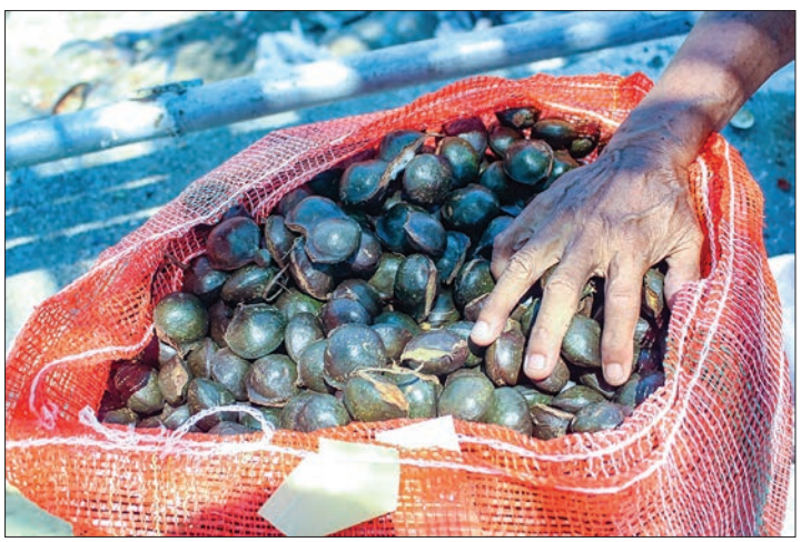
Jengkol beans.

Last year, growers reaped a handsome profit from the sale of the same products despite a decrease in production. The majority of jengkol beans were sent to Yangon market through Myeik.—Myint Oo (Myeik)