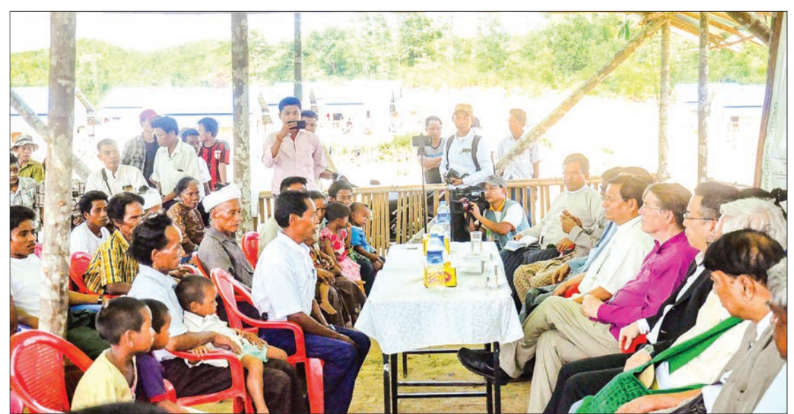
Members of the Interfaith delegation meet locals at the Mro ethnic village.