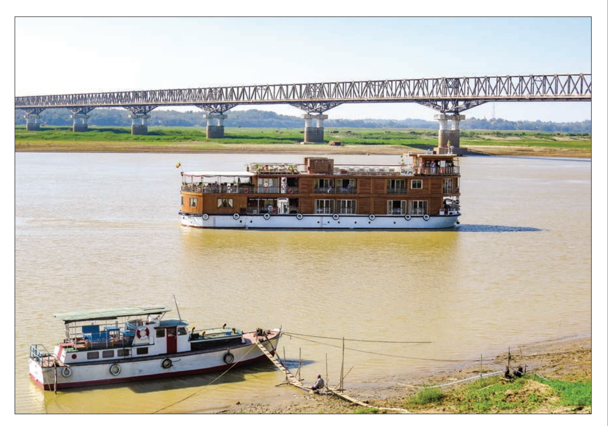
The Ayeyawady bridge (Magway).

ALTHOUGH a total of 20,000 tourists visit Myanmar annually, few tourists stay overnight in the Magway Region, according to the Ministry of Hotels and Tourism.