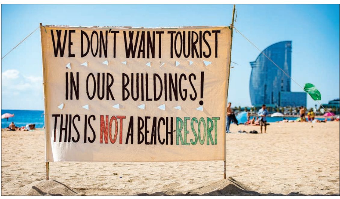
No escape: In Barcelona, protesters have hit the beaches to make their message heard.

Other cities in Spain, the world's second most visited country after France according to the UN World Tourism Organization, are also facing a surge in the number of sharing economy short-term rentals, threatening