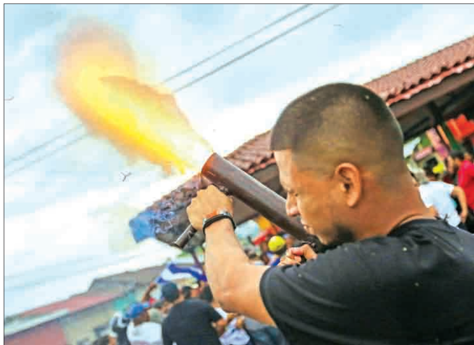
A Nicaraguan university student opposed to President Daniel Ortega fires a hand-held mortar in a neighbourhood in Masaya, a city that was a cradle of the Sandinista movement but is now a hotbed of anti-government resistance.