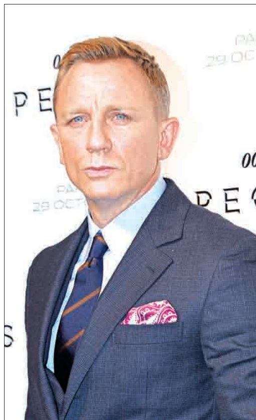
This will be the fifth time Craig plays James Bond.

The film is expected to be Craig's last time playing the spy, having previously starred in "Casino Royale", "Quantum of Solace", "Skyfall" and "Spectre".