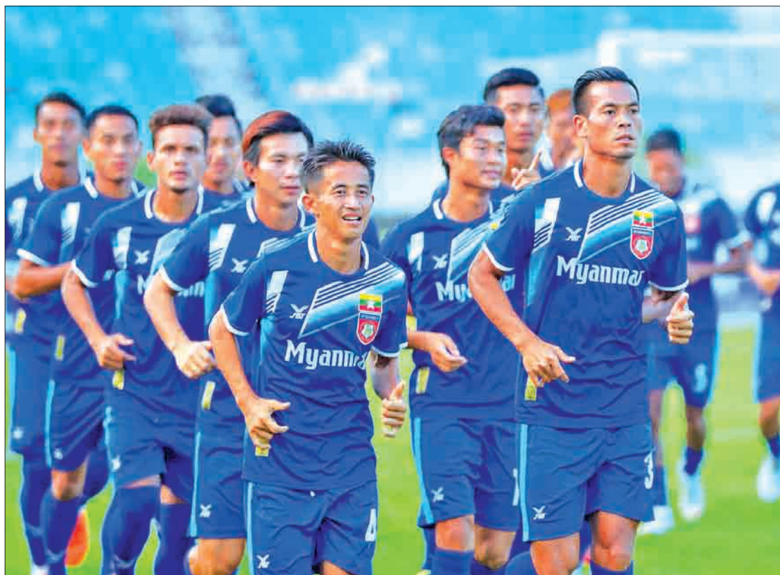
Myanmar national football squad seen during training.