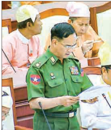
Deputy Minister for Home Affairs Maj-Gen Aung Soe.

He said the Rakhine State Peace and Development Council had leased 20 acres, along with 10 acres of grazing land from the Taungpaukgyi mountain range to state departments and the state