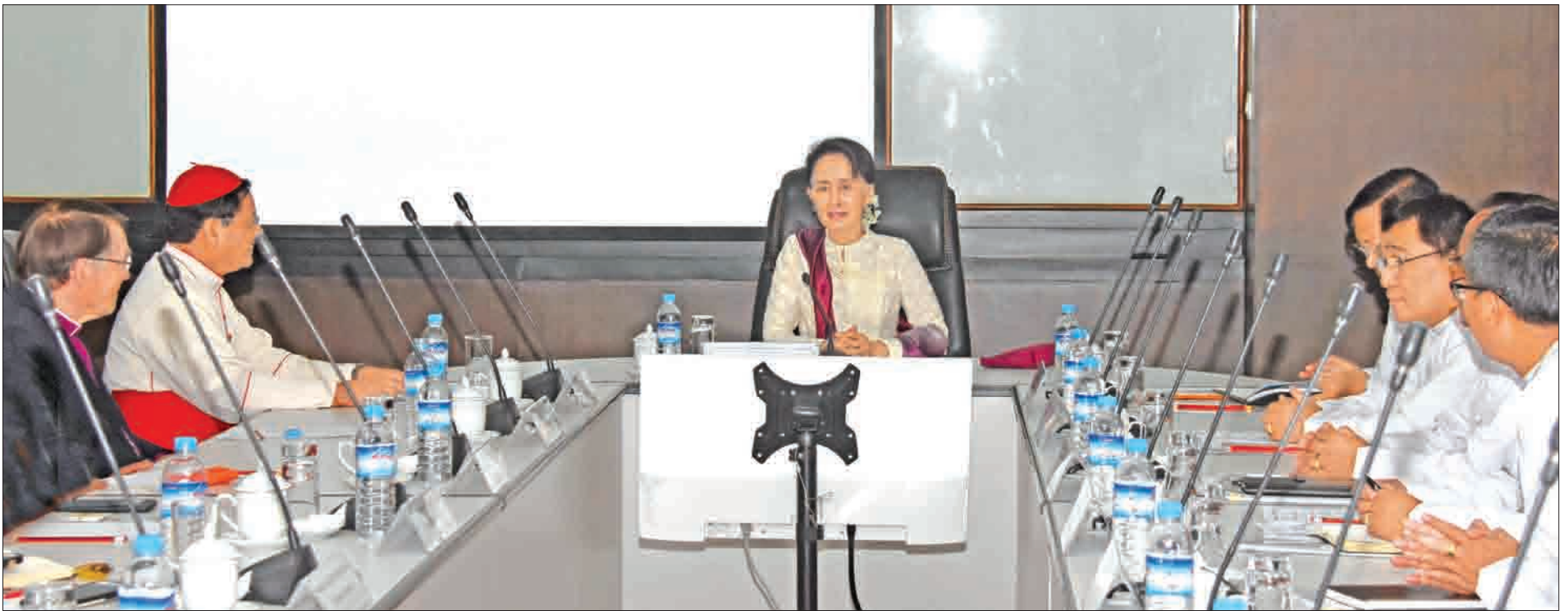
State Counsellor Daw Aung San Suu Kyi meets with the interfaith delegation at the Ministry of Foreign Affairs in Nay Pyi Taw yesterday.