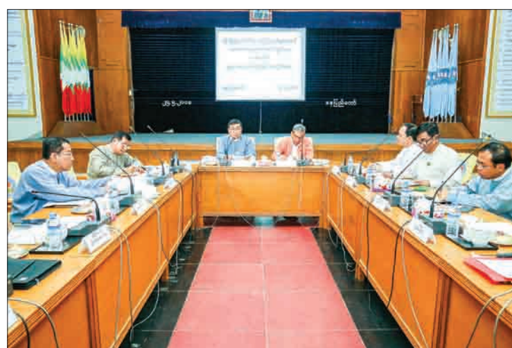
The committee formed to implement the recommendations on Rakhine State holds the work coordination meeting.

At the meeting, U Nyi Pu, Joint Chairman and Chief Minister of Rakhine State, urged departments concerned to make more efforts for implementing the recommendations to bring better results, while the Rakhine State Government was working hard to bring about harmony between the different communities in the state.—MNA