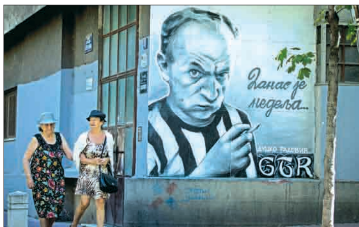
Graffiti artists from the Grobarski Trash Romanizam (GTR) group depict famous Serbian poet and Partizan soccer club fan Dusko Radovic on a Belgrade wall.