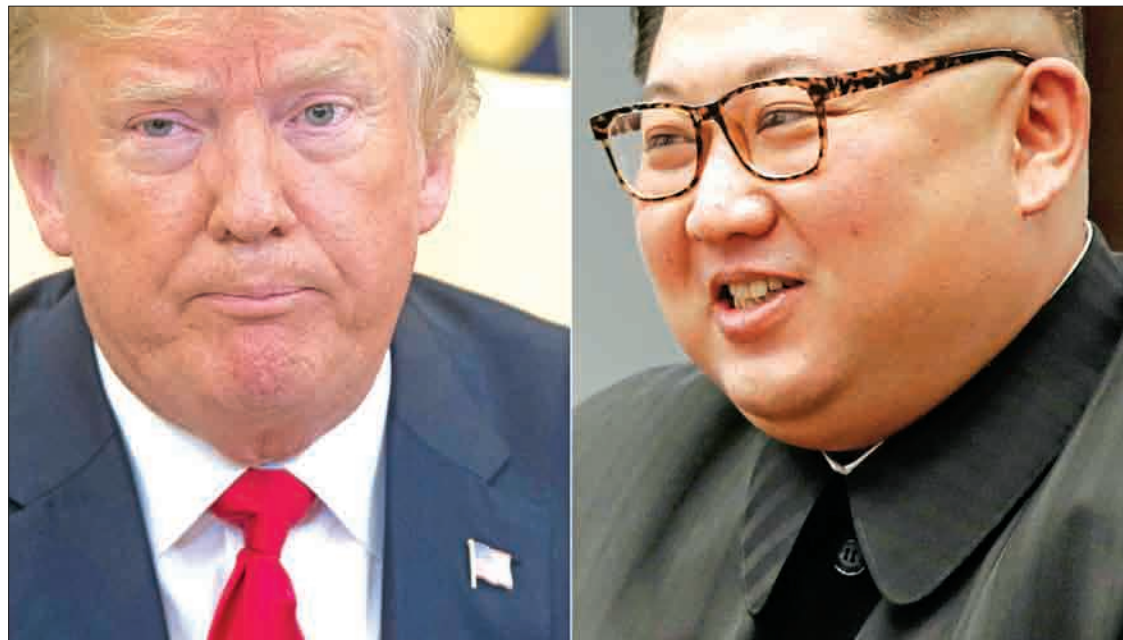
In a personal letter to Kim Jong Un, Donald Trump announced he would not go ahead with the 12 June summit in Singapore, following what the White House called a “trail of broken promises” by the North.

Just before Trump announced the cancellation of the meeting, North Korea declared it had “completely” dismantled