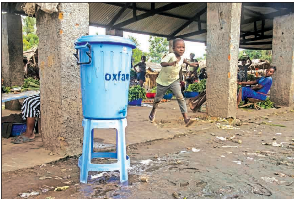
Dispensers containing water mixed with disinfectant are being used in Mbandaka during the Ebola outbreak.

The charity's DRC representative Gianfranco Rotigliano told AFP if a student becomes infected, he or she would be promptly taken care of.