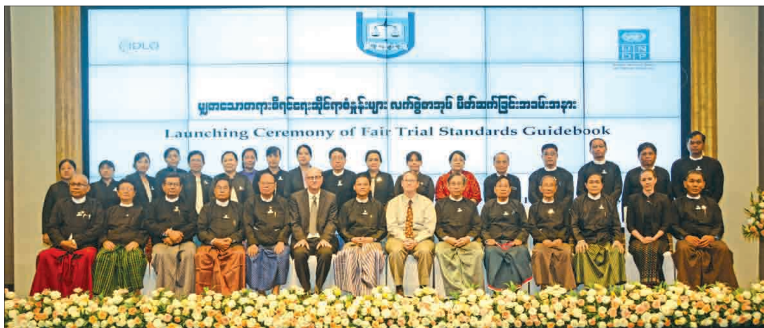
Union Attorney General U Tun Tun Oo and officials take a documentary photo at Launching Ceremony of Fair Trial Standards Guidebook in Nay Pyi Taw yesterday.

tor General Daw Khin Cho Ohn of the Prosecution Department explained, in detail, the contents of the guidebook.