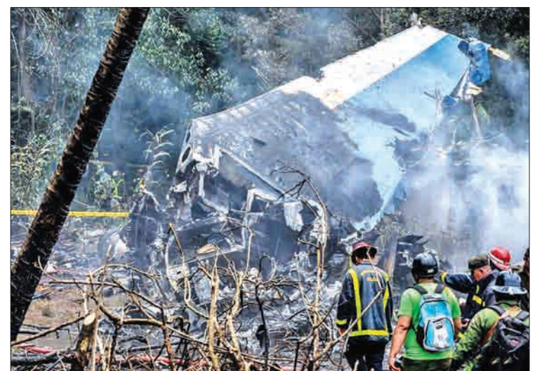
Rescuers work at the site where an airplane of Cuban airline “Cubana de Aviacion” crashed, in Havana, Cuba, on 18 May 2018. At least three people have been found alive, but in critical condition, after a Boeing 737 passenger plane crashed near Havana on Friday, according to state newspaper Granma.

The plane was carrying 113 people on board. Altogether 111 people died in the incident, including 100 Cubans, five foreigners and all the six crew members from Mexico. —Xinhua ■