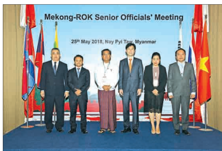
Officials seen at Mekong-ROK Senior Officials' Meeting.

Organisation, state and region Advocates general, representatives from local and foreign organisations, civil society organisations and other invited guests. ■