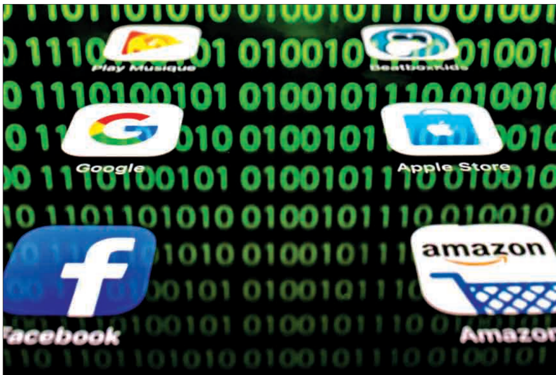
The EU's so-called General Data Protection Regulation (GDPR) comes into effect on Friday.

The law establishes the key principle that individuals must explicitly grant permission for