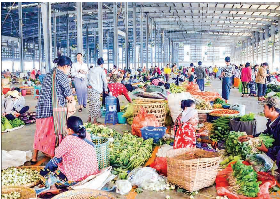
Vendors are seen at Danyingone wholesale fruit, vegetable and flower market in Yangon.

The commerce ministry is striving to help deal with the challenges faced by farmers, such as high input costs, procurement of pedigree seeds, high cultivation costs and erratic weather problems. – Mon Mon■