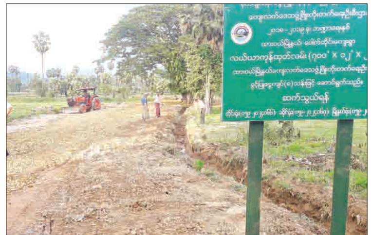
A farm road, which plays a key role in transporting agricultural produce, is under construction in Dawei.

U Hsan Win Htay, head of the township Rural Development Department, inspected the site on 24 May to check on the progress of the road construction.—Dawei District IPRD ■