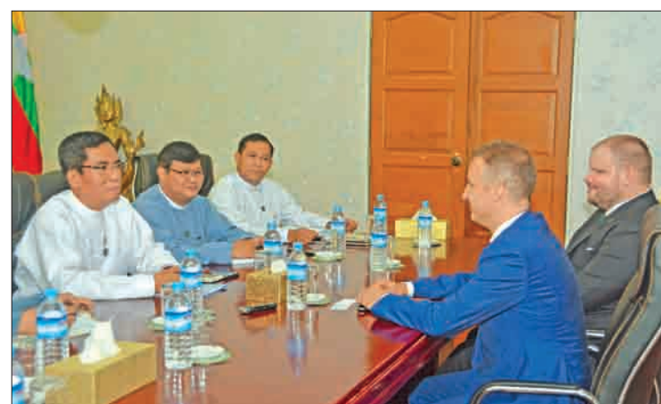
Deputy Minister for Information U Aung Hla Tun holds talk with Netherlands Ambassador to Myanmar H.E. Wouter Jurgens in Nay Pyi Taw yesterday.

He said Myanmar would not have reached the right track in its transition to democracy without the support by the inter-