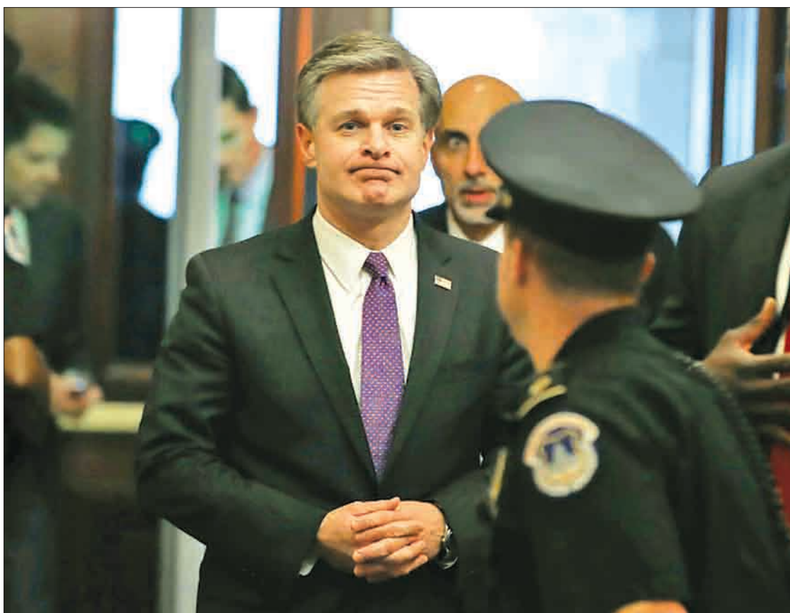
FBI Director Chris Wray was among the intelligence officials who briefed senior members of Congress about the FBI's use of a confidential intelligence source in the Russia investigation.

An initial Thursday briefing at the Department of Justice was intended to be only for Republicans, including House Intelligence Committee Chairman