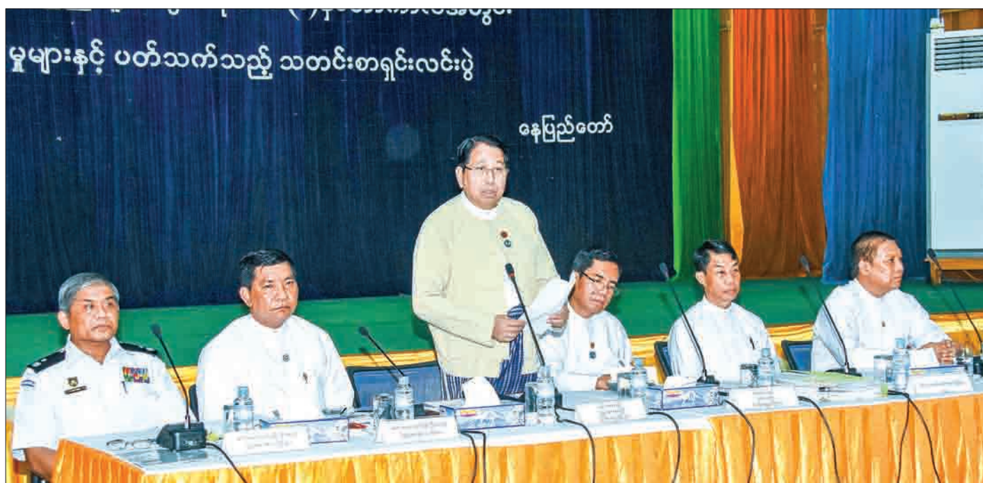
Union Minister for Information Dr. Pe Myint talks to media at the press conference in Nay Pyi Taw yesterday.

In the 2017-2018 Academic Year, over 300,000 school children are learning at 1,547 monasteries and the ministry funded Ks140 million to the monastic education schools nationwide to give salaries