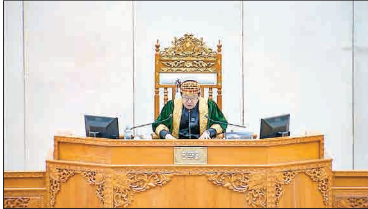
Pyithu Hluttaw Speaker U T Khun Myat.

The railway project was discontinued on 4 April 2014 after residents protested against the