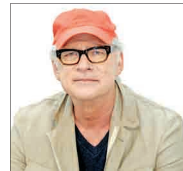
US director Barry Levinson won an Oscar for 1988's "Rain Man".

PARGUE — "Rain Man" director Barry Levinson will be honoured at the Czech Republic's Karlovy Vary film festival in July, organisers said on Wednesday.