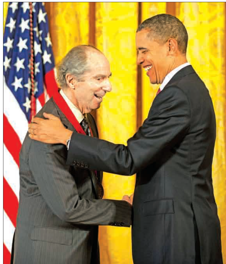
Then US President Barack Obama presents the 2010 National Humanities Medal to Roth.

In 2012, Roth confirmed that "Nemesis" would be his last novel, after having reread all his books. —AFP ■