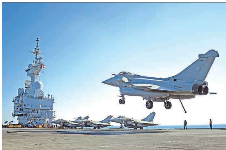
A French Rafale fighter jet lands on the deck of France's aircraft carrier Charles-de-Gaulle operating in the eastern Mediterranean on 9 December 2016, as part of an international coalition against the Islamic State group.

Russian-backed Syrian troops and the US-led coalition have been waging separate offensives against the Islamic State group. A "de-confliction" line in place along the Euphrates River since last year is meant to keep the two assaults from crashing into each other. Loyalist troops are present west of the river while the US-backed Syrian Democratic Forces (SDF) are on the east. A military source from forces allied to Syria's government said the strikes had targeted two regime military positions near a frontline with IS.—AFP ■