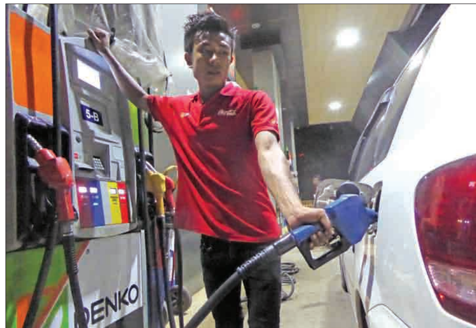
A worker fills a car with fuel at a refilling station in Yangon.