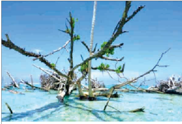
Vanishing island in the Pacific.

These melting ice together with the rain water, collapsing rocks and earths from the erosions of the shorelines that are being dumped into the seas and oceans are causing the water level rises. Which in turn led to flooding of low-lying grounds close to the shores. The worst hit by the floods