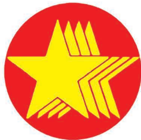
Democratic Party for a New Society's Emblem.

In accord with Section 14 (d) of the Political Parties Registration Rules, it is hereby announced that those who want to remonstrate with the UEC about the party's emblem may submit a complaint along with the supporting evidence within seven days starting from issuance of this announcement.—Union Election Commission