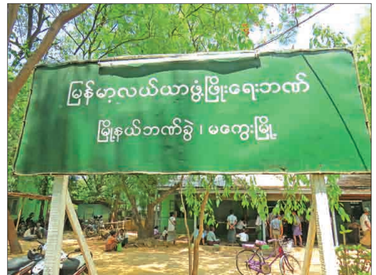
Farmers wait outside the bank branch of Myanmar Agricultural Development in Magway Township to draw agricultural loans.

Last year, farmers could obtain agricultural loans from the bank by showing their household and bank accounts. But this year, they have to submit farmland