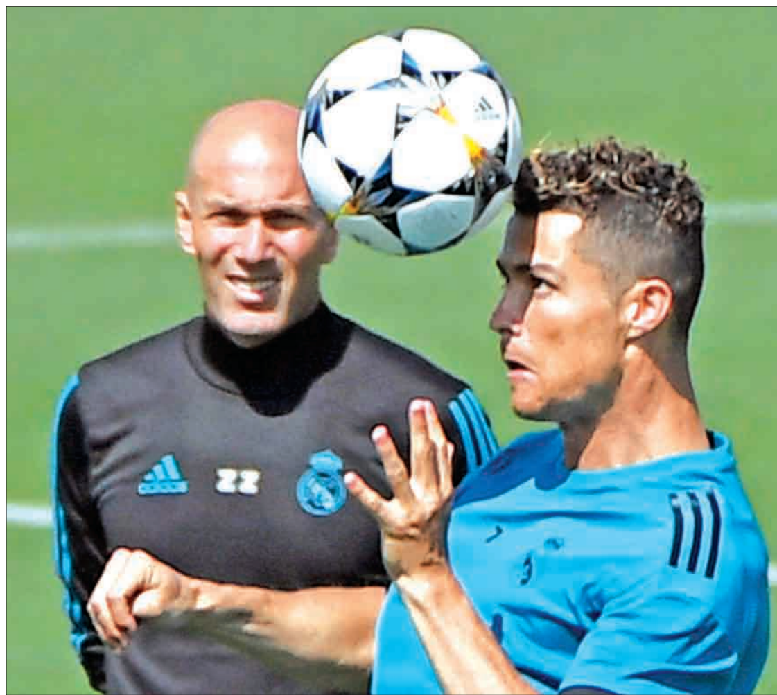
Real coach Zinedine Zidane watches Cristiano Ronaldo in training ahead of this weekend's final.

Ronaldo's decline in the first half of this season was as