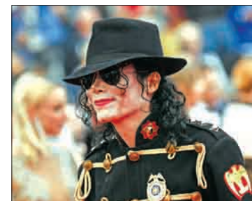
Pop star Michael Jackson.

"We are told ABC intends to use music and other intellectual property owned by the estate such as photos, logos, artwork and more in the program itself,