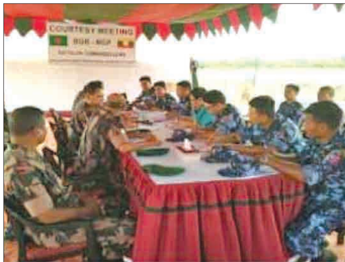
Myanmar-Bangladesh battalion commander-level meeting held on Wednesday in Bangladesh.

The Myanmar border guard also reminded the Bangladeshi border guard of Myanmar's offer to hand over five Bangladeshi people who were found on a fishing boat and are currently