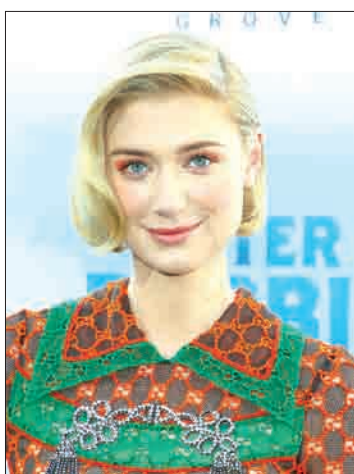
Premiere Of Columbia Pictures' "Peter Rabbit" - Red Carpet.

cerned with the 'toxic femininity' that Winton is presenting?" he asked, noting a recent spate of sex scandals in Australia involving female teachers and their high school students.