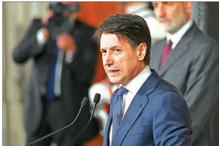
Giuseppe Conte's appointment could herald an end to more than two months of political uncertainty.

Italian media reported that League chief Matteo Salvini would become interior minister while Five Star leader Luigi Di