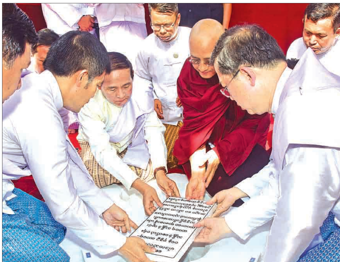
Shwe Parami Tawya Sayadaw Ashin Sanda Dhika and President U Win Myint place stone inscription at the centre of the Eternal Peace Pagoda in Nay Pyi Taw yesterday.

The Eternal Peace Pagoda will be built on 1.3 acres of land and it will be 54 ft high when completed.—Myanmar News Agency ■