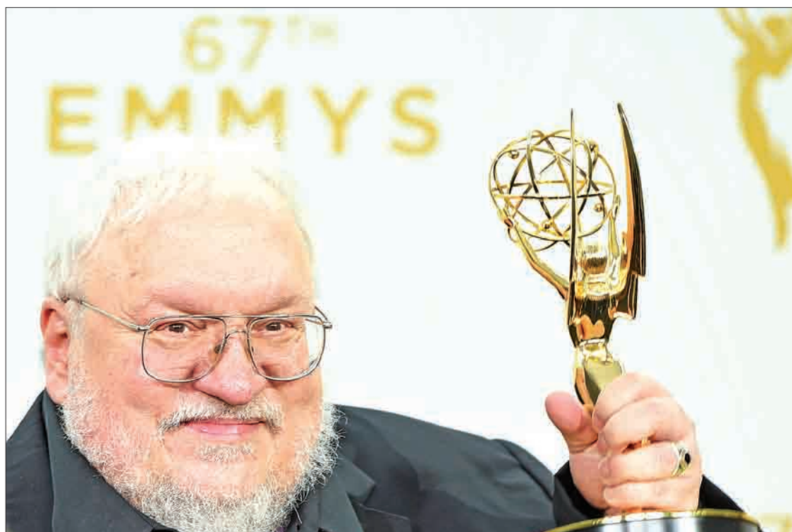
Writer/producer George R.R. Martin, winner of the award for Outstanding Drama Series for "Game of Thrones," will now see his story become an animated film.