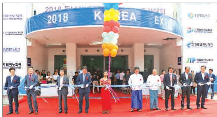
An opening ceremony of 2018 Korea-Expo held in Yangon.

2018 Korea-Expo kicked off at the Tatmadaw Convention Hall in Yangon yesterday, with 120 booths.