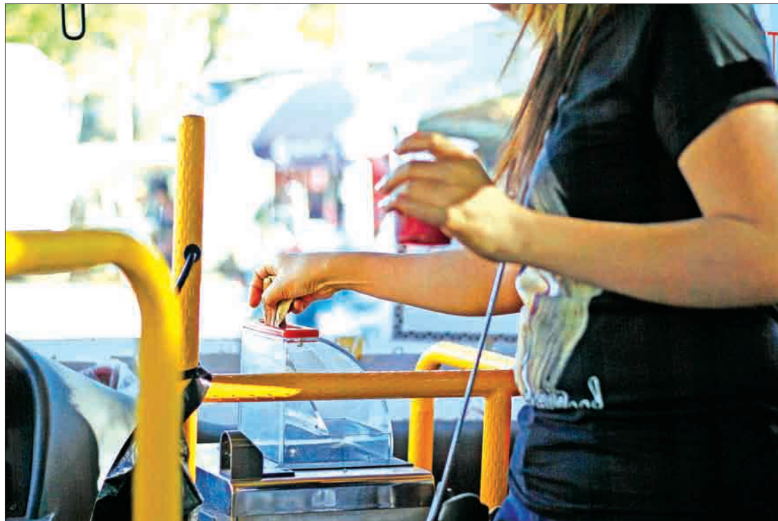
A passenger drops money into a cash box in the YBS bus in Yangon.

Two clerks from the Power Eleven Public Company inspected the passenger fare payment on 1 May in five YBS-78 bus lines. They found a payment gap of 50 per cent in the