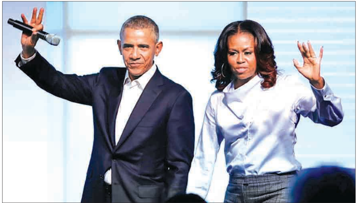
Barack Obama and Michelle Obama.

The Obamas already have a large social media presence — a combined 150 million followers on Twitter and Instagram — but the deal will see their influence boosted significantly by Netflix's 125 million subscribers in 190 countries. "Barack and Michelle Obama are among the world's most respected and highly-recognized public figures and are uniquely positioned to discover and highlight stories of people who make a difference in their communities and strive to change the world for the better," said Netflix chief content officer