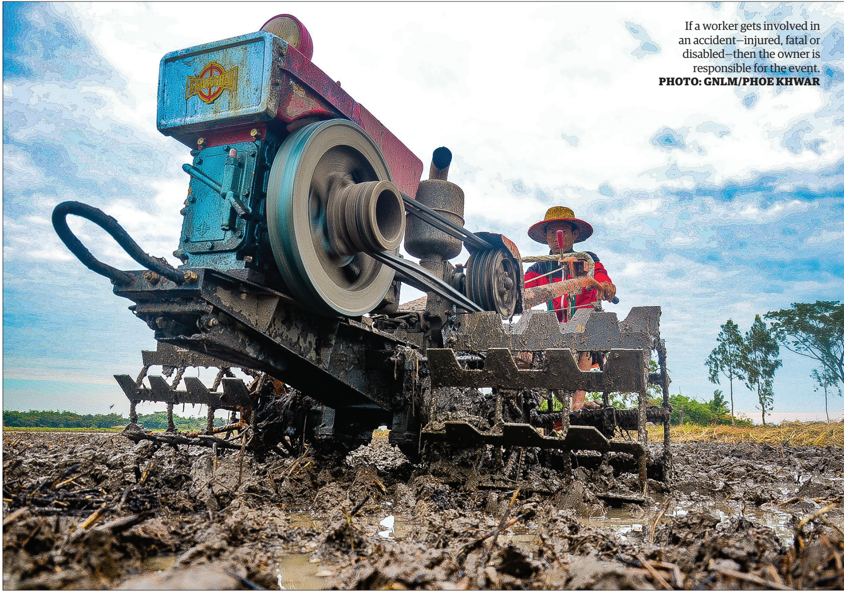
If a worker gets involved in an accident—injured, fatal or disabled—then the owner is responsible for the event.

The Committee handles all the complaints and preliminary investigations have been made about them. Investigations are made whether the complaints are in accord with the existing laws or