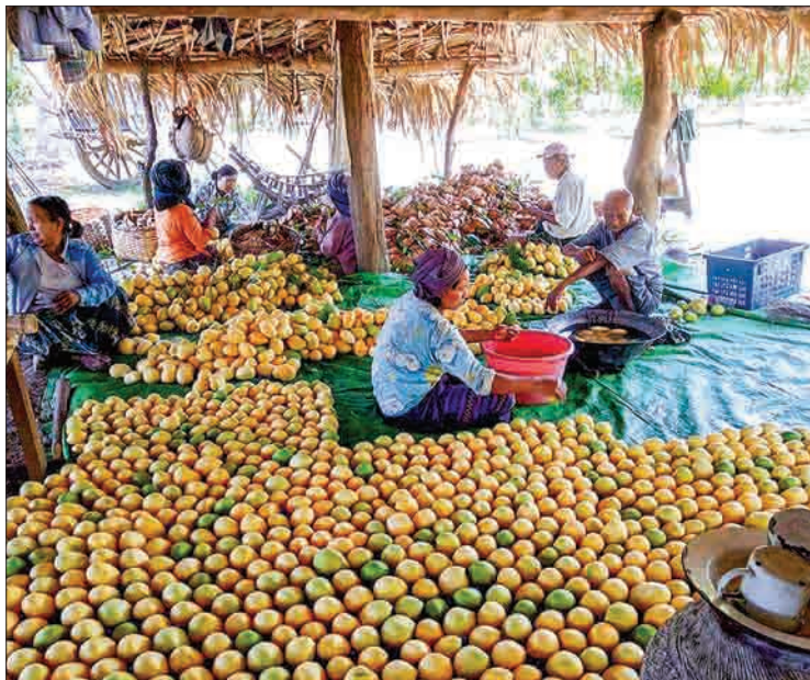
Labourers arranging mangoes in the farm.

"Local cultivators requested traders to buy even the small-sized mangoes. We select the fruits using a machine to weigh their size. The price of mangoes depends on their size. The man-