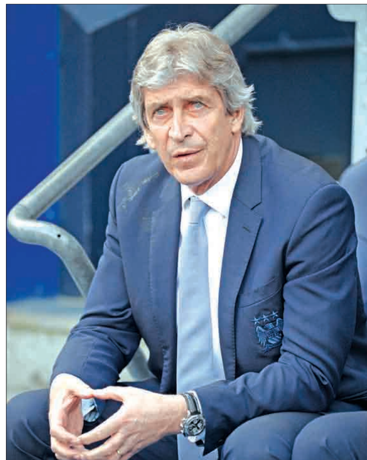
Former Manchester City manager Manuel Pellegrini is the new boss at West Ham.

Despite being under contract through to the end of 2018 and with a reported release clause of $7 million, Hebei confirmed on Saturday that Pellegrini had left his role.—AFP ■