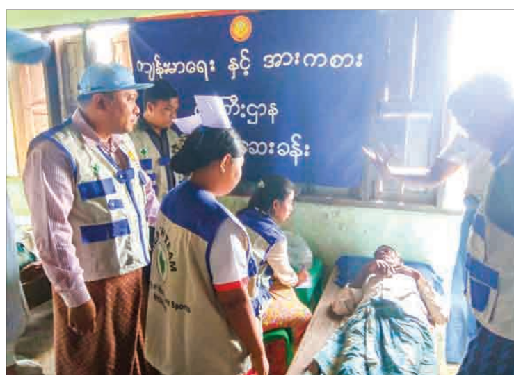
Medical mobile team provides medical treatment to returnee at the clinic in Maungtau.