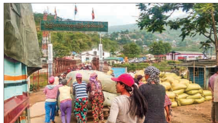
Myanmar-India friendship bridge between India and Myanmar.

It is reported that the temporary traffic limitation happened as a VIP person is expected to visit the Indian site soon. According to local authorities, some of the goods exported to India are considered illegal in India though Myanmar legally trades them. As the two sides have reached an agreement to mutually close the bridge temporarily, Indian authorities have allowed people to cross the bridge and carry their goods with carts. The move is meant only to limit the traffic and when the bridge will reopen is uncertain. — IPRD ■