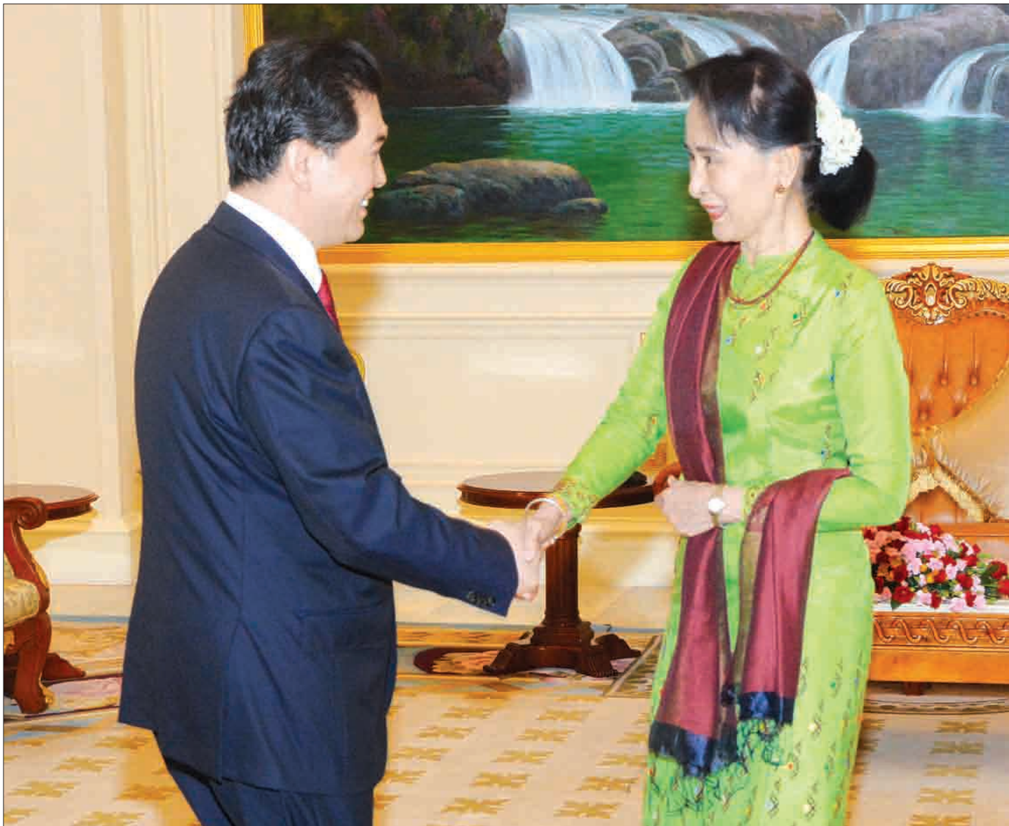
State Counsellor Daw Aung San Suu Kyi (Right) welcomes Vice Chairman of the Chinese People's Political Consultative Conference (CPPCC) Mr. Wang Zhengwei (Left) at the Ministry of Foreign Affairs in Nay Pyi Taw yesterday.