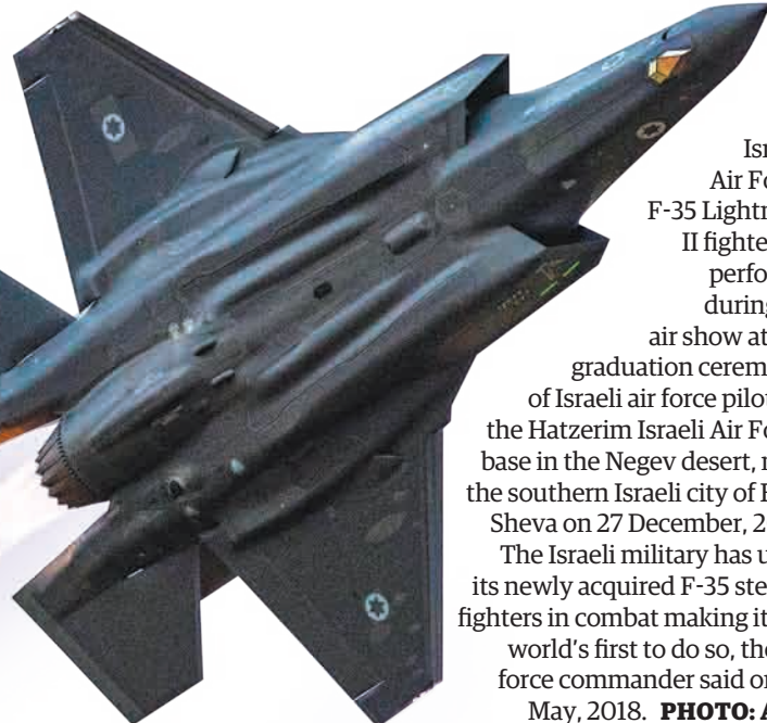
An Israeli Air Force F-35 Lightning II fighter jet performs during an air show at the graduation ceremony of Israeli air force pilots at the Hatzertim Israeli Air Force base in the Negev desert, near the southern Israeli city of Beer Sheva on 27 December, 2017. The Israeli military has used its newly acquired F-35 stealth fighters in combat making it the world's first to do so, the air force commander said on 22 May, 2018.

Israel has carried out a number of strikes in Syria against what it describes as Iranian targets as well as on what it says are advanced arms deliveries to Hezbollah.