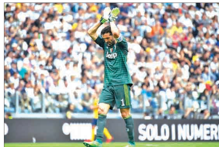
Buffon.

Paris Saint-Germain president Nasser Al-Khelaifi earlier in the day poured cold water on suggestions Buffon could step in to replace the French club's number one goalkeeper, Alphonse Areola. Al-Khelaifi told L'Equipe sports daily: "He (Buffon) is a fantastic goalkeeper, he's very charismatic and is a true gentleman. I'm sure all the clubs want him."—AFP ■