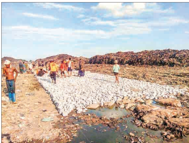
YCDC staff paving roads to transport garbage at the Htein Bin garbage dump in Hlinethaya Township.

The canals surrounding the dump have been built to accumulate rainwater, and the same will