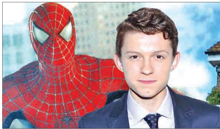
Actor Tom Holland.

LOS ANGELES — Comic book legend Stan Lee says Tom Holland is the perfect choice to play Spider-Man as the actor is exactly how he imagined the webbed superhero.