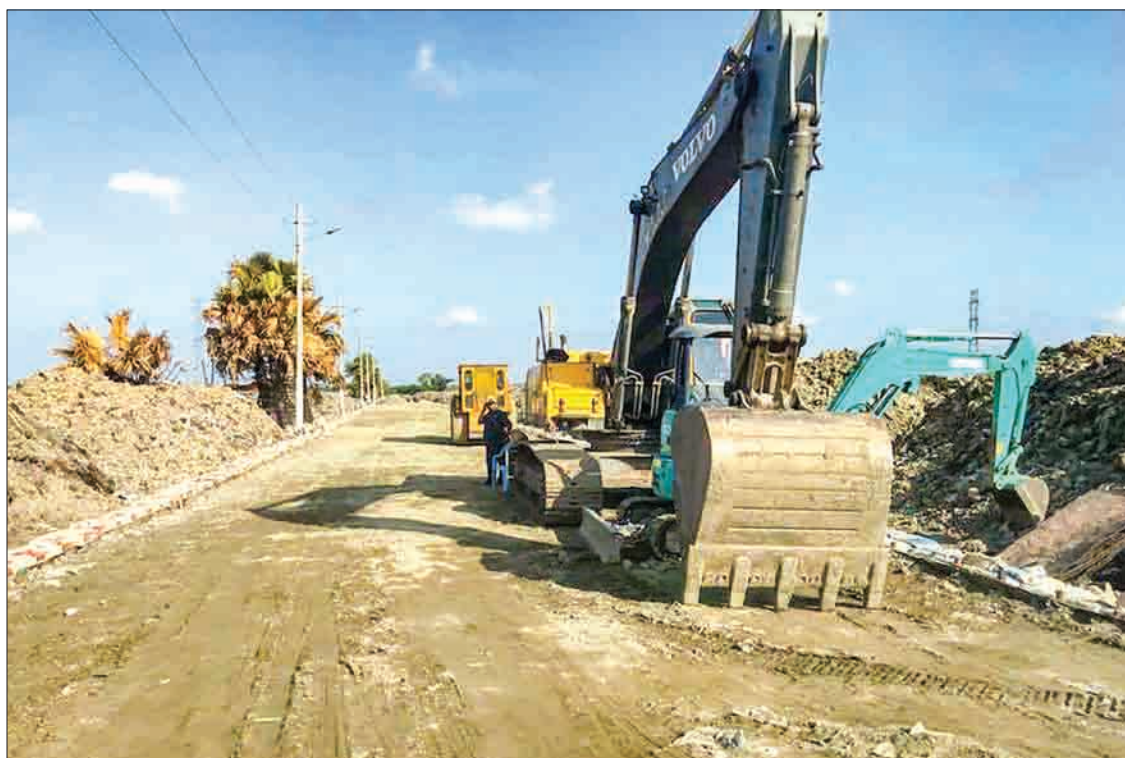
Workers construct the road along the Htein Bin garbage dump in Hlinethaya Township.