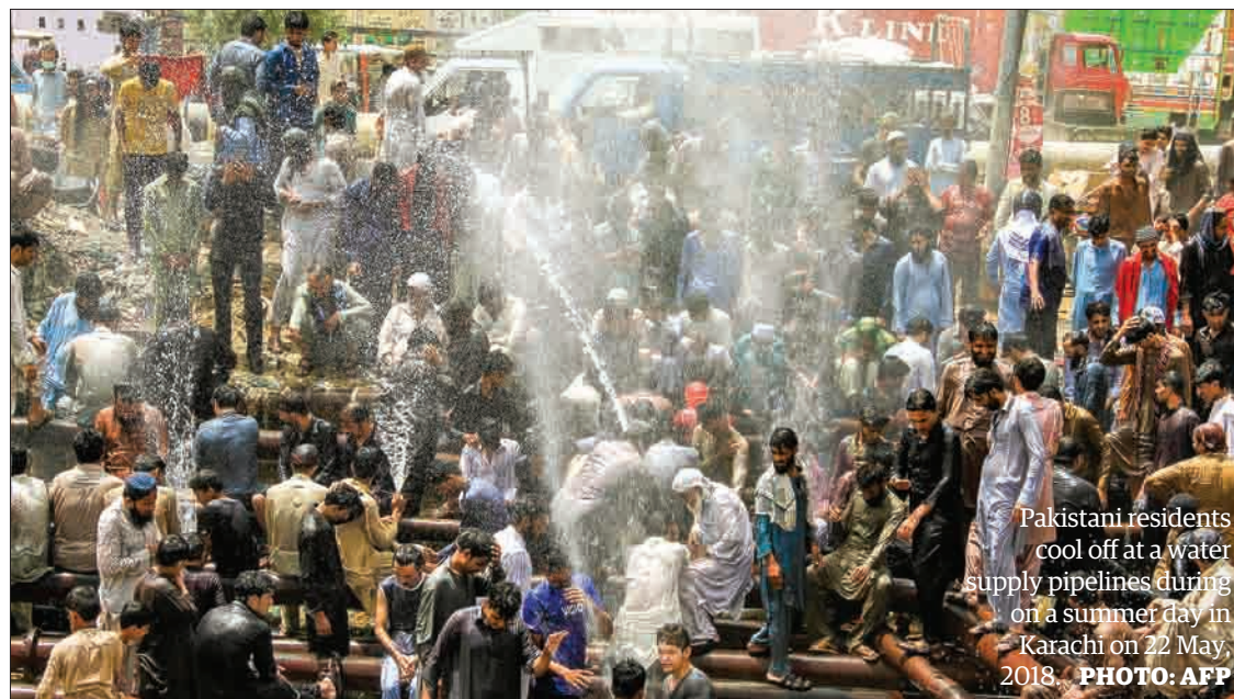
Pakistani residents cool off at a water supply pipelines during on a summer day in Karachi on 22 May, 2018.

KARACHI, PAKISTAN — Dozens of people are feared to have died in a heatwave gripping Pakistan's largest city Karachi this week, a charity in the sprawling metropolis said on Tuesday, as temperatures hit 42 degrees Celsius (108 degrees Fahrenheit).