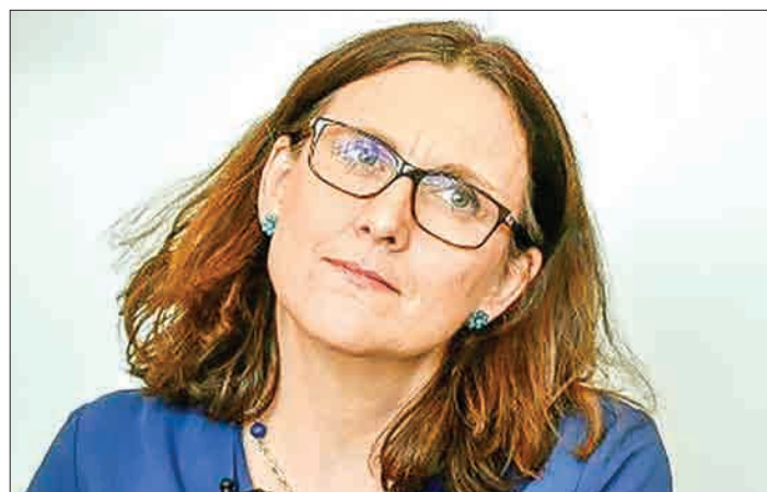
EU Commissioner of Trade Cecilia Malmstrom said he did not think Europe's offer to the US would be enough to stave off the threat of a trade war.

"We are allies but we are not vassals. Today is a moment of truth for the EU," said French trade minister Jean-Baptiste