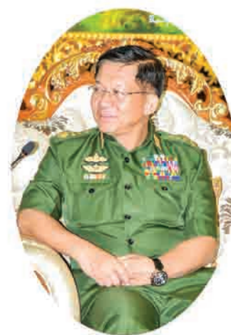
Special Envoy Mr. Sun Guoxiang, left, and Senior General Min Aung Hlaing, right, meets in Nay Pyi Taw.