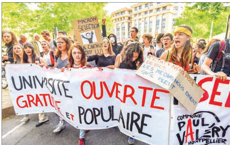
Students take part in a demonstration on 22 May, 2018, in Montpellier, southern France, as part of a day of striking by French public sector workers to protest a series of reforms proposed by the French president, which they consider an attack on key civic services as well as their own economic security.