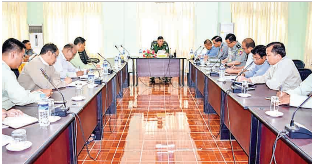
Coordination meeting for competitions to mark the 21 st International Day against Drug Abuse and Illicit Trafficking held in Sittway, Rakhine State, yesterday.