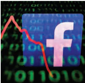
The EU laws will cover large tech companies like Facebook, Google, and Twitter that use personal data

The Silicon Valley giant has told the European Com-mission, the EU’s executive arm, that the personal data of up to 2.7 million Europeans may have been sent inappro-priately to Cambridge Analyt-ica, which has since filed for bankruptcy in the US.—AFP ■