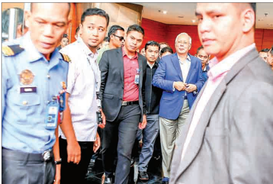
Malaysia's former prime minister Najib Razak (centre-R) leaves after being questioned at the Malaysian Anti-Corruption Commission (MACC) office in Putrajaya on 22 May, 2018.

The ousted leader arrived at the Malaysian Anti-Corruption Commission