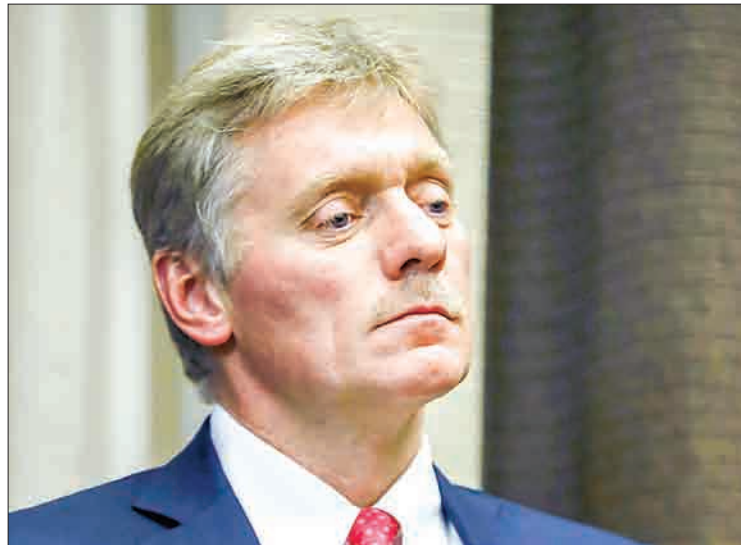
Kremlin spokesman Dmitry Peskov.

In his State of the Nation Address to both houses of Russia's parliament on 1 March, Putin announced about the development and trials of the most advanced strategic weapons Russia was creating in response to Washing-