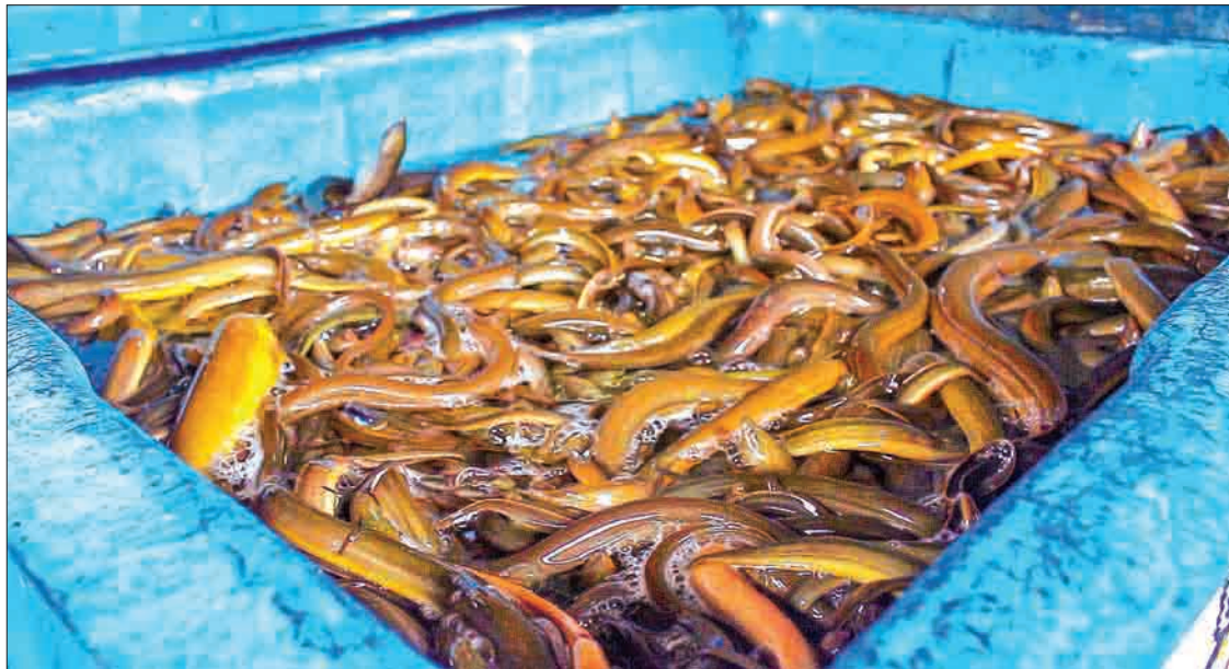
MFF successfully conducted experimental eel cultivation process with Viet Nam's technology.

were produced in the past two weeks and more eggs were hatched. Currently, the two-week-old larvae are fed stuff produced from the feed processing factory. The larvae will pass the