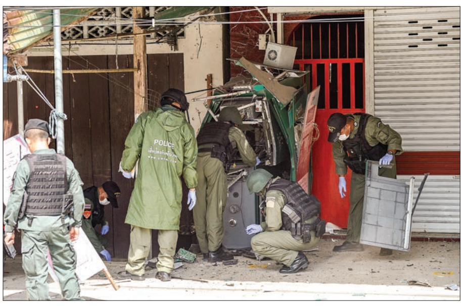
Thai military bomb squad inspect a damaged bank's ATM station next to a gold shop in Bacho district in the restive southern province of Narathiwat on 21 May, 2018 following an overnight attack by suspected militants.

BANGKOK — Muslim insurgents detonated more than 20 homemade explosives across Thailand's south, the army said on Monday, in a night of violence undermining junta claims of headway in peace talks with the rebels.