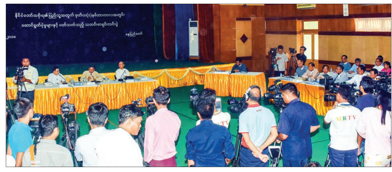
Ministry for Education, Ministry of Transport and Communications and Ministry of Ethnic Affairs hold press conference on their performance in second year in office in Nay Pyi Taw.

technical assistance for basic education primary level while ADB (Asian Development Bank) and EU (European Union) provides technical assistance to prepare middle and high school level text books and teachers guide. KG+12 system was started in academic year 2016-2017 and is expected to be completed in academic year 2022-2023.