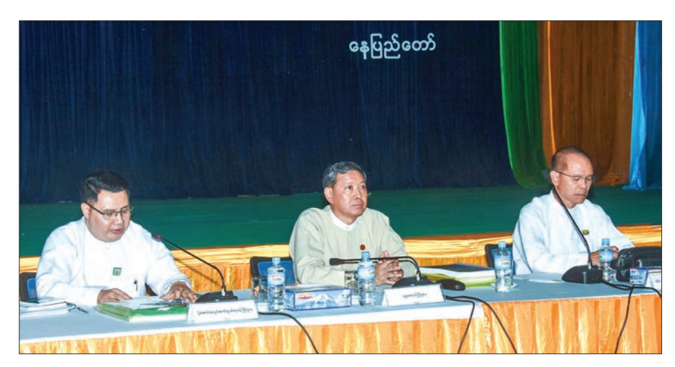
Union Minister for Education Dr Myo Thein Gyi, Permanent Secretary U Win Khant and Ministry of Ethnic Affairs Director-General U Hla Maw Oo attend the press conference on second one-year performance in Nay Pyi Taw yesterday.

NATIONAL 22 MAY 2018 THE GLOBAL NEW LIGHT OF MYANMAR