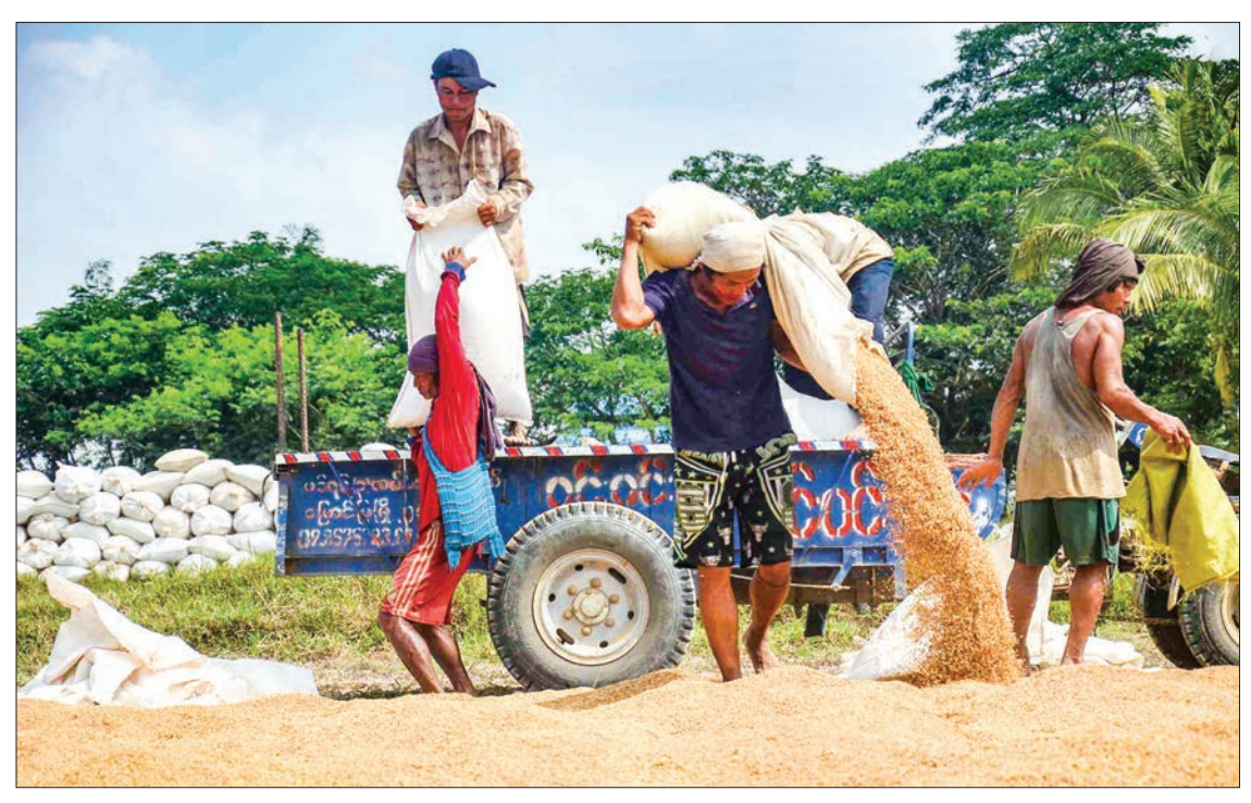
Farmers harvest rice in Kangyidauk in Ayeyawady delta.