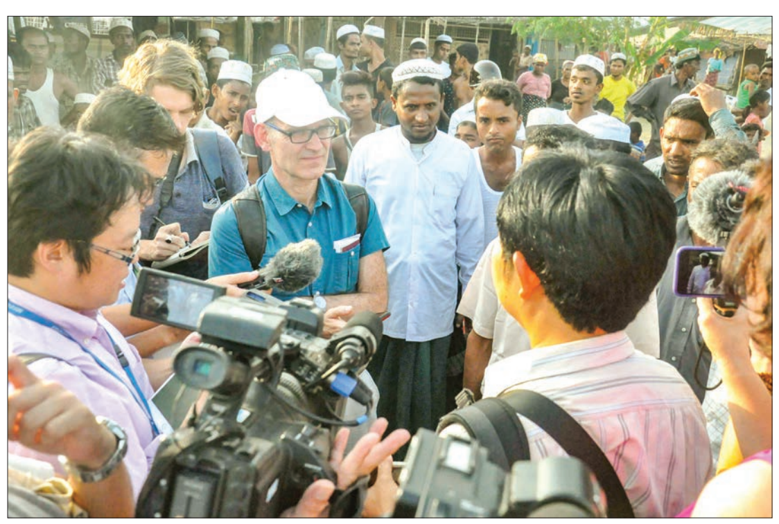
Independent media group interviews locals in Takapyin IDP camp in Sittway yesterday.

AN independent media group including foreign journalists arrived in Sittway Airports at 4:35pm yesterday.