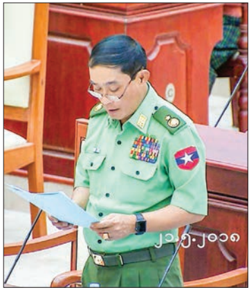
Deputy Minister for Border Affairs Maj-Gen Than Htut.

Commission member U Aung Myint replied that the members for the various levels of the election commission were chosen according to the Constitution and its related laws by the Union Election Commission, and it is not mentioned in the Constitution and the laws that the members should be as submitted by