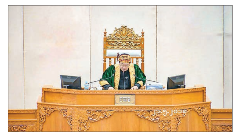
Pyithu Hluttaw Speaker U T Khun Myat.

session, U Thaung Aye of Pyawbwe constituency first asked if there was any plan to amend the Pyawbwe Township election commission member list, as the list sent back by the Union Election Commission included the names of two persons who were not in the list submitted by the township. Union Election