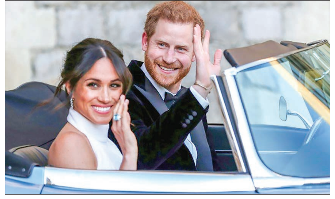
Prince Harry, duke of Sussex, (R) and Meghan Markle, duchess of Sussex, leave Windsor Castle after their wedding.

they were greeted by around 100,000 people lining the streets. The couple will not be taking a honeymoon immediately, as they are due to attend a charity garden party for Prince Charles, the heir to the throne, at Buckingham Palace on Tuesday.—AFP