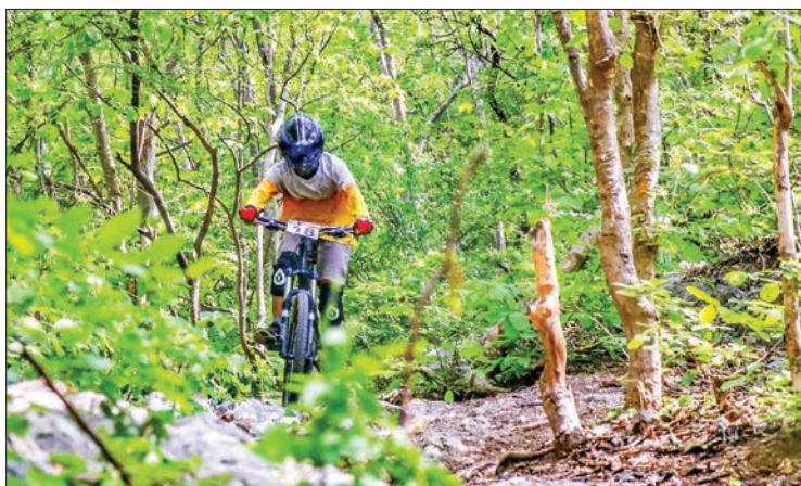
A cyclist contests in Myanmar Downhill Junior 2018 cycling contest.

The commissaries gave necessary instructions to the participants and the medical teams were ready to provide healthcare services for them.