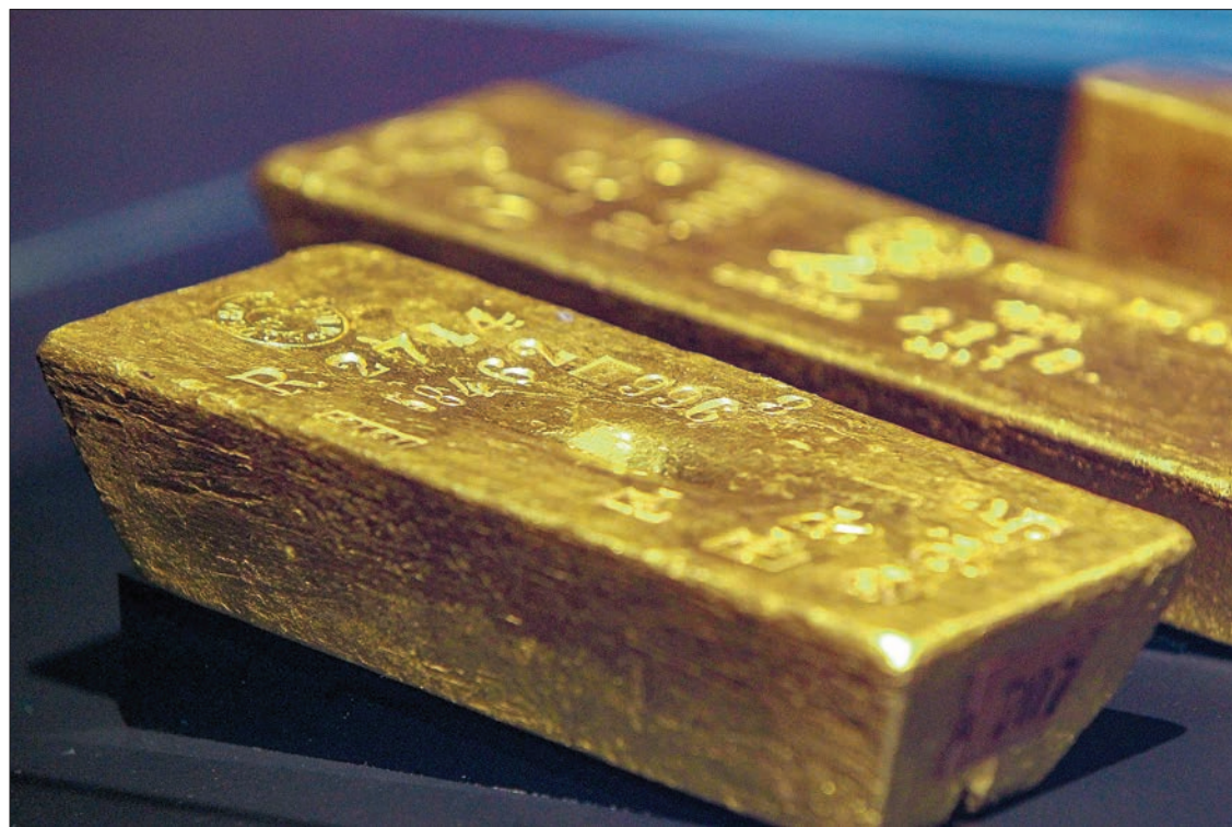
African nations have vowed to recover billions of dollars held in off-shore accounts.

The announcement to donate to the Reaching the Last Mile Fund was made by visiting British Minister for the Middle East Alistair Burt during his meeting with Reem bint Ibrahim Al Hashimy, UAE Minister of State for International Cooperation.—Xinhua ■