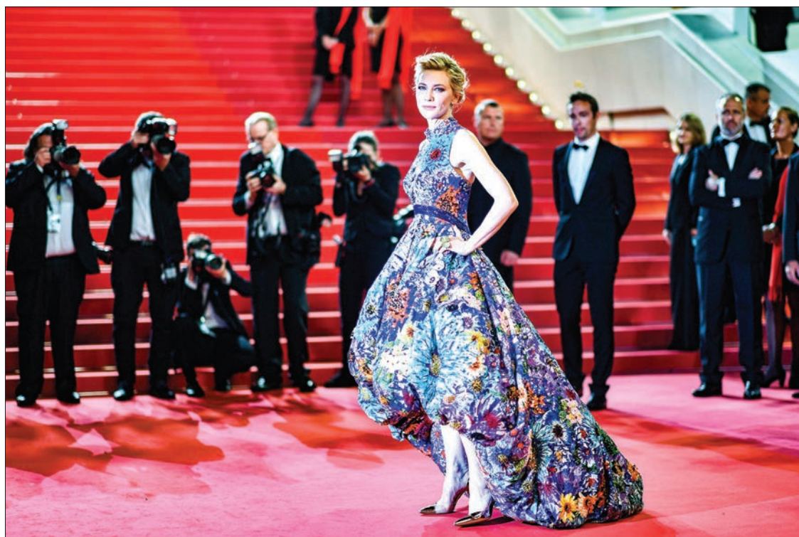
Cate Blanchett's spectacular blue Mary Katrantzou ball gown that took six months to make.

Black and mixed-race French actresses showed how to be angry and elegant in their protest on the red carpet about the shocking discrimination and stereotyping they have suffered. Dressed in Balmain they lit up Cannes on the wettest night of the festival and were clapped up the carpet by jury member Kh-