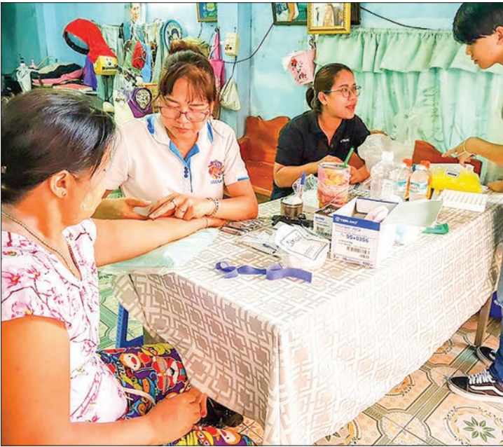
A volunteer Thai doctor performs a free medical check up on a migrant Myanmar worker.