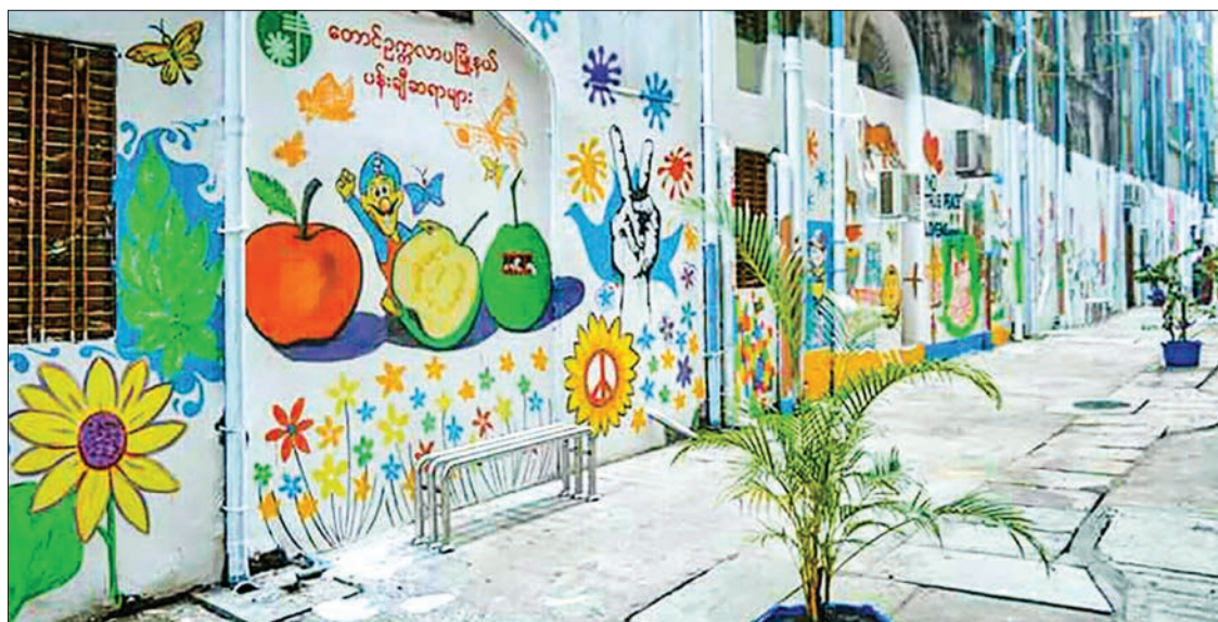
“South Okkalapa Township Artists” is written above the drawing of three apples on a wall in the reclaimed back alley in Pabedan Township, Yangon.

Altogether, some five projects were set up.— Aye Min Thu ■