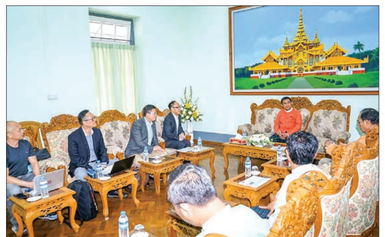
Bago Region Chief Minister discusses construction of a paper production plant with Lee & Man Manufacturing Co. Chairman.

The Chief Minister then expressed his gratitude for the foreign investment venture as the lack of job opportunities in