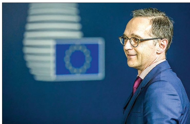
German Foreign Minister Heiko Maas.

proach produces unequivocal results - while some are talking about dialogue, I take care to have it intensified again,” he said. The minister evaded the question on whether he was go-