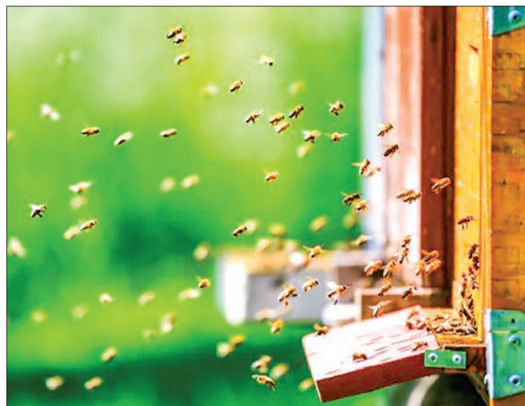
Beekeeping is a cherished national tradition in Slovenia, which has led the way in raising awareness of the plight of bees.

cabin, one is engulfed by a dense, soporific buzzing emanating from the more than 20 hives inlaid into one of the walls.