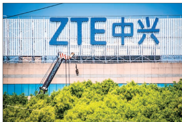
Chinese telecom giant ZTE suspended operations after US sanctions were imposed to punish it for exporting sensitive materials to Iran and North Korea.

Liu called the agreement a "necessity", but added: "At the same time