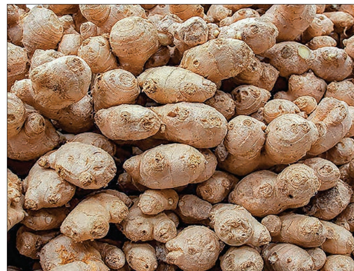
Ginger.