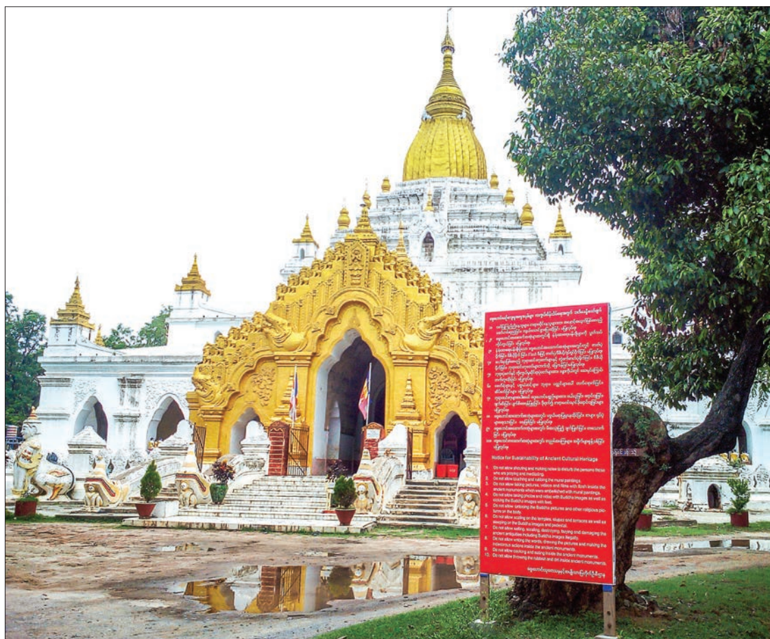
Kyauktawgyi Pagoda is famous for its large Buddha Image.

So come, visit the pagoda and admire its unique architecture and murals. —Nway Nadi (Myitnge) ■