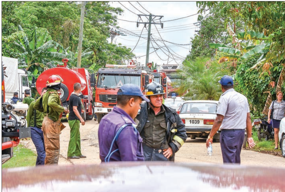
Emergency and rescue personnel work at the site after a Cubana de Aviacion aircraft crashed after taking off from Havana's Jose Marti airport.

The aircraft was a Boeing 737-200 leased to Cuba's state airline Cubana de Aviacion by Mexican company Global Air, also known as Aerolineas Damojh. It was a "wet lease," meaning Global Air supplied the plane, its crew