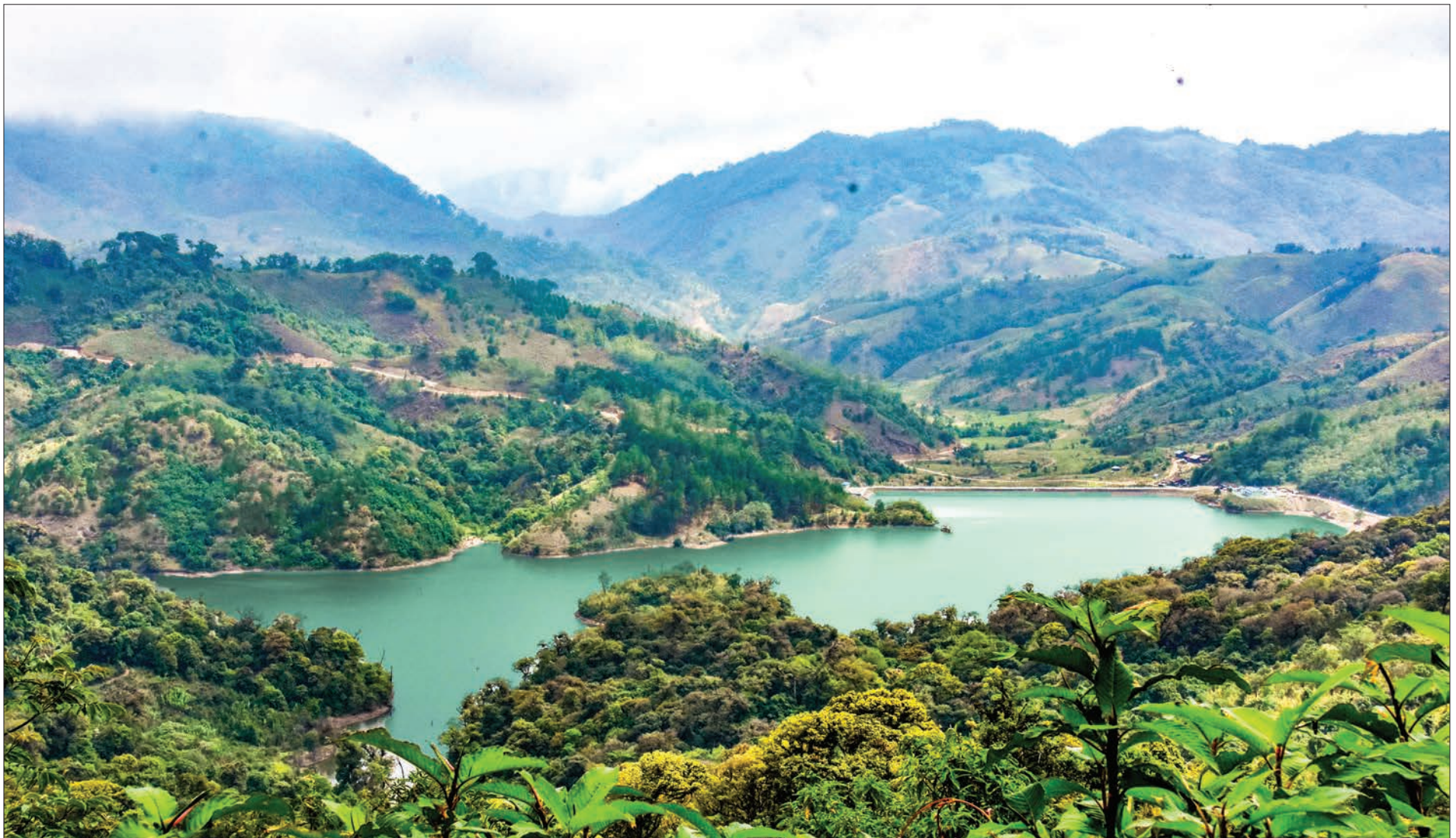
Laiva Dam project that will supply water to Falam Township which has a population over 25,000.