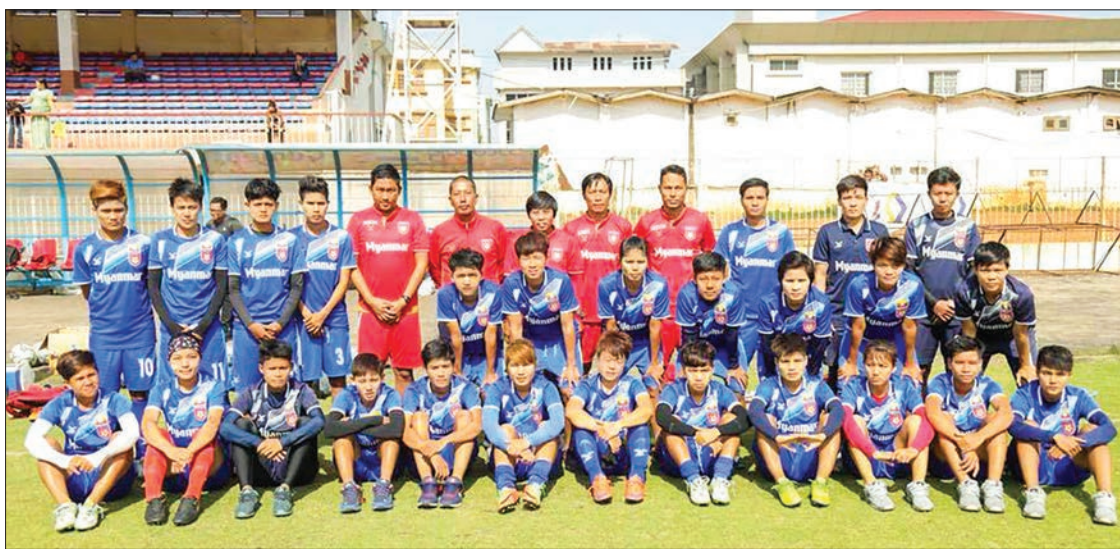
Myanmar national women footballers seen at Shan United football Stadium in Taunggyi.

The friendly match was played in three sessions of 30 minutes each, and during the first session, the Ho Pong Youth team led 1-0; however, during the