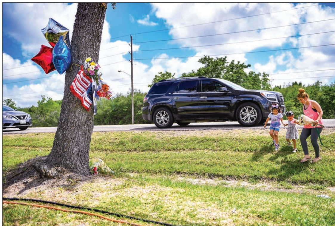
A family brings flowers to a makeshift memorial at Santa Fe High School in Texas, where the latest US mass shooting occurred.