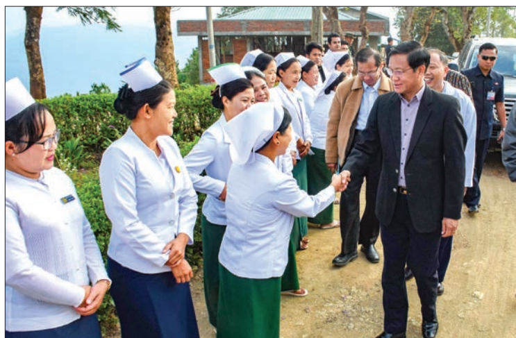
Vice President U Henry Van Thio shakes hands with medical staff as he enters Falam General Hospital.