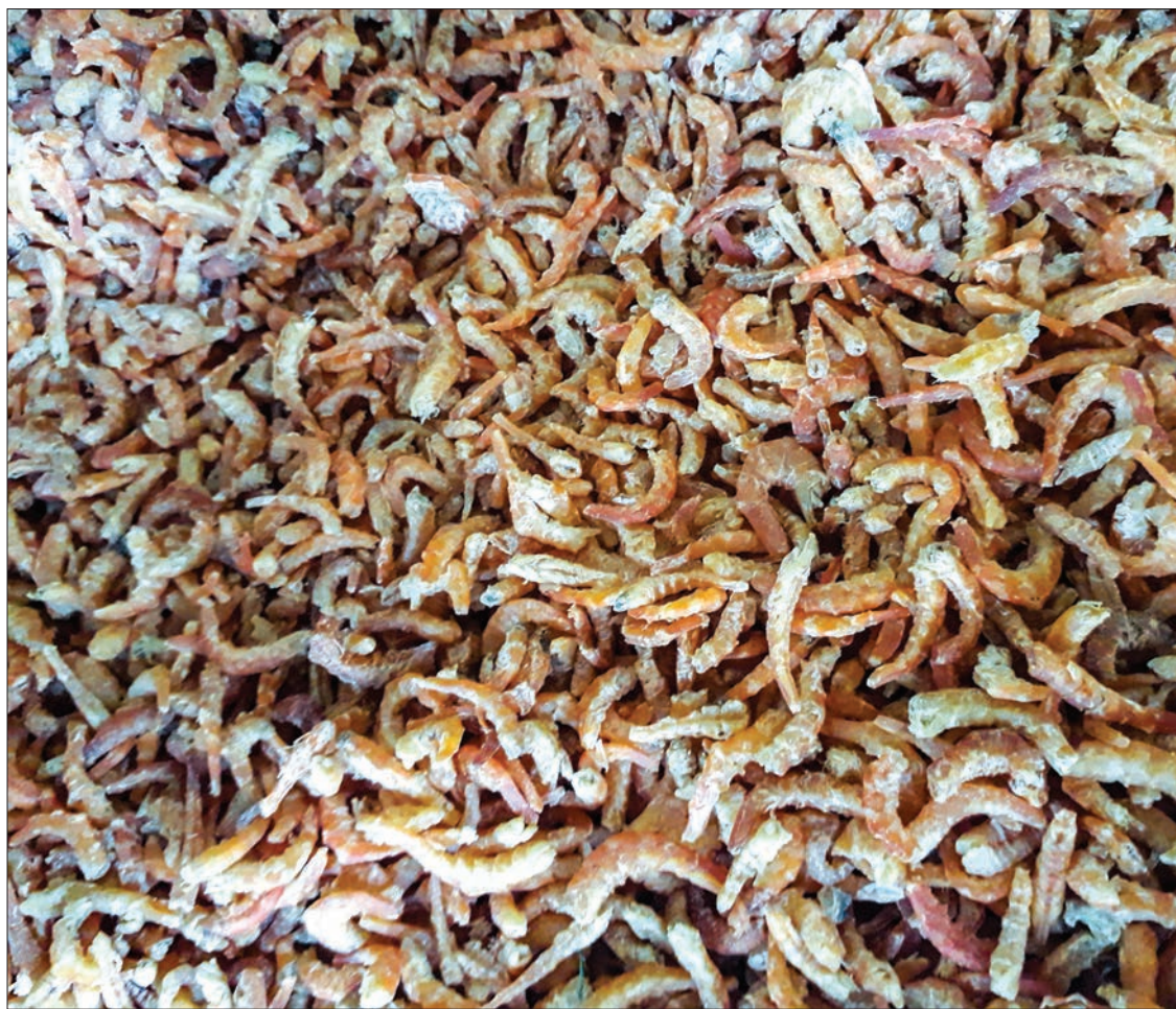
Dried shrimp is an important ingredient of Myanmar dishes.