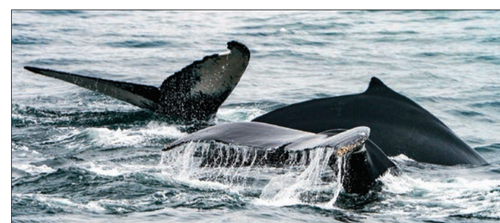
A humpback whale exhales a blow and raises its fluke as it prepares to dive while feeding.

Boats are not allowed to approach closer than 500 yards (meters). —AFP ■