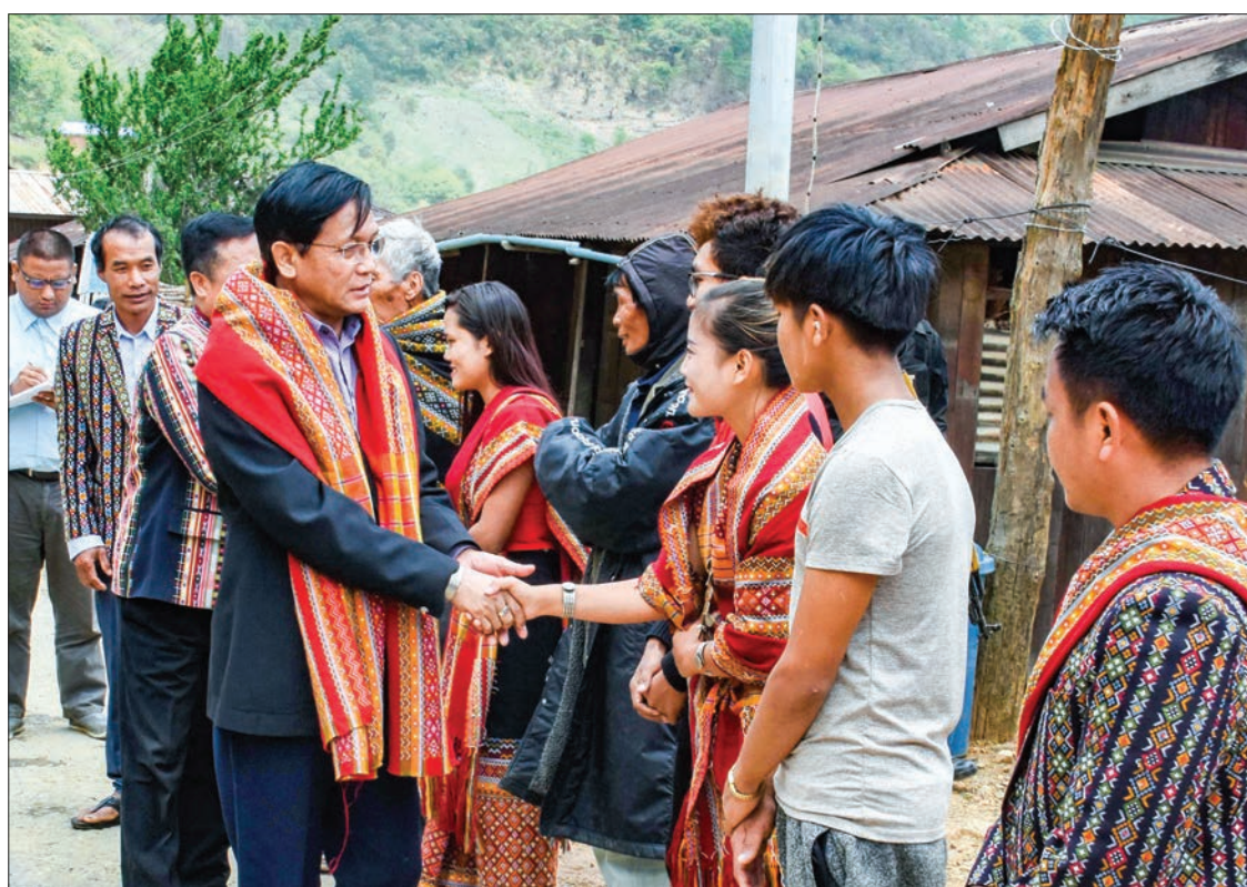
Vice President U Henry Van Thio warmly greets local people.