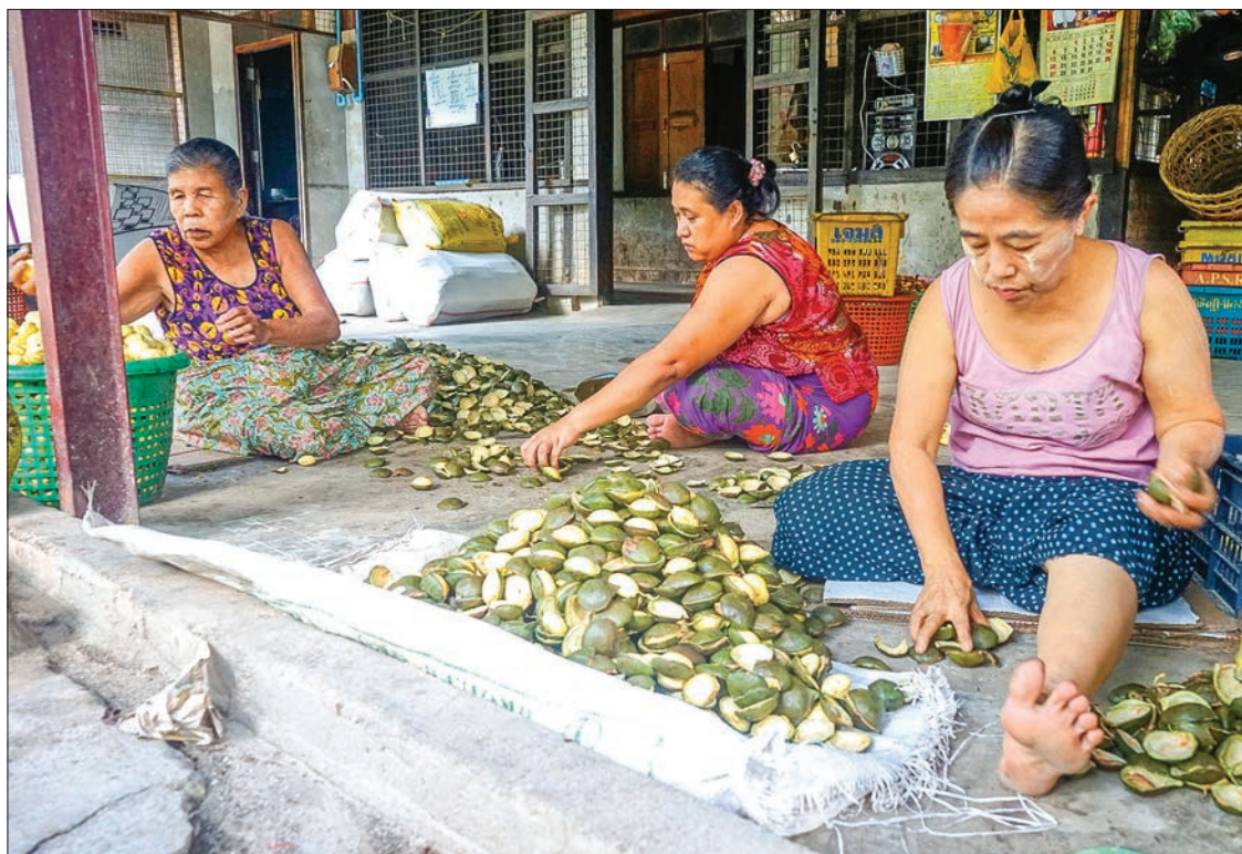
Women are preparing jengkol beans to sell in the market.

Depending on their size and freshness, the raw Jengkol beans are sold for Ks15-Ks30 per fruit in the local market, whereas the salted