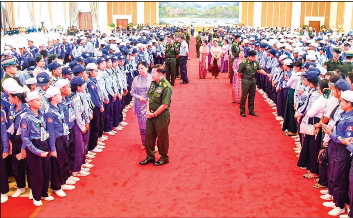
Senior General Min Aung Hlaing cordially greeting marine and aviation youth.

The Senior General presented gifts to the trainees from the marine and aviation training courses and received the gifts presented by the youth. Later, Ma Khin Sabei Aung from the marine youth training course