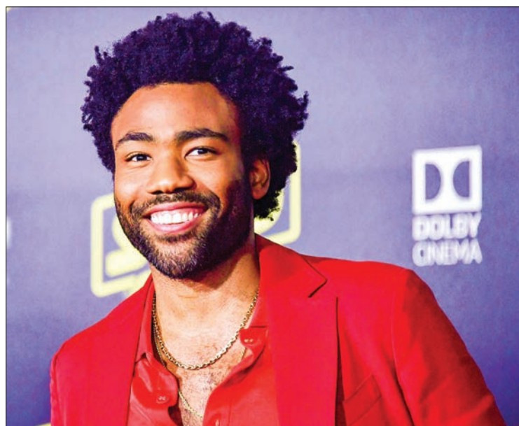
Actor Donald Glover is better known to rapt teenagers the world over as US hip hop phenomenon Childish Gambino.

He has been a fan favorite pretty much from the moment the first "Solo" trailer dropped, and Lucasfilm has said that a standalone Lando movie might happen one day — but not any time soon. Glover — who divides his time between Atlanta, a couch at his studio in Los Angeles and the Hawaiian island of Kauai — was at his brother's house when he got the top secret news that he'd landed the part. — AFP ■