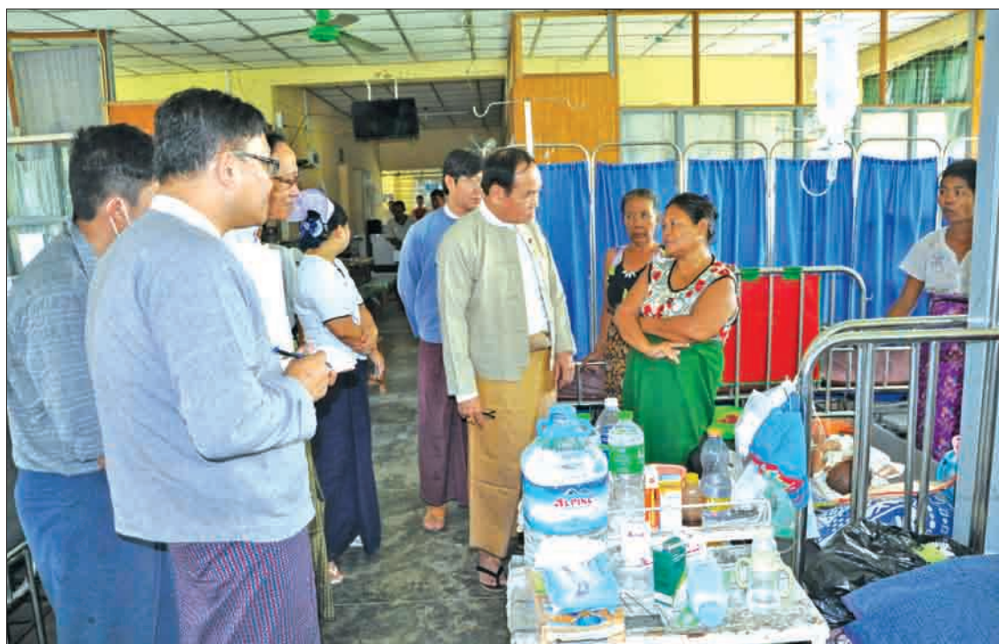
Union Minister Dr Myint Htwe inspects the 200-bed Hlinethaya General Hospital in Hlinethaya, Yangon Region yesterday.

A party consisting of Deputy Directors General and other