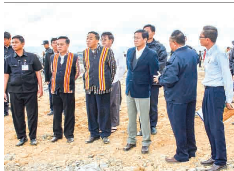
Vice President U Henry Van Thio inspects the Falam (Surbung) airport construction project, which is in phase 1 of construction on the Surbung mountain range in Tiddim.