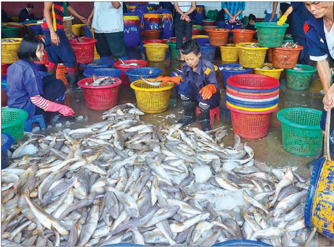
Worker select fishes at the Nyaungtan Jetty in Yangon.