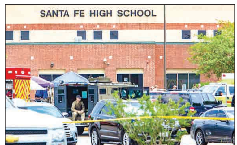
Emergency crews gather in the parking lot of Santa Fe High School, where at least eight people were killed by a heavily armed student.

engaged the gunman and was shot in the elbow, officials said.—AFP ■