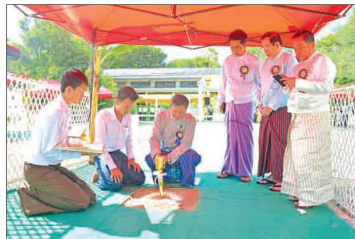
Union Minister Dr. Myo Thein Gyi driving the stake for the construction of the TVET and TTTI in Bahan Township, Yangon yesterday.

In his speech at the event, Union Minister Dr. Myo Thein Gyi said in any country, the technical and vocational education sector plays an important role in the socio-economic development of its people. State Counsellor Daw Aung San Suu Kyi pointed out this in her speech delivered at the TVET Forum held in Nay Pyi Taw in