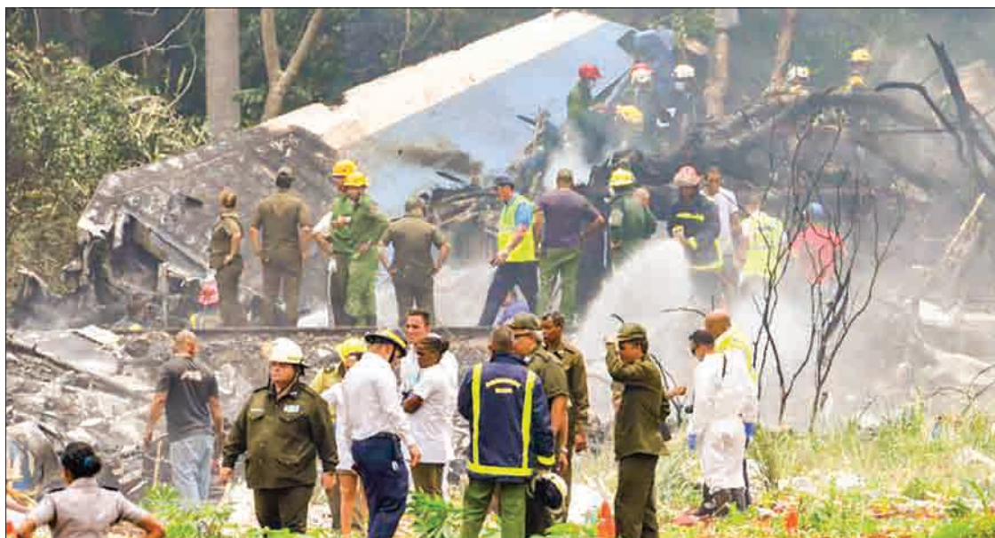
A Cubana de Aviacion aircraft crashed after taking off from Havana's Jose Marti airport.

The Boeing crashed shortly after taking off from Jose Marti airport, coming down in a field near the airport and sending a thick column of acrid smoke into the air. The mourning period is to last from 6:00 am (1000 GMT) on Saturday to midnight on Sunday, the Communist Party leader and former president Raul Castro said. Flags are to