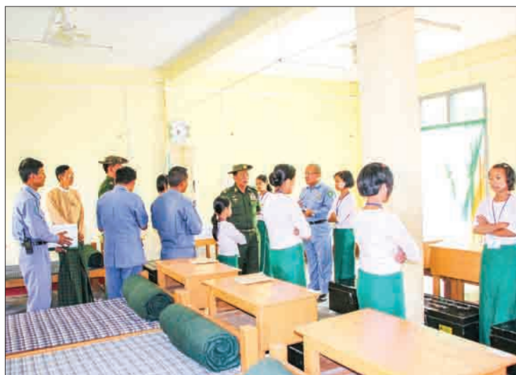
Union Minister Lt-Gen Ye Aung inspects border area national races youth development training school in Pinlebu Township.

of 16 May, the Union Minister inspected a site in Bamauk Township where a border areas national race youth development training school is to be built, and on 17 May the Union Minister inspected the Pinlebu Township border area national races youth development training school, where he provided cash assistance and urged the planting of seasonal fruit trees.