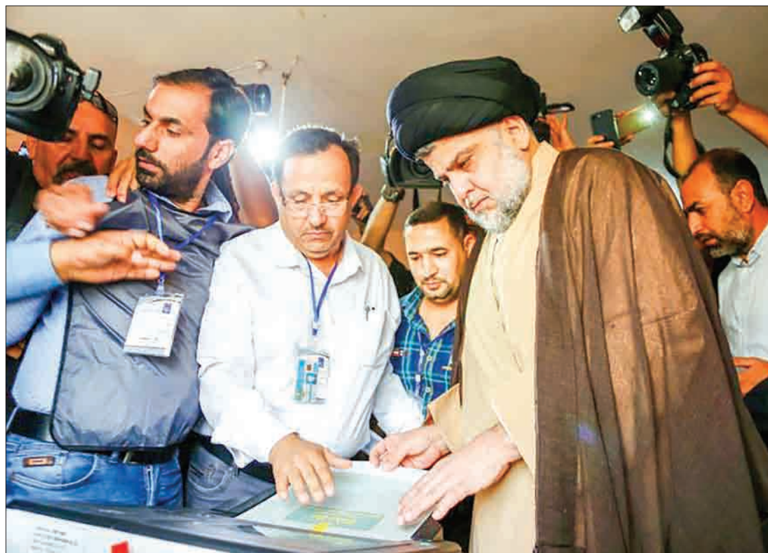
Moqtada Sadr. None of the three leading groups won more than 50 seats in Parliament in the 12 May vote, which saw record high abstentions with just 44.52 per cent turnout — the lowest since the first multiparty elections in 2005.

But despite leading the tally, his alliance falls short of a