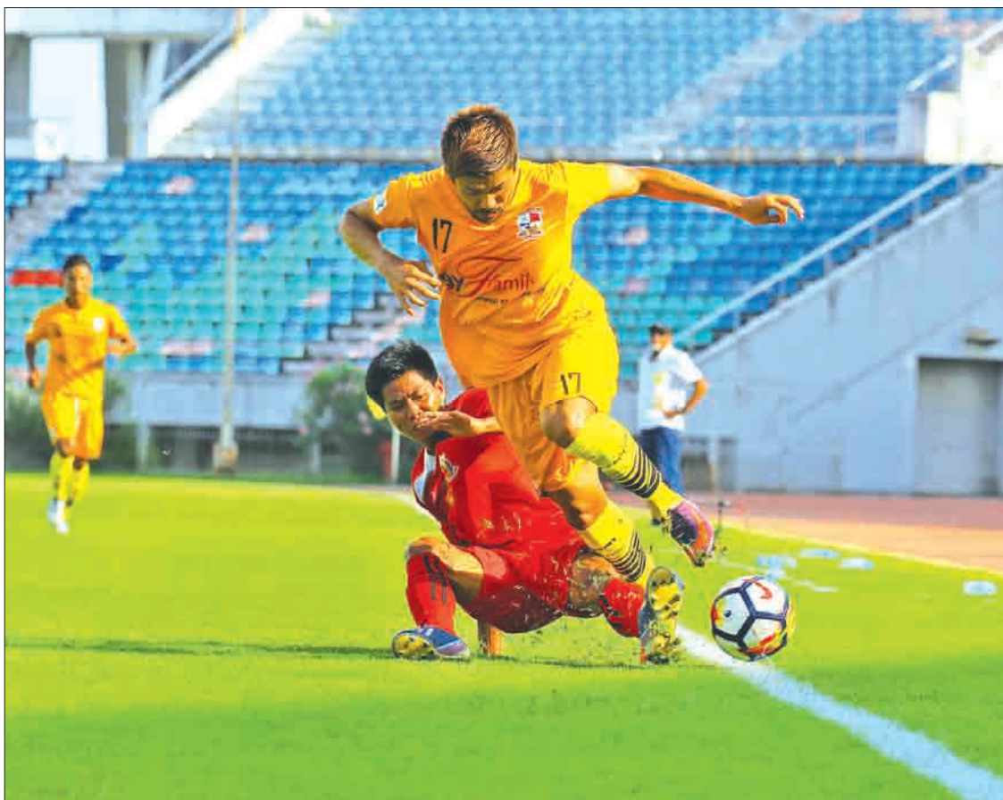
Zwekapin(yellow) and Hantharwady(red) vie for the ball in yesterday's MNL match at Thuwunna Stadium in Yangon.