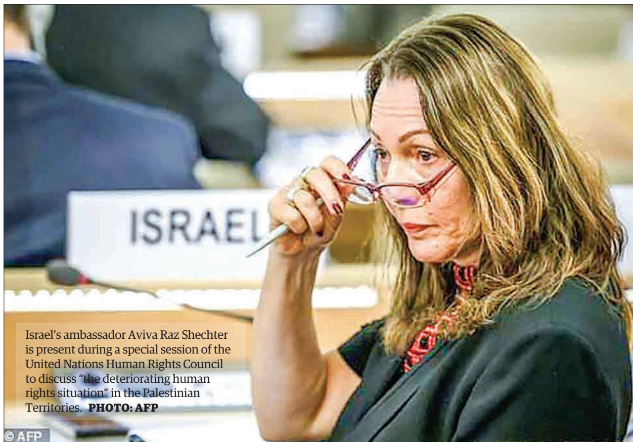
Israel's ambassador Aviva Raz Shechter is present during a special session of the United Nations Human Rights Council to discuss “the deteriorating human rights situation” in the Palestinian Territories.

the United States and Australia, voted against the resolution, while 29 voted in favour and 14 abstained, including Britain, Switzerland and Germany. The resolution came after Israeli forces killed 60 Palestinians during protests on the Gaza border on Monday as the US relocated its embassy from Tel Aviv to the disputed city of Jerusalem. In its statement, the Israeli foreign ministry said the results of the inquiry were a “foregone conclusion inherent in the wording of the resolution”. “It is clear to all that the purpose of the commission is not to arrive at the truth, but rather to impair Israel’s right to self-defence, and to demonise the Jewish state,” it added.—AFP ■