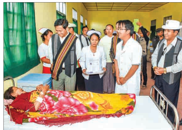
Vice President U Henry Van Thio encourages a patient undergoing treatment at 16-bed hospital in Tibual Village, Falam Township, Chin State yesterday.

After this, the Vice President inspected the construction of the runway and two retaining walls. In the evening, the Vice President and party reached Falam Town, where they were welcomed by traditional dances.— Myanmar News Agency ■