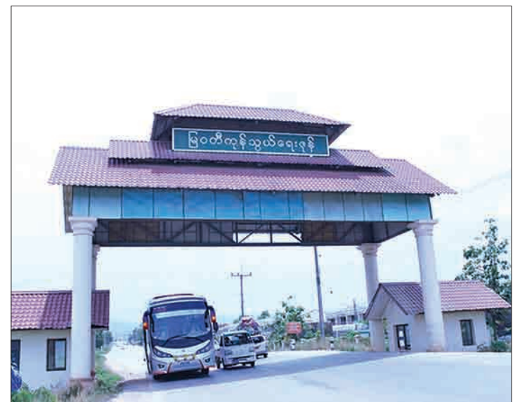
Vehicles seen at Myawaddy border trade zone.

Myanmar primarily imports a wide range of consumer products, food, soft drinks, cooking oil, plastic ware, and cosmetics, while exporting marine products, agricultural commodities and other items to neighbouring country.—Swe Nyein ■