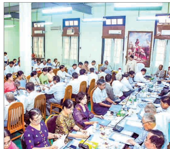
Union Minister for Information Dr. Pe Myint addresses the first coordination meeting for selecting 2017 Myanmar National Literature Award winners in Yangon yesterday.

Additionally, Ministry of Information, Printing and Publishing Department, Sarpay Beikman has formed a National Literature Award selection committee with 65 experts in literature to choose the 2017 Myanmar National Literature Award winners.—Myanmar News Agency ■