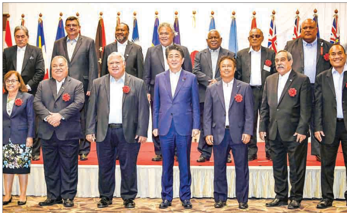
Japanese Prime Minister Shinzo Abe (C) poses with leaders of Pacific island countries at their summit in the northeastern Japan city of Iwaki on 19 May, 2018.

The participants at the eight Pacific Islands Leaders Meeting also noted the importance of the complete, verifiable and irreversible scrapping of all of weapons of mass destruction and ballistic missiles, while stressing the need of an immediate resolution of the abductions of Japanese nation-