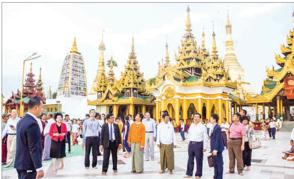
A delegation led by Mr. Wang Zhengwei, Vice chairman of the Chinese People's Political Consultative Conference (CPPCC) visit Shwedagon Pagoda in Yangon yesterday.