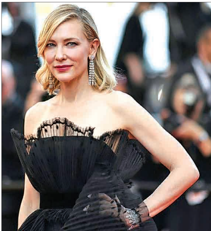
Cate Blanchett heads the Cannes jury.

Both its female stars, Uma Thurman and Riley Keough,