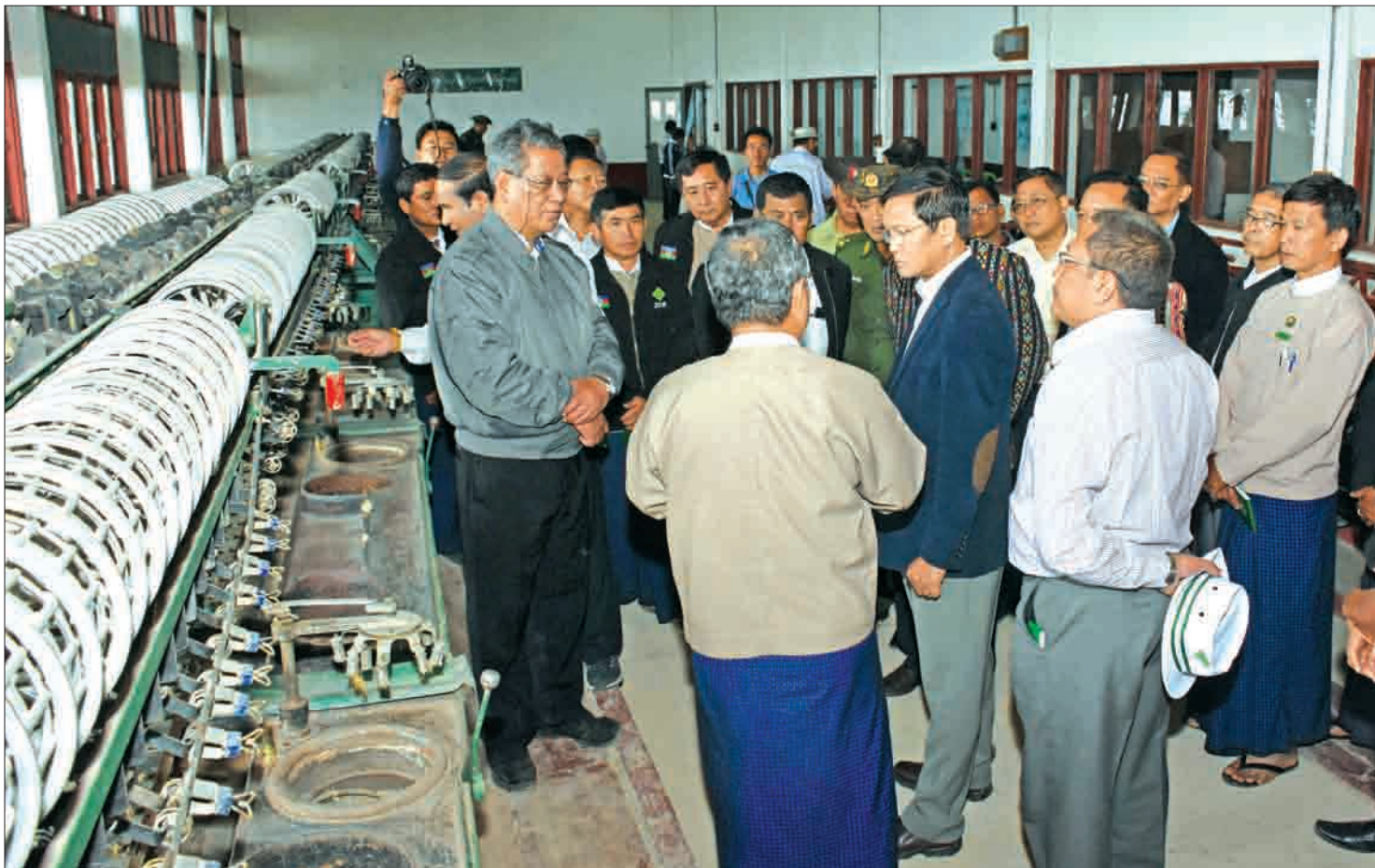
Vice President U Henry Van Thio visits the silk factory in Tiddim, Chin State.