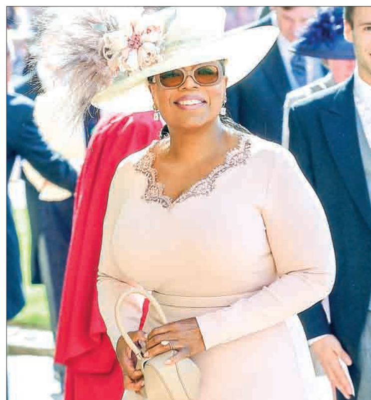
US presenter Oprah Winfrey arrives for the wedding ceremony of Britain's Prince Harry, Duke of Sussex and US actress Meghan Markle at St George's Chapel, Windsor Castle, in Windsor, on 19 May, 2018.

Politicians have been left off the guest list, meaning there was no invite for US President Donald Trump or British Prime Minister Theresa May.—AFP ■