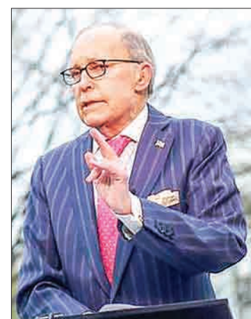
National Economic Council Director Larry Kudlow told reporters at the White House that China was “meeting many of our demands” but that there was “no deal yet”.

But Trump is also keen to appear tough on trade and fulfil a campaign promise to make a “deal” that better benefits the United States.—AFP ■