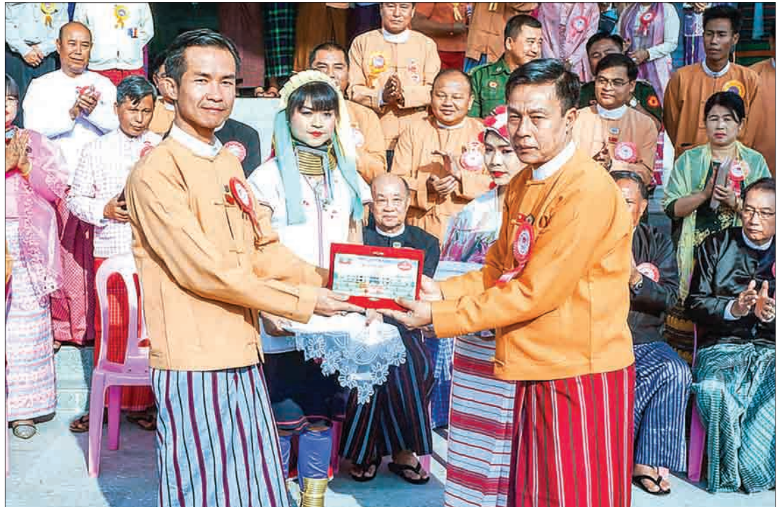
Kayah State Chief Minister U L Phaung Sho presents commemorative gift on the opening of the new Kayah State Hluttaw building to Hluttaw representative in Loikaw yesterday.

Also, the Amyotha Hluttaw Speaker, the Kayah