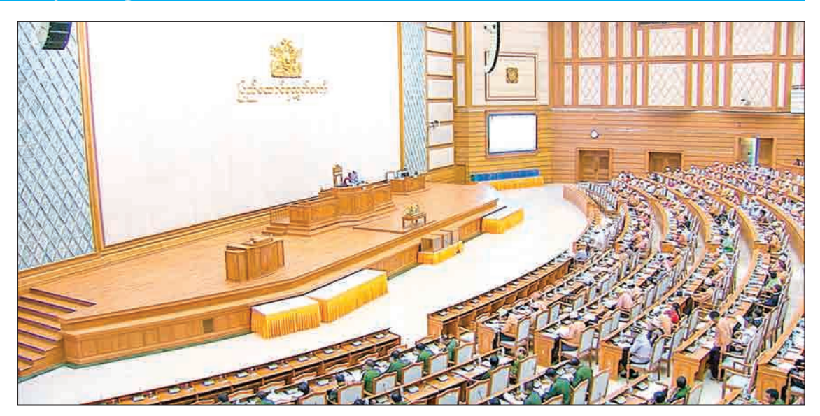
Pyidaungsu Hluttaw being convened in Nay Pyi Taw yesterday.