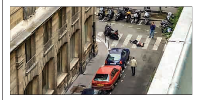
A friend of the man who carried out a deadly knife attack in Paris was charged with "associating with criminal terrorists" while two women were detained for questioning as the investigation gathers speed.

During a search of his home in Strasbourg police found seven cellphones but were unable to locate the phone he used most often, sources close to the case said.—AFP