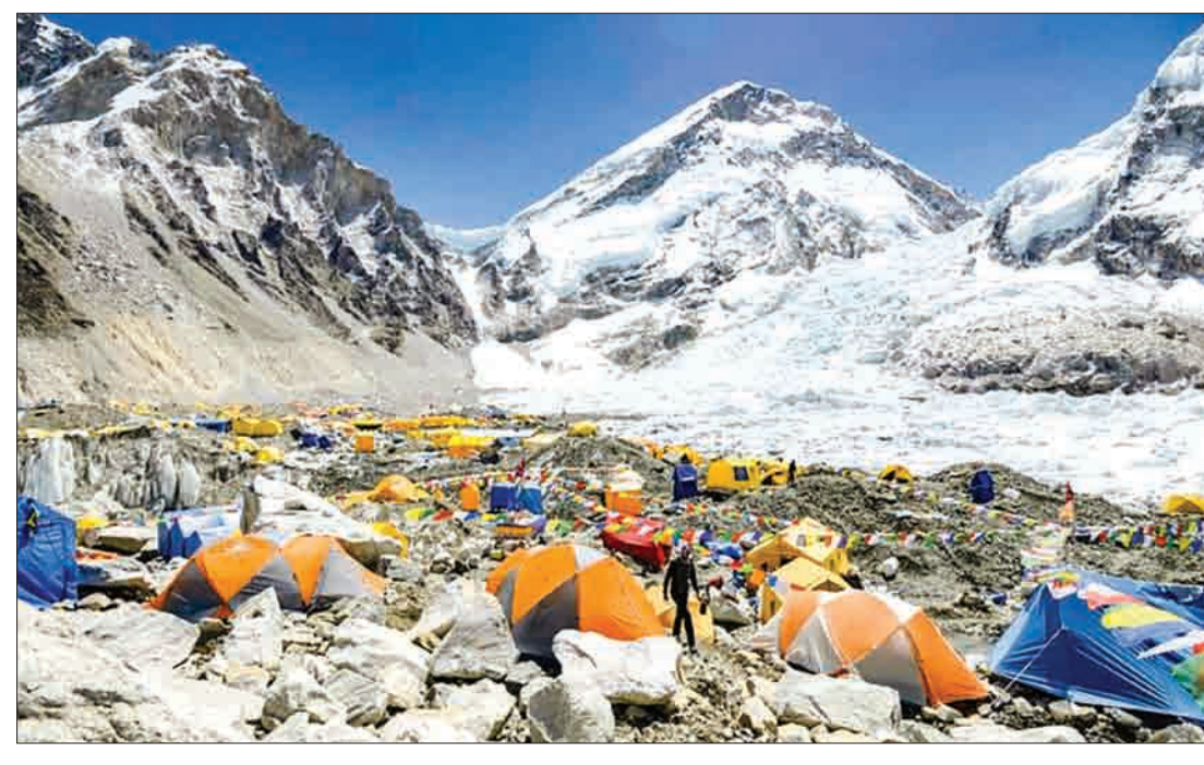
A climber walks through base camp below Everest, which is suffering from a dangerous shortage of its most important resource: experienced Sherpa guides.