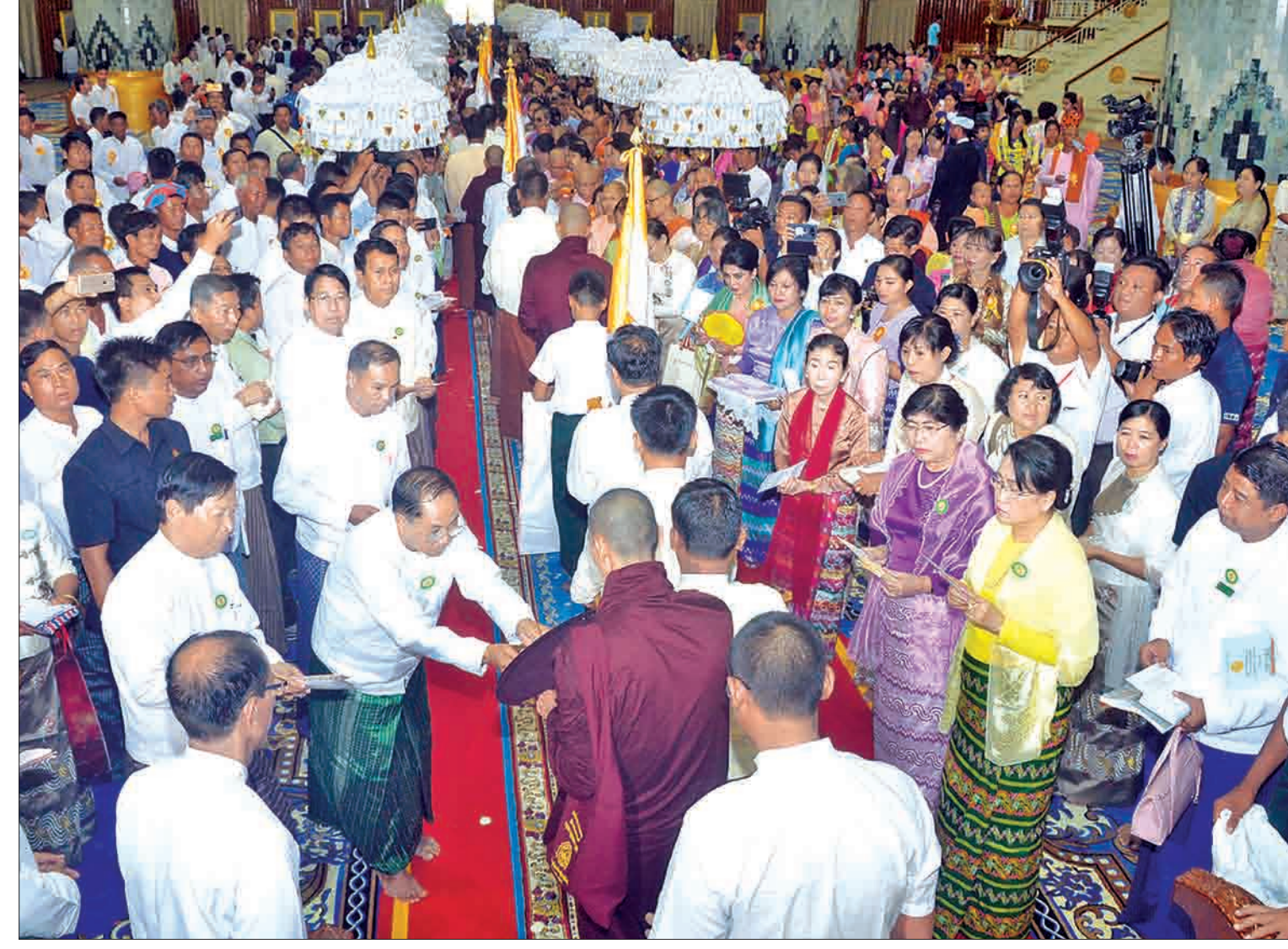
The congregation led by Vice President U Myint Swe donates offertory to winners of the Tipitakadhara Examination in Yangon.