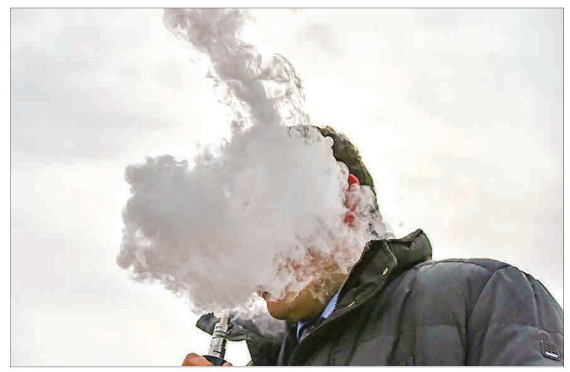
According to FEMA, the Federal Emergency Management Agency, there were 195 fires and explosions involving electronic cigarettes between 2009 and 2016 in the United States.

"A regulated device typically contains electronic circuitry,