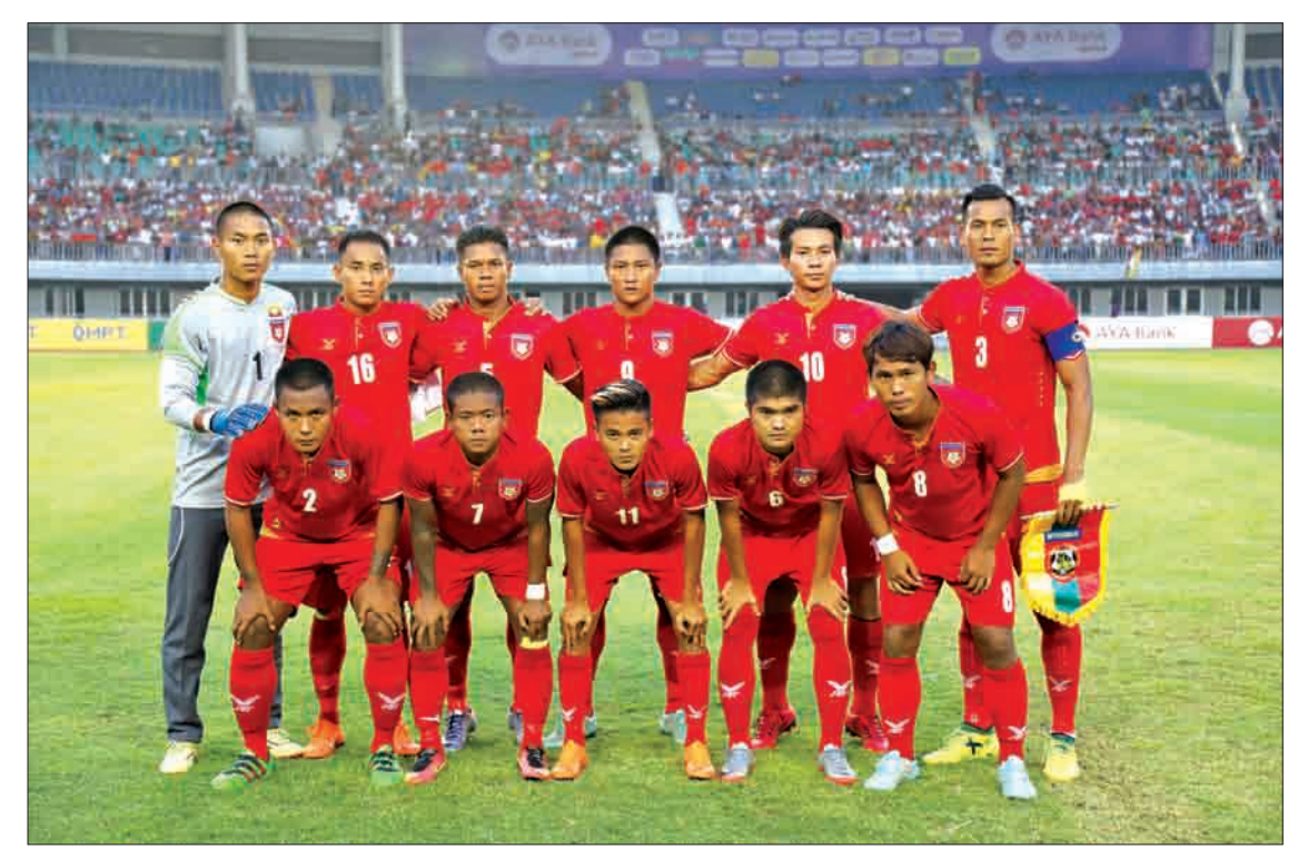
Myanmar national football team seen at an international football match.

Although China lost all their matches and failed to score a goal in their FIFA World Cup debut in 2002, qualifying for the