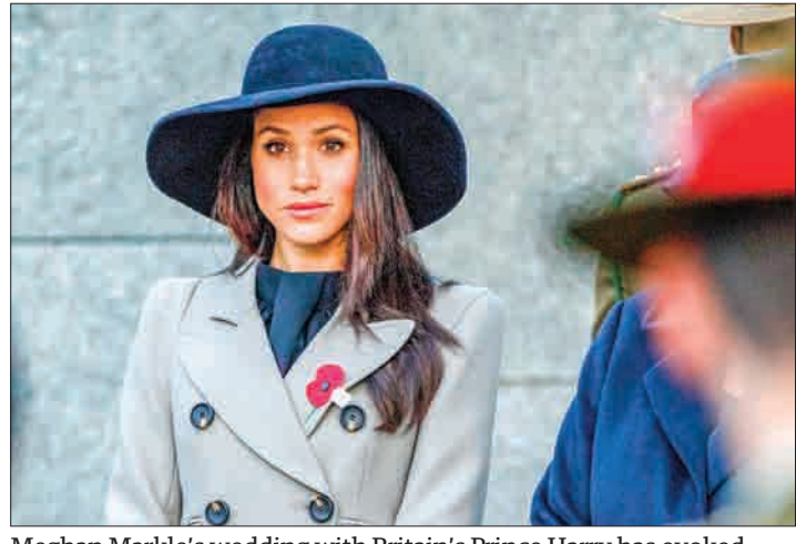
Meghan Markle's wedding with Britain's Prince Harry has evoked comparisons with another royal tie-up: Grace Kelly's 1956 marriage to Prince Rainier of Monaco.

But no one doubts that Rainier's union with one of the bright-