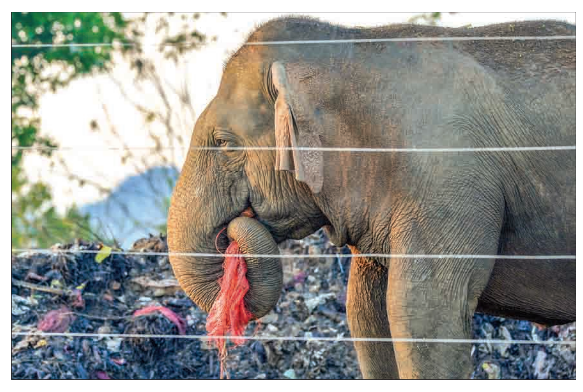
Hundreds of Sri Lanka's wild elephants now scavage at rubbish dumps, risking their health due to plastic scraps mixed with rotting food

covered in smelly garbage and rooting among piles of plastic bottles, a far cry from the majestic jumbos portrayed in travel brochures.