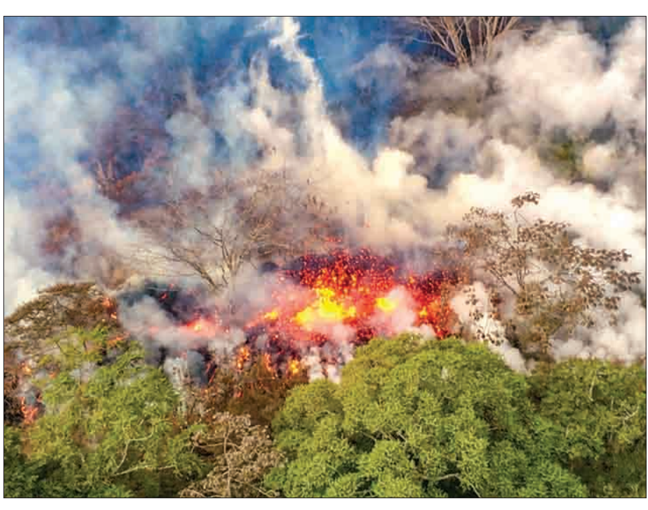
Lava from the Kilauea Volcano burns vegetation between two fissures on Hawaii's Big Island on 16 May 2018.

Authorities by afternoon said weak winds and rain meant that ash fallout from the latest eruption was largely contained in areas around the Kilauea summit. "We've had reports of light ash fall in