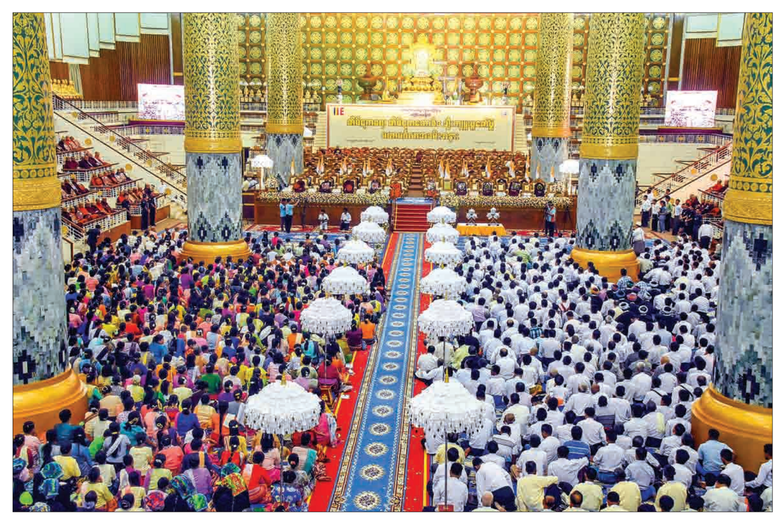
A ceremony to confer religious titles to winners of the Tipitakadhara Examination is held in Yangon.

In the 70<sup>th</sup> examination, 307 monks took part, an increased from the 291 who took the examination last year. —GNLM ■