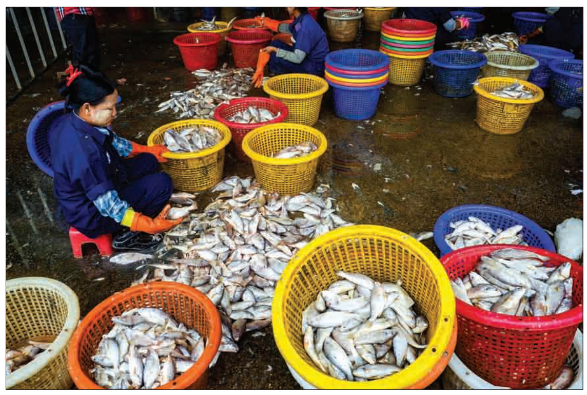
File photo shows workers sort fish at a fish market in Yangon.

Myanmar chiefly imports three groups of commodities, including capital goods, intermediate goods and consumer products, which saw an increase in value from both public and