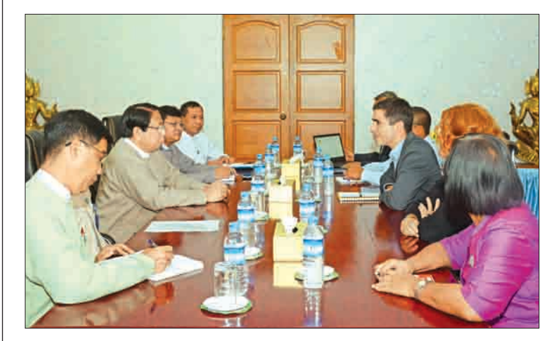
Union Minister Dr Pe Myint holds talks with BBC media action delegation in Nay Pyi Taw yesterday.

new memorandum of understanding between Myanmar Radio and Television (MRTV) and BBC Media Action and matters related to the Joint Peace Fund Programme series to be broadcast on MRTV. —Myanmar News Agency