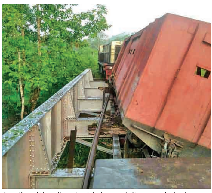
A section of the railway track is damaged after an explosion in Mogaung Township, Kachin State.

Similarly, the No. 55 northbound train became stranded at Moehnyin Station