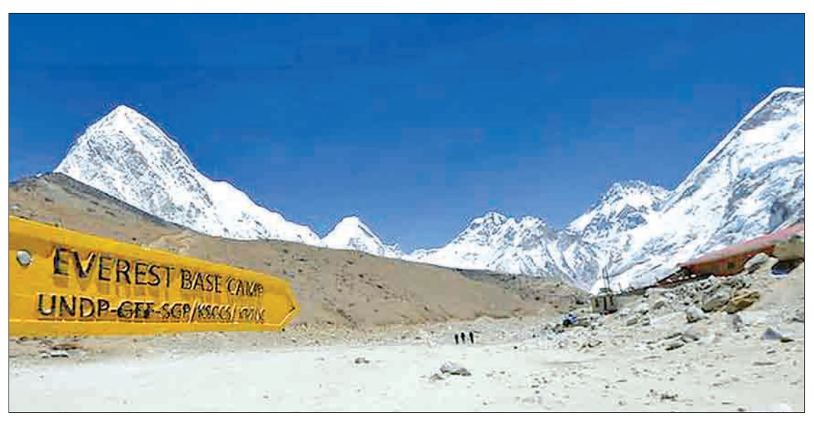
This year's narrow window of good May weather has seen records broken on Mount Everest.

other Nepali women to climb," the 44-year-old told AFP last month.