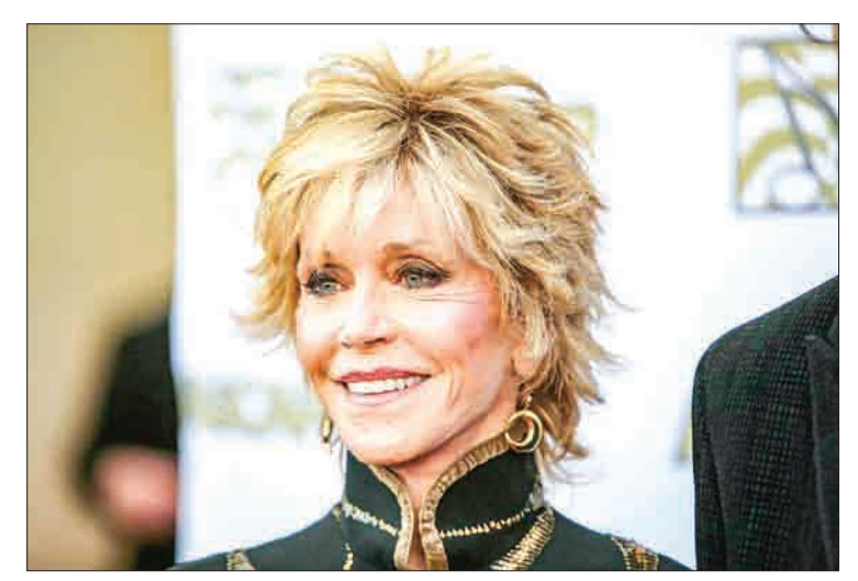
Veteran actor Jane Fonda . PHOTO: PTI

you to a party tonight if you'll get me into a Tarantino film," the Hollywood veteran asked.