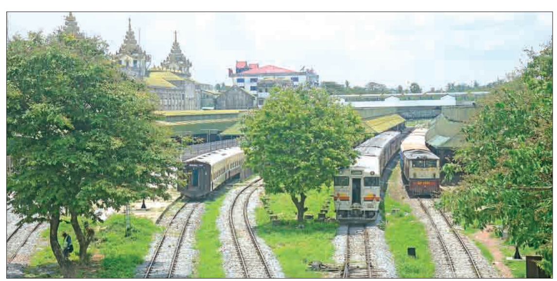
The Yangon Central Railway Station.

They can then start online trading using the applications of the related securities companies.—Htet Myat