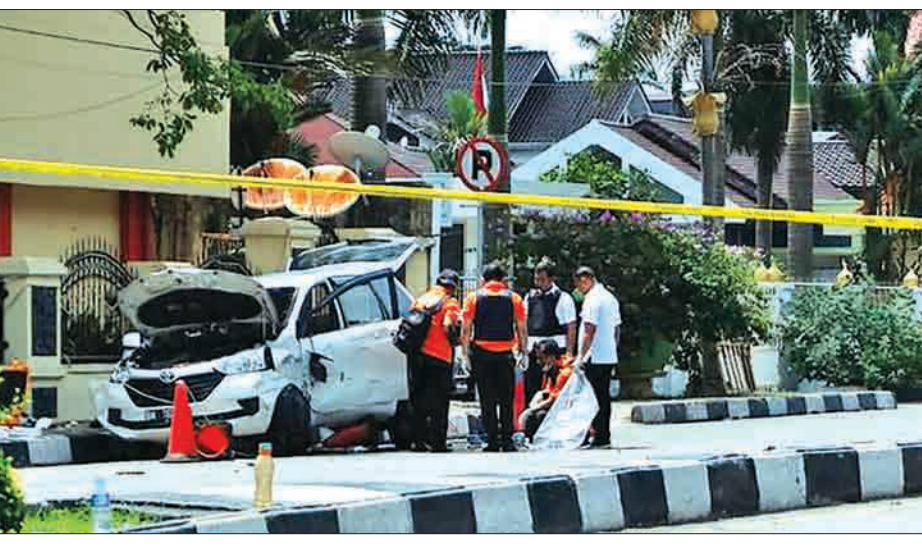
Indonesian policemen examine a car used by attackers outside the police headquarter in Pekanbaru, Riau following attacks on 16 May, 2018.

The attacks have put Indonesia on edge as the world's biggest Muslim majority country starts the holy fasting month of