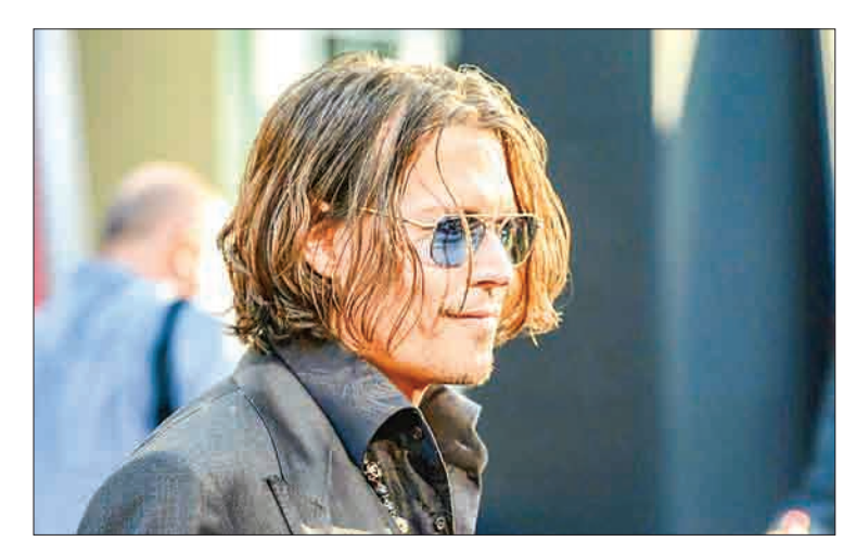
Johnny Depp.

SOCIAL 17 MAY 2018 THE GLOBAL NEW LIGHT OF MYANMAR