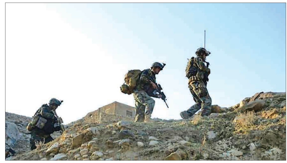
Afghan commandos and the US air force have driven the Taliban to the outskirts of the western provincial capital of Farah, officials said Wednesday.

With internet and mobile networks patchy, casualty figures were difficult to verify. On Tuesday, the defence ministry said four soldiers and "dozens" of insurgents had been killed.