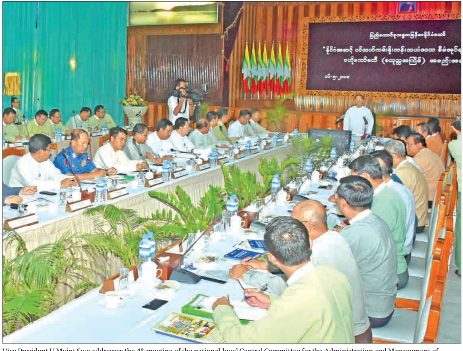
Vice President U Myint Swe addresses the 4th meeting of the national-level Central Committee for the Administration and Management of Natural Resources in coastal area.