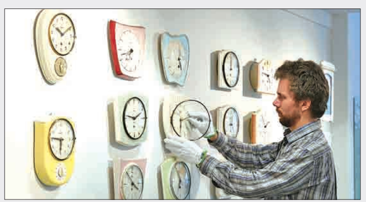
Messing with the natural rhythm of one's internal clock may boost the risk of developing mood problems ranging from garden-variety loneliness to severe depression and bipolar disorder, researchers say.

Last year, the Nobel Prize for medicine was awarded to three US scientists who pioneered our understanding of how the circadian clock ticks. —AFP■