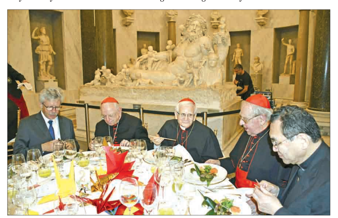
The Kyoto unit of the Japan Agricultural Cooperatives group sponsors a banquet at the Vatican Museum in Vatican City on 14 May, 2018, inviting cardinals and ambassadors to promote Japanese food and Kyoto-grown vegetables.

The group has hosted similar banquets featuring Kyoto vegetables at famous sites around the world including the Palace of Versailles in the suburbs of Paris and the Topkapi Palace in Istanbul, Turkey -Kyodo News ■