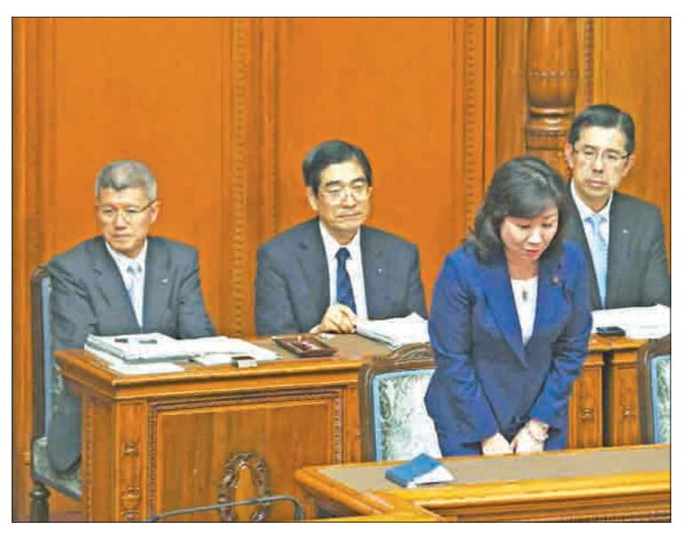
Seiko Noda (front), women's empowerment minister, bows after parliament approves a law to promote women's participation in politics.

The new law urges political parties engaging in national and local elections to "make