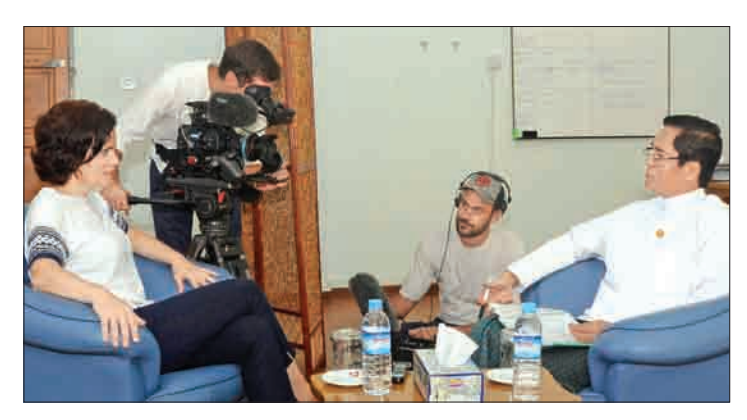
ARD German TV interviews Deputy Minister U Aung Hla Tun in Nay Pyi Taw yesterday.

He requested Bangladesh, the international community and the international media to cooperate with Myanmar in order to make the repatriation process succeed as soon as pos-