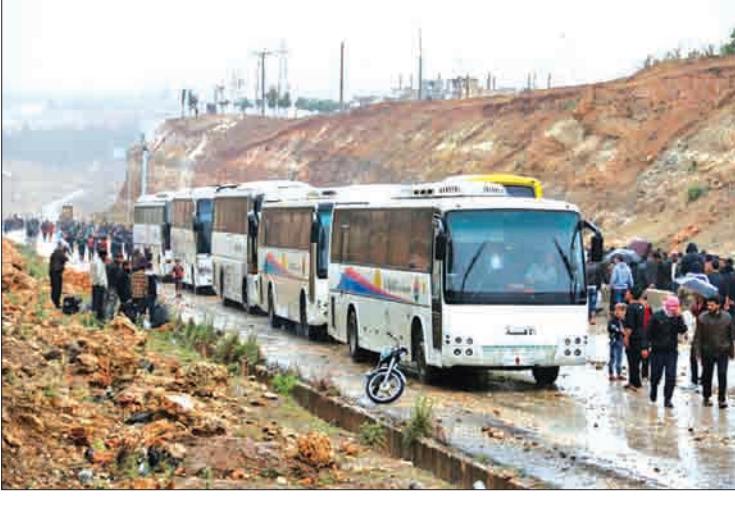
Syrians board buses prior to being evacuated from the rebel-held town of Rastan on 7 May, 2018, after rebels and civilians were granted safe passage to a rebel-held part of Aleppo province under a deal with the government.

The evacuations from areas straddling the boundary between Homs and Hama provinces came under a deal between rebel factions and the government. Hundreds of people gathered in the centre of the town of Rastan in Homs province to welcome the return of government security forces and attend a flag-raising ceremony on the main square. Nearby towns and villages in the areas of Talbiseh and Al-Hula were also evacuated, the official SANA news agency and the Syrian Observatory for Human Rights war monitor reported. "The last convoy of terrorists and their families exits northern Homs province and southern Hama province," SANA reported.