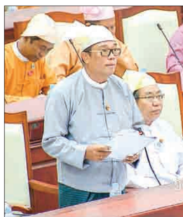
Deputy Minister for Construction U Kyaw Lin.

Next, the Hluttaw put on record that U Thet Naung of Lahe constituency had attended an international relations, administration and public cooperation course in Switzerland from 7 to 19 April 2018, U Naing Htoo Aung of Natogyi constituency attended the Dialogue on Parliamentarians Supporting the Quiet Revolution for Better Regulatory Governance in Indonesia from 19 to 20 April 2018, Dr. Min Thein of YeU constituency at-