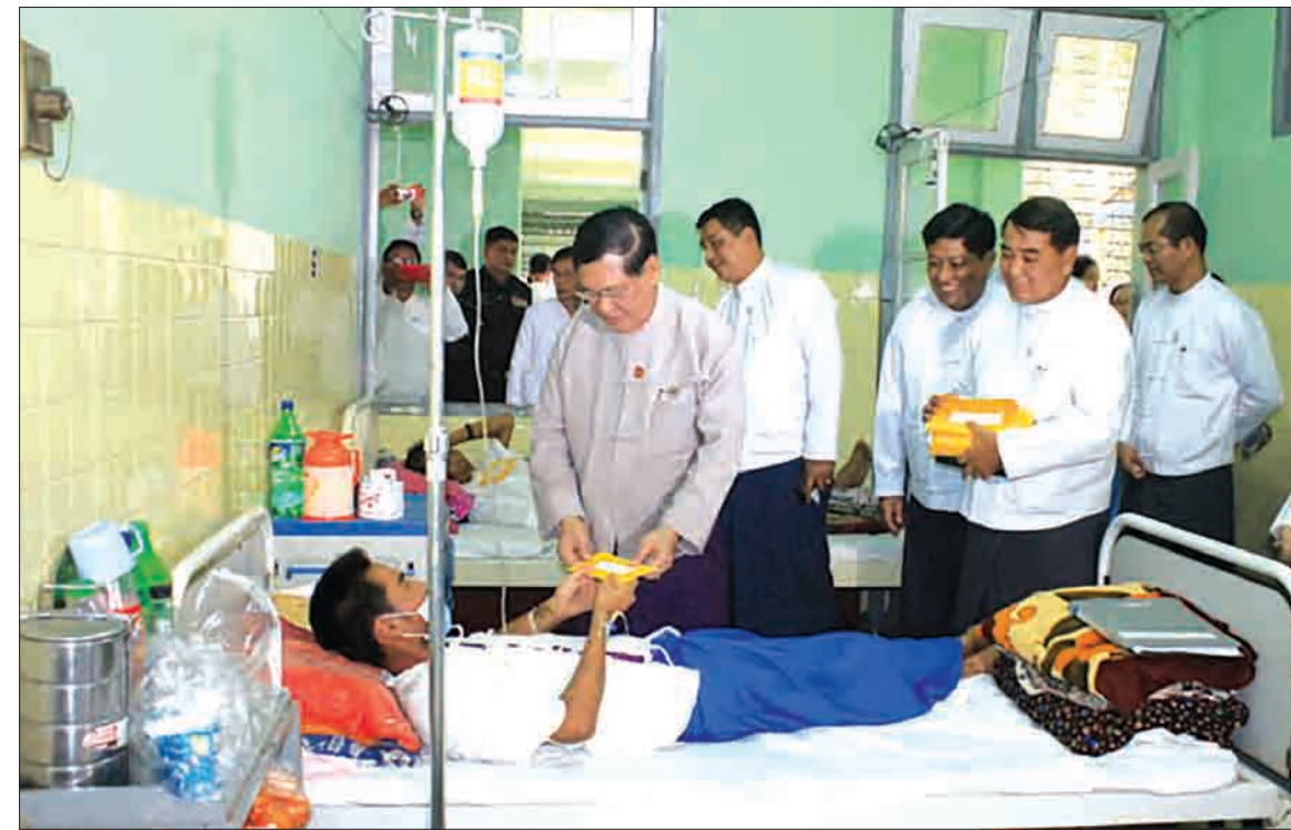
Union Minister for Labour, Immigration and Population U Thein Swe presents social pension for three months to an elder aged over 90 years in Nay Pyi Taw Council Area last year.

The SSB has implemented a social security scheme covering employees working for firms, state-owned, private, foreign and joint ventures. Moreover the social security scheme is contributory. The SSB administers social security programme for public employees, including members of the civil service, state boards, state corporations, municipal authorities and military personnel,