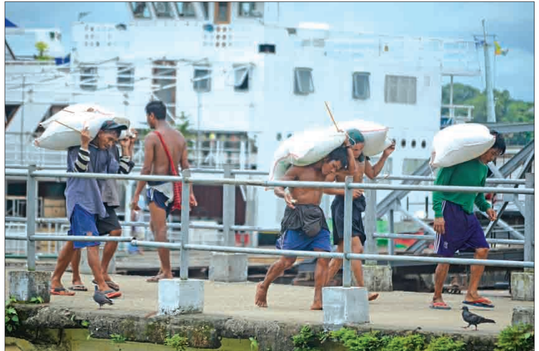
Workers carry bags of rice at a harbour in Yangon.

Some eight per cent of the rice exports go to China. Importing rice and corn from Myanmar is considered illegitimate in China, as the volume often exceeds the import quota set by China. However, these goods fetch a good price. The General Administration of Quality Supervision,