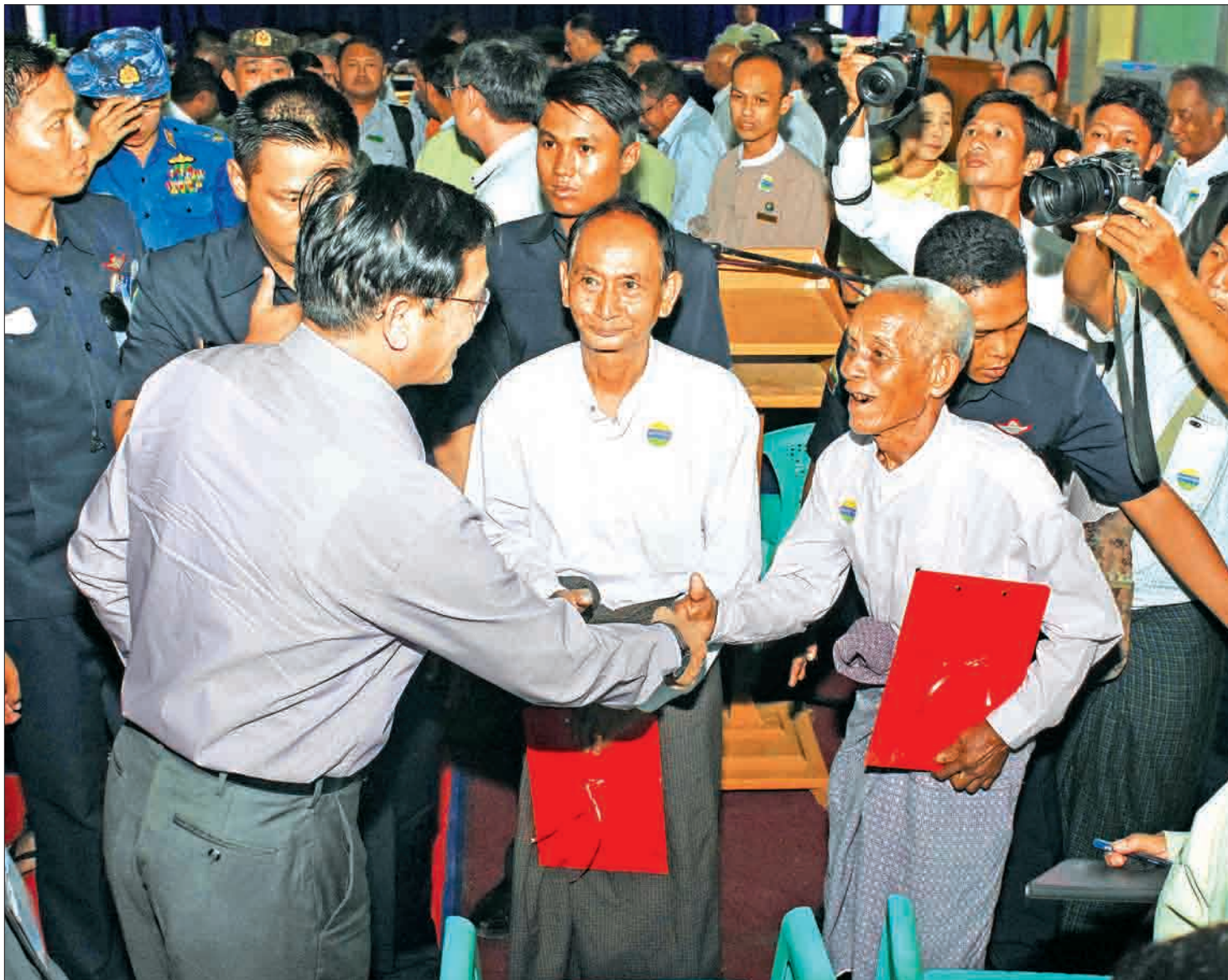
Vice President U Henry Van Thio, left, shakes hands with a farmer at a ceremony yesterday to return confiscated farmland to farmers in Myittha, Mandalay Region.