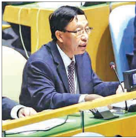
U Hau Do Suan, Permanent Representative of Myanmar.

in good faith through bilateral cooperation, it is most regrettable that instead of fulfilling its commitment for repatriation of the displaced persons as agreed upon in the bilateral agreements, the Bangladesh side has been deliberately making excuses one after another to stall the repatriation process. Bangladesh has been distorting the facts and telling the whole world that Myanmar is not willing to accept the return of the displaced persons. Bangladesh is altering the truth and vilifying the Government and people of Myanmar to solicit international condemnation and to exert maximum political pressures on Myanmar. We need full and sincere cooperation of the Government of Bangladesh if the repatriation process is to be successful.