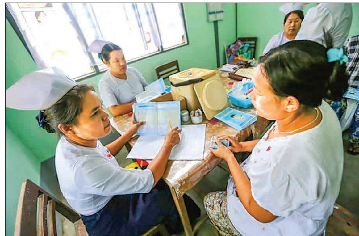
A pregnant woman receives medical care at the social security clinic.

as well as employees in private sector industries. On 31 August 2012, the Pyidaungsu Hluttaw enacted the Social Security Law of 2012, which introduced benefit systems for invalids, the elderly, survivors and unemployed individuals. The board has operated three hospitals and 93 social security clinics, other 43 clinics, 3 divisional offices and 77 township offices.