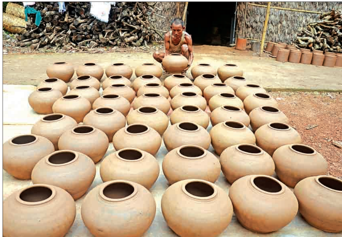
The Yangon Region government will set up the small and medium enterprises data centre to provide loans to 100 selected entrepreneurs.

Additionally, the Yangon region SME development agency and the Yangon Region credit