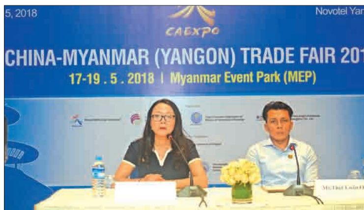
Press Conference on China-Myanmar (Yangon) Trade Fair 2018

The trade fair is set to be held in the China-ASEAN Expo (CAEXPO) Secretariat, Trade Development Bureau (TDB) of Ministry of Commerce of China, Department of Trade Promotion of the Ministry of Commerce, Myanmar and WorldEx-SingEx Exhibitions