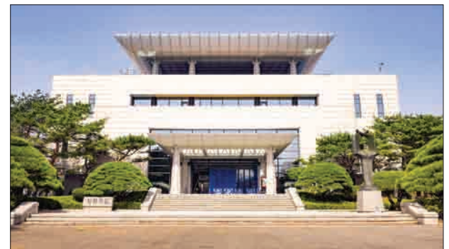
Photo taken on 18 April, 2018, shows the House of Peace in South Korea in the border village of Panmunjeom. PHOTO: KYODO NEWS

for more than 1.7 billion belly Champions from eight (ONE Championship) Fox Sports, ABS-CBN, Astro, ClaroSports, Bandsports, Startimes, Premier Sports, Thairath TV, Skynet, Mediacorp and OSN, the world's largest broadcasting stations, including, among other broadcast station broadcasts are shown. — ONE Championship ■