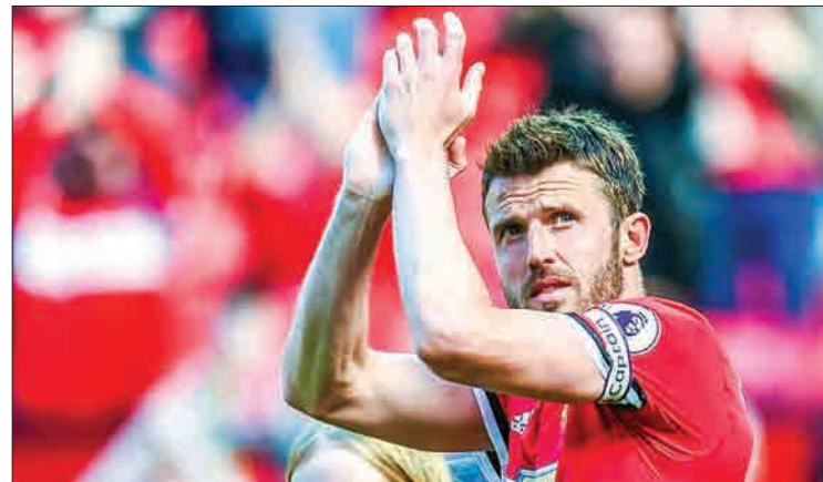
Michael Carrick applauds the Old Trafford crowd at the end of the English Premier League match between Manchester United and Watford on 13 May, 2018.

"It changes overnight," Carrick said. "I am not training this week. I am going to jump on the staff." The 36-year-old had other options