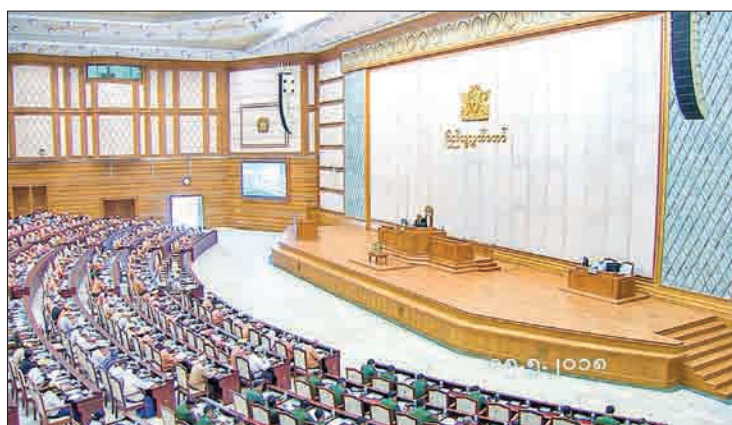
Pyithu Hluttaw is been convened in Nay Pyi Taw.

Replying to a question by Daw Yin Min Hlaing of Gangaw constituency on translating and distributing to construction businesses the Myanmar National Building Code (MNBC), as well as designating, drawing up and enforcing the processes, procedures, rules and regulations that is vital for implementing a third-party system for bridge and construction work, the deputy minister said that with the support of related ministries and