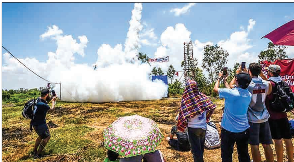
People watch as participants launch a home-made rocket during the 'Bun Bang Fai' festival in Yasothon on 13 May, 2018. The annual rocket festival celebrated in Thailand's rural Isaan region is aimed at prodding gods into unleashing rain ahead of the rice-farming season.