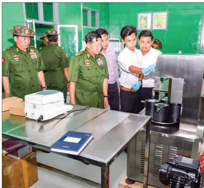
Senior General Min Aung Hlaing inspects the Coconut Milk Factory in Pathein, Ayeyawady Region.

Commander-in-Chief of Defence Services Senior General Min Aung Hlaing met with training officers, soldiers and trainees of local military training institute in Hinthada cantonment, Ayeyawady Region yesterday.