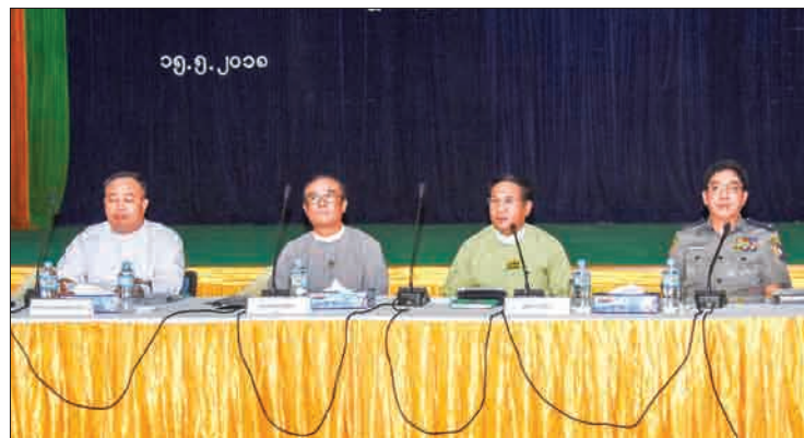
Ministry of Home Affairs, Ministry of Construction and Ministry of Agriculture, Livestock and Irrigation hold press conference on their performance in second one-year period in Nay Pyi Taw .

The Union Minister explained about the establishment of five north south express roads, seven east west express roads,