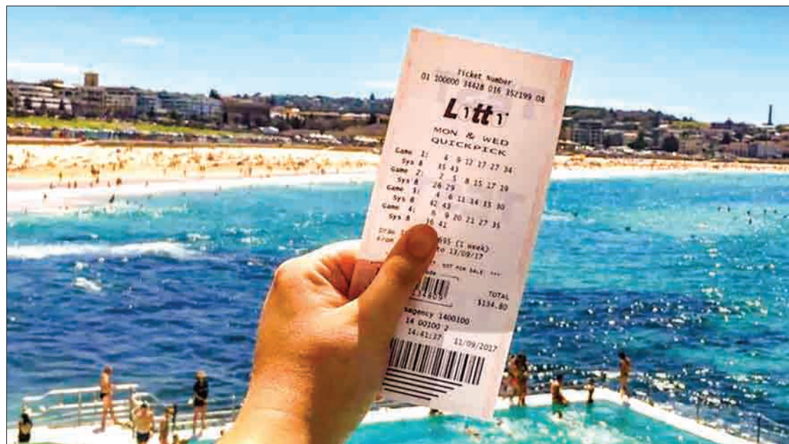
The man bought his two winning lottery tickets from a shop in Bondi, the famous beach side suburb in Sydney, Australia.

"We have had people win twice in their lifetime, but not twice in a week. It is very unusual