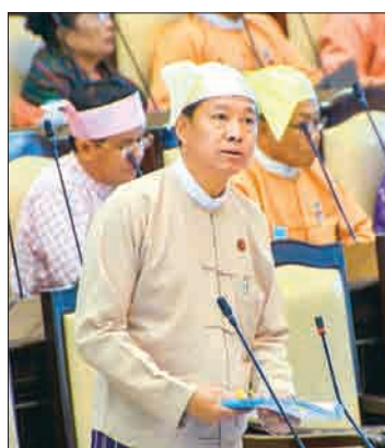
Union Minister for Education Dr. Myo Thein Gyi.

The Union Minister first responded to a question raised by U Ngun Hay of Chin State constituency (1) on the plan to construct a new primary school in Chin State, Haka Township, Thi-phul Village-tract, Hirun Village, during the 2018-2019 fiscal year. The primary school in Hirun Village had only 37 students and the application to obtain a capital construction fund for the 60x30 feet brick nogging building with zinc sheet roofing is included in the township priority list of build-