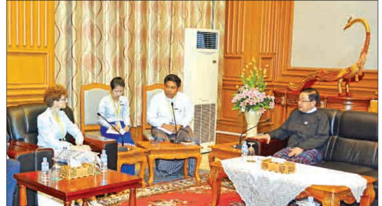
Pyithu Hluttaw Speaker U T Khun Myat meets with World Bank Country Director Ms. Ellen Goldstein in Nay Pyi Taw.

they openly discussed matters related to promoting bilateral friendships between the two governments, Hluttaws and peoples,