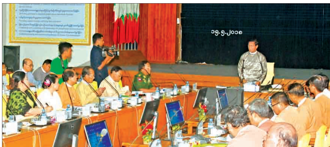
Vice President U Henry Van Thio addresses the meeting of the National Natural Disaster Management Committee (1/2018) in Nay Pyi Taw yesterday.

The Vice President then said it was also necessary to prepare emergency response strategies and resettlement plans. He said it involved building houses in areas least likely to be affected by natural disasters as well as preplanning and cooperating with relevant ministries to reinstate transportation, rebuild roads and schools, and administer health-care immediately after the effects of a natural disaster.